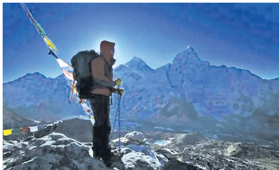
A trekker stands in front of Mount Everest, which is 8,850 metres high (C), at Kala Patthar in Solukhumbu District on 7 May, 2014. —REUTERS

Israel annexed East Jerusalem, in whose walled Old City the compound is located, as part of its capital. This status is not recognized abroad. Many world powers support the Palestinians’ goal of setting up their own future capital in East Jerusalem.—Reuters