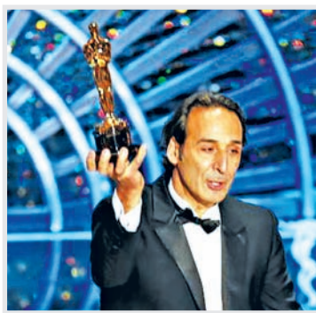
Alexandre Desplat, winner for best original score for the film "The Grand Budapest Hotel," holds his Oscar at the 87th Academy Awards in Hollywood, California on 22 Feb, 2015.

the 6,100 members of the Academy of Motion Picture Arts and Sciences who vote for the Oscars, winning four awards on its nine nominations.