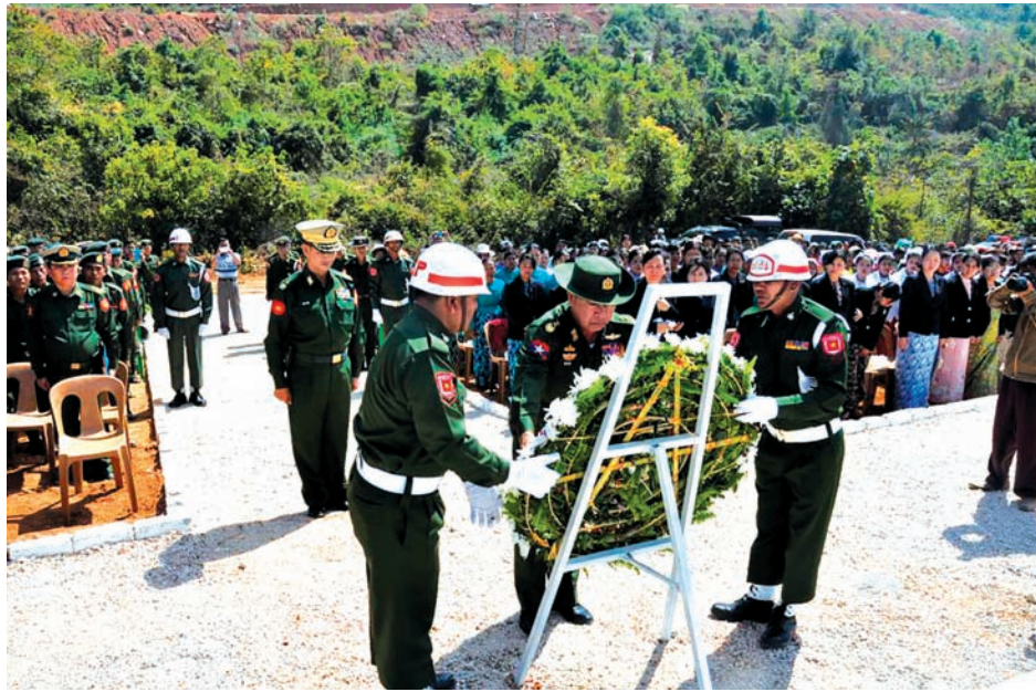
Lt-Gen Aung Than Htut lays a wreath to pay tributes to servicemen fallen in Laukkai region.