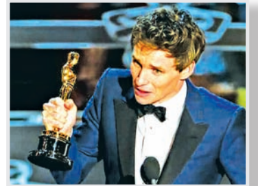
Actor Eddie Redmayne accepts the Oscar for best actor for his role in "The Theory of Everything" during the 87th Academy Awards in Hollywood, California on 22 Feb, 2015.