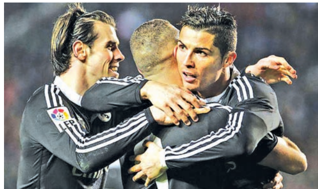
Real Madrid's Karim Benzema (C) celebrates with teammates Gareth Bale (L) and Cristiano Ronaldo after he scored a goal against Elche during their Spanish first division soccer match at the Martinez Valero stadium in Elche, on 22 Feb, 2015.

Benzema was unlucky to have a spectacular overhead kick ruled out due to a questionable offside call but he did knock a loose ball in from