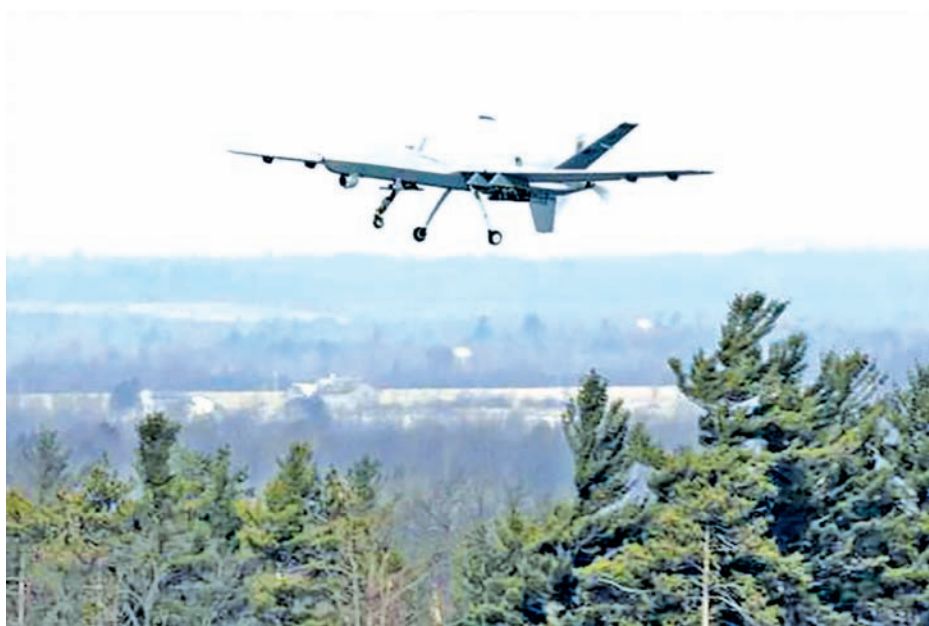
A US Air Force MQ-9 Reaper unmanned aerial vehicle assigned to the 174 th Fighter Wing, New York Air National Guard, takes off on a training mission at Wheeler-Sack Army Airfield, Fort Drum, NY in this 14 Feb, 2012 USAF handout photo obtained by Reuters on 6 Feb, 2013.

The details of the policy are classified. It follows a two-year review amid growing demand from US allies for the new category of weapons that have played a key role in US