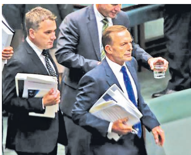
Australia's Prime Minister Tony Abbott (front) walks into the Australian Parliament located in the Australian capital city of Canberra on 23 Feb, 2015.

"For too long, we have given those who might be a threat to our country the benefit of the doubt," Abbott said. "We will never sacrifice our freedoms in order to defend them, but we will not let our enemies exploit our decency either."