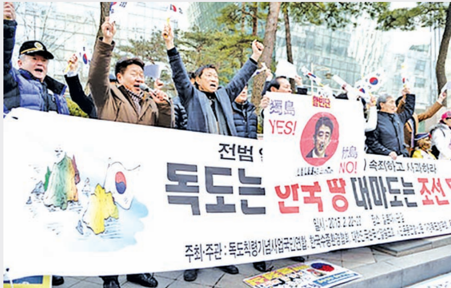
Protesters hold a demonstration in front of the Japanese Embassy in Seoul on 23 Feb, 2015, against Japan's claim to a pair of South Korean-administered islets. Seoul and Tokyo are at odds over the sovereignty of the islets, which are called Dokdo in South Korea and Takeshima in Japan.

SEOUL, 23 Feb — South Korea's Foreign Ministry on Monday summoned a senior diplomat from the Japanese Embassy to lodge a protest against the Japanese government's sending of a high-level official to represent it at an annual