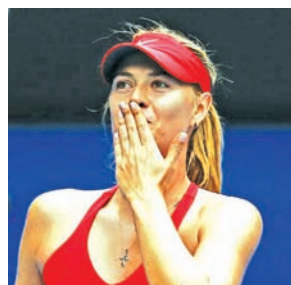
Maria Sharapova of Russia celebrates after defeating Eugenie Bouchard of Canada in their women's singles quarter-final match at the Australian Open 2015 tennis tournament in Melbourne on 27 Jan, 2015.

"It's quite a tough deal. There are a lot of girls that have had big wins, even some that are not seeded, so I look forward to tough