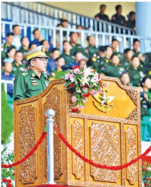
Senior General Min Aung Hlaing delivers speech at opening of Tatmadaw (Army, Navy, Air) Sports Competition 2015.