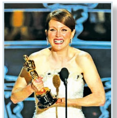
Julianne Moore accepts the Oscar for Best Leading Actress for her role in "Still Alice" at the 87th Academy Awards in Hollywood, California on 22 Feb, 2015.

Poland's "Ida" clinched best foreign-language film, and direc-