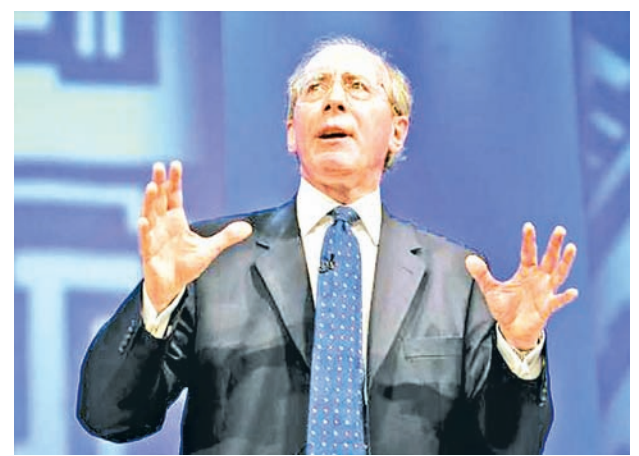
Conservative party leadership contender Malcolm Rifkind.

Straw, who had already announced he was stepping down in May and who was highly critical of colleagues during the 2010 expose, is shown saying he normally charges around 5,000 pounds a day for external work such