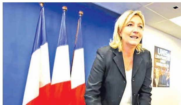
France’s National Front political party head Marine Le Pen arrives to attend a news conference at the party headquarters in Nanterre near Paris on 6 Feb, 2015.