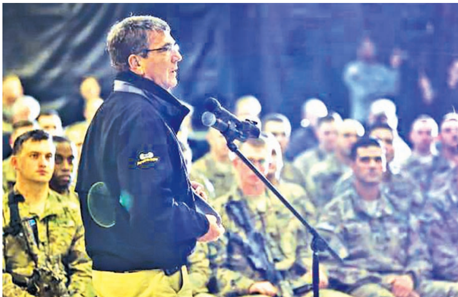
US Secretary of Defence Ash Carter delivers remarks at a question-and-answer session with US military personnel at Kandahar Airfield in Kandahar on 22 Feb, 2015.

KANDAHAR AIR FIELD, (Afghanistan), 23 Feb — A once bustling military hub at the heart of America's war in southern Afghanistan, Kandahar Air Field seemed destined to quietly shut down this year as part