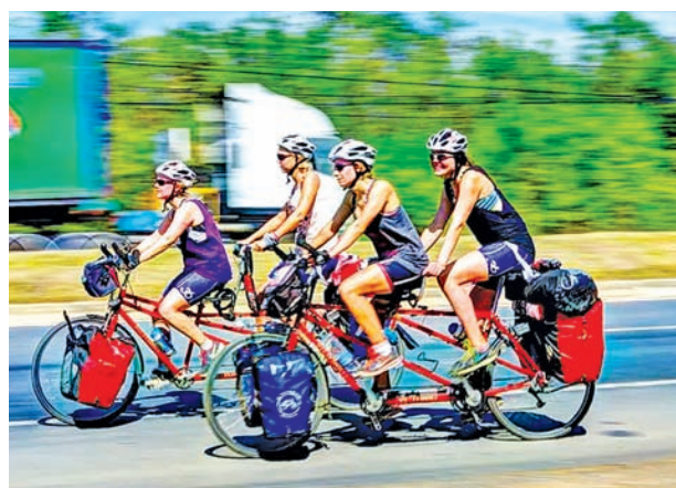
Four women of R4WR (Ride 4 Women's Rights) foundation from the Netherlands on bike during their journey in Thailand before entering Myanmar.