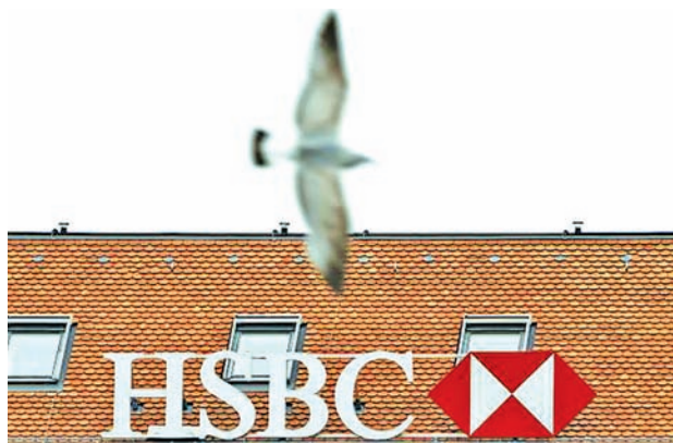
A HSBC logo is pictured at a Swiss branch of the bank in Geneva on 18 Feb, 2015.

LONDON, 23 Feb — HSBC (HSBA.L) reported a 17 percent fall in annual pre-tax profit and cut its profitability target, saying allegations its Swiss business had helped customers to dodge taxes had brought shame on the bank.