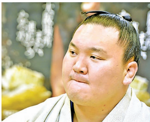
Yokozuna Hakuho speaks at a press conference in the western Japan city of Sakai on 23 Feb, 2015, on the occasion of the release of rankings for the Spring Grand Sumo Tournament in March. Touching on his criticism for the first time over ringside judges who had called a do-over in his bout against ozeki Kisenosato at the New Year Grand Sumo Tournament in January, Hakuho said he had only been speaking his mind.

He raised eyebrows further when he remarked that "the color of one's skin doesn't matter. When I am on the dohyo I have the spirit of Japan laced in my topknot. We are