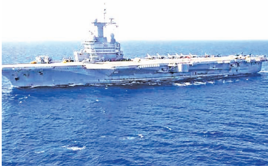
France's flagship Charles de Gaulle aircraft carrier makes its way through the Mediterranean Sea while on mission on 26 March, 2011.