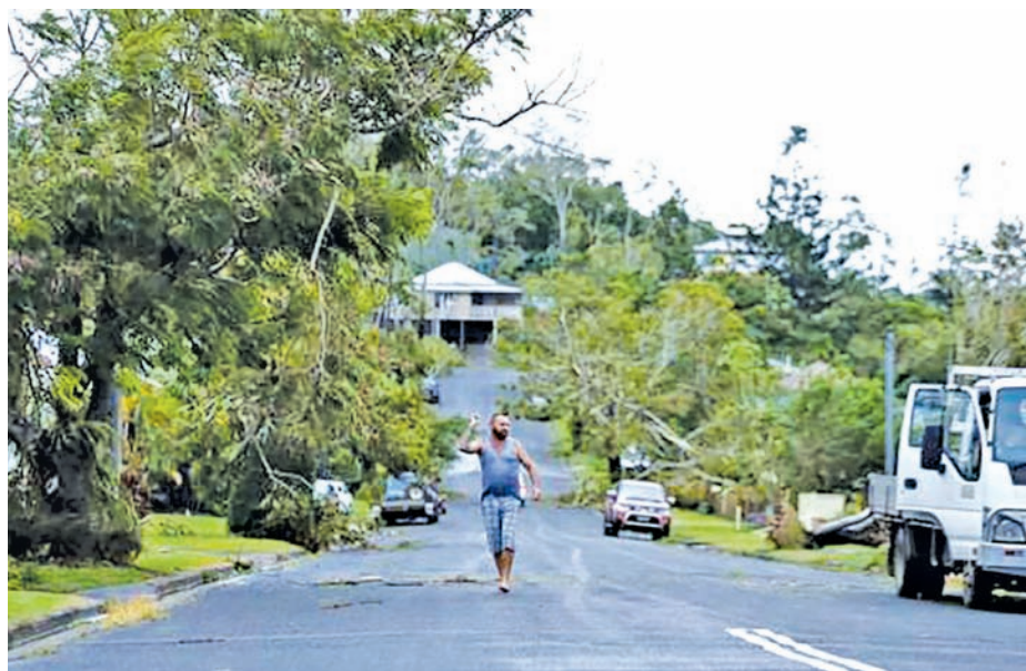
A resident of the coastal town of Yeppoon is pictured on his street full of fallen trees after Cyclone Marcia hit northeastern Australia on 20 Feb, 2015.

"I don't think that it's anywhere as severe as in other times of cyclones and rain events, but we are still getting reports in," said a spokesman for the Queensland Resources Council.