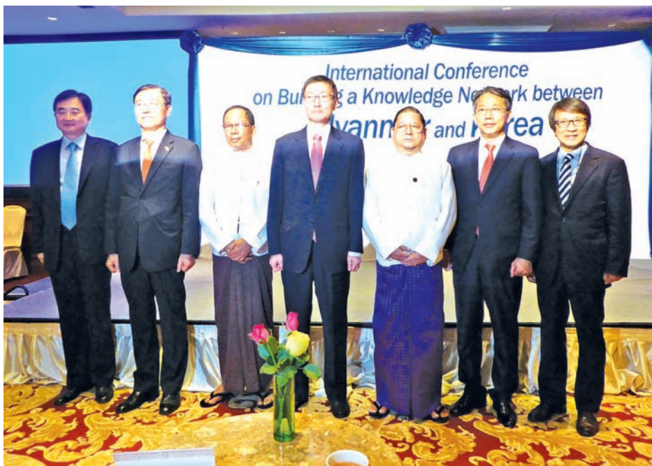
Officials of Korea Transport Institute and ministerial officials pose for documentary photo after international conference on building a knowledge network.—PHOTO: KHAING THANDA LWIN