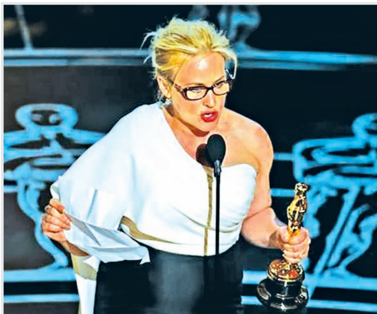
Patricia Arquette speaks after winning the Oscar for Best Supporting Actress for her role in "Boyhood" at the 87th Academy Awards in Hollywood, California on 22 Feb, 2015.

Wes Anderson's colorful caper, "The Grand Budapest Hotel" proved popular among