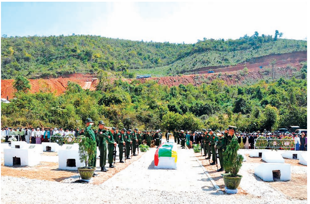
The Guard of Honour and people salutes the Tatmadawmen fallen in Lauklai region. MYAWADY