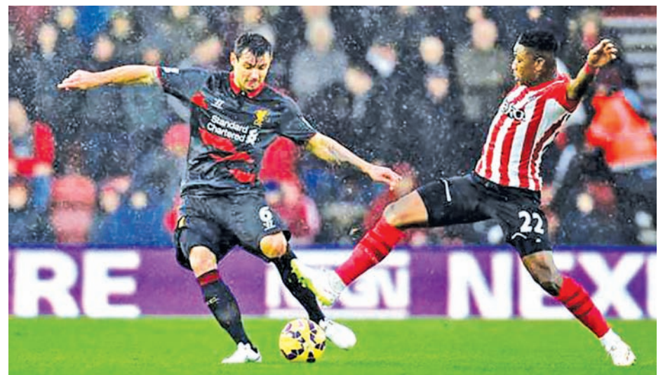
Southampton v Liverpool, Barclays Premier League, St Mary's Stadium, Liverpool's Dejan Lovren in action with Southampton's Eljero Elia on 22 Feb, 2015.

Steven Naismith had given 12 th -placed Everton a second-half lead before goals from Leicester's David Nugent and Esteban Cambiasso turned the match around but they could not hold on and are now four points adrift at the foot of the table.