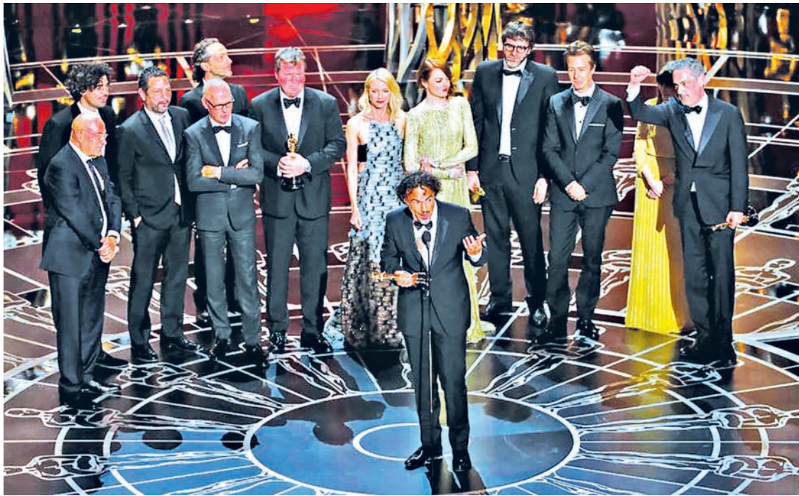
Director Alejandro Inarritu accepts the Oscar for best picture for his film "Birdman or (The Unexpected Virtue of Ignorance)" during the 87th Academy Awards in Hollywood, California on 22 Feb, 2015.

LOS ANGELES, 23 Feb — The dark comedy "Birdman" held up a mirror to Hollywood and its struggling actors and in return received the film industry's highest recognition on Sunday, the Academy Award for best picture.