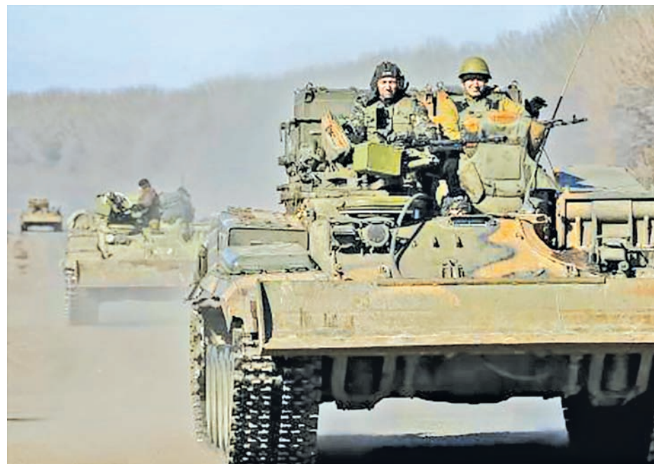
Members of the Ukrainian armed forces ride military vehicles near Artemivsk, eastern Ukraine on 22 Feb, 2015.

KIEV, 23 Feb — Ukraine’s military said on