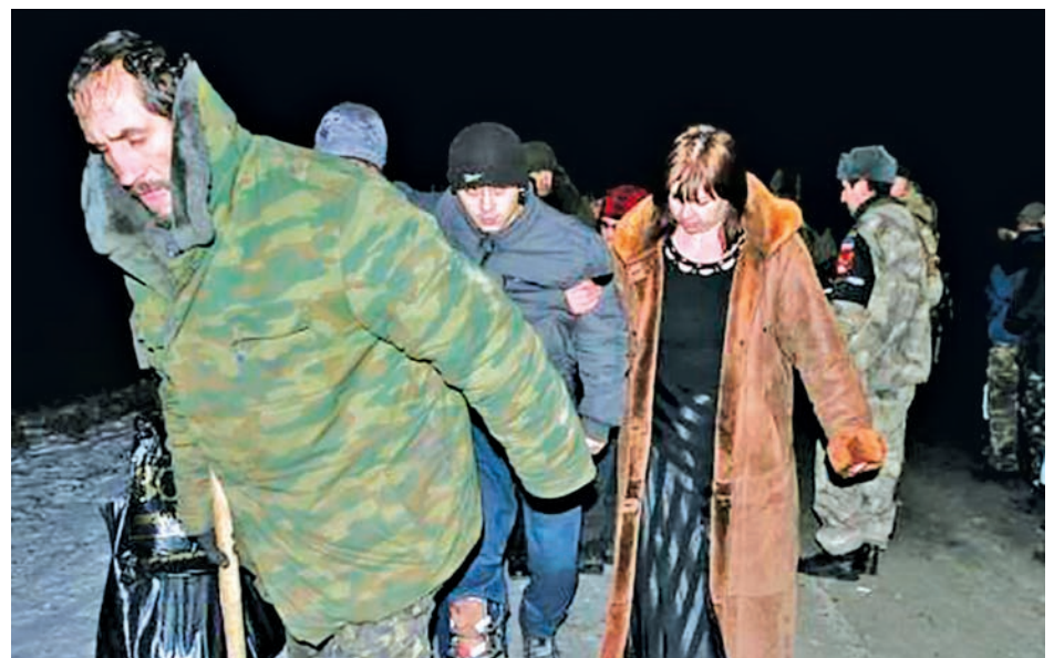
Members of pro-Russian separatists (L and C) walk after being exchanged for Ukrainian prisoners of war near the village of Zholobok in Luhansk region, eastern Ukraine on 21 Feb, 2015.

Nevertheless, rebel leaders said on Saturday they had signed a document detailing a plan for the withdrawal of heavy weapons, as required by the Minsk agreement, a sign they may be prepared to halt their advance, having achieved their