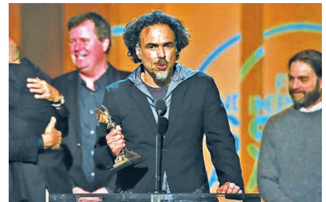
Writer and director Alejandro Gonzalez Inarritu accepts the Best Feature award for the film "Birdman" at the 2015 Film Independent Spirit Awards in Santa Monica, California on 21 Feb, 2015.

Poland's "Ida" won best international film, while "CitizenFour," about National Security Agency whistleblower Edward Snowden, won best documentary. Both are nominated for Oscars. Dan Gilroy, nominated for the best screenplay Oscar, won best screenplay and first feature for "Nightcrawler."—Reuters