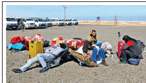
Egyptian men wait to board buses back home in Salloum, Egypt, east of the border with Libya, on 21 Feb, 2015. Over 6,000 Egyptians have returned from Libya, since the air strike against the Islamic State (IS) in the neighbouring country on Monday, according to Salloum land port gate authority.