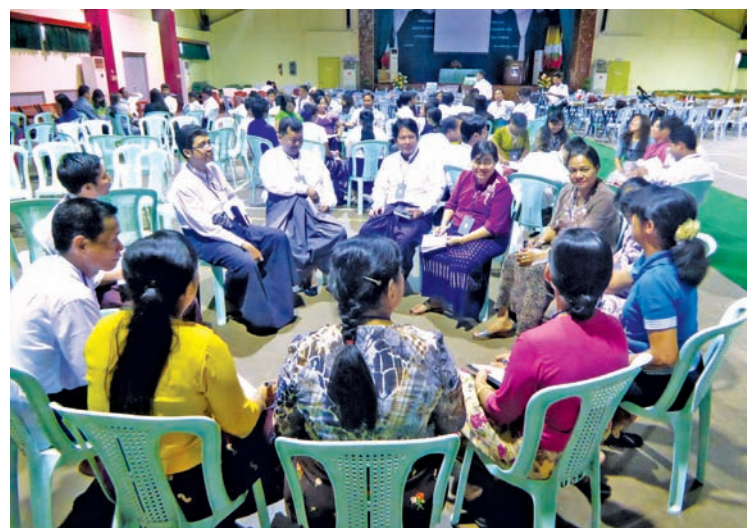
Attendees at workshop for the media on election reporting seen in group discussions.