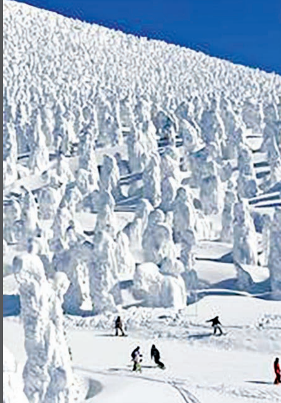
People enjoy skiing among so-called “Ice Monsters” at Zao hot spring ski resort in Yamagata, northeastern Japan, on 21 Feb, 2015. Ice Monsters are formed by ice and snow coating pine trees, and are now in the last stage of their best time to view.