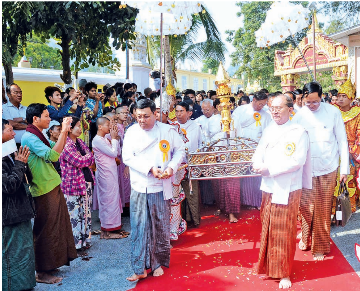
President U Thein Sein conveys diamond orb for Laykyun Marn Aung Pagoda in Sagaing.

Sitagu International Buddhist Academy in Sagaing Township donated K30 million and Paing Company and Gantgawmying