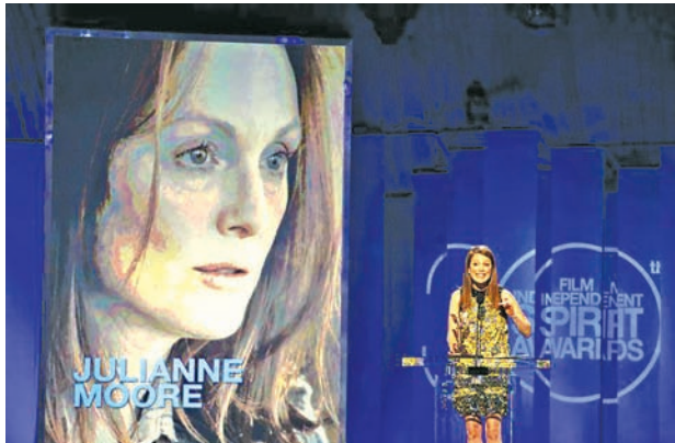
Actress Julianne Moore accepts the award for best female lead for her role in "Still Alice" at the 2015 Film Independent Spirit Awards in Santa Monica, California on 21 Feb, 2015.

All four acting categories were won by Oscar-nominated frontrunners, including Michael Keaton for best ac-