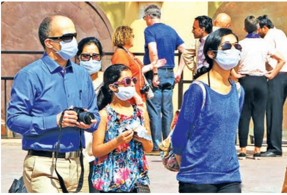
Tourists wear masks in Jaipur, India, on 21 Feb, 2015. India seems to be reeling under the impact of swine flu, which has claimed nearly 600 lives so far this year.