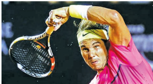
Rafael Nadal of Spain returns to Fabio Fognini of Italy during their men's singles tennis semi-final match at the Rio Open tournament in Rio de Janeiro, on 21 Feb, 2015.

"I'm really happy about this match. I beat the best player on this surface," said the world number 28, who has been in good form this year since winning the Australian Open doubles title with Simone Bolelli last month. "Rafa is always difficult. From the second