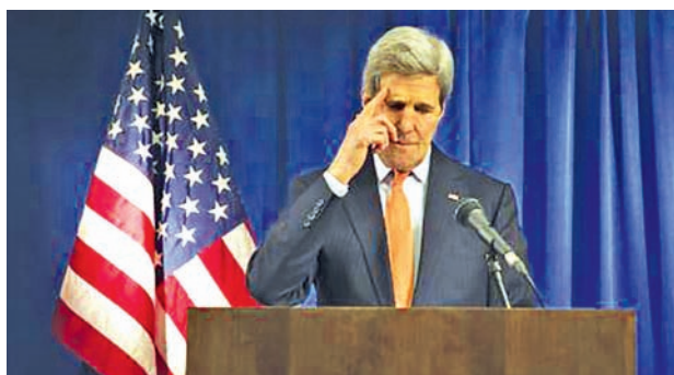
US Secretary of State John Kerry reacts during a media briefing at the US Embassy in London, on 21 Feb, 2015.