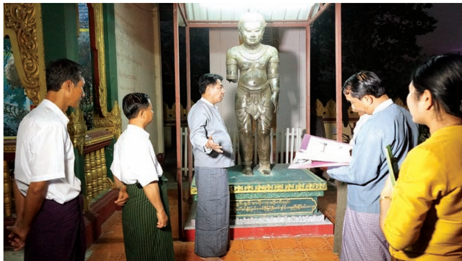
Union Minister for Culture U Aye Myint Kyu visits Khmer Bronze Statue in the precinct of Myasigone Pagoda in Toungoo.

NAY PYI TAW, 22 Feb — Union Minister for Culture U Aye Myint Kyu visited construction of pagoda in Toungoo Township, Bago region, Saturday.