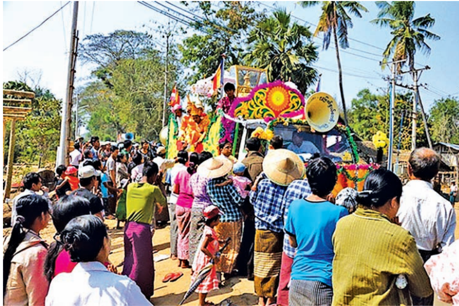
hill of Shwemuhtaw Pagoda in Pathein.

The replica took relic was conveyed from the Gandakuti chamber on the