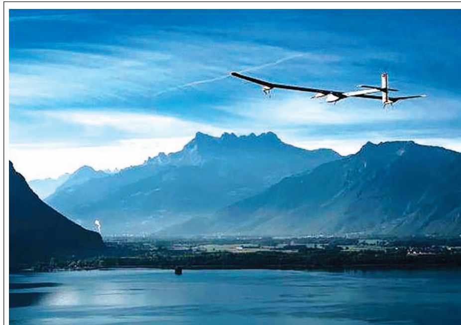
Solar Impulse-2 from Switzerland will arrive in Mandalay on 8 March 2015.—MNA