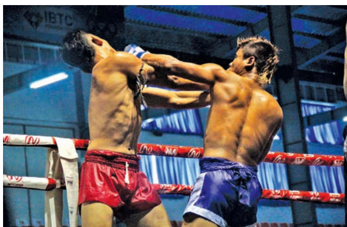
Participants in best body postures in men's body-building contest and a boxer lands a punch on an opponent in traditional boxing event of National Sports Festival 2015.