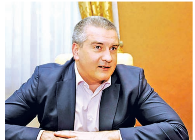
Crimea's leader Sergey Aksyonov

SIMFEROPOL, 22 Feb — Crimea's leader Sergey Aksyonov, in his first interview with Japanese media since Russia's annexation of Crimea, said the process of joining Russia was successful as it was achieved without military conflict and supported in a referendum last March to secede from Ukraine.