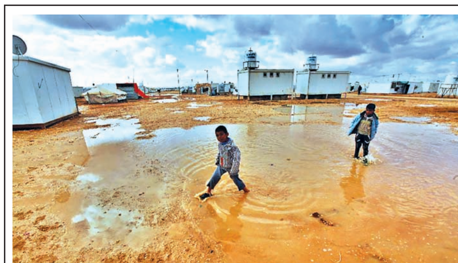
Syrian refugee boys play in rain water at Zaatari Syrian refugee camp near Mafraq city, Jordan, on 21 Feb, 2015.