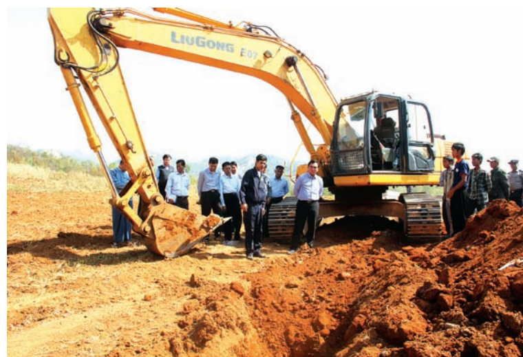
U Myat Hein, Union Minister for Communications and Information Technology inspects preparation for laying of fibre optic cables.

Currently, Myanmar has 6,135 mobile stations in 322 townships, with an average mobile density reaching 45.42%.—MNA