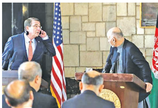
US Secretary of Defence Ash Carter (L) listens to remarks by Afghan President Ashraf Ghani (R) during a joint news conference at the Presidential Palace in Kabul on 21 Feb, 2015.

"Right now I think we're comfortable looking