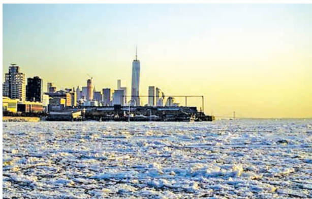
The One World Trade Centre tower is pictured in the background as ice floes are viewed along the Hudson River in New York on 20 Feb, 2015.

The new round of harsh weather is part of a system that has cut a