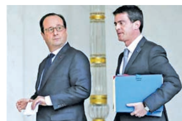
French President Francois Hollande (L) and Prime Minister Manuel Valls walk together after the weekly cabinet meeting at the Elysee Palace in Paris on 22 Dec, 2014.

The Ifop survey was based on the views of 1,972 people gathered via phone and Internet between 12-21 February, Ifop said.—Reuters