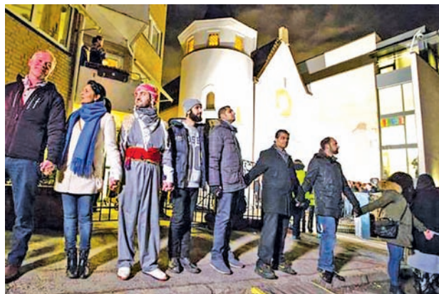
Muslims join hands to form a human shield as they stand outside a synagogue in Oslo on 21 Feb, 2015.