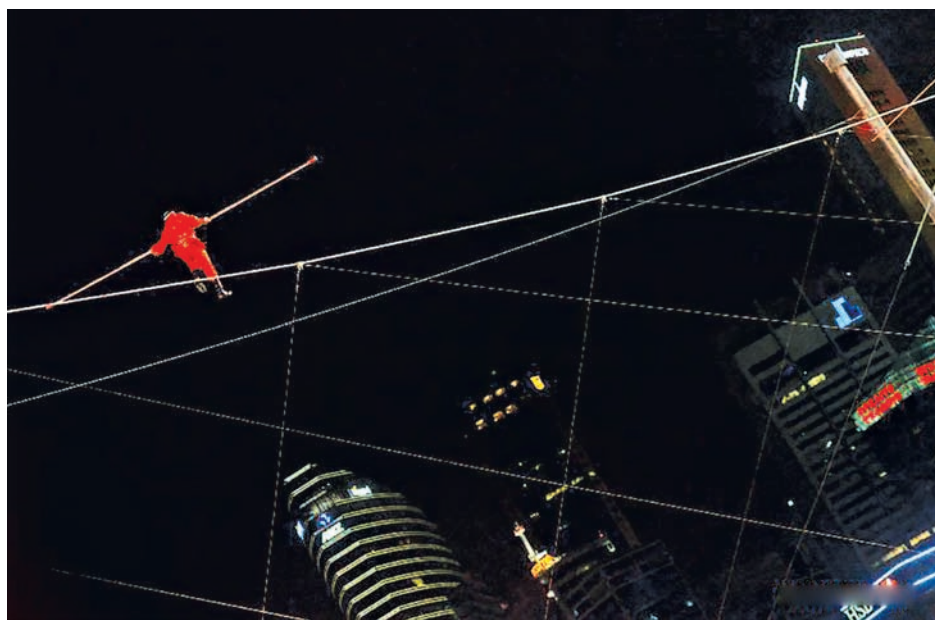
Adili Wuxor from China’s Xinjiang Acrobatic Troupe performs acrobatics on the aerial tightrope during a Spring Festival celebration called “River Hongbao” held in Singapore’s Marina Bay in Singapore, on 21 Feb, 2015.