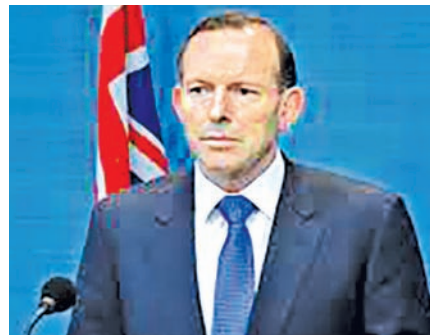
Australian Prime Minister Tony Abbott

PERTH, 22 Feb — Australian Prime Minister Tony Abbott foreshadowed tighter immigration controls on Sunday when he released the first report into a siege last December in Sydney's Lindt cafe, in which two hostages and the gunman were killed.