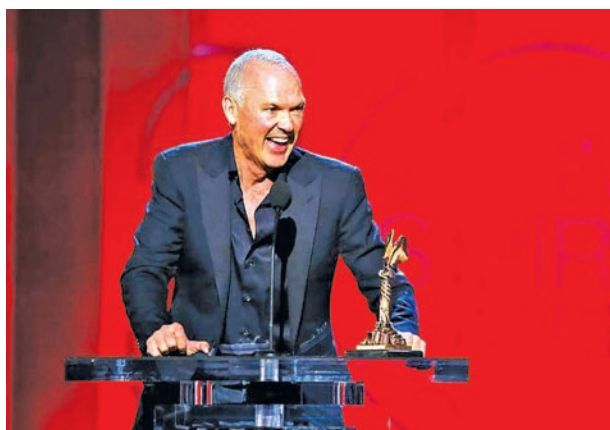
Actor Michael Keaton accepts the award for Best Male Lead for his role in "Birdman" at the 2015 Film Independent Spirit Awards in Santa Monica, California on 21 Feb, 2015.

tor for "Birdman." In his acceptance speech, he called the film "bold cinema," and a "game-changer."