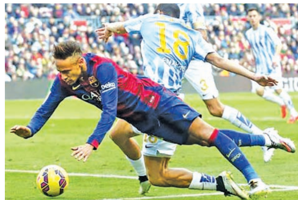
Barcelona's Neymar is challenged by Malaga's Roberto Rosales during their Spanish First division soccer match at Camp Nou stadium in Barcelona on 21 Feb, 2015.

over Uruguayan Pablo Cuevas finished at 3.30 am on Saturday. Fognini played a long last eight match that lasted more than three hours on Friday before he overcame Argentine Federico Delbonis. — Reuters