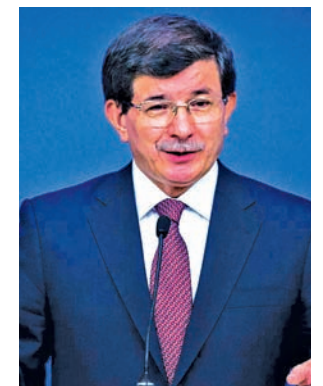
Turkish Prime Minister Ahmet Davutoglu

ANKARA, 22 Feb — Turkish soldiers guarding the tomb of Suleyman Shah in Syria have been successfully evacuated to Turkey in a military operation overnight, Turkish Prime Minister Ahmet Davutoglu said on his Twitter account on Sunday.