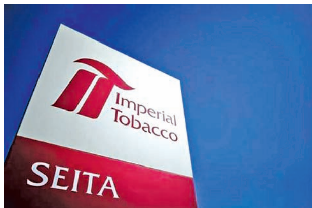
View of a sign outside the Imperial Tobacco Seita cigarette plant in Carquefou, near Nantes, on 15 April, 2014.

Australia introduced a ban a few years ago as a way to reduce smoking and is facing challenges at the World Trade Organization over complaints the laws create illegal obstacles to commerce.