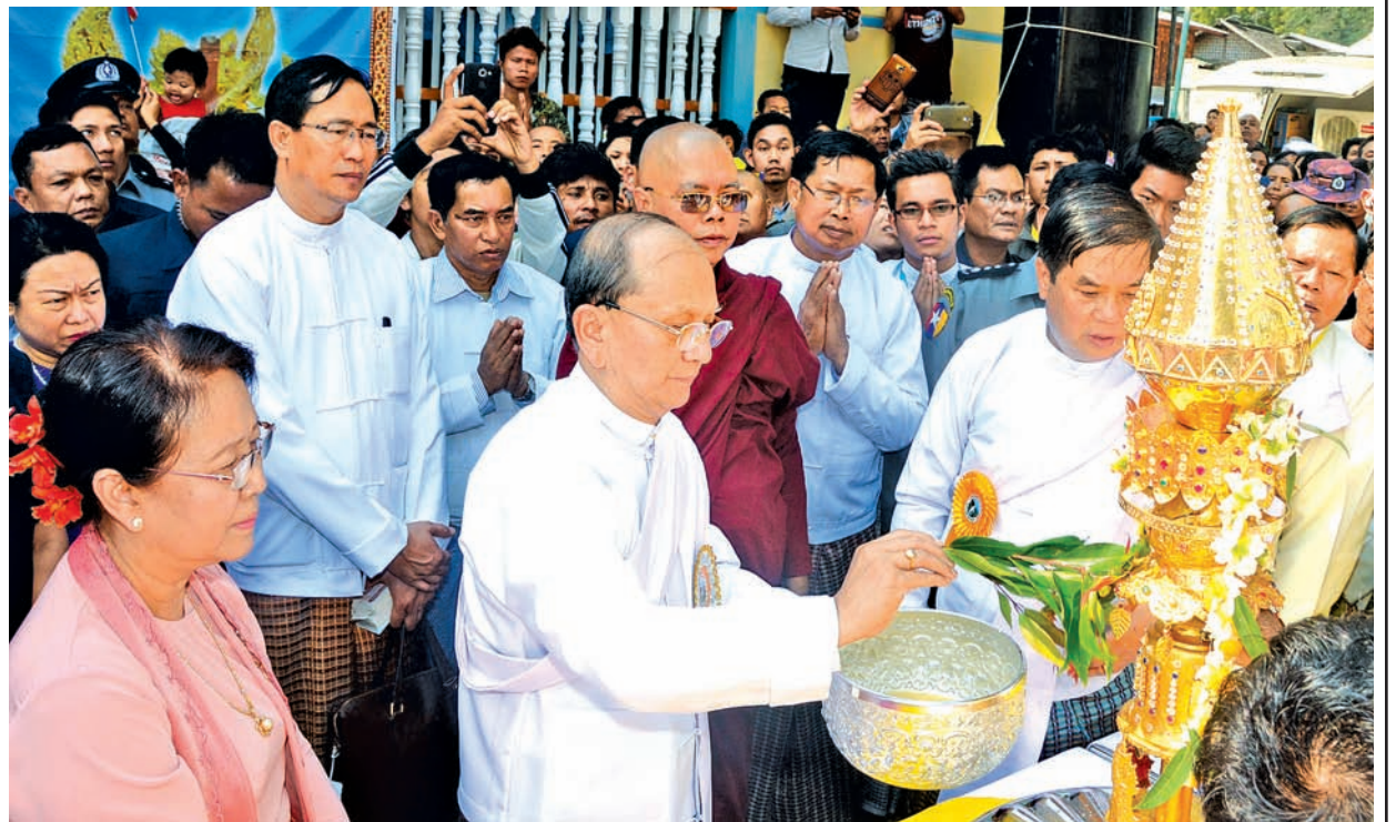
President U Thein Sein sprinkles scented water on diamond orb before hoisting it atop Laykyun Marn Aung Pagoda in Sagaing. (News on page 1)—MNA

NAY PYI TAW, 23 Feb — On the occasion of the 31 st Anniversary of the National Day of Brunei Darussalam which falls on 23 February 2015, U Wunna Maung Lwin, Union Minister for Foreign Affairs of the Republic of the Union of Myanmar, has sent a message of felicitations to His Royal Highness Prince Haji Mohamed Bolkhiah, Minister of Foreign Affairs and Trade of Brunei Darussalam.—MNA