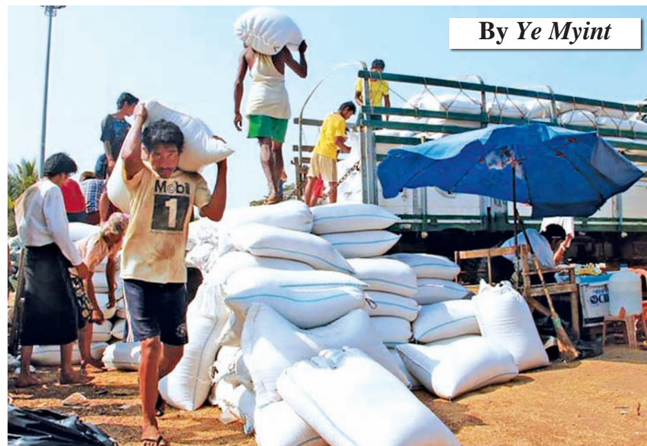
Workers uploading sacks of rice in Yangon. Chinese firms offer to buy white rice with 25%, 35%, 100% broken from Myanmar, MRF says.