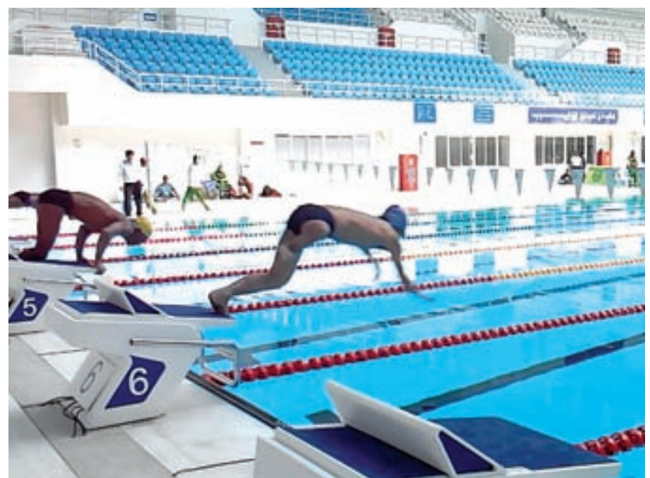
Swimmers with disabilities taking part in swimming competition at Wunna Theikdi swimming pool in Nay Pyi Taw. THAN NAING (ZABUTHIRI)