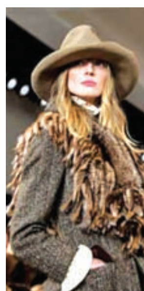
A model presents a creation from the Ralph Lauren Fall/Winter 2015 collection during New York Fashion Week on 19 Feb, 2015.