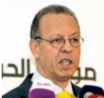
United Nations' Yemen envoy Jamal Benomar addresses a news conference on a proposal to turn the country into a federation of semi-autonomous regions, in Sanaa on 24 Dec, 2013.

SANAA, 20 Feb — Yemen's feuding parties have agreed on a "people's transitional council" to help govern the country and guide it out of a political crisis, UN mediator Jamal Benomar announced on Friday.