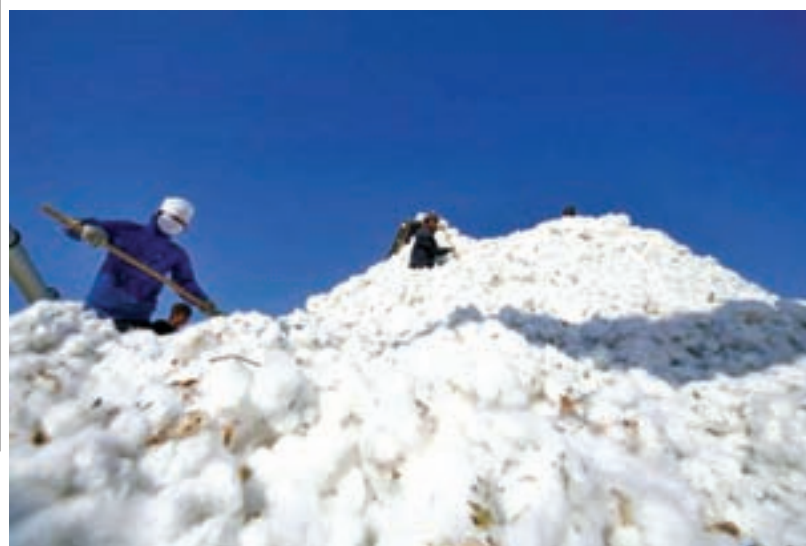
Farmers stack cotton at a cotton purchase station in Hami, Xinjiang Uighur Autonomous Region in this 3 Nov, 2010 file picture.

BEIJING, 20 Feb — China's top cotton producer, a quasi-military body formed 60 years ago to settle the far west Xinjiang area, is resisting a government policy that could force it to cut output in an industry employing hundreds of thousands in the restive region.