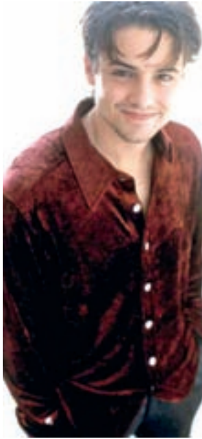
Actor Will Friedle

'Guardians of the Galaxy' will premiere on Disney XD in 2015.—PTI