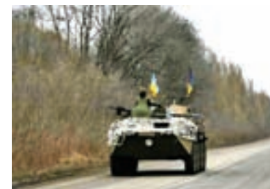
A member of the Ukrainian armed forces rides an armoured personnel carrier near Debaltseve, eastern Ukraine on 20 Feb, 2015.

KIEV/VUHLEHIRSK, (Ukraine), 20 Feb — Fighting persisted in east Ukraine on Friday despite new European efforts to ensure a ceasefire takes hold.