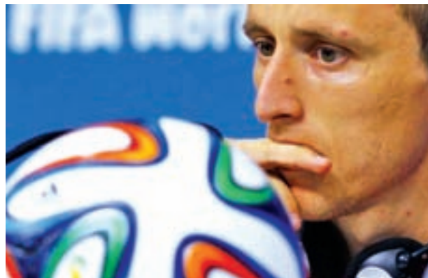
Croatia's Luka Modric

Real are a point clear of second-placed Barcelona