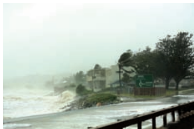
Cyclone Marcia slams into the heavily populated central and southern coastline of Queensland from 8 am local time, Australia, on 20 Feb, 2015. Two cyclones, Lam and Marcia, hit the north and east regions of Australia on Friday with winds of up to 290 km per hour recorded so far.