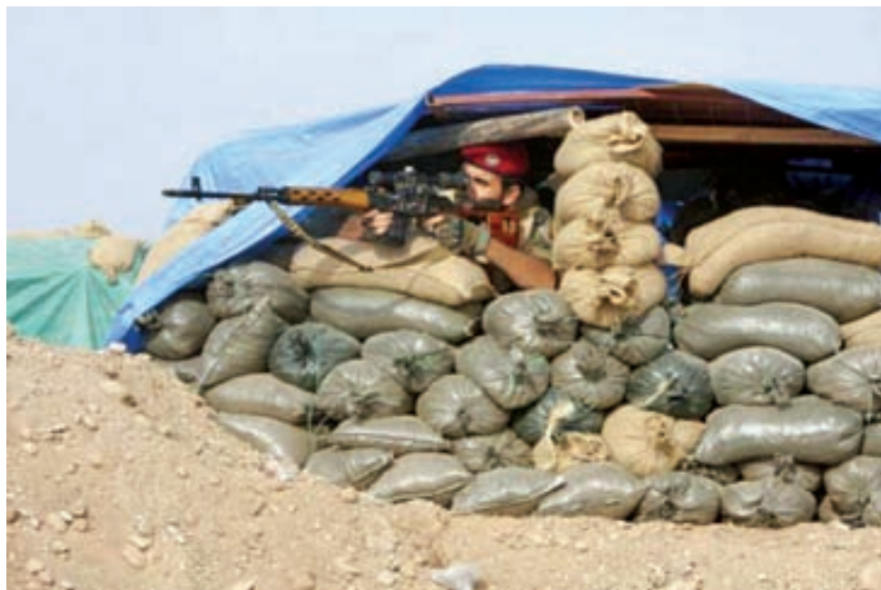
A Kurdish Peshmerga fighter takes up position with weapon at the frontline against the Islamic State, on the outskirts of Mosul on 26 Jan, 2015.