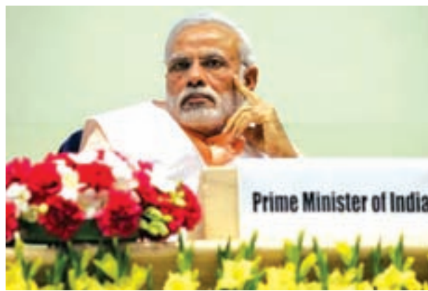
India's Prime Minister Narendra Modi attends an event organized by the Christian community to celebrate the beatification of two Indians by Pope Francis late last year, in New Delhi on 17 Feb, 2015.

Leaders of the hardline Hindu group Vishwa Hindu Parishad associated with the BJP have cautioned members across India against making comments that "hurt Narendra Modi's image". A saint-like bust of the prime minister was removed from a temple in his home state of Gujarat after he tweeted his disapproval, and a designer suit he wore to meet US President Ba-