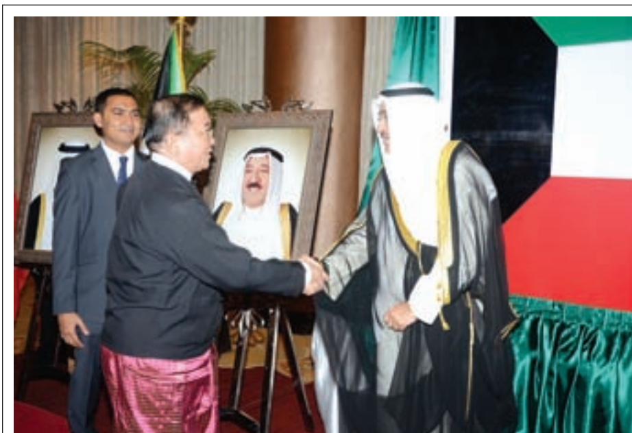
Deputy Minister for Energy U Aung Htoo being welcomed by Kuwaiti Ambassador Mr Essa Y.K.E. Al-Shamali at the reception to mark 54 th Anniversary of National Day and 24 th Anniversary of Independence Day of Kuwait on 20 February in Yangon.