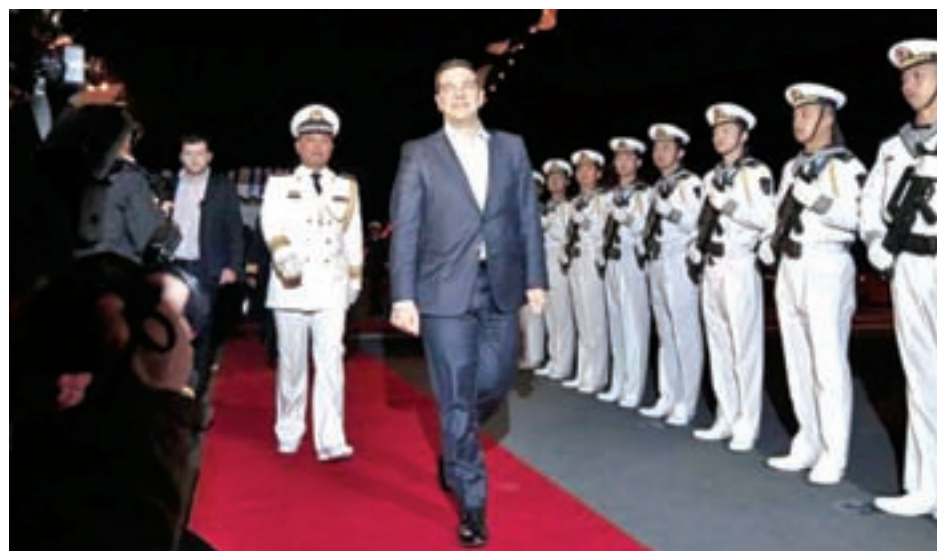
Greek Prime Minister Alexis Tsipras walks past a guard of honour after boarding the Chinese frigate Changbaishan at the port of Piraeus, near Athens on 19 Feb, 2015.

Under a privatisation scheme last year, COSCO had been shortlisted, along with four other suitors, as a potential buyer of a stake of 67 percent in the Piraeus port.— Reuters