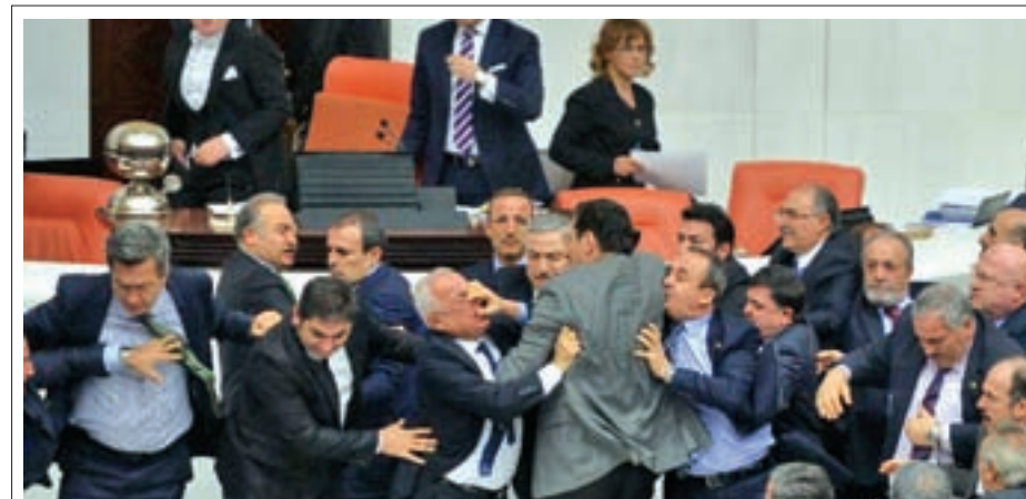
Photo taken on 19 Feb, 2015 shows the fight between parliamentarians during the first day of debates in Turkish legislature's General Assembly on a government-led controversial homeland security bill in Ankara, Turkey. The fight erupted following arguments between the deputies of ruling Justice and Development Party (AKP) and the deputies of the main opposition Republican People's Party (CHP) during a session late in the evening.