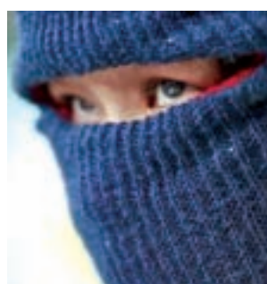
A woman, who identified herself as a surrogate mother, looks on during a news conference at Pavena Foundation for Children and Women, in Pathum Thani on 9 Sept, 2014.

"This law aims to stop Thai women's wombs from becoming the world's womb. This law bans foreign couples from coming