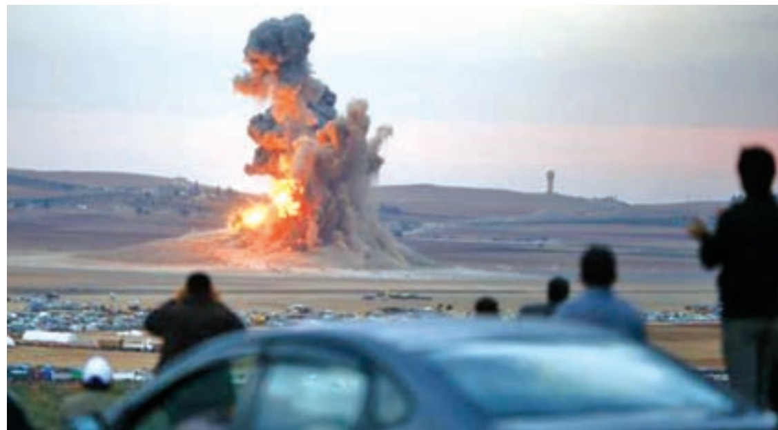
Smoke and flames rise over a hill near the Syrian town of Kobani after an airstrike, as seen from the Mursitpinar crossing on the Turkish-Syrian border in the southeastern town of Suruc in Sanliurfa Province, on 23 Oct, 2014.

WASHINGTON, 20 Feb — The US-led coalition staged 15 air strikes on Islamic State forces in Iraq and Syria, the Combined Joint Task Force said on Thursday.