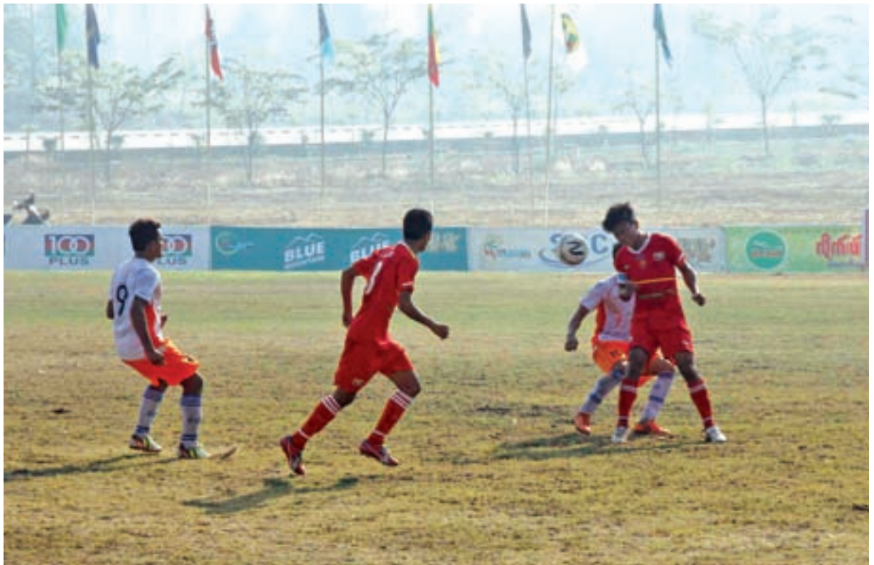
Players of Nay Pyi Taw Council Area team trying to control football in meeting with those of Sagaing Region at Wunna Theikdi training ground No 4.