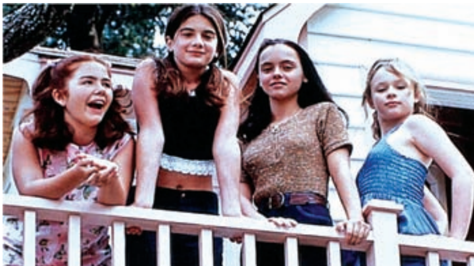
The film is centred on one memorable summer four 12-year-old friends had in 1970.