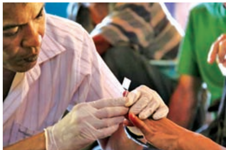
A government health worker takes a blood sample to be tested for malaria in Ta Gay Laung village hall in Hpa-an District in Kayin State, south-eastern Myanmar, on 28 Nov, 2014.

LONDON, 20 Feb — Malaria with total resistance to the antimalarial drug artemisinin has taken hold in Myanmar and spread close to the border with India, threatening to repeat history and render crucial medicines useless, scientists said on Friday.