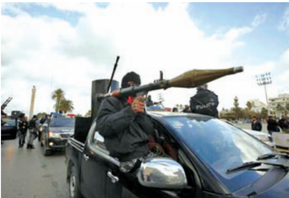
Members of the Libyan Police are seen on their vehicles as the Police prepare for deployment during the start of a security plan put forth by the Tripoli-based government to increase security in the Libyan capital, at Martyrs' Square in Tripoli on 9 Feb, 2015.

UNITED NATIONS, 20 Feb — Britain said on Thursday that Libya needed a unified government before the United Nations Security Council could change an arms embargo in order to better equip Libya's military to com-