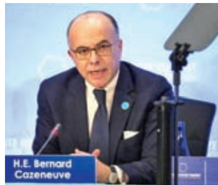
French Interior Minister Bernard Cazeneuve speaks at the Ministerial meeting on Foreign Fighters during the White House Summit on Countering Violent Extremism at the State Department in Washington on 19 Feb, 2015.

WASHINGTON, 20 Feb — France’s chief internal security official is travelling to California’s Silicon Valley to discuss his government’s concerns about violent jihadist social media messaging with leading tech and Internet companies.