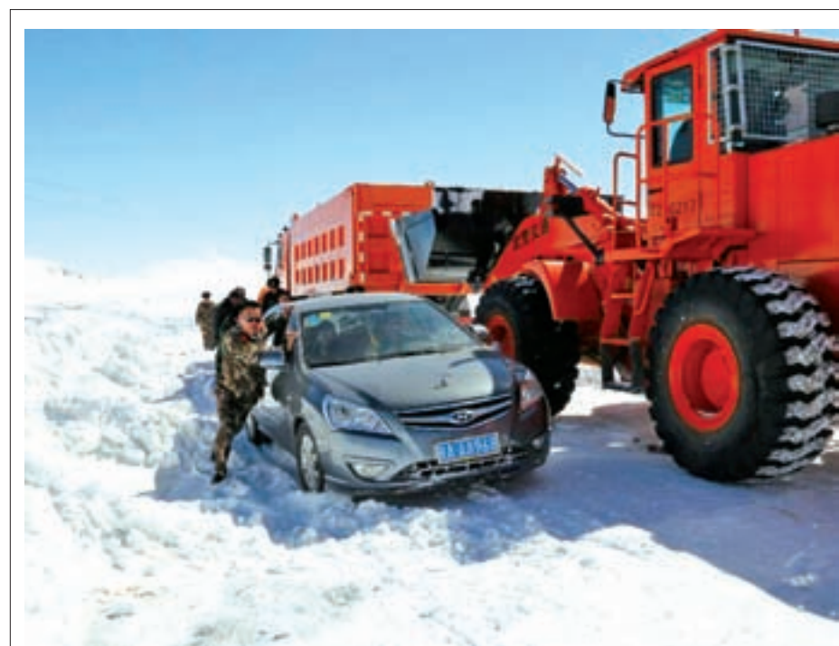
Soldiers escort a trapped car on snow-covered Xinjiang-Tibet Road (Mayou Mula section), Ali Prefecture, southwest China's Tibet Autonomous Region, on 19 Feb, 2015. The road of the Mayou Mula section, with an altitude of 4,900 metres, was blocked by snow as a snowfall hit the region on Thursday, the first day of Chinese Lunar New Year. Rescuers from local police had to work two hours to evacuate trapped vehicles and people.

Beijing has also pledged to invest billions of dollars in textile factories in Xinjiang, in the hope of creating 1 million jobs by 2023, but there are concern that Uighurs could be overlooked for many of the jobs. —Reuters