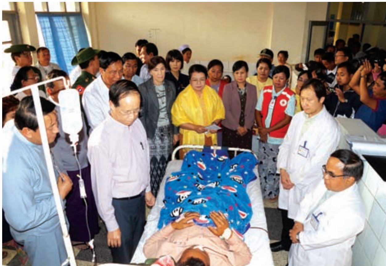
Vice President Dr Sai Mauk Kham comforts a patient at Lashio General Hospital in Lashio.

Nay Pyi Taw, 20 Feb—Vice President Dr Sai Mauk Kham and party visited injured Tatmadaw personnel who fought bravely for the nation in Laukkai and their families at the Military Hospital in Lashio station on Friday.