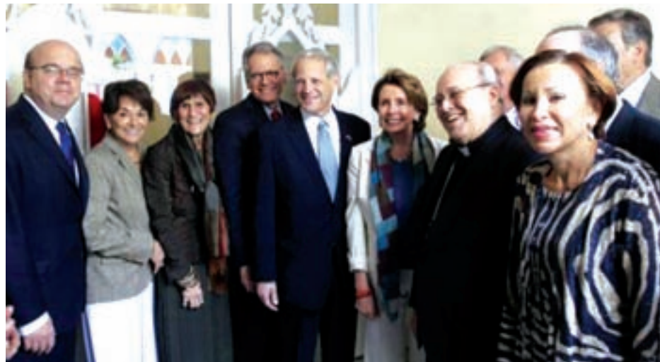
US House of Representatives Democratic leader Nancy Pelosi (3 rd R, front), Archbishop of Havana Cardinal Jaime Ortega (2 nd R, front) and members of a delegation of congressional Democrats pose for a photograph in Havana on 19 Feb, 2015.

Other members of the delegation were Representatives Jim McGovern, Eliot Engel, Rosa DeLauro, Collin Peterson, David Cicilline, Anna Eshoo, Nydia Velazquez and Steve Israel.