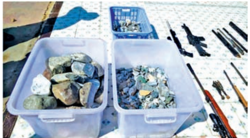
Photo shows pieces of jade and arms seized in clashes between Tatmadaw and Kokang insurgents.

NAY PYI TAW, 19 Feb — Kokang insurgent groups had infiltrated into Laukkai and launched attacks starting from 9 February with the intention of capturing it before 12 February. Despite their attempts, the Tatmadaw relentlessly countered their attacks and their operation to capture the town result-