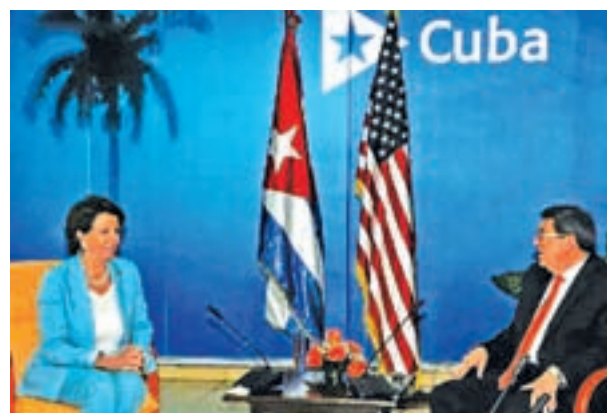
Cuban Foreign Minister Bruno Rodriguez (R) meets with the Minority Democratic Leader of US House of Representatives Nancy Pelosi at the headquarters of Cuban Foreign Ministry in Havana, capital of Cuba, on 18 Feb, 2015.