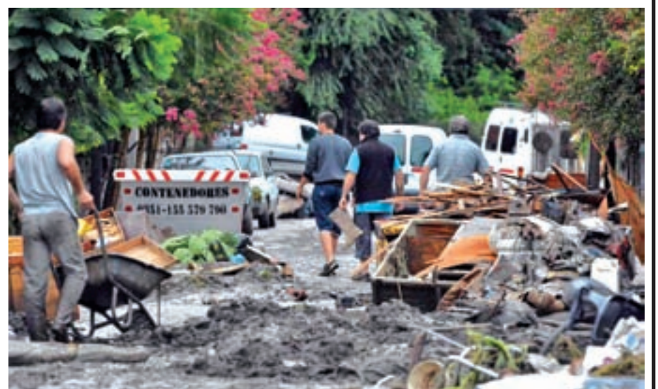
Residents clean the debris after a flood in a village of Cordoba, Argentina, on 18 Feb, 2015. The flood in Cordoba caused by the heavy rains have left seven dead and more than 1,500 houses damaged in the villages of the Sierras Chicas, and more than 300 people remain evacuated, according to local press.—XINHUA

Directorate of Investment and Company Administration