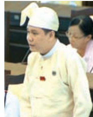
Dr Myat Nyana Soe of Yangon Region Constituency No 4. —MNA

NAY PYI TAW, 19 Feb — At the 19 th day session of Amyotha Hluttaw on Thursday, Dr Myat Nyana Soe of Yangon Region Constituency No 4 asked whether there is a plan to build social security housings under the 2012 Social Security Law. Deputy Minister for Labour, Em-