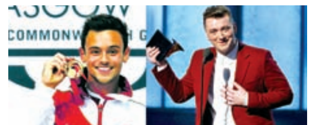
Grammy-winning singer Sam Smith and diver Tom Daley are among those nominated at this year's British LGBT Awards.

Meanwhile, Danny Dyer, Lorraine Kelly, Mel C, Russell Brand, Nigella Lawson and Price have been nominated for the Straight Ally of the Year prize, which recognizes straight stars who have been supportive of the LGBT community.