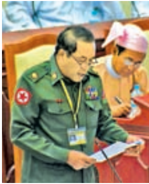
Deputy Minister Brig-Gen Kyaw Kyaw Tun. —MNA

NAY PYI TAW, 19 Feb — The Pyithu Hluttaw (Lower House) continued its 19th day session on Thursday, with questions and answers regarding farming disputes and standards and measures for sale of alcohol and a submission of motion.