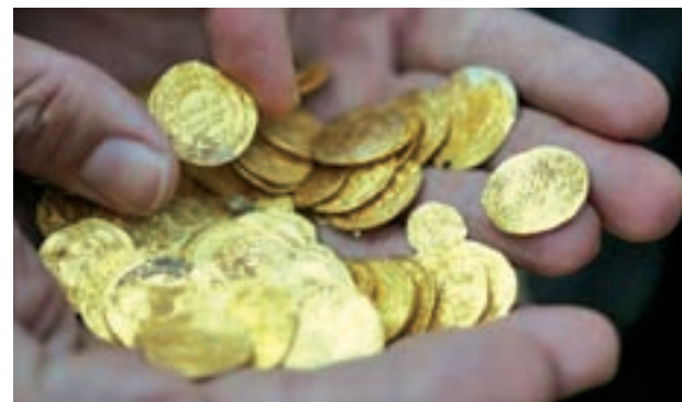
Ancient gold coins are displayed in Caesarea, north of Tel Aviv along the Mediterranean coast on 18 Feb, 2015.