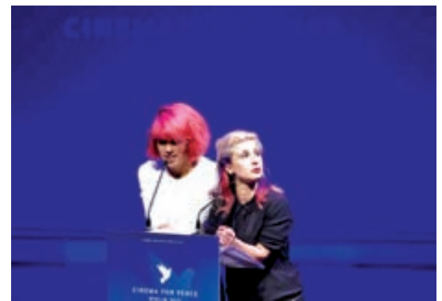
Nadezhda Tolokonnikova (L) and Maria Alyokhina of the band Pussy Riot address the "Cinema for Peace".

NEW YORK, 19 Feb — Russian punk rock group Pussy Riot released their first song in English on Wednesday, a musical tribute to Eric Garner, the unarmed black man whose death in a police chokehold last summer sparked wide protests against police violence.