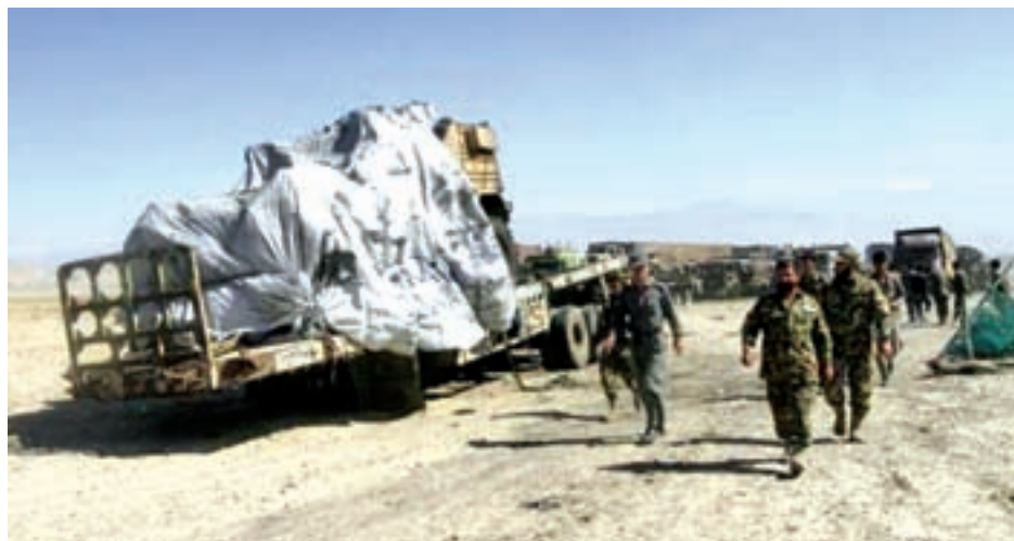
Afghan security forces arrive at the site of burning NATO supply trucks, after a Taleban attack at Behsud District of Nangarhar Province on 9 June, 2014.