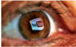
A picture illustration shows a YouTube logo reflected in a person's eye, in central Bosnian town of Zenica, early on 18 June, 2014.

SAN FRANCISCO, 19 Feb — Google Inc's (GOOGL) YouTube is set to launch its long-awaited paid monthly subscription service called YouTube Music Key in a few months, said Robert Kyncl, the online video service's head of content and business operations, at the Code/Media conference.