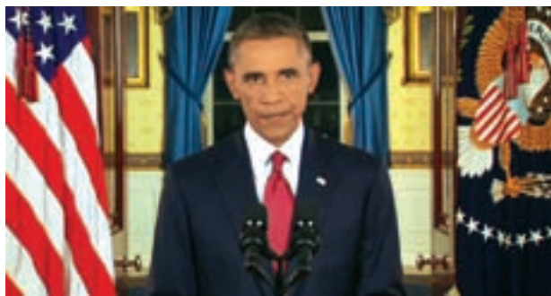
US President Barack Obama

“We must never accept the premise that they put forward, because it is