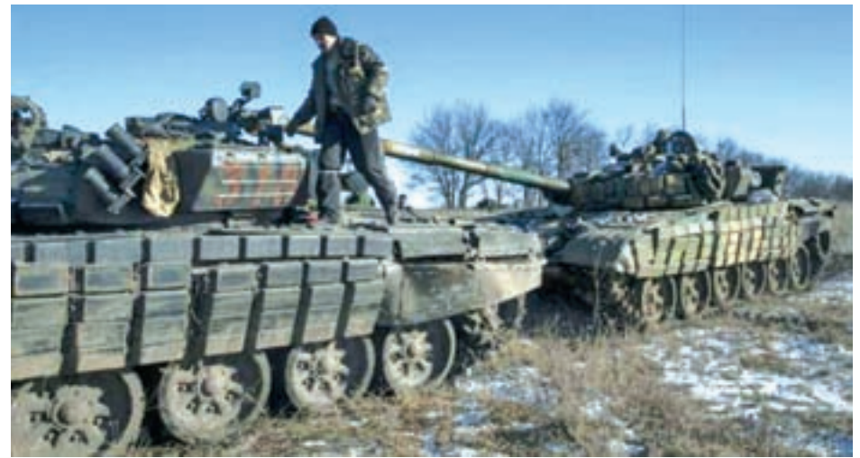
A tank crew member of the separatist self-proclaimed Donetsk People's Republic Army walks on top of a tank at a checkpoint on the road from the town of Vuhlehirsk to Debaltseve on 18 Feb, 2015.

But Merkel’s spokesman was more cautious, saying more punitive measures hinged on developments on the ground in eastern Ukraine. “If the fighting doesn’t stop after the fall of Debaltseve, new sanc-