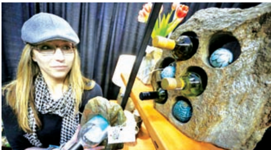
An exhibitor displays a wine rack made of natural stone at the 42 nd Home and Garden Show in Vancouver, Canada, on 18 Feb, 2015. About 425 exhibitors across the province of British Columbia showcased their newest home design inspirations and gardening ideas during the 5-days event, which can draw around 60 thousand spectators.