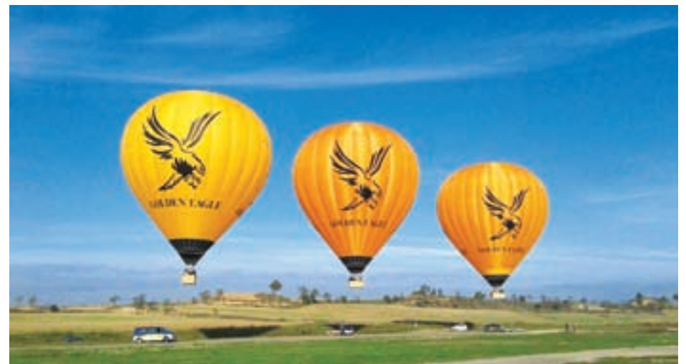
Golden Express Tours launched a hot air balloon operation named Golden Eagle Ballooning in Myanmar's ancient city Bagan last November.