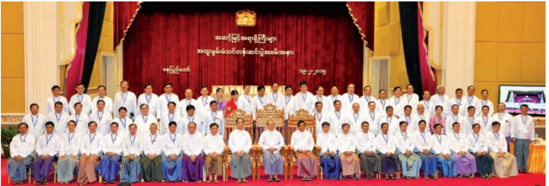
President U Thein Sein poses for documentary photo with trainees and trainers at the graduation ceremony of special refresher course for high-ranking officers.

NAY PYI TAW, 19 Feb—President U Thein Sein attended the graduation ceremony of a special refresher course for high-ranking officers, organized at his palace here on Thursday, officials said. Speaking at the ceremony, Union Minister at