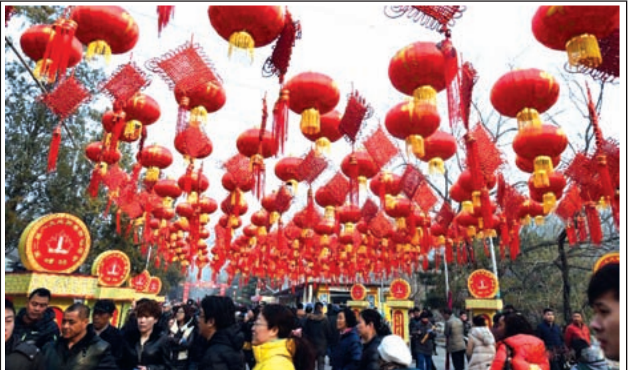
Visitors walk past a passage of red lanterns during the annual temple fair at Badachu Park in Beijing, capital of China, on 19 Feb, 2015. The temple fair kicked off on Thursday, the first day of the Chinese Lunar New Year. — XINHUA