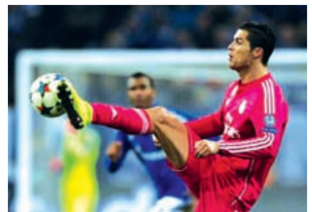
Real Madrid's Cristiano Ronaldo controls the ball during their Champions League Round of 16 first leg soccer match against Schalke 04 in Gelsenkirchen on 18 Feb, 2015.