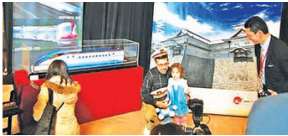
Visitors to the Japan Week event at New York's Grand Central Station take souvenir photos on 18 Feb, 2015, with a model of the latest bullet train to be used for the country's newest shinkansen train service linking Tokyo with the popular destination of Kanazawa beginning in the following month.