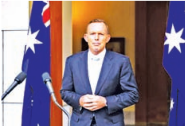
Australia's Prime Minister Tony Abbott