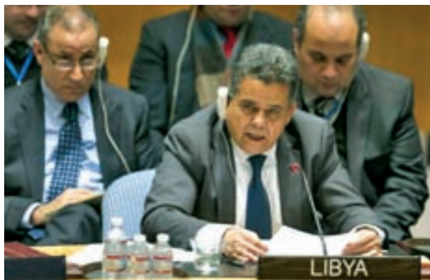
Libyan Foreign Minister Mohamed Dayri speaks during a United Nations Security Council meeting about the situation in Libya in the Manhattan borough of New York on 18 Feb, 2015.

The Security Council met to discuss Libya after Islamic State released a video showing the beheading of 21 Egyptian Christians. Egypt responded to the killings with air