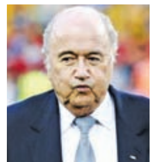
FIFA President Sepp Blatter

"Italy has no dignity or pride, it can't be right to see