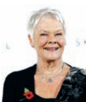
Actress Judi Dench

The film offers a mix of Indian and British themes,