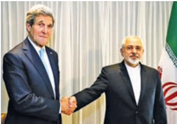
US Secretary of State John Kerry shakes hands with Iranian Foreign Minister Mohammad Javad Zarif before a meeting in Geneva on 24 Jan, 2015