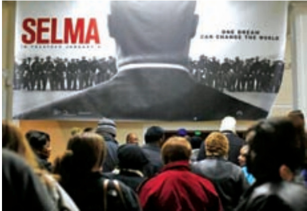
Audience members line up for a screening of the movie "Selma" at the Selma Walton Theatre in Selma, Alabama, on 9 Jan, 2015.

LOS ANGELES, 19 Feb — In a year when a lack of diversity among Academy Awards nominees prompted the Twitter hashtag #OscarsSoWhite, one-third of Americans believe Hollywood does not pay proper attention to minorities and women, according to the