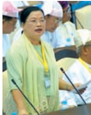
Deputy Minister Daw Win Maw Tun.