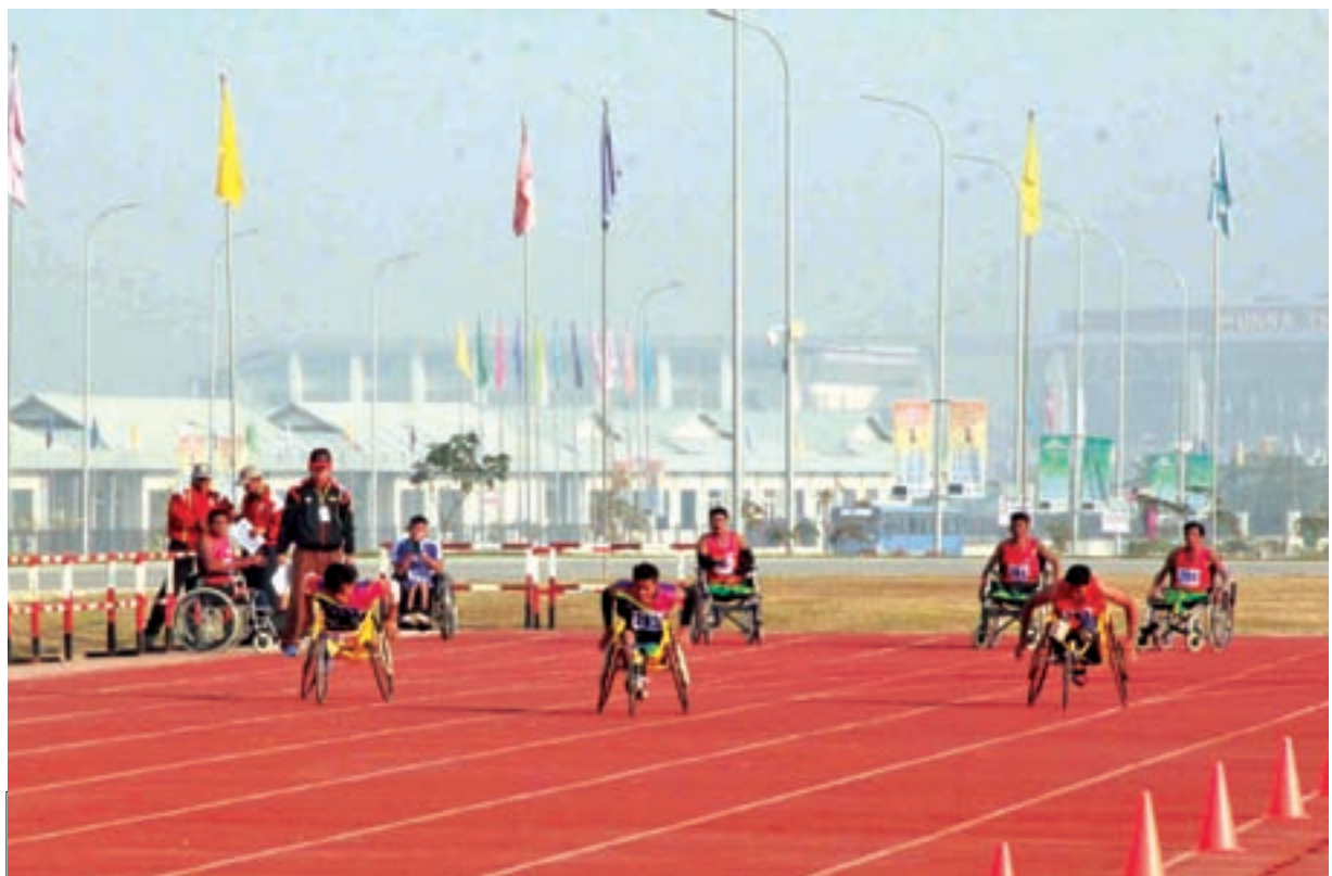
Athletes with disabilities taking part in men's 100-m wheelchair race at sports ground No 1 of Wunna Theikdi Stadium.—MNA

Myanmar, Fiji Friendship Football Match Myanmar U 22 0 - 0 Fiji U 20