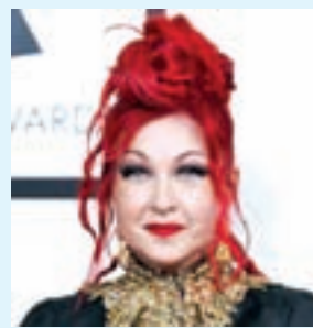
Musician Cyndi Lauper arrives at the 56th annual Grammy Awards in Los Angeles, California in this file photo taken on 26 Jan, 2014.

Dixon and Garcia will be inducted posthumously and both are in the Rock and Roll Hall of Fame, as is Hunter.—Reuters