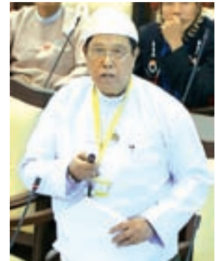
Deputy Minister U Soe Tint.

U Saw Maw Tun of Bago Region Constituency No 1 asked whether there is a plan to arrange public observation of historic parliament building in the compound of Secretariat in Yangon. Deputy Minister for Construction U