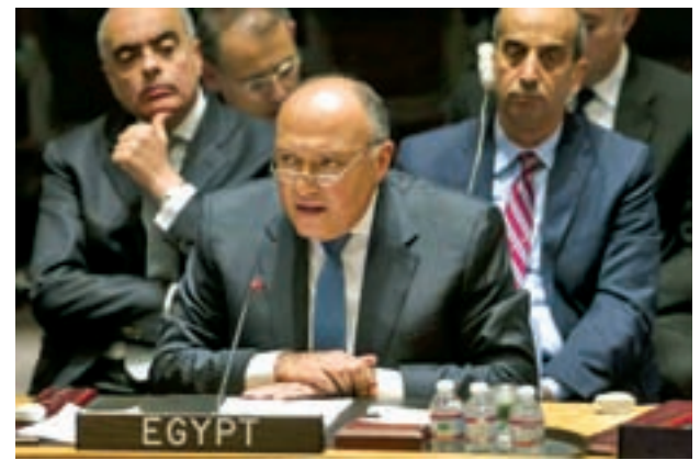
Egyptian Foreign Minister Sameh Shoukry speaks during a United Nations Security Council meeting about the situation in Libya in the Manhattan borough of New York on 18 Feb, 2015.

Egypt's Foreign Minister Sameh Shukri backed the call for the arms embargo to be lifted and also said a naval blockade should be put in place in areas not under government control to stop weapons reaching militants. He also said states wanting to help Libya confront terrorism should be