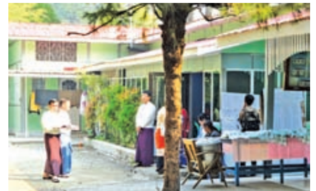
Candidates waiting for interviews for appointments for assistant surgeons and dentists.