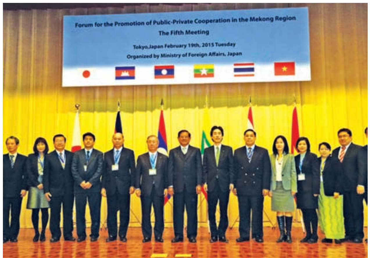
Delegates from Japan and five Southeast Asian countries along the Mekong River pose for a group photo at a meeting in Tokyo of the Japan-Mekong economic cooperation forum on Feb. 19.

"In Thailand, we call the Mekong Subregion the 'Golden Land' because of the opportunities that are there," he said.