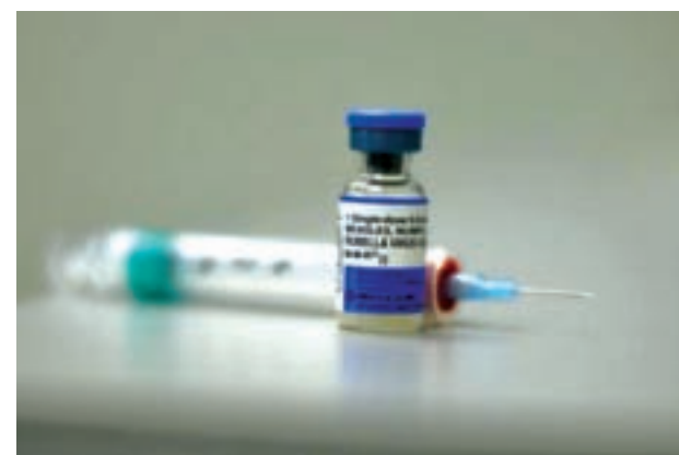
A measles vaccine is seen at Venice Family Clinic in Los Angeles, California on 5 Feb, 2015.

LOS ANGELES, 18 Feb — California public health officials, grappling with a measles outbreak that has already sickened 113 people statewide, urged residents on Tuesday to vaccinate themselves and their children before traveling internationally over spring school break. More than 150 people have been diagnosed with measles across the United States, many of them linked to an outbreak that authorities believe began when an infected person from out of the country visited Disneyland in late December. The measles outbreak has renewed a debate over the so-called anti-vaccination movement, in which fears about potential side effects of vaccines, fueled by now-debunked research suggesting a link to autism, have prompted a small minority of parents to refuse inoculations for their children.