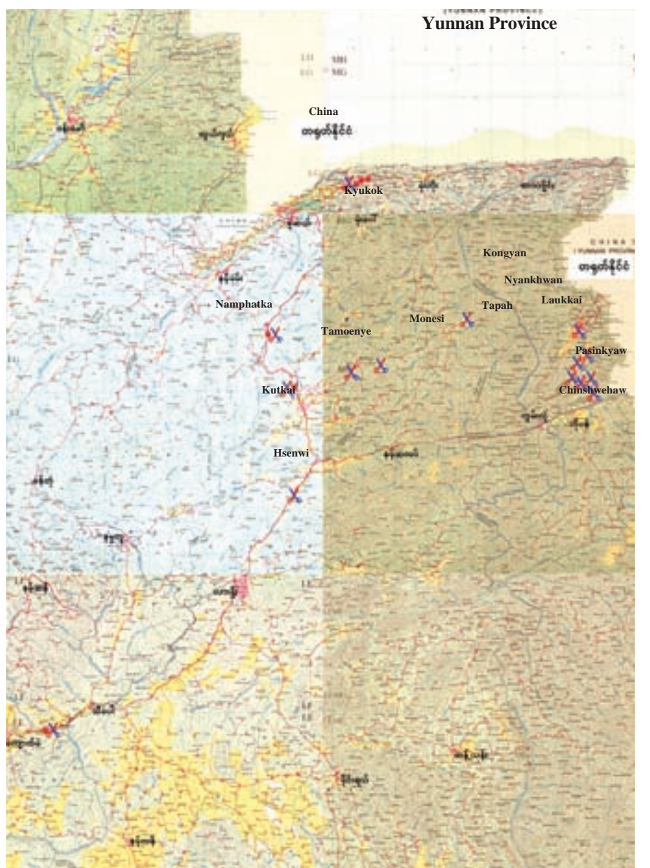
A map shows clashes between military columns and Kokang renegade groups in Laukkai Region.