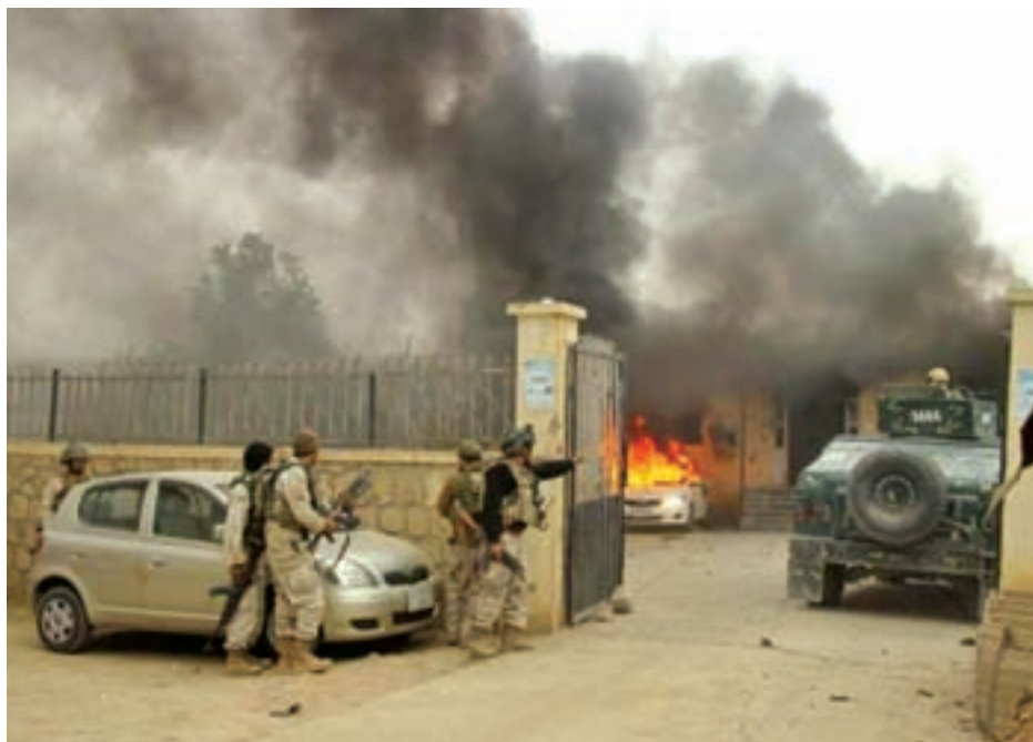
Afghan security forces arrive at the site of an attack in Kunduz Province on 27 Oct, 2014.