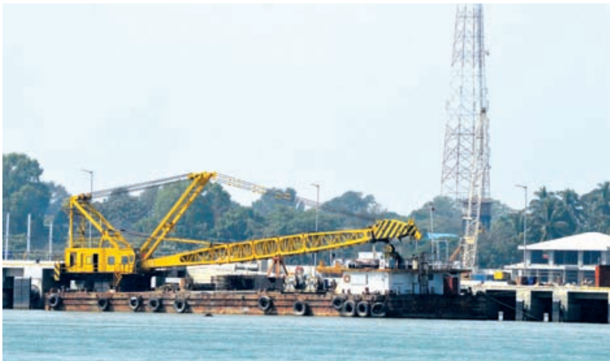
Photo taken around three months ago of Sittwe port which is being upgraded by India in Sittwe, Rakhine State. The project which started in December 2010, is expected to be completed this May.