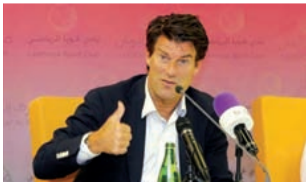
Lekhwiya's soccer head coach Michael Laudrup gestures during a news conference in Doha on 2 July, 2014.

TOKYO, 18 Feb — Former Barcelona star and current Qatari club Lekhwiya manager Michael Laudrup has said he knows the Japan Football Association is targeting him for the Japan national team job and will make a decision on his future at the season's end.