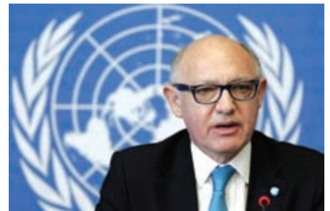
Argentina’s Foreign Minister Hector Timerman

BUENOS AIRES, 18 Feb — Argentina wants the United States to help it get to the bottom of a deadly 1994 bombing at the heart of a current political scandal by including the crime in the US nuclear talks with Iran, its foreign minister said on Tuesday.