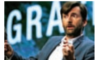
David Tennant won a What's On Stage Award for his turn in Richard II, said that there are a number of Shakespearean roles he would still love to play, reported Digital Spy.

When asked if he knows when he will next appear on stage, Tennant said, "We don't exactly, but hopefully something this year with a bit of luck."