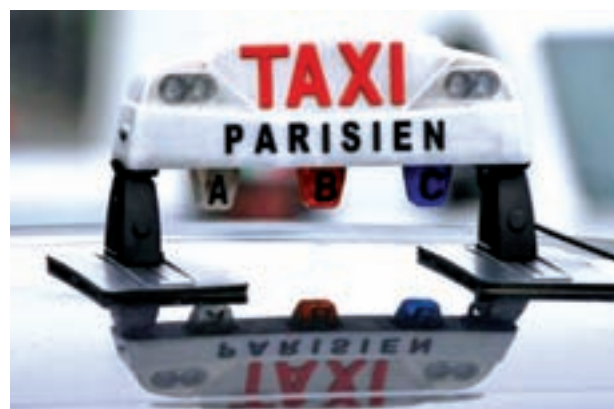
A striking Paris taxi takes part in a demonstration over the Paris ring road on 15 Dec, 2014.

Launched in California four years ago, the service has rapidly become popular in a number of countries because it often undercuts established taxi and minicab services.—Reuters