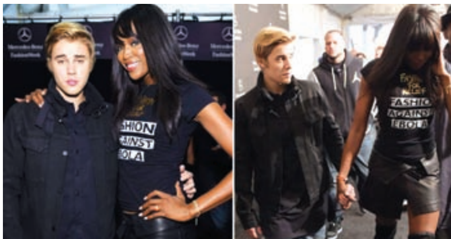
Justin Bieber has sparked dating rumour with Naomi Campbell after they were spotted walking hand-in-hand backstage at her Fashion for Relief Charity Fashion Show.

Some Hollywood stars like Paris Hilton, Michelle