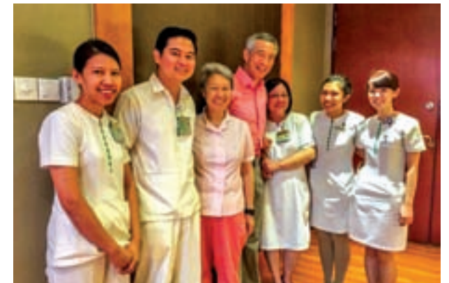
Singapore Prime Minister Lee Hsien Loong and Medical team.