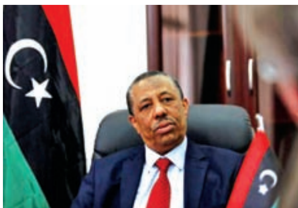
Libya's internationally recognized Prime Minister Abdullah al-Thinni speaks during an interview with Reuters in Bayda on 15 Feb, 2015.

The military jet attacked, hitting the airport