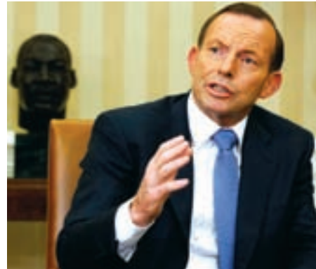
Prime Minister Tony Abbott

JAKARTA/SYDNEY, 18 Feb — Indonesia owes it to Australia not to execute two Australian drug offenders on death row, Prime Minister Tony Abbott said on Wednesday, ratcheting up a diplomatic war of words that is threatening to sour relations between the neighbours.