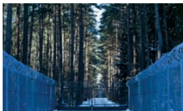
Barbed wire fence surrounding a military area is pictured in the forest near Stare Kiejkut village, close to Szczytno in northeastern Poland on 27 Jan, 2014.

WARSAW, 18 Feb — Poland will comply with a European Court of Human Rights ruling that the country had hosted a secret CIA jail, foreign minister Grzegorz Schetyna said on Wednesday.