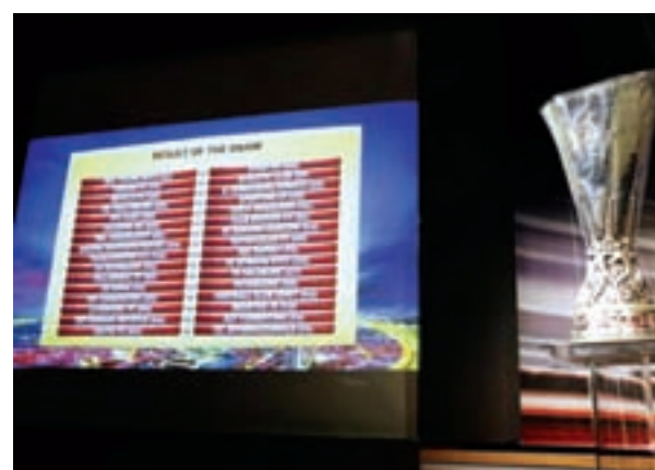
A screen shows the results of the draw for the Europa League round of 32 soccer matches near the Europa League trophy at the UEFA headquarters in Nyon on 15 Dec, 2014.

Demba Ba, who has five Europa League goals this season. Ba, with Chelsea last April, took advantage of Steven Gerrard's famous slip on the Anfield turf to score the opening goal in a 2-0 win that effectively cost Liverpool the chance of a first English title for 24 years. Gerrard, currently out with a hamstring injury, is the only survivor from Liverpool's 8-0 win and also from their last European title success in 2005. He would love nothing more to end his last season at the club before moving to the MLS by winning another European trophy. Rafa Benitez, who led Liverpool to that success a decade ago, is seeking to become only the second