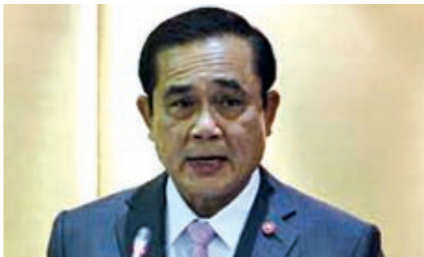
Thailand's Prime Minister Prayuth Chan-ocha

over from 2014 and some will come from the 2015 budget. It will be used in drought-hit areas and for other water-related emergencies in all 77 provinces