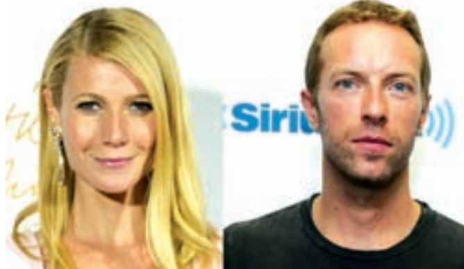
Gwyneth Paltrow and her estranged husband Chris Martin were seen walking together on the beach in Malibu along with their children, son Moses and daughter Apple.

LOS ANGELES, 18 Feb — Oscar-winning actress Gwyneth Paltrow spent her Valentine's Day with her estranged husband Chris Martin.