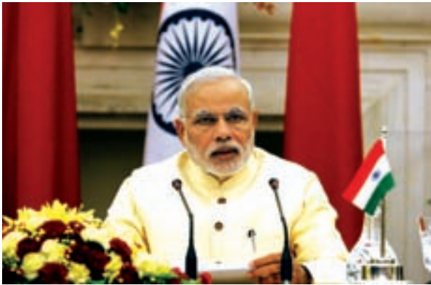
India's Prime Minister Narendra Modi

BENGALURU, (India) 18 Feb— India's Prime Minister has asked global defence contractors to transfer more technology to the country as part of the lucrative deals that they win to modernise its armed forces.