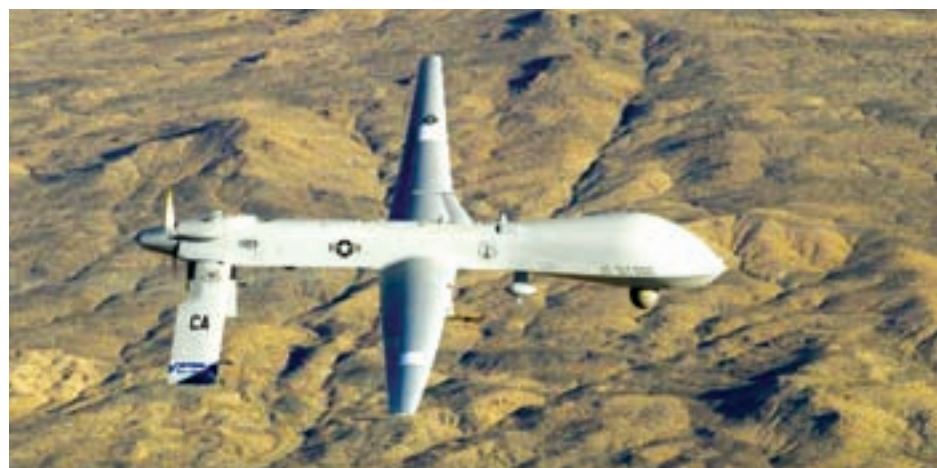
A US Air Force MQ-1 Predator

WASHINGTON, 18 Feb— The US government on Tuesday established a policy for exports of military and commercial drones, including armed ones, and said it plans to work with other countries to shape global standards for the use of the controversial weapons systems. The State Department said it would allow exports of lethal US military drones under strict conditions, including that sales must be