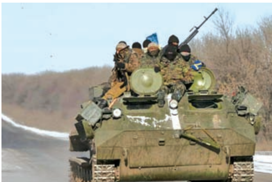
Members of the Ukrainian armed forces ride on a military vehicle near Debaltseve, eastern Ukraine on 17 Feb, 2015.

Another pro-government paramilitary leader, Mykola Kolesnyk, said in a telephone interview on 112 television channel: “We