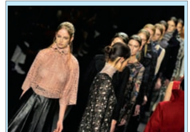
Models present creations of Vivienne Tam during the New York Fashion Week in New York, the United States, on 16 Feb, 2015.