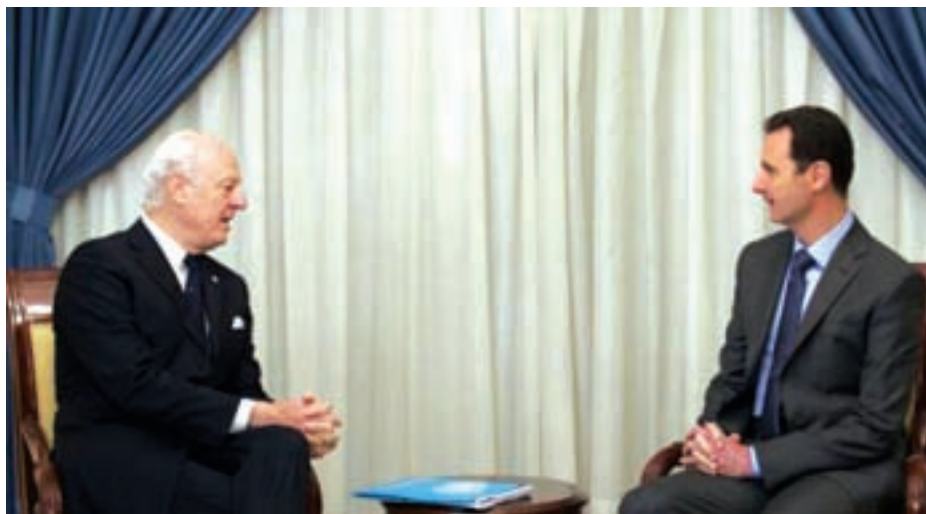
Syria's President Bashar al-Assad (R) meets United Nations Syria mediator Staffan de Mistura, in Damascus on 11 Feb, 2015, in this picture released by Syria's national news agency SANA.

dor, Bashar Ja'afari, declined to comment.