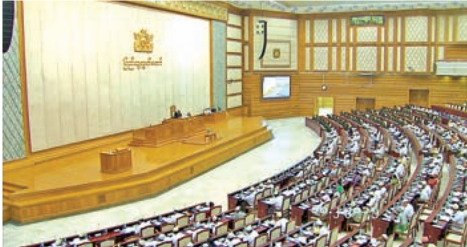
Pyidaungsu Hluttaw representatives focus on extension of explanation time.—MNA

NAY PYI TAW, 18 Feb — Government ministries have got three more minutes for explanations at Pyithu Hluttaw beginning at the 18 th day of 12 th regular session despite only three minutes in the past.