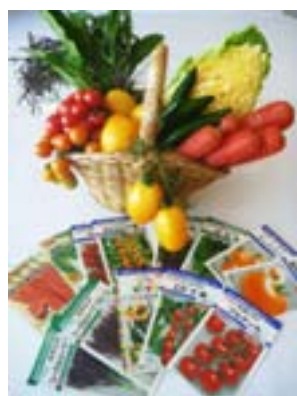
Photo taken 17 Dec, 2014 shows packets of Takii & Co.'s functional vegetable seeds under the brand of "Phyto Rich," along with harvested vegetables.

Functional vegetables are richer in nutrients than ordinary vegetables, such