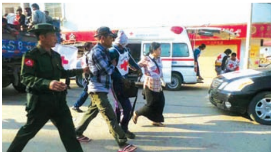
Injured Red Cross member being taken by Red Cross members and military servicemen.—MNA