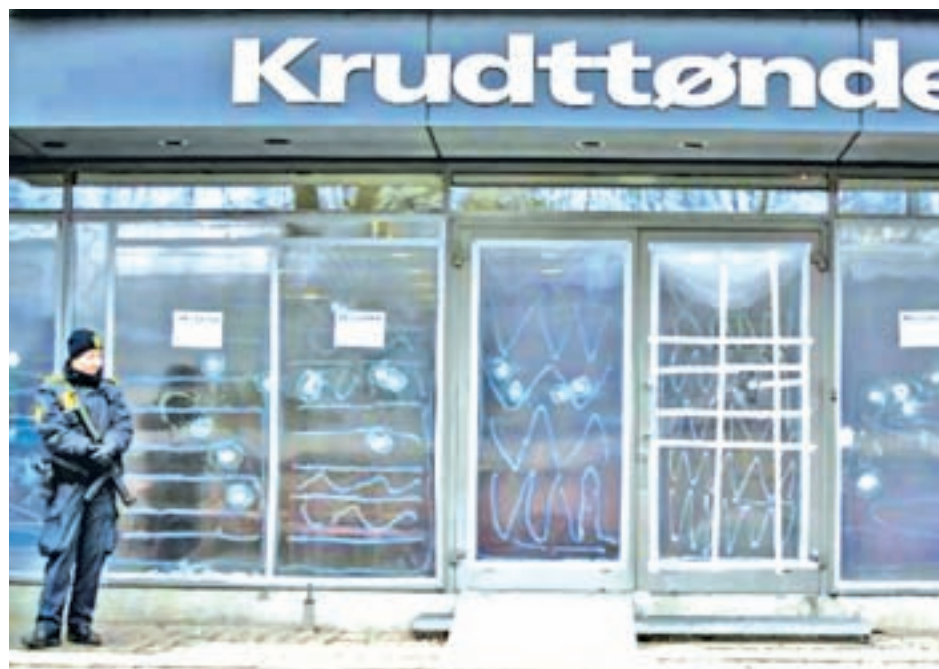
A member of the police guards the scene of a shooting at cafe 'Krudttønde,' which was hosting a free speech event, in Oesterbro, Copenhagen, on 16 Feb, 2015.

On Monday, police confirmed that the shooter visited an internet cafe where later they detained the two men accused of aiding him.