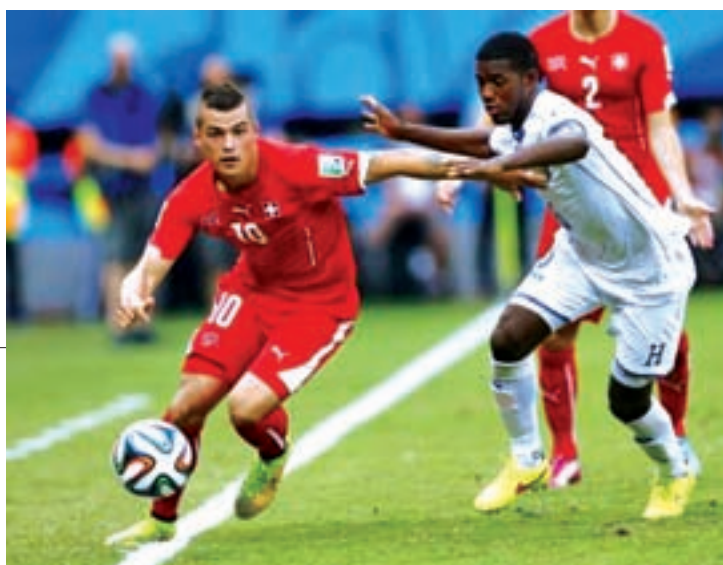
Switzerland's Granit Xhaka (L) is challenged by Juan Carlos Garcia of Honduras during their 2014 World Cup Group E soccer match at the Amazonia arena in Manaus on 25 June, 2014.