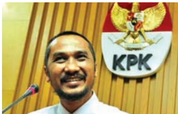
Chief of Indonesia's Corruption Eradication Commission (KPK) Abraham Samad speaks during a news conference in Jakarta on 26 Jan, 2012.

Samad has also faced accusations in parliament of taking part in politics while serving as KPK chief, casting doubt on the agency's neutrality.