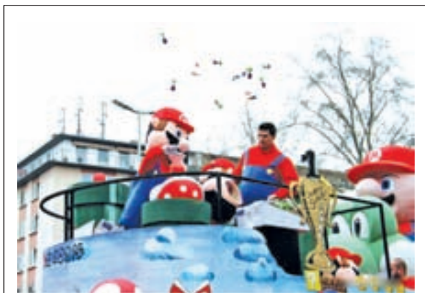
An actor in the costume of Super Mario throws candies during the traditional Rose Monday carnival parade in the western German city of Mainz on 16 Feb, 2015.

In 2012, two back-to-back crashes occurred. The first accident led to the death of one pilot who was flying an F15 jet on a training mission. In the following day, a Hawk aircraft crashed while training and the pilot survived the accident.—Xinhua