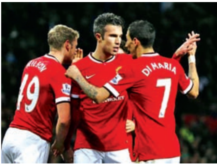
Manchester United's Robin van Persie (C) celebrates with Angel Di Maria (R) after scoring his teams third goal during their English Premier League soccer match against Burnley at Old Trafford in Manchester, northern England on 11 Feb, 2015.