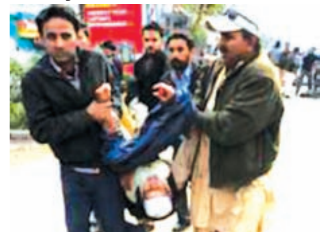
Residents carry an injured man from the site of an explosion outside the police headquarters in Lahore on 17 Feb, 2015.

But a court this week invalidated the KPK's decision, claiming it had no legal basis. The KPK has yet to respond.—Reuters