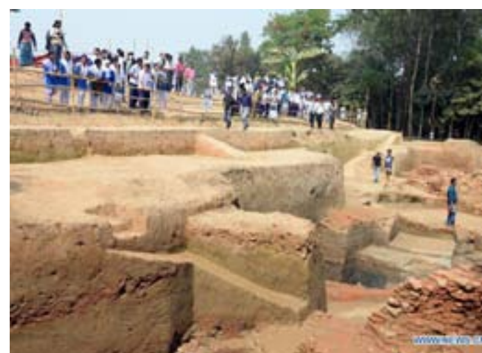
School children look at an archaeological site Buddhist temple found in Munshigani's Natেশ্বর, Bangladesh on 16 Feb, 2015. Bangladesh and China joint archaeologists unearthed an ancient Buddhist temple with unique architecture features.

STATE OF THE SEA: Seas will be moderate in Myanmar waters.