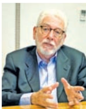
French anthropologist Philippe Descola

"It was an eye-opening discovery when I witnessed their activities in interacting with nature, completely different from the Western view of nature that dichotomizes humans and nature," the 65-year-old professor at the College de France in Paris said during a visit to Tokyo. Descola, who studied under renowned anthropologist Claude Levi-Strauss,