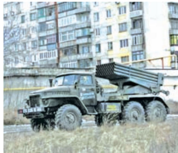
A truck with a multiple rocket launcher used by the separatist self-proclaimed Donetsk People's Republic army drives near Donetsk on 16 Feb, 2015.