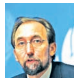
Jordan’s Prince Zeid Ra’ad Zeid al-Husseini.