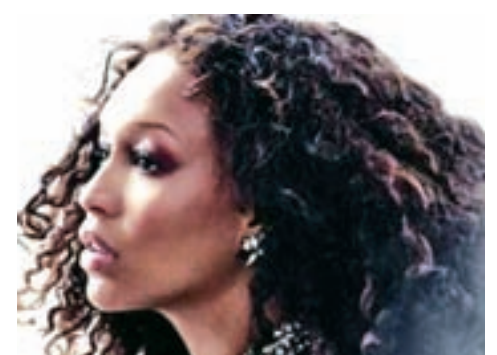
Singer Rebecca Ferguson