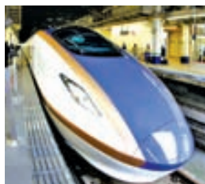
This 5 Feb, 2015, photo shows a bullet train of the Hokuriku Shinkansen Line, scheduled to be launched on 14 March, 2015, arriving at JR Omiya Station in Saitama Prefecture, near Tokyo.

TOKYO, 17 Feb — Countdown boards, balloons and flags are decking two of the key train stations in the Hokuriku region as a new bullet train line, bringing Tokyo much closer to this snowy region, will begin operation in less than a month on 14 March. The Hokuriku Shinkansen Line, connecting Nagano, central Japan, and Kanazawa on the Sea of Japan coast, is an extension of the existing route between Tokyo and Nagano, enabling passengers to travel from Tokyo to Kanazawa in two hours and 28 minutes.— Kyodo News