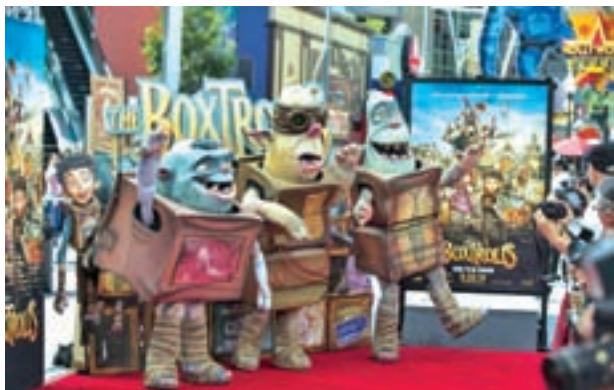
Boxtroll characters are pictured at the premiere of “The Boxtrolls” at Universal Studios City, California on 21 Sept, 2014.

LOS ANGELES, 17 Feb — With the surprise snub of a front-runner and five nominees featuring dragons, trolls, robots and mythical creatures, the Oscar for best animated film