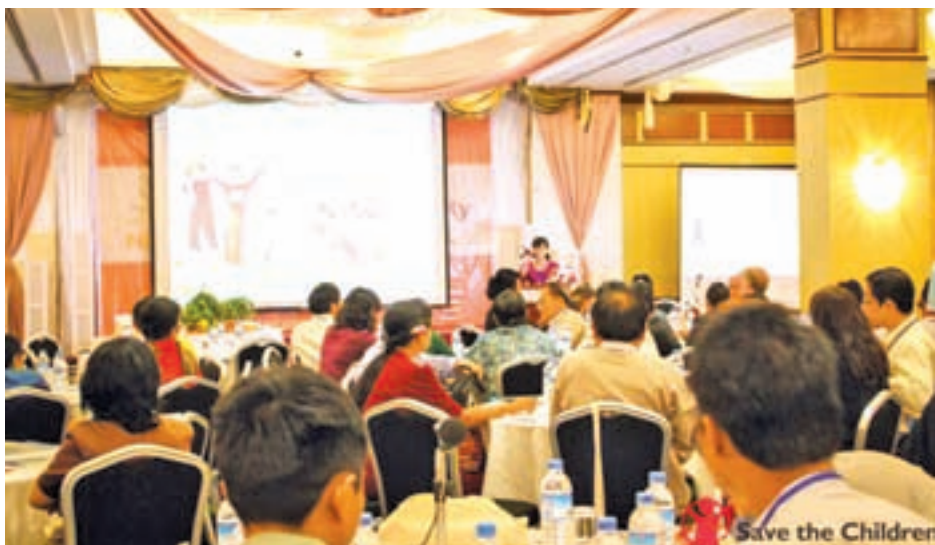
Launch of the Scaling Up Nutrition Civil Society Alliance (SUN CSA) hosted by the Save The Children in progress at Summit Parkview Hotel in Yangon on Tuesday.

YANGON, 17 Feb — The Scaling Up Nutrition Civil Society Alliance (SUN CSA) hosted by the Save the Children in Yangon on