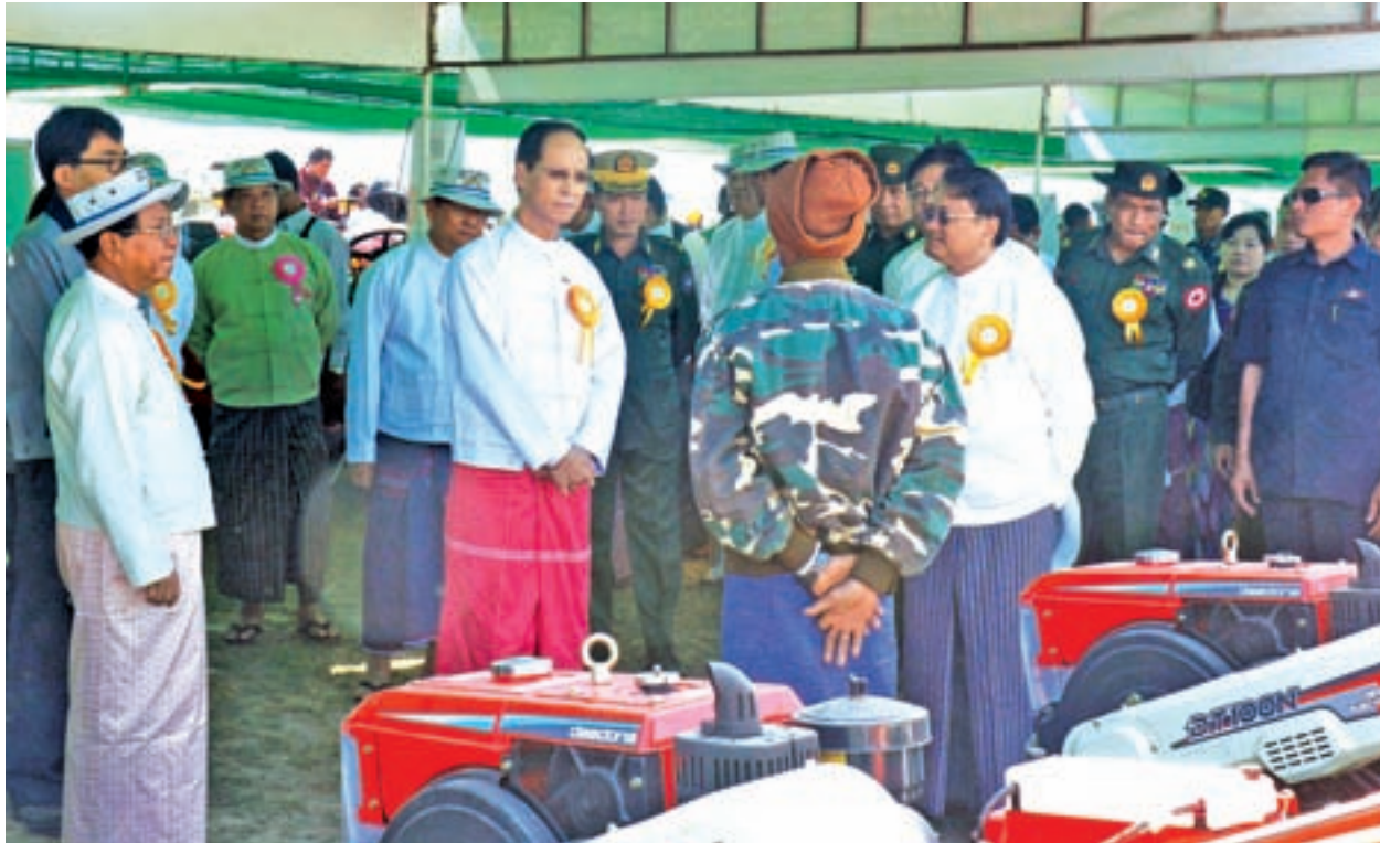
Vice President Dr Sai Mauk Kham visits booths of agricultural machinery at the ceremony of socioeconomic development of people in Mawlamyine.

NAY PYI TAW, 17 Feb — Myanmar has set its hope on reducing poverty to 16% in 2015 in a bid to meet the United Nations Millennium Development Goals, with Vice President Dr Sai Mauk Kham saying that the country's poverty index was 32% in 2005 and it was down to 26% in 2010.