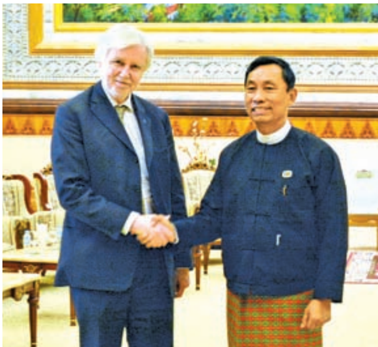
Speaker Thura U Shwe Mann cordially greets Mr Erkki Tuomioja, Minister for Foreign Affairs of Finland.