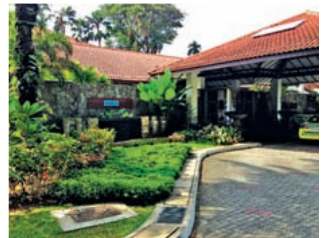
Entrance at the front of ISEAS Complex

wide range of archived newspapers such as : The Straits Times (Including Digital Life, Mind Your Body, Urban, Little Red Dot and IN), The Straits Times Education Program, The Sunday Times, The Business Times, The Business Times Weekend, The New Paper, The New Paper on Sunday, Tabla, Berita Harian (including Gen G/I-Cube), Berita Minggu (Malay), Lianhe Zaobao, Lianhe Zaobao Sunday, My Paper (Chinese and English), Shin Min Daily News, Lianhe Wanbao, Friday Weekly (Chinese), Thumbs Up (Chinese) & Thumbs Up Junior (Chinese).