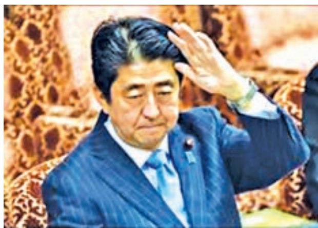
Prime Minister Shinzo Abe

TOKYO, 17 Feb — Prime Minister Shinzo Abe said on Tuesday he plans to prepare legislation so the Self-Defence Forces can be sent overseas to rescue Japanese nationals in danger,