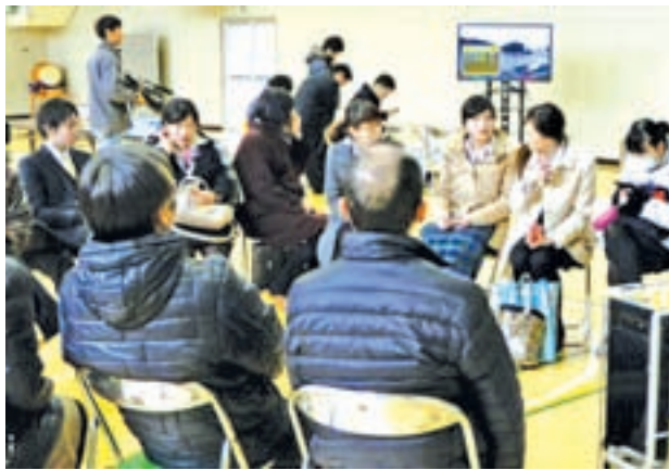
Local resident evacuees are seen at the gymnasium of Kamaishi elementary school after an evacuation warning was issued for coastal towns in Iwate prefecture in northeastern Japan after a tsunami warning was broadcast following a 6.9 magnitude earthquake, in Kamaishi, Iwate prefecture, in this photo taken by Kyodo on 17 Feb, 2015.—KYODO NEWS

TOKYO, 17 Feb — Earthquakes with a preliminary magnitude of 6.9 and 5.7 struck the Pacific off northeastern Japan on Tuesday, with slight tidal waves observed in some coastal areas following the first temblor.