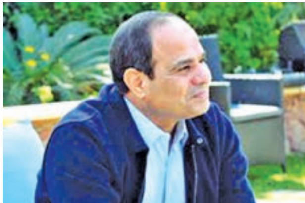
Egyptian President Abdel Fattah Al-Sisi

PARIS, 17 Feb — Egyptian President Abdel Fattah Al-Sisi called for a United Nations resolution mandating an international coalition to intervene in Libya after its jets bombed Islamic State targets there. “There is no other choice, taking into account the agreement of the Libyan people and government and that they call on us to act,” he told France’s Europe 1 radio in an interview aired on Tuesday. Asked if it would recommence its own action: “We need to do it again, and all of us together.” Islamic State released a video on Sunday showing the beheading of 21 Egyptian Christians, drawing Cairo directly into the conflict across its border and raising concerns the Islamist insurgents, already active in Syr-