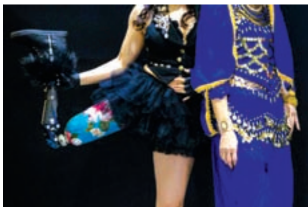
Women wearing prosthetic legs participate in a public photo session at the Hasselblad and Profoto booth, during the CP+ camera and imaging equipment trade fair in Yokohama south of Tokyo, on 14 Feb, 2015.

“I want to show that prostheses can be cool and sometimes even cute,” said the 33-year-old, posing in a sassy red mini-dress that showed off a prosthetic leg painted with cherry blossoms and gilded Japanese fans.