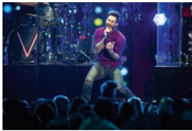
Adam Levine and Maroon 5 perform at the Z100’s Jingle Ball 2014 at Madison Square Garden in New York in this 12 Dec, 2014 file photo.

Their choice of first-time host Neil Patrick Harris could be seen as the bridge between young