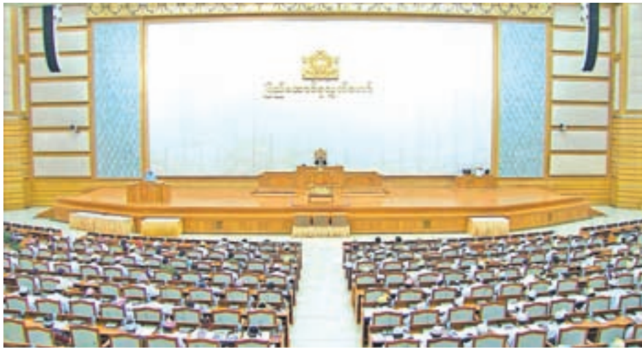
Representatives of Pyidaungsu Hluttaw debate land allocation processes.—MNA