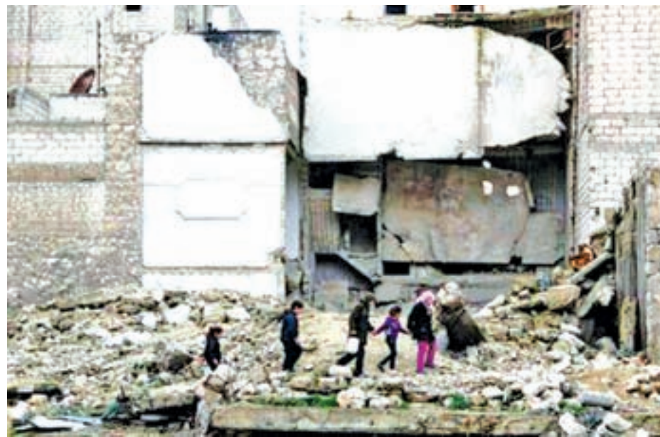
Children walk on the debris of a damaged building at al-Myassar neighbourhood of Aleppo on 16 Feb, 2015.

BEIRUT, 17 Feb — The Syrian army backed by allied militia has captured several villages north of Aleppo from insurgents and blocked a main supply route leading into the northern city amid heavy fighting, a group monitoring the war said on