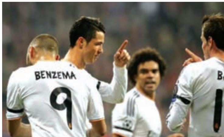
Real Madrid's Cristiano Ronaldo (2nd L) celebrates his goal against Bayern Munich with teammates Pepe, Gareth Bale (R) and Karim Benzema (L) during their Champions League semi-final second leg soccer match in Munich on 29 April, 2014.

In that time, Real have been knocked out of the King's Cup by Atletico Madrid while a 4-0 drub-