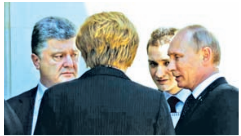
Ukraine president-elect Petro Poroshenko (L), German Chancellor Angela Merkel (C) and Russian President Vladimir Putin talk after a group photo in Benouville, France on 6 June, 2014.

"Further, the withdrawal of heavy weapons should be started on Tuesday, as agreed in Minsk," he added.