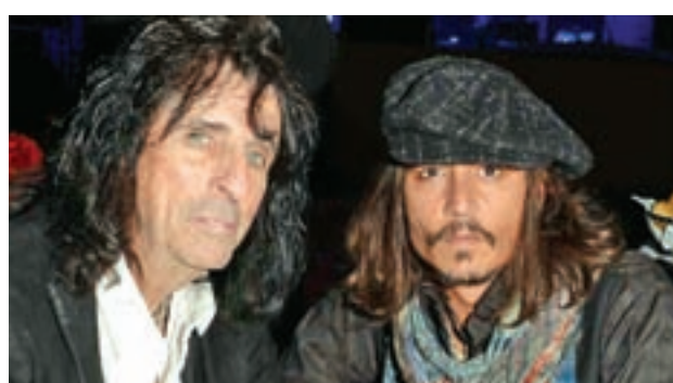
Johnny Depp has teamed up with rocker Alice Cooper and Aerosmith’s lead guitarist Joe Perry to form a new band called Hollywood Vampires.

The Hollywood Vampires actually is the name of a famous band in the 70s. Cooper fronted the music act alongside the likes of John Lennon, Harry Nilsson, Keith Moon, and Ringo Starr.