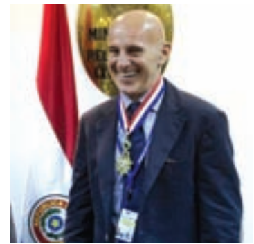
Former Italy coach Arrigo Sacchi

The quarter-finals will be played on the weekend of 7-8 March.—Reuters