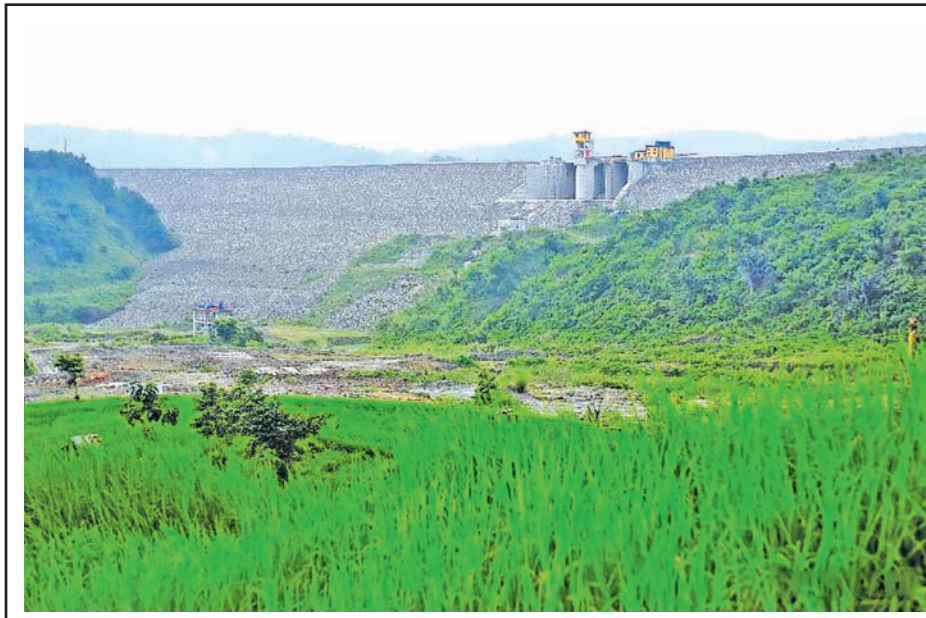
Photo taken on 14 Feb, 2015 shows a scene of the Jatigede Dam in Sumedang in West Java, Indonesia.

Indian Prime Minister Narendra Modi has renamed India's "Look East" policy to "Act East" to highlight engagement with ASEAN countries.— Xinhua