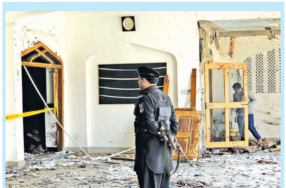
A Pakistani policeman examines a Shia Muslims mosque after militants attack in northwest Pakistan's Peshawar on 14 Feb, 2015. At least 19 people were killed and over 40 others injured in a twin suicide attack at a mosque of Shia Muslims in Peshawar on Friday afternoon, officials said. —XINHUA

But Nusra Front also has a presence in the region, complicating their efforts. Sunni Islamist insurgents including the ultra hardline Islamic State also control wide expanses of Syria's north and east. —Reuters