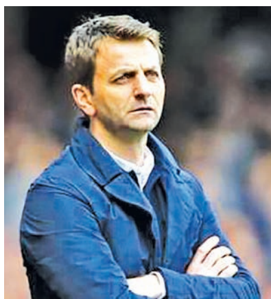
Tim Sherwood reacts during an English Premier League soccer match at Upton Park in London, on 3 May, 2014.

"It is a great honour to manage one of the biggest clubs in English football. I can't wait to get started and I'm really looking forward to the challenge," Sherwood, given a three-