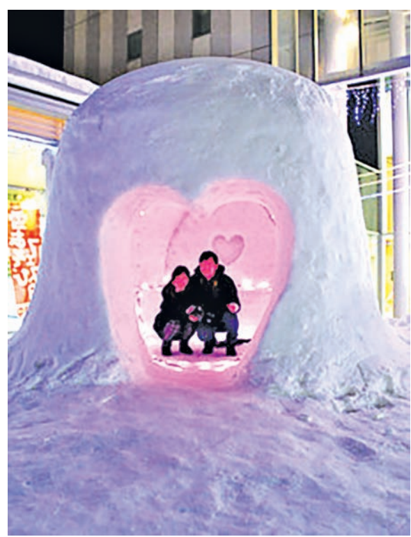
A couple poses for photos inside a snow hut with a heart-shaped entrance, made especially for Valentine's Day on 14 Feb, 2015, in Yokote, Akita Prefecture.