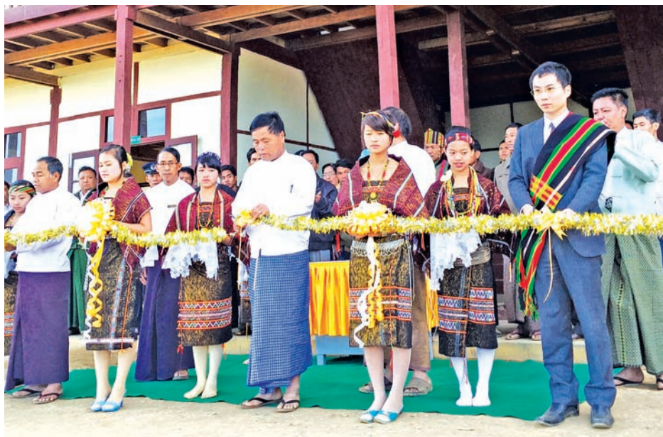
Opening ceremony of new school building in Matupi Township, Chin State, built by contribution of Japanese Government.—GGP/GNLM