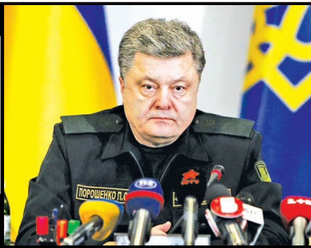
Ukraine's President Petro Poroshenko talks to military staff in Kiev on 14 Feb, 2015.

A Ukrainian staff officer stationed near Debaltseve said: “The general level (of attacks) has decreased, although there are violations.” Washington accused Moscow of