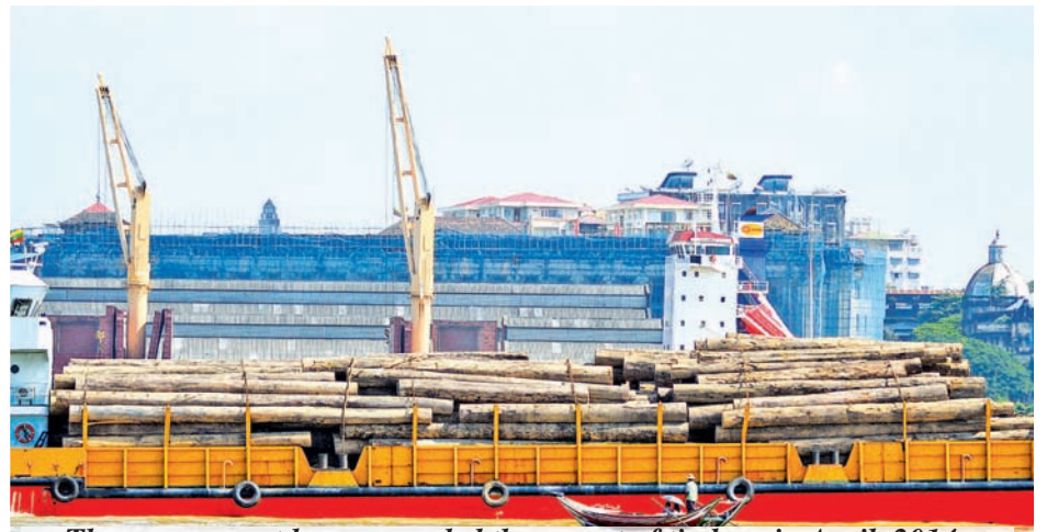
The government has suspended the export of timbers in April, 2014.