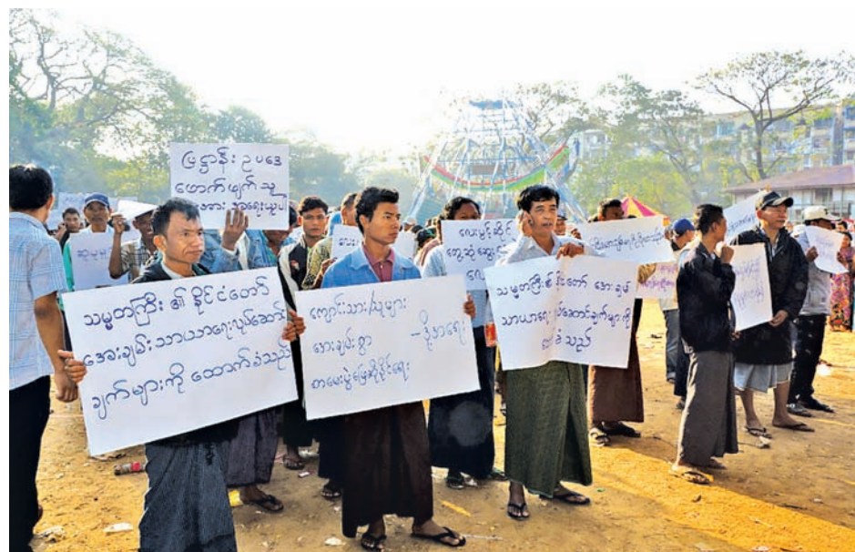
Protesters holding placards that read “We support President’s action for stability of the State.”, “No hindrance to exams”.

the demonstrators dispersed at 2.30pm. Another protest took place in a township here the same day, with demonstrators carrying placards that read “No closure of factories due to disruption”, “We prefer stability and peace”, “No hindrance to exams”, and “Solution through negotiation”.