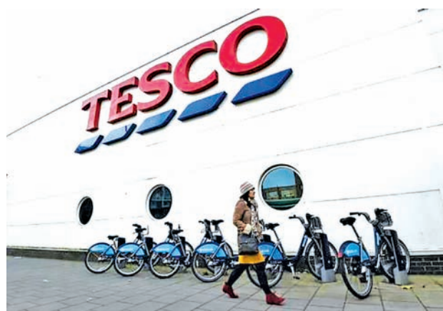
A woman walks past a Tesco supermarket in central London, on 9 Dec, 2014.