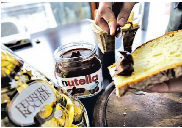
A woman spreads Nutella on a slice of bread in Milan on 20 Nov, 2009.

He never let outsiders buy into the company, which his father set up in 1946. The group, which toyed with the idea of making a bid for its British rival Cadbury a few years ago, is present in 53 countries. Forbes magazine described Ferrero as "the richest candyman on the planet", putting him and his family in 30 th place on their list of the world's wealthiest people, with a net worth of $23.4 billion.—Reuters