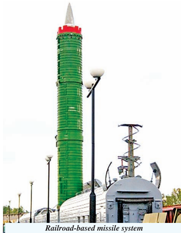
Railroad-based missile system