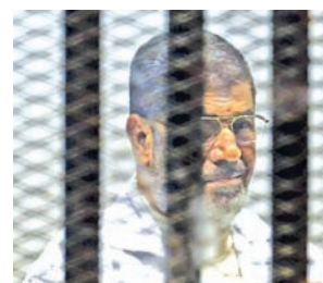
Former Egyptian President Mohamed Mursi

CAIRO, 15 Feb — An Egyptian court put ousted Islamist president Mohamed Mursi on trial on Sunday on charges of endangering national security by leaking state secrets and sensitive documents to Qatar, furthering a state crackdown