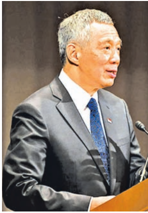
Singapore's Prime Minister Lee Hsien Loong

SINGAPORE, 15 Feb — Singapore Prime Minister Lee Hsien Loong has been diagnosed with prostate cancer and will undergo surgery to remove his prostate gland on Monday, his