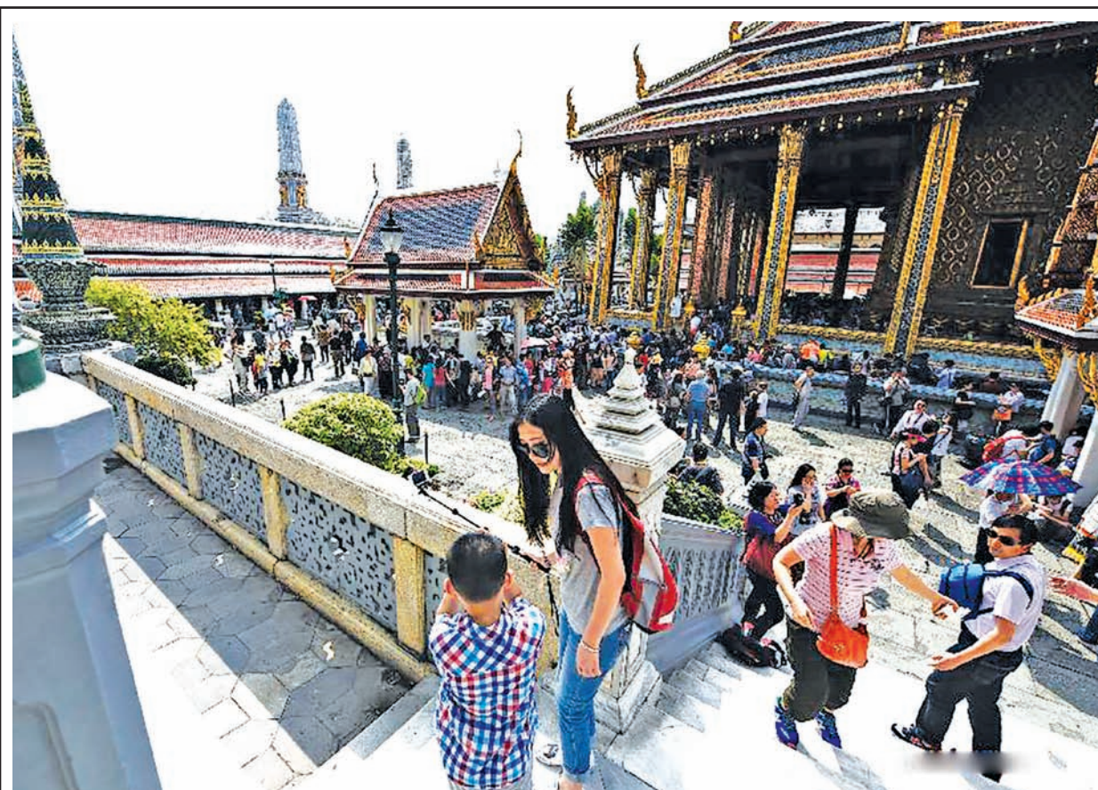
Some Chinese tourists visit the Grand Palace in Bangkok, capital of Thailand, on 15 Feb, 2015.