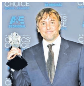
Director Richard Linklater poses backstage with his Best Director award for "Boyhood" during the 20th Annual Critics' Choice Movie Awards in Los Angeles, California on 15 Jan, 2015.

"You can't make a film like this and expect it to be so widely embraced," Linklater said. "We feel very fortunate that audienc-