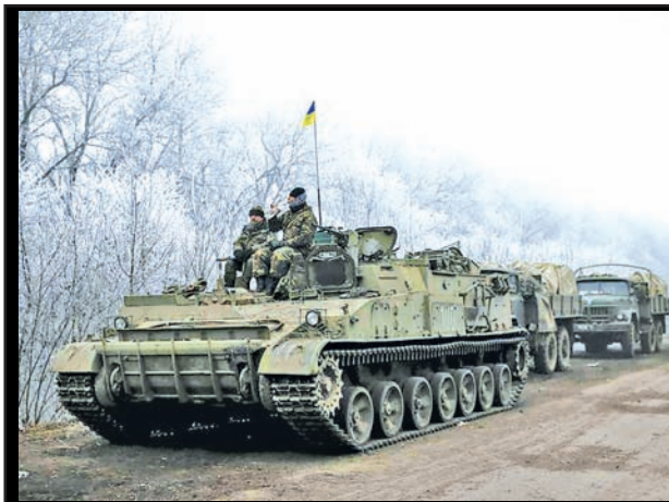
Members of the armed forces of the separatist self-proclaimed Donetsk People's Republic stand guard at a checkpoint near Donetsk, on 15 Feb, 2015.

Reuters journalists in Donetsk, the main rebel stronghold, said artillery bombardment halted at midnight and they heard no firing overnight, after intense final hours before the ceasefire when shells had exploded every few seconds. A single explosion could be heard in the morning from an outlying suburb. A Reuters photographer in government-held territory also said constant bombardment had halted overnight, although he heard a volley of artillery around 7 am from the direction of Debaltseve, a strategic railway hub town where Ukrainian forces have nearly been surrounded by advancing rebels.