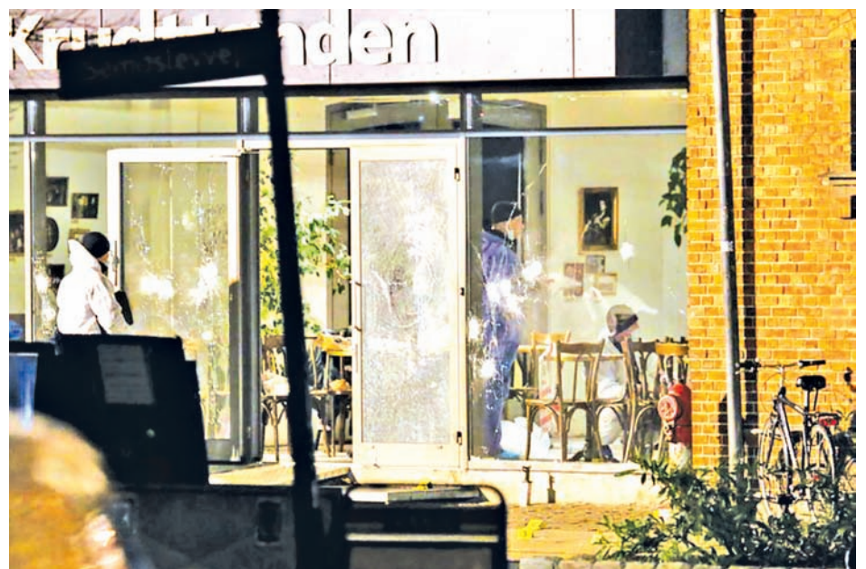
Forensic investigators are seen at the site of a shooting in Copenhagen on 14 Feb, 2015.