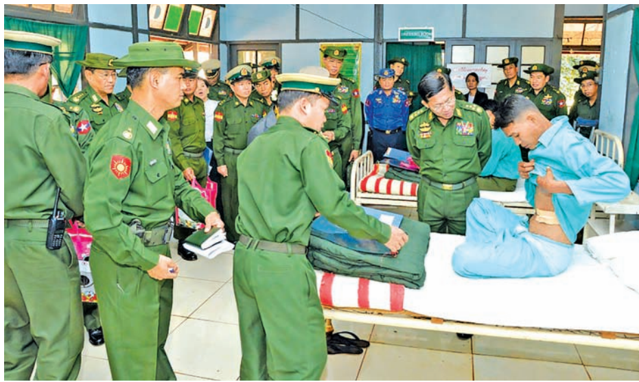
Commander-in-Chief of Defence Services Senior General Min Aung Hlaing comforts a soldier who sustains injuries in the fight against Kokang renegade troops.

The senior added that on behalf of the Tatmadaw (See page 3)