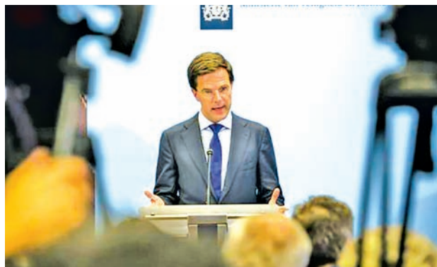
Netherlands' Prime Minister Mark Rutte

AMSTERDAM, 15 Feb — The centre-right government of Dutch Prime Minister Mark Rutte slid further in opinion polls ahead of a March provincial election that could see his fragile Liberal-Labour coalition lose the Senate.