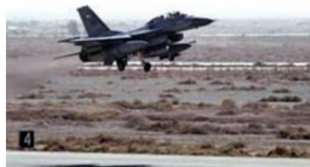
A Royal Jordanian Air Force plane takes off from an air base to strike the Islamic state in the Syrian city of Raqqa on 5 Feb, 2015.

WASHINGTON, /AMMAN, 14 Feb — The United States is readying plans to resupply Jordan with munitions in the coming weeks, possibly including precision-guided arms, expediting support for the kingdom as it expands its role in air strikes against the Islamic State (IS), officials say.