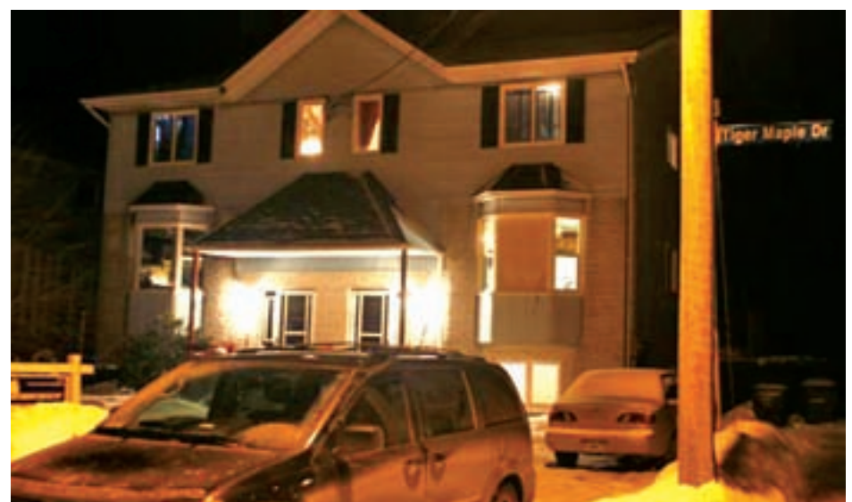
A duplex home where a 19-year-old man was found dead is shown in Timberlea, Nova Scotia, on 13 Feb, 2015.

"We believe we have apprehended all known individuals in this matter and eliminated the threat. We are not seeking any further suspects at this time," the statement said. — Reuters