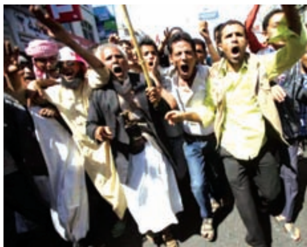
Anti-Houthi protesters shout slogans during a demonstration against the Shi'ite Muslim militia group in the southwestern city of Taiz on 14 Feb, 2015.— REUTERS

France, the United States, Britain, Germany, Italy and Saudi Arabia have closed their missions in the capital Sanaa and withdrawn staff, citing security concerns. Spain and the United Arab Emirates announced the closure of their embassies in Sanaa on Saturday.— Reuters