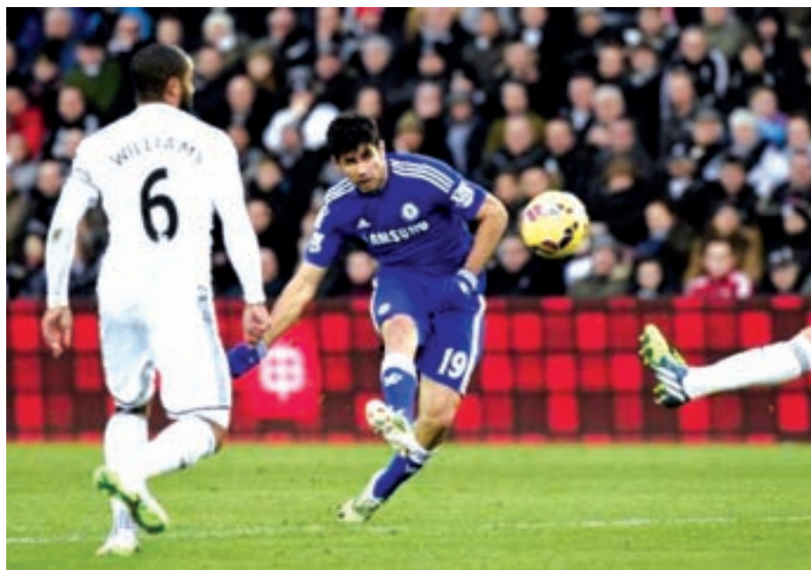
Diego Costa (R) shoots but misses during an English Premier League soccer match at the Liberty Stadium in Swansea, Wales on 17 Jan, 2015.

"The truth is we played a great match the other day but we have already put it out of our minds," Juanfran said. "For us they were three more points to help us in our goal of achieving great things. It has given us a lot of confidence to approach an extremely tough game against Celta." — Reuters