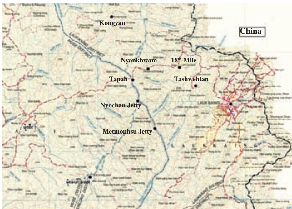
A map shows clash between Tatmadaw and renegade troops of Kokang in Laukkai Region.—MYAWADY