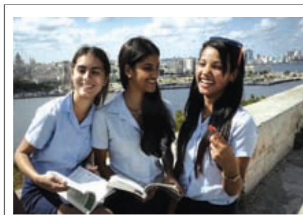
Students assist the 24 th International Book Fair Cuba 2015 in Havana, Cuba, on 13 Feb, 2015.