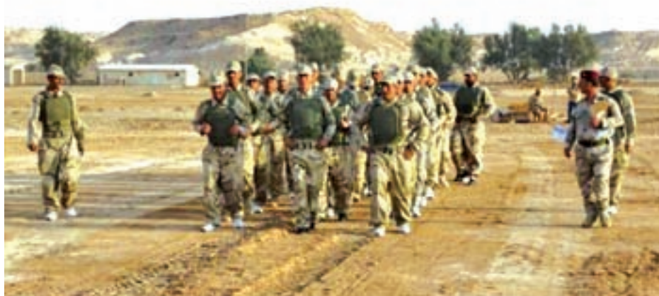
Tribal fighters take part in a military training to prepare for fighting against Islamic State militants, at the Ain al-Assad military base in Anbar Province on 15 Nov, 2014.