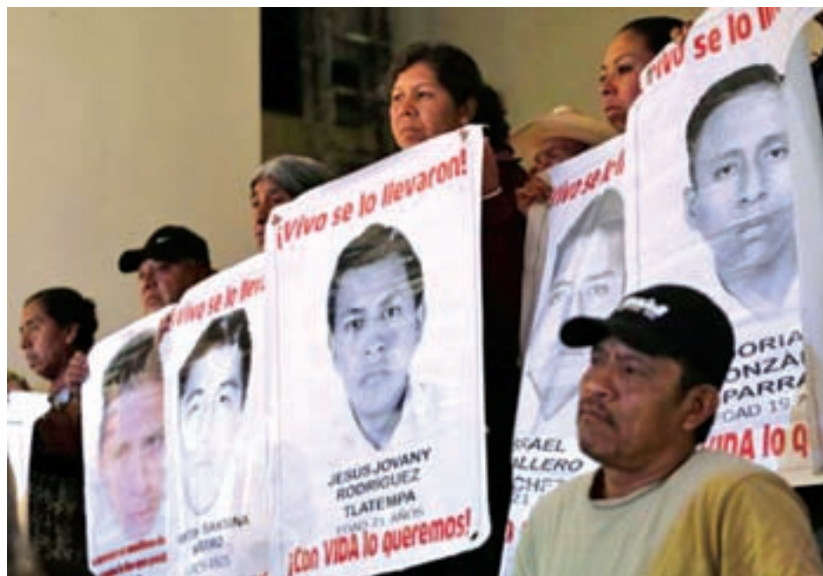
Relatives hold up posters of some missing students from Ayotzinapa Teacher Training College during a news conference, at the Miguel Agustín Pro Juárez Human Rights Centre in Mexico City on 9 Feb, 2015.

Mexico's Attorney General Jesus Murillo has said there is no doubt that the 43 students were mur-