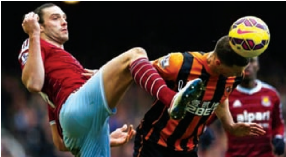
Andy Carroll (L) challenges James Chester during an English Premier League soccer match at Upton Park in London on 18 Jan, 2015.