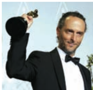
Emmanuel Lubezki poses with his award for best cinematography for his film 'Gravity' at the 86th Academy Awards in Hollywood, California on 2 March, 2014.

A seven-time Oscar nominee, the 50-year-old Lubezki has what Inarritu describes as "beautiful talent and exquisite taste," and together they have created a "terrific