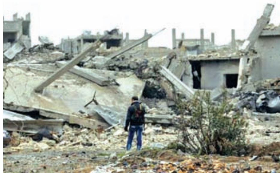
A fighter of the Kurdish People's Protection Units (YPG) walks around damaged buildings in the northern Syrian town of Kobani on 30 Jan, 2015.—REUTERS

Islamic State's advance on Kobani last year with heavy weapons drove tens of thousands of residents over the border into Turkey. The Kurds, armed with mainly light weapons, called for international help and the town now lies in ruins.— Reuters