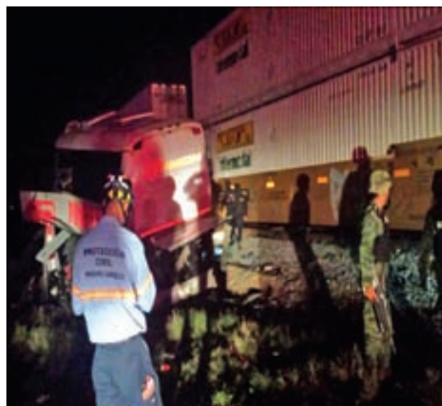
A member of Civil Protection inspects the site of traffic accident in Anahuac Municipality, Mexico, on 13 Feb, 2015. At least 16 people died and 22 others were injured on Friday in the collision between a bus and a train in Anahuac Municipality.

MEXICO CITY, 14 Feb — A train hit a coach, leaving at least 16 people dead and 30 others wounded on Friday night near the Mexico-US border, local authorities said.