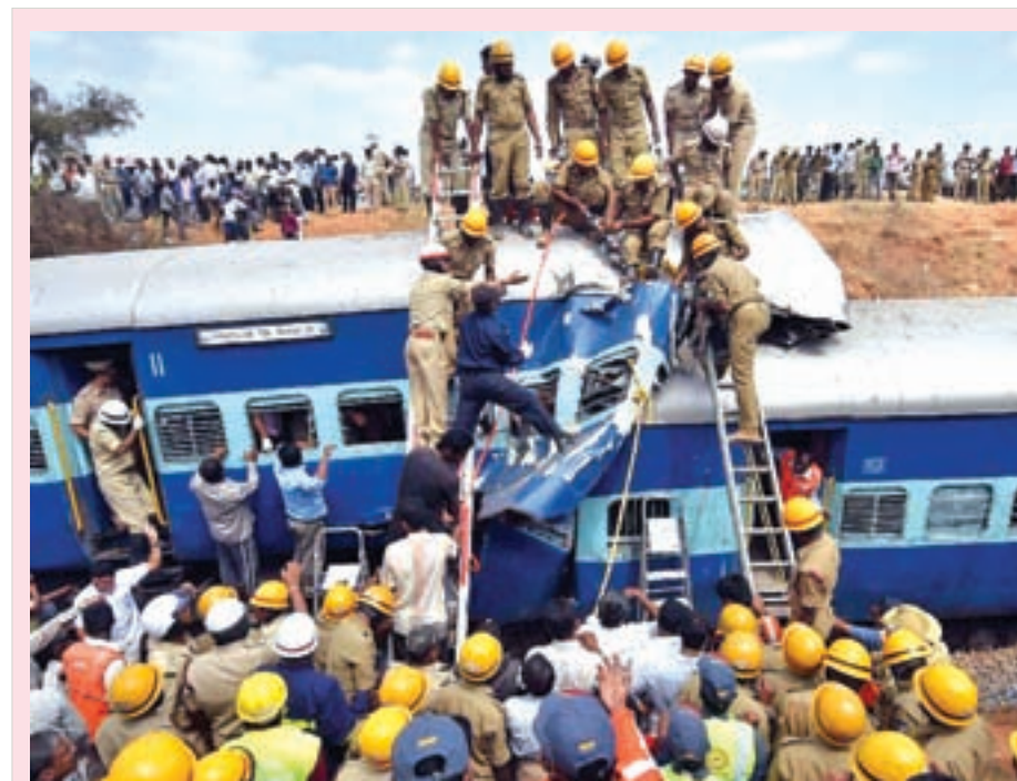
Rescuers cut the outer shell of a crumbled compartment of a derailed train to pull out the body of a victim near Anekal, about 40 kilometers south of Bangalore, India, Feb. 13, 2015. At least 12 people were killed and more than 150 others injured in a train derailment in the southern Indian state of Karnataka on Friday, a senior police officer said.