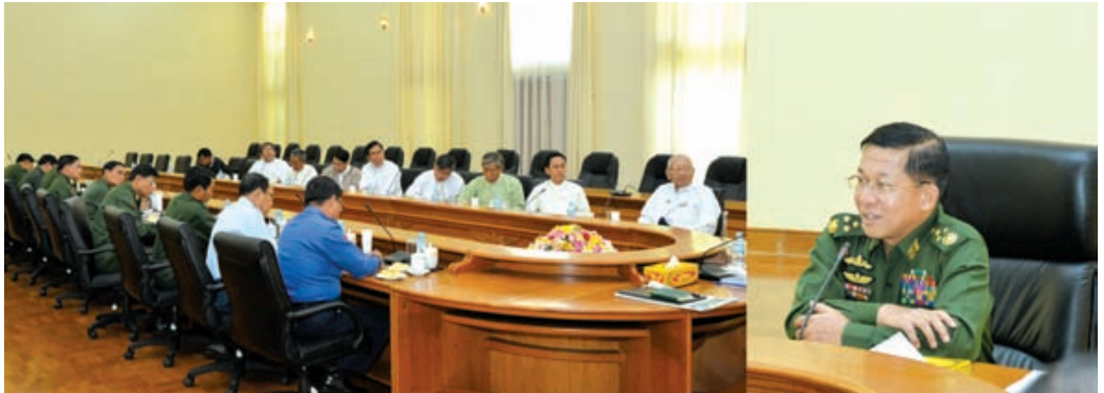
Senior General Min Aung Hlaing highlights clashes between government troops and Kokang renegade groups in Laukkai in meeting with members of Myanmar Press Council (Interim).

The Senior General said that investigations in 2009 found that Kokang renegade groups were manufacturing illegal drugs and