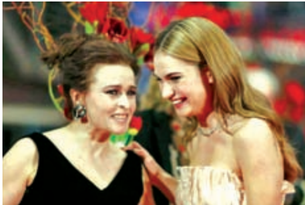
Actresses Helena Bonham Carter and Lily James (R) arrive for the screening of the movie 'Cinderella' at the 65th Berlinale International Film Festival in Berlin on 13 Feb, 2015.

BERLIN, 14 Feb — The gowns almost steal the show in the new Disney live-action version of "Cinderella", actresses Lily James and Helena Bonham Carter said on Friday at the film's world premiere, but neither would recommend their dresses for street wear.