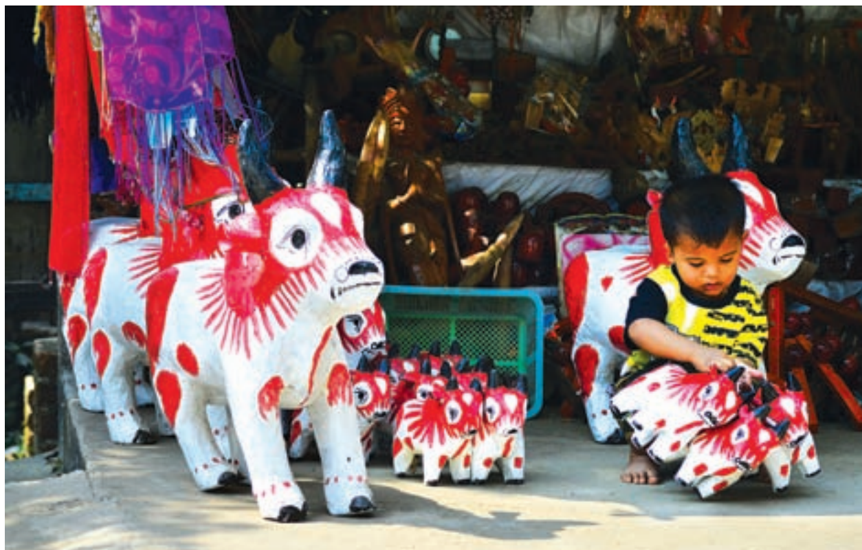
A child plays with cow toys.