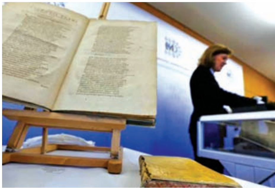
One of over 500 ancient books, with original editions of Galileo Galilei and Nicolaus Copernicus among them, is presented by German police during a news conference at the Munich Federal state police headquarters, on 13 Feb, 2015.

"As director his role was to do all he could to protect and preserve the books. However, he reversed his function. By taking advantage of his position, he was