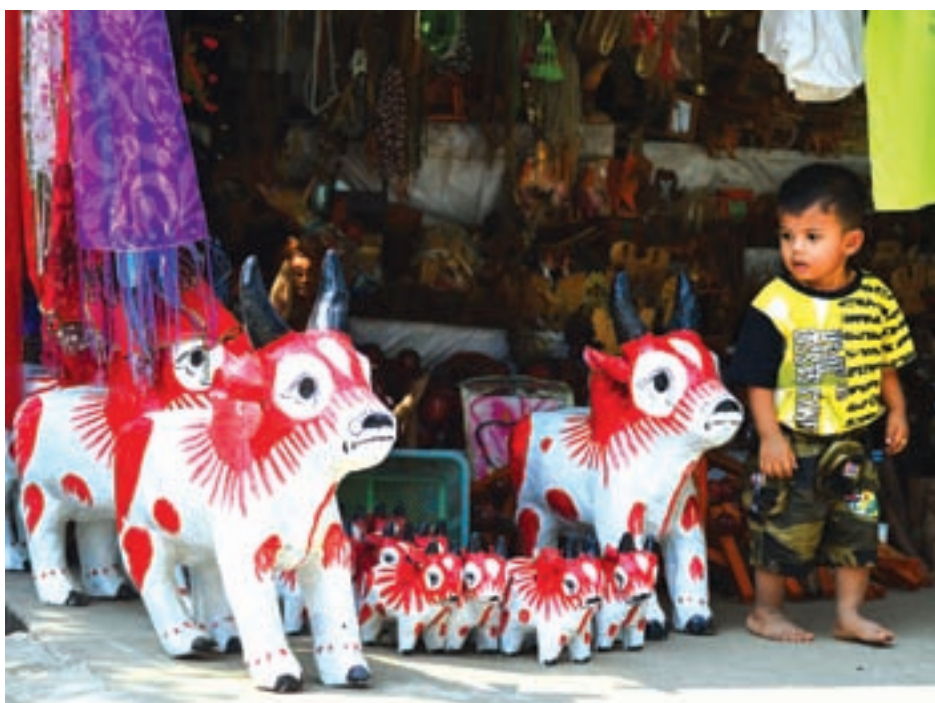
A child gazing at cow toys.

mâché toy artisans, including U Kyin Soe, who consider the demand for papier mâché toys at pagoda festivals as a reliable barometer for the future of the traditional folk art have seen a decrease in demand for papier mâché animals, but not cows, at the festivals.