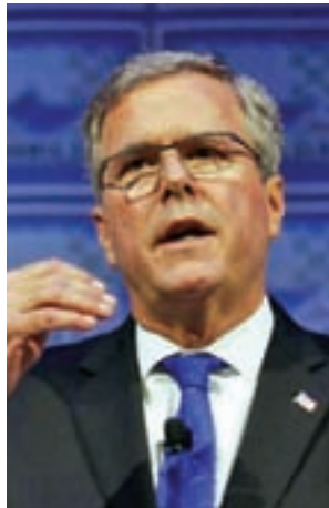
Former Florida Governor Jeb Bush addresses the Detroit Economic Club about his "Reform Conservative Agenda" in Detroit, Michigan, on 4 Feb, 2015.

His committee also gave out $5,200, the legal maximum, to 14 Republican lawmakers. Among the recipients: Senator Chuck Grassley and Representative David Young of Iowa; Senator Kelly Ayotte and Representative Frank Guinta of New Hampshire;