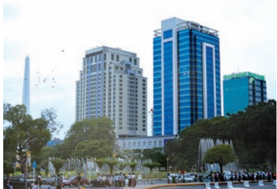
Photo of a view of downtown Yangon showing high-rise buildings and Independence Monument.