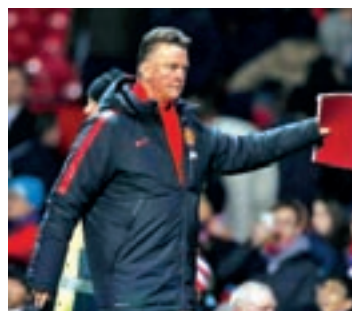
Manchester United manager Louis van Gaal leaves the pitch after their English Premier League soccer match against Burnley at Old Trafford in Manchester, northern England on 11 Feb, 2015.