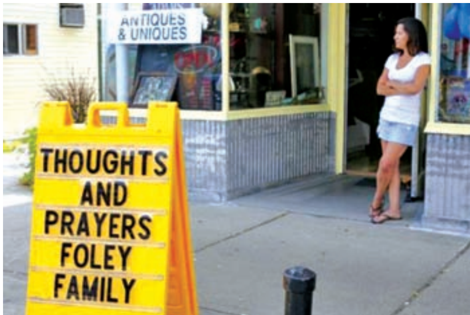
A sign outside a shop remembers James Foley in his hometown of Rochester, New Hampshire on 20 Aug, 2014.

The signers include Reuters, the Associated