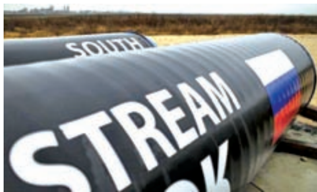
Gas pipes bearing the flag of Russia lie on the ground near the Serbian village of Sajkas, north of Belgrade, where Serbia ceremonially launched its leg of Russia's South Stream pipeline before the project was cancelled, on 10 Dec, 2014.

BRUSSELS/ESSEN/MOSCOW, 13 Feb — Russia's plan to cut out Ukraine as a