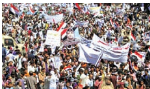
Anti-Houthi protesters demonstrate to commemorate the fourth anniversary of the uprising that toppled former President Ali Abdullah Saleh, in Yemen’s southwestern city of Taiz on 11 Feb, 2015.

The Houthis have sidelined the central government in Yemen, which borders oil giant Saudi Arabia.