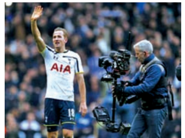
Harry Kane of Tottenham Hotspur celebrates at the final whistle after defeating Arsenal in their English Premier League soccer match at White Hart Lane, London on 7 Feb, 2015.