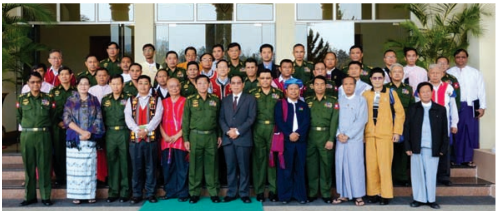
Senior General Min Aung Hlaing poses for documentary photo with leaders of armed ethnic groups.