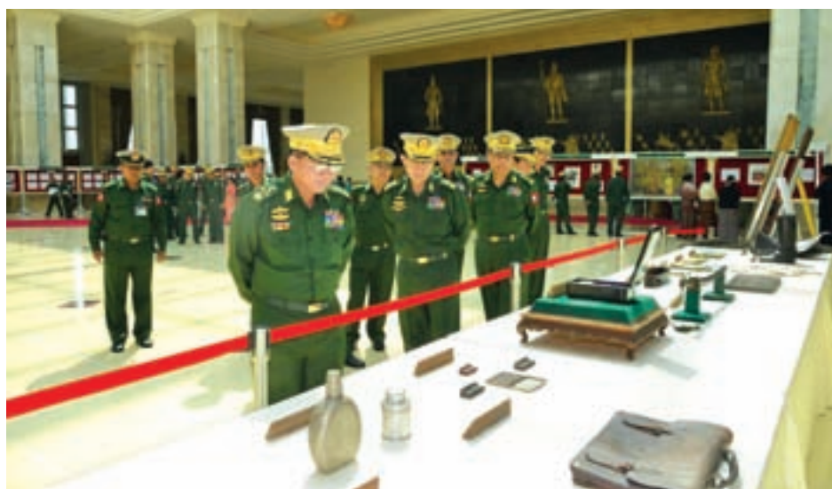
Senior General Min Aung Hlaing views equipment used by General Aung San.

NAY PYI TAW, 13 Feb — Commander-in-Chief of Defence Services Senior General Min Aung Hlaing