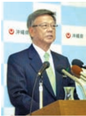
Okinawa Gov Takeshi Onaga attends a Press conference in the prefectural capital, Naha, on 13 Feb, 2015.