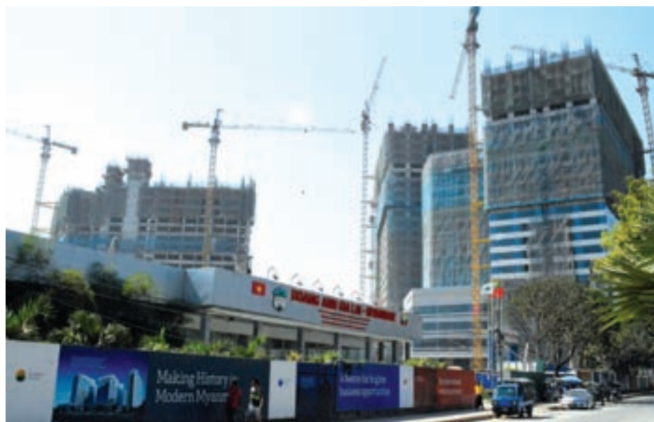
Photo of Hoang Anh Gia Lai Myanmar Centre being developed on Kaba-Aye Pagoda Road in Bahan Township, Yangon.

area of 73,358 sqm with a land lease term of 50 years (See page 2)