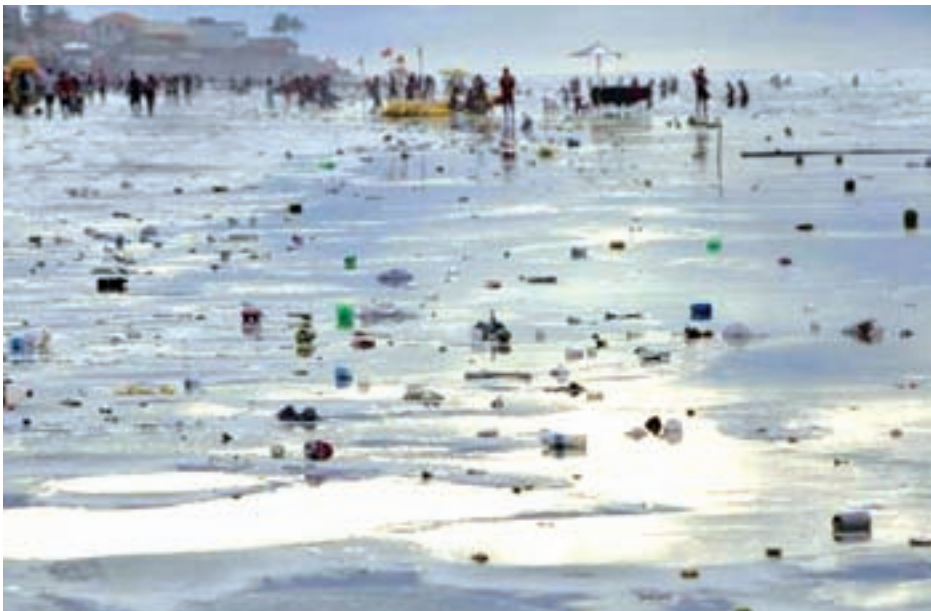
Trash is left scattered along Atalaia beach during the peak of the summer vacation season in Salinópolis, Para state, on 17 July, 2014.

WASHINGTON, 13 Feb — The world's oceans are clogged with plastic debris, but how much of it finds its way into the seas annually? Enough to place the equivalent of five grocery bags full of plastic trash on every foot (30 cm) of every nation's coastline around the globe.