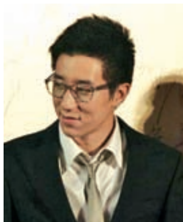
Hong Kong actor Jaycee Chan attends a movie festival in Shanghai on 13 June, 2009.

State media has reported that Jackie Chan felt ashamed of his son's drug abuse and hopes that