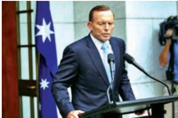
Australia's Prime Minister Tony Abbott

SYDNEY, 13 Feb — Australian business leaders are fuming over government instability that has become "poisonous" for investor confidence, and doubt that conservative Prime Minister Tony Abbott can reverse his leadership's downward spiral within six months.