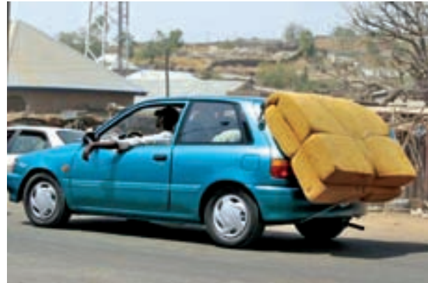
A mattress is seen strapped to the back of a car as people flee the violence from Boko Haram, in Adamawa in the north east of Nigeria on 31 Jan, 2015.