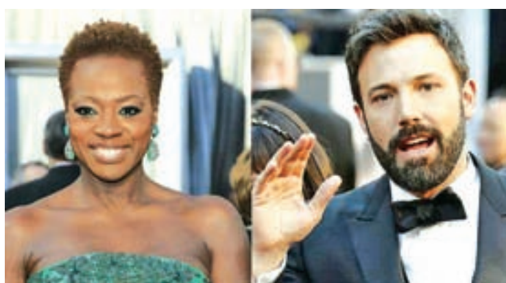
Hollywood stars Ben Affleck, Jessica Chastain, Viola Davis, Kevin Hart, Shirley MacLaine, Chris Pine, Miles Teller and Naomi Watts will be presenters at this year's Oscars.

Chastain has received two Oscar nominations, one for Best