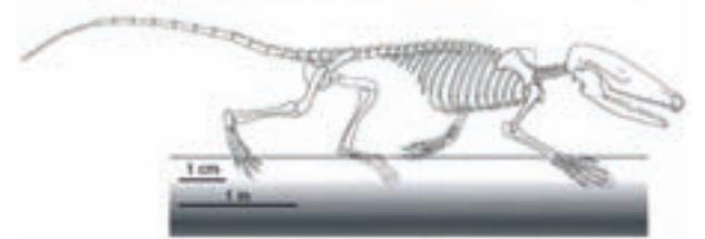
Skeletal and life style reconstructions of Agilodocodon scansorius , a docodont mammaliaform is shown in this illustration courtesy of University of Chicago released to Reuters on 12 Feb, 2015.—REUTERS

WASHINGTON, 13 Feb — It may not have been the most opportune time to be a furry little critter, what with all those hungry dinosaurs and flying reptiles hanging around. But early mammals still managed to make their mark during the Jurassic Period.