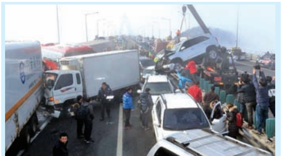
Firefighters work at the site of a car pileup accident in Seoul, on 11 Feb, 2015. At least two people have been confirmed dead, with 65 others including seven Chinese injured, in a car pileup accident on Yeongjong Grand Bridge in Incheon, west of South Korea's capital Seoul, local media reported on Wednesday. —XINHUA