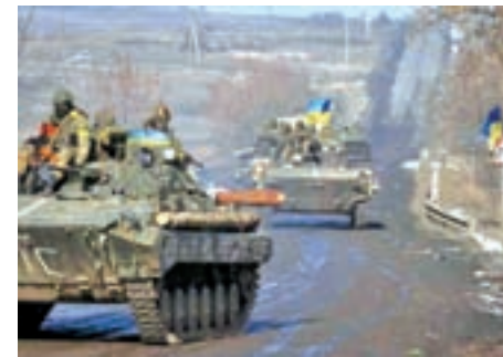
Members of the Ukrainian armed forces ride on armoured personnel carriers (APC) near Debaltseve, eastern Ukraine, on 12 Feb, 2015.

KIEV, 13 Feb — Eight Ukrainian service personnel have been killed and 34 wounded in fighting against separatists in eastern Ukraine in the past 24 hours, a Kiev military spokesman said on Friday, despite a four-power peace deal worked out in Belarus.