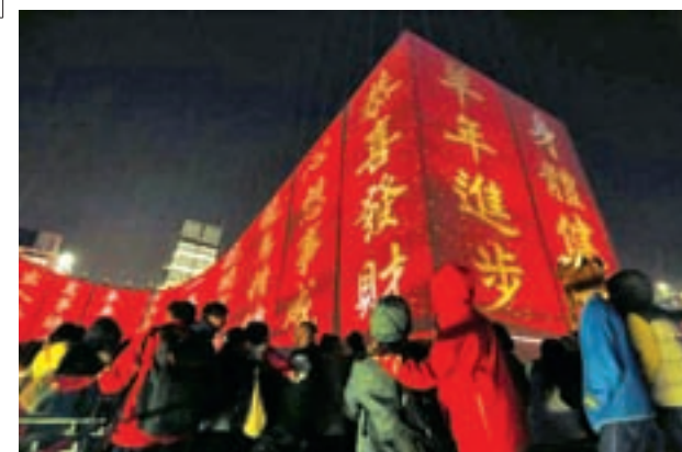
Images of "Fai Chun" or Chinese New Year couplets, which read, "Wishing you wealth and prosperity" (3 rd R) and "Progress in Year of the Goat" (2 nd R), are shown on the facade of the Hong Kong Cultural Centre in Hong Kong on 12 Feb, 2015.