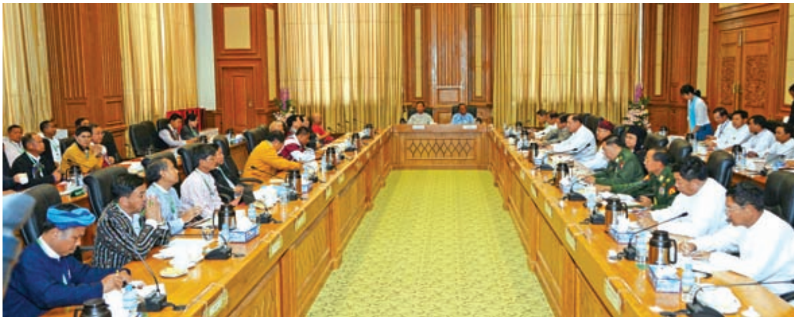
Speaker of Pyidaungsu Hluttaw and Pyithu Hluttaw Thura U Shwe Mann and Amyotha Hluttaw Speaker U Khin Aung Myint meet leaders of armed ethnic groups.

NAY PYI TAW, 13 Feb— Speaker of Pyidaungsu Hluttaw and Pyithu Hluttaw Thura U Shwe Mann and