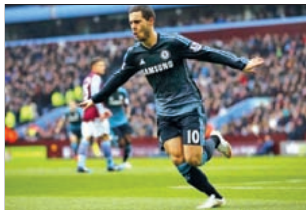
Eden Hazard of Chelsea celebrates scoring against Aston Villa during their English Premier League soccer match at Villa Park, Birmingham on 7 Feb, 2015.

come the best player in the world."— Reuters