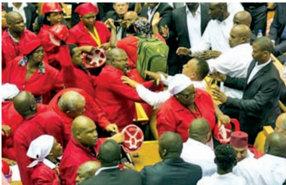
Members of Julius Malema's Economic Freedom Fighters (EFF) (in red) clash with security officials after being ordered out of the chamber during President Jacob Zuma's State of the Nation address in Cape Town on 12 Feb, 2015.

But he received a hostile reception from lawmakers from the far-left Economic Freedom Fighters (EFF), led by firebrand former ANC youth leader Julius Malema, who started to challenge him about graft allegations.