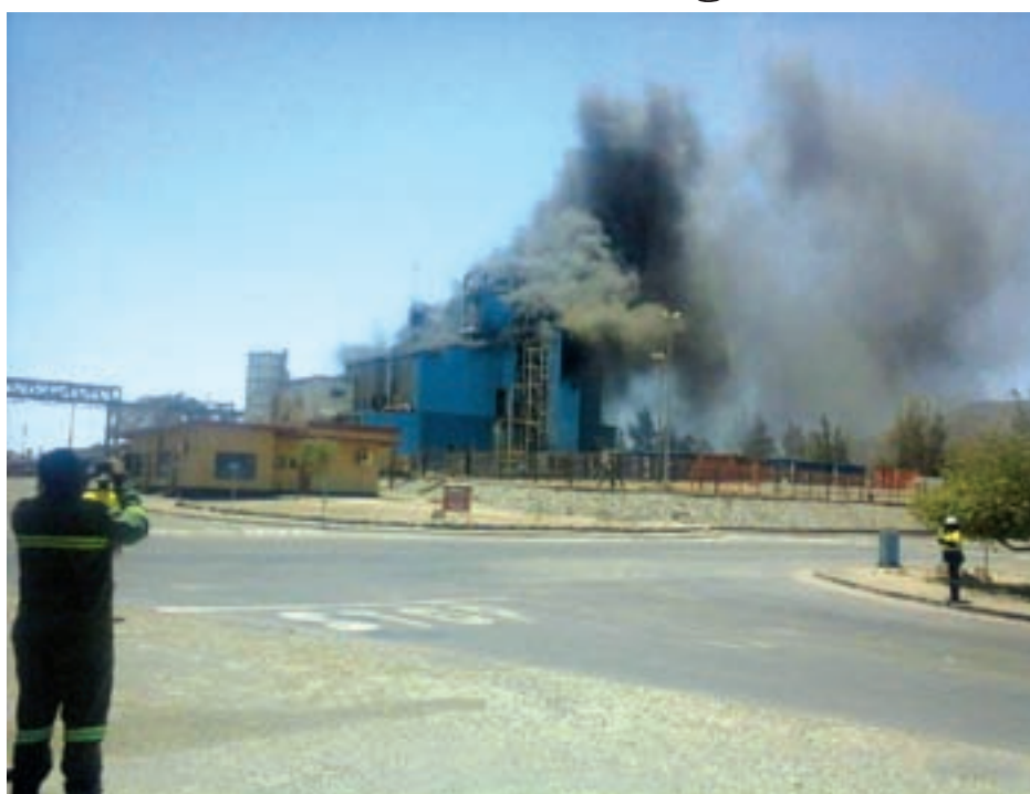
Workers take photos of the fire-hit Rossing Uranium near the town of Arandis, some 65 kilometres from the coastal city of Swakopmund, Namibia on 12 Feb, 2015. Over 1,000 miners at an open-pit uranium mine in Namibia's coastal Namib Desert were evacuated on Thursday after a fire broke out.

The mine's emergency service evacuated all workers to safe areas after the fire broke out at the final product recovery plant of the mine, where uranium oxide is packed for export, according to a statement issued on Thursday afternoon by the mine. There were no injuries to the employees. Mining operations in the areas were not affected by the incident and continue as normal, the statement said. "The fire happened in a sudden and spread quickly within the plant. We had to call the fire brigades from Swakopmund and Arandis