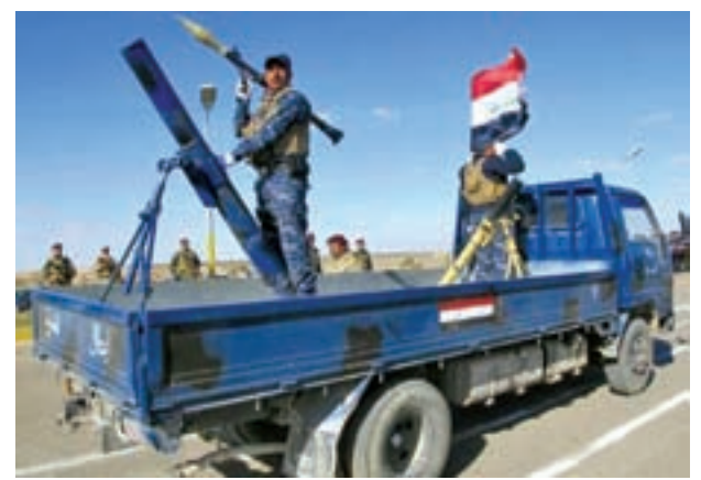
Sunni volunteers take part in a parade as they prepare to fight against militants of the Islamic State, in the town of Amriyat al-Falluja in Anbar Province, on 8 Jan 2015.

An Iraqi defence ministry spokesman declined to comment on the situation in