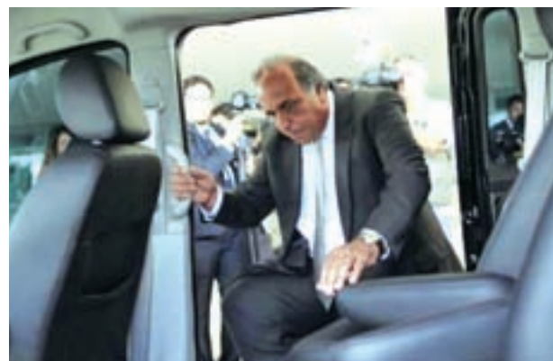
Governor of Rio de Janeiro state Luiz Fernando Pezao climbs into a car as he leaves Planalto Palace after a meeting with Brazil's President Dilma Rousseff in Brasilia on 28 Jan, 2015.

Hundreds of millions of dollars have already been spent but the waters remain polluted. Olympic sailors, who visited the city for test