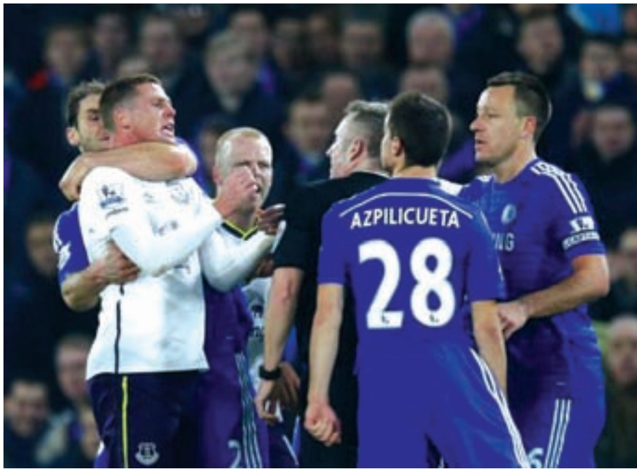
Branislav Ivanovic (L) of Chelsea grapples with Everton's James McCarthy during their English Premier League soccer match at Stamford Bridge, London, on 11 Feb, 2015.

Serb Ivanovic will face no action, however, after the FA said a three-member panel that reviewed the