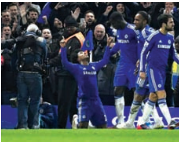
Willian (L) of Chelsea celebrates scoring against Everton during their English Premier League soccer match at Stamford Bridge, London on 11 Feb, 2015.

LONDON, 12 Feb — Willian's late strike snatched a 1-0 home win for Chelsea over a stubborn Everton side to maintain their seven-point lead over Manchester City who crushed Stoke City 4-1 in the Premier League on Wednesday.