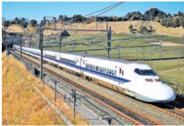
Photo shows the Shinkansen 700, bullet train

Prayuth heads a military government that is looking for big ticket schemes to stimulate