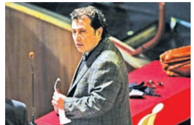
Captain of the Costa Concordia cruise liner Francesco Schettino prepares to read a speech during his trial in Grosseto on 11 Feb, 2015.