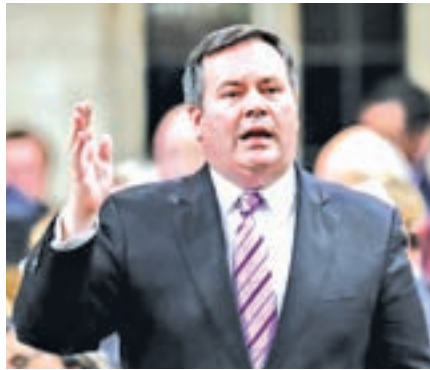
Canada's Defence Minister Jason Kenney speaks during Question Period in the House of Commons on Parliament Hill in Ottawa on 4 Feb, 2015.

OTTAWA, 12 Feb — Canada is inclined to extend the six-month mandate of its military mission in Iraq, which comprises special forces on the ground