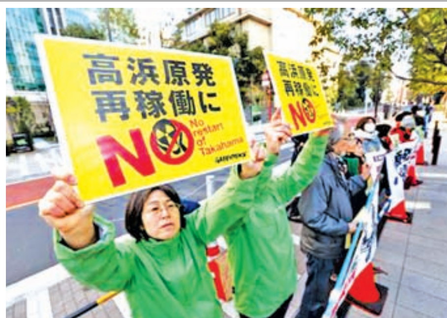
Campaigners express opposition to resuming operation of two idled reactors on 12 Feb, 2015, in front of the Nuclear Regulation Authority's Tokyo office. The regulator approved a report concluding that the Nos 3 and 4 units of Kansai Electric Power Co's Takahama nuclear power plant comply with new safety requirements.—KYODO NEWS

Over 100 people have died of swine flu in the state this year alone and this is the first case of a foreign national succumbing to the condition.—Xinhua