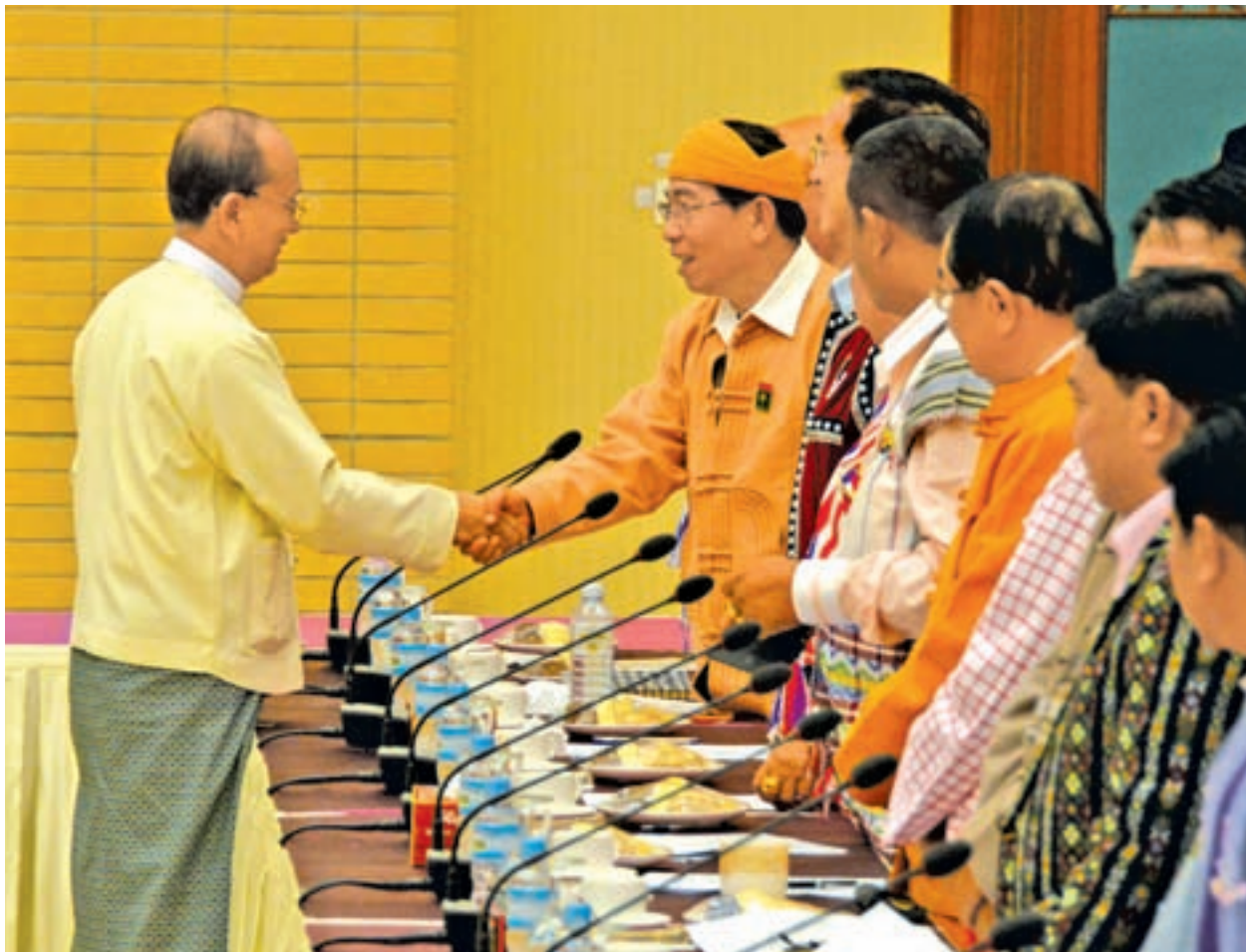
President U Thein Sein cordially greets one of the leaders of 13 armed ethnic groups at Myanmar International Convention Centre No 2.

NAY PYI TAW, 12 Feb — President U Thein Sein met with leaders of 13 armed ethnic groups at the Myanmar International Convention Centre No 2 in Nay Pyi Taw on Thursday.