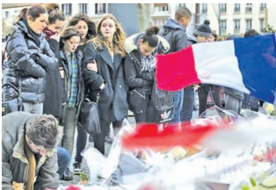
A French flag and flowers are seen as people pay tribute to the victims of a hostage taking at the Hyper Cacher kosher supermarket, where four people were killed during a terror attack on Friday near the Porte de Vincennes in eastern Paris on 12 Jan, 2015.

Wednesday's edition of Islamic State's online