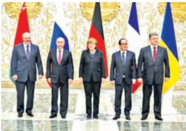
Belarus' President Alexander Lukashenko (L), Russia's President Vladimir Putin (2nd L), Ukraine's President Petro Poroshenko (R), Germany's Chancellor Angela Merkel (C) and France's President Francois Hollande pose for a family photo during peace talks in Minsk on 11 Feb, 2015.

MINSK, 12 Feb — The leaders of Germany, France, Russia and Ukraine have agreed a deal to end fighting in eastern Ukraine, participants at the summit talks said on Thursday.