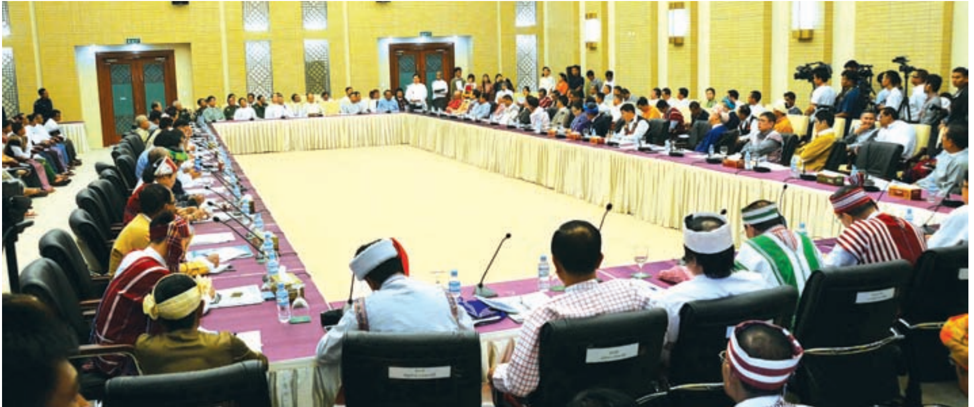
President U Thein Sein meets armed ethnic groups and political parties at the Myanmar International Convention Centre No. 2.—MNA

NAY PYI TAW, 12 Feb— President U Thein Sein met with armed ethnic groups and political parties at the Myanmar International Convention Centre No 2 in Nay Pyi Taw on Thursday. First of all, the president cordially greeted the leaders of political parties.