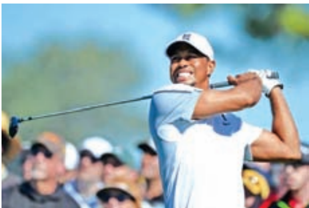
Tiger Woods hits his drive on the 12 th during the first round of the Farmers Insurance Open golf tournament at Torrey Pines Municipal Golf Course in La Jolla, CA, USA on 5 Feb, 2015.