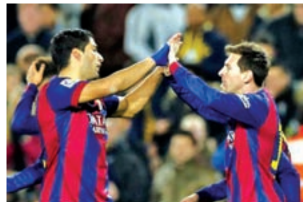
Barcelona's Luis Suarez and Lionel Messi (R) celebrate a goal against Villarreal during their King's Cup semi-final first leg soccer match at Camp Nou stadium in Barcelona on 11 Feb, 2015.