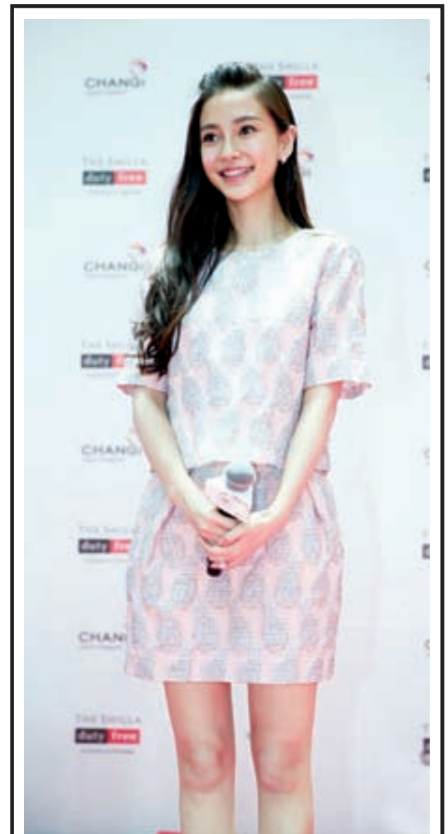
Actress Angelababy attends fashion activity in Singapore, on 10 Feb, 2015.

Oscar nominee, for his leading roles in 'Pulp Fiction' and 'Saturday Night Fever'. Washington is the star of the hit television drama 'Scandal' and received two Emmy nominations for her role.—PTI