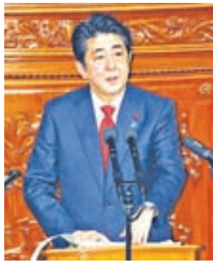
Prime Minister Shinzo Abe gives his policy address to the House of Representatives plenary session on 12 Feb, 2015, in Tokyo.

provide humanitarian assistance such as food and medical aid," Abe said. "Japan will fulfill that responsibility in the international fight against terrorism." Abe has denied Islamic State's allegation that Japan has donated money to kill the extremist group's people and expressed his intention of stepping up nonmilitary, humanitarian assistance.