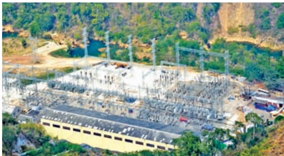
Photo of Baluchaung No.2 Hydropower Plant with installed capacity of 168 MW which serves as a major electric power source producing around 10 per cent of electricity generation in Myanmar.

According to the ministry, the country sees a 15 per cent increase in power demand every year, expecting to hit 4,531 megawatts in 2020, 8,020 in 2025 and 14,542 in 2030.—GNLM