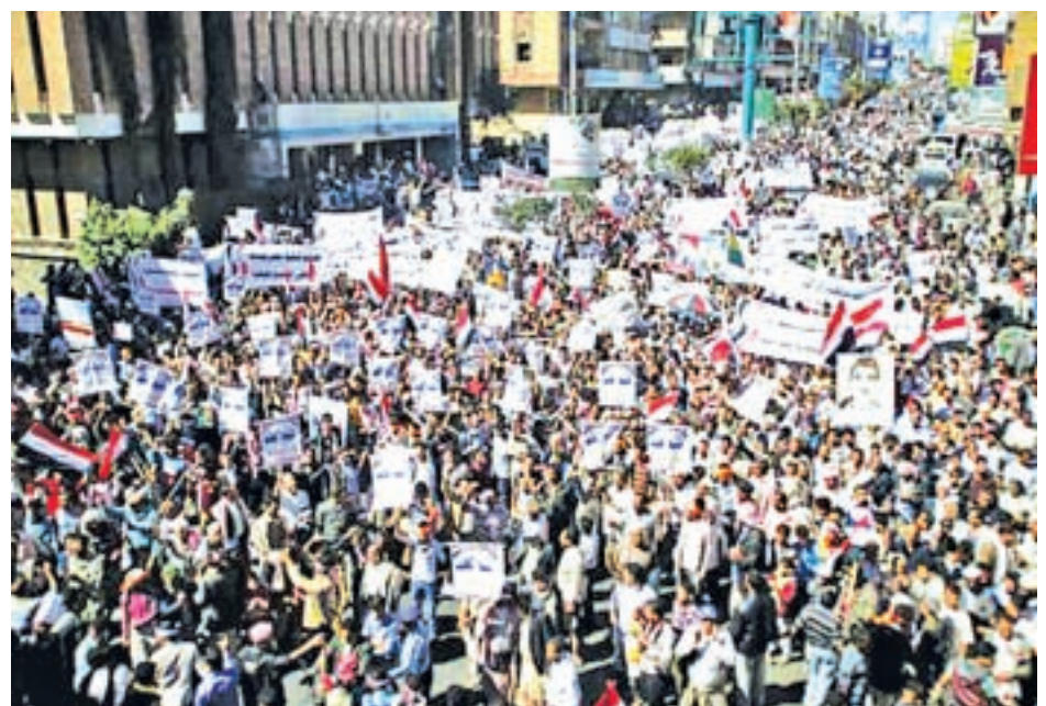
Anti-Houthi protesters demonstrate to commemorate the fourth anniversary of the uprising that toppled former president Ali Abdullah Saleh, in Yemen's southwestern city of Taiz on 11 Feb, 2015.

"There continue to be ... US Department of Defence personnel on the ground in Yemen that are coordinating with their counterparts in Yemen," he said.—Reuters