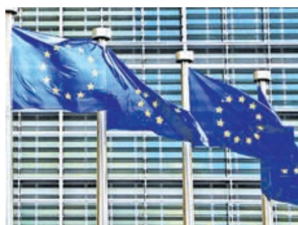
European Union flags flutter outside the EU Commission headquarters in Brussels on 2 Feb, 2015.

Lawmakers have resisted endorsing the system for sharing data, known as the Passenger Name Record (PNR), on the grounds