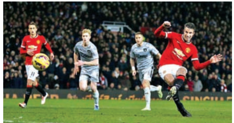
Manchester United's Robin van Persie (R) scores his team's third goal from a penalty during their English Premier League soccer match against Burnley at Old Trafford in Manchester, northern England on 11 Feb, 2015.

"I didn't like this performance today," the United manager said. "Of course, we have won and the result is fantastic. But after this match you cannot say that we are going up and I want to progress every match."