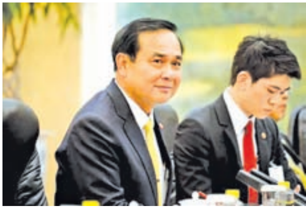
Thailand's Prime Minister Prayuth Chan-ocha (C)

BANGKOK, 12 Feb — Thailand plans to build high-speed railway links connecting Bangkok to tourist destinations south of the Thai capital modeled on Japan's bullet