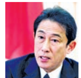
Japanese Foreign Minister Fumio Kishida

Japan has resolved to contribute more actively to peace and stability in Asia and other parts of the world,