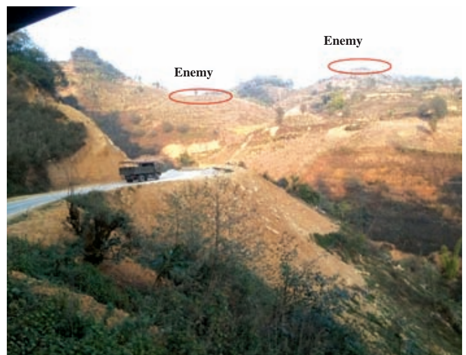
A photo shows location of enemy in fighting at Laukkai region.