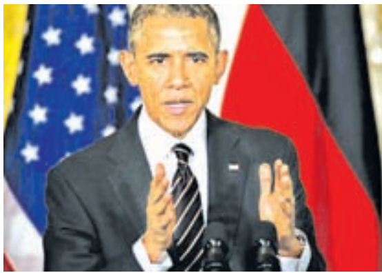
US President Barack Obama speaks during a joint news conference with German Chancellor Angela Merkel following their meeting at the White House in Washington on 9 Feb, 2015.

Facing pressure to let lawmakers weigh in on an issue as important as the deployment of troops and chastened by elections that handed power in Congress to Republicans, he said in Novem-