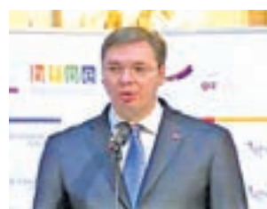
Serbian Prime Minister Aleksandar Vucic

"I expect the first chapters to be opened very soon," said the prime minister, stressing at the same time that "what we will do with the country and how much we will be able to change is far more important than just opening the chapters." Vucic said that the international community had already recognized the efforts Serbia had made in the eco-