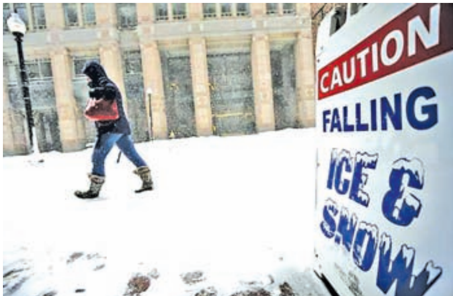
A pedestrian walks along a snow covered street during a winter snow storm in Boston, Massachusetts on Feb, 2015.