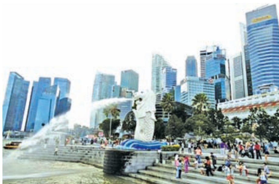
Tourists take pictures next to the Merlion statue in the central business district of Singapore on 6 Feb, 2015.—REUTERS

The STB did not give a forecast for 2015 on Wednesday, but said it would not be able to meet a 10-year plan to grow visitor arrivals to 17 million this year due to unforeseen circumstances such as the 2008 global financial crisis.—Reuters