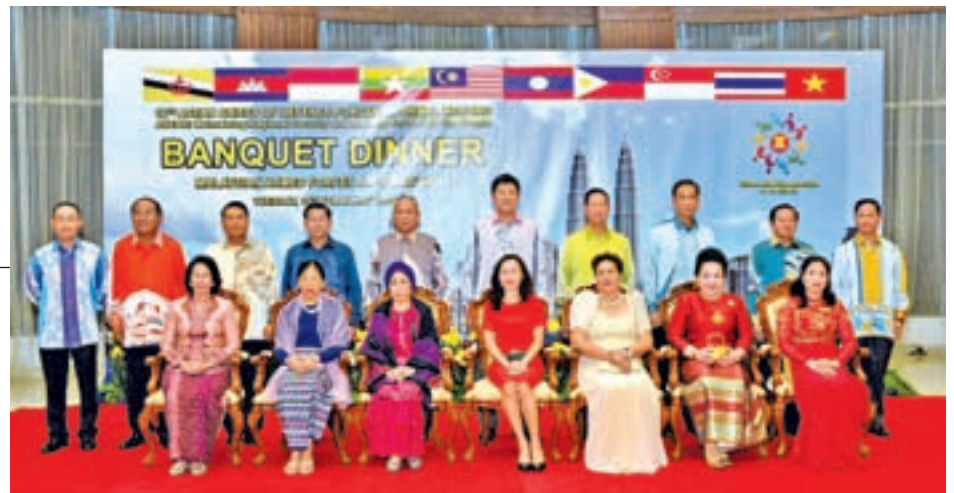
Senior General Min Aung Hlaing poses for documentary photo with chiefs of defence forces of ASEAN countries.

countries. After the dinner, the Commander-in-Chief and wife posed for documentary photos together with Chiefs of Defence Forces of ASEAN countries and their wives and exchanged gifts.— Myawady