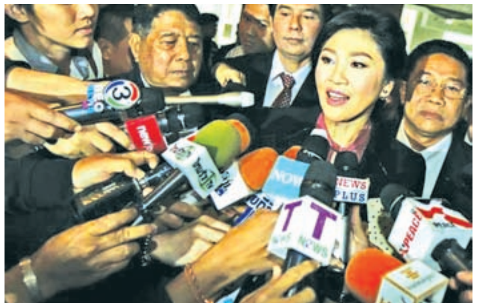
Ousted former Prime Minister Yingluck Shinawatra talks to reporters as she arrives at Parliament before the National Legislative Assembly meeting in Bangkok on 9 Jan, 2015.—REUTERS

The charges are the latest twist in 10 years of turbulent politics that have pitted Yingluck and her brother against the royalist military establishment that sees the Shinawatras as a threat and reviles their populist policies. Thaksin, who remains hugely influential in Thailand, was ousted in a coup in 2006 and fled into exile to avoid jail over a corruption conviction two years later on charges he says were politically motivated.—Reuters