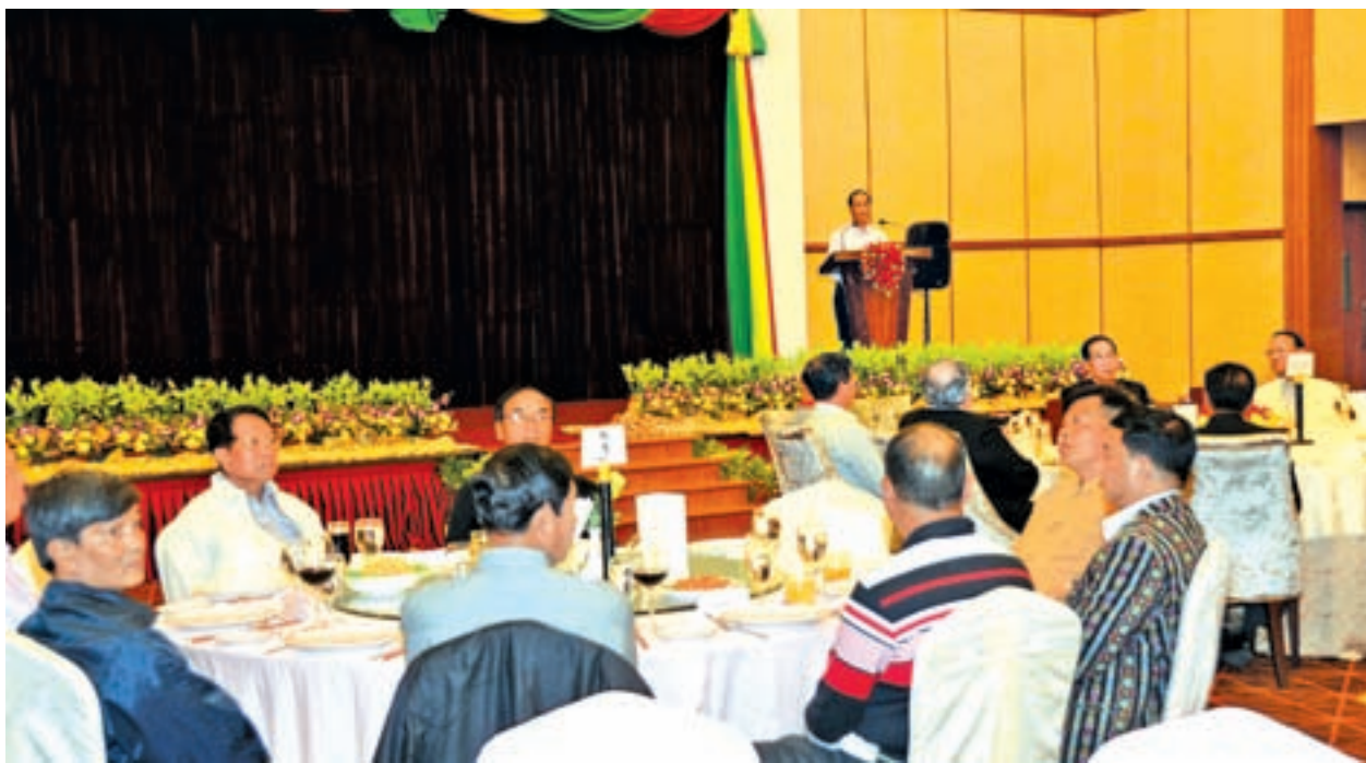
Vice President Dr Sai Mauk Kham delivers speech at dinner to armed ethnic group leaders.

NAY PYI TAW, 11 Feb — Vice President Dr Sai Mauk Kham who is also the chairman of Union Peace-Making Work Committee, hosted dinner to leaders of armed ethnic groups who are in Nay Pyi Taw to attend the 68 th Anniversary Union Day celebration, at Hotel Max in Nay Pyi Taw Ho-