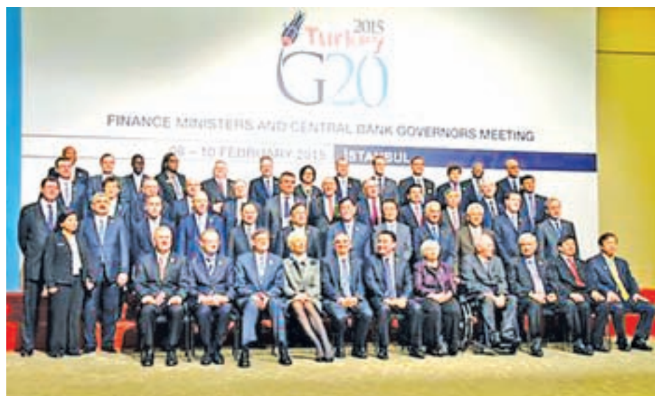
Group of 20 finance ministers and central bank governors are shown during a group photo shoot before wrapping up their two-day meeting in Istanbul on 10 Feb, 2015.