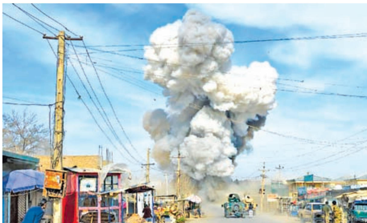
Photo taken on 10 Feb, 2015 shows smoke rising from the site of attack in Kunduz Province, northern Afghanistan. A massive suicide attack in northern Afghanistan’s Kunduz Province and bomb blast against a member of the Provincial Council in eastern Nangarhar Province have left six persons including five attackers dead and injured seven others, including a police and six civilians on Tuesday, officials confirmed.

It said the embassy would close from Friday until further notice.