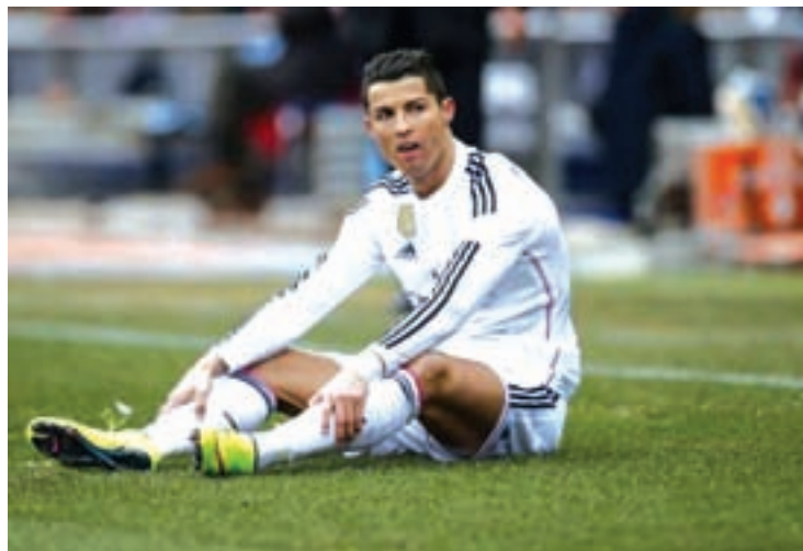
Real Madrid's Cristiano Ronaldo sits on the pitch during their Spanish first division soccer match against Atletico Madrid at the Vicente Calderon stadium in Madrid, on 7 Feb, 2015.

MADRID, 11 Feb — When Real Madrid forward Cristiano Ronaldo collected his third FIFA Ballon d'Or award last month he was enjoying a run of form that was spectacular even by his standards and the European champions were riding high.