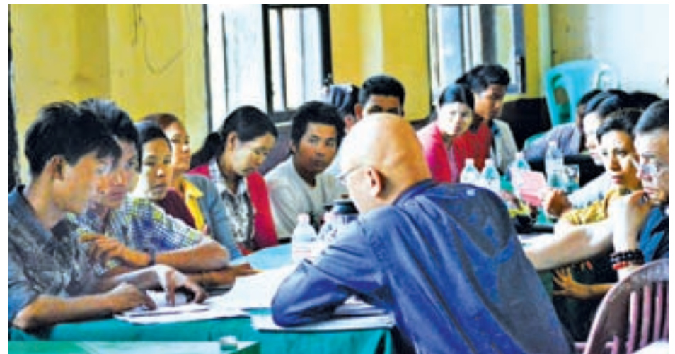
Workers from Red Stone Garment Factory and the manager of the factory are at the negotiation table.

“We are urging our factory to increase our basic salary from K30,000 to K60,000 and our monthly