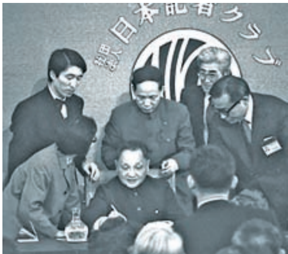
File photo taken in October 1978 shows then Chinese Vice Premier Deng Xiaoping (C) after a Press conference at the Japan National Press Club in Tokyo. Historic sound recordings of news conferences by a number of world figures, including Deng, have been unveiled on the press club's website by 10 Feb, 2015.