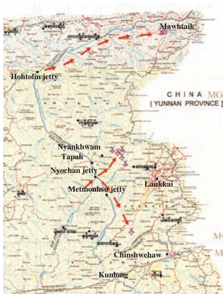
A map shows clashes in Laukkai region

On 17 December, 2013, Kokang renegade group, with the use of explosive laden tricycle-motorized vehicle, also tried to blast Kunlong suspension bridge which is a main facility for public transportation, but their attempts failed.— Myawady