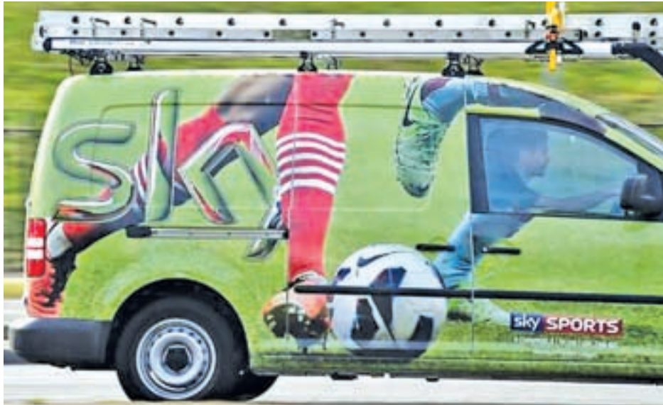
A British Sky Broadcasting Group (BSkyB) work van is driven in west London on 25 July, 2014.

LONDON, 11 Feb — Pay-TV group Sky (SKYB.L) has agreed to pay 4.2 billion pounds to show 126 live English Premier League matches a season from 2016 to 2019, pressured by fierce rival BT (BT.L) to smash analysts' forecasts and secure the best games.