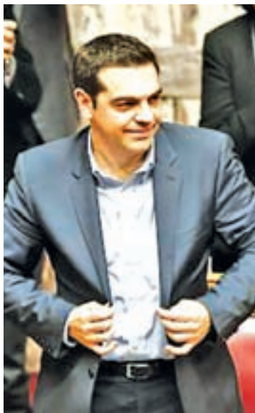
Greek Prime Minister Alexis Tsipras

That came after Schaeuble said that if Greece did not want a new aid programme, “then that's it,” adding to a chorus of warn-