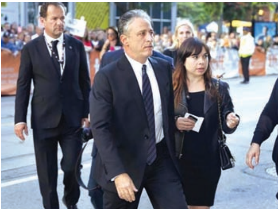
Director Jon Stewart arrives at the Canadian premiere of "Rosewater" at the Toronto International Film Festival (TIFF) in Toronto on 8 Sept, 2014.

LOS ANGELES, 11 Feb — Comedian Jon Stewart, famed for his biting television satire of politicians and the media, will leave his job as host of Comedy Central's parody newscast