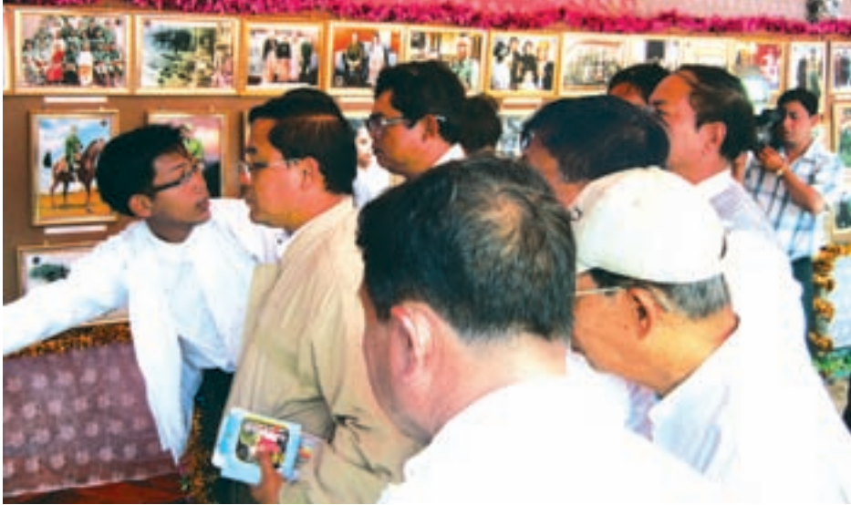
MYANAUNG, 11 Feb— To mark the centennial birthday of General Aung San, the photo and art gallery and souvenir showroom were opened at Zeyathayi Ground

in Ward 4 in Myanaung Township, Ayeyawady Region, on Wednesday.