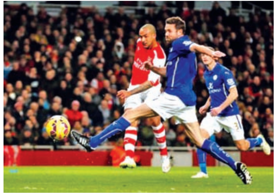
Theo Walcott scores the second goal for Arsenal at Emirates Stadium on 10 Feb, 2015.

At Anfield, striker Daniel Sturridge, on his first Premier League start after a long-term injury, was one of Liverpool's liveliest players and could