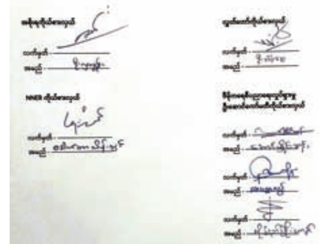
Signatures of four-party talks' participants.—MNA

agreement have been successfully implemented including during the Hluttaw debates for amendment of the national education law and recognized the difficulty to stop the protests and concerns for difficulty to hold examinations and other undesirable incidents. Student representatives will explain the outcomes of the talks to the protesting students and will submit the altitude of the students to the four-party talks to be held on 14 February 2015.— MNA