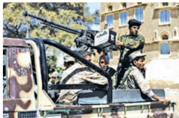
Houthi fighters ride a patrol truck in Sanaa on 10 Feb, 2015.

Reuters spoke to sources close to Hadi to draw a picture of what led Hadi to leave office. —Reuters