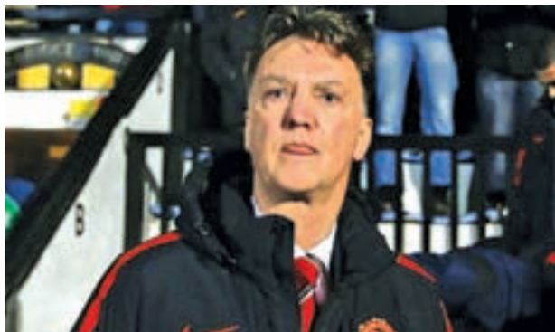
Manchester United manager Louis van Gaal

LONDON, 11 Feb — Manchester United manager Louis van Gaal has denied a Football Association misconduct charge relating to comments he made following last month's FA Cup draw with Cambridge United, the governing body said on Tuesday.