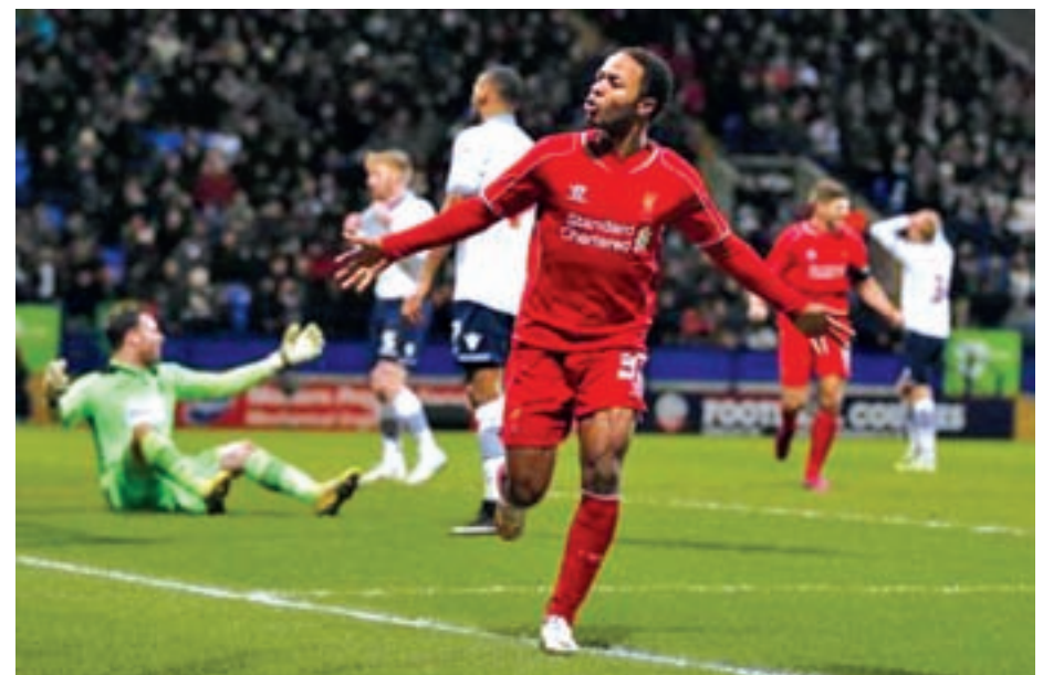
Liverpool’s Raheem Sterling celebrates after scoring during their FA Cup fourth round replay soccer match against Bolton Wanderers at the Macron Stadium in Bolton, northern England on 4 Feb, 2015.

“I know the player is very happy and wants to continue working the way he has been. I have spoken to him a number of times — he is happy here and you can see that in his game. “It is