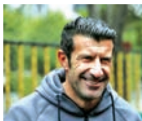
Former Portugal forward Luis Figo smiles as he attends a Figo Football Academy training session in the southern Chinese city of Guangzhou on 4 Feb, 2015.

ZURICH, 10 Feb — The four candidates for the FIFA presidency have passed integrity checks