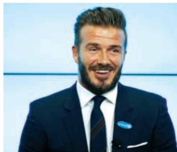
David Beckham attends at a Press conference to mark his 10 years as a UNICEF Goodwill Ambassador, at Google's headquarters in central London, on 9 Feb, 2015.

More than 15 million children were exposed to extreme violence in conflicts in 2014 and millions more were hit by natural