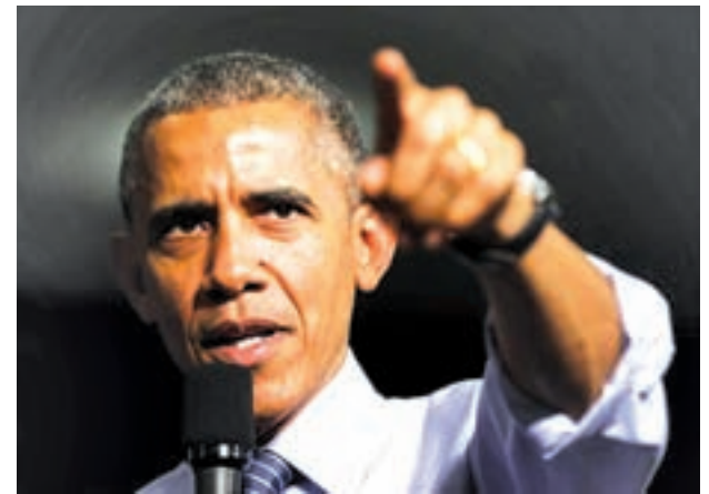
US President Barack Obama

Congressional aides told Reuters on Monday