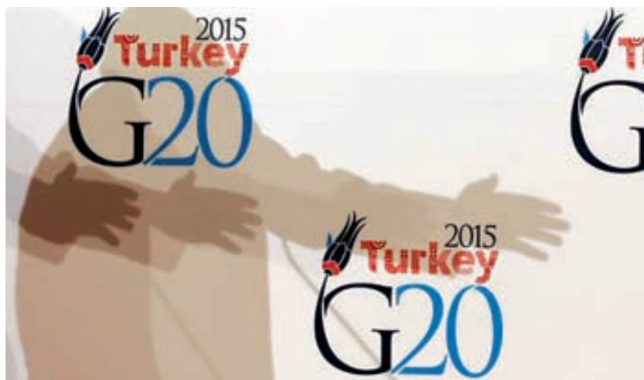
OECD Secretary General Angel Gurría casts his shadow on the podium as he speaks during a news conference in the G20 finance ministers and central bank governors meeting in Istanbul on 9 Feb, 2015.

The draft communique welcomed the European Central Bank’s (ECB) quantitative easing — despite German concern about the policy — and said the move would further support recovery in the euro area.