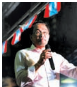
Malaysia's opposition leader Anwar Ibrahim speaks at a rally in Kuala Lumpur on 9 Feb, 2015.

KUALA LUMPUR, 10 Feb — Malaysia's highest court rejected on Tuesday an appeal by opposition leader Anwar Ibrahim against a 2014 sodomy conviction and upheld a five-year prison term that will likely end a political career marked by controversy.