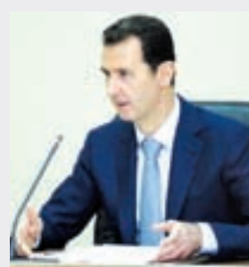
Syria's President Bashar al-Assad

Assad said the Syrian government had known about the US-led campaign before it started but didn't have details. Asked if there was ongoing dialogue via third parties, he said: "There is no dialogue. There is, let's say, information, but not dialogue."—Reuters