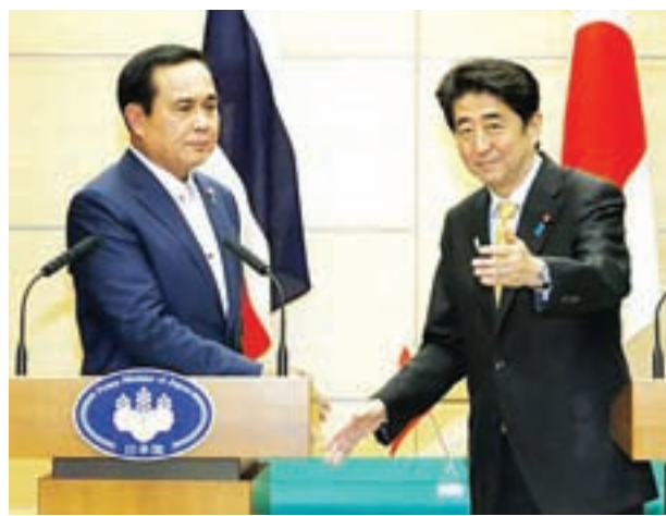
Japanese Prime Minister Shinzo Abe (R) and Thai Prime Minister Prayut Chan-o-cha end their joint Press conference following their talks at Abe's office in Tokyo on 9 Feb, 2015.

"These projects would provide great economic op-