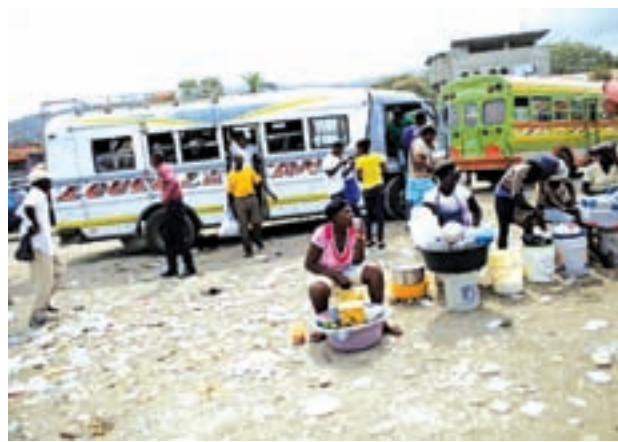
Women offer food for sale at a bus station in Port-au-Prince on 7 Feb, 2015.

In downtown Port-au-Prince young men played football on some streets, while barricades were erected in several suburbs to try to block motorcycle taxi drivers who did not observe the strike action.