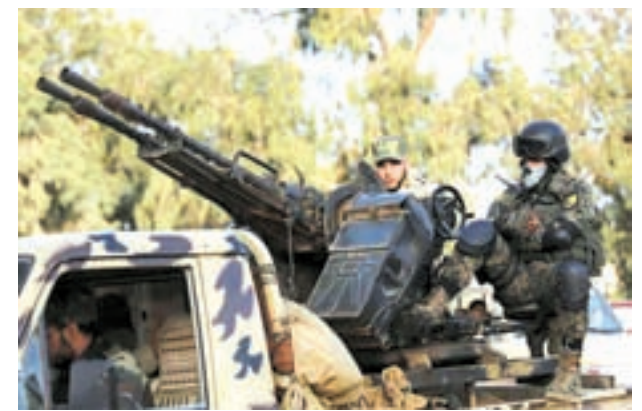
Members of Libyan pro-government forces, which is backed by the locals, look on in an army camp, in Benghazi on 1 Feb, 2015.

BENGHAZI, 10 Feb — Libyan special forces said on Monday they had retaken the main military base in Benghazi from Islamist fighters that they have been battling since October, part of a wider struggle four years after the ousting of autocrat Muammar Gaddafi.