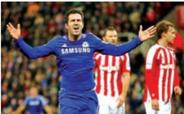
Chelsea’s Cesc Fabregas celebrates after scoring the second goal during their English Premier League soccer match against Stoke City at the Britannia Stadium in Stoke-on-Trent, northern England on 22 Dec, 2014.

“Every striker in the world would be proud to score that magnificent