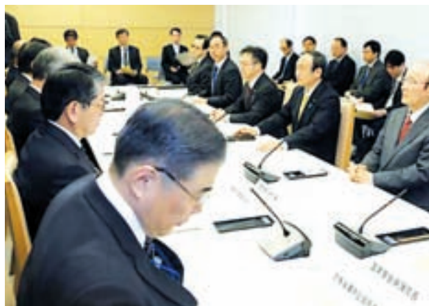
Photo taken on 10 Feb, 2015, at the prime minister’s office in Tokyo shows the first meeting of a government panel to examine the hostage crisis, in which two Japanese men were killed by Islamic State militants. Discussing how to deal with international terrorism and how to protect Japanese citizens abroad, the panel will compile a report probably in April.