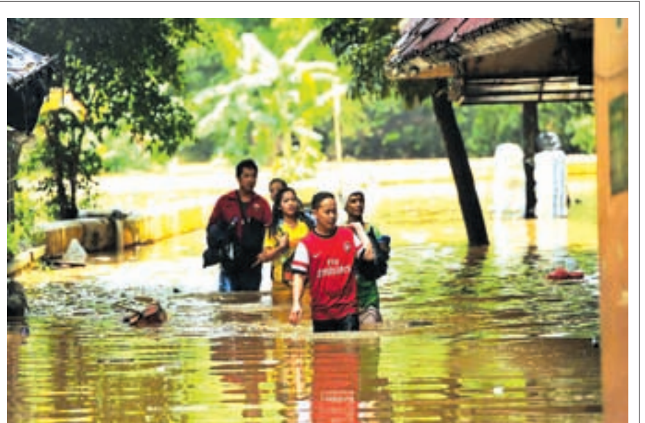
Workers walk through floodwater at Cipulir textile market in Jakarta, Indonesia, on 10 Feb, 2015. Floods have paralyzed business in parts of Jakarta and forced residents to take shelters.—XINHUA

The charismatic Anwar, who heads a three-party opposition alliance, has for years been the greatest threat to Malaysia's political establishment. Prime Minister Najib Razak's government has rejected any suggestion of interference in the case.—Reuters