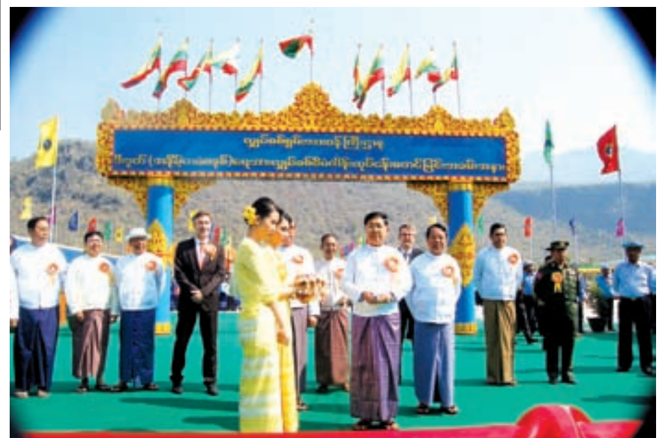
Union Ministers attend launching of Deedok (lower head) hydropower project.

MANDALAY, 10 Feb—A low-head hydropower project was started on Tuesday in an area 12 miles off the Yeywa power plant in PyinOoLwin, Mandalay Region, officials said.