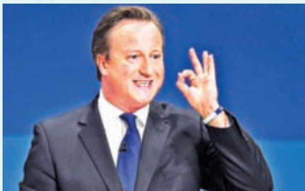
Britain's Prime Minister David Cameron

LONDON, 10 Feb — Businesses must respond to Britain's strong economic growth and low inflation by boosting pay, Prime Minister David Cameron will say on Tuesday, seeking to address his election opponents' argument that many are yet to feel the benefit of recovery.