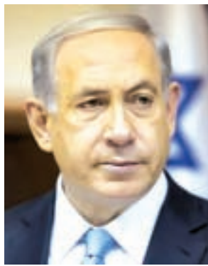
Israeli's Prime Minister Benjamin Netanyahu attends the weekly cabinet meeting in his office in Jerusalem on 8 Feb, 2015.

Another option is for the prime minister to make his speech at the annual meeting of the American Israel Public Affairs Committee in Washington the same week, rather than in Congress.