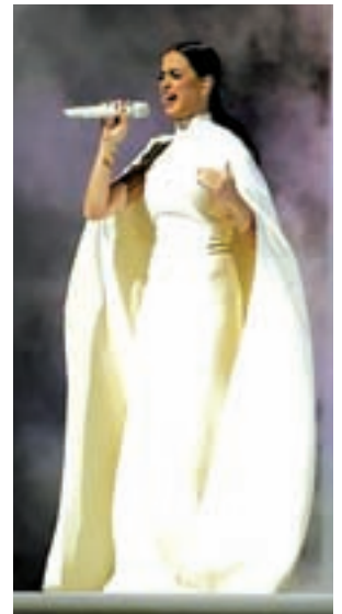
Katy Perry performs "By The Grace of God" at the 57th annual Grammy Awards in Los Angeles, California on 8 Feb, 2015.

On the eve of the 2009 Grammys, R&B singer Chris Brown, who was nominated for three Grammys this year, beat up then-girlfriend and singer Rihanna. Both were in attendance on Sunday, with Rihanna performing shortly after Perry. The NFL, which has become the public face of domestic violence after a spate of arrests among players, aired during last week's Super Bowl a public service announcement of a woman's