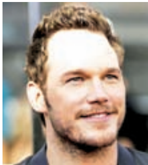
'Guardians of the Galaxy' star Chris Pratt says he would love to play the lead role in 'Indiana Jones' franchise.

LOS ANGELES, 10 Feb — 'Guardians of the Galaxy' star Chris Pratt says he would love to play the lead role in 'Indiana Jones' franchise, reacting on a report suggesting that he would star in its next instalment.