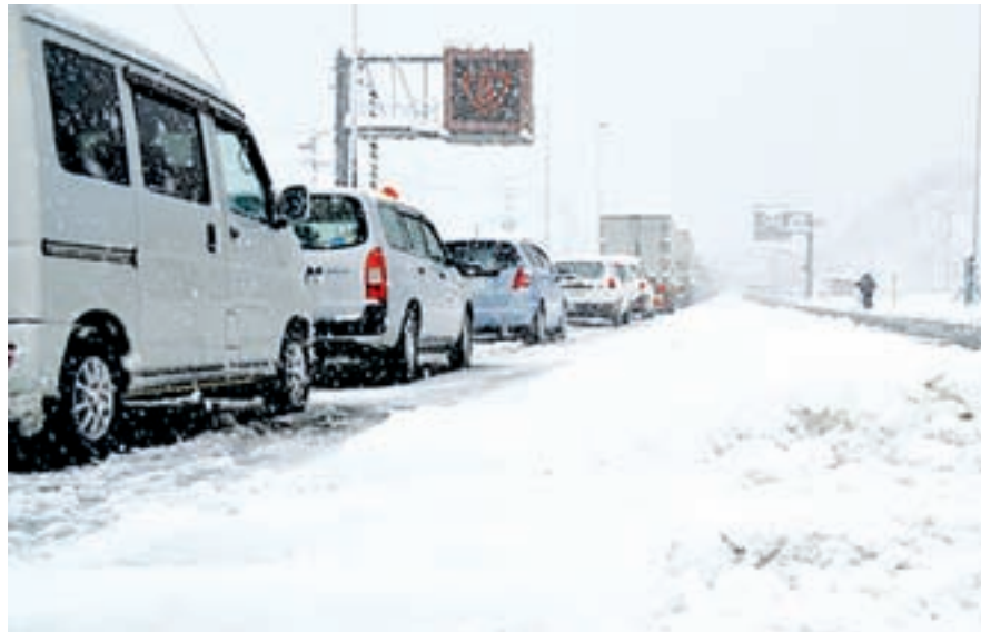
Photo taken on 10 Feb, 2015, in the central Japan city of Tsuruga shows many cars held up due to heavy snow on Route 8. While more than 200 cars became stuck, no injuries have been reported so far.