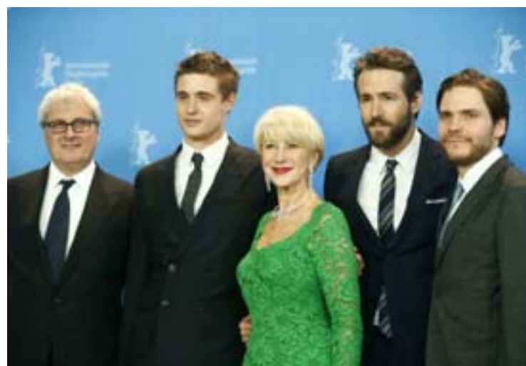
Director Simon Curtis, actors Max Irons, Helen Mirren, Ryan Reynolds and Daniel Bruhl (L-R) pose during a photocall to promote the movie 'Woman In Gold' at the 65th Berlinale International Film Festival, in Berlin on 9 Feb, 2015.

Among them was the Klimt 1907 portrait from his "gold period"