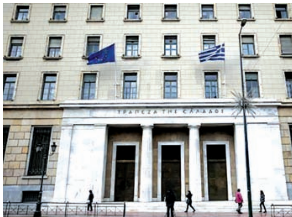
An European Union flag (L) and a Greek national flag flutter as people make their way past the headquarters of Bank of Greece in Athens on 9 Feb, 2015.

ATHENS, 10 Feb — Greek Defence Minister Panos Kammenos said that if Greece failed to get a new debt agreement with