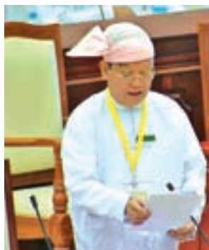
Deputy Minister U Aung Thein of President Office.

(from page 1) generating 168 megawatts. As of 2015-2016 FY, it can also thereby contribute to supply of electricity to 255 villages in Kayah State where 112 of 521 villages have had electricity so far. The state is expected to see 90 percent electric power coverage at the end of next