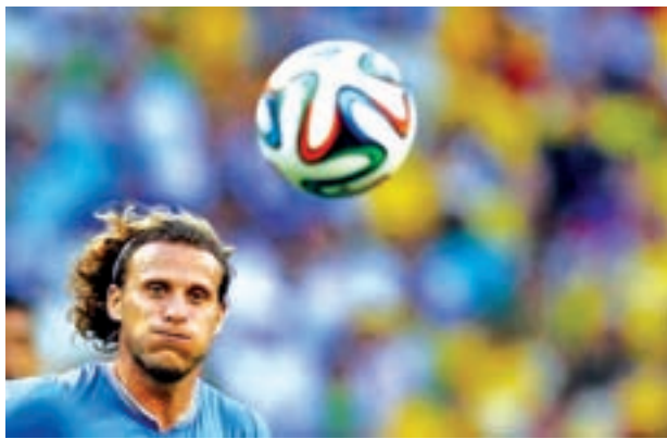
Uruguay's Diego Forlan watches the ball during their 2014 World Cup Group D soccer match against Costa Rica at the Castela stadium in Fortaleza on 14 June, 2014.

MONTEVIDEO, 10 Feb — Uruguayan soccer player Diego Forlan on Monday denied evading taxes by hiding money in Swiss accounts with the British bank HSBC Holdings PLC.