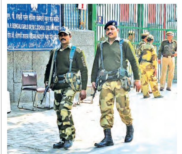
Photo taken on 8 Feb, 2015 shows tight security outside a counting center at Gole Market area in New Delhi, India. Some of the electronic voting machines (EVMs) are kept here from the polling booths and will be opened for counting on 10 Feb. Several counting centers are scattered in the entire Delhi where the EVMs are stored.