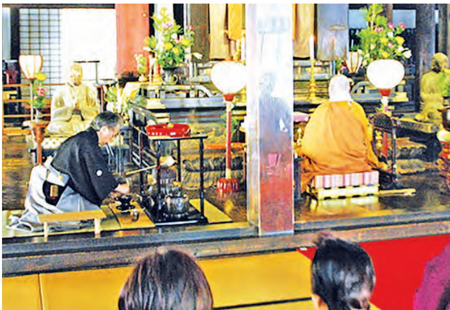
Photo taken on 9 Feb, 2015, shows a tea ceremony held at the Gokurakudo main hall, a national treasure, of Gangoji Temple, a World Heritage site, in the ancient city of Nara, western Japan.