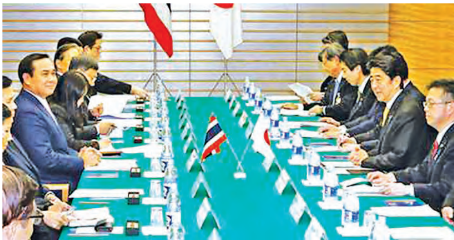
Japanese Prime Minister Shinzo Abe (2 nd from front, R) and Thai Prime Minister Prayut Chan-o-cha (4 th from front, L) hold talks at Abe’s office in Tokyo on 9 Feb, 2015.

On the economic front, Abe and Prayut are expected to discuss Japan’s cooperation in railway and other infrastructure development in Thailand, including a possible introduction of Japan’s shinkansen bullet train technology.