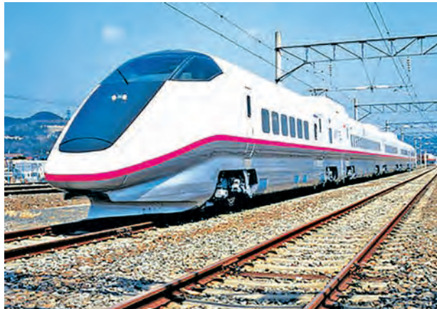
Supplied photo shows “Komachi” high-speed trains running on the Akita Shinkansen Line designed by Kenji Ekuan. His office said on 9 Feb, 2015, that Ekuan died of a heart rhythm disorder at a Tokyo hospital in the early morning of the previous day.

TOKYO, 9 Feb — Industrial designer Kenji Ekuan, who crafted a soy sauce dispenser now ubiquitous in Japan and around the world, died of a heart rhythm disorder at a Tokyo hospital early Sunday morning, his office said on