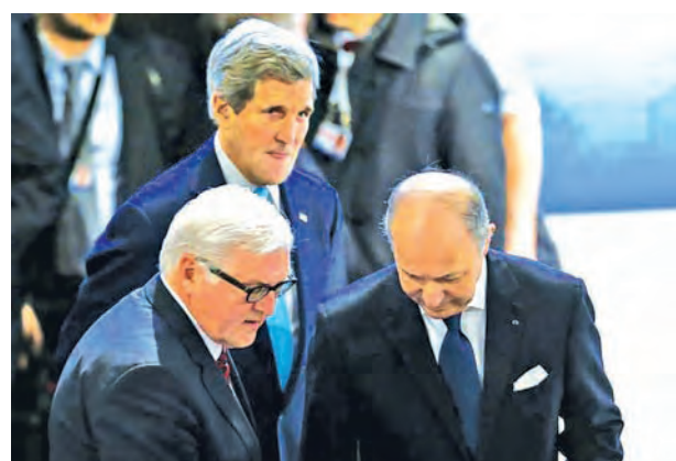
German Foreign Minister Frank-Walter Steinmeier, French Foreign Minister Laurent Fabius (R) and US Secretary of State John Kerry (top) arrive for the chairman's debate during the 51st Munich Security Conference at the 'Bayerischer Hof' hotel in Munich on 8 Feb, 2015.

A Ukraine military spokesman said on Sunday that intense fighting was continuing around the rail junction town of Debaltsevo, with rebel fighters making repeated attempts