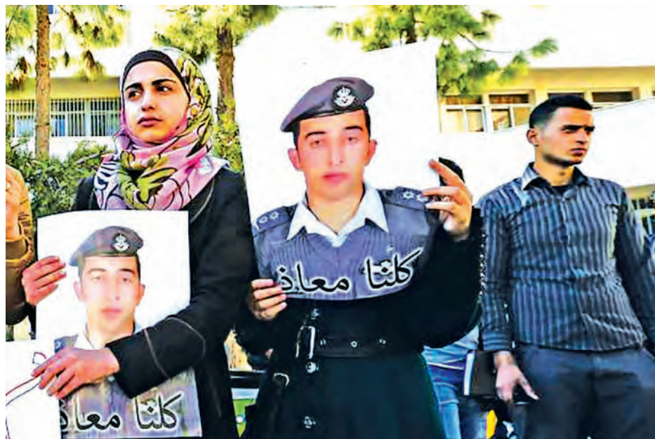
Students hold pictures of Islamic State captive Jordanian pilot Muath al-Kasaesbeh during a rally calling for his release, at Jordan University in Amman on 3 Feb, 2015.

At least 37 people were killed in a wave of bombings on Saturday. Despite the violence, the government lifted a longstanding night-time curfew on Saturday night aimed at normalizing life in the war-torn city.— Reuters