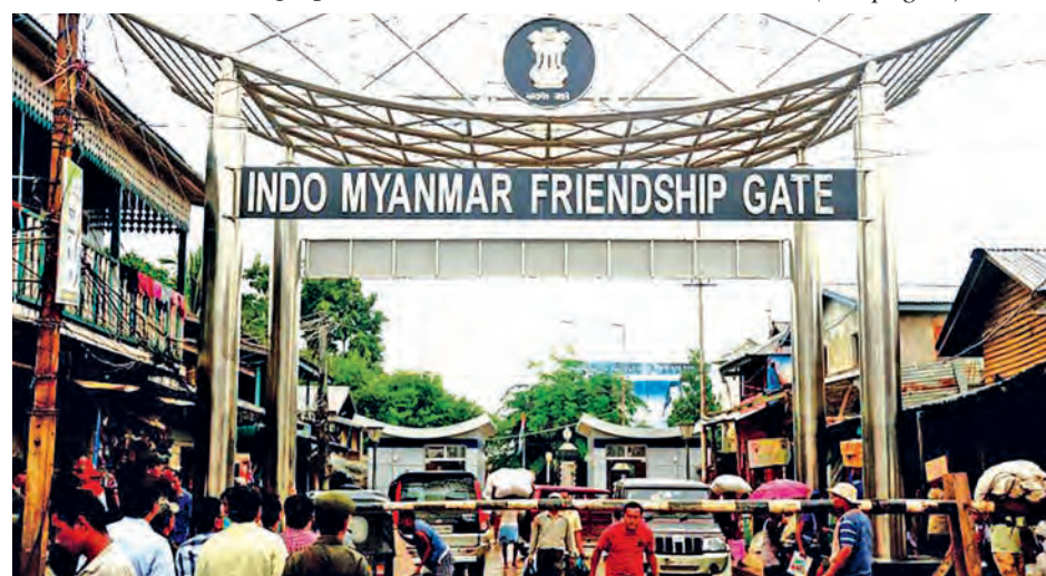
An Indo-Myanmar friendship gate promote bilateral trade.

Myanmar is exporting agricultural products to (See page 2)