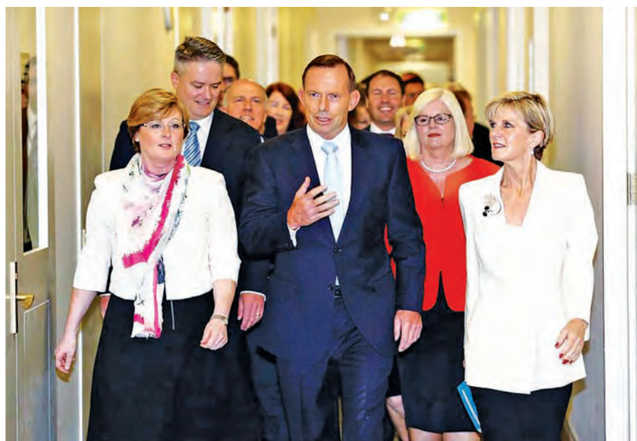
Australian Prime Minister Tony Abbott (C) walks to a government party room meeting surrounded by supporters in Canberra’s Parliament House on 9 Feb, 2015.

Following the vote, online gambling site Sportingbet.com.au had Communications Minister Malcolm Turnbull as the favorite to be prime minister at the next election, with a $1 bet paying out at $1.60. Abbott was at odds of $2.75, while Foreign Minister Julie Bishop was $6.50, an indica-