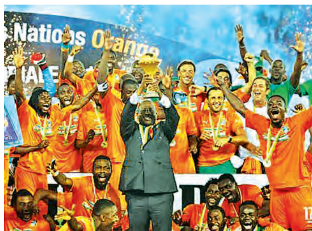
Ivory Coast's players and officials celebrate with the trophy after winning the African Nations Cup final soccer match against Ghana in Bata, on 8 Feb, 2015.

Victory for the Ivorians also handed Frenchman Herve Renard the distinction