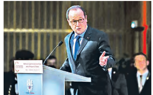
French President Francois Hollande delivers a speech during the Franco-African Forum at the Bercy Finance Ministry in Paris, on 6 Feb, 2015.