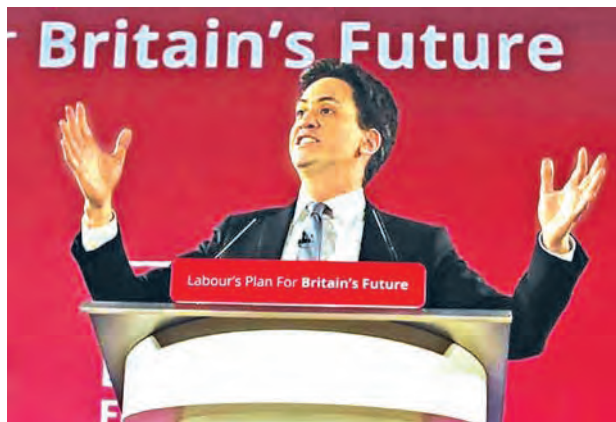
Britain's opposition Labour Party leader Ed Miliband gestures as launches his party's 2015 election campaign, at the Lowry Theatre in Salford, north west England on 5 Jan, 2015.

LONDON, 9 Feb — The Labour Party said on Monday it would double the length of paid paternity leave for new fathers to a month if it wins a national election on 7 May, a pledge that drew criticism from some business leaders.