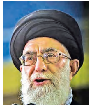
Iran’s Supreme Leader Ayatollah Ali Khamenei

DUBAI/MUNICH, 9 Feb — Iran’s supreme leader said on Sunday he could accept a compromise in nuclear talks and gave his strongest defence yet of President Hassan Rouhani’s decision to negotiate with the West, a policy opposed by powerful hardliners at home.