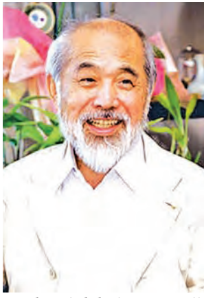
Industrial designer Kenji Ekuan.

TOKYO, 9 Feb — Industrial designer Kenji Ekuan, who crafted a soy sauce dispenser now ubiquitous in Japan and around the world, died of a heart rhythm disorder at a Tokyo hospital early Sunday morning, his office said on