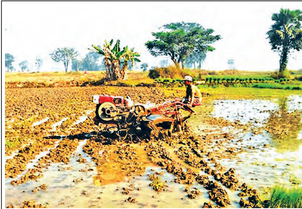
A farmer ploughs farmlands irrigated by Kunchaung Dam with the use of power-tiller for cultivation of summer paddy on 8 February near Yaynitkwin village in Myanaung Township, Ayeyawady Region.

Kho Hlon Yar foundation vaccinated blood donors against hepatitis B free of charge as of November 2014.