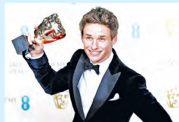
Eddie Redmayne poses after receiving the award for best leading actor for "The Theory of Everything" at the British Academy of Film and Arts (BAFTA) awards ceremony at the Royal Opera House in London on 8 Feb, 2015.

Twenty-four-year-old British actor Jack O'Connell picked up the Rising Star award, the only prize voted on by the public.