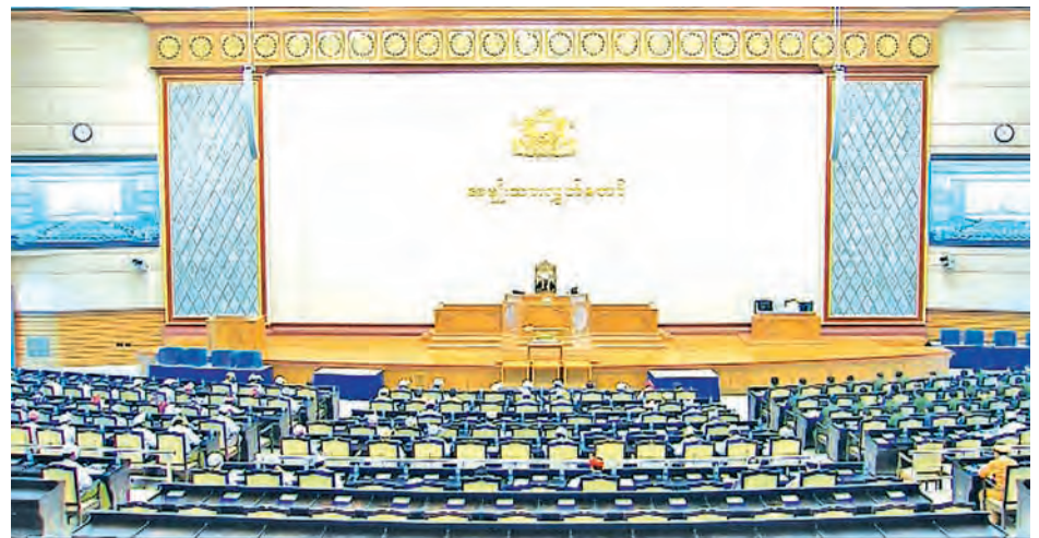
Representatives of Amyotha Hluttaw debate effective prevention of drug abuse.

The motion was seconded by four representatives who proposed to form bodies made up of teachers and town elders to expose drug addicts and give treatment to them as well as to take action against traffickers, to restructure current rehabilitation centres for effective measures, and to educate young people in townships on drug abuse and to expose drug traffickers regardless of their statuses.