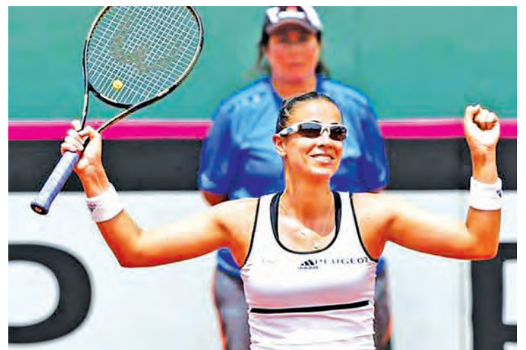
Paula Ormaechea of Argentina celebrates after defeating Coco Vandeweghe of the US in their Fed Cup World Group II first round tennis match in Buenos Aires on 8 Feb, 2015.

Editorial Section — (+95) (01) 8604529 Advertisement & Circulation — (+95) (01) 8604532