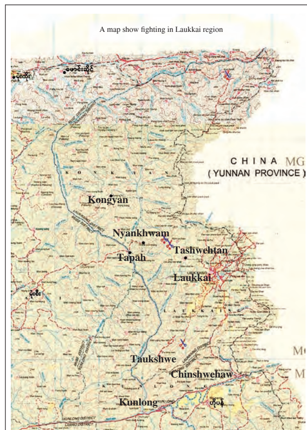
A map shows a fighting between Tatmadaw and renegade troops of Kokang. (News on Page 1)—MYAWADY