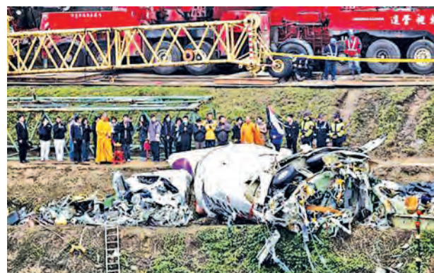
Relatives of the victims pray during a Buddhist ritual near the wreckage of TransAsia Airways plane Flight GE235 after it crash landed into a river, in New Taipei City on 5 Feb, 2015.

The CAA said the flight tests would only involve TransAsia’s 71 ATR pilots, and not those who fly its Air-