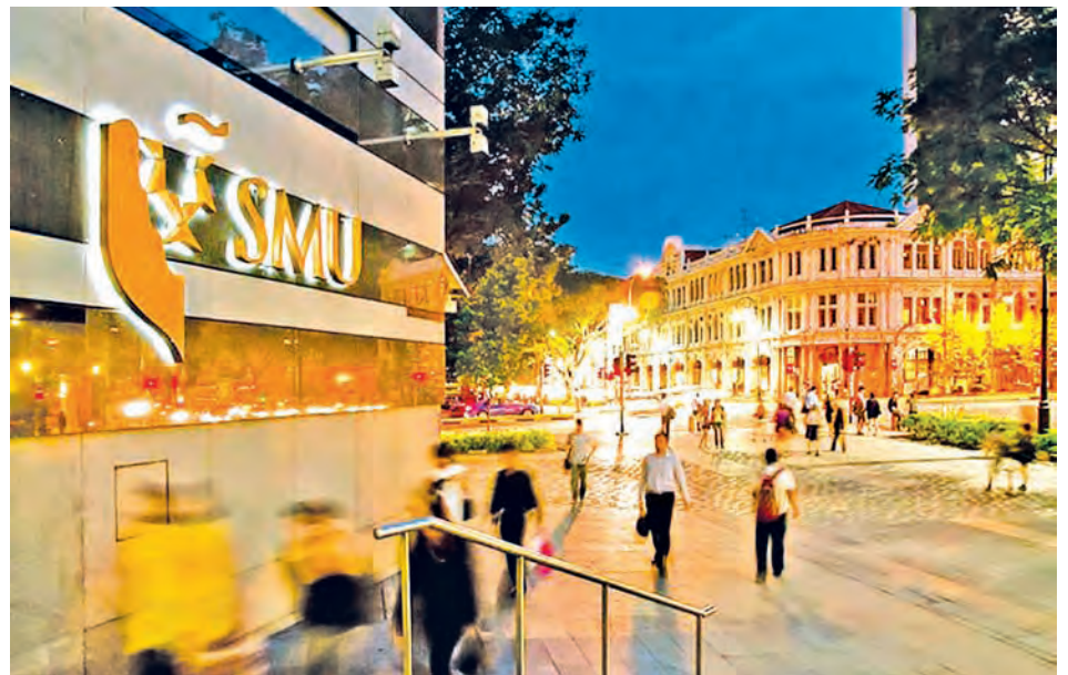
Singapore Management University

Each year, the "Edusave Merit Bursary" (EMB) is