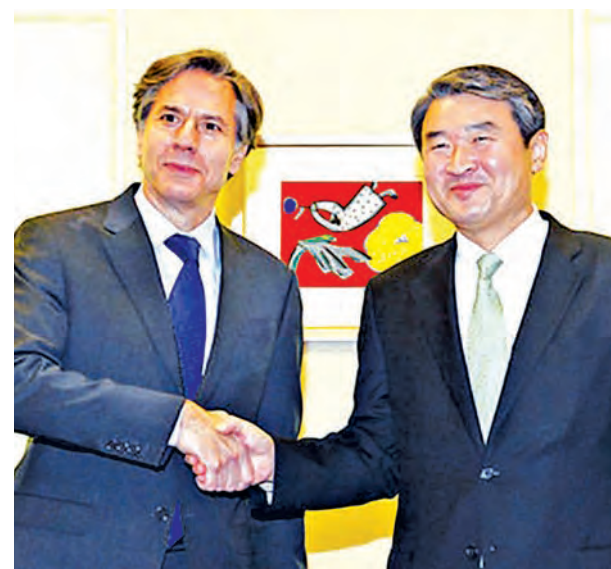
US Deputy Secretary of State Antony Blinken (L) and South Korean Vice Foreign Minister Cho Tae Yong shake hands before their talks in Seoul on 9 Feb, 2015. After the meeting, Blinken said no decision has been made on deploying a US advanced anti-missile system in South Korea.