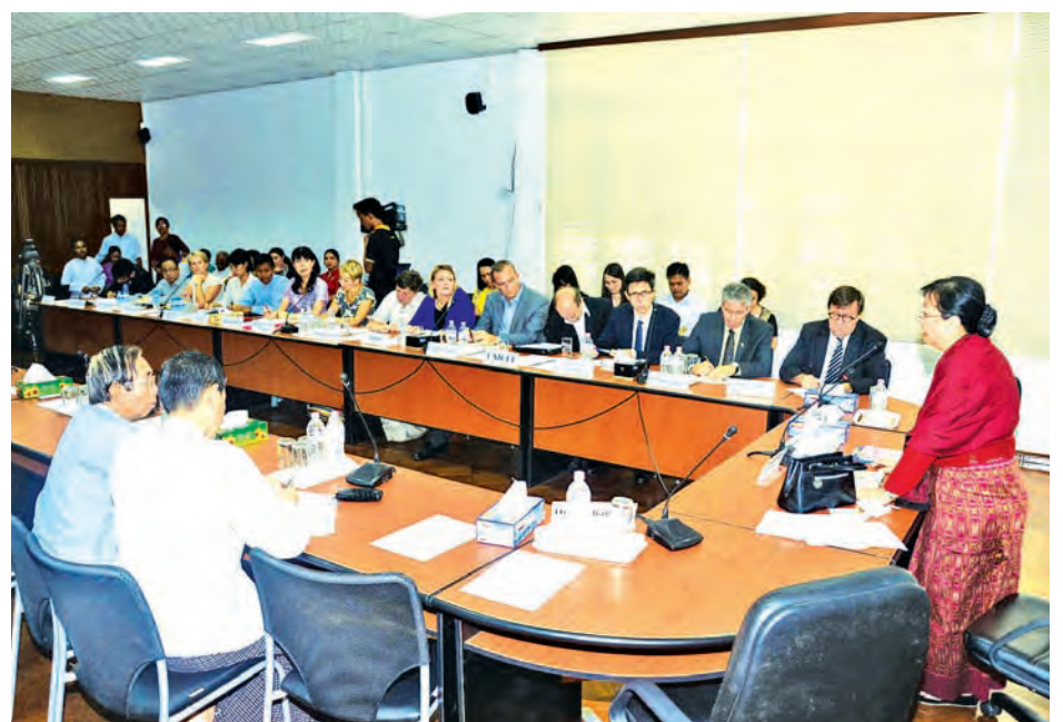
Union Minister for Education Dr Daw Khin San Yi speaking at meeting between Comprehensive Education Sector Review-CESR and international development partners.