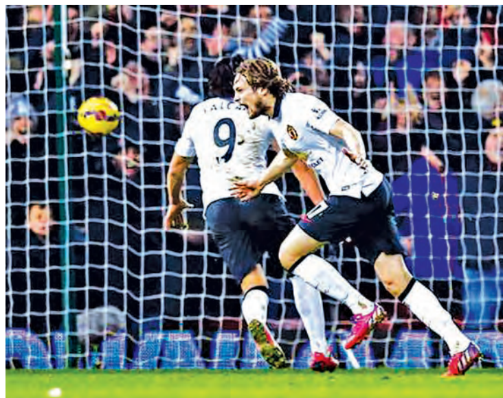
Manchester United's Daley Blind celebrates after scoring a goal against West Ham United during their English Premier League soccer match at the Boleyn Ground in London, on 8 Feb, 2015.

James Tomkins was the next West Ham player to test De Gea when the defender's header