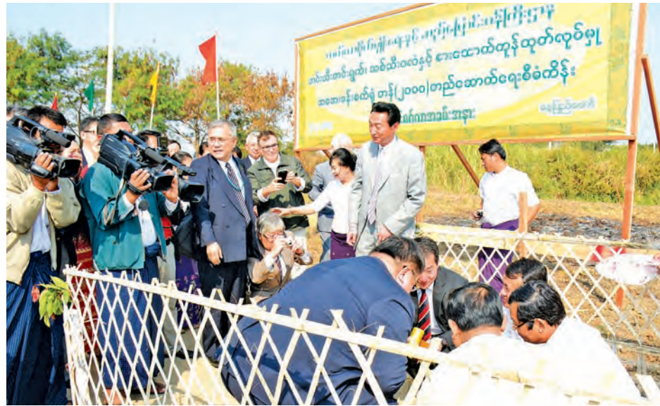
Union Ministers and officials drive stake for construction of 2000-ton cold storage.—MNA

NAY PYI TAW, 9 Feb—Union Minister for Agriculture and Irrigation U Myint Hlaing and Union