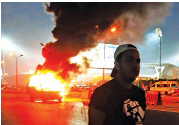
A soccer fan is seen near a police car, which was set on fire by fireworks, during clashes between soccer fans and security forces in front of a stadium on the outskirts of Cairo on 8 Feb, 2015.

"I'd told him: leave soccer matches," she said.