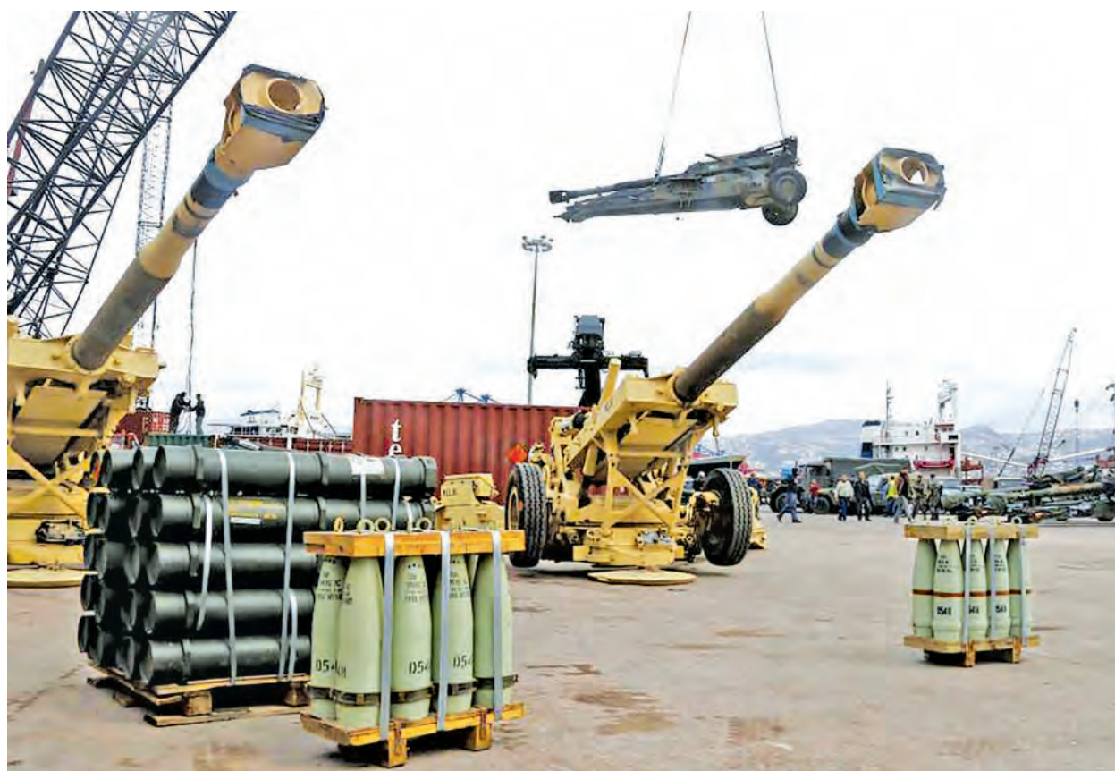
Workers unload artillery, part of a military donation from the US government to the Lebanese army, during a ceremony at Beirut's port on 8 Feb, 2015.