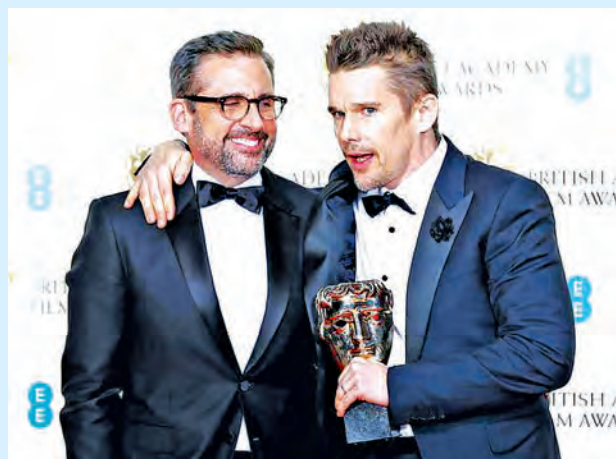
Ethan Hawke hugs Steve Carrell after he presented him with the award for best director which he accepted on behalf of Richard Linklater for "Boyhood" at the British Academy of Film and Arts (BAFTA) awards ceremony at the Royal Opera House in London on 8 Feb, 2015.

Mexican Emmanuel Lubezki won the cinematography award for his work on "Birdman", but the show business satire failed to pick up the big prizes that some commentators had tipped it for.