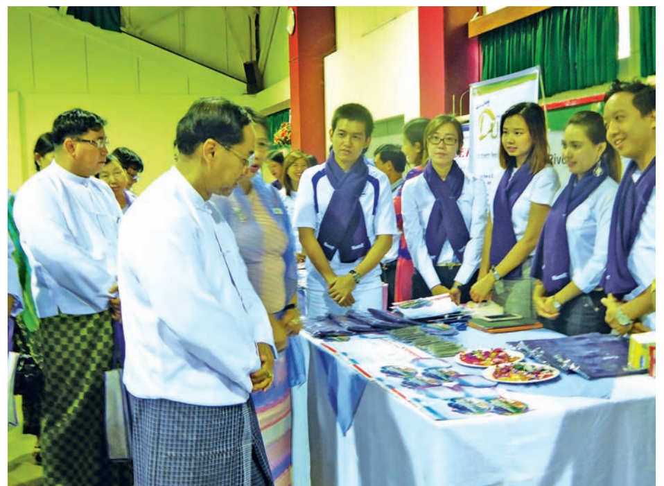
Yangon Region Chief Minister U Myint Swe views equipment used in treatment of epilepsy at the ceremony to mark International Epilepsy Day.