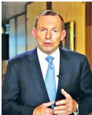
Tony Abbott, Prime Minister of Australia

"It is important to end the uncertainty at the very beginning of the parliamentary sitting week,"