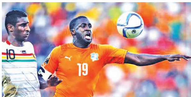
Yaya Toure is challenged by Guinea's Kevin Constant during Group D soccer match of the 2015 African Cup of Nations in Malabo on 20 Jan, 2015.

pable of making inroads into that deficit at present, although Ivorian Toure is back