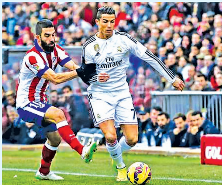
Atletico Madrid's Arda Turan (L) challenges Real Madrid's Cristiano Ronaldo during their Spanish first division soccer match at the Vicente Calderon stadium in Madrid, on 7 Feb, 2015.

The champions are now four points behind Real at the top and sit level with Barcelona, who visit Athletic Bilbao on Sunday, but coach Diego Simeone remains pragmatic about their chances of retaining the title.