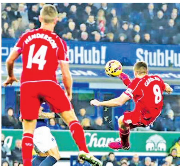
Steven Gerrard of Liverpool has a shot at the Everton goal during their English Premier League soccer match at Goodison Park, Liverpool, on 7 Feb, 2015.