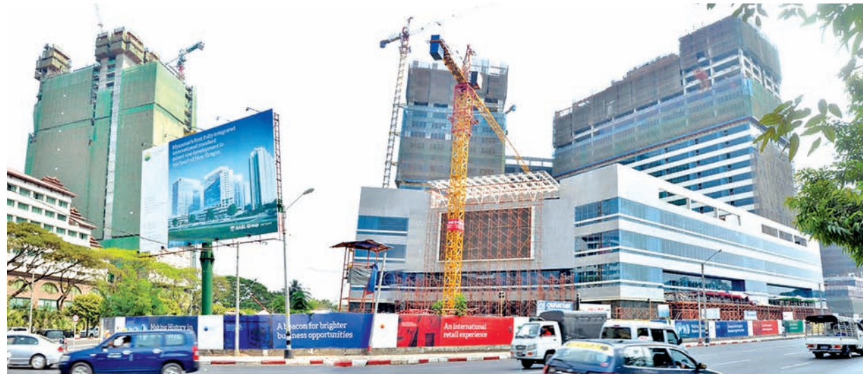
Construction projects in Yangon City suspend work processes to review environmental impacts.

However, the authorities had to plan inspection tours at the project sites as