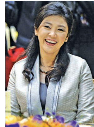
Ousted former Prime Minister Yingluck Shinawatra

banned from politics for five years and indicted on criminal charges over her involvement in a state rice buying scheme that cost Thailand billions of dollars.