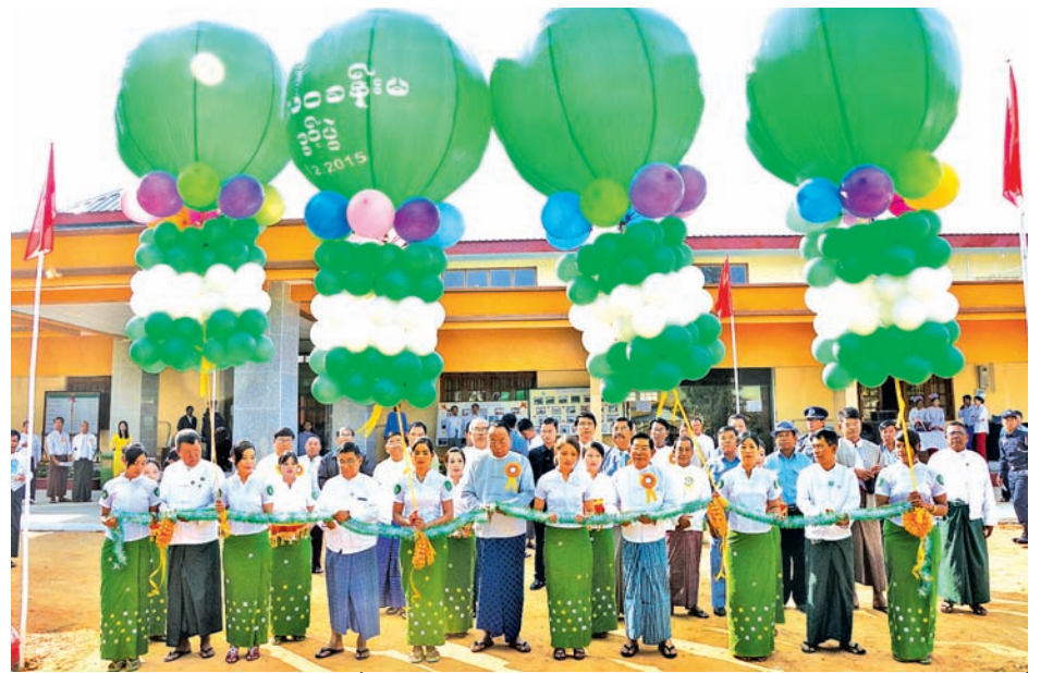
Speaker of Amyotha Hluttaw U Khin Aung Myint opens Thilawa Hall in Yamethin Township.

After the ceremony, the speaker attended the opening ceremony of a middle school in Kyaukpyu Village. At the school opening ceremony, the speaker said that the government has been increasing the budgets for education and health sectors as the two sectors are important for regional development. In conclusion,