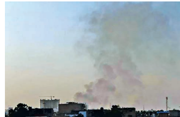
Black smoke raises into the air near Benghazi port, where there are violent clashes, in Benghazi on 7 Feb, 2015.

The conflict has been complicated by a separate battle in Benghazi, the country's second-largest city, where forces allied to Thinni launched an offensive in mid-October to expel Islamist armed groups