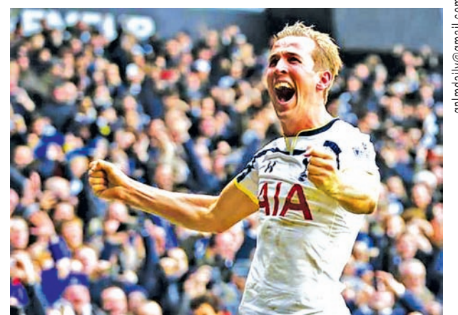
Harry Kane of Tottenham Hotspur celebrates scoring his second goal against Arsenal during their English Premier League soccer match at White Hart Lane, London on 7 Feb, 2015.

Editorial Section — (+95) (01) 8604529 Advertisement & Circulation — (+95) (01) 8604532 gmmdaily@gmail.com www.globalnewlightofmyanmar.com www.facebook.com/globalnewlightofmyanmar