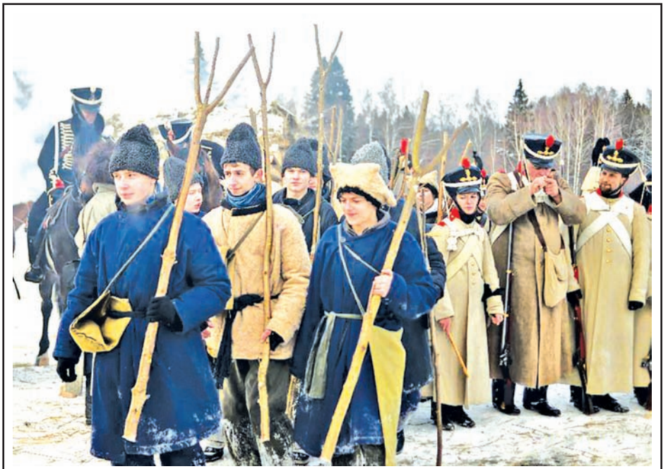
The 203 rd anniversary of the 1812 Russian Patriotic War was marked in the village of Afineyevo, 30km southwest of Moscow, Russia on 7 Feb, 2015.