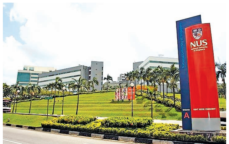
National University of Singapore

[Note: An "offshore campus", or overseas branch campus, is a franchised operation that a tertiary or higher education institution creates in order to expand its operations beyond the borders where it is mainly based. They are operating with the bidding of the host country's government. The theory behind this idea is the provision of a tertiary institution's programs to potential students, through direct contact with the tertiary institution's own faculty and with its own facilities, rather than surrendering the respon-