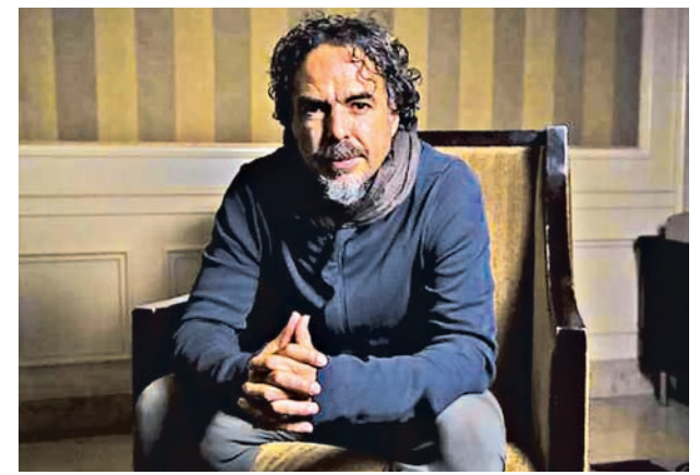
Mexican film director Alejandro Gonzalez Inarritu poses for a portrait while promoting his upcoming movie ‘Birdman’ in Los Angeles, California in this on 16 Dec, 2014 file photo.

Since 1948, there have been only seven occasions when the DGA award winner has not gone on to win the corresponding Academy Award. ‘Argo’ director