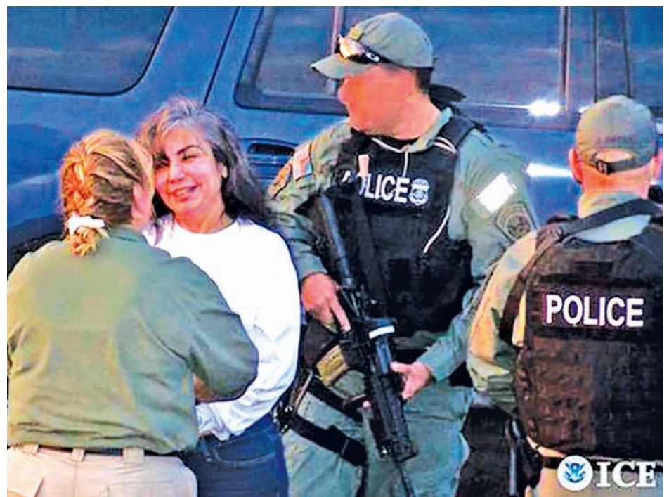
Sandra Avila Beltran, known as the "Queen of the Pacific" is surrounded by US Immigration and Customs Enforcement (ICE) officials before being deported to Mexico at El Paso International airport, in this handout photo released to Reuters on 20 Aug, 2013.