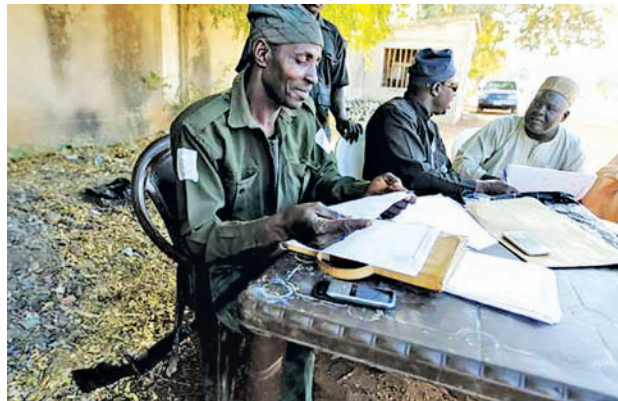
Militia hunters helping the army to fight the Boko Haram insurgency hold a meeting in Yola, Adamawa State on 14 Jan, 2015.

YAOUNDE, 8 Feb — African nations pulling together a regional force to fight Nigeria's Boko Haram militants on Saturday pledged 8,700 soldiers, policemen and civilians, an increase from earlier estimates for the mission. The African Union had previously authorized a force of 7,500 troops from Nigeria, Chad, Cameroon, Niger and Benin to take on the Islamists, who