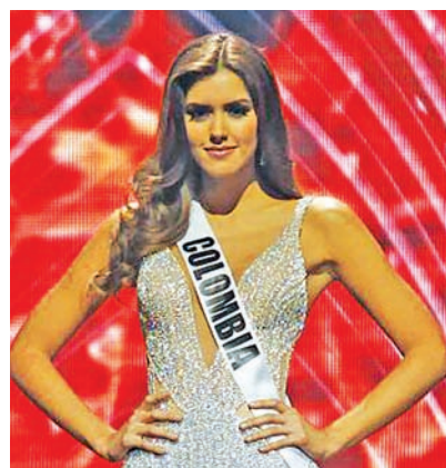
Miss Colombia Paulina Vega poses after being named a top 5 finalist, on her way to be crowned as Miss Universe, at the 63rd Annual Miss Universe Pageant in Miami, Florida on 25 Jan, 2015.

"We salute your willingness to travel to Havana, at this time we invite you to make a visit," added the FARC, which has been holding negotiations with the government in Cuba since late 2012.—Reuters