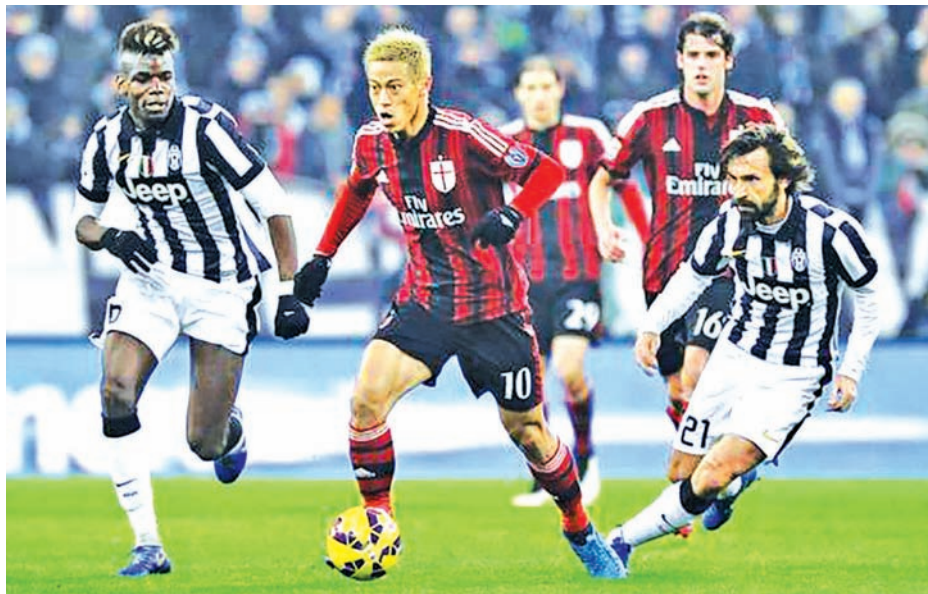
Juventus' Paul Pogba (L) and Andrea Pirlo fight for the ball with AC Milan's Keisuke Honda during their Italian Serie A soccer match at Juventus Stadium in Turin, on 7 Feb, 2015.

“We played a good game but, unfortunately,