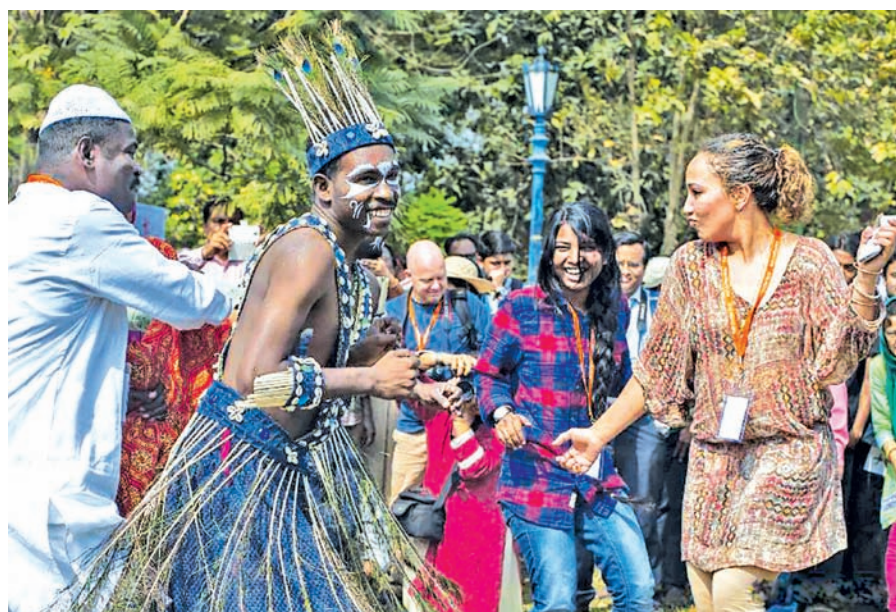
Sufi artists dance in the annual three-day music festival "Sufi Sutra" in Calcutta, capital of eastern Indian state West Bengal on 7 Feb, 2015. More than 100 Sufi singers, dancers and musicians from India, Brazil, Denmark, Egypt, Morocco, Tunisia and Spain celebrated the festival.

Myanma Oil and Gas Enterprise Ph.+95 67- 411097/411206