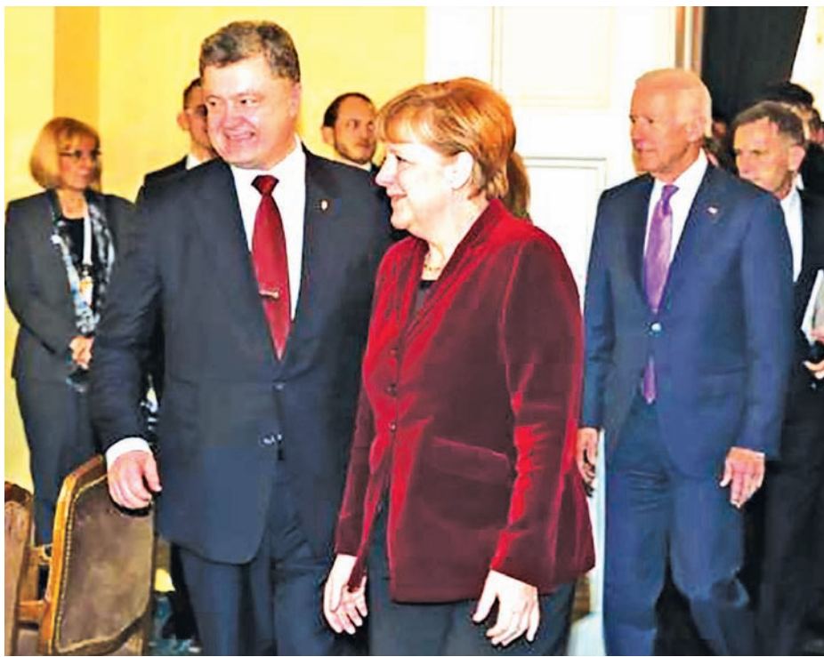
Ukraine's President Petro Poroshenko, German Chancellor Angela Merkel and US Vice President Joe Biden (L-R) arrive for a meeting during the 51st Munich Security Conference at the 'Bayerischer Hof' hotel in Munich on 7 Feb, 2015.

Ukraine's military said on Saturday that pro-Russian separatists had stepped up shelling of government forces and appeared to be amassing troops for new offensives