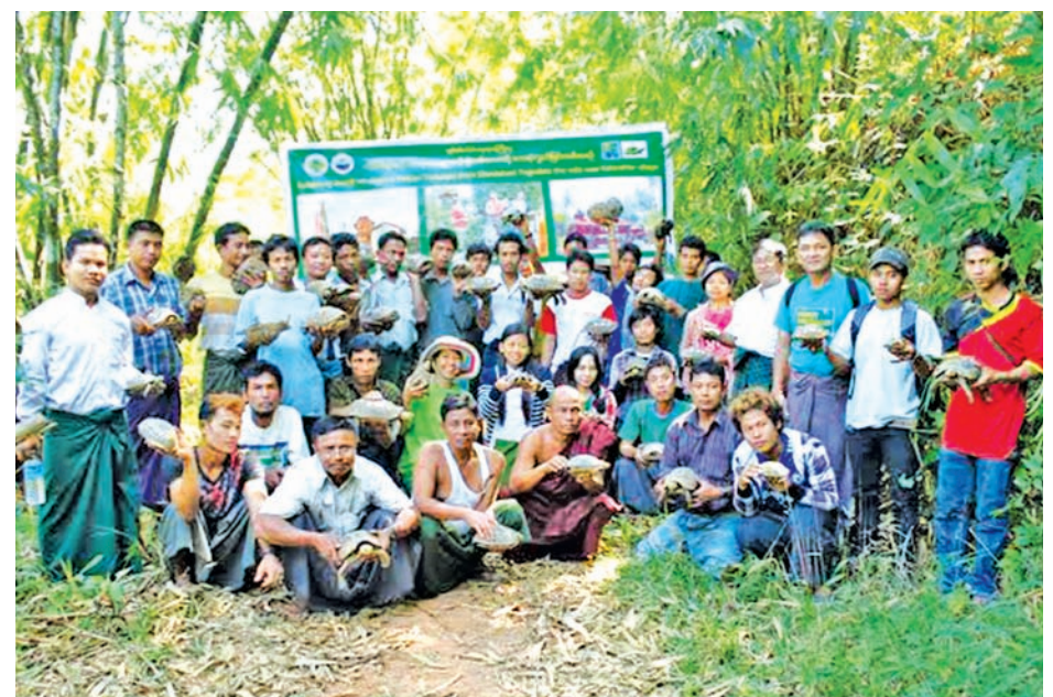
Volunteers ready to release yellow tortoises into water-shed area in Yebyu Township.