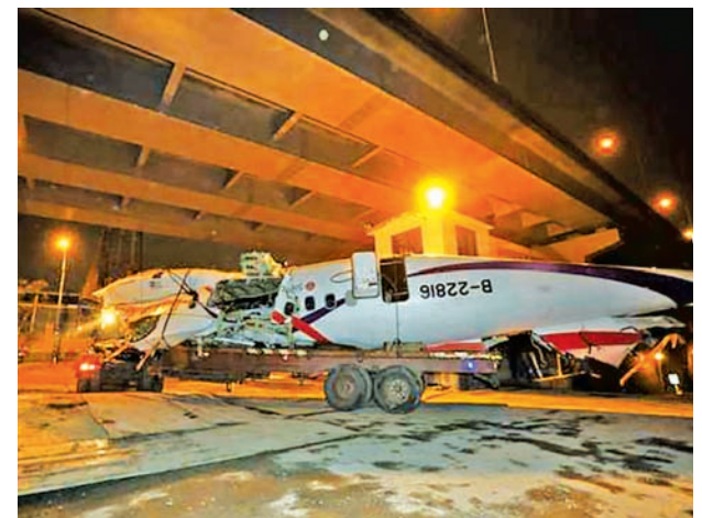
Wreckage of TransAsia Airways plane Flight GE235 is transported on the back of a truck after it crash landed into a river, in New Taipei City, on 5 Feb, 2015.