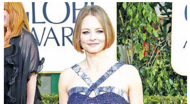
Actress director Jodie Foster feels more women are needed behind the camera in Hollywood to change things.

“There aren’t enough women directors. And hopefully that will change. And perhaps that will change with this next generation.”