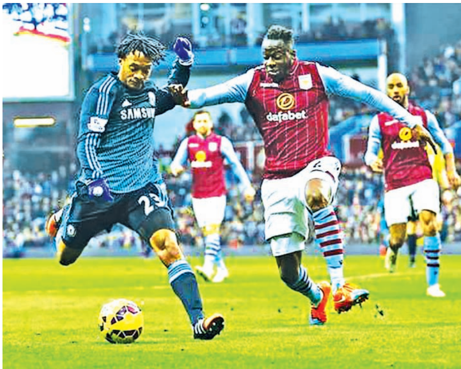
Loic Remy (L) of Chelsea is challenged by Aly Cissokho of Aston Villa during their English Premier League soccer match at Villa Park, Birmingham on 7 Feb, 2015.

Southampton scored deep into stoppage time to beat Queens Park Rangers 1-0 and climb back into third place in an increasingly congested scrap for a