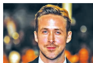
Ryan Gosling has been offered the role opposite Emma Watson.

The ‘Notebook’ star, who made his directing debut with the upcoming ‘Lost River’, has been offered the role opposite