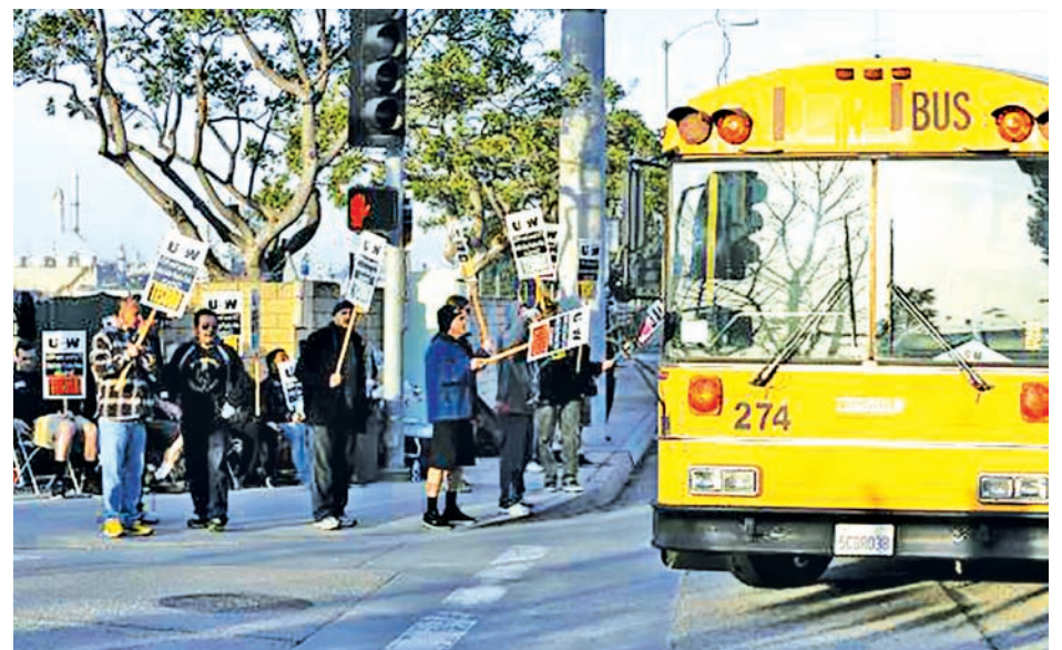
Members of the United Steel Workers union picket the Tesoro refinery in Carson, California on 2 Feb, 2015.