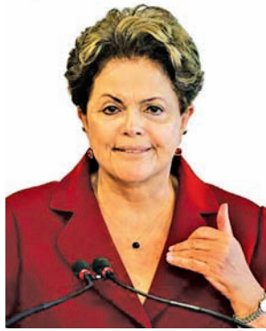
Brazil's President Dilma Rousseff

Rousseff promised during last year's campaign that she would not have to dramatically raise utility prices or slash government spending, but since her October reelection she has done both to try to regain