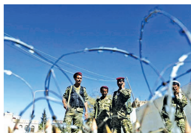
Houthi militiamen and soldiers stand behind a roadblock at the scene of a blast near the republican palace in Sanaa on 7 Feb, 2015.

Parties from across Yemen's political spectrum declined to support the Houthis' moves.