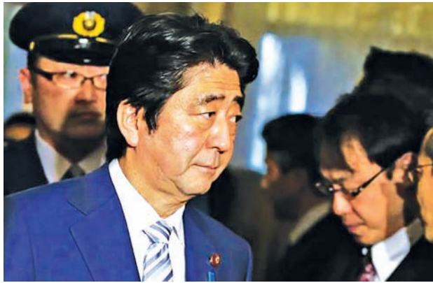
Japan's Prime Minister Shinzo Abe walks to the Lower House of the parliament in Tokyo on 5 Feb, 2015.