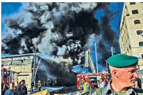
An Israeli border policeman stands guard on the site of a large fire in Wadi Joz, an Arab neighbourhood in East Jerusalem on 7 Feb, 2015. A large fire broke out in the shop here on Saturday, causing two residents minor injuries due to smoke inhalation. The cause of fire is still under investigation.