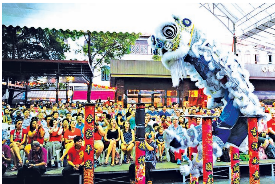
A lion dance troupe participates in a lion dance competition held in Singapore's Chinatown, 7 Feb, 2015. Singapore on Saturday held the 8 th International Lion Dance Competition to celebrate the Chinese Lunar New Year in Singapore's Chinatown.