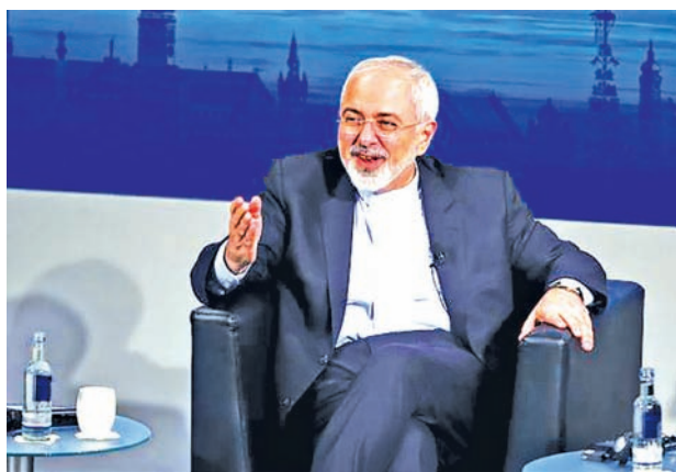
Iran's foreign minister Mohammad Javad Zarif gestures during an open debate at the 51st Munich Security Conference at the 'Bayerischer Hof' hotel in Munich on 8 Feb, 2015.

Russia and China, failed to reach an agreement it