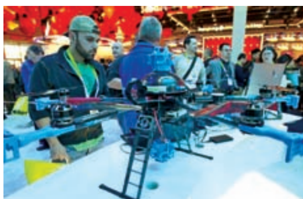
A man looks over a 360Heros drone at the Intel booth during the 2015 International Consumer Electronics Show (CES) in Las Vegas, Nevada, in this file photo taken on 6 Jan, 2015.

The US Federal Aviation Administration is months late in developing small drone regulations. A draft FAA rule, under review by the White House Office of Management and Budget, is expected to be