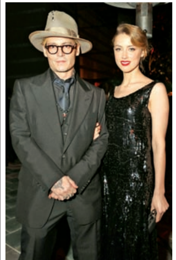
Johnny Depp & Amber Heard

The couple, who have been engaged since late 2012, began dating after Depp split from his longtime partner, French actress Vanessa Paradis. Depp and Paradis are the parents of two children, a boy and a girl. Depp gained fame in the late 1980s after appearing in the popular TV series "21 Jump Street" and later starred in "Edward Scissorhands" and "Alice in Wonderland."