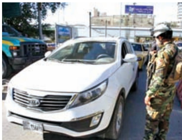
A policeman stands guard at a checkpoint in Baghdad on 5 Feb, 2015.

"Life goes on although Iraq is at war and is aiming to liberate the rest of the country," he said.