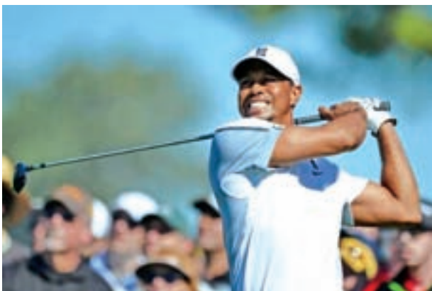
Tiger Woods hits his drive on the 12 th during the first round of the Farmers Insurance Open golf tournament at Torrey Pines Municipal Golf Course, La Jolla, CA, USA on 5 Feb, 2015.