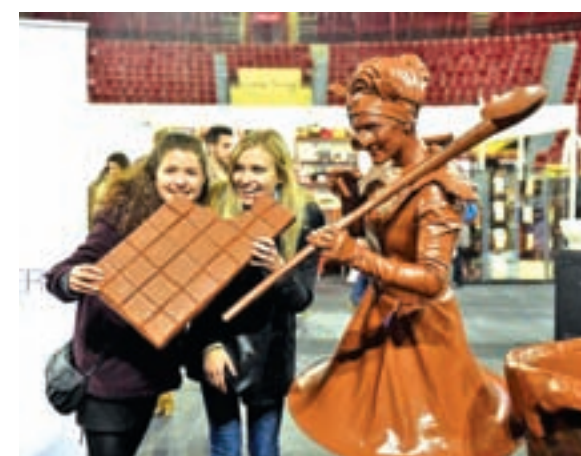
Visitors pose with a chocolate man during a chocolate fair at Campo Pequeno Square in Lisbon, capital of Portugal on 5 Feb, 2015. Lisbon's chocolate fair kicked off Thursday at Campo Pequeno Square in Portuguese capital Lisbon, with dozens of local and international brands displaying tasty and unique cocoa products.