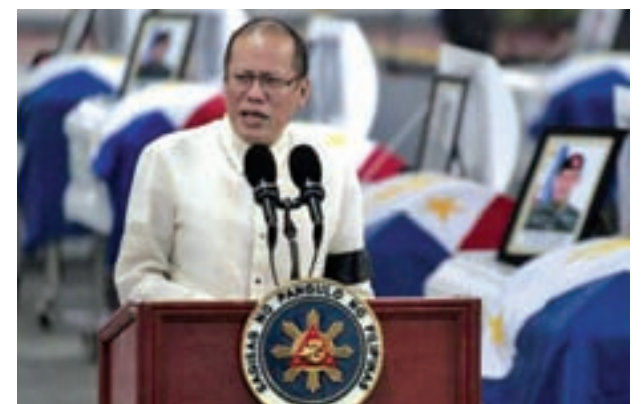
Philippine President Benigno Aquino delivers a speech in front of the caskets of the slain members of the Special Action Force (SAF) who were killed in Sunday's clash with Muslim rebels, during a service inside a police headquarters in Taguig city, south of Manila on 30 Jan, 2015.