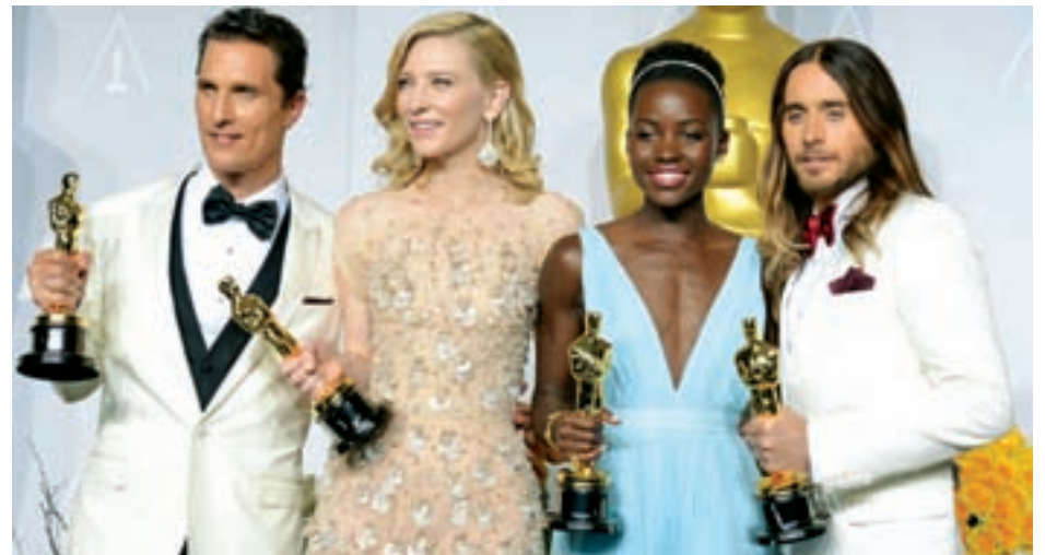
The Academy awards, hosted by Neil Patrick Harris, will take place on 22 February.

Blanchett has been nominated for six Oscars