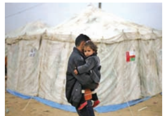
A Palestinian man carries his sister near tents erected by Palestinians whose houses were destroyed by what witnesses said was Israel shelling during a 50-day conflict last summer, east of Khan Younis in the southern Gaza Strip on 27 Jan, 2015.

"No one has said to us that they're not committed