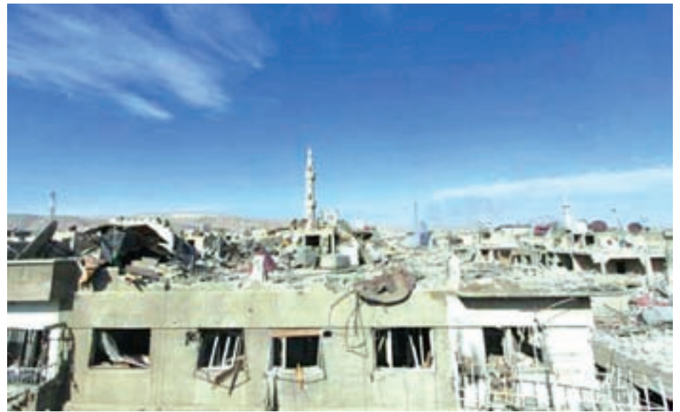
A general view of the destruction after what activists said were at least 20 air strikes by forces loyal to Syria's President Bashar al-Assad in the Douma neighbourhood of Damascus on 5 Feb, 2015.

Islam Army was formed by a merger of rebel factions in 2013 and has received backing from Sau-