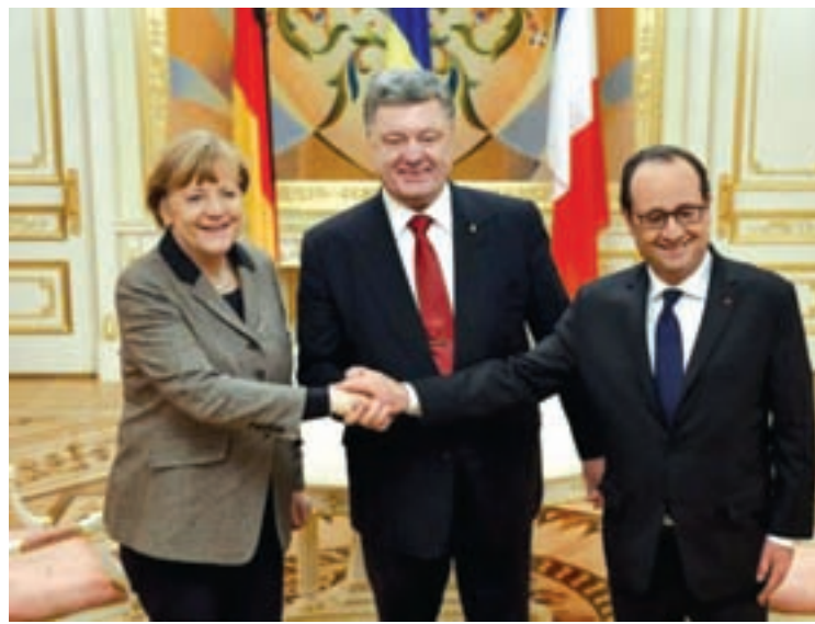
Ukraine's President Petro Poroshenko (C) shakes hands with German Chancellor Angela Merkel and French President Francois Hollande during their meeting in Kiev, on 5 Feb, 2015.

The Ukrainian military reported that two more soldiers had