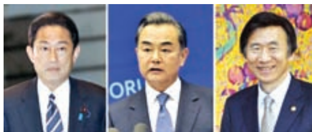
Combined photo shows (from L) Japanese Foreign Minister Fumio Kishida, Chinese Foreign Minister Wang Yi and South Korean Foreign Minister Yun Byung Se. Japanese government sources said on 6 Feb 2015, that the three countries are planning to hold a foreign ministerial meeting in late March.

Foreign Minister Fumio Kishida, Chinese Foreign Minister Wang Yi and South Korean Foreign