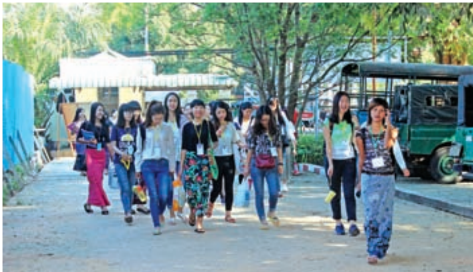
Photo shows a group of foreign students walking out of Yangon University of Foreign Languages, which hosts 290 students from various countries studying the Myanmar language at regular and evening classes.