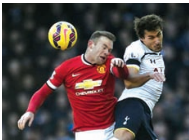
Benjamin Stambouli (R) challenges Wayne Rooney during their English Premier League soccer match at White Hart Lane in London on 28 Dec, 2014.

“I wouldn't say I want him to beat my record because I'm very proud of it but if he does it means he's going well and England are going well so from that re-