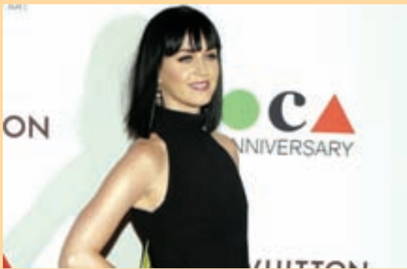
Pop star Katy Perry

LOS ANGELES, 6 Feb — After Kim Kardashian, it is 'Roar' hitmaker Katy Perry's turn to get featured in a new mobile game. Glu, which was behind Kardashian's game, plans to bring Perry's mobile game by later this year.