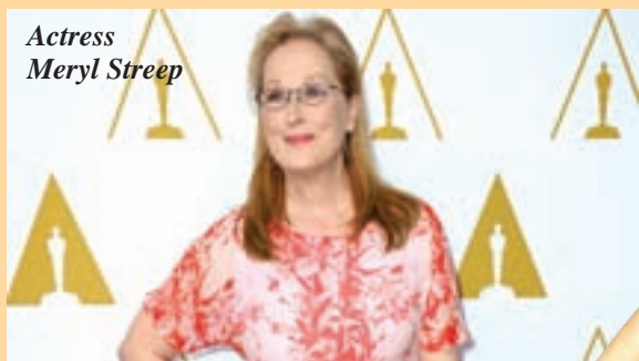
Actress Meryl Streep

LOS ANGELES, 6 Feb —Oscar-winning actress Meryl Streep has turned rocker for her new movie 'Ricki and the Flash'. The first look of the film, which arrived online yesterday, shows the 65-year-old actress playing an electric guitar in a bright top, cool necklace and braids, reported Ace Showbiz.