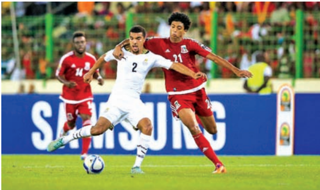
Kwesi Appiah (C) of Ghana vies with Ivan Zarandona Esono (R) of Equatorial Guinea during the semi-final match of Africa Cup of Nations between Ghana and Equatorial Guinea in Malabo, Equatorial Guinea on 5 Feb, 2015. Ghana won 3-0.

With violent home supporters launching missiles and water bottles onto terrified Ghana fans as well as onto the pitch