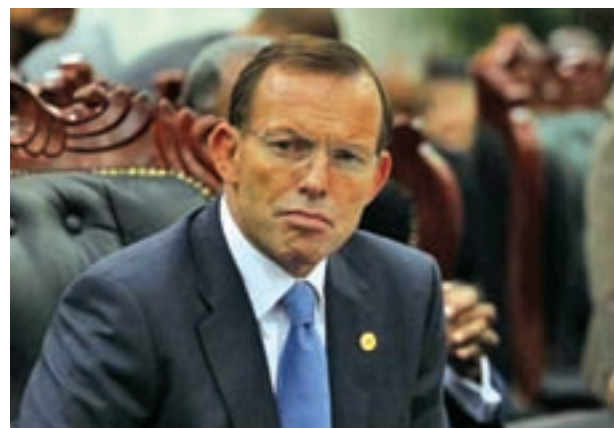
Australia's Prime Minister Tony Abbott

CANBERRA, 6 Feb — Australian Prime Minister Tony Abbott on Friday announced that deputy party leader Julie Bishop will run alongside him in defeating next week's leadership spill motion.