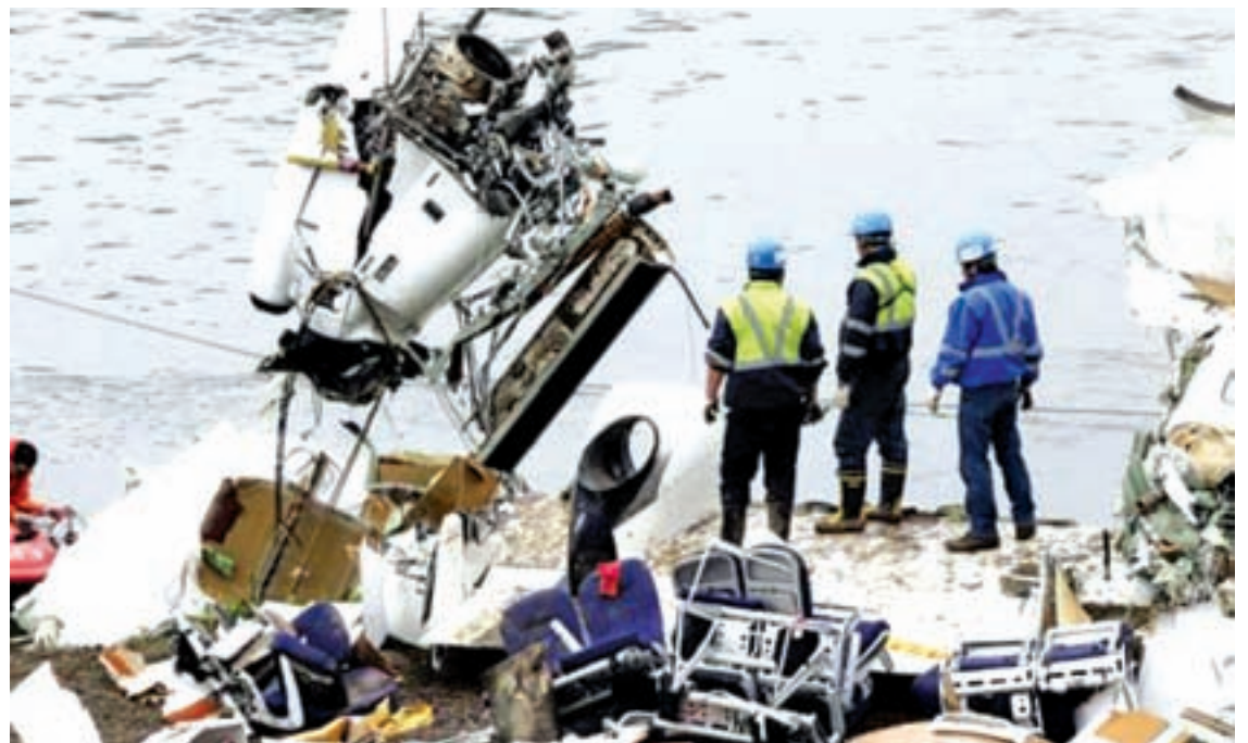
Rescuers look on as part of the wreckage of TransAsia Airways plane Flight GE235 is lifted after it crash landed into a river, in New Taipei City, on 5 Feb, 2015.