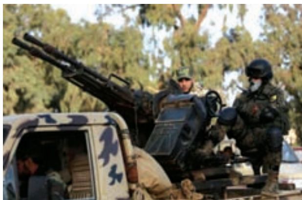
Members of Libyan pro-government forces, which is backed by the locals, look on in an army camp, in Benghazi on 1 Feb, 2015.

Army forces have since been trying to retake the port area and two other districts