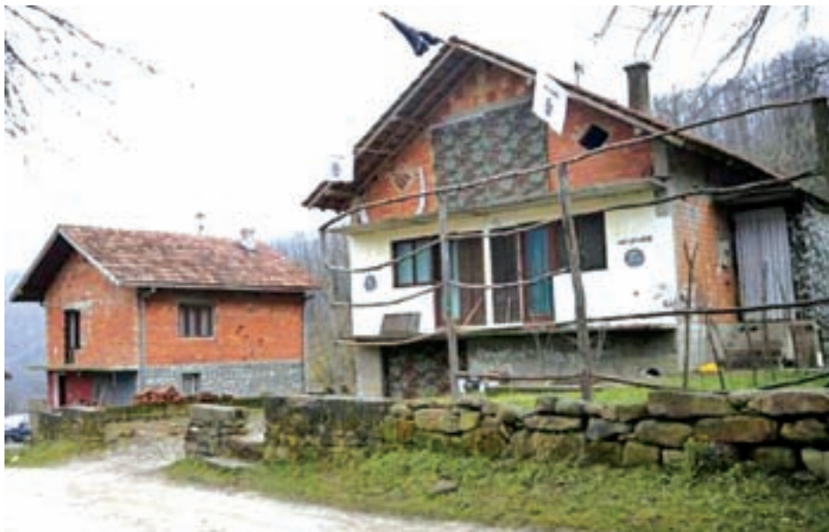
A house in the Bosnian village of Gornja Maoca decorated with Islamic State flags on 4 Feb, 2015.

GORNJA MAOCA, (Bosnia), 6 Feb — Flags and emblems of Islamic State, pictured on Wednesday on houses in a Bosnian village, disappeared on Thursday under threat of action by police wary of the dangers posed by radical Islamists returning from Syria and Iraq.