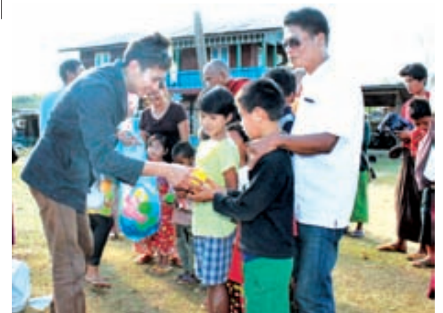
A philanthropist presents gifts to children from a refugee camp.