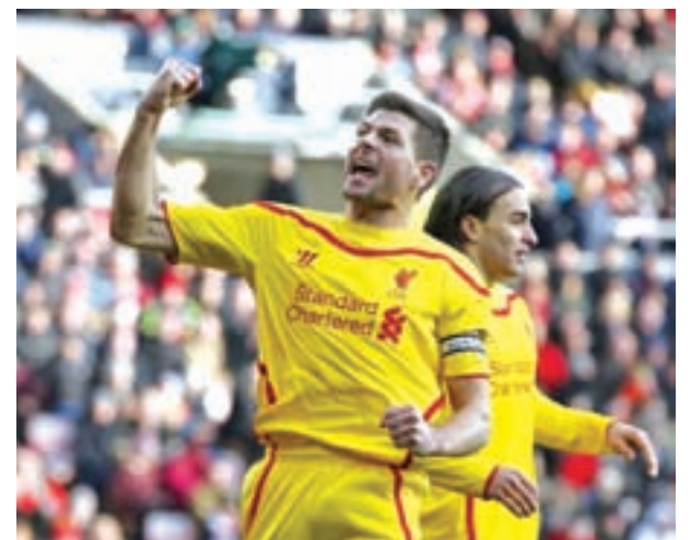
Liverpool's Steven Gerrard celebrates the goal of teammate Lazar Markovic during their English Premier League soccer match against Sunderland at the Stadium of Light in Sunderland, northern England on 10 Jan, 2015.

The midfielder has always enjoyed making a big impact against fierce local rivals Everton, scoring in the 1-1 draw between the sides at Anfield in September and orchestrating many victories during frenetic derby battles since making his