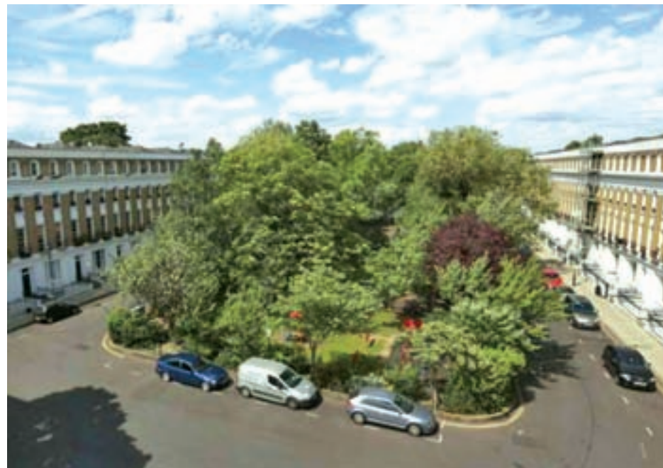
A general view of Milner Square in Islington, north London in this 30 June, 2012.