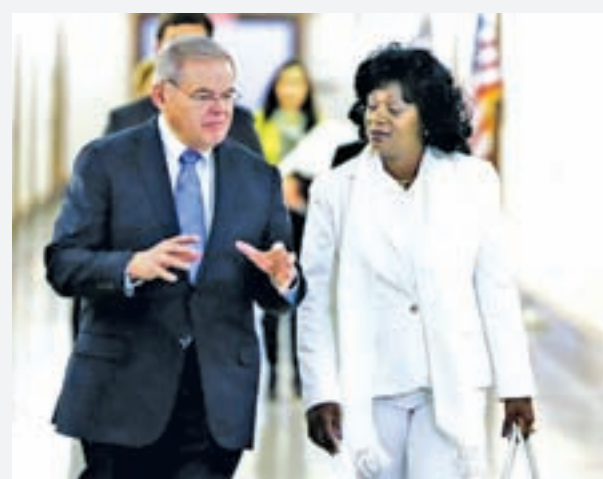
US Senator Robert Menendez (D-NJ) escorts the leader of Cuba’s Ladies in White Berta Solar (R), to the Senate Foreign Relations’ Western Hemisphere Subcommittee hearing on President Barack Obama’s changes to Cuba policy in Washington on 3 Feb, 2015.

WASHINGTON, 4 Feb — Political detentions have declined in Cuba since the 17 December US-Cuban rapproche-