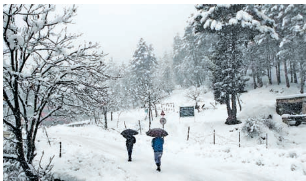
Two Kashmiri men walk in the snow with umbrellas in Tangmarg, about 40 km north of Srinagar, the summer capital of Indian-controlled Kashmir on 3 Feb, 2015. Snowfall in upper reaches and plains of Indian-controlled Kashmir on Tuesday affected air, rail services and closed Srinagar-Jammu national highway, the only road link connecting Kashmir region with the rest of India.