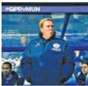
Queens Park Rangers manager Harry Redknapp looks on before their English Premier League soccer match against Manchester United, at Loftus Road in London on 17 Jan, 2015.

LONDON, 4 Feb — Harry Redknapp resigned as manager of struggling Queens Park Rangers on Tuesday with the 67-year-old citing knee problems