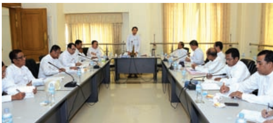
Deputy Speaker of Pyidaungsu Hluttaw and Pyithu Hluttaw U Nanda Kyaw Swa speaking at finalization of bills.

NAY PYI TAW, 4 Feb—Pyithu Hluttaw Bill Committee discussed bills on the interfaith marriage, the reli-