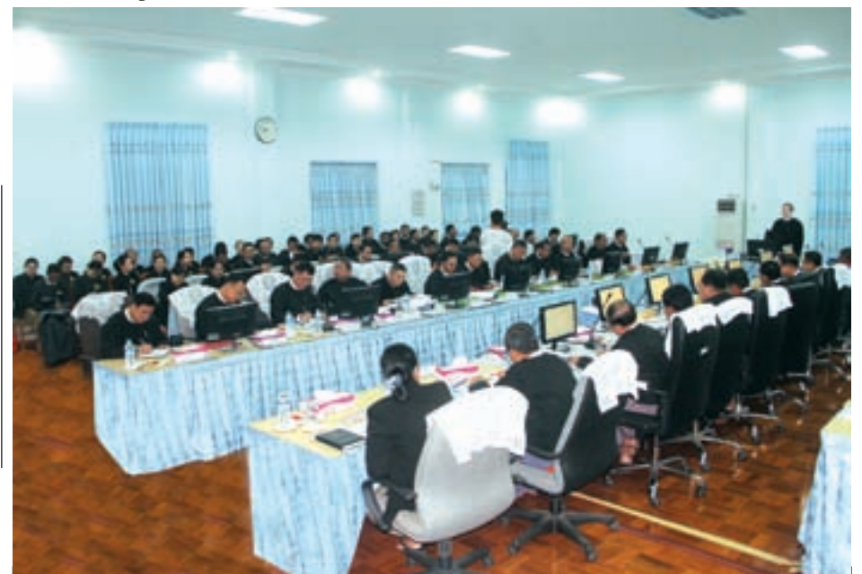
Chief Justice of the Union U Tun Tun Oo highlights role of judicial pillar without bias and any interference.—MNA