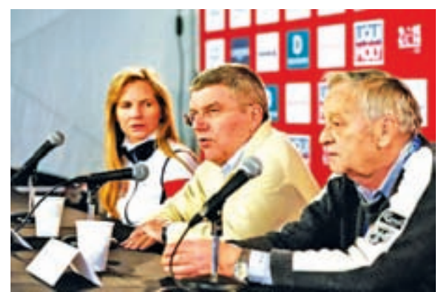
IOC president Thomas Bach (middle) speaks during a Press conference prior to the women's Super G in the FIS alpine skiing world championships at Raptor Racecourse.

Bach has made it clear the International Olympic Committee will not be moving the 2022 Winter Games from its traditional February time slot to avoid a clash. FIFA is expected to make a final decision on the 2022 World Cup dates in March. But Bach said that he received a com-