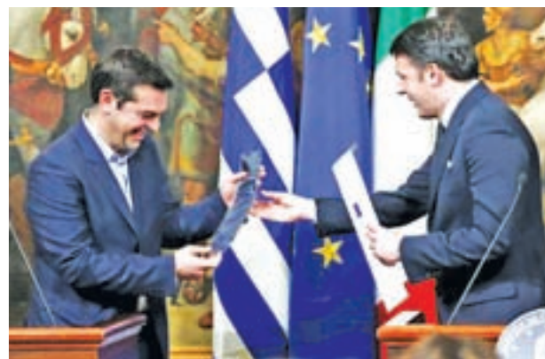
Italian Prime Minister Matteo Renzi (R) gives a tie as a present to his Greek counterpart Alexis Tsipras during a news conference at Chigi palace in Rome on 3 Feb, 2015.

A German DIW think-tank paper supported growth-linked bonds because they would lower the likelihood of a Greek default, stabilise the debt ratio even if growth was weak, provide an incentive for reforms and, if growth took off, they would make more money for the euro zone lenders.—Reuters