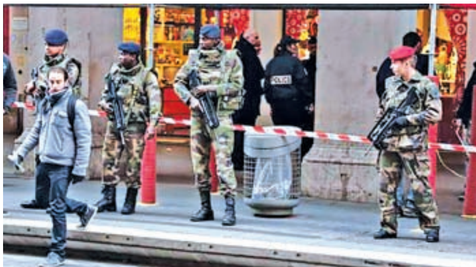
French soldiers stand guard outside a Jewish Community centre, where two French soldiers were attacked and wounded in a knife attack in Nice on 3 Feb, 2015.