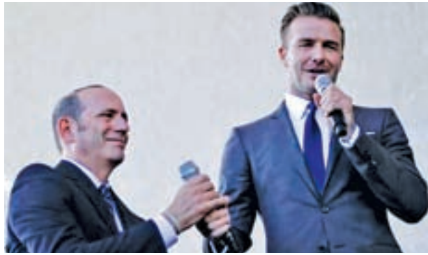
Don Garber (L), Major League Soccer (MLS) commissioner, exchanges working microphones with David Beckham as Beckham discusses matters related to the ownership position he has with a proposed MLS expansion team that could play in Miami, at a news conference in Miami, Florida on 5 Feb, 2014.

MIAMI, 4 Feb — More than a year after David Beckham swooped into Miami, the retired English football star has not yet secured a spot for his planned Major League Soccer team, but he and his partners are still searching, a spokesman said on Tuesday. "The Miami Beckham United team is actively looking at four or five