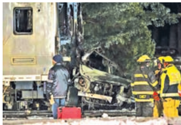
A car sits crushed into the front of a Metropolitan Transportation Authority (MTA) Metro North Railroad commuter train near the town of Valhalla, New York on 3 Feb, 2015.—REUTERS

Earlier that year two Metro-North passenger trains collided between Fairfield and Bridgeport, Connecticut, injuring more than 70 people and halting services.—Reuters