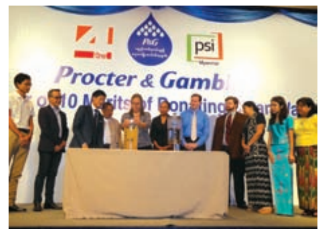
Officials from P&G Co, PSI, famous supermarkets are tasting P&G water purification system at opening ceremony of water donation campaign in Myanmar.

Over the past decade, P&G has provided nearly 6 billion liters of potable drinking water to remote communities around the world. The company donated 10 million liters to Myanmar families through World Vision (Myanmar) in 2014, according to the organizer.— GNLM