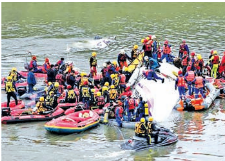
Rescuers carry out rescue operations after a TransAsia plane crashed into a river in New Taipei City, on 4 Feb, 2015.

The plane missed apartment buildings by metres, though it was not clear if that was luck or whether the pilot was aiming for the river. Footage showed a van skidding to a halt on the damaged overpass after barely missing the plane's wing, with small pieces of the aircraft scattered along the road.