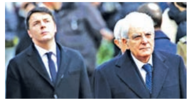
Italy's newly elected president Sergio Mattarella (R) and Prime Minister Matteo Renzi pay their respects at the Unknown Soldier's monument in central Rome, on 3 Feb, 2015.

On the eve of a visit to Kiev on Thursday by US Secretary of State John Kerry, the stakes are rising, with the rebels and Kiev's forces mobilizing more forces.