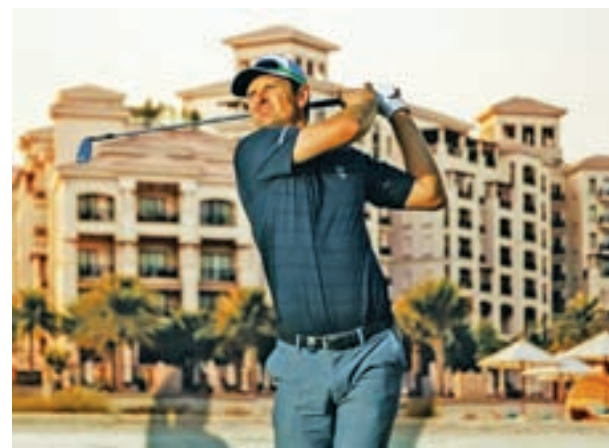
Britain's Justin Rose tees off on the 12th hole during the Abu Dhabi Golf championship on 6 Jan, 2015.

And while seven-times event winner Woods and local boy Phil Mickelson