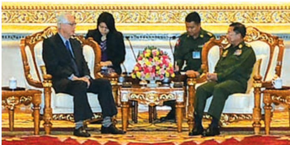
Senior General Min Aung Hlaing holds talks with Emeritus Senior Minister Goh Chok Tong of Singapore.

NAY PYI TAW, 4 Feb— The Tatmadaw is cooperating with the government for stability, the rule of law and ceasefire with ethnic armed groups, Commander-in-Chief of Defence Services Senior General Min Aung Hlaing told Emeritus Senior Minister Goh Chok Tong of Singapore at the Zeyathiri Beikman in Nay Pyi Taw on Wednesday.