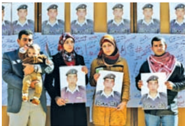
Relatives of Islamic State captive Jordanian pilot Muath al-Kasaesbeh hold pictures of him as they join students during a rally calling for his release, at Jordan University in Amman on 3 Feb, 2015.

Authorities also executed a senior al-Qaeda