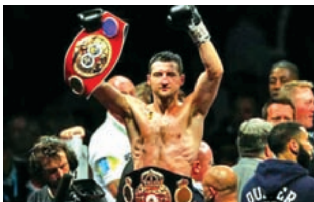
Carl Froch of Britain celebrates with the championship belt after defeating compatriot George Groves in their WBA and IBF Super Middleweight World Championship title fight at Wembley Arena in London on 31 May, 2014.

LONDON, 4 Feb — Carl Froch has relinquished his IBF super-middleweight belt as the Briton recovers from the elbow injury that forced him to miss out on a fight with Julio Cesar Chavez Jr.