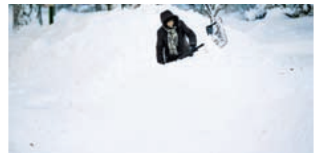
A woman shovels snow out a driveway in the Chicago suburb of Wilmette, Illinois on 2 Feb, 2015.