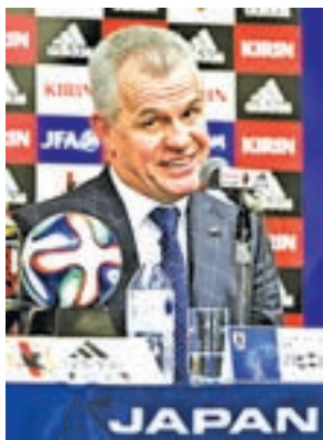
Photo taken in August 2014 shows Javier Aguirre attending a Press conference in Tokyo to assume the post of Japan coach. The Japan Football Association announced on 3 Feb, 2015, that Aguirre has been sacked for his alleged involvement in a 2011 match-fixing scandal in Spain.

TOKYO, 4 Feb — Japan national team players have expressed sadness at the departure of coach Javier Aguirre after just 10 games in charge of the former Asian champions.