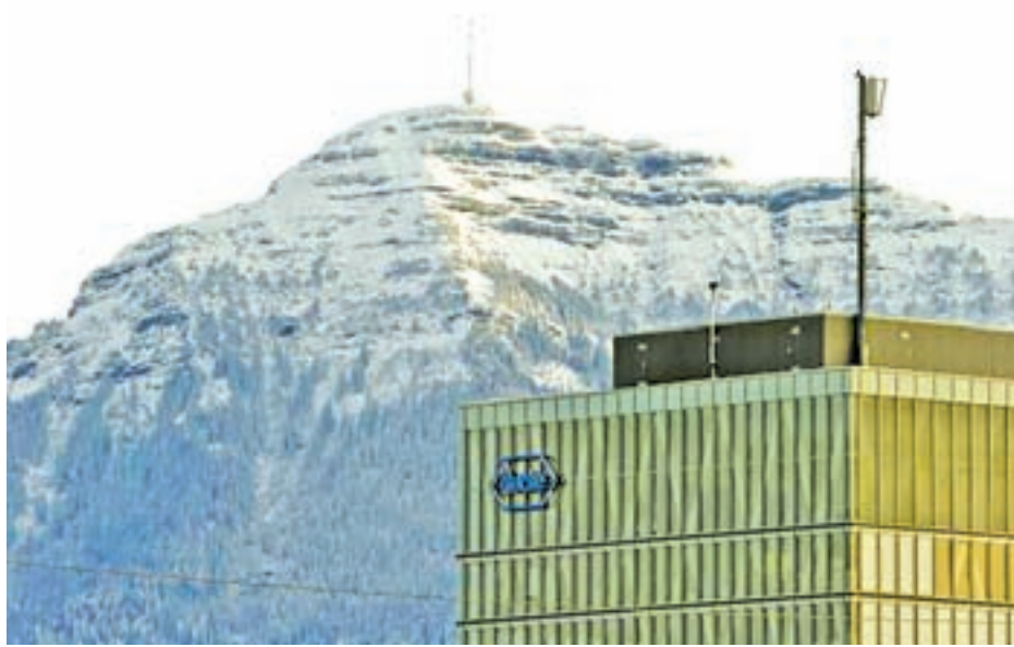
An office building of Swiss drugmaker Roche is seen in front of Mount Rigi in the central Swiss village of Rotkreuz on 28 Jan, 2015.