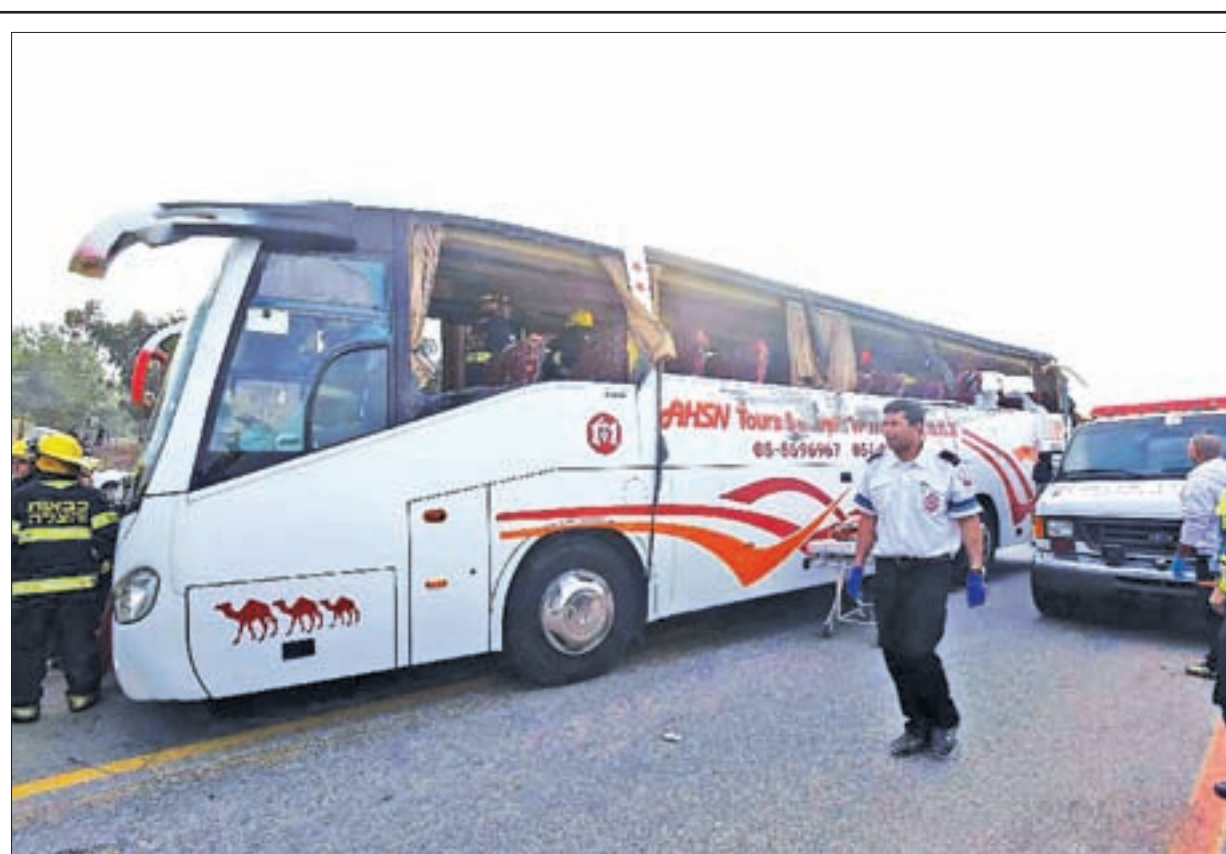
Damaged bus is seen on the site where a massive accident occurred near the Lehavim Junction, a section of Road 31 in Negev desert, southern Israel, on 3 Feb, 2015. At least eight people were killed and dozens more injured in a massive accident in southern Israel on Tuesday, emergency services said. Police spokesperson said the accident happened as a bus full of Arab Bedouins passengers from villages in southern Israel's Negev desert, collided with a truck that was carrying a tractor.