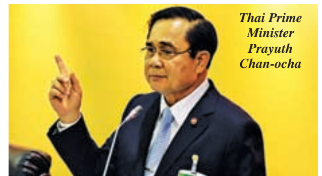
Thai Prime Minister Prayuth Chan-ocha

BANGKOK, 4 Feb — Thai Prime Minister Prayuth Chan-ocha said on Wednesday that a general election planned for early 2016 to return Thailand to democracy would go ahead.