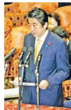
Prime Minister Shinzo Abe

Foreign Minister Fumio Kishida told the same parliamentary session that