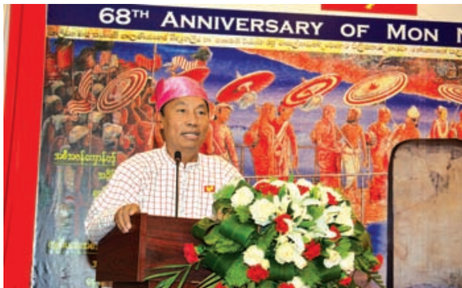
Speaker of Pyidaungsu Hluttaw and Pyithu Hluttaw Thura U Shwe Mann speaking at 68th Anniversary Mon National Day.