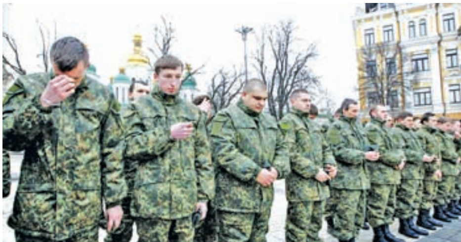
Members of the newly created Ukrainian interior ministry battalion "Saint Maria" pray during a ceremony before heading to military training, in front of St Sophia Cathedral, in Kiev on 3 Feb, 2015.

MOSCOW/ KIEV, 4 Feb — By considering giving weapons to Kiev, the United States could be contemplating a risky venture which advocates say would help end the conflict in Ukraine but opponents warn might fan the flames of war.