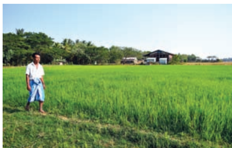
Farmers in Ayeyawady Delta have pinned high hopes on the second crop for extra money.

"We cannot use draught cattle again in the dry-season because they worked for our first crop in rainy season and if we use them again in dry season again, they can die from over-work" said Kyaw Soe, one of the farmers in Yay Win Chauk Village. "We cannot afford to pay compensation for hired cattle if they die, and we have no harvester and only two power-tillers in our village."—GNLM