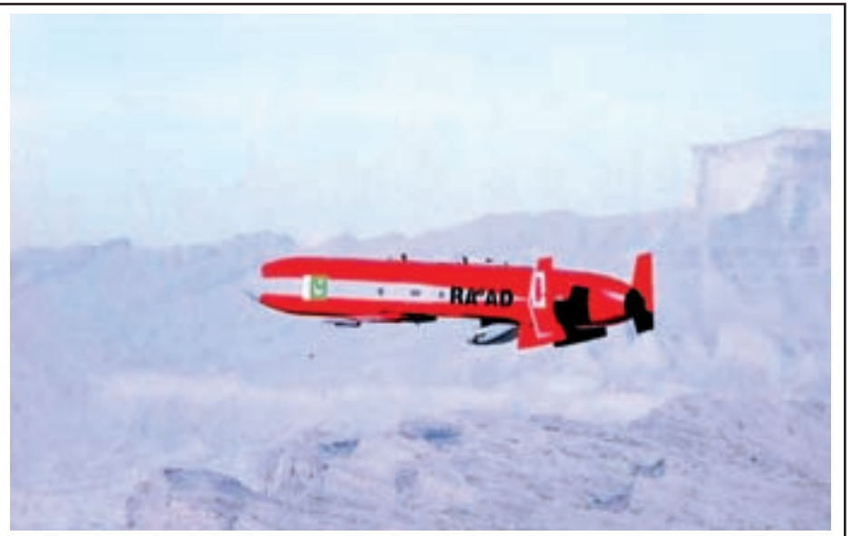
Photo provided by the Pakistan army's Inter-Services Public Relations (ISPR) office on 2 Feb, 2015 shows the Air Launched Cruise Missile (ALCM) "Ra'ad" being launched from an undisclosed location in Pakistan. Pakistan on Monday conducted a successful flight test of an indigenously developed cruise missile that enables the country to achieve strategic stand-off capability on land and at sea, the military said.

"Mr Chairman, my country is impatient," she said.—Reuters