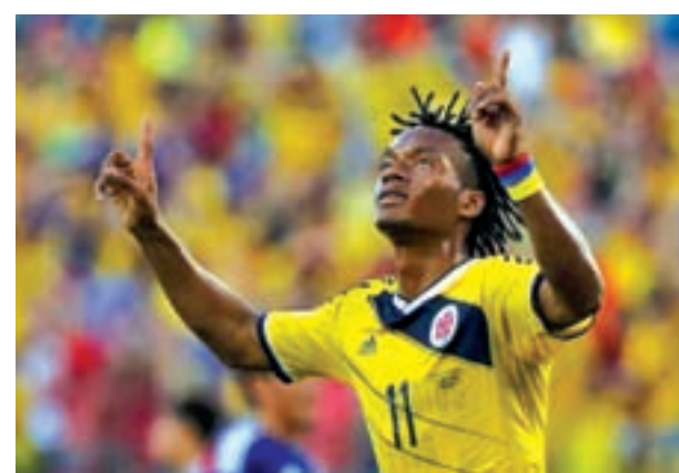
Colombia's Juan Cuadrado celebrates after scoring a penalty goal against Japan during their 2014 World Cup Group C soccer match at the Pantanal arena in Cuiaba on 24 June, 2014.