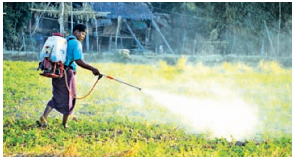
A farmer sprays tonic on bean plants in Kawa.