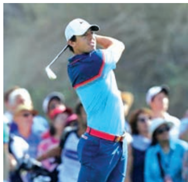
Rory McIlroy of Northern Ireland in action during the final round of the Dubai Desert Classic on 1 Feb, 2015.