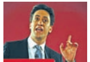
Britain's opposition Labour Party leader Ed Miliband gestures as he launches his party's 2015 election campaign, at the Lowry Theatre in Salford, north west England on 5 Jan, 2015.

The Times said that when plugged into a mod-