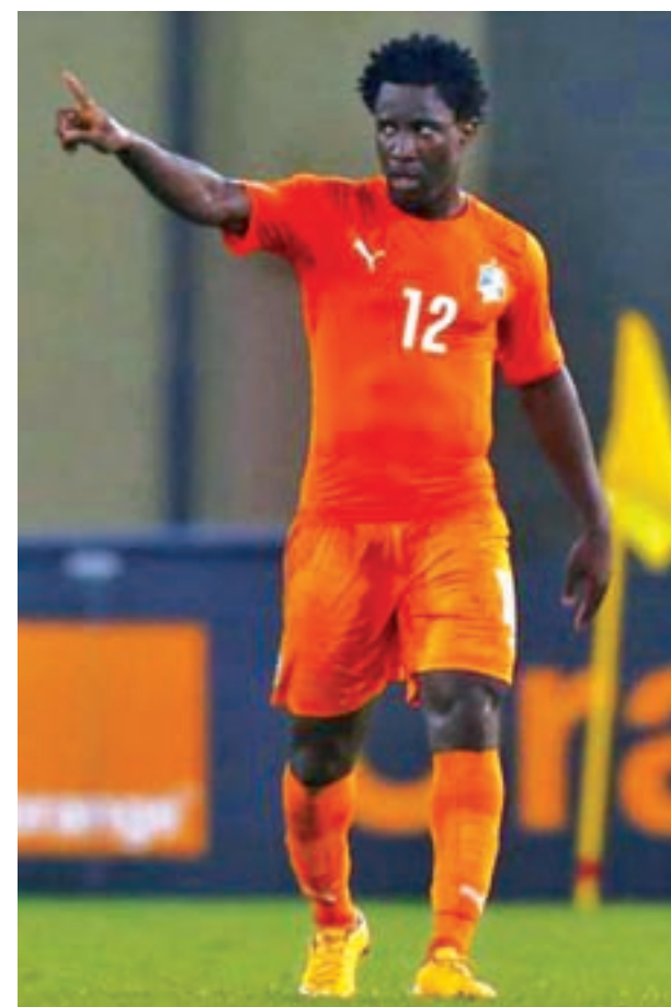
Ivory Coast's Wilfried Bony celebrates his second goal during their quarter-final soccer match of the 2015 African Cup of Nations against Algeria in Malabo on 1 Feb, 2015.

"Things are much easier when you have players