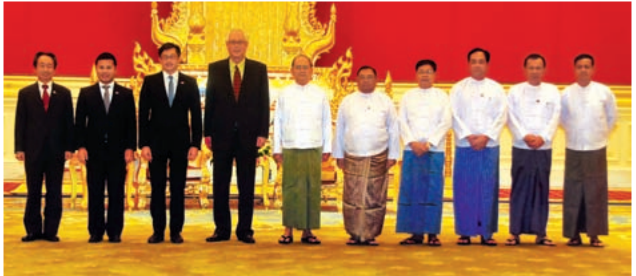
President U Thein Sein poses for documentary photo with Singaporean Emeritus Senior Minister Goh Chok Tong.

NAY PYI TAW, 3 Feb—President U Thein Sein received Singaporean Emeritus Senior Minister Goh Chok Tong and party at