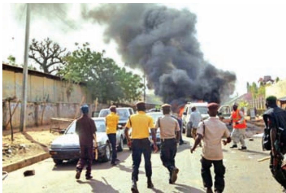
Security personnel rush towards the site of a car bomb explosion near a stadium in the northeastern Nigerian city of Gombe on 2 Feb, 2015.

BAUCHI, (Nigeria), 3 Feb — A bomb blast that went off just minutes after Nigeria's President Goodluck Jonathan left an election