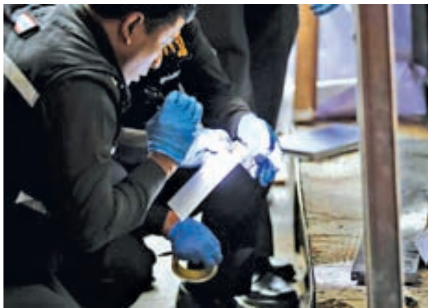
Police forensic experts work at the site of a blast on an elevated walkway linking the overhead rail line to the mall in central Bangkok on 2 Feb, 2015.