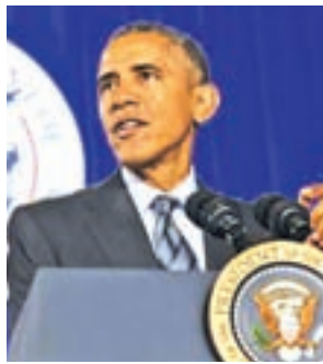
US President Barack Obama speaks about the FY2016 budget at the Department of Homeland Security in Washington on 2 Feb, 2015.

events of the past year only reinforce the need to re-source DoD (Department of Defence) at the president's requested funding level as opposed to current law," the Pentagon said in a statement.