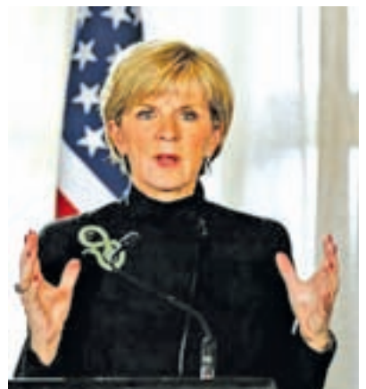
Australian Foreign Minister Julie Bishop

SYDNEY, 3 Feb — Australian Prime Minister Tony Abbott sought a commitment from deputy party leader Julie Bishop that she would not challenge him, Sky News reported on Tuesday, a promise that the Foreign Minister refused to give.