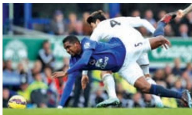
Samuel Eto'o (L) is challenged by Ki Sung-yueng during their English Premier League soccer match at Goodison Park in Liverpool, northern England on 1 Nov, 2014.

Mihajlovic, a notoriously tough taskmaster who has revived Sampdoria's fortunes in his 15 months in charge, said he was ashamed by