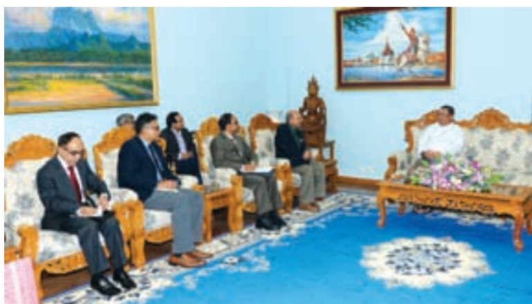
Union Minister U Wunna Maung Lwin receives Dr Tawfiq-E-Elahi Chowdhury, Hon'ble Energy Adviser to the Bangladeshi PM.—MNA

They discussed strengthening bilateral diplomatic relations and ways and means to promote hydropower and gas sector coordination between the two countries.—MNA