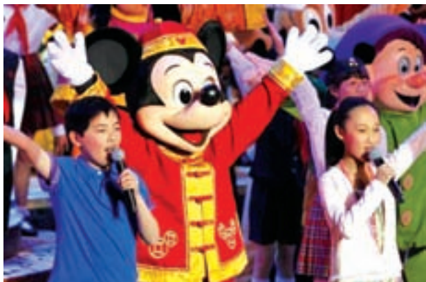
Dancers perform during the groundbreaking ceremony of Shanghai Disneyland in Pudong on 8 April, 2011.

NEW YORK, 3 Feb — Walt Disney Co's theme park in Shanghai, which was previously slated to open at the end of the year, has been pushed to the first half of 2016, the Wall Street Journal reported, citing people close to the project.