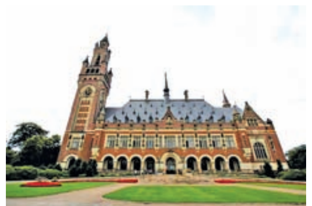
The Peace Palace, which houses The International Court of Justice, is seen in The Hague on 22 July, 2010.

"The strongest arguments they have to say they are justifying their wars is