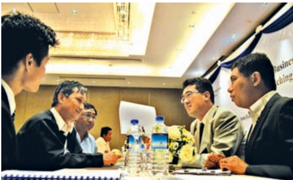
Participants in an agriculture business-matching seminar are in deep conversation for better understanding of the Myanmar agricultural machinery market, at Chatrium Hotel in Yangon.