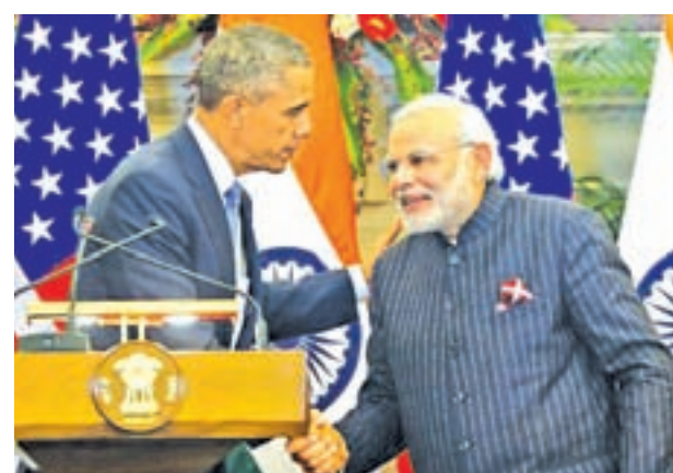
US President Barack Obama and India’s Prime Minister Narendra Modi (R) shake hands after giving opening statements during a at Hyderabad House in New Delhi on 25 Jan, 2015.

New Delhi also proposed setting up an insurance pool with a liability cap of 15 billion rupees ($244 million). The state-run Nuclear Power Corporation of India would pay premiums to cover its liability. Suppliers would take out separate insurance against their secondary liability — which could not exceed that of the operator — at a “fraction” of the cost. India must still ratify the International Atomic