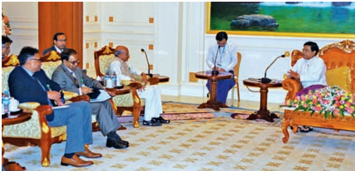
Vice President U Nyan Tun receives Dr. Tawfiq-E-Elahi Chowdhury, Hon'ble Energy Adviser to the Prime Minister of Bangladesh.

NAY PYI TAW, 3 Feb—Vice President U Nyan Tun received Dr. Tawfiq-E-Elahi Chowdhury, Hon'ble Energy Adviser to the Prime Minister of Bangladesh and