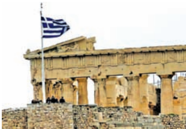
Tourists stand near the temple of Parthenon atop the ancient site of the Athens Acropolis on a cold and windy day on 30 Jan, 2015.

PARIS/ATHENS, 2 Feb — Greece’s leftist government began its drive to persuade a sceptical Europe to accept a new debt agreement on Sunday while it starts to roll back on austerity measures imposed under its existing bailout agreement.