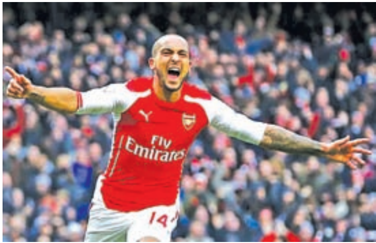
Arsenal's Theo Walcott celebrates his goal against Aston Villa during their English Premier League soccer match at the Emirates Stadium in London, on 1 Feb, 2015.

LONDON, 2 Feb — Arsenal climbed above rivals Tottenham Hotspur into fifth in the Premier League and inflicted more misery on a goal-shy Aston Villa with an emphatic 5-0 victory on Sunday that fuelled their top-four hopes.