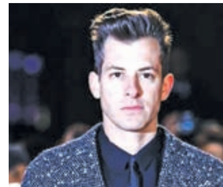
Singer Mark Ronson arrives for the UK premiere of ‘Mortdecai’ at Leicester Square in London on 19 Jan, 2015.

Ronson could not hold on to number one position in the album charts, where Trainor’s new entry “Title” earned her a chart-topping debut studio album. Ed Sheeran’s “X” continued its long spell in the top five, charting in second place ahead of Ronson’s “Uptown Special”.—Reuters