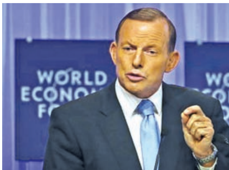
Australia’s Prime Minister Tony Abbott

SYDNEY, 2 Feb — Australian Prime Minister Tony Abbott on Monday dropped a signature plan for paid parental leave and promised a more consultative approach on economic and security problems, seeking to stave off mounting criticism of his leadership.