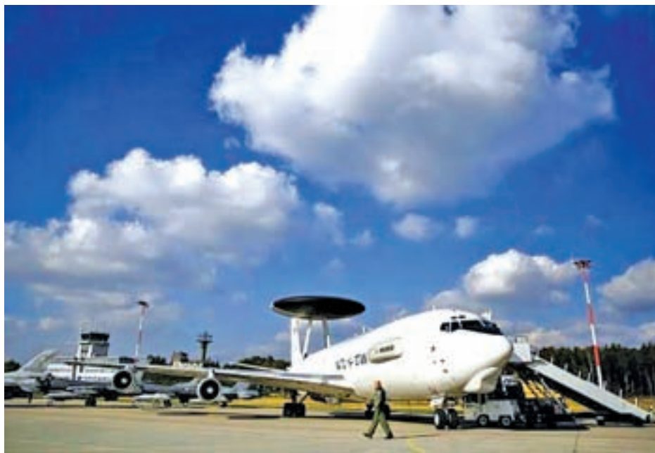
An AWACS aircraft is seen on the tarmac during a visit of new NATO Secretary-General Jens Stoltenberg of Norway (not pictured) at Lask air base on 6 Oct, 2014.

Palomeros said the programme would be a test case for many NATO pri-