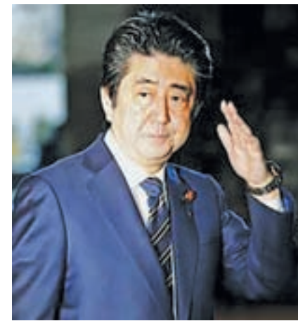
Japanese Prime Minister Shinzo Abe enters his office in Tokyo on 2 Feb, 2015, a day after Islamic State posted online a video purporting to show the killing of a Japanese hostage.

put high priority on seeking the release of Goto, who was captured when he went to Syria to try to seek Yukawa's release. Yukawa was seized by militants in August after going to Syria to launch a security company.