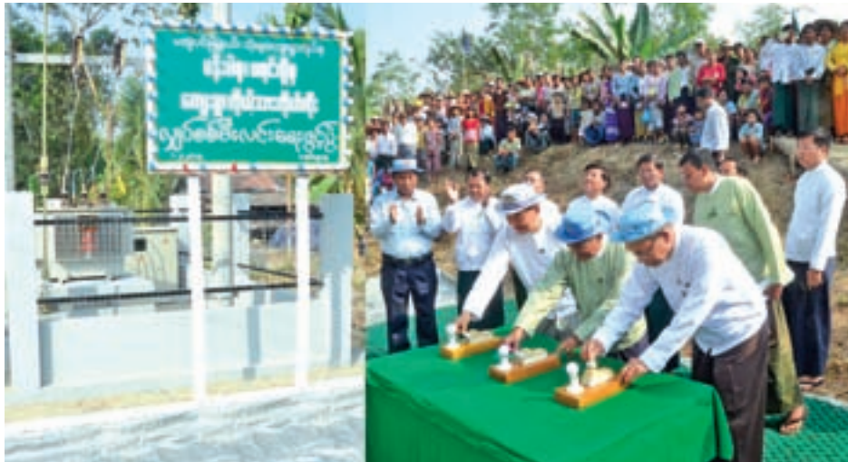
Union Minister U Thein Nyunt switches on transformer to supply electricity to local people in rural areas of Maubin Township.—MNA

Thongwa, Wadaw, Pabesu and Bayingyisu villages in Maubin Township on 1 February. The union minister presented books and publications and a light fire engine to Doh Ywa library in Kyaungywa Model Village. At the electrification