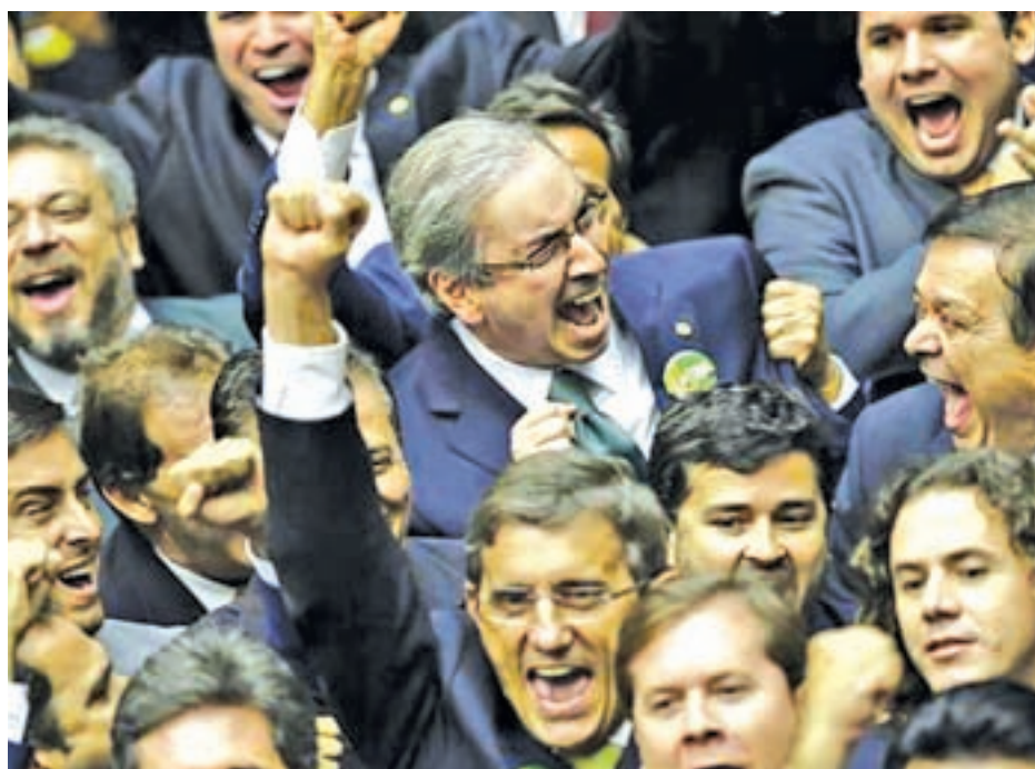
Deputy Eduardo Cunha (C) reacts after being elected as the President of the Chamber of Deputies during a session in the plenary of the House of Representatives in Brasilia on 1 Feb, 2015.

European Union foreign ministers agreed on Thursday to extend for another six months economic sanctions against Russia that had been due to expire soon. Washington has promised to tighten its own sanctions, which have helped feed an economic crisis in Russia.—Reuters