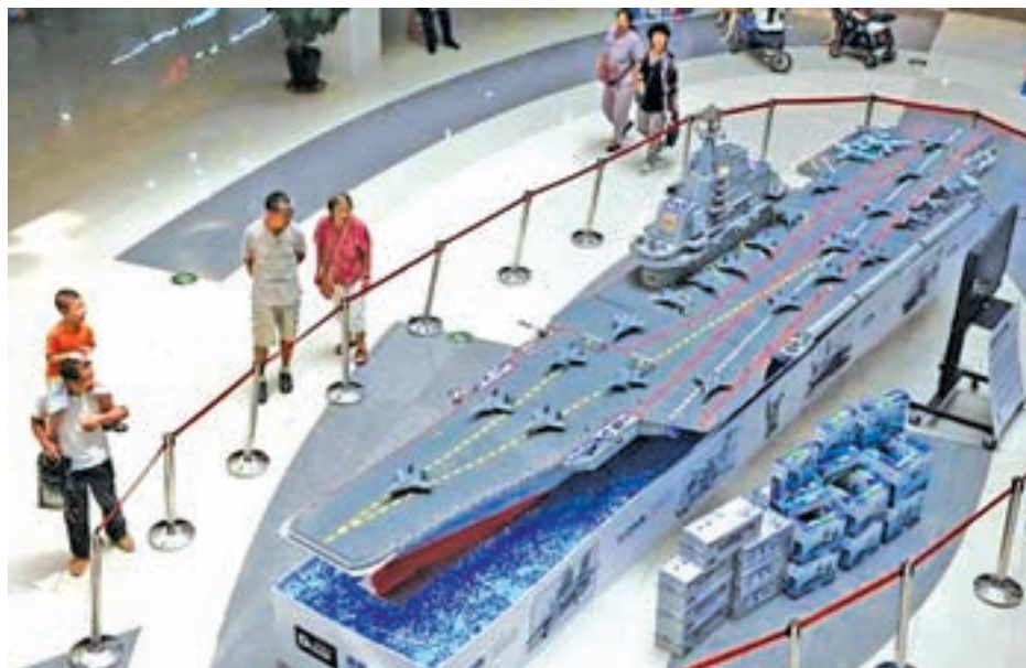
People look at a replica of Chinese aircraft carrier “Liaoning” made of toy building blocks, on display at a shopping mall in Shenyang, Liaoning Province on 10 Aug, 2014.

Chinese military analysts said the reports were