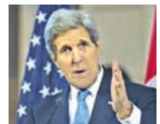
US Secretary of State John Kerry addresses the media in Boston, Massachusetts on 31 Jan, 2015.

Kerry will visit Kiev on Thursday for talks with President Petro Poroshenko and other Ukrainian officials. Obama voiced concern last week about renewed fighting between Russian-backed separatist and government forces in eastern Ukraine and said the United States was considering all options short of military action to isolate Russia. The Times said eight former senior US officials would issue an independent report on Monday urging Washington to send