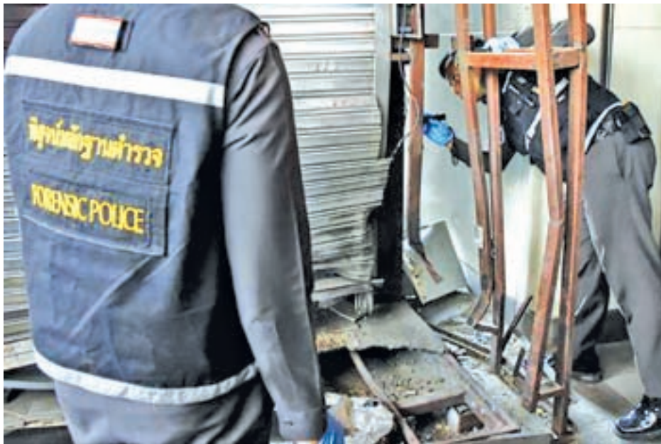
Police forensic experts work at the site of a blast on an elevated walkway linking the overhead rail line to the mall in central Bangkok on 2 Feb, 2015.

BANGKOK, 2 Feb — Thai Prime Minister Prayuth Chan-ocha ordered security to be tightened in Bangkok on Monday after two small bombs rattled a luxury shopping mall and stoked tension in a city under martial law since a coup in May.