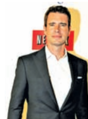
Scott Foley’s wife Marika Dominczyk shared on Twitter a picture of her husband wearing a cast on his foot.

LOS ANGELES, 2 Feb — Actor Scott Foley has suffered an injury during the filming of political thriller TV series ‘Scandal’. The 42-year-old actor’s wife Marika Dominczyk shared on Twitter a picture of her husband wearing a cast on his foot, reported Ace Showbiz. “Btw- aftermath of running with no shoes. On the street #Scandal @scottkfoley #dasboot #foleyfangirls.”, she captioned the photo.