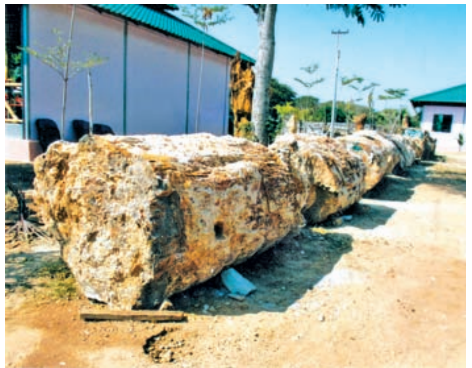
Petrified wood seen in Natogyi Township.