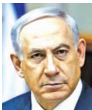
Israel's Prime Minister Benjamin Netanyahu attends the weekly cabinet meeting at his office in Jerusalem, on 1 Feb, 2015.

The soldiers and peacekeeper died when guerrillas fired rockets at unmarked Israeli vehicles at the frontier, and Israel responded with artillery shells and an air strike.