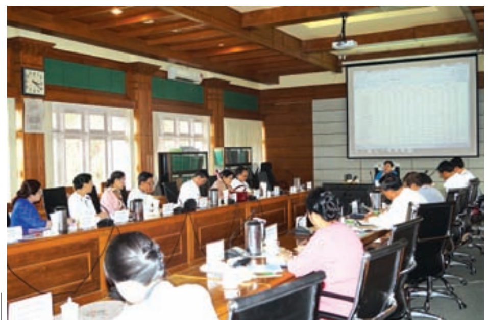
Union Minister for Education Dr Daw Khin San Yi highlights rules of interviews for candidates of President's scholarship award.

YANGON, 2 Feb — Union Minister for Education Dr Daw Khin San Yi attended the coordination meeting on holding the interview for candidates of President's scholarship award at the hall of Higher Education Department (Lower Myanmar), here, on Monday. A total of 142 candidates who secured the highest points in Aptis test are to join the interview in Yangon at 9 am on 17 February.