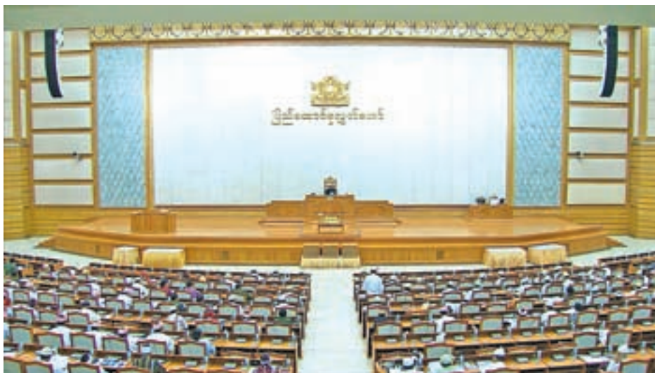
Representatives of Pyidaungsu Hluttaw focus on discussion of referendum bill, suffrage of white card holders.