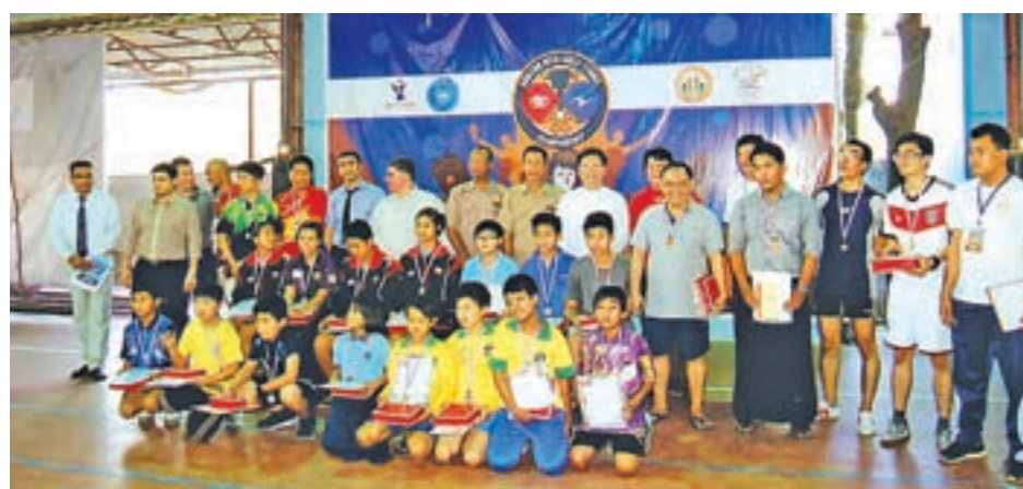
Winners pose for documentary photo in group at invitational tennis tournament organized by Horizon International School.