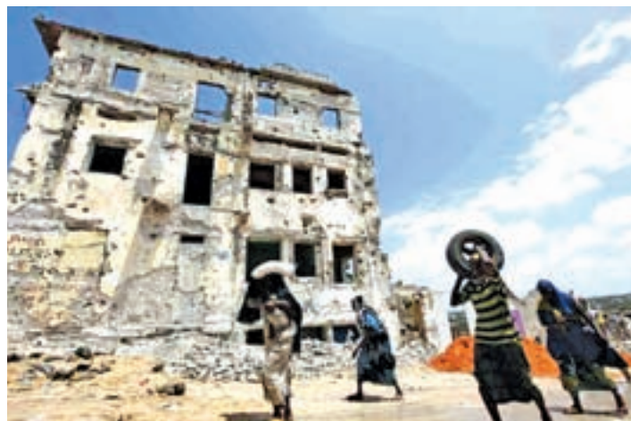
Displaced people walk past a war-devastated village in Bakara district, south of Somalia’s capital Mogadishu, in this file photo taken on 18 Aug, 2011.—REUTERS

The Committee said that DFID’s long-term future as a standalone ministry would be at risk unless stronger mechanisms to support cooperation across government on development issues were put in place.—Reuters