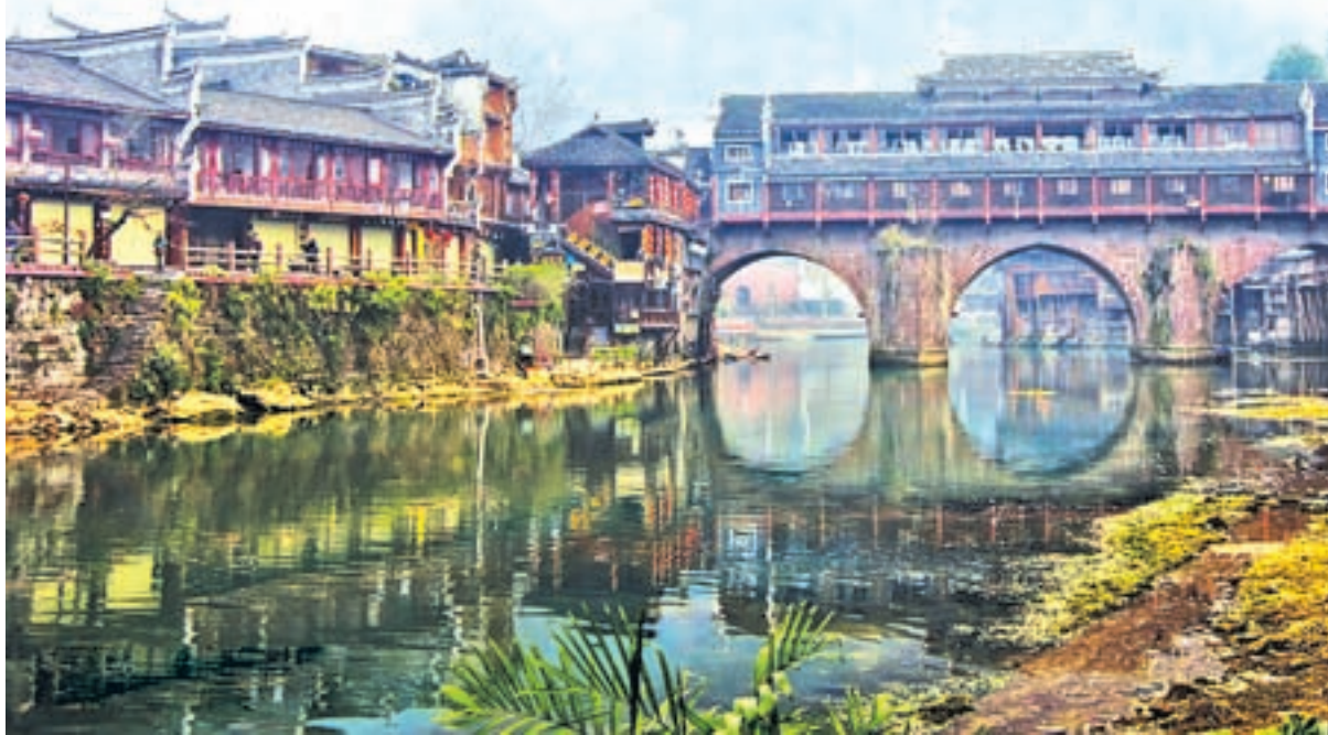
Photo shows the beautiful scenery of the Phoenix (Fenghuang) ancient city, in central China's Hunan Province. The Phoenix city, located in Xiangxi Tujia-Miao Autonomous Prefecture in Hunan, enjoys a growing reputation among tourists for its picturesque landscape, exotic customs and historical sites.