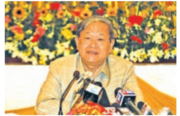
Cambodia's ruling Cambodian People's Party's spokesman and Cambodian information minister Khieu Kanharith speaks at a Press conference in Phnom Penh, Cambodia, on 1 Feb, 2015. The Cambodian People's Party has added 306 new members to its central committee during a three-day congress, which ended on Sunday.—XINHUA