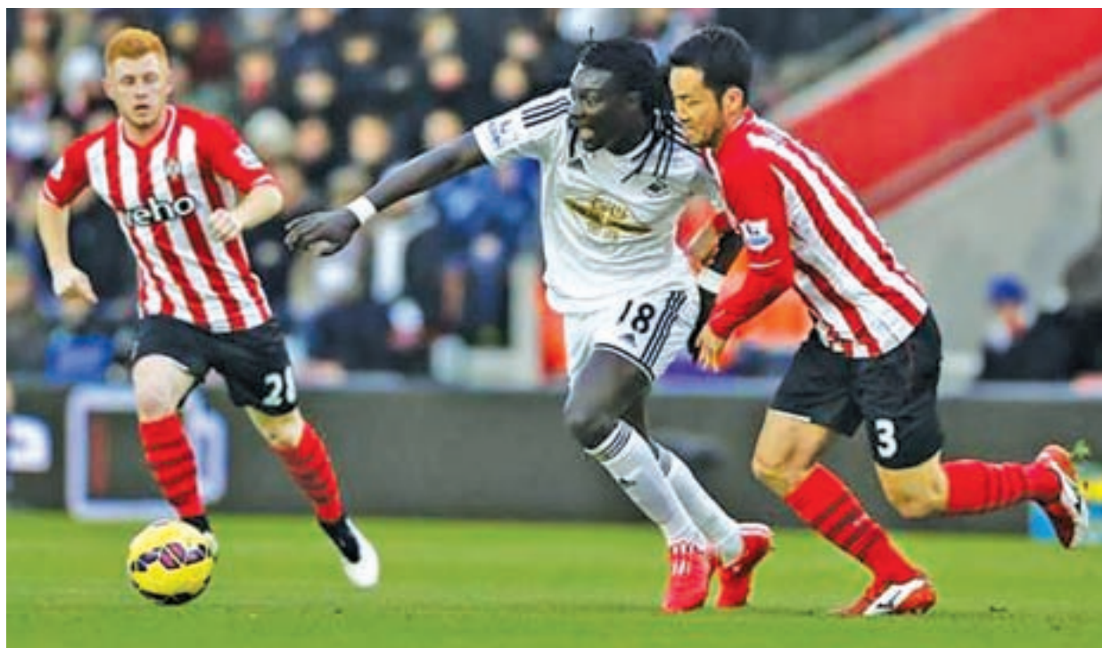
Southampton's Maya Yoshida (R) challenges Swansea City's Bafetimbi Gomis during their English Premier League soccer match at St Mary's Stadium in Southampton, southern England, on 1 Feb, 2015.

Editorial Section — (+95) (01) 8604529 Advertisement & Circulation — (+95) (01) 8604532 gnlmtdaily@gmail.com www.globalnewlightofmyanmar.com www.facebook.com/globalnewlightofmyanmar THE GLOBAL NEW LIGHT OF MYANMAR "R/489 Printed and published at the Global New Light of Myanmar Printing Factory at No. 150, Nga Htat Kye Pagoda Road, Bahan Township, Yangon, by the Global New Light of Myanmar Daily."