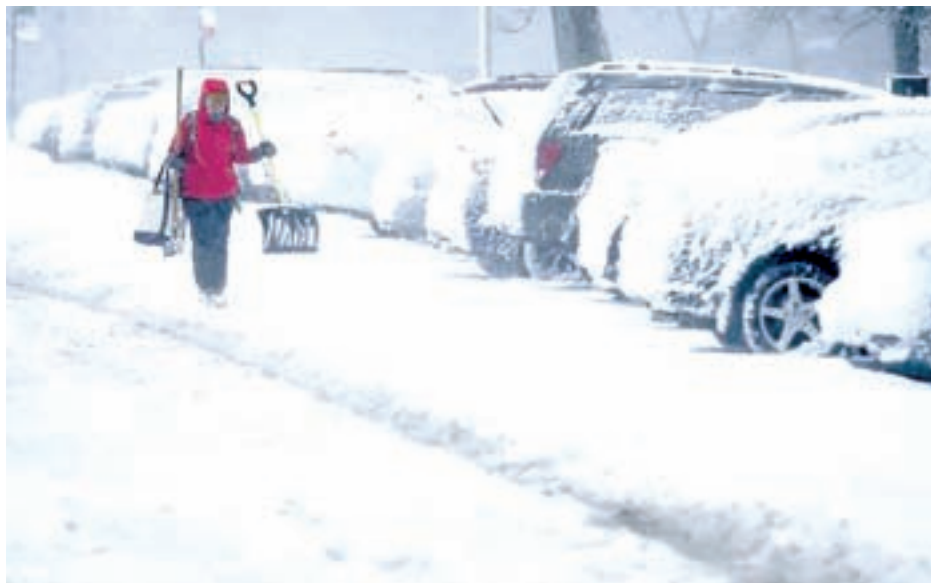
A woman carries a shovel through a parking lot during blizzard conditions in Chicago, Illinois on 1 Feb, 2015.

is forecast to follow the snow across the country. In Grand Island, Nebraska, the temperature plunged to 7 Fahrenheit (-14 Celsius) by mid-afternoon on Sunday.