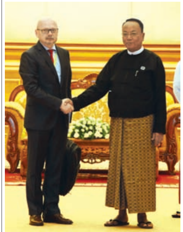
Speaker of Amyotha Hluttaw U Khin Aung Myint cordially greets Mr Zenon Kuchciak, Ambassador of Poland.—MNA

Power lines and three transformers were built for supply of electricity to 500 villages in Thongwa Village-tracts.—MNA