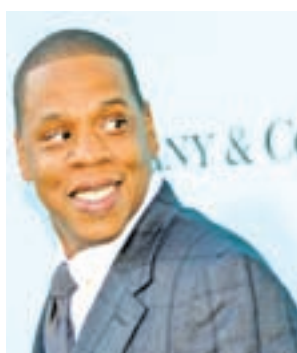
Jay-Z has reportedly got preliminary approval from the Aspiro board.

LOS ANGELES, 2 Feb — Rapper Jay-Z is expanding his empire into music streaming business.