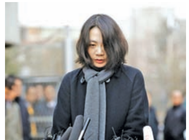
Cho Hyun-ah, also known as Heather Cho

SEOUL, 2 Feb — The daughter of the boss of Korean Air, on trial in a case popularly known as "nut rage", treated flight crew like "feudal slaves", a chief steward said in court on Monday.