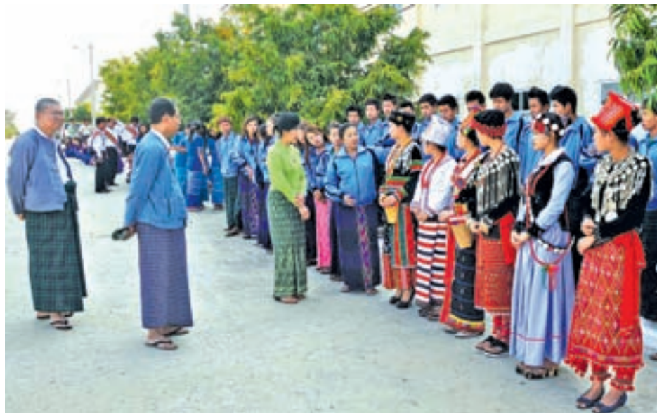
Deputy Minister for Culture Daw Sanda Khin cordially welcomes members of cultural troupes from regions and states.

NAY PYI TAW, 2 Feb— Delegates of cultural troupes from regions and states arrived at No 7 Transit Centre in Nay Pyi Taw on Monday.