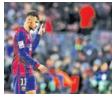
Barcelona's Neymar celebrates his goal against Villarreal during their Spanish first division soccer match at Nou Camp stadium in Barcelona on 1 Feb, 2015.

BARCELONA, 2 Feb — Lionel Messi struck the winner for Barcelona who twice came from behind to beat Villarreal 3-2 at home and move a point behind leaders Real Madrid in La Liga on Sunday.