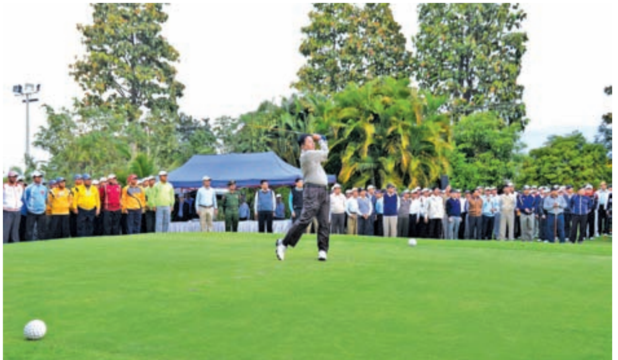
Commander-in-Chief of Defence Services Senior General Min Aung Hlaing tees off small ball at opening of Tatmadaw (Army, Navy and Air) Golf Tournament 2014-15.

NAY PYI TAW, 1 Feb —Commander-in-Chief of Defence Services Senior General Min Aung Hlaing teed off the Command-