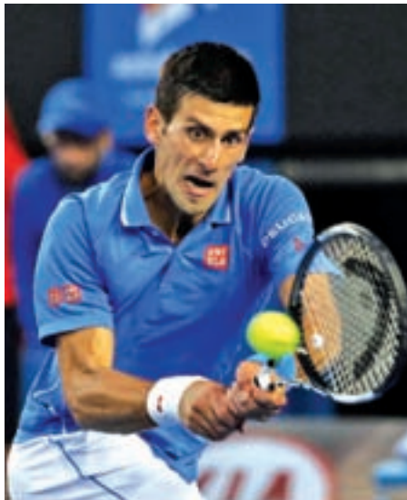
Novak Djokovic of Serbia returns the ball during his men's singles final match against Andy Murray of Great Britain at 2015 Australian Open tennis tournament at Melbourne Park in Melbourne, Australia on 1 Feb, 2015.

He conceded 12 straight points to be broken again and fell back to 4-2.