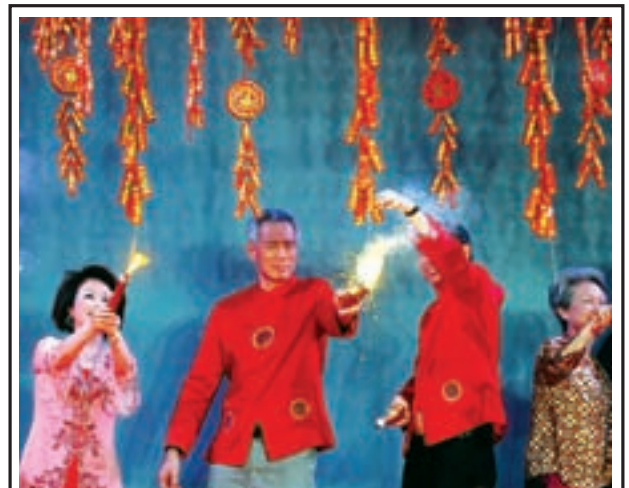
Singapore's Prime Minister Lee Hsien Loong (2 nd, L) and his wife Ho Ching (2 nd, R) attend the light up ceremony in Singapore's Chinatown on 31 Jan, 2015. Singapore's Chinatown held a light up ceremony for the Lunar New Year celebrations on Saturday.

In 2005, North Korea reached an agreement with the United States, South Korea, China, Japan and Russia to suspend its nuclear programme in return for diplomatic rewards and energy assistance.—Reuters