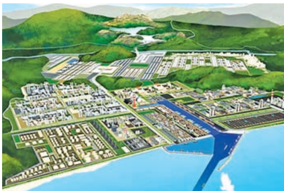
A graphical representation of the Dawei Special Economic Zone and deep sea port project.

The dock of Myanma Shipyards will be upgraded to build vessels of 22,000 dwt and repair vassals of 3,000 dwts in addition to doing other dock related business.—GNLM