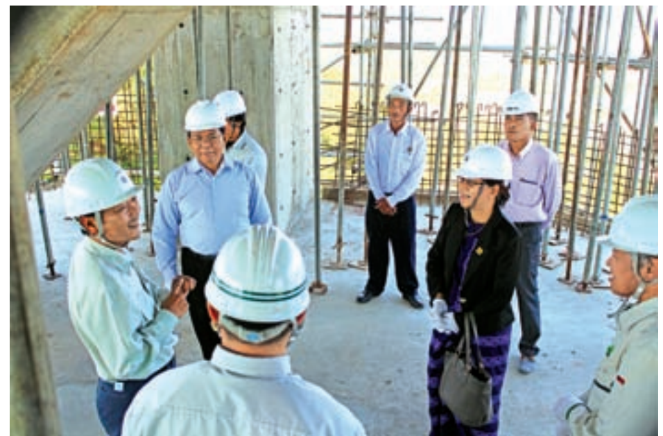
Union Minister U Nyan Tun Aung inspects construction of a weather-radar station in Kyaukpyu Township.

Sayadaw U Nimala of the monastery and his laypersons has conducted the