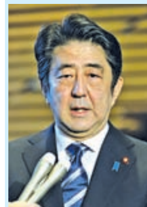
Japanese Prime Minister Shinzo Abe speaks to reporters at the prime minister's office on 1 Feb, 2015, after a new video image purportedly showing the beheaded body of Kenji Goto, a Japanese man taken hostage by a group believed to be Islamic State militants, was posted online.

TOKYO, 1 Feb — The following is the full text of a statement issued on Sunday by Prime Minister Shinzo Abe regarding the hostage case involving Japanese nationals in Syria.