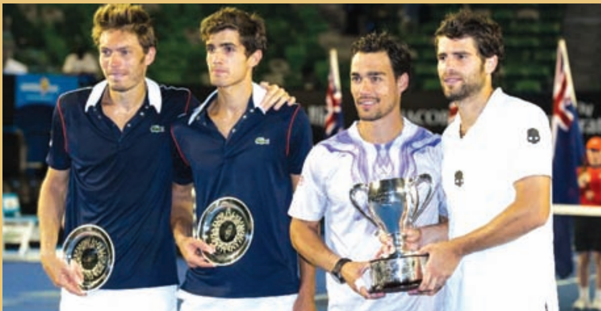
Fabio Fognini (2 nd R) and Simone Bolelli (R) of Italy and Pierre-Hugues Herbert (2 nd L) and Nicolas Mahut (L) of France pose with their trophies after the men's doubles final at the 2015 Australian Open tennis tournament at Melbourne Park in Melbourne, Australia on 31 Jan, 2015. Fognini and Bolelli won 2-0 to claim the titles.