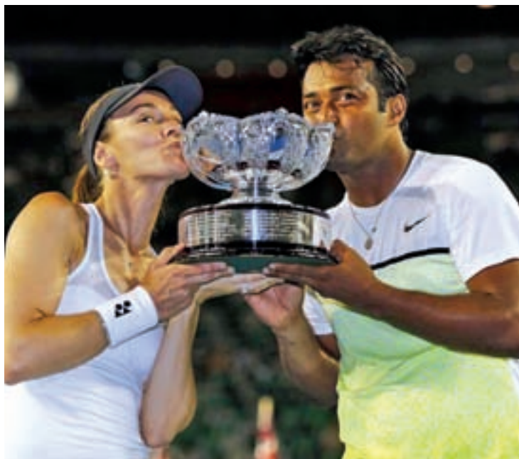
Martina Hingis (L) of Switzerland and Leander Paes of India kiss their trophy after defeating Kristina Mladenovic of France and Daniel Nestor of Canada to win their mixed doubles final match at the Australian Open 2015 tennis tournament in Melbourne on 1 Feb, 2015.

MELBOURNE, 1 Feb — Five times grand slam singles winner Martina Hingis won her second Australian Open mixed doubles title on Sunday as she