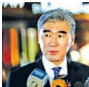
US Special Representative for North Korea Policy Sung Kim speaks to the media at a news conference in Beijing on 30 Jan, 2015.

Sung Kim has been meeting with officials of the countries that had been part of the so-called six-party talks in the past week in Tokyo and Beijing, where he said it was up to the North to show it was serious about ending its nuclear programme.