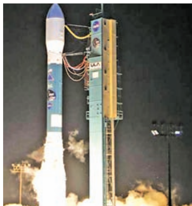
A 127-foot (39 metre) rocket built and flown by United Launch Alliance blasts off at 6:22 am PST (14:22 GMT) from Vandenberg Air Force Base, California on 31 Jan, 2015.

Perched on top on the rocket was NASA's 2,100-pound (950 kg) SMAP, which will spend at least three years measuring the amount of water in the top 2 inches of Earth's