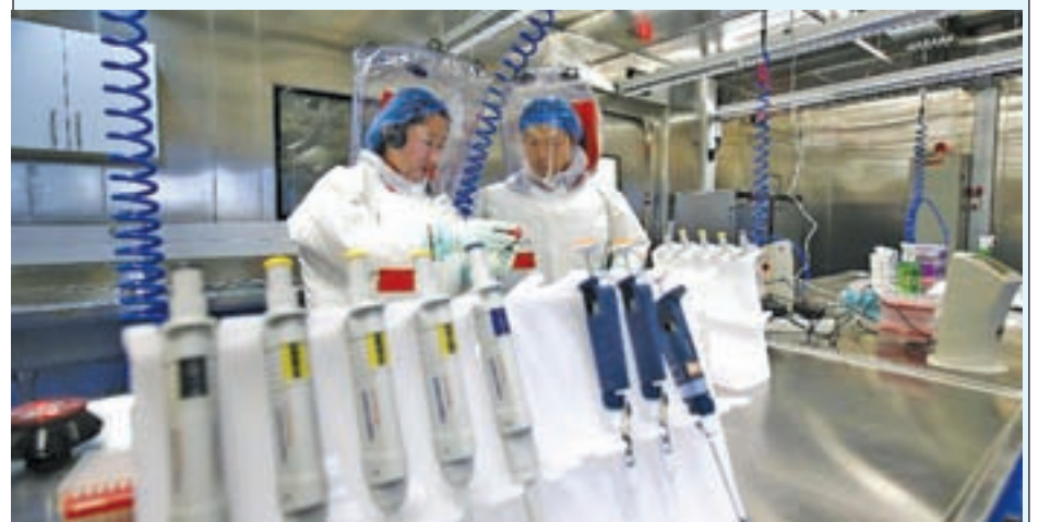
Researchers take part in a drill at the newly-completed lab in Wuhan, capital of central China's Hubei Province on 30 Jan, 2015. China completed its first high level biosafety laboratory based in Wuhan on Saturday in Wuhan after more than a decade of construction. The lab will be used to study class four pathogens (P4), which refers to the most virulent viruses that pose a high risk of aerosol-transmitted person-to-person infections.