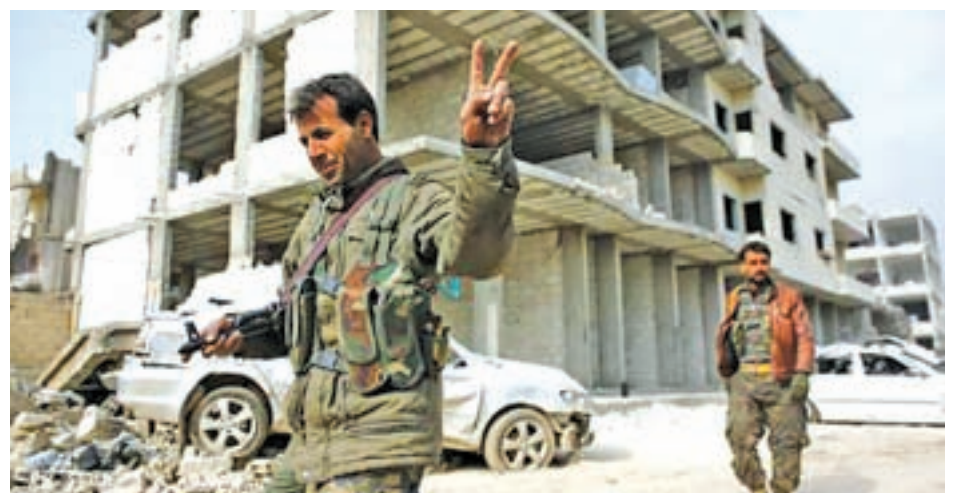
A fighter of the Kurdish People's Protection Units (YPG) flashes a V-sign as he patrols in the streets in the northern Syrian town of Kobani on 28 Jan, 2015.—REUTERS

in and around Kobani since 8 August, destroying more than 280 fighting positions, nearly 100 buildings, more than 60 technical vehicles and other equipment, it said.—Reuters