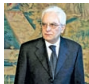
Italy's new President Sergio Mattarella

Renato Brunetta, Forza Italia’s chief whip in the lower house, said the pact that Renzi and Berlusconi sealed last year to make institutional reforms was