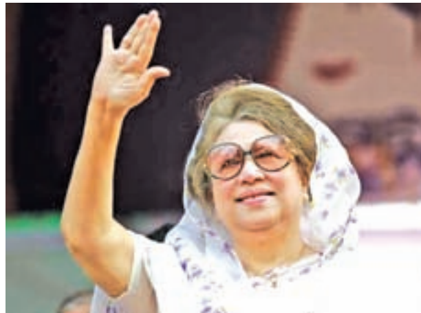
Bangladesh Nationalist Party (BNP) Chairperson Begum Khaleda Zia

"There has been no electricity ... they have also cut Internet and cable televi-