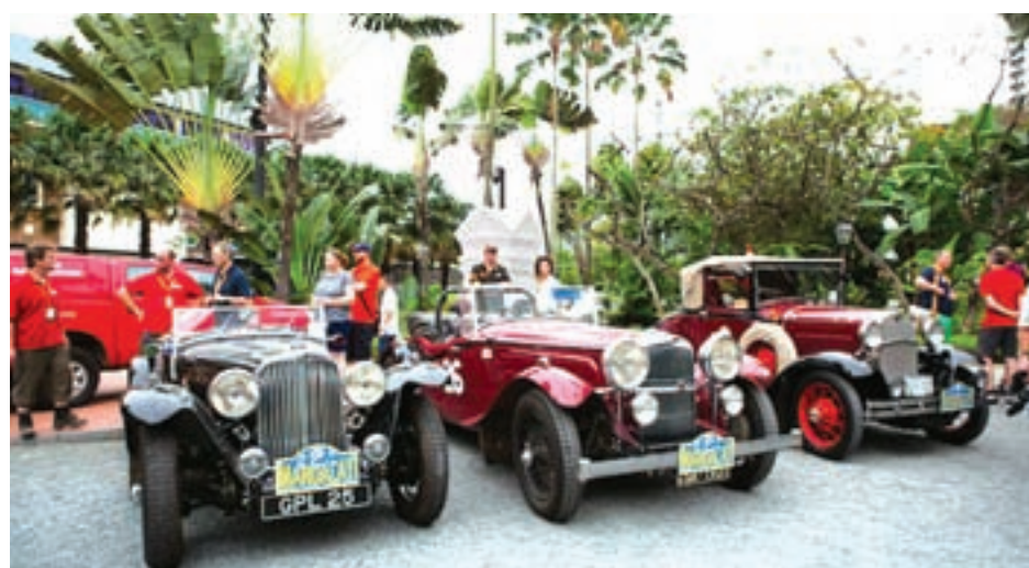
Classic cars getting ready to leave for Mandalay.