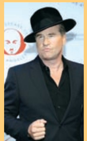
Actor Val Kilmer

Some Christian Scientists, based on the pre-