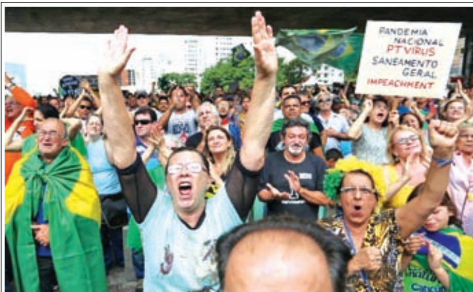
Demonstrators take part in a protest against corruption and demand the impeachment of Brazil's President Dilma Rousseff, in Sao Paulo, Brazil on 31 Jan, 2015.