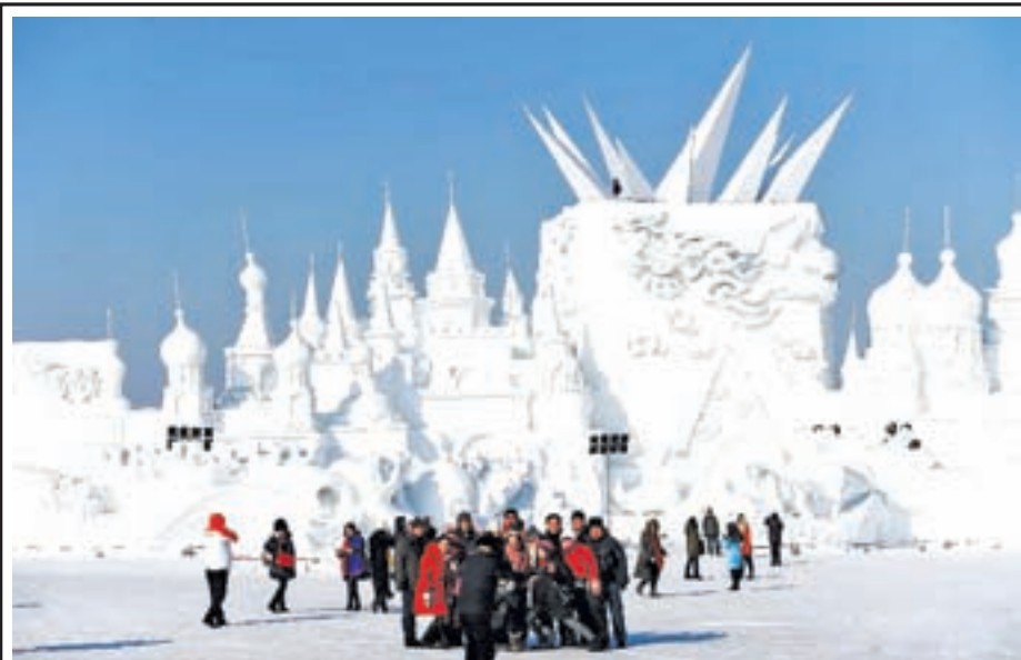
Tourists pose for photos in front of a snow sculpture at the Sun Island International Snow Sculpture Art Expo in Harbin, capital of northeast China's Heilongjiang Province, on 31 Jan, 2015. More tourists visit the snow and ice amusements in Heilongjiang Province this year.