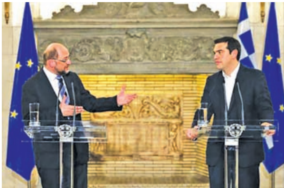
Greek Prime Minister Alexis Tsipras (R) and European Parliament President Martin Schulz hold a joint statement to media in the Greek Premier's office in Athens on 29 Jan, 2015.

He also spoke to Jeroen Dijsselbloem, head of the euro zone finance