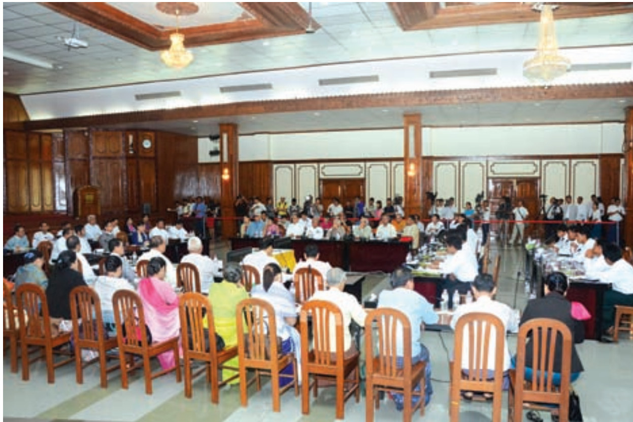
Union level officials meet student representatives at talks on National Education Law in accord with the new political culture in practice in the time of the democratically elected government.—MNA

ucation Dr Daw Khin San Yi expressed her views during the discussion, pointing out the need to go by policies and laws as education is a long-term process.