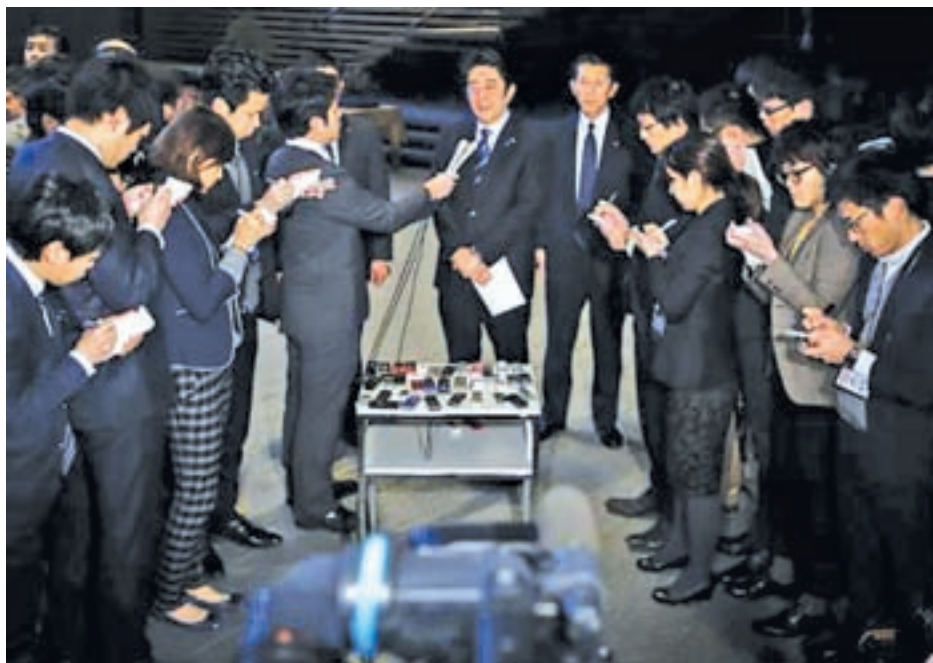
Japan's Prime Minister Shinzo Abe (C) speaks to the media at his official residence in Tokyo on 1 Feb, 2015.

The hardline Islamist group, which controls large parts of Syria and Iraq, released the video showing a