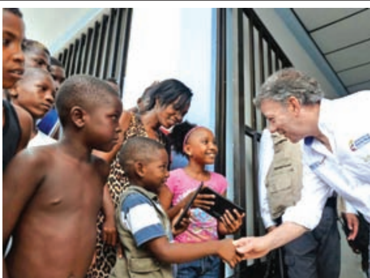
Image provided by Colombia's Presidency shows Colombian President Juan Manuel Santos (R) greeting children during his visit to Guapi, Cauca department, Colombia, on 31 Jan, 2015. According to local press, Santos visited the streets of Guapi after participating in the Regional Ministers Council.

OUTLOOK FOR SUBSEQUENT TWO DAYS: Slight increase of night temperatures in the Southern Myanmar areas.