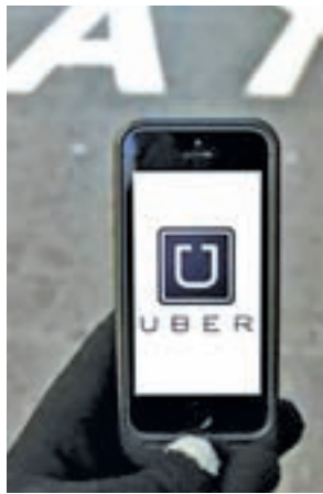
The logo of car-sharing service app Uber on a smartphone over a reserved lane for taxis in a street is seen in this photo illustration taken in Madrid on 10 Dec, 2014.

Management at the San Francisco-based company, which announced