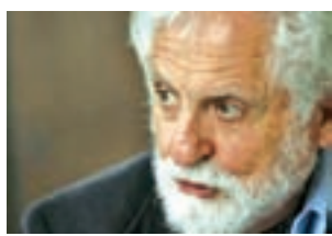
Vienna born US chemist, novelist and playwright Carl Djerassi, known for the development of the first oral contraceptive pill, talks during a news conference in Vienna on 11 Nov, 2008.

“I’m sick and tired of talking about the pill,” Djerassi told the San Francisco Chronicle in an interview four months ago at his flat in the Russian Hill neighbourhood. Instead, he