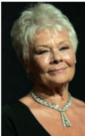
Veteran actress Judi Dench