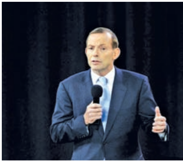
Australia's conservative Prime Minister Tony Abbott

Local media reported that Abbott has called a two-day meeting of his cabinet from Tuesday to thrash out a policy agenda