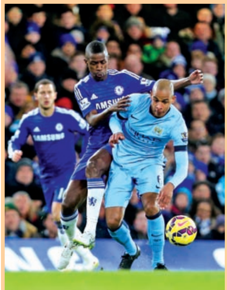
Fernando (R) of Manchester City vies with Ramires of Chelsea during the Barclays Premier League match between Chelsea and Manchester City at Stamford Bridge in London, England on 31 Jan, 2015. The match ended in 1-1 draw.

Robin van Persie, Radamel Falcao and an own goal by Wes Morgan before halftime put United in command against Leicester