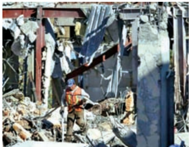
A crew member works to clear debris the day after a deadly gas truck explosion ripped through a maternity hospital in Mexico City, on 30 Jan, 2015.

Mexico tests DNA of babies who survived blast in search for parents