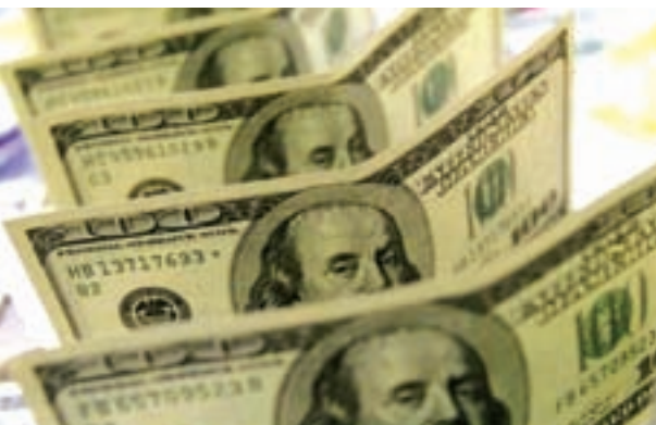
US dollar bank notes are seen in a bank in Budapest on 8 Aug, 2011.

New York, 31 Jan — Oil prices rallied on Friday following the sharpest weekly drop in US oil rig count in nearly 30 years, while the dollar index ended January with its longest run of gains since the greenback was floated in 1971. US stocks finished the day down more than 1 percent as data showed US economic growth slowed sharply in the fourth quarter. Major US stock indexes posted losses for the week and month, with the declines driven by falling oil prices and concern about weak overseas demand. The S&P 500 was