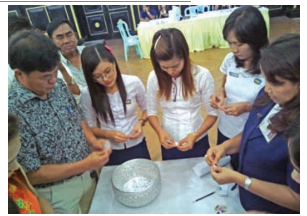
YCDC members, applicants are seen at sale of apartment through draw lot system at the City Hall in Yangon.