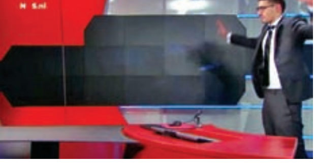
A man surrenders to the police in a TV studio of Dutch national broadcaster NOS in Amsterdam in this still image taken from a 29 Jan, 2015 video.

Center (JACC) is running the search operations which involve Australian, Chinese and Malaysian search equipment. Australia had set aside A$80-A$90 million last year for the search, already the most expensive ever undertaken. Malaysia has said it would split the costs. Malaysia declared the flight's disappearance an accident on Thursday, clearing the way for airlines to pay compensation to victims' families. Malaysia said it, China and Australia remained committed to the search.—Reuters