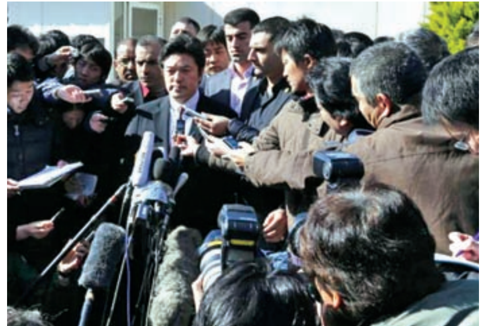
Japan's State Minister for Foreign Affairs Yasuhide Nakayama speaks to the media in front of the Japanese Embassy in Amman on 28 Jan, 2015.

The message extended a previous deadline set on Tuesday in which Goto said he would be killed within 24 hours if al-Rish-