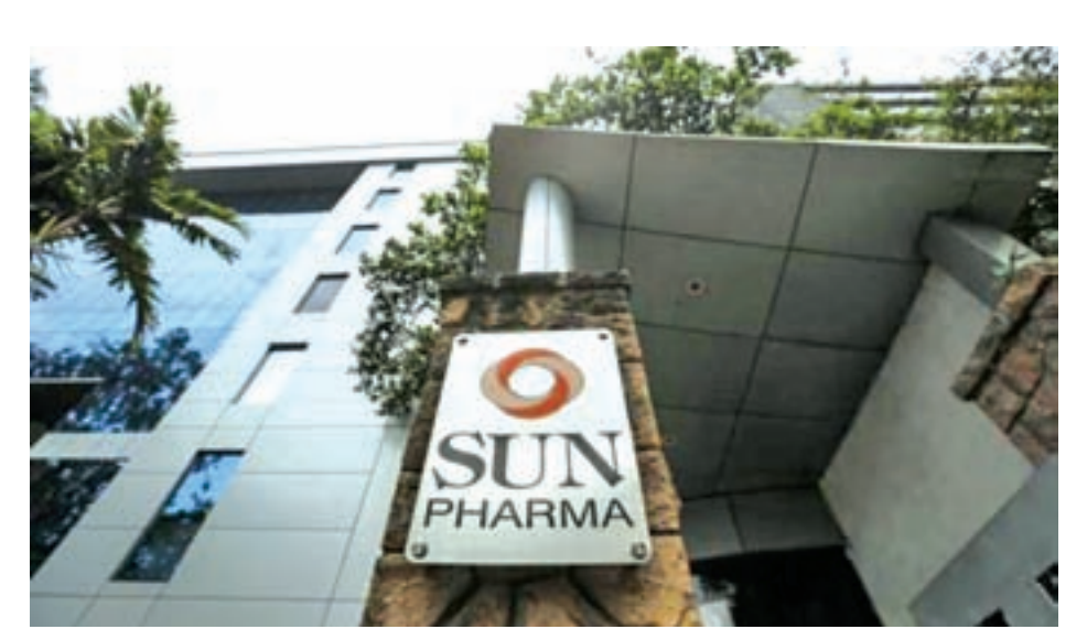
A logo of Sun Pharmaceutical Industries Ltd at its research and development centre in Mumbai on 7 April, 2014.

monly used to treat pneumonia, urinary tract infections and acne. Ranbaxy is one of three companies to sell the antibacterial drug, and Sun is expected to begin selling the medicines soon, the FTC said in a statement.- Reuters