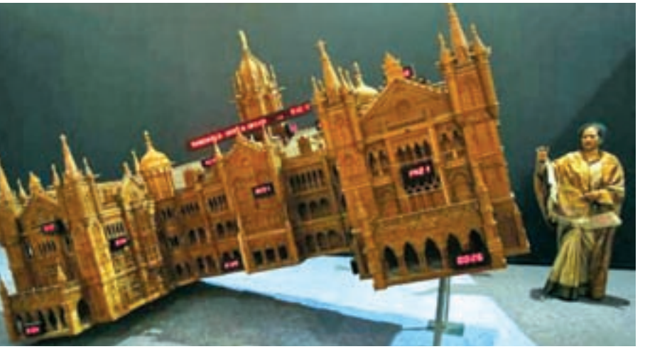
A visitor looks at an exhibit titled "The Threshold into a Dream" by Indian artist TV Santhosh at the India Art Fair in New Delhi on 29 Jan, 2015.

and several galleries have done exceptionally well," founder Neha Kirpal told Reuters.—Reuters