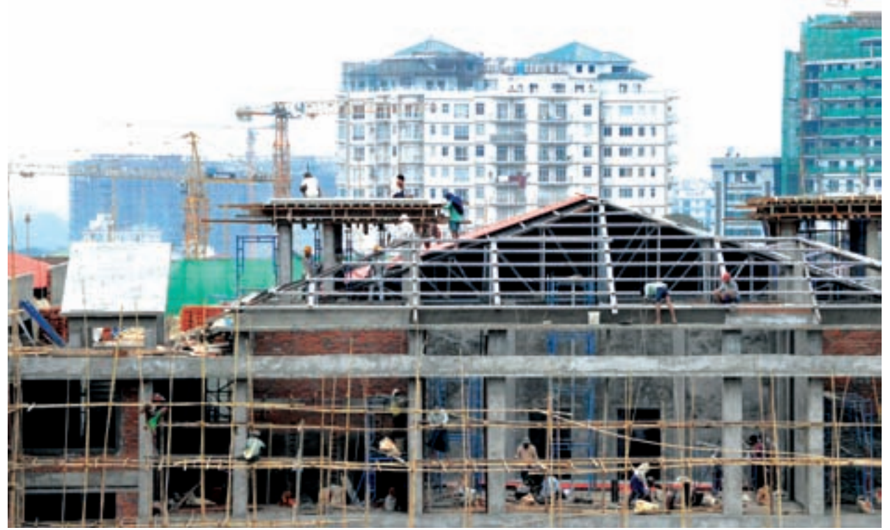
Photo of a building under construction and workers near downtown Yangon.