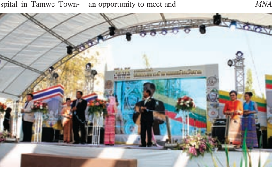
Union Minister for Commerce U Win Myint opens Tak Border Trade Fair 2015.

The event is aimed to offer both Thai and Burmese business operators an opportunity to meet and