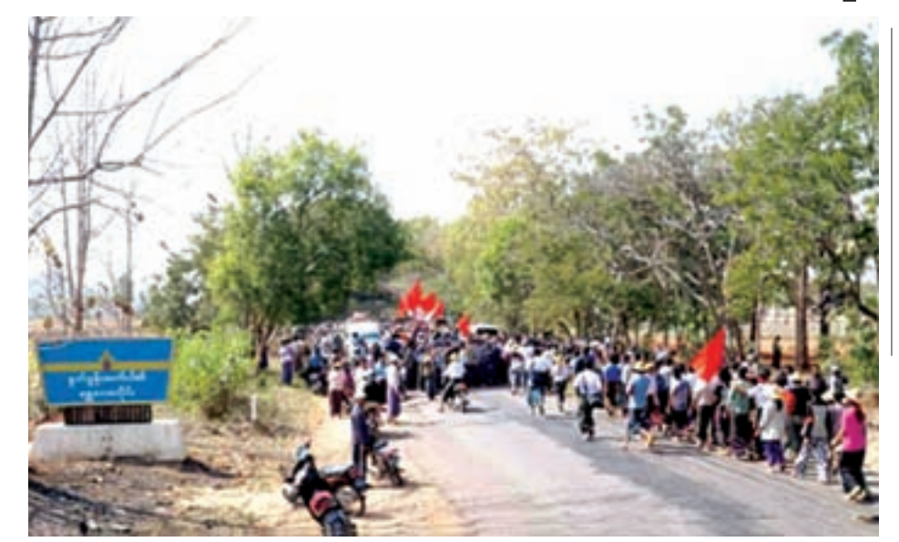
Student protesters continue marching against National Eduation Law in Chauk Township, Magwe region, on January 31.

CHAUK, 31 Jan- Students who are protesting against National Education Law reached Chauk, Magwe region, on Saturday morning after an overnight stay in Kyaukpataung the milepost 391/2 to make