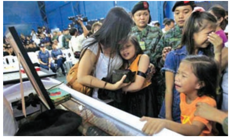
Children cry in front of the casket for their father, one of the slain members of the Special Action Force who were killed in a clash with Muslim rebels, during a service inside a police headquarters in Taguig city, south of Manila on 30 Jan, 2015.