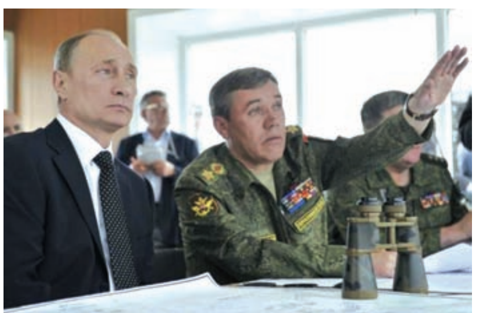
Russian President Vladimir Putin (L) and Chief of Staff Valery Gerasimov watch military exercises in Russia's Zabaykalsky region on 17 July, 2013.

'Support for our strategic nuclear forces to ensure their high military capability combined with ... growth of the military potential of the general forces will assure that (the