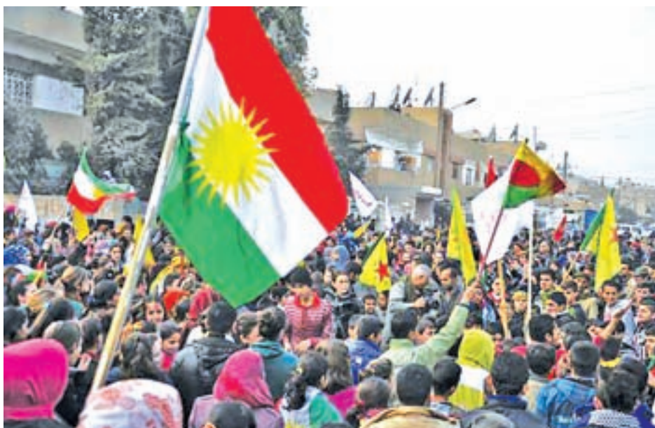
Kurdish civilians gather in the Syrian Kurdish city of Qamishli as they wave Kurdish flags in celebration after it was reported that Kurdish forces took control of the Syrian town of Kobani on 27 Jan, 2015.