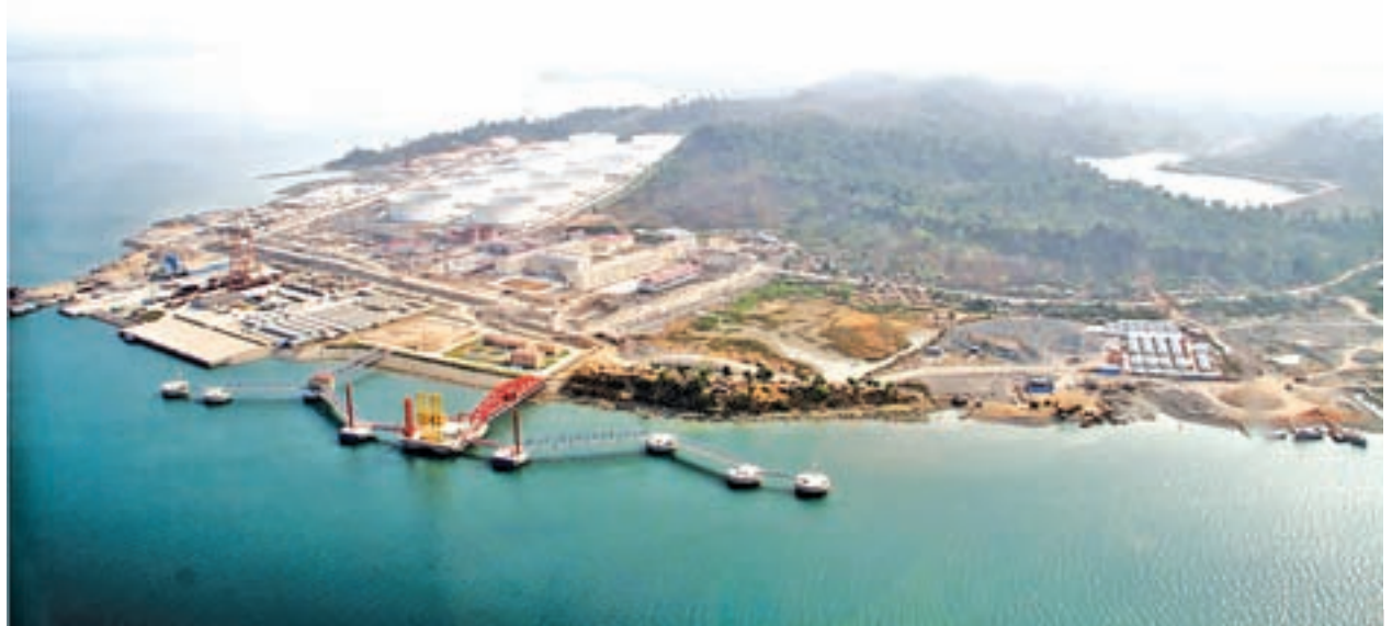
An aerial view of Ma-de Crude Oil Unloading Terminal in Kyaukpyu Township.