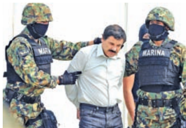
Mexican drug kingpin Joaquin "Shorty" Guzman