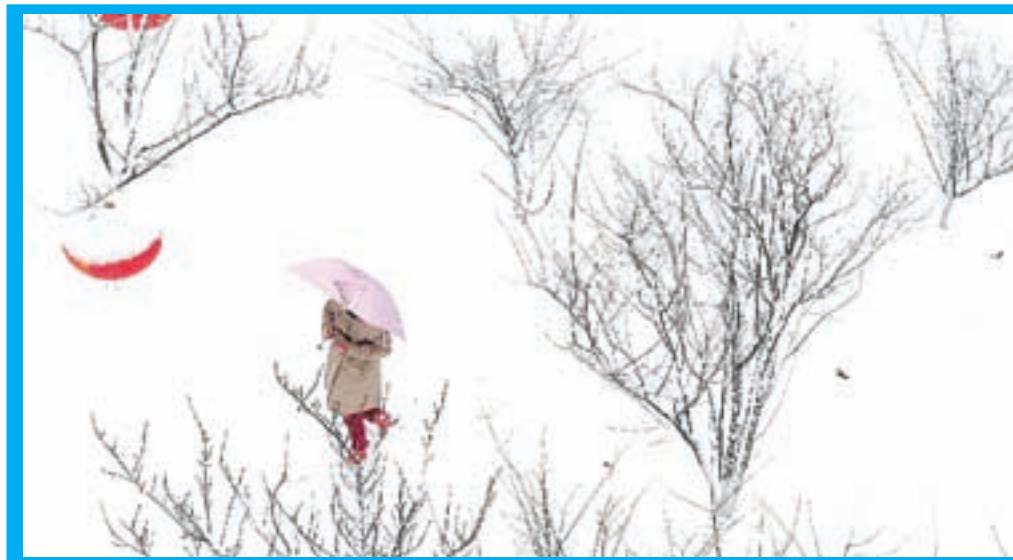
A citizen walks in the snow in Hefei, capital of east China's Anhui Province on 28 Jan, 2015. The provincial meteorological authorities on Wednesday issued a blue warning for snowstorm in some parts of Anhui, including Hefei.

Tuan said the military helicopter UH 1 departed from Tan Son Nhat Airport in HCM City at 7:00 am local time on a training mission, but eight minutes later it lost contacts in Binh Chanh district of HCM City. Search and rescue work was underway, he added.— Xinhua