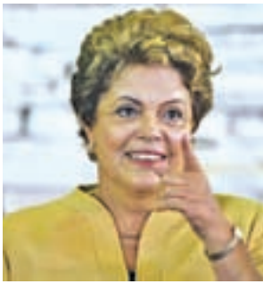
Brazil's President Dilma Rousseff

BRASILIA, 28 Jan — Brazil's President Dilma Rousseff urged her cabinet on Tuesday to embrace fiscal belt-tightening and other measures aimed at restoring business confidence and growth in her second term.