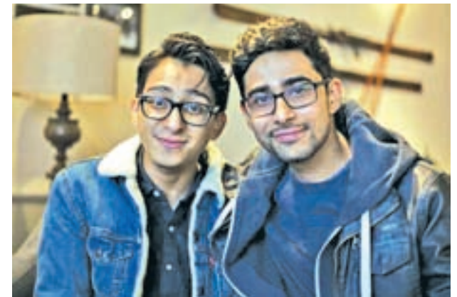
Actors Tony Revolori (L) and Suraj Sharma pose at the Sundance Film Festival in Park City, Utah on 24 Jan, 2015.

"I'm Hispanic and I don't have a lot of those head movements. It's a lot of those things you'll see in the film which you won't even notice, but I had to get it right," he said.— Reuters