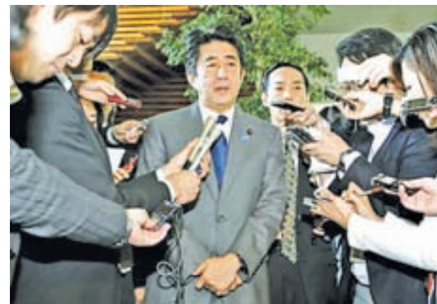
Prime Minister Shinzo Abe meets with reporters on 28 Jan, 2015, at his office in Tokyo, following a ministers’ meeting to deal with the hostage crisis.