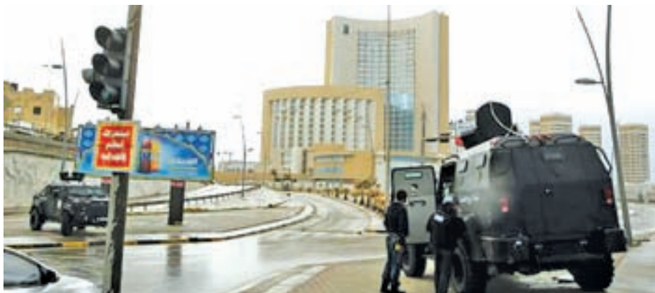
Security forces surround Corinthia hotel after a car bomb in Tripoli on 27 Jan, 2015.

ry Corinthia Hotel was still under investigation and details remain unclear. But Libyan officials said two gunmen set off a car bomb before storming the hotel, killing four foreigners, a security officer and three guards.