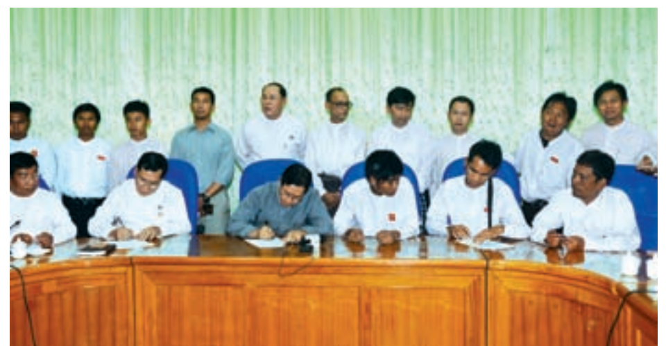
Union Minister U Aung Min and students sign agreement.

According to the declaration, the participants agreed to hold four party talks among the government, the Hluttaw, students and the National Network for Education Reform on 1 February in Yangon, to discuss the eleven demands