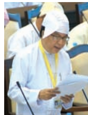
Deputy Minister for Education Dr Zaw Min Aung.

According to sources, the area where Yangon Central Railway Station