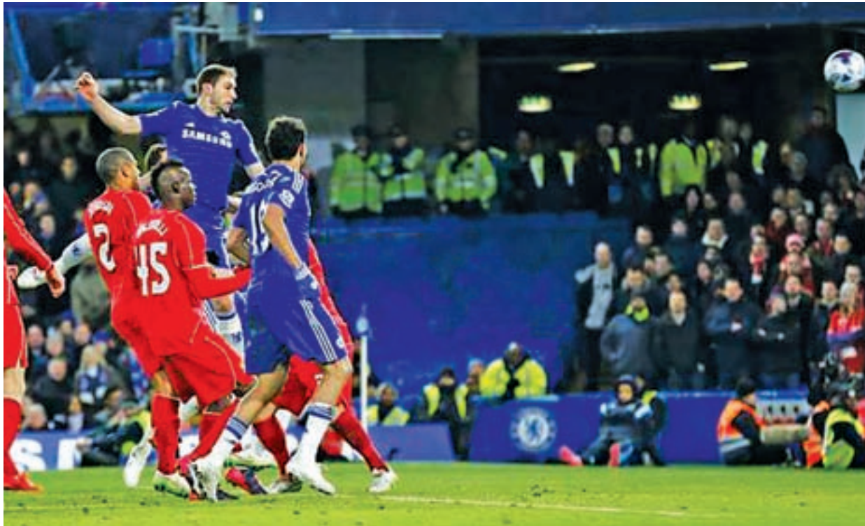
Chelsea's Branislav Ivanovic (3rd L) scores against Liverpool during their English League Cup semi-final second leg soccer match at Stamford Bridge in London on 27 Jan, 2015.