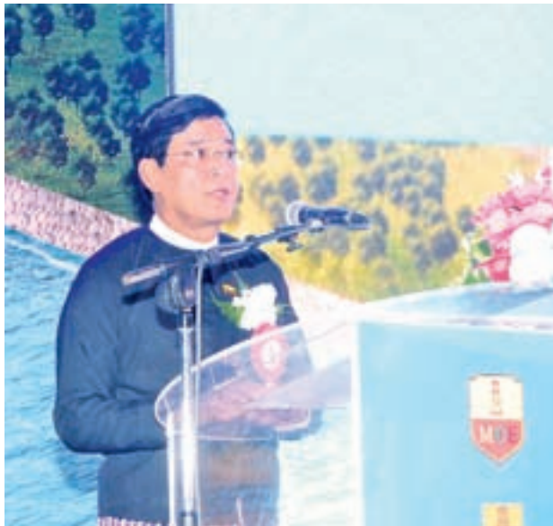
Vice President U Nyan Tun delivers an address at commissioning of Ma-de Crude Oil Unloading Terminal and pre-commissioning of South-East Asia crude oil pipeline.

YANGON, 28 Jan—Ma-de oil port in Rakhine State, jointly built by Ministry of Energy and South East Asia Pipeline, will accept unloading of crude oil from Middle East by tankers, Patron of National Energy Management Committee Vice President U Nyan Tun said at the commissioning of Ma-de Crude Oil Unloading Terminal and pre-commissioning of