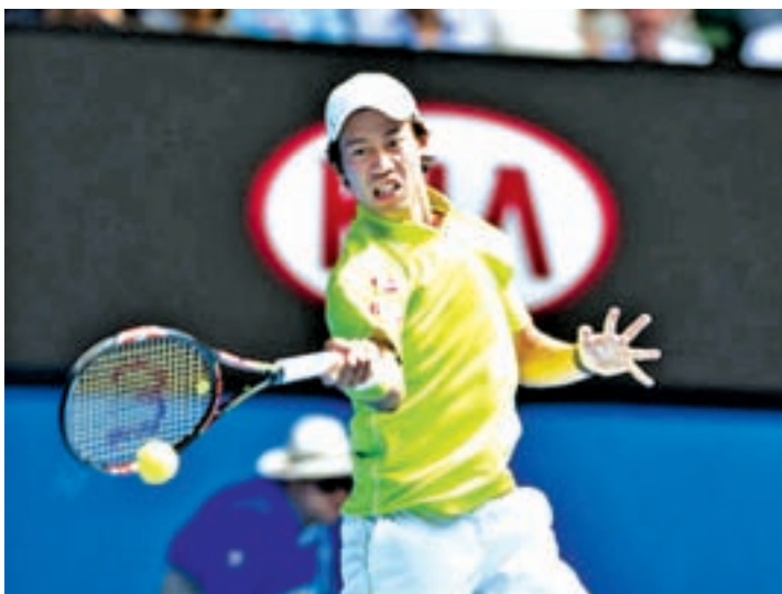
Japan's Kei Nishikori returns a shot during an Australian Open quarterfinal against Stan Wawrinka of Switzerland on 28 Jan, 2015, in Melbourne.