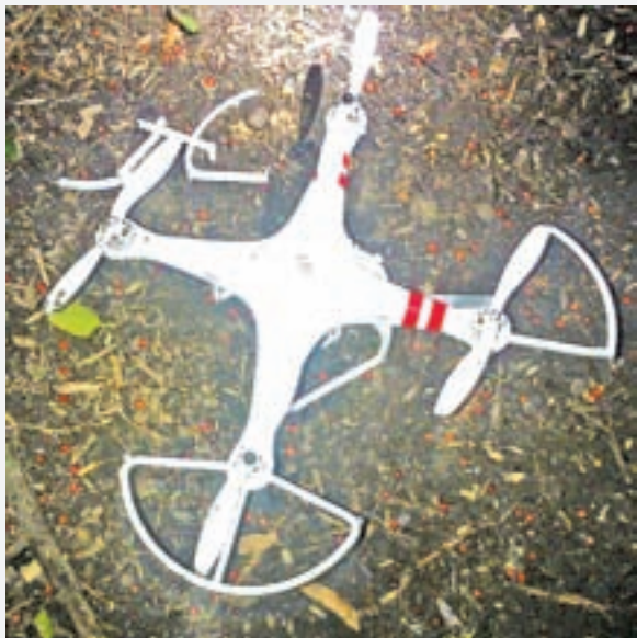
A recreational drone that landed on the White House South Lawn is seen in this US Secret Service handout image taken and released on 26 Jan, 2015. An individual has come forward to claim responsibility for flying the small drone that crashed on the South Lawn of the White House early on Monday morning, a Secret Service spokeswoman said. The individual claimed the drone was being used for recreational purposes.