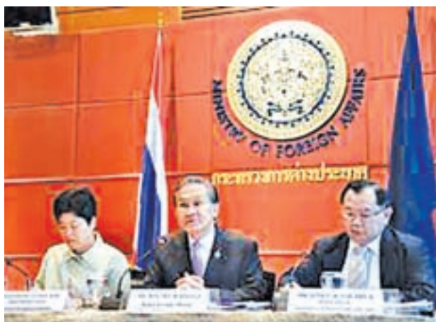
Thai deputy foreign minister Don Pramudwinai