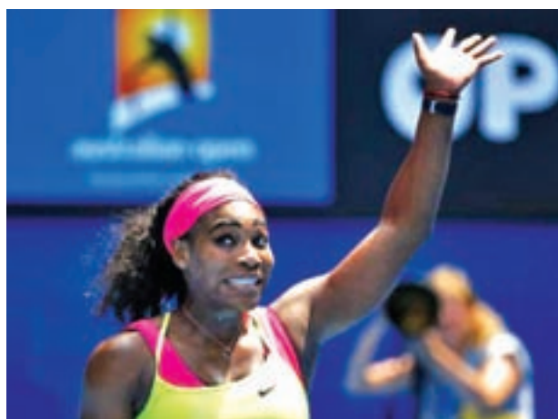
Serena Williams of the US reacts after defeating Dominika Cibulkova of Slovakia to win their women's singles quarter-final match at the Australian Open 2015 tennis tournament in Melbourne on 28 Jan, 2015.

MELBOURNE, 28 Jan — Serena Williams will turn to her sister for advice for her all-American semi-final against Madison Keys, the teenager with designs on the throne of US women's tennis. An injury-hampered Keys defeated Venus Williams in