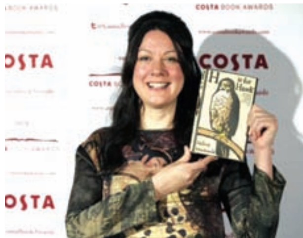
Helen Macdonald, nominee in the 2014 Costa Book Awards and winner of the Costa Biography Award category, poses with her book 'H is for hawk' prior to the announcement of the overall winner in London on 27 Jan, 2015.