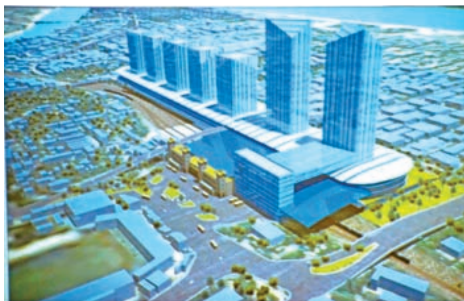
Artist's Impression of the Yangon Railways Station Yard.