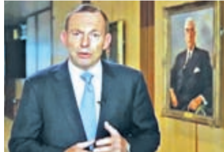
Tony Abbott, Prime Minister of Australia.

SYDNEY, 28 Jan — Australian Prime Minister Tony Abbott said on Wednesday he would take criticism of his decision to grant Britain's Prince Philip a knighthood “on the chin”, promising greater consultation as speculation about his future as leader mounted. Abbott, an avowed monarchist who was born in England, bestowed Australia's highest honour on Queen Elizabeth's husband earlier this week, provoking widespread criticism, including some from within his party.