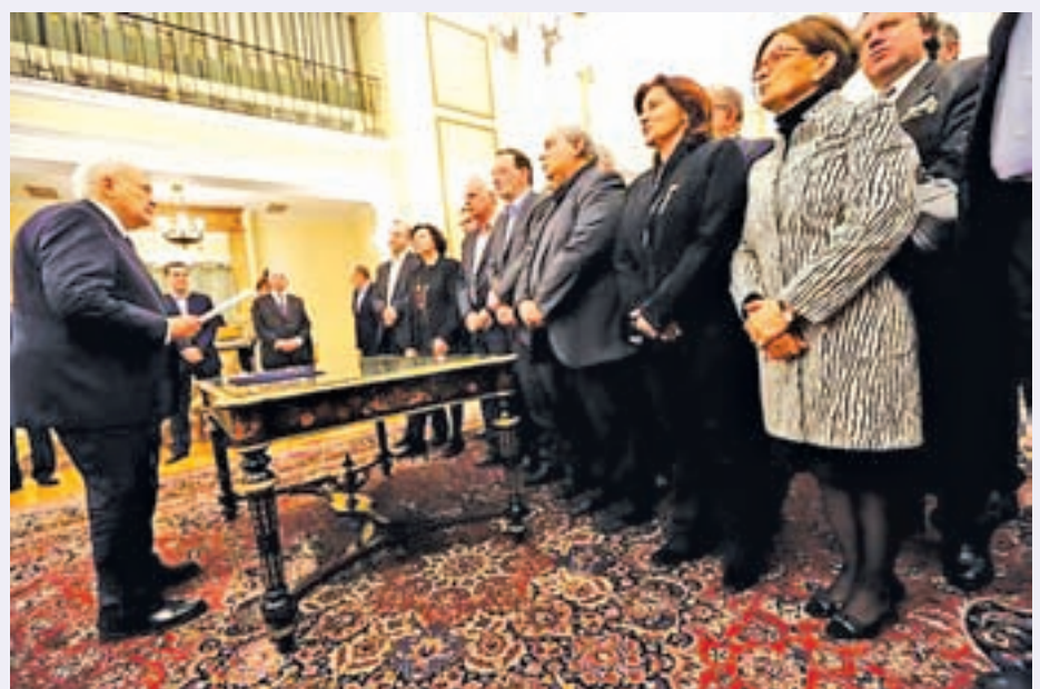
Greek President Karolos Papoulias (L) reads the political oath as newly appointed ministers and deputy ministers take part in a swearing in ceremony at the presidential palace in Athens on 27 Jan, 2015.