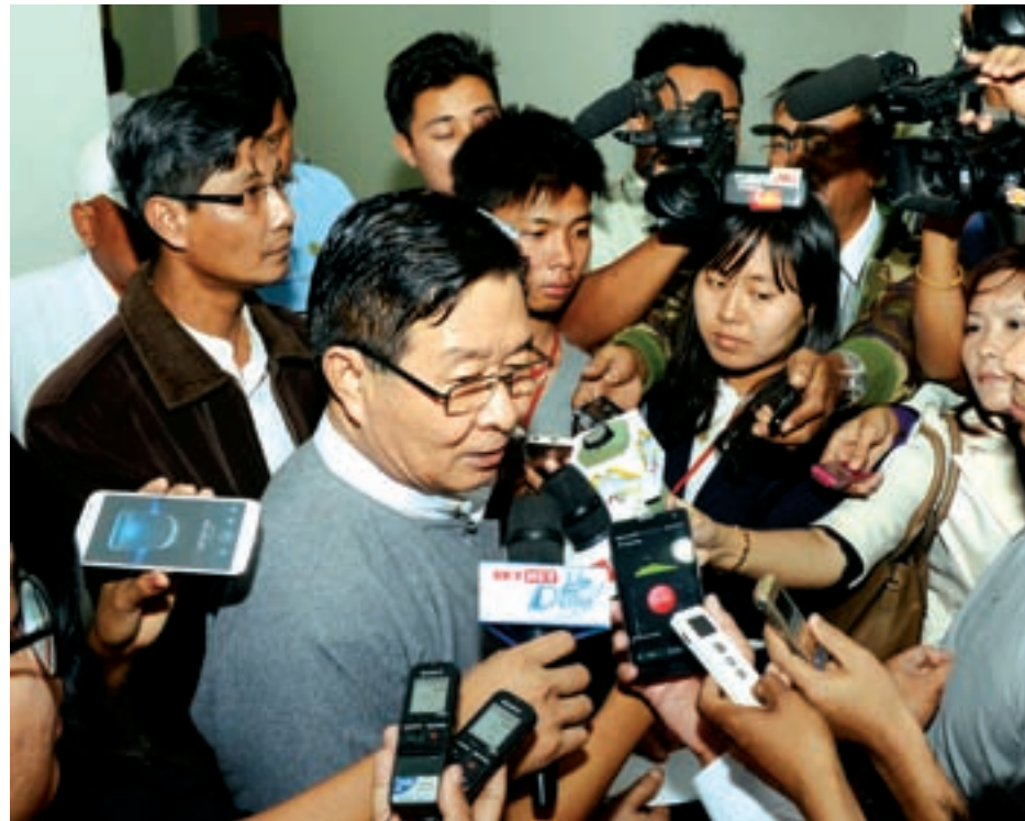
Union Minister U Aung Min replies to queries at media at the ceremony to issue four points agreement.

NAY PYI TAW, 28 Jan— The government, Hluttaw representatives and student representatives of Democracy Education Movement in Nya Pyi Taw on Wednesday and issued a four points agreement on