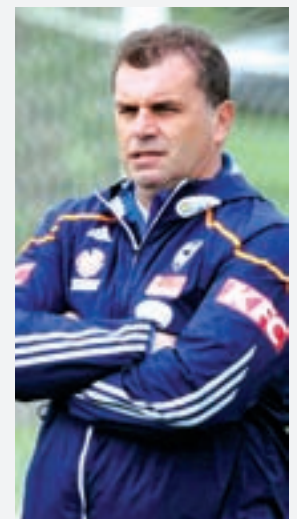
Australia's coach Ange Postecoglou

"I think we have been very good in the whole tournament. There haven't been too many