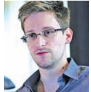
Former US National Security Agency contractor Edward Snowden

The NSA did not respond to a request for comment. After past Snowden disclosures, it has avoided discussing specific operations but said it complies with US law, which allows broad surveillance over-