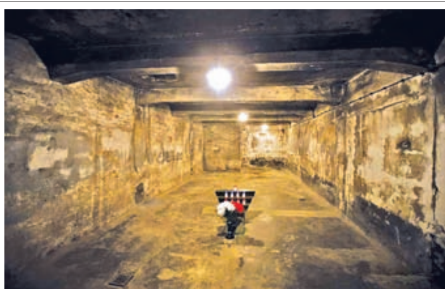
Photo taken on 9 Nov, 2012 shows the gas chamber at the memorial site of the former Auschwitz concentration camp in Oswiecim, Poland. The celebrations of the 70 th anniversary of Auschwitz concentration camp liberation began in the Polish southern town of Oswiecim on Tuesday morning. The concentration camp was founded in 1940 by the Germans mostly for the aim of imprisoning Polish captives. Since 1942 it became Europe's one of the biggest places of Jewish extermination, with more than 1.1 million people killed, also including Poles, Romanians, Soviet captives and others. The camp was liberated on 27 Jan, 1945 by the Red Army soldiers of the former Soviet Union, the date which eventually became the Holocaust Victims Memory Day.

In addition, World War II artefacts including two machine guns recovered at the Attap Vallery bunker, archival photographs, court transcripts and video clips will also be displayed.—Xinhua