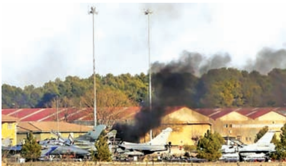
Smoke rises after a Greek F-16 fighter plane crashed during NATO training at the Albacete air base in Albacete on 26 Jan, 2015.

MADRID, 27 Jan — Eight French nationals and two Greeks were killed and 21 people injured when a Greek fighter plane crashed during NATO training in Spain on Monday, Spanish Prime Minister Mariano Rajoy said.