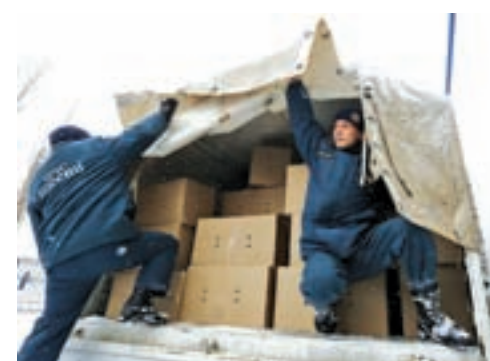
The convoy will consist of more than 170 trucks that will deliver over 1,500 tons of cargo.