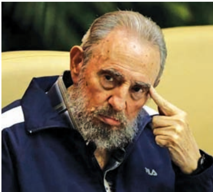
Former Cuban leader Fidel Castro

HAVANA, 27 Jan — Retired Cuban leader Fidel Castro on Monday appeared to lend his support to talks with the United States in his first comments about his longtime adversary since both countries agreed last month to restore diplomatic ties.