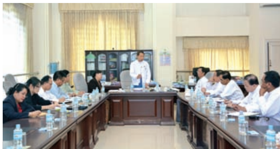
Deputy Speaker of Pyidaungsu Hluttaw U Nanda Kyaw Swa highlights amendment of provisions in National Education Law.—MNA