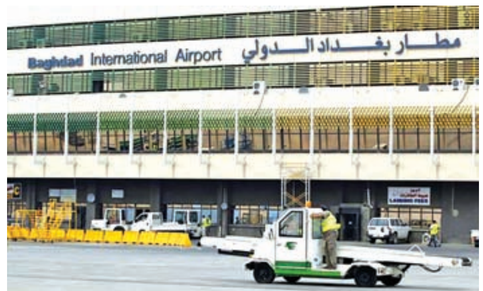
A general view shows Baghdad International Airport in this on 25 Oct, 2012 file photo.

Airport (BGW) on 26 January 2015, damage to the aircraft fuselage consistent with small arms fire was discovered on flydubai flight FZ 215," a company