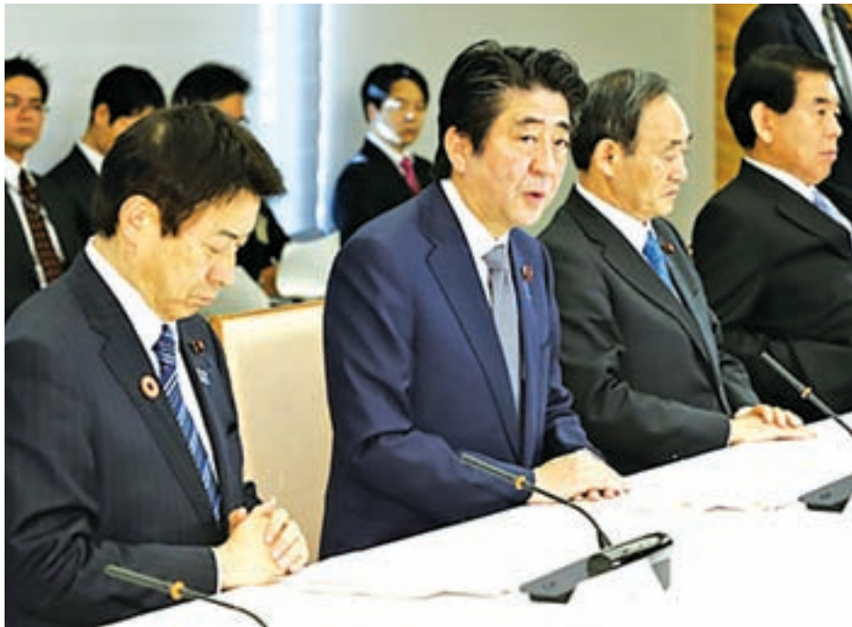
Prime Minister Shinzo Abe (2 nd from L) addresses a ministers' meeting to decide a national strategy on dementia on 27 Jan, 2015, in Tokyo. It is estimated that the number of elderly people suffering dementia will reach around seven million in Japan in 2025.

TOKYO, 27 Jan — The government on Tuesday adopted a new strategy to bolster measures against dementia, expecting the number of patients to reach about 7 million in Japan in 2025 as the population