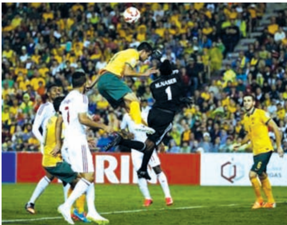
UAE's goalkeeper Majed Naser (C) punches the ball clear against Australia's Tim Cahill during their Asian Cup semi-final soccer match at the Newcastle Stadium in Newcastle on 27 Jan, 2015.

The UAE stunned champions Japan in a penalty shootout to reach the semi-finals for the first time since 1996 but another upset never looked on the cards after Australia's early salvo.