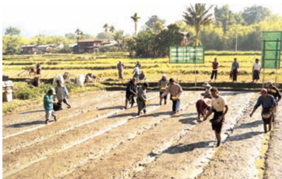
farmland in ThaleU Village, with participation of five farmers.—Nay Myo Thurein

In 2014-15, competitive cultivation of Palethwe hybrid paddy to produce over 200 baskets per acre will be held on 10 acres of