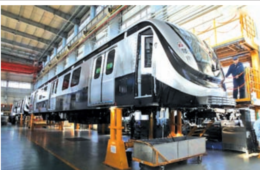
File photo taken on 8 Dec, 2014 shows workers installing a subway for export to Brazil in CNR Changchun Railway Vehicles Co, Ltd in Changchun, capital of northeast China’s Jilin Province. China CNR Corporation Limited, a leading manufacturer of locomotives in China, announced a subway export contract with the United States on Monday. It is the country’s first foray into the US rail transit market. China CNR will sell 284 subway trains worth 4.118 billion yuan (670 million US dollars) to the transportation regulator in Massachusetts, to equip Boston’s Red and Orange subway lines, according to the announcement.