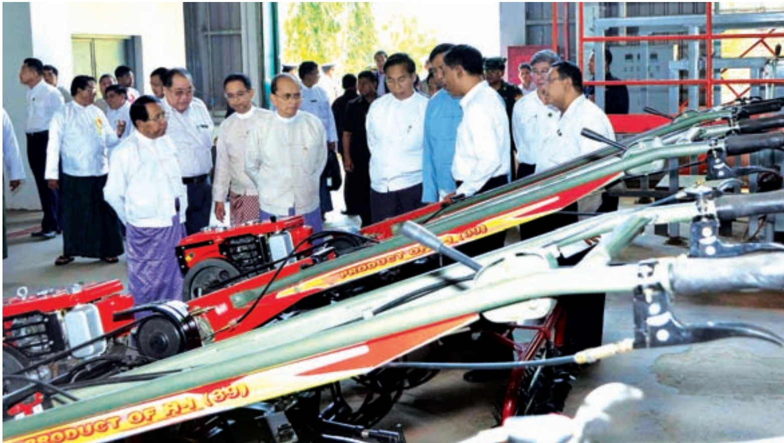
President U Thein Sein views power-tillers to be sold to farmers through installment.

NAY PYI TAW, 27 Jan— Productive loans are aimed at reducing poverty and stabilizing incomes for people in rural areas and enabling them to afford education, health and living expenses, President U Thein Sein told a meeting with cooperative members in Kyaukse township, Mandalay Region, on Tuesday, officials said.