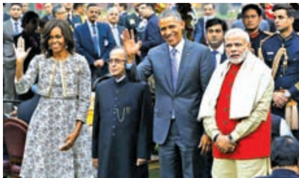
US President Barack Obama and first lady Michelle Obama wave as they pose with India’s President Pranab Mukherjee (2 nd L) and Prime Minister Narendra Modi (R) during a home reception with several hundred Indian political and cultural figures at the Rashtrapati Bhavan presidential palace in New Delhi on 26 Jan, 2015.

It rained as troops, tanks and cultural floats filed through the heart of New Delhi, but excitement