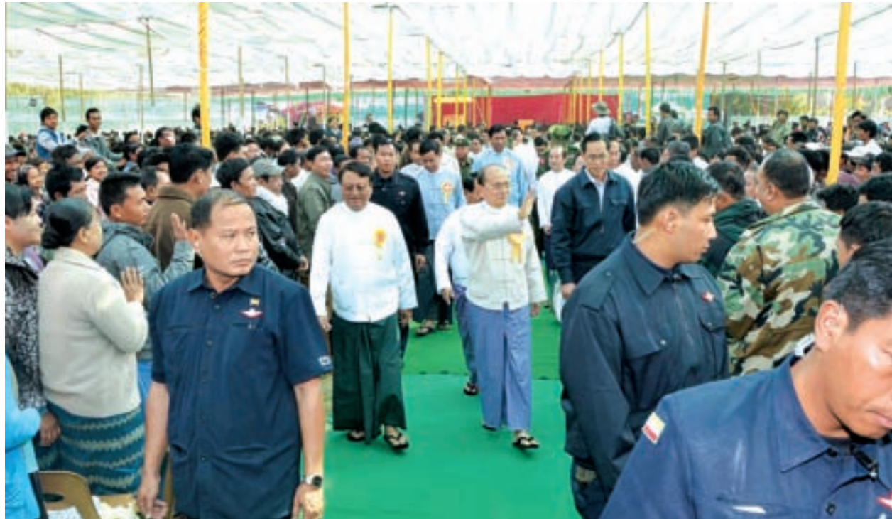
President U Thein Sein waves to departmental officials and local people in Kyaukse.