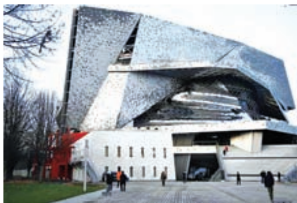
A general view shows the new Paris Philharmonic Hall "Philharmonie de Paris" by French architect Jean Nouvel is this picture taken on 14 Jan, 2015 before its inauguration.