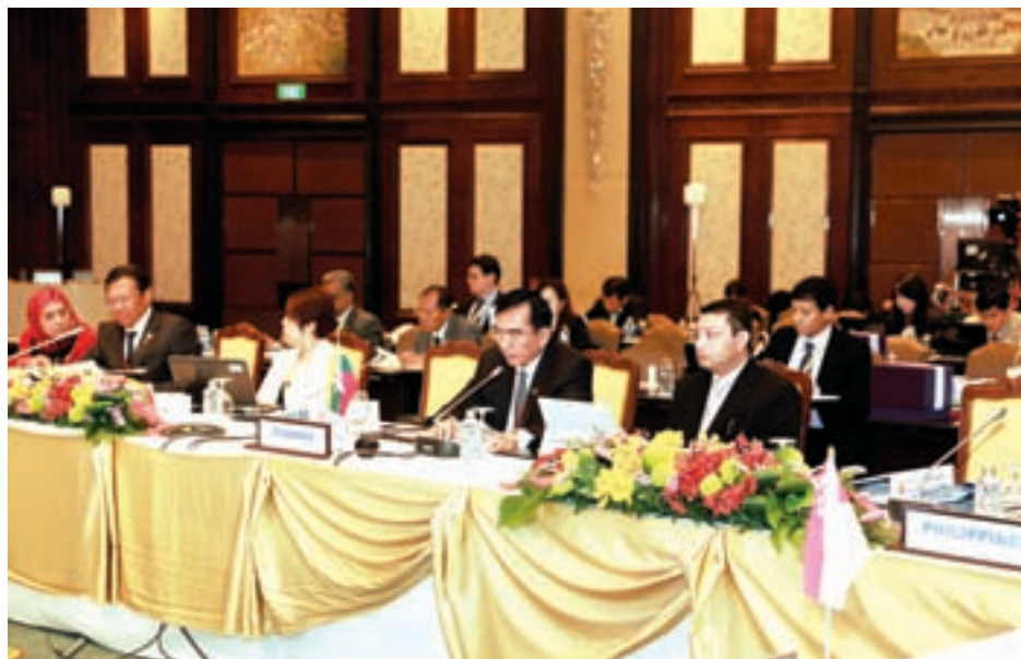
Union Minister U Myat Hein attends 14 th ASEAN Telecommunications and IT Ministers' Meeting (14 th TELMIN) in Bangkok, Thailand.—MNA

NAY PYI TAW, 27 Jan—Union Minister for Communications and Information Technology U Myat Hein attended the 14th ASEAN Telecommunications and IT Ministers' Meeting-(14 th TELMIN) in Bangkok, Thailand, on 22 and 23 January.