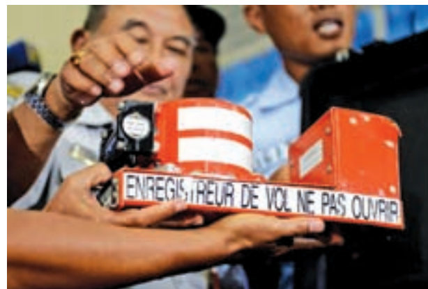
Indonesian soldiers show the cockpit voice recorder of AirAsia QZ8501 at Iskandar airbase in Pangkalan Bun, Central Kalimantan on 13 Jan, 2015.

JAKARTA, 27 Jan — A preliminary report into last month’s crash of an AirAsia passenger jet that killed 162 people will not include an analysis of the black box flight recorders, an Indonesian investigator said on Tuesday.