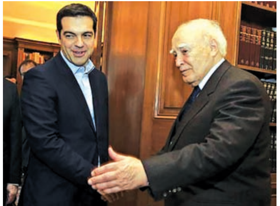
Greece's President Karolos Papoulias (R) welcomes Alexis Tsipras, Syriza party leader and winner of the Greek parliamentary elections, before Tsipras' swearing-in ceremony as Greece's first leftist prime minister in Athens on 26 Jan, 2015.

Stavros Theodorakis, leader of To Potami, a new centrist party once seen as a potential Syriza coalition partner, said he could not join a government that included the Independent Greeks, whom he called "far right" and "anti-European". But he said he would wait to see the government's programme before deciding whether to support a vote of confidence in parliament.