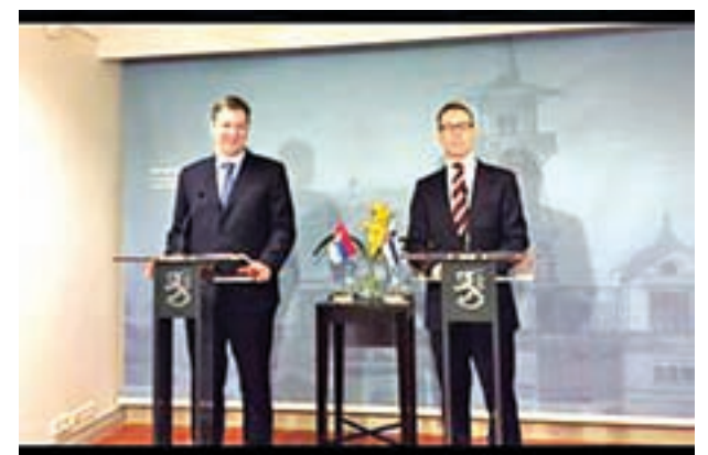
Serbia’s Prime Minister Aleksandar Vucic and Finland’s Prime Minister Alexander Stubb.—TANJUG

We are not asking for charity, we have embarked on the reforms on our own, without external pressure, because we want to be a modern, economically stable, European country. We want a healthy economy and hard work, he said.— Tanjug