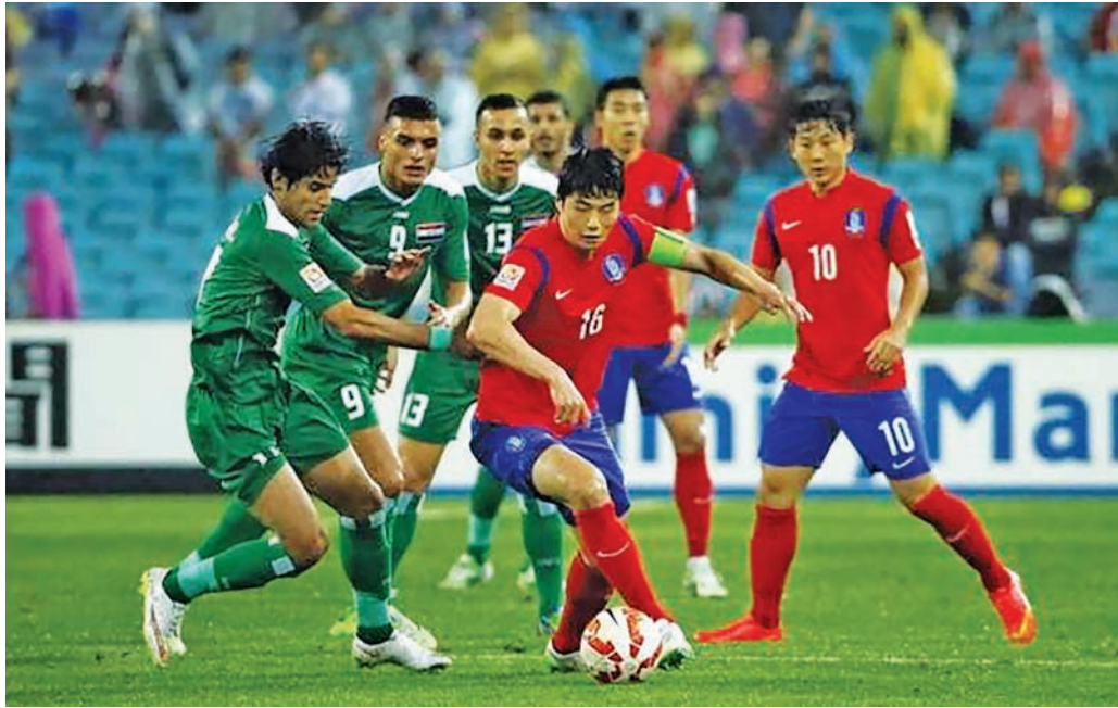
South Korea's Ki Sung-yueng (L) controls the ball during their Asian Cup semi-final soccer match against Iraq at the Stadium Australia in Sydney on 26 Jan, 2015.

Their hopes of another fairytale run to the title to match their 2007 triumph were washed away in the Sydney rain and it is twice champions South Korea