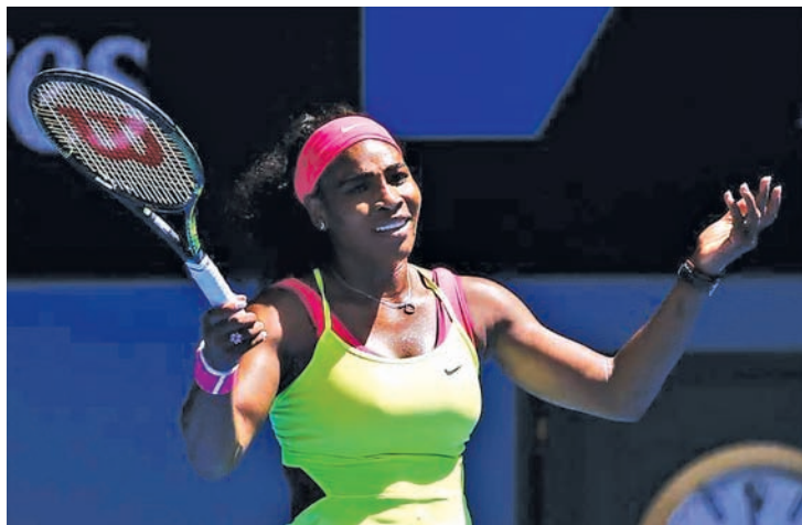
Serena Williams of the US reacts after missing a shot against Garbine Muguruza of Spain during their women's singles fourth round match at the Australian Open 2015 tennis tournament in Melbourne on 26 Jan, 2015.

MELBOURNE, 26 Jan — Serena Williams avenged last year's French Open loss to Garbine Muguruza at the Australian Open on Monday, overhauling the hard-hitting Spaniard 2-6, 6-3, 6-2 to reach the quarter-finals. The 24 th seed Muguruza stunned Williams in the second