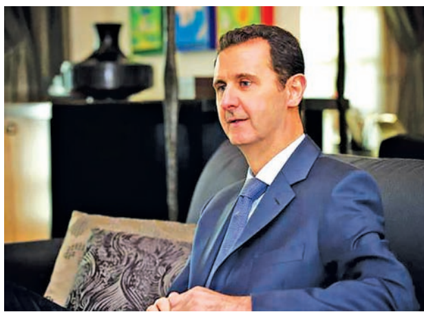
Syria's President Bashar al-Assad is seen during an interview with the American magazine Foreign Affairs published in Damascus on 26 Jan, 2015.

Since Islamic State took over much of Syria