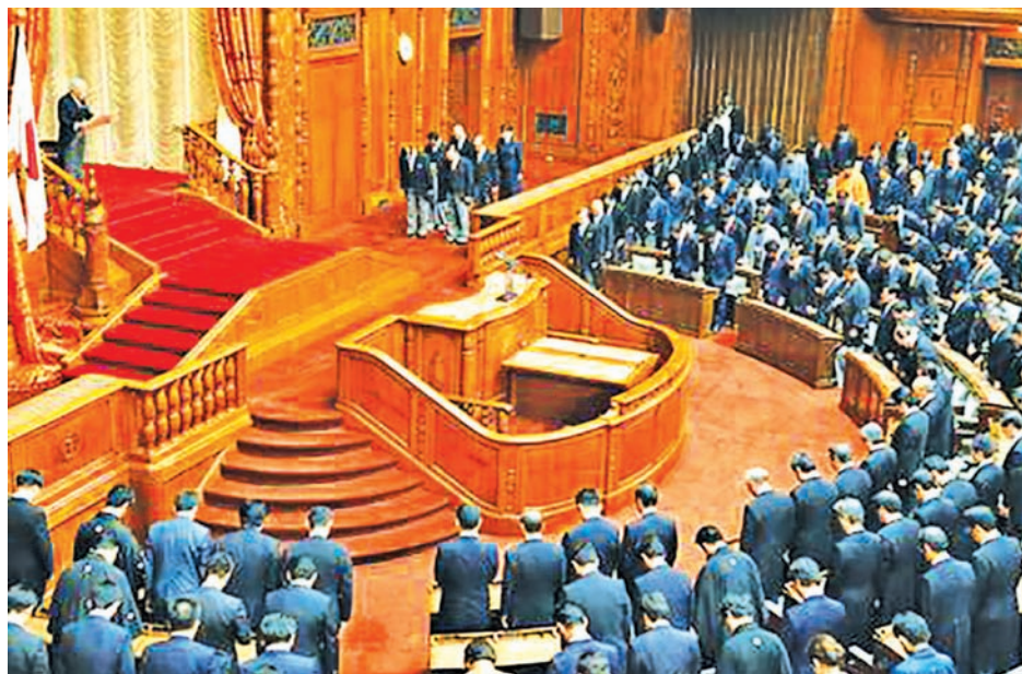
Photo taken on 26 Jan, 2015, at the House of Councillors chamber in Tokyo shows the opening ceremony of a 150-day regular Diet session, with the attendance of Emperor Akihito. The session was convened as Prime Minister Shinzo Abe continues to grapple with a hostage crisis.

Abe has portrayed the Diet session through 24 June as one to push for bold reform in various