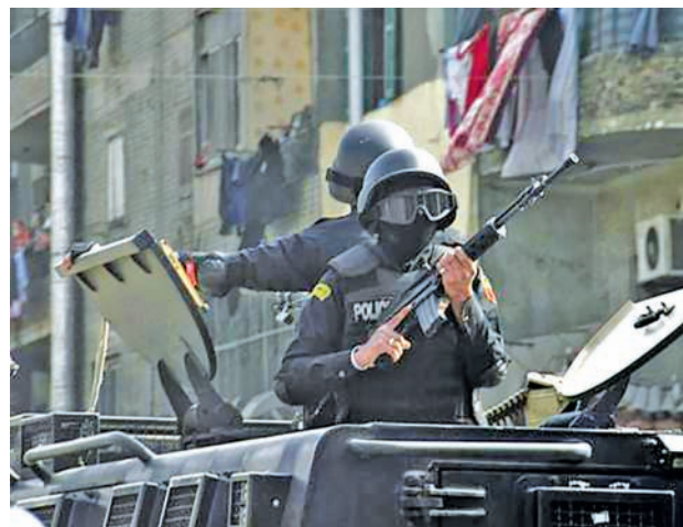
Police keep guard in a vehicle as others disperse an anti-government demonstration in Matariya area, east of Cairo on 25 Jan, 2015.

CAIRO, 26 Jan — At least 17 people were killed on Sunday in Egypt’s bloodiest protests since Abdel Fattah al-Sisi was elected president, as security forces fired at protesters marking the anniversary of the 2011 uprising that toppled Hosni Mubarak. Gunfire and sirens could be heard in Cairo into the night as armoured personnel carriers moved through the centre of a city where security forces had once again used lethal force against dissenters. A Health Ministry spokesman said at least 17 people had been killed at protests across the