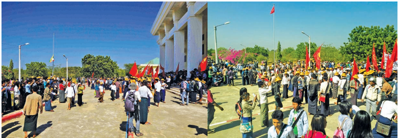
Student protesters taking down State Flag in front of main building at Myingyan Degree College in Myingyan Township.

ingyan Township around 6:00 p.m. together with some groups before staying the night at Sunlungu Buddhist monastery.— 040