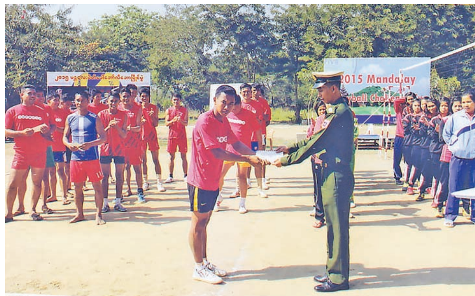
An official presents championship trophy to Central Command team.