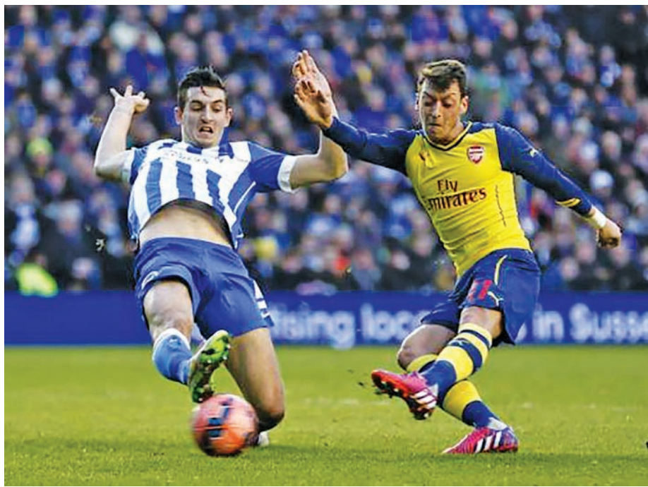
Arsenal's Mesut Ozil (R) scores a goal against Brighton and Hove Albion during their FA Cup fourth round soccer match at the Amex stadium in Brighton, southern England on 25 Jan, 2015.

West Ham United had substitute Diafra Sakho to thank for sparing their blushes against League