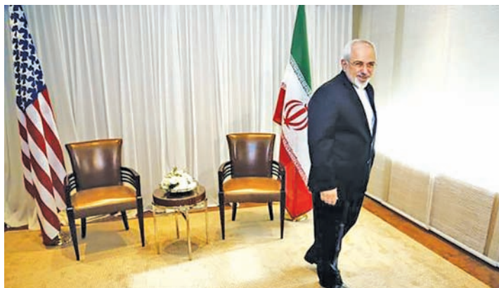
Iranian Foreign Minister Mohammad Javad Zarif is pictured before a meeting with US Secretary of State John Kerry in Geneva on 14 Jan, 2015.