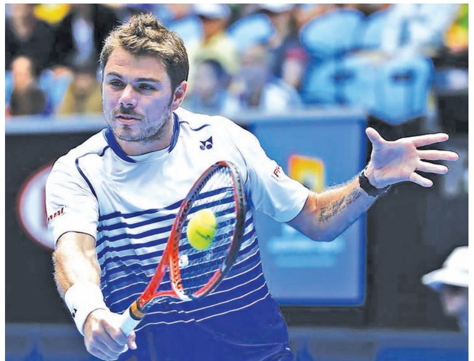
Stan Wawrinka of Switzerland hits a return to Guillermo Garcia-Lopez of Spain during their men's singles fourth round match at the Australian Open 2015 tennis tournament in Melbourne on 26 Jan, 2015.