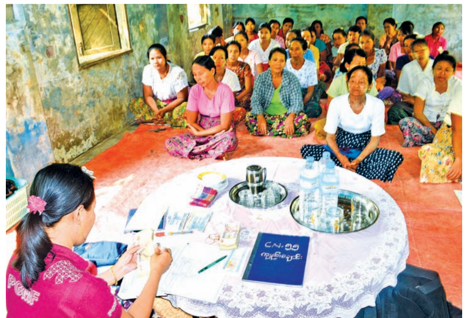
When villagers understand how to value loans and their businesses for getting out of poverty, they are ready to receive loans from the Pact Global Microfinance Fund.