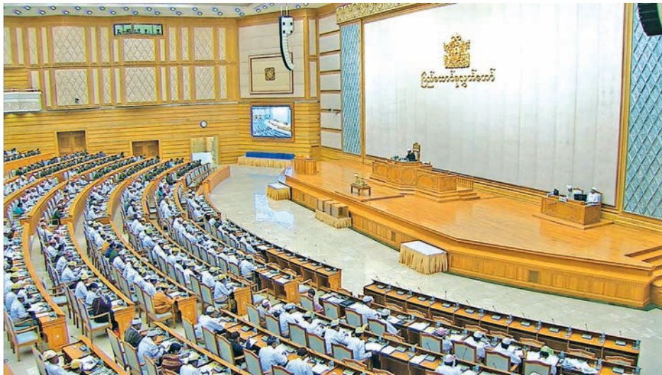
Pyidaungsu Hluttaw representatives focusing Union Budget bill.

NAY PYI TAW, 26 Jan—Pyidaungsu Hluttaw convened its fifth-day meeting Monday, with keeping records on separate funds of development projects in the message sent by President under 2014 Union Budget Bill, and discussing 2015 Union Budget Bill submitted by Ministry of Finance.