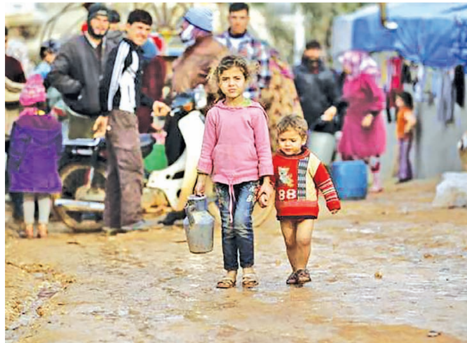
Internally displaced children walk inside Al-Karameh refugee camp beside the Syrian-Turkish border in the Northern Idlib countryside on 10 Jan, 2015.