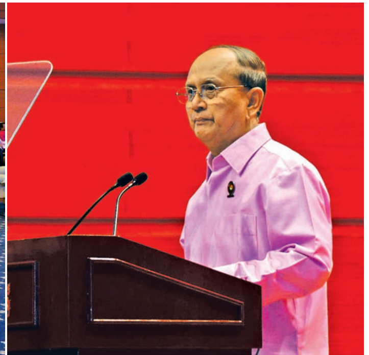
President U Thein Sein delivers speech at opening of the ASEAN Tourism Forum 2015.—MNA

NAY PYI TAW, 26 Jan — President U Thein Sein attended the opening of the ASEAN Tourism Forum 2015 at Myanmar International Convention Centre-II, here, on Monday evening.