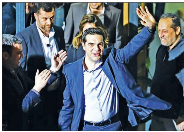
Head of radical leftist Syriza party Alexis Tsipras waves while leaving the party headquarters after winning the elections in Athens on 25 Jan, 2015.

Germany, Europe’s biggest economy, has insisted Greece must respect the terms of its 240 billion euro bailout deal, which saved the country from bankruptcy but at the cost of bitter sacrifices by the Greek people. As thousands of flag-waving supporters hit the streets of Athens, some shedding tears of joy, Germany’s Bundesbank warned Greece it needed reform to tackle its economic problems. Syriza’s campaign slogan “Hope is coming!” resonated with voters worn down by huge budget cuts and heavy tax rises during six years of crisis that has sent unemployment over 25 percent and pushed millions into poverty. “We hope our expectations will be fulfilled,” said 47-year-old teacher Efi Avgoustakoushe. “On Monday in class, we’re not allowed to comment and take sides but we will be smiling.” Tsipras said he would cooperate with fellow euro zone leaders for “a fair and mutually beneficial solution” but said the Greek people came first. “Our pri-