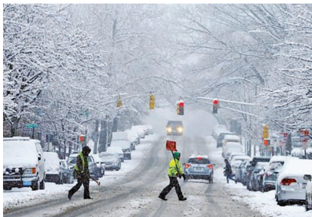
A snow shoveler crosses a street during a winter snowstorm in Cambridge, Massachusetts on 24 Jan, 2015.