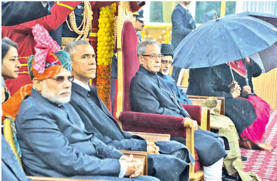
India's Prime Minister Narendra Modi (L-R), US President Barack Obama, India's President Pranab Mukherjee and Vice President Mohammad Hamid Ansari attend the Republic Day parade in New Delhi on 26 Jan, 2015.

NEW DELHI, 26 Jan — Barack Obama is the first US president to be guest of honour at India's annual Republic Day parade, a flamboyant display of the South Asian nation's military might and cultural diversity in the heart of the capital, New Delhi.