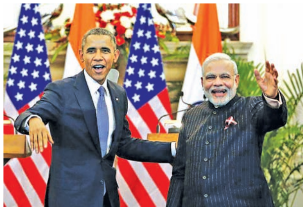
US President Barack Obama stands next to Indian Prime Minister Narendra Modi (R) waving as they leave after giving their opening statement at Hyderabad House in New Delhi on 25 Jan, 2015.

After India and Washington first reached a nuclear deal in 2006, nuclear commerce worth billions of dollars was meant to be the centerpiece of a new strategic relationship, allowing New Delhi access to