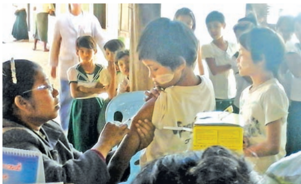
A health staff vaccinates school girl against measles and German measles.

NAY PYI TAW, 26 Jan—The mass immunization of measles and German measles commenced on 19 January across the nation.