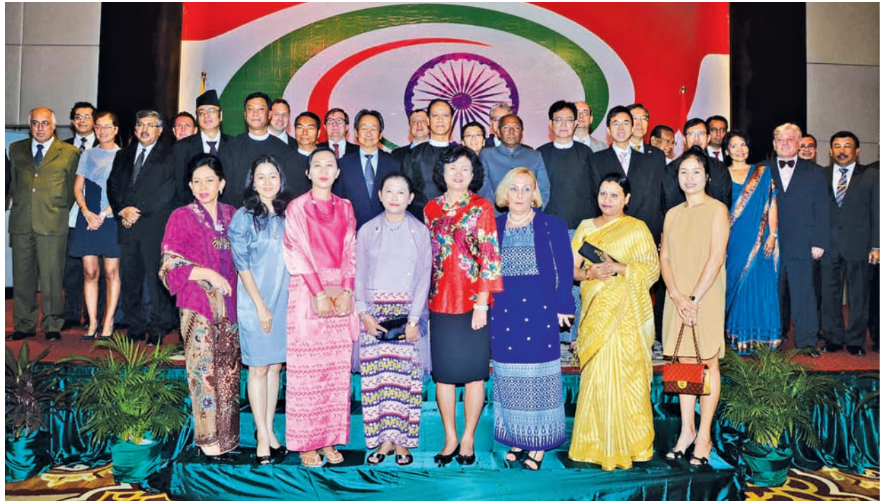
Vice President Dr Sai Mauk Kham poses for documentary photo with ambassadors and officials of UN agencies at the reception to mark 66 th Anniversary of Republic Day of India.

YANGON, 26 Jan — Vice President Dr Sai Mauk Kham attended a reception to mark the 66 th Anniversary of Republic Day of the Republic of India at Sedona Hotel on Kaba Aye Pagoda Road, on Monday evening.