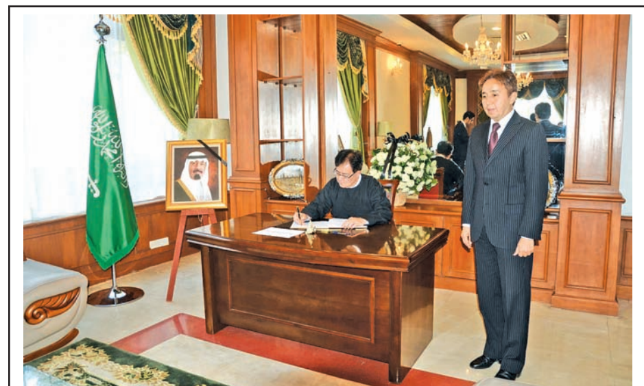
Deputy Minister for Foreign Affairs U Thant Kyaw signs the book of condolences for demise of King Abdullah bin Abdulaziz Al Saud of Saudi Arabia at the Saudi Arabian Embassy in Yangon on 26 January.—MNA

Aung Zin Phyoo Thein (Undergraduate Student of International Relations at the School of Government and International Affairs, Durham University, United Kingdom)