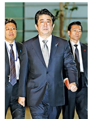
Prime Minister Shinzo Abe enters his office on 26 Jan, 2015, as the Japanese Diet convened a 150-day regular session. Abe is faced with a hostage crisis, in which one of two Japanese hostages being held by a group thought to be Islamic State is believed to have been killed.

The top government spokesman said Abe instructed his Cabinet ministers to make all-out efforts to secure the release of the freelance journalist when they gathered at the prime minister’s office on Monday. The person speaking in the audio statement