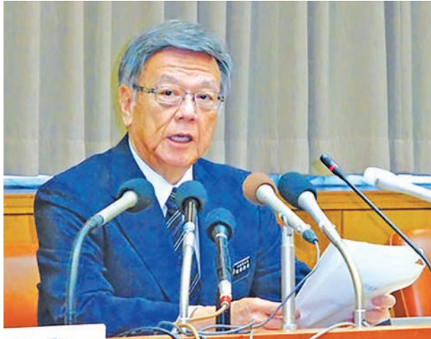
Takeshi Onaga, governor of Japan's southernmost island prefecture of Okinawa, attends a press conference on 26 Jan, 2015, in the prefectural capital of Naha. He said a panel of experts will be set up before the end of January to examine the validity of his predecessor's approval of a landfill to relocate a US military base within the prefecture.

NAHA, 26 Jan — Okinawa Gov Takeshi Onaga said on Monday a panel of experts will be set up before the end of January to examine the validity of his predecessor's approval of a landfill to relocate a US military base within the prefecture.