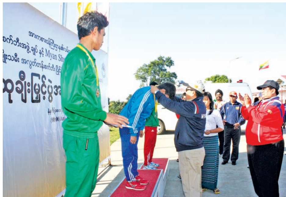
NAY PYI TAW, 25 Jan— Myanmar Cycling Federation and Myan Shwe Pyi Tractors Company jointly organized the Road Race Contest on Saturday.