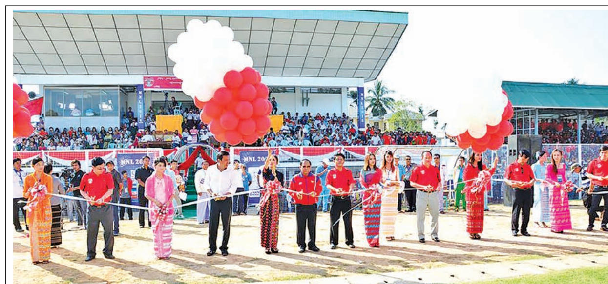
Ayeyawady Region Chief Minister U Thein Aung and President of Myanmar Football Federation U Zaw Zaw formally open new stadium of Ayeyawady United FC in Patheingyi on 24 January.