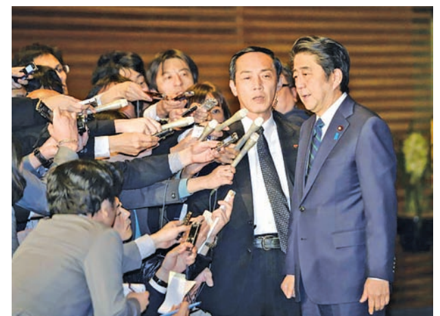
Japan's Prime Minister Shinzo Abe (R) speaks to the media at his official residence in Tokyo in this on 25 Jan, 2015 photo by Kyodo.—KYODO NEWS

"We are now analyzing (the authenticity of) the image," Defence Minister Gen