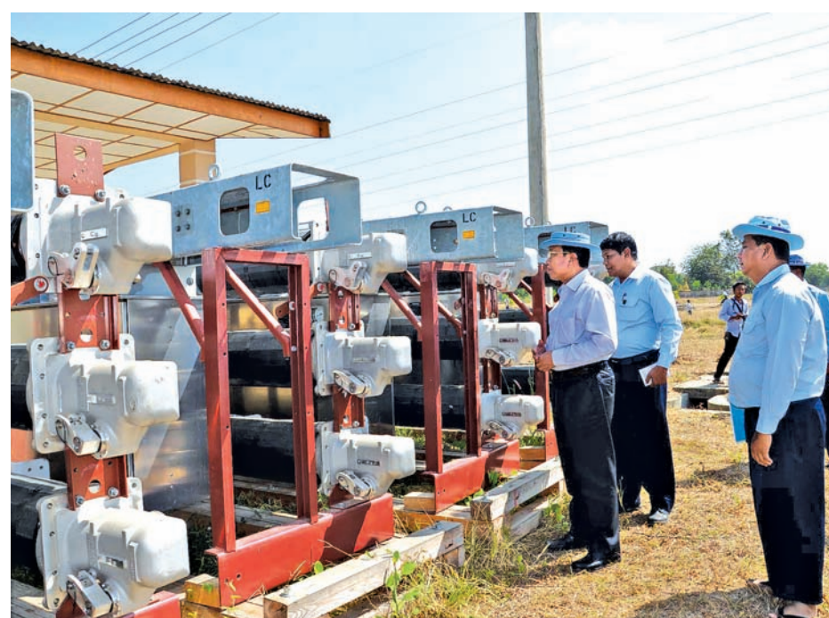
Union Minister for Electric Power U Khin Maung Soe inspects machine parts to be used at construction of power stations and power lines in Ayeyawady Region.—MNA

NAY PYI TAW, 25 Jan — The Ministry of Electric Power constructs power grids for supply of electricity to local people in Ayeyawady Region. At present, electri-