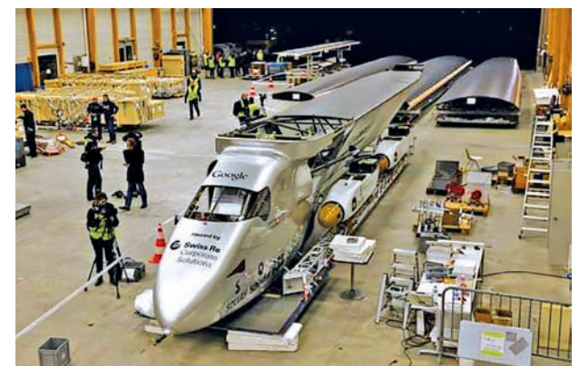
The dismantled Solar Impulse 2 aircraft is pictured before being loaded into a Cargolux Boeing 747 cargo aircraft at Payerne airport on 5 Jan, 2015.

The plane, which has the weight of a family car (2,300 kg, 5,100 pounds) and a wingspan equal to that of the largest passenger airliners, will take off in late February and return by late July. Its journey