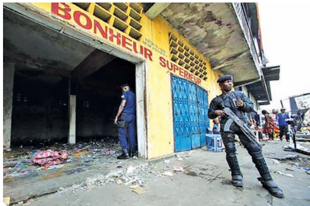
A police officer stands guard in front of a store that was looted during violent protests in Kinshasa, Democratic Republic of Congo on 23 Jan, 2015.

The same envoys have met the presidents of the Senate and National As-