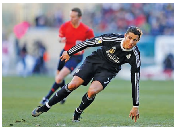
Real Madrid's Cristiano Ronaldo is seen during their Spanish First Division soccer match against Cordoba at El Arcangel stadium in Cordoba on 24 Jan, 2015.