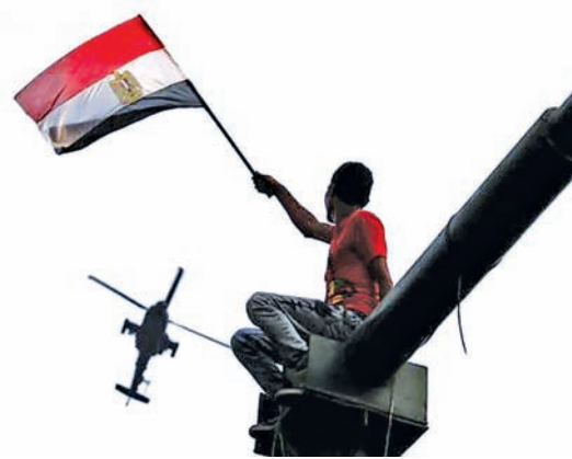
A man waves an Egyptian national flag as a military helicopter circles over Tahrir Square, in Cairo, on 8 June, 2014.

Tensions have been rising in Egypt. A woman protester was shot dead on Saturday near Cairo's Tahrir Square, the symbolic heart of the revolt that ended Mubarak's 30 years of rule. Dozens of protesters were killed during last year's an-