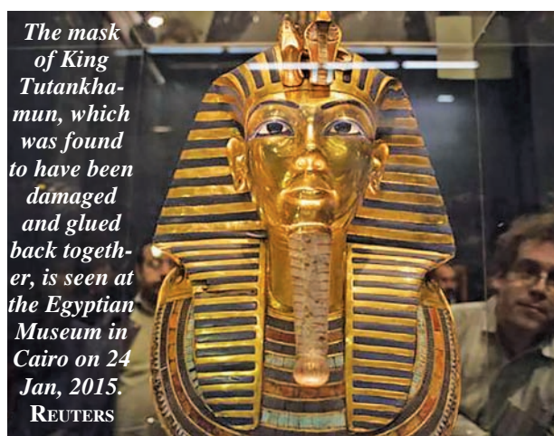
The mask of King Tutankhamun, which was found to have been damaged and glued back together, is seen at the Egyptian Museum in Cairo on 24 Jan, 2015.

a line of glue around its chin, prompting speculation about the damage and questions over whether Egypt was able to care for its priceless artefacts. The beard broke off when museum workers were changing the lights in its display case and accidentally touched the mask, the antiquities ministry said. Christian Eckmann, a German conservator brought in to evaluate the