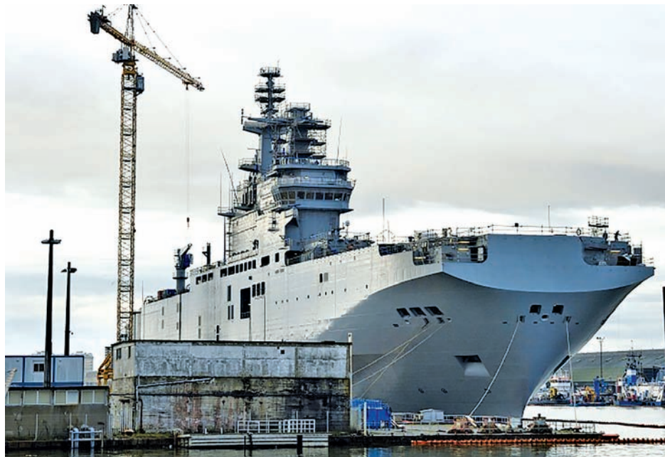
Mistral (L9013) is an amphibious assault ship, a type of helicopter carrier.

we know how to use them. If they give back our money, we know how to use it too, but in either case it would have an adverse impact of the technical rearming of the Russian Navy,” Borisov said.— Itar-Tass