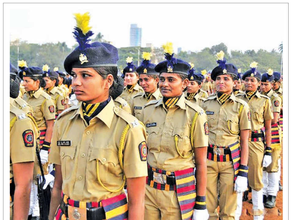
Indian policewomen rehearse for the upcoming Republic Day parade at Shivaji Park in Mumbai, India on 24 Jan, 2015. India is to celebrate its 66 th Republic Day on 26 Jan with a large military parade.