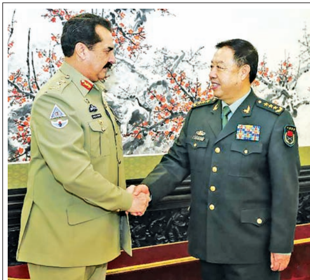
Vice Chairman of China's Central Military Commission Fan Changlong (R) meets with Chief of Staff of the Pakistani Army Raheel Sharif in Beijing, capital of China, on 25 Jan, 2015.

The doctor was paid 7,000 yuan for helping her find the couple who bought the boy, the procuratorate said. The boy is now in the care of his grandmother. Further investigation is under way.—Xinhua