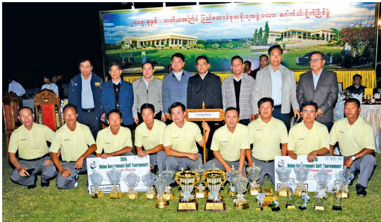
Vice President U Nyan Tun poses for documentary photo with champion Ministry of Defence team in Third Union Government's Cup Golf Tournament.

NAY PYI TAW, 25 Jan — Vice President U Nyan Tun attended the prize presentation for the Third Union Government's Cup