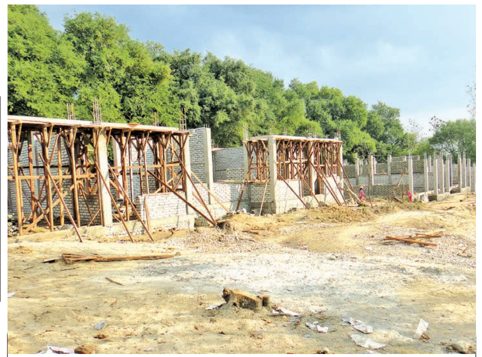
Staff quarters being built at Station Hospital (16-bed) in Buta Village, Tatkon Township.