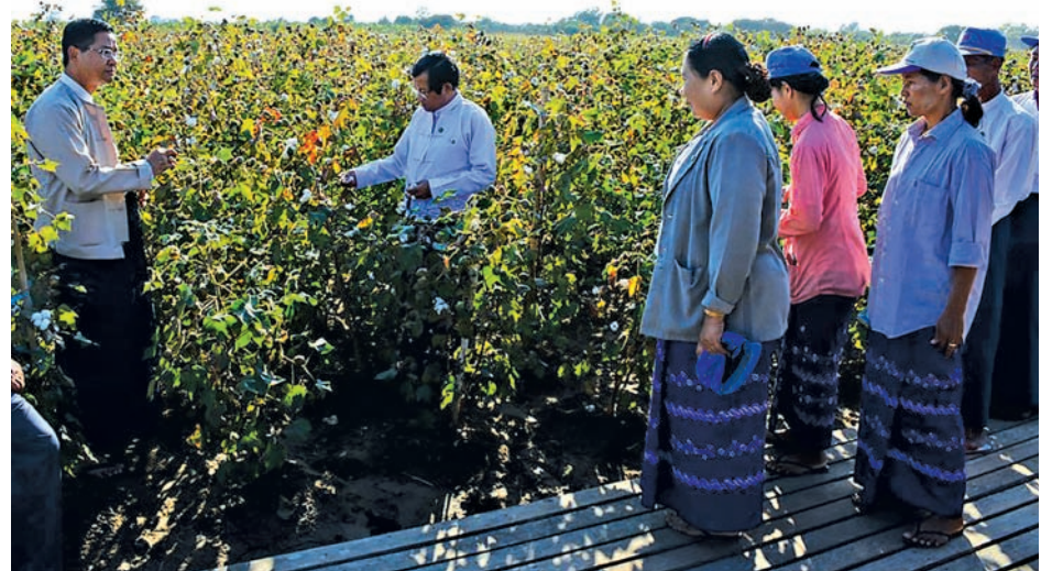
Union Minister for Agriculture and Irrigation U Myint Hlaing views thriving cotton plants at Shwedaung Research Farm in Nay Pyi Taw.

NAY PYI TAW, 25 Jan — The Ministry of Agriculture and Irrigation is focusing on distribution of quality strains of crops and raising income of farmers. Shwedaung Research Farm under Department of Industrial Crops Development is producing quality seeds of paddy and crops in Nay Pyi Taw. Union Minister for Agriculture and Irrigation U Myint Hlaing viewed thriving Palethwe hybrid paddy, Shwedaung-9 and Ngwechi-8 long staple cotton research plantations on Saturday afternoon.