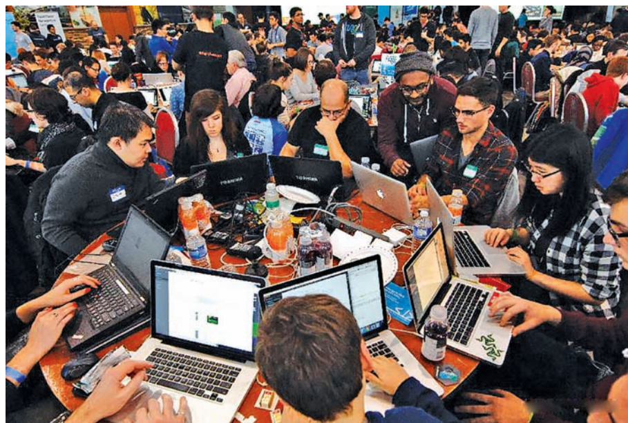
People learn how to code during the 2nd annual HTML500 free coding camp in Vancouver, Canada, on 24 Jan, 2015. The HTML500 is a one-day event where Canada's top 50 tech companies come together to teach 500 people how to code for free. By the end of the day, attendees will create their very own landing page, networked with 100 developers, and possibly even gotten hired by one of the 50 companies in attendance at this massive celebration.