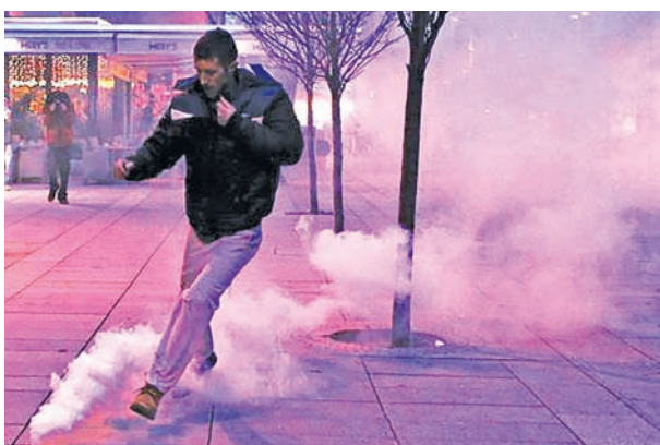
A protester kicks a tear gas canister during a protest in the centre of Pristina on 24 Jan, 2015.

Fearing bankruptcy, Kosovo's new government