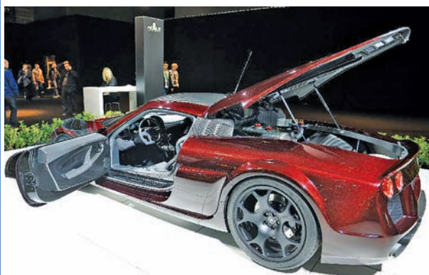
Photo taken on 23 Jan, 2015 shows a NOBLE M600 coupe at Brussels Motor Show in Brussels, Belgium.