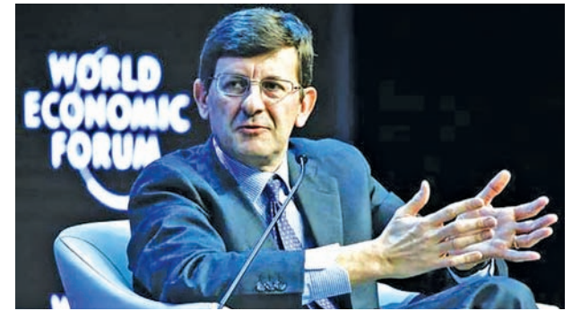
Vittorio Colao, CEO of Vodafone Group, gestures during the session "The Future of the Digital Economy" in the Swiss mountain resort of Davos on 22 Jan, 2015.

"Is fragmentation happening? Quite frankly, there is a temptation," said Vittorio Colao, chief executive of mobile telecoms group Vodafone, who pointed to different regulatory regimes as an impediment to network traffic. A growing volume of business relies on the Internet, from tourism to