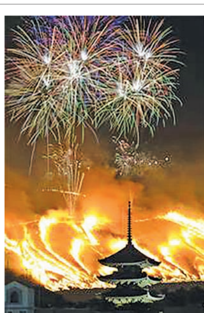
Wakakusa Yamayaki in Nara Grass is burned on the hillside of Mt Wakakusa in the city of Nara during an annual festival on 24 Jan, 2015, as fireworks preceded it. The festival is held on the fourth Saturday in January and has been taking place for hundreds of years. At front is the five-story pagoda of Kofukuji, a Buddhist temple. Photo was taken by multiple exposure from 6:19 pm to 6:40 pm.

KABUL, 25 Jan — One attacker was killed and two civilians were wounded after a suicide truck bomb rocked Afghan capital of Kabul early Sunday morning, police said. "A truck packed with explosive was detonated along ring road in Qasaba locality at 05:45 am (local time), and the explosion injured slightly two civilian passersby," the Kabul police said in a statement. The attacker was killed on the spot and the truck was destroyed, the statement said, adding that "the explosives were planted under the fruit boxes for carrying out a subversive attack." The potential target remained unknown but, witnesses said the target might have been the nearby front gate of military airport, lying in north of Hamid Karzai International Airport. The road was not busy when the incident occurred. The Taliban insurgent group claimed responsibility for the attack. About 10,000 civilians were killed and injured in Taliban-led insurgency and conflicts in the central Asian country in 2014, according to UN mission officials. The officials blamed the attacks of Taliban insurgents and other armed groups for most of the civilian deaths and injuries.—Xinhua