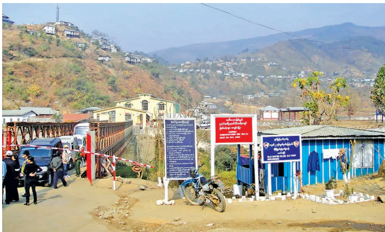
Myanmar has opened border trade camps at her neighbouring countries, including India to promote trade promotion through normal and border trade routes. A border gate at Reedkhoda Town, Chin State, shaing border with India.

He also said India has believed that its development could not be complete and sustainable unless it built productive partner-