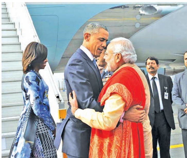
US President Barack Obama hugs India's Prime Minister Narendra Modi as he arrives at Air Force Station Palam in New Delhi on 25 Jan, 2015.

Obama will be the first US president to attend India's Republic Day parade, an annual show of military might long associated with