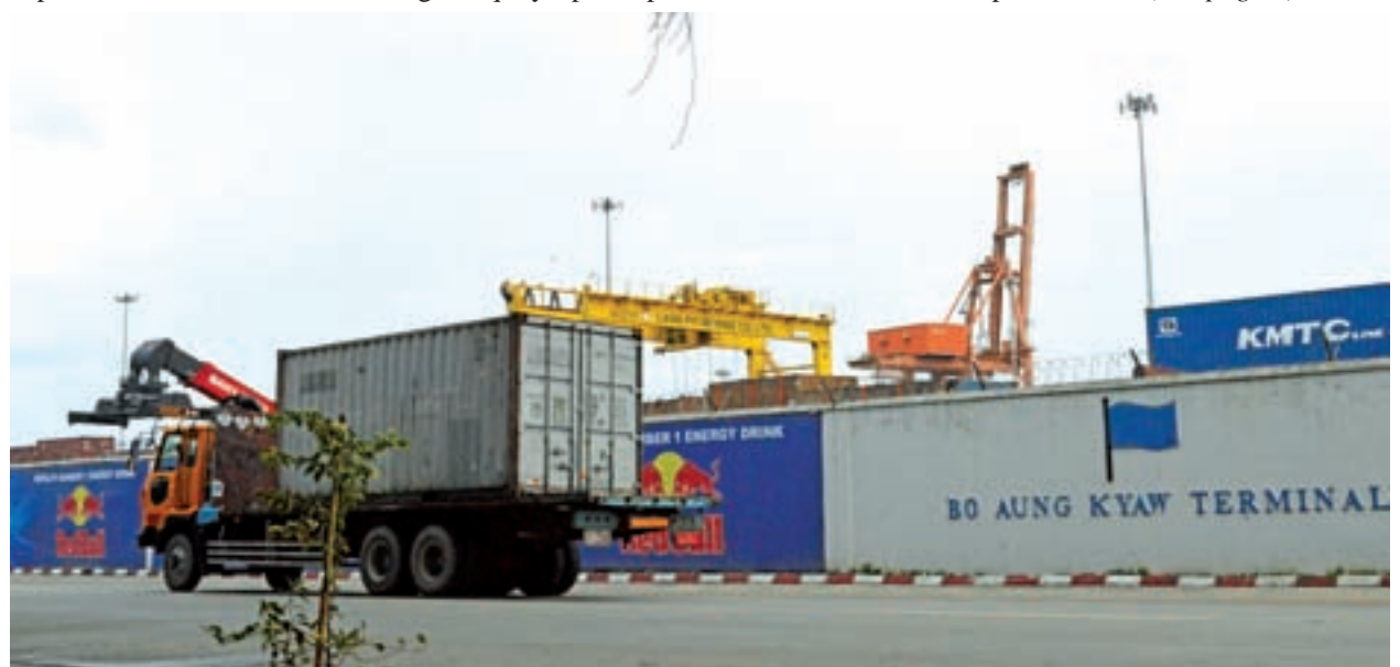
Photo of Bo Aung Kyaw Terminal, one of the major port terminals handling cargo ships and goods in Yangon.

"We recognized that Myanmar still needs additional efforts covering the range of policy domains such as customs procedures, customs valuation, trade facilitation, foreign investment, business environment, import and export licensing, taxes and (See page 3)