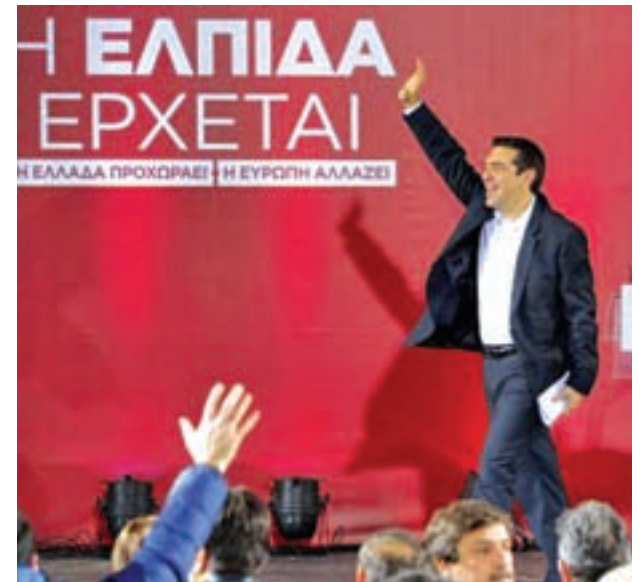
Opposition leader and head of radical leftist Syriza party Alexis Tsipras waves to supporters during a campaign rally in Heraklion, on the island of Crete, on 22 Jan, 2015.

ATHENS, 24 Jan — Greece's anti-bailout leftists Syriza held their lead over the ruling Conservatives in two of the final opinion polls to be published before Sunday's snap election, although one survey showed the gap widening as another showed it narrowing slightly.