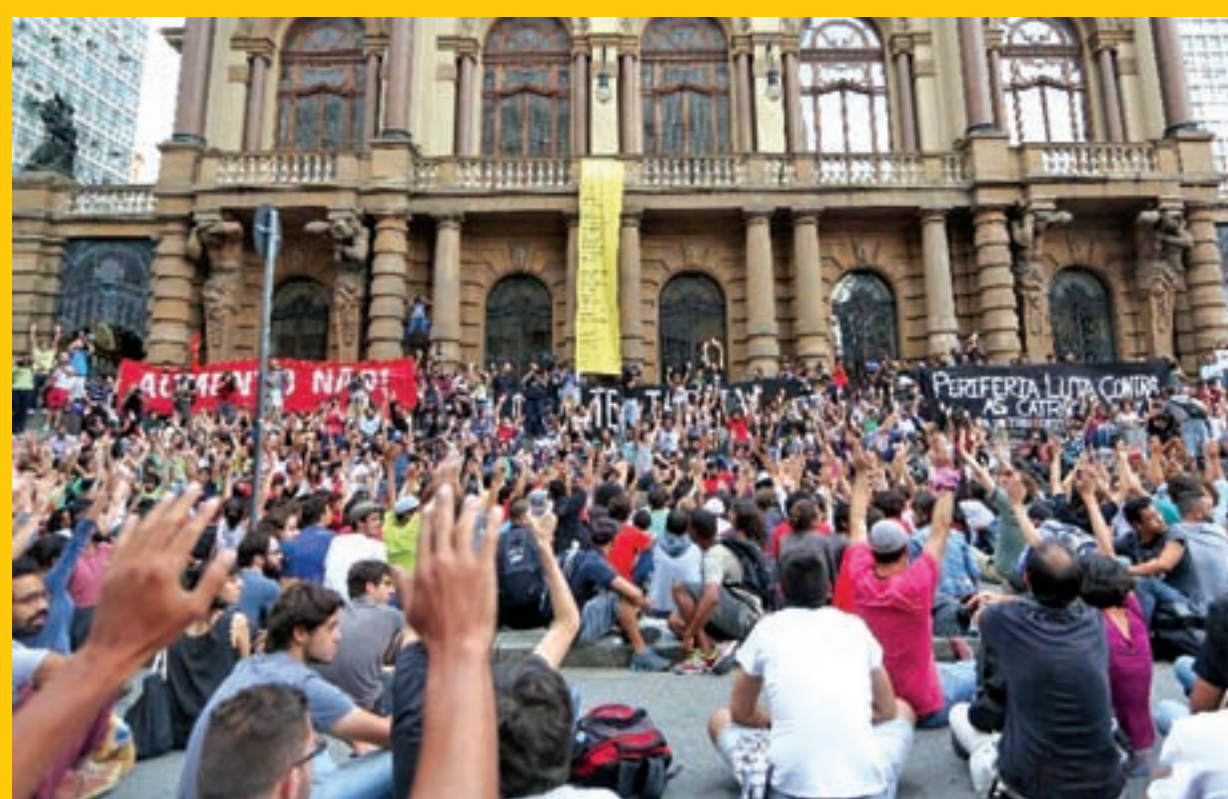
Residents take part in a protest against the increase of the fares of public transportation, in Sao Paulo, Brazil, on 23 Jan, 2015. Activists of the movement "Passe Livre" (free fare) and residents, rallied on Friday against the increase on the fares of buses, trains and subway which came into effect on January, according to local press.

Lebanon's security has been repeatedly jolted by the Syria conflict, which has also helped paralyze its government. The country has been without a head of state since May.