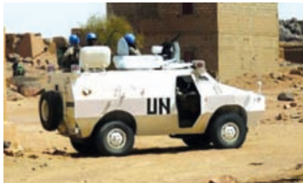
UN peacekeepers patrol in the northern town of Kidal, in this file photo taken on 17 July, 2013.—REUTERS

MNLA said they were attacked first and denied warning shots had been fired.— Reuters