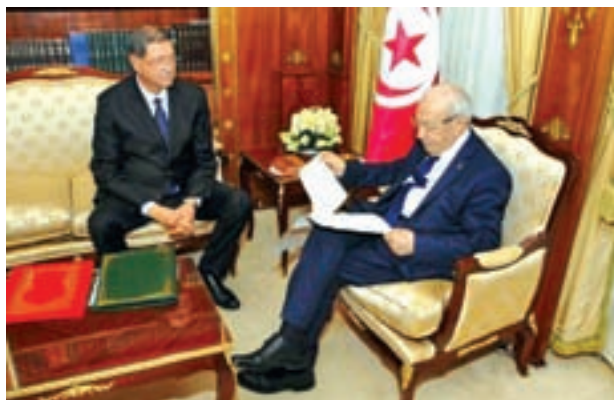
Tunisia’s nominated prime minister Habib Essid (L) gives the list of the new government to President Beji Caid Essebsi in Tunis on 23 Jan, 2015.

the programme of Nidaa Tounes with the help of the other parties. It is a government for all Tunisians to apply democracy,” Essid said.