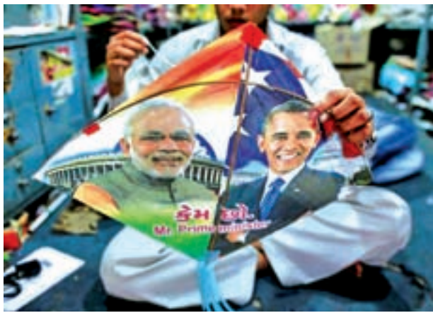
An employee ties threads on a kite, with portraits of Indian Prime Minister Narendra Modi (L) and US President Barack Obama, ahead of Obama's visit, in Mumbai on 23 Jan, 2015.

King Abdullah died on Friday after a short illness and has been succeeded by his elderly brother Salman,