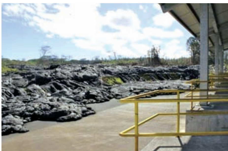
Lava flow from the Kilauea volcano is pictured having breached a fence but stopped feet away from a transfer station outside the village of Pahoa on Hawaii's Big Island on 8 Dec, 2014.

Ace Hardware representatives said they plan to reopen on 1 February, and a Longs Drugs Store in a nearby complex could open as soon as Monday. Several smaller restaurants, markets and boutiques are