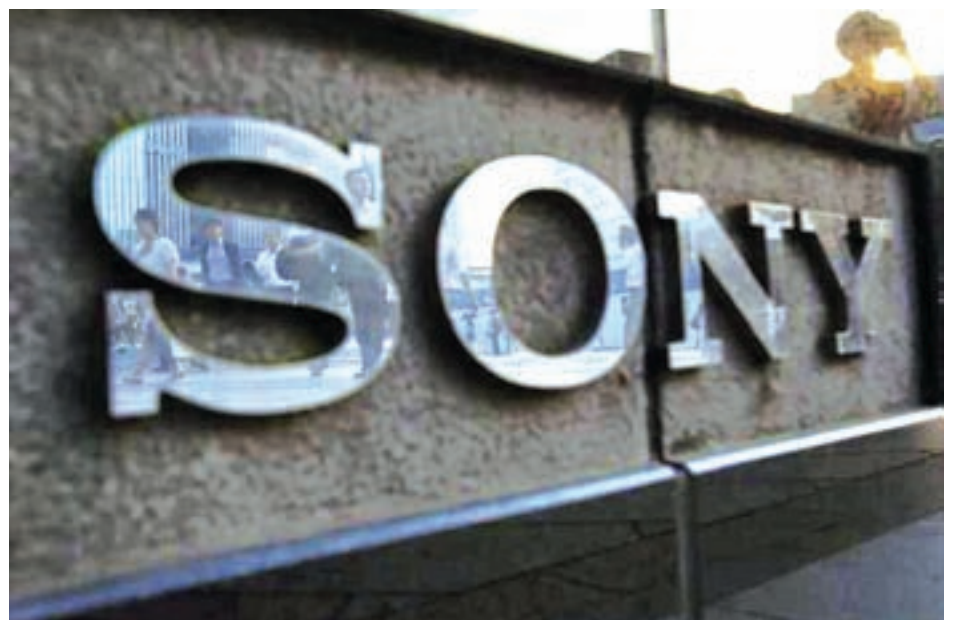
Pedestrians are reflected in a logo of Sony Corp outside its showroom in Tokyo on 16 July, 2014.

TOKYO, 24 Jan — Sony Corp said it was delaying the official submission of its third-quarter results due to the massive cyberattack on Sony Pictures Entertainment, which debilitated network systems at the Hollywood studio.