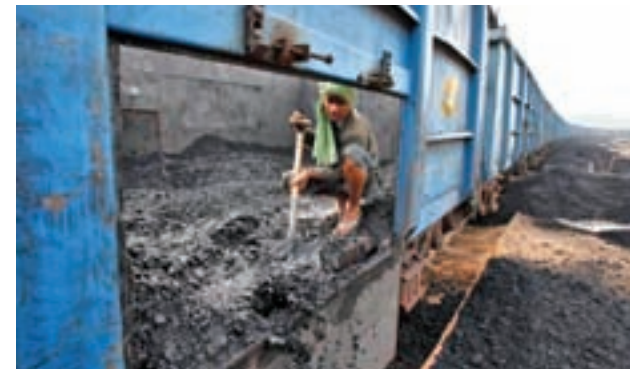
A worker unloads coal from a goods train at a railway yard in Chandigarh on 8 July, 2014.

such as the Adani Group (ADEL.NS), controlled by billionaire Gautam Adani, and GVK are likely to bid for commercial coal blocks to cash in on fast-rising demand from the power industry.