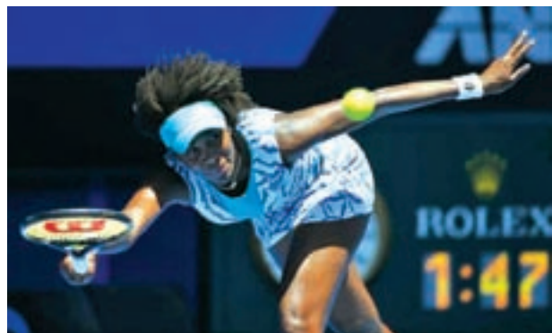
Venus Williams of the US stretches to hit a return to Camila Giorgi of Italy during their women's singles third round match at the Australian Open 2015 tennis tournament in Melbourne on 24 Jan, 2015.