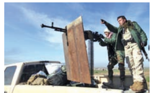
Kurdish Peshmerga fighters keep watch during the battle with Islamic State militants on the outskirts of Mosul on 21 Jan, 2015.

Peshmerga forces this week launched a ground