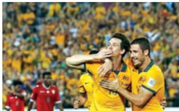
Australia's Robbie Kruse (L) celebrates his goal with team mate Mathew Leckie during their Asian Cup Group A soccer match against Oman at the Stadium Australia in Sydney on 13 Jan, 2015.

The Bayer Leverkusen forward missed the World Cup last year after being forced to undergo