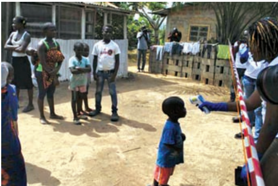
Health workers take the temperature of a boy who came in contact with a woman who died of Ebola virus in the Paynesville neighbourhood of Monrovia, Liberia on 21 Jan, 2015.

firmed Ebola cases in Liberia as of today,” said Deputy Health Minister Tolbert Nyenswah, who heads Liberia's Ebola taskforce.