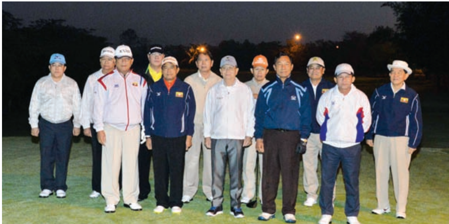
President U Thein Sein poses for documentary photo with state dignitaries at the opening of the third Union Government Cup Golf Tournament in Nay Pyi Taw.

NAY PYI TAW, 24 Jan —President U Thein Sein took part in the third Union Government Cup Golf Tournament held in Nay Pyi Taw on Saturday. Over