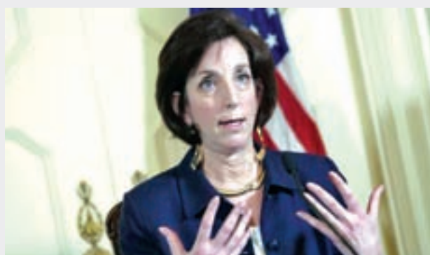
US Assistant Secretary for Western Hemisphere Affairs Roberta Jacobson speaks during a conference in Havana on 23 Jan, 2015.