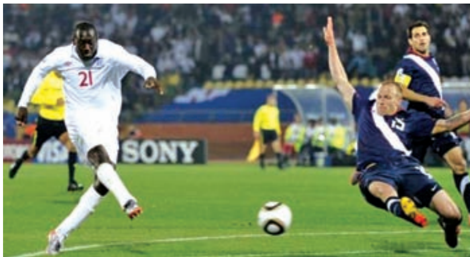
England's Emile Heskey (L) fails to score against the US during the 2010 World Cup Group C soccer match at Royal Bafokeng stadium in Rustenburg on 12 June, 2010.

LONDON, 24 Jan — The FA Cup holds fond memories for Emile Heskey, but a chance to play against former team Liverpool, when a few months ago he was clubless and working for their TV channel, will be among the sweetest for the former England striker.