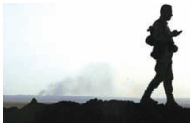
Smoke rises from a recent US air strike on Islamic State (IS) militant positions in Khazir, on the edge of Mosul in this file photo taken on 16 Sept, 2014.—REUTERS

In Syria, the US-led coalition conducted 12 strikes, including 10 near the besieged border town of Kobani that struck seven units of militant fighters, the statement said. An air strike near Al Hasaka destroyed a mobile oil drilling rig.—Reuters