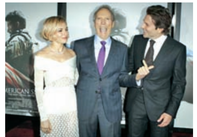
Actress Sienna Miller (L), director Clint Eastwood and actor Bradley Cooper (R) arrive for the premiere of the film "American Sniper" in New York on 15 Dec, 2014.

son's role in the fight for voting rights for blacks.