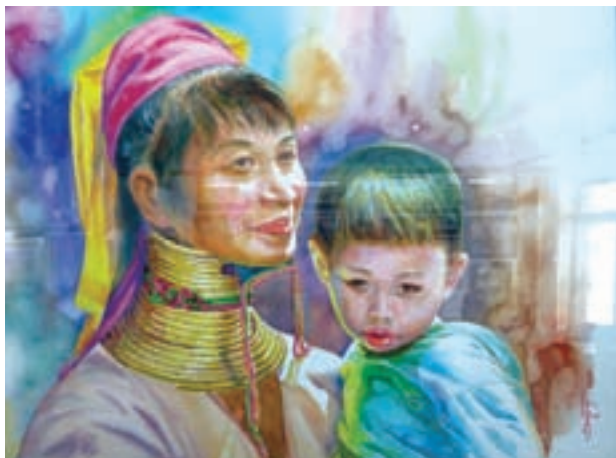
A watercolour created by a local artist is on display for sale at River Ayeyawady Gallery in Yangon.