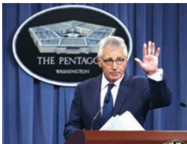
US Secretary of Defence Chuck Hagel waves at the end of a news conference at the Pentagon in Washington, on 22 Jan, 2015.

He said the advanced element of US forces headed to establish training sites amounted to fewer than 100 troops.