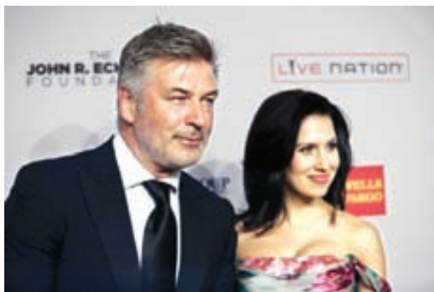
Actor Alec Baldwin (L) and his wife Hilaria Baldwin arrive at the Elton John AIDS Foundation's 12 th Annual "An Enduring Vision" benefit gala at Cipriani in New York on 15 Oct, 2013.

NEW YORK, 24 Jan — Emmy-winning actor and reputed hothead Alec Baldwin is putting his actions into words. A memoir about his life, the ups and downs of his career and his struggles with addiction is due out next year, publisher HarperCollins said on Friday. The book, entitled "Nevertheless," is scheduled for launch in the autumn of 2016.