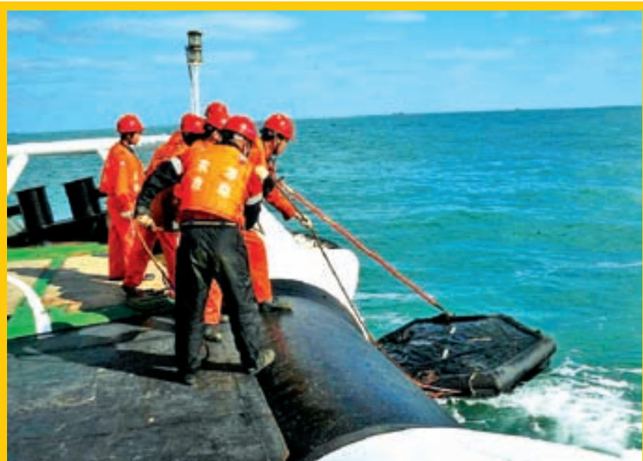
Rescuers salvage a life raft of a fishing boat that sank in the East China Sea, on 23 Jan, 2015. Three people were saved from a fishing boat that sank in the East China Sea after colliding with another vessel on Thursday night, leaving another ten people on board unaccounted for.