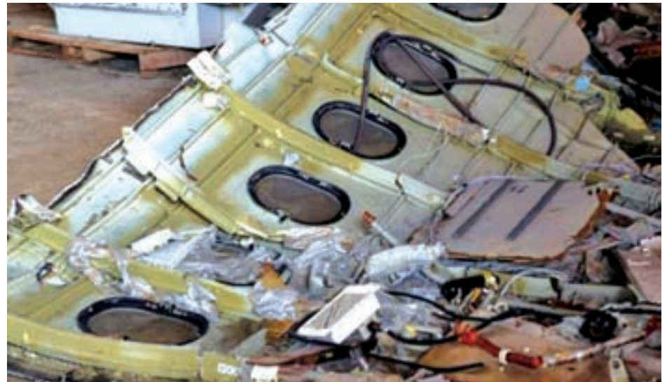
Part of the fuselage of crashed AirAsia Flight QZ8501 is seen inside a storage facility at Kumai port in Pangkalan Bun, on 19 Jan, 2015.

ABOARD KRI BANDA ACEH, 23 Jan — Indonesian divers on Thursday found six bodies near the fuselage of an AirAsia (AIRA.KL) jet that crashed last month into the Java Sea, but were unable to enter the wreckage where most of the victims are believed to be trapped, a navy official said.