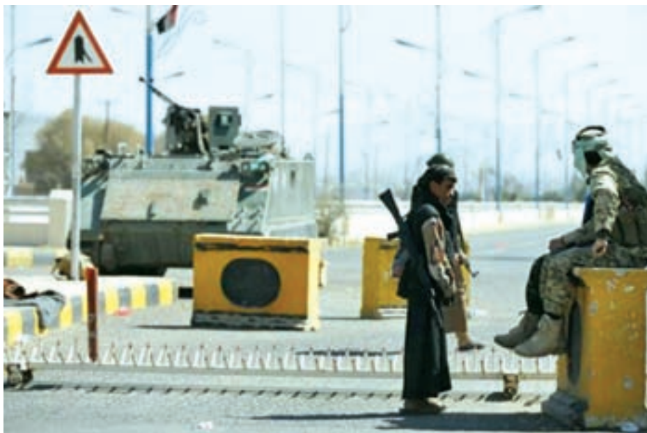
Houthi fighters secure an entrance to the presidential palace in Sanaa on 22 Jan, 2015.

His legacy was an effort to overhaul the kingdom's economic and social systems to address a looming demographic crisis by creating private sector jobs and making young Saudis better prepared to take them.—Reuters