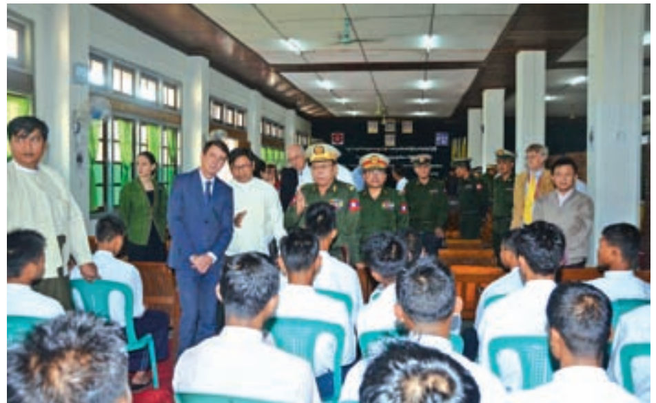
Senior military officers meet youths who have already withdrawn from military units at handing over ceremony of child soldiers.

YANGON, 23 Jan—A ceremony to hand over 42 child soldiers to parents or guardians was held at No 1 Transit Centre, here, on Friday.