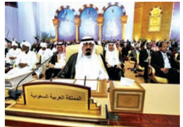
Saudi Arabia's King Abdullah attends the opening session of the Arab summit in Doha on 30 March, 2009.

But by immediately announcing the appointment of his youngest half-brother Muqrin bin Abdulaziz as Crown Prince, King Salman decisively moved to end speculation about the direction of the royal succession and splits in the ruling family.