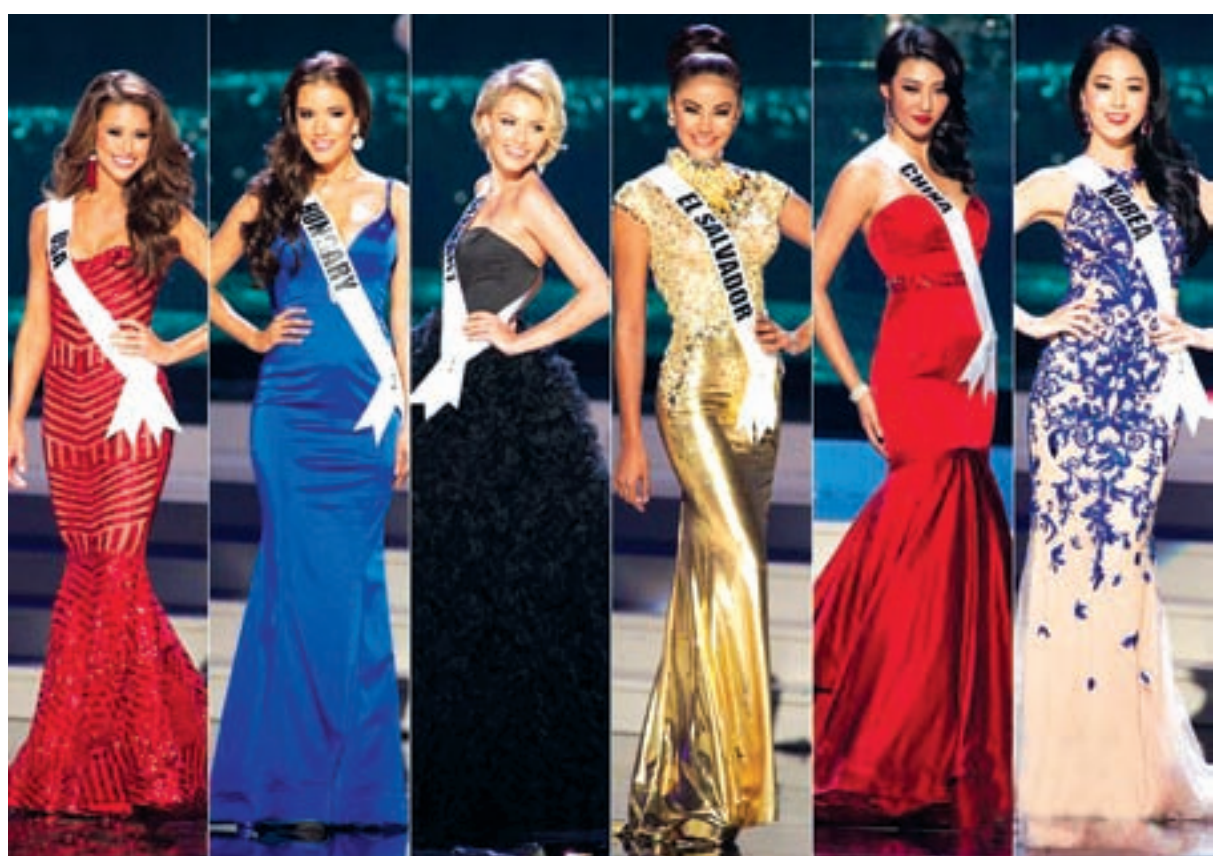
The 63 rd Annual Miss Universe Pageant takes place in Doral-Miami, Florida and will air live from Florida International University on Sunday, on 25 Jan, 2015.

"The Hunger Games: Mockingjay, Part 2" is set for release on 20 November. Also featuring Josh Hutcherson and Liam Hemsworth among others, the action adventure movie is directed by Francis Lawrence.—PTI