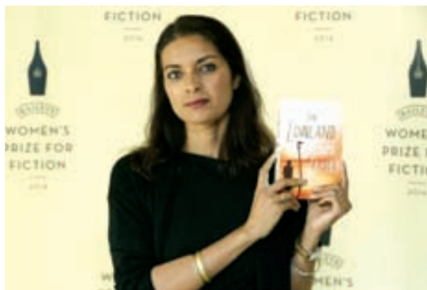
Author Jhumpa Lahiri poses with her novel "The Lowland", ahead of the 2014 Bailey's Women's Prize for Fiction in London on 4 June, 2014.

Lahiri, who won a Pulitzer Prize in 2000, was the best-known author on a shortlist of five writers with her entry "The Lowland," a tale of Indian brothers