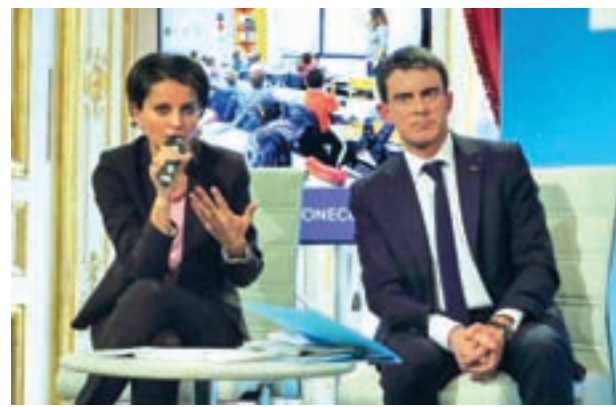
French Prime Minister Manuel Valls (R) and Education and Research minister Najat Vallaud-Belkacem attend a news conference in Paris, on 22 Jan, 2015.

Three home-grown gunmen of Algerian and African origin killed 17 people in three days of violence, starting with the