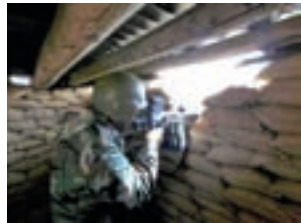
A Kurdish Peshmerga fighter takes his position as he keeps watch during the battle with Islamic State militants on the outskirts of Mosul on 21 Jan, 2015.

WASHINGTON, 23 Jan — The United States and Iraq have started preparing for an offensive by summer to recapture the Iraqi city of Mosul, which was taken by Islamic State militants last June, the Wall Street Journal reported on Thursday.