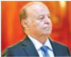
Yemen's President Abdu Rabbu Mansour Hadi

SANAA, 23 Jan — Yemen drifted deeper into political limbo on Friday after President Abd-Rabbu Mansour Hadi resigned in exasperation at a Houthi rebel takeover of the country, a move that appeared to catch the Iran-backed group off balance.