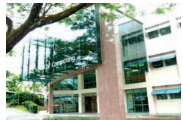
NUS School of Computing (Photo from Wikipedia)

In 1960, the governments of the then Federation of Malaya and Singapore indicated their desire to change the status of the divisions into that of a na-