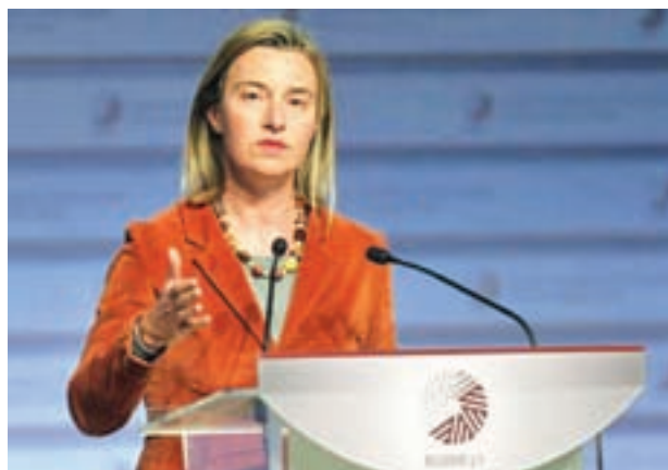
European Commission High Representative Federica Mogherini speaks during a news conference in Riga on 8 Jan, 2015.

It was by British Foreign Secretary Philip Hammond, French Foreign Minister Laurent Fabius, German Foreign Minister Frank-Walter Steinmeier