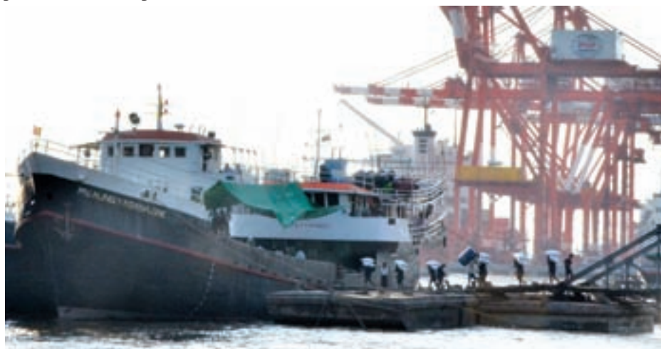
Myanmar entrepreneurs to export rice through maritime route as market promotion.

“After checking quality of products and whether they are pest free, officials (See page 3)