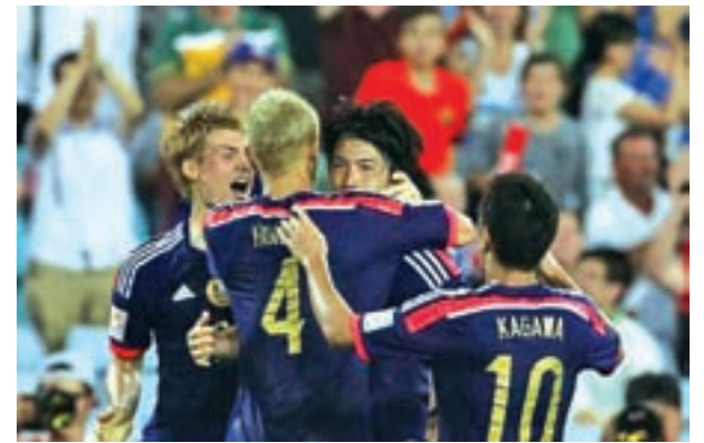
Japan's Gaku Shibasaki (2 nd R) celebrates his goal with team mates during their Asian Cup quarter-final soccer match against UAE at the Stadium Australia in Sydney on 23 Jan, 2015.

Japan continued to pile on the pressure, and