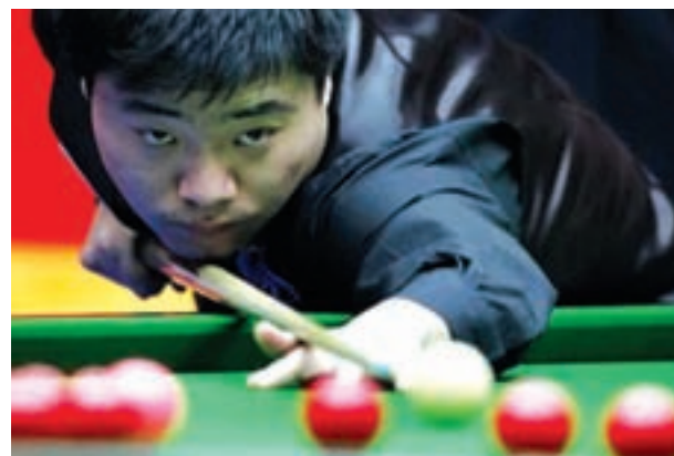
China's Ding Junhui plays a shot during his match against Mark Williams of Wales in the final of the 2010 World Snooker China Open in Beijing on 4 April, 2010.

"Four years ahead of its original target, the World Professional Billiards and Snooker Association has engaged heavily in working alongside the World Confederation of Billiard Sports on a bid for inclusion in the 2020 Olympics in Tokyo," snooker's world governing