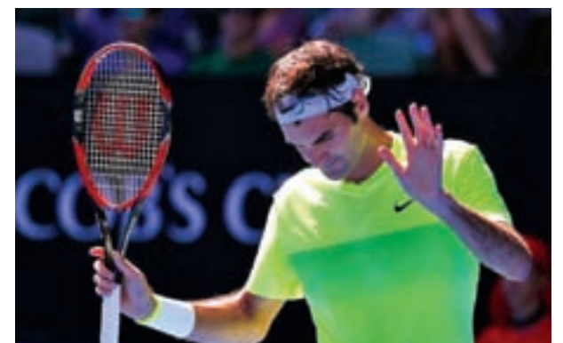
Roger Federer of Switzerland

fortable playing against Roger, but I was focusing on my service game, I didn't have many chances on his serve." The 33-year-old Swiss struggled with his first serve early in the match, while the 30-year-old Seppi took advantage of three of his five break points to take a two sets to love lead.