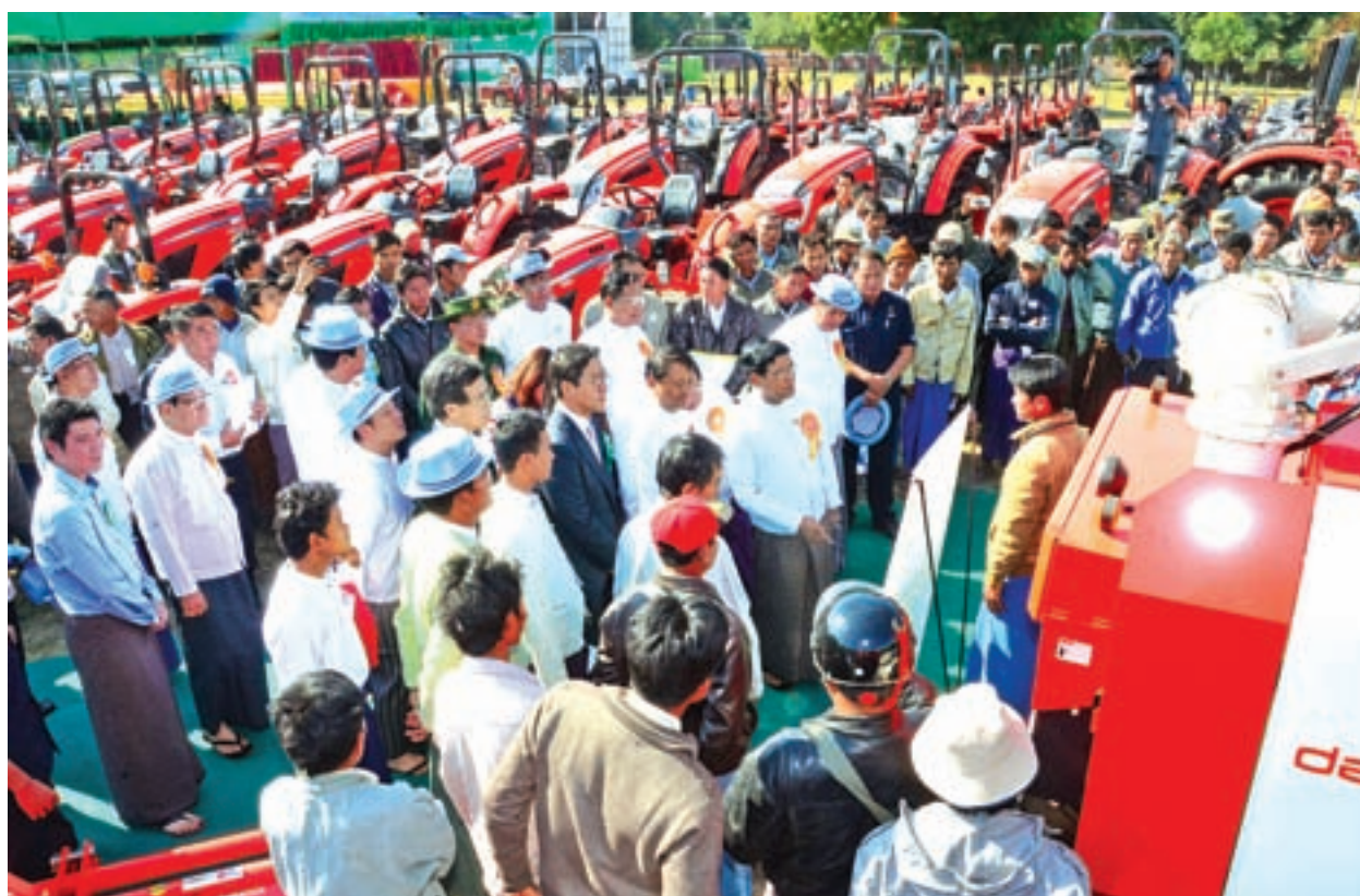
Vice President U Nyan Tun views agricultural machinery to be sold to local farmers.

The cooperative system demands concerted cooperation of individual members in enjoying higher socioeconomic status, with the vice president saying that cooperative success will ease their reliance