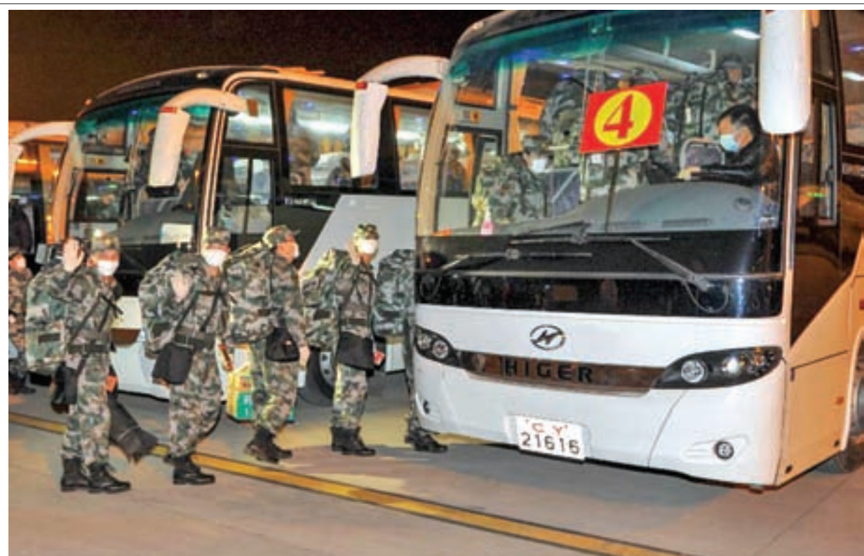
Members of the Chinese medical team, who returned from Liberia after assisting in the African nation’s prevention and control of the Ebola virus, get on a bus for medical quarantine area in Chongqing, southwest China, on 22 Jan, 2015. A total of 82 medical workers, as the second batch of the 164-member team, returned to motherland on Thursday morning. They will be kept in quarantine under medical observation for about 20 days. —XINHUA

Commenting on the agreement signed with her Serbian counterpart, the Finnish minister of the interior said that the topics they discussed included high-tech crime, border control, illegal migration, and citizens fighting in foreign wars.— Tanjung