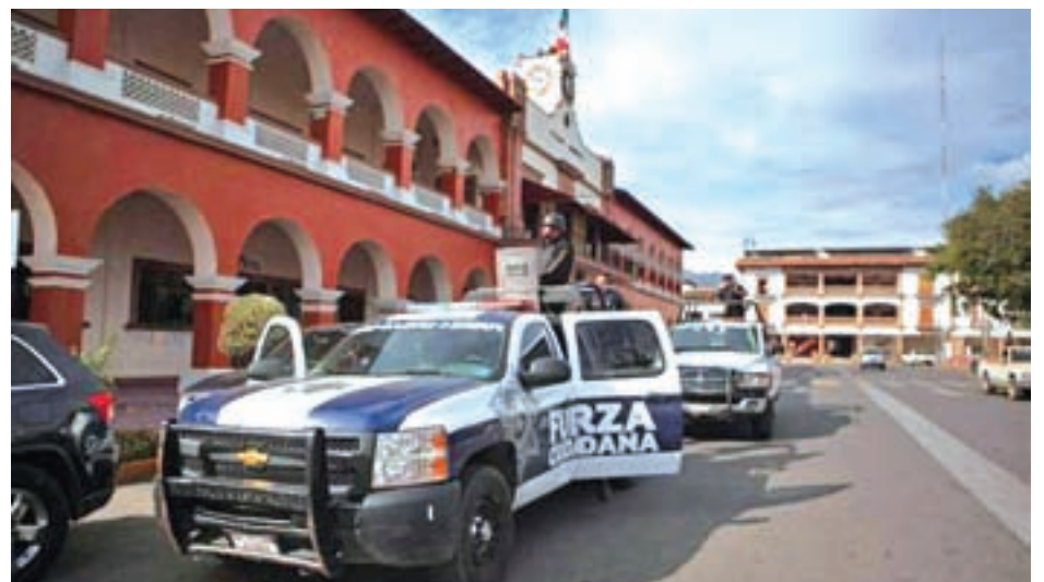
Police stand guard outside the town hall after a shooting between federal forces and armed civilians in the town of Apatzingan, Michoacan on 6 Jan, 2015.