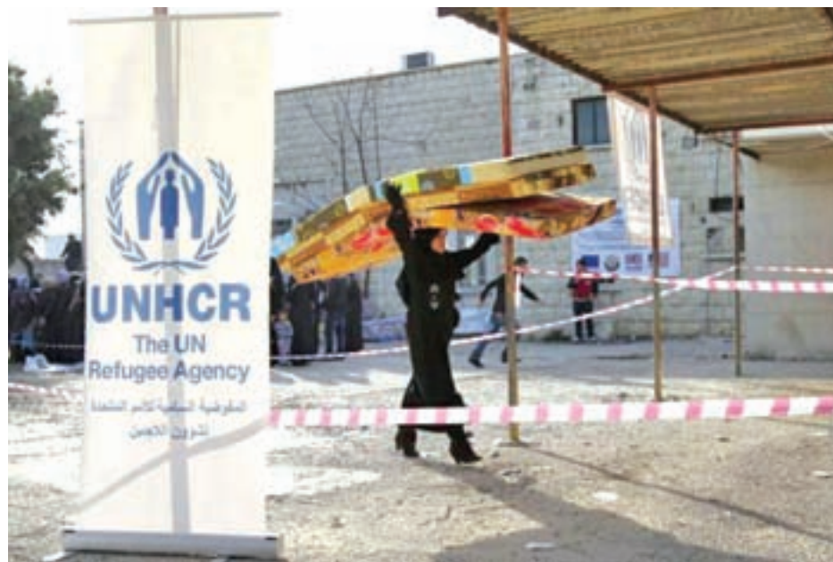
A Syrian refugee receives aid from the UN refugee agency (UNHCR) in Batroun, northern Lebanon on 13 Jan, 2015.

The Security Council approved humanitarian access without Syrian government consent into rebel-held areas at four border crossings from Turkey, Iraq and Jordan. Western diplomats said at the time that nearly 2 million people could be reached. Ban's report on Syria aid access, obtained by Reuters , said food assistance had reached 596,000 people, non-food items had been delivered to 522,000, water and sanitation supplies had reached more than 280,000 and medical supplies some