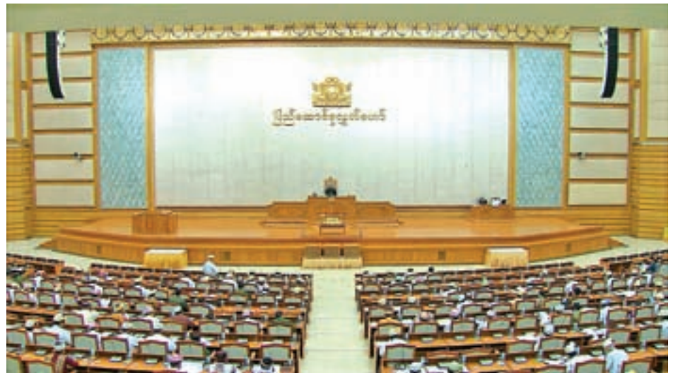
Pyidaungsu Hluttaw representatives attend fourth day session.—MNA