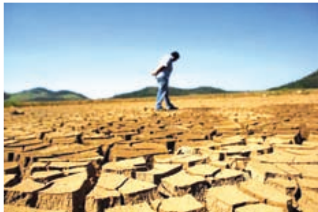
A worker of SABESP, a Brazilian enterprise of Sao Paulo state, that provides water and sewage services to residential, commercial and industrial areas looks at the cracked ground of Jaguary dam in Braganca Paulista, 100 km from Sao Paulo on 31 Jan, 2014.