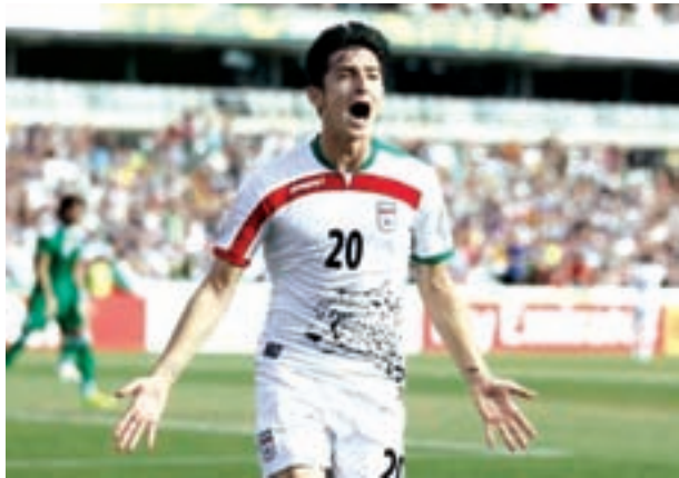
Iran's Sardar Azmoun celebrates his goal during their Asian Cup quarter-final soccer match against Iraq at the Canberra stadium in Canberra on 23 Jan, 2015.