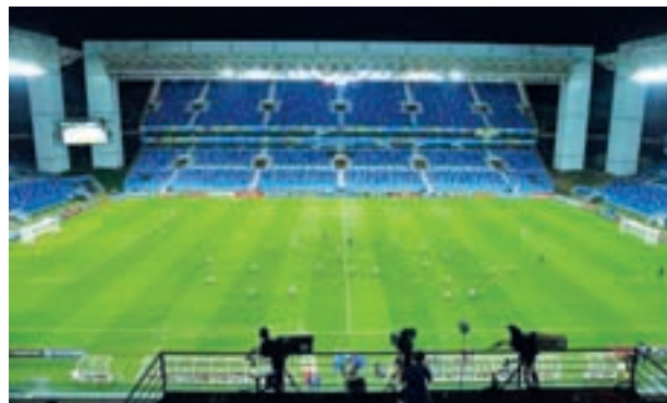
Australia's national soccer team players attend a training session in the Arena Pantanal stadium in Cuiaba on 12 June, 2014. Australia will play its first match of the 2014 World Cup against Chile on 13 June in Cuiaba.

There was added concern over its readiness following a fire there in