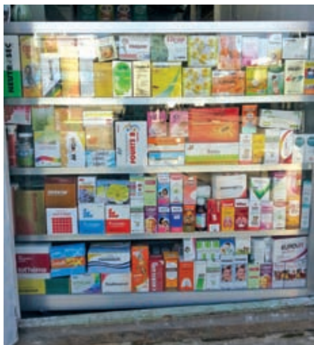
Western medicines are displayed on sale at a shop in Yangon suburban area.

An MP from Rakhine State welcomed the bill, saying that it protects freedom of worship and forced religious conversion, and is compatible with human rights.—MNA