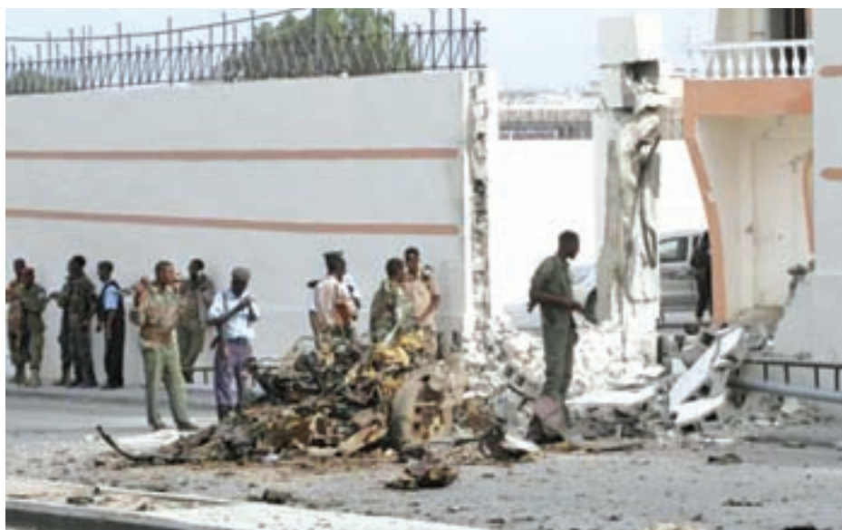
Somali government forces assess the scene of a suicide car explosion in front of the SYL hotel in the capital Mogadishu on 22 Jan, 2015.

MOGADISHU, 23 Jan — A suicide car bomb exploded at the gate of a Mogadishu hotel where Turkish delegates were meeting on Thursday, a day before a visit by President Tayyip Erdogan to the Somali capital. At least two police officers were killed but none of the Turkish delegates