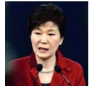
South Korean President Park Geun-hye

SEOUL, 23 Jan — South Korean President Park Geun-hye on Friday named the ruling Saenuri Party's floor leader, Lee Wan Koo, as new prime minister, according to the presidential office. Lee, widely viewed as a figure close to the president, will replace Chung Hong Won after winning a parliamentary endorsement through a hearing.