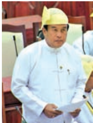
Deputy Minister for Sports U Thaung Htaik.—MNA

NAY PYI TAW, 22 Jan—Pyithu Hluttaw (Lower House) session raised questions on retirees who worked beyond their retirement age, environmental and social impacts from factory sewage of an industrial zone in Mawlamyine and upgrading a stadium in Myaung on Thursday.