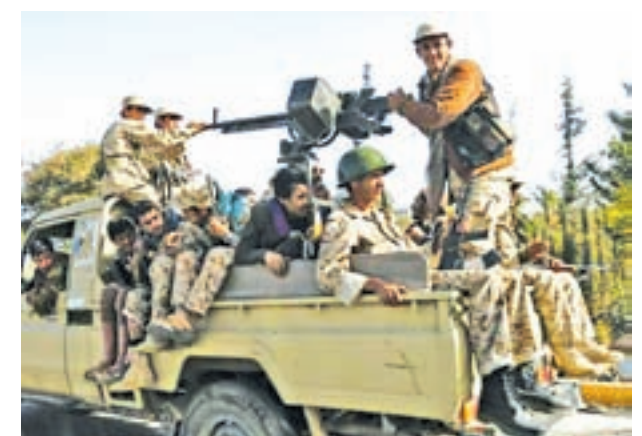
Houthi fighters ride a truck while patrolling a street in Sanaa on 21 Jan, 2015.