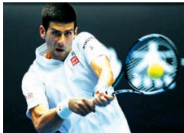
Novak Djokovic of Serbia hits a return to Andrey Kuznetsov of Russia during their men's singles second round match at the Australian Open 2015 tennis tournament in Melbourne on 22 Jan, 2015.

Zvonareva also could have been considered something of a dark horse for the world number one, with early signs of an upset when the 30-year-old Russian, a twice grand slam finalist who was ranked as high as number two in