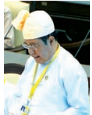
Deputy Minister for Culture U Than Swe.

The deputy minister explained cooperation between Myanmar and Australian researchers and archaeologists in preserving the pages of stone inscriptions, collecting data and upload digitalized photos of stone inscriptions online. Reckless acts of some people have caused damage to some stone pag-