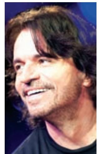
Music composer & instrumentalist Yanni

Yanni is known to blend Jazz, classical, soft, rock and world music ele-