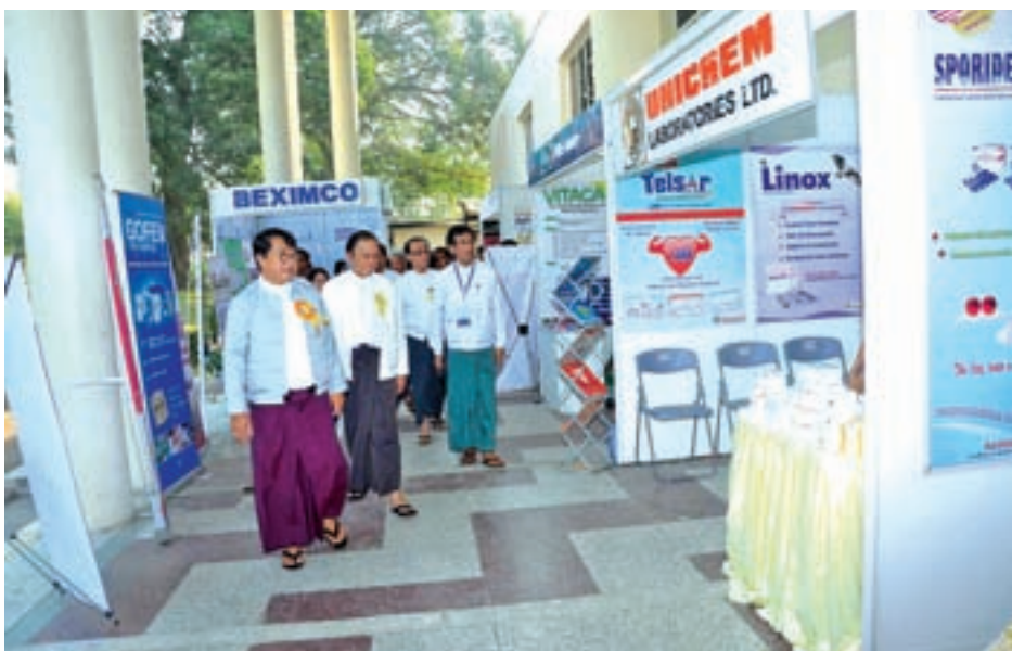
Union Minister for Health Dr Than Aung visits booths of medical companies at 23 rd Ear, Nose and Throat Specialists Conference.