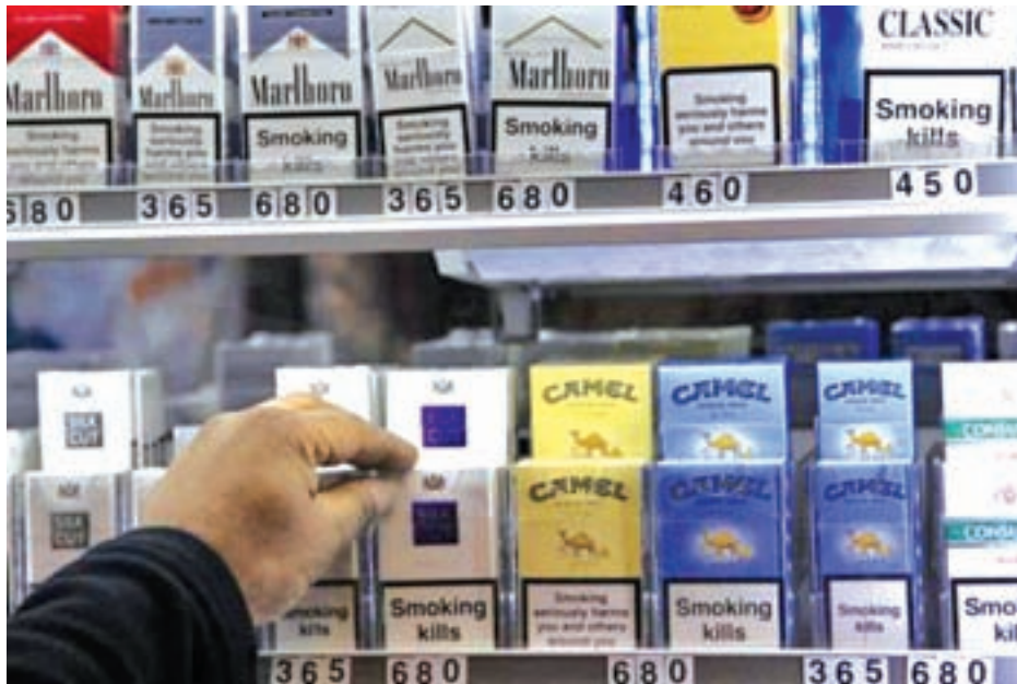
A shopkeeper reaches for a packet of cigarettes in a newsagent in London on 9 March, 2011.

Jane Ellison, a junior minister in Britain's health