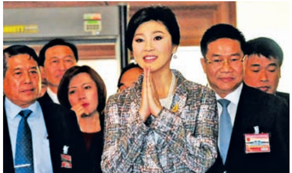
Former Thai Prime Minister Yingluck Shinawatra (C) arrives at the parliament building in Bangkok on 22 Jan, 2015. Thailand's military-appointed legislature is to vote on impeachment against Yingluck over a government rice subsidy scheme on Friday.

On Wednesday, the impeachment trial against former Senate Speaker Nikhom Wairatpanich and former House Speaker Somsak Kiatsuranon was wrapped up, with the final verdict also expected on Friday. The case against