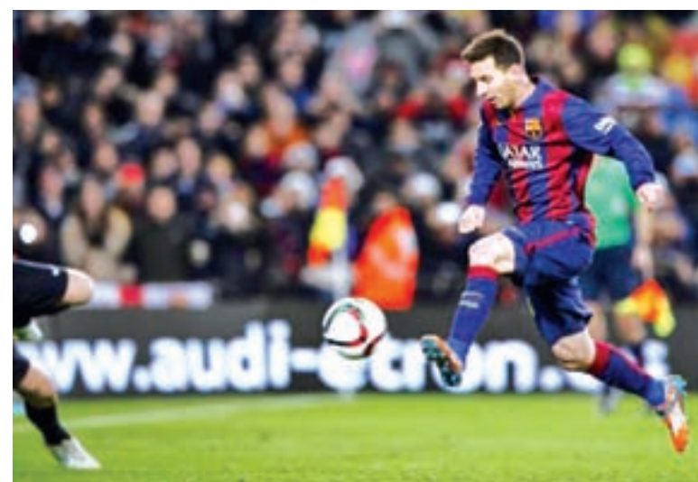
Barcelona’s Lionel Messi kicks to score a goal during their King’s Cup quarter-final first leg soccer match against Atletico Madrid at the Nou Camp stadium in Barcelona, on 21 Jan, 2015.

“Not conceding a goal is an important achievement but it does not guarantee anything. We will try to do things well again in the return.”—Reuters