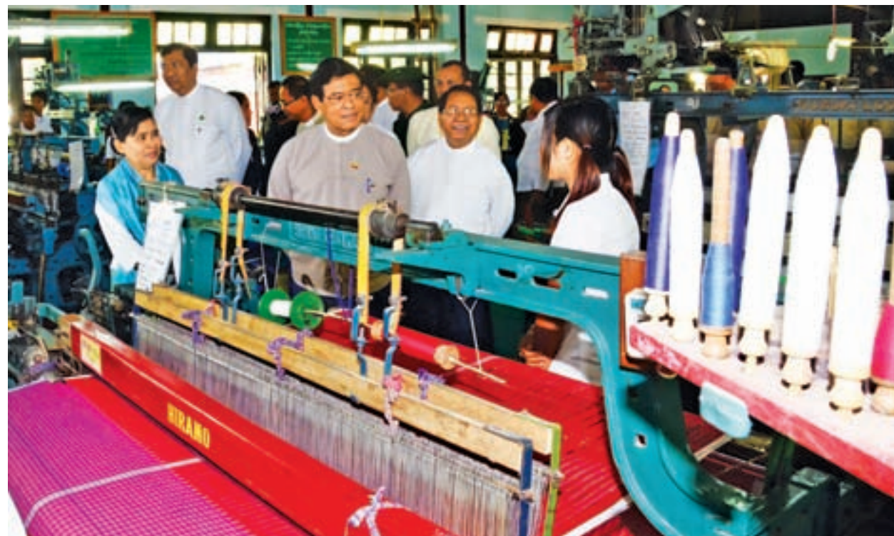
Vice President U Nyan Tun visits Hsaungda Weaving School in Amarapura Township.

The 2015 ATF kicked off today and it will last eight days until next Thursday. This is the first time the forum takes place in Myanmar since its inauguration in 1981. Myanmar expects to welcome more globetrotters through the two-day leisure-trade event.—GNLM