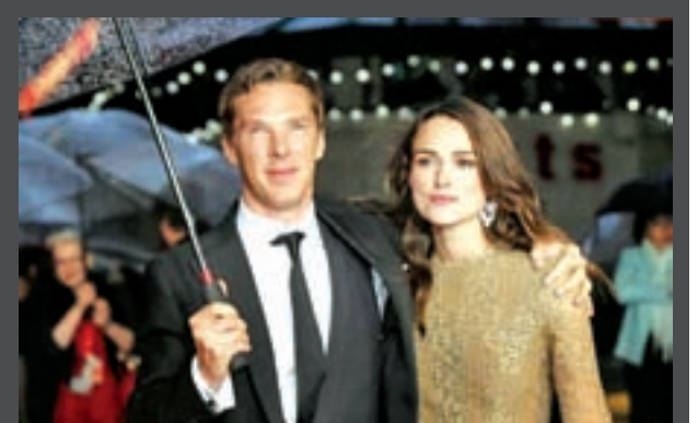
Benedict Cumberbatch & Keira Knightley