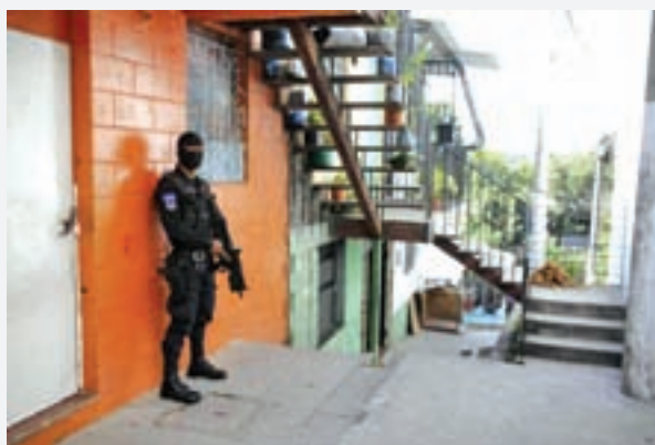
A member of the police stands guard, due to threats from the 18 th Street gang for the residents at the San Valentin apartments, in the town of Mejicanos, on the outskirts of San Salvador on 21 Jan, 2015.