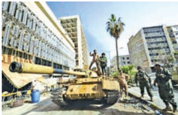
Members of the Libyan pro-government forces, backed by locals, gather on a tank outside the Central Bank, near Benghazi port on 21 Jan, 2015.