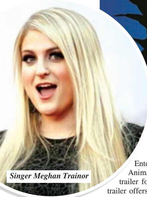
Singer Meghan Trainor

Ronson and singer Bruno Mars' hit "Uptown Funk!" was the top down-