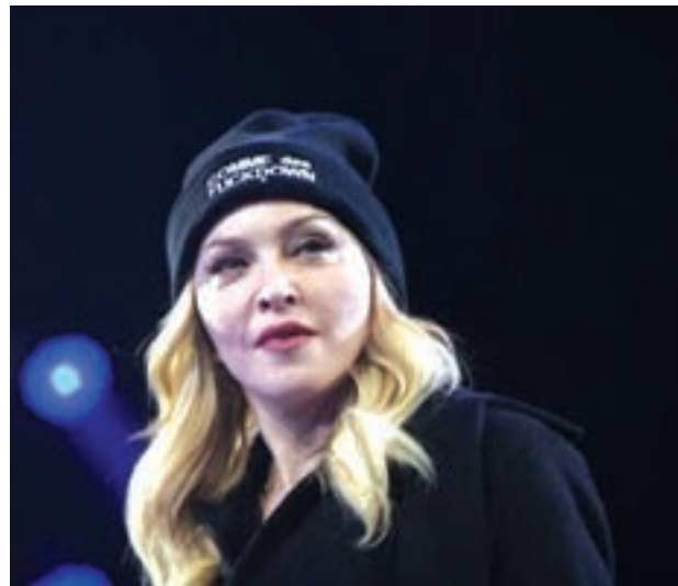
Singer Madonna walks on stage during Amnesty International’s “Bringing Human Rights Home” concert in the Brooklyn borough of New York on 5 Feb, 2014.

JERUSALEM, 22 Jan — An Israeli man was arrested on Wednesday on suspicion of hacking into the computers of singers including pop star Madonna and selling their songs online, according to Israeli and US law enforcement sources.