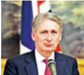
British Foreign Secretary Philip Hammond

LONDON, 22 Jan — Iraqi forces are months away from being able to launch proper combat operations