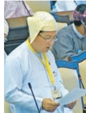
Deputy Minister for Commerce Dr Pwint Hsan.—MNA

The ministry in the 2013-2014 fiscal year paid nearly K1.486 billion to 976 farmers in recompense for the loss of 2,402.75 acres of their farmland, with the deputy minister saying that arrangements are underway to compensate over K1.182 billion to 797 farmers in four townships of the Nay Pyi Taw Council Area for the loss of 1,864.04 acres of their farmland in the 2014-2014 FY. He added that over K124m has been earmarked for spending on affected farmland in Bago Region, whose area is still being measured. The compensation could be made, following an approval by the local government, he said, adding that funds of K10 billion have been appealed to recompense affected farmers in the regions of Yangon, Bago and Mandalay as well as the Nay Pyi Taw council area in