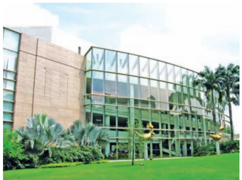
NUS University Culture

The National University of Singapore is a comprehensive research university and the flagship tertiary institution of the country which has a global approach to education and re-