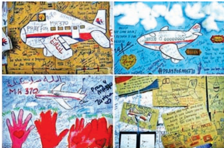
A combination photo shows drawings with messages of hope for passengers of missing Malaysia Airlines Flight MH370 at Kuala Lumpur International Airport (KLIA) outside Kuala Lumpur on 14 June, 2014.

SYDNEY, 22 Jan — The Australian Transport Safety Bureau (ATSB) on Thursday called for expressions of interest in the recovery of missing Malaysia Airlines Flight MH370 from the bottom of the Indian Ocean — should the aircraft be found.