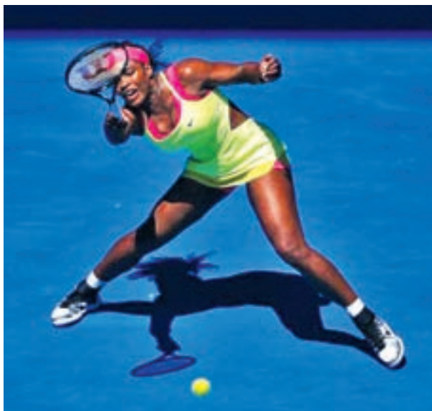
Serena Williams of the US casts a shadow as she hits a return to Vera Zvonareva of Russia during their women's singles second round match at the Australian Open 2015 tennis tournament in Melbourne on 22 Jan, 2015.