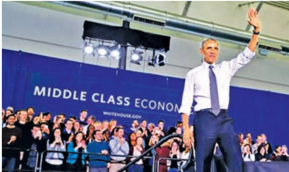
US President Barack Obama waves to the audience after speaking during a visit to Boise State University in Idaho on 21 Jan, 2015.

BOISE, (Idaho), 22 Jan — A day after delivering a defiant State of the Union speech to the Republican-led US Congress, President Barack Obama headed to the conservative heartland on Wednesday to promote his plans for bolstering the middle class.