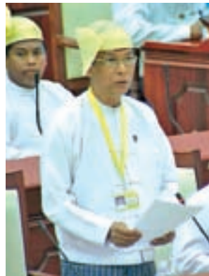
Deputy Minister for Finance Dr Lin Aung. MNA

Deputy Minister for Finance Dr Lin Aung answered the questions on retirees, saying that government employees are required to retire when they are sixty under section 230