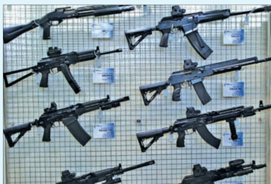
Kalashnikov machine guns

Moscow, 22 Jan — The Kalashnikov Concern isn't against the intentions of the US-based Russian Weapon Company to begin manufacturing of the world-famous Kalashnikov automatic assault rifles in the US. The corporation sees such a move as a logical one, TASS was told by the press service of the group.