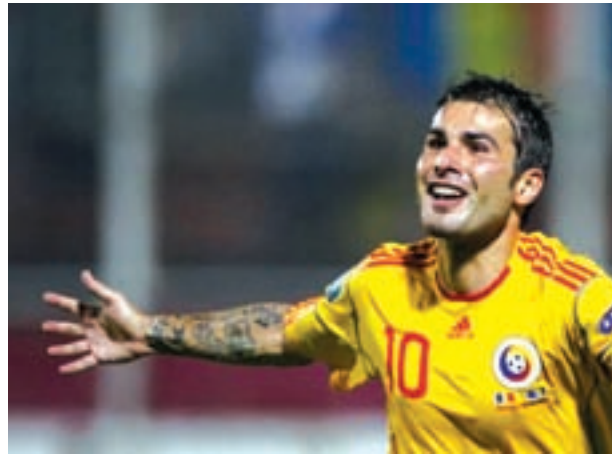
Romania’s captain Adrian Mutu celebrates after scoring against Bosnia and Herzegovina during their Euro 2012 Group D qualifying soccer match at Giulesti stadium in Bucharest on 3 Jun, 2011.