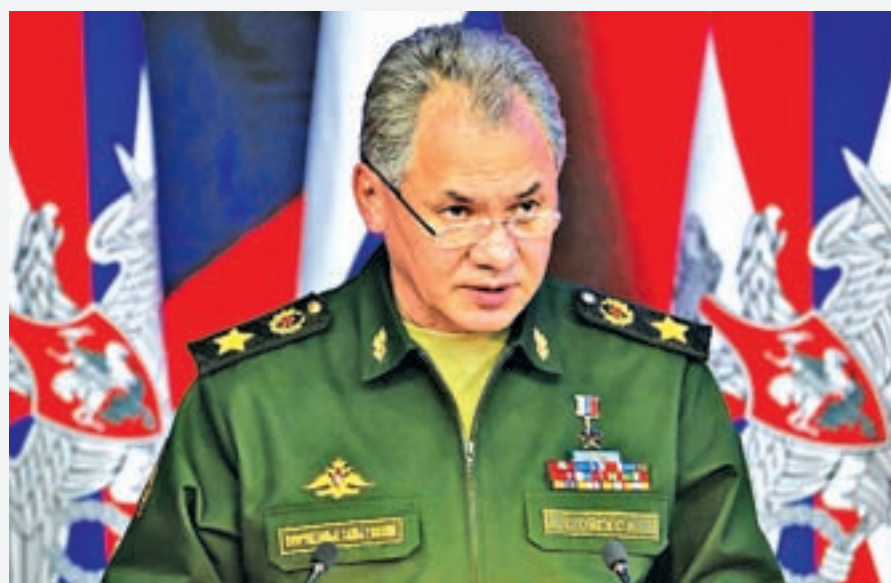
Russian Defence Minister Sergey Shoigu