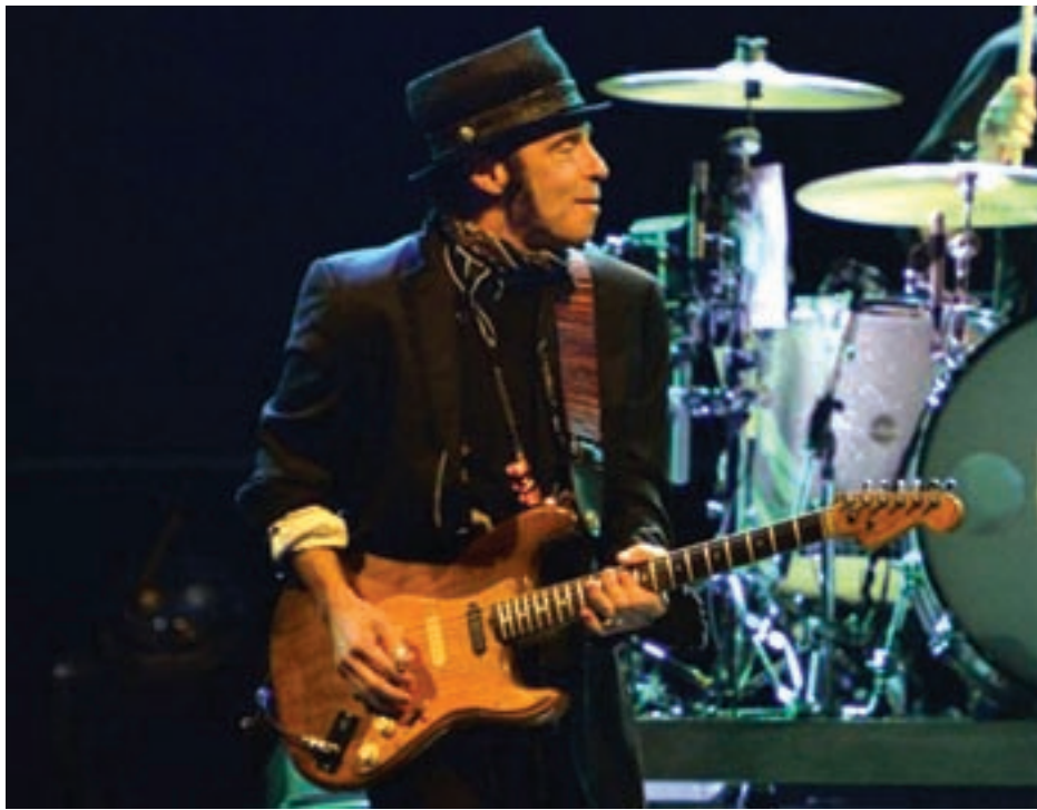
E-Street Band member Nils Lofgren performs at a concert with Bruce Springsteen (unseen) in Stockholm in this 3 May, 2013 file photo.

LONDON, 21 Jan — After 26 gruelling months on tour with Bruce Springsteen and the E Street Band playing stadiums across the globe, guitar man Nils