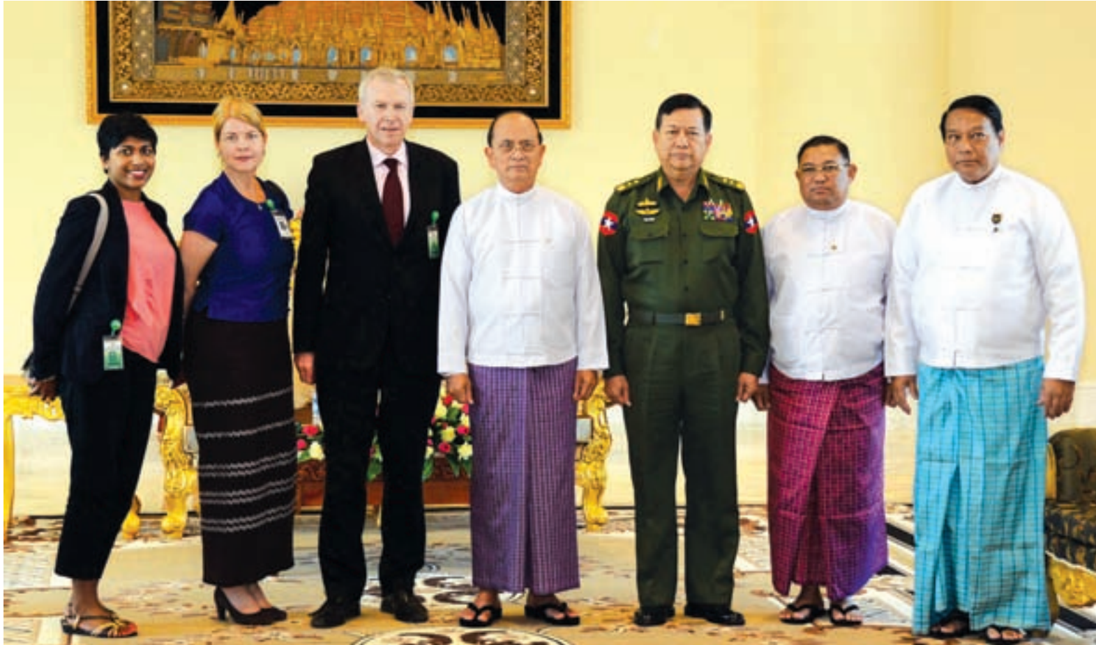
President U Thein Sein poses for documentary photo with Mr Yves Letterme, Secretary General of the International Institute for Democracy and Electoral Assistance (IDEA) and party.

NAY PYI TAW, 21 Jan—President U Thein Sein held talks with Mr Yves Letterme, Secretary General of the International Institute for Democracy and Electoral Assistance (IDEA) and party at Presidential Palace, on Wednesday.