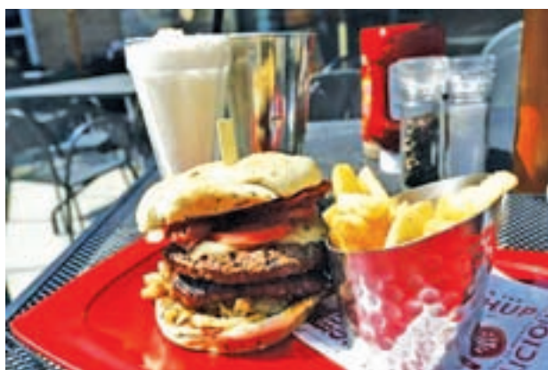
A meal of a "Monster"-sized A.1. Peppercorn burger, Bottomless Steak Fries, and Monster Salted Caramel Milkshake is seen at a Red Robin restaurant in Foxboro, Massachusetts on 30 July, 2014.

The study was based on surveys of more than 3,000 King County residents who frequent chain restaurant. It began eight months before the county required restaurants to post calorie information at the beginning of 2009, and continued for two years after that.