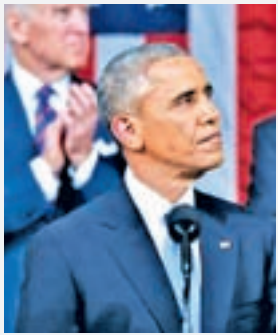
US President Barack Obama

WASHINGTON, 21 Jan — President Barack Obama struck a defiant tone for his dealings with the new Republican-led Congress on Tuesday, calling on his opponents to raise taxes on the rich and threatening to veto legislation that would challenge his key decisions.