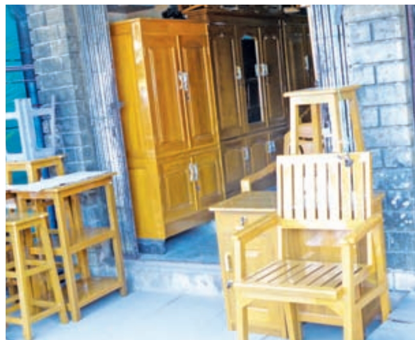
A family-run furniture store in Tamway Township, Yangon, displays wooden furniture on sale.

YANGON, 21 Jan—The first Myanmar International Furniture Expo will open to the public 12 to 15 February at Tatmadaw Convention Hall in Yangon with the aim of seeking new business opportunities, a source said.