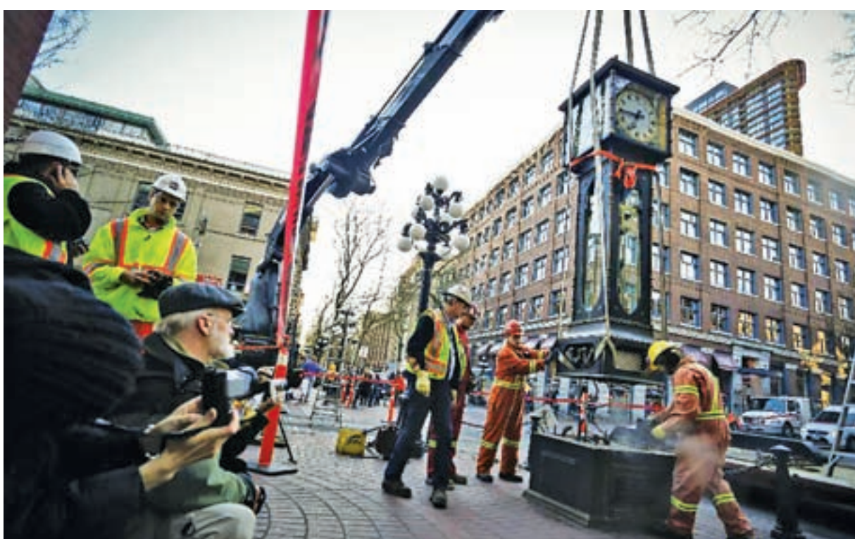
Workers re-install the steam clock to its original position at Gastown in Vancouver, Canada on 20 Jan, 2015. After a three-month absence from Gastown in Vancouver, the iconic Steam Clock returned to its original place. The Steam clock is one of the major tourist spot and symbol of Vancouver. Built in 1977, the clock was taken away first time for major repair.—XINHUA