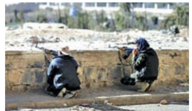
Houthi fighters take up position on a street during clashes near the Presidential Palace in Sanaa on 19 Jan, 2015.—Reuters

The accord gives the Shi'ite Muslim group, which takes its name from the family of its leader, a role in all military and civil state bodies. The Houthis also demand changes to the divisions of regional power in a draft constitution.—Reuters