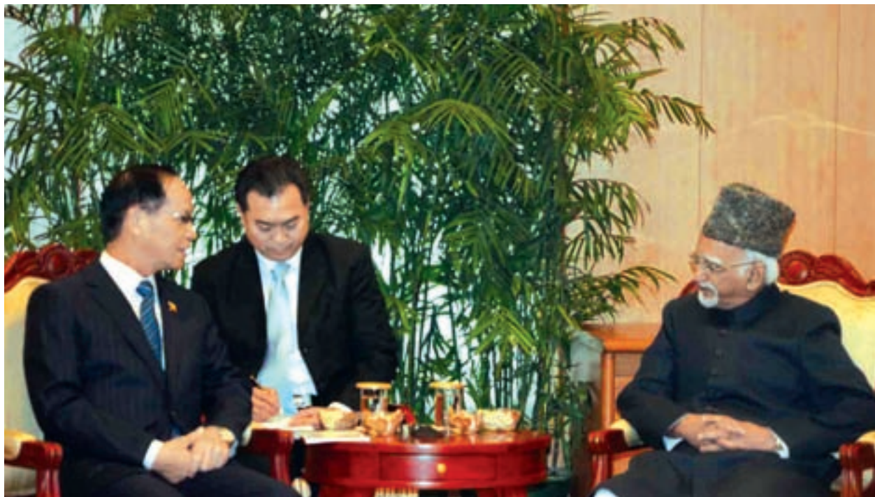
Vice President Dr Sai Mauk Kham holds talks with Indian Vice President Mohammad Hamid Ansari.

NEW DELHI, 21 Jan— Vice President Dr Sai Mauk Kham met Indian premier Narendra Modi at the Prime Minister's Office on Wednesday evening be-