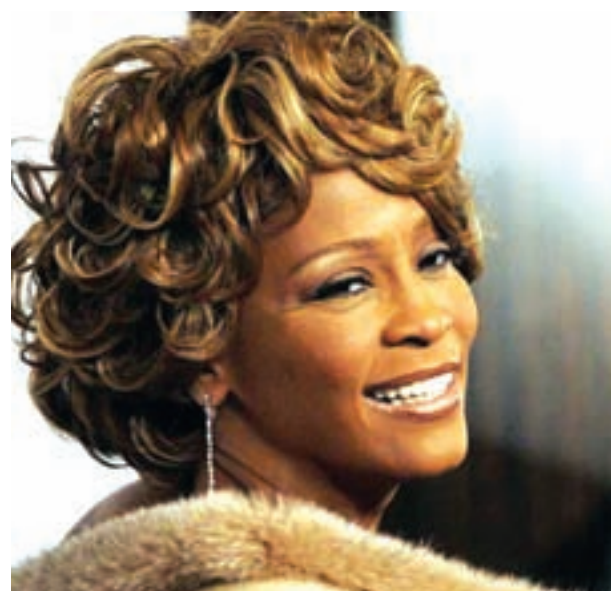
Lifetime’s biopic on singer Whitney Houston, which was slammed by her family, attracted 4.5 million total viewers.

LOS ANGELES, 21 Jan — Lifetime’s biopic on singer Whitney Houston, which was slammed by her family, attracted 4.5 million total viewers, becoming the network’s most-watched telecast since ‘ Flowers in the Attic ’.