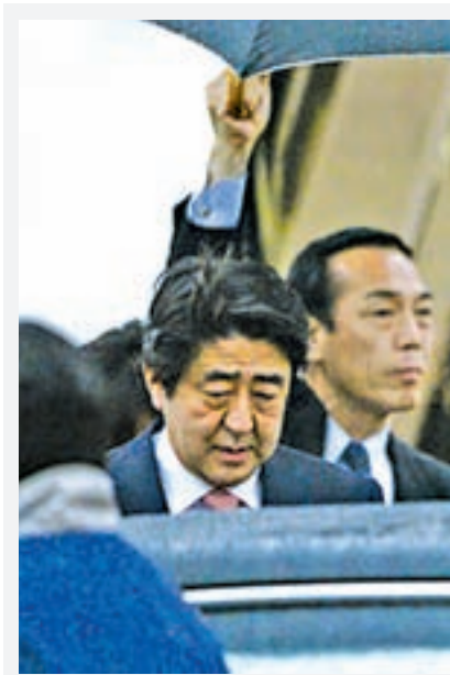
Prime Minister Shinzo Abe arrives at Haneda airport in Tokyo on 21 Jan, 2015, after completing his Middle East trip. He asked Middle East leaders for help as Islamic State militants threatened to kill two Japanese captives.

TOKYO, 21 Jan — Japan stressed on Wednesday it has pledged “non-military” support for