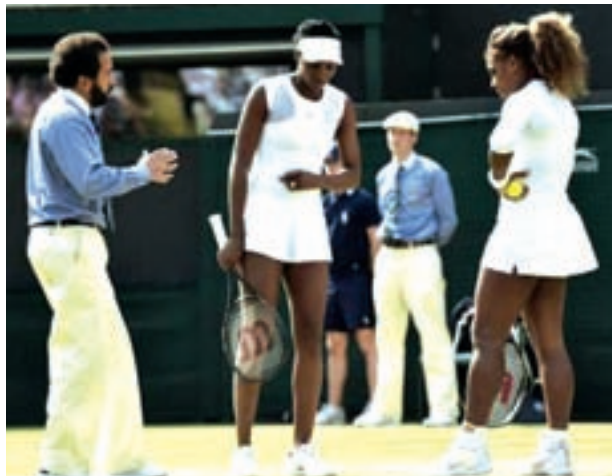
Serena (R) and Venus Williams at the Wimbledon Tennis Championships, in London on 1 July, 2014.