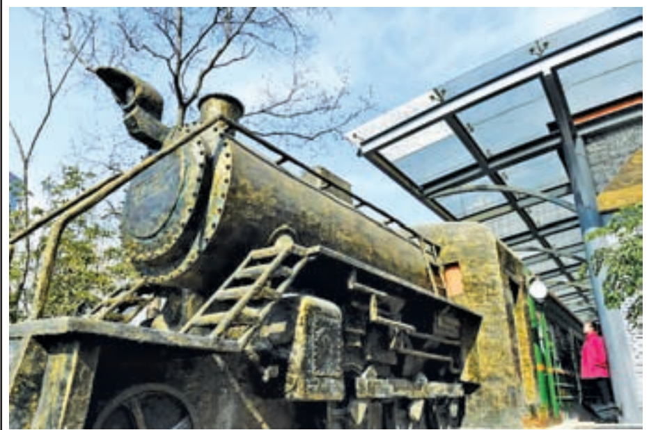
The photo taken on 20 Jan, 2015 shows the exterior look of a railway-themed restaurant in Hefei, capital of east China's Anhui Province. A railway-themed restaurant opened recently in Hefei. It is composed of two carriages and a locomotive sculpture. The restaurant also holds art exhibitions.—XINHUA