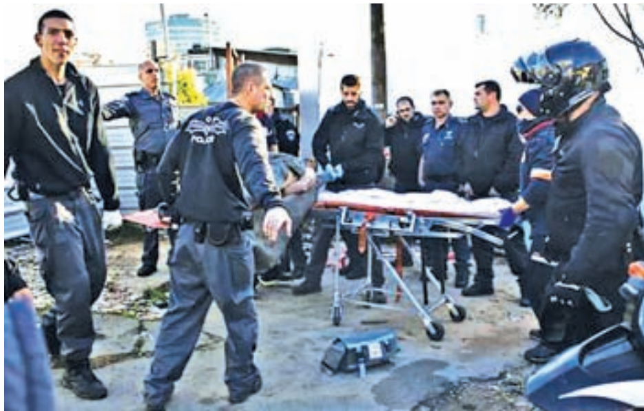
Israeli police officers carry on a stretcher a Palestinian man who stabbed up to 10 people in Tel Aviv on 21 Jan, 2015.

A doctor at Tel Aviv's Ichilov hospital told Army Radio that seven people had been admitted for treatment, four of whom were seriously hurt. "Shortly after he boarded the bus, the assailant stabbed the driver several times but there was an excellent response