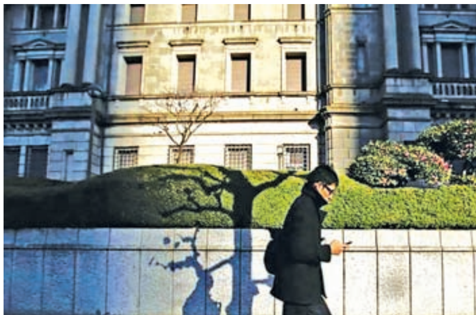
A man using his mobile phone walks past the Bank of Japan headquarters building in Tokyo on 19 Dec, 2014.

TOKYO, 21 Jan — Asian shares hit a six-week high and the euro stayed under pressure on Wednesday as investors counted on the European Central Bank to unveil a stimulus drive, while the yen jumped after the Bank of Japan left policy unchanged.