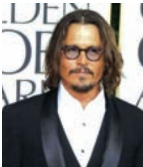
Superstar Johnny Depp

LOS ANGELES, 21 Jan — Superstar Johnny Depp finds the idea about actors venturing into music very sickening.