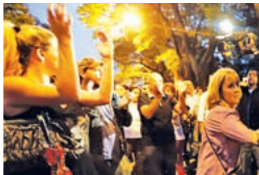
Women smash a police fence during a protest over the death of prosecutor Alberto Nisman, in front of the Olivos presidential residence in Buenos Aires on 19 Jan, 2015.