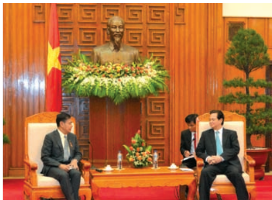
Union Minister for Information U Ye Htut meets Vietnamese Prime Minister Mr Nguyen Tan Dung.

HANOI, 21 Jan—At the invitation of Minister for Information and Communications Mr Nguyen Bac Son of Vietnam, a delega-