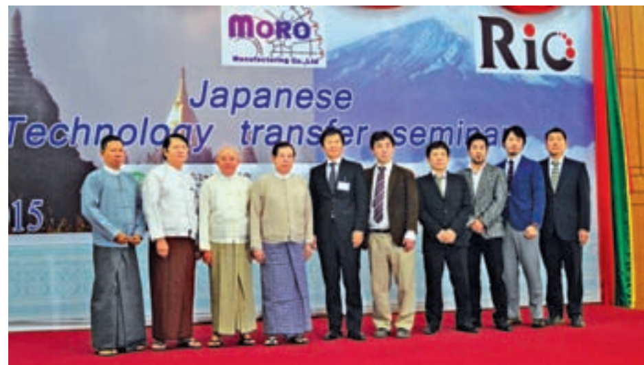
A team of Japanese CEOs from machinery manufacturing company, IT company and food export company hosts a Japanese technology transfer seminar at RUMFCCI Building in Yangon on Wednesday.

During their presentations, the Japanese CEOs explained their vision of offshore business, noting a manpower shortage caused by population decline in Japan. The seminar was aimed at seeking business partners who will become an important source of technology transfer for ensuring industrial vitalization and economic growth in Myanmar, said officials.—GNLM