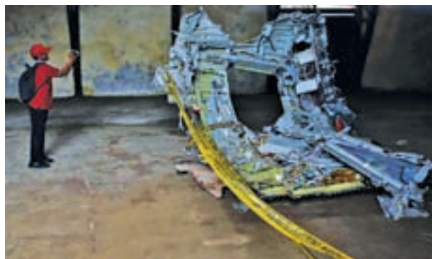
A man shoots video footage of part of the fuselage of crashed AirAsia Flight QZ8501 inside a storage facility at Kumai port in Pangkalan Bun on 19 Jan, 2015.

“This will not be exposed to the public. This is for the consumption of those countries that are involved.”— Reuters