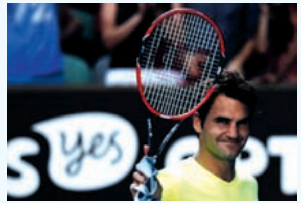
Roger Federer of Switzerland celebrates after defeating Simone Bolelli of Italy in their men's singles second round match at the Australian Open 2015 tennis tournament in Melbourne on 21 Jan, 2015.