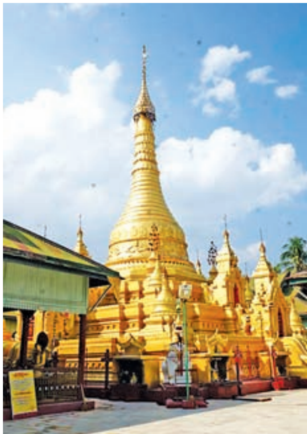
A photo taken on 19 January shows Lawkamarazein Pagoda in Pyinmana Township, Nay Pyi Taw Council Area.