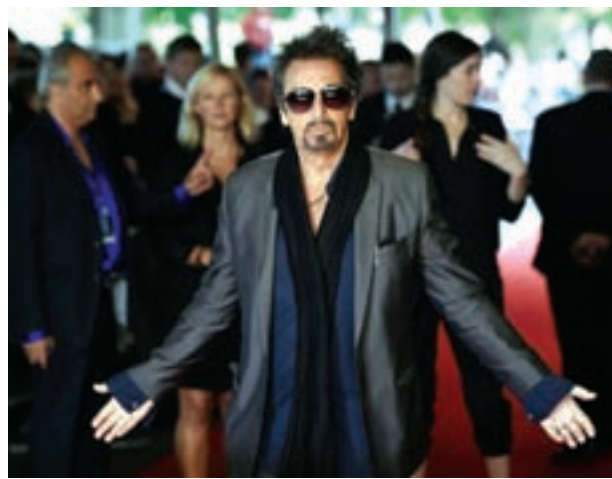
US director/actor Al Pacino arrives for the British premiere of his film "Salome and Wilde Salome" at Southbank in central London on 21 Sept, 2014.

By the 25-year-lag rule, the 1971 box-office disappointment "Willy Wonka & the Chocolate Factory" should be in the registry: IMDb lists 52