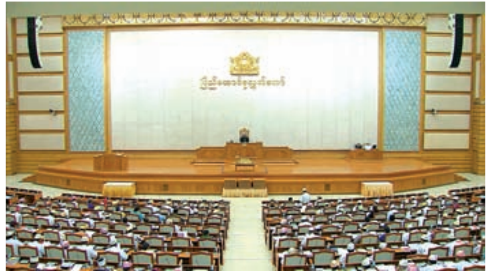
Representatives attending second day session of Pyidaungsu Hluttaw.

The CWC comprises a Preamble, 24 Articles, and 3 Annexes—the Annex on Chemicals, the Verification Annex, and the Confidentiality Annex. The Convention aims to eliminate an entire category of weapons of mass destruction by prohibiting the development, production, acquisition, stockpiling, retention, transfer or use of chemical weapons by