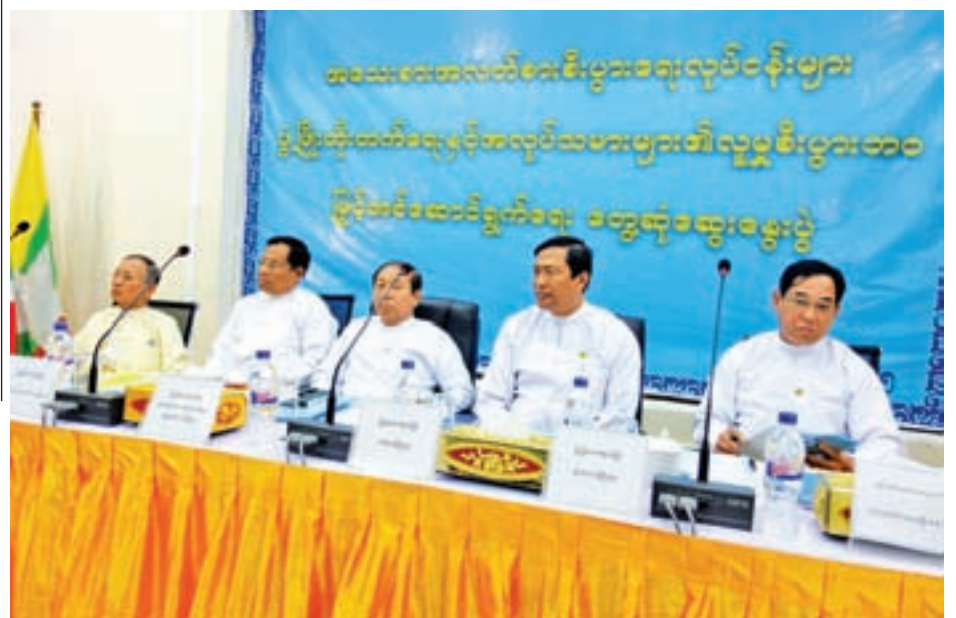
Union Ministers meet employers and employees to discuss development of SMES and uplift of living standard of workers.