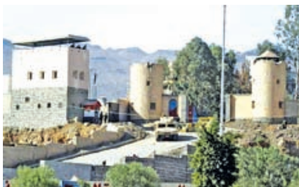
A vehicle from the Presidential Protection Forces is seen positioned outside the house of President Hadi during clashes near the house and the Presidential Palace in Sanaa on 19 Jan, 2015.

SANNA, 20 Jan — Yemen’s powerful Houthi movement fought artillery battles with the army near the presidential palace in Sanaa on Monday, surrounded the prime minister’s residence and drew accusations they were mounting a coup.