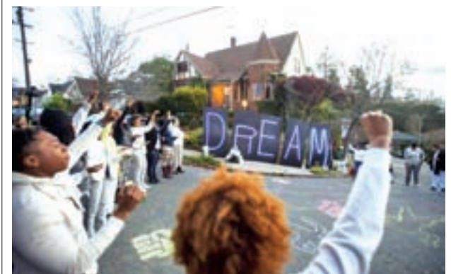
Black rights protesters gather near illuminated letters spelling "DREAM" outside a house which they identified as the residence of Oakland Mayor Libby Schaaf, in Oakland, California on 19 Jan, 2015.

NEW YORK, 20 Jan — Tributes to civil rights leader Martin Luther King Jr were held around the United States on Monday as protests over the treatment of minorities by law enforcement rolled on across the country.