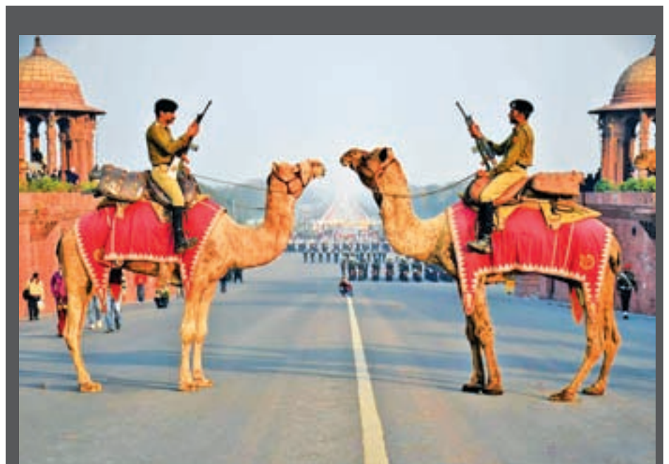
Indian soldiers ride on camels during the rehearsals of the Beating Retreat ceremony at Raisina Hill, in New Delhi, India, on 19 Jan, 2015. The ceremony is performed every year on the evening of on 29 January by the three wings of the Indian military marking the end of Republic Day festivities.

In a draft submitted to the government in August 2014, the Ministry of Finance proposed that Vietnamese people from 21 years of age have sufficient behavioural and financial capacities to gamble in domestic casinos, but it has not been adopted by the country's lawmakers.