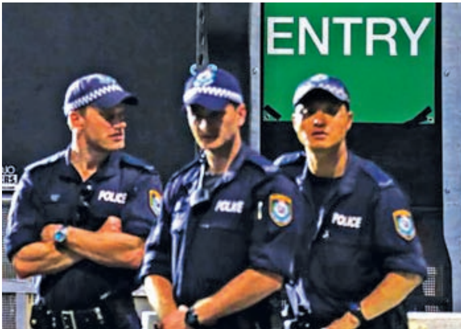
Police watch as people enter the harbour foreshore area in the city for the annual new year fireworks display on Sydney Harbour on 31 Dec, 2014.

SYDNEY, 20 Jan — Australia raised the threat level of a terrorist attack against law enforcement officers to “high” on Tuesday, federal police said, citing intelligence on discussions with international partners and recent