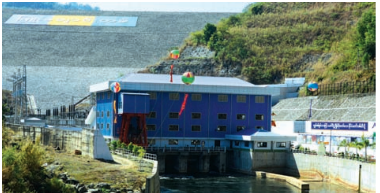
Pyuchaung Dam and hydropower plant commissioned into service on 8 January 2015 will generate 120 million kwh per year.

Workshop discussions will center on the opportunities and challenges of Myanmar's hydropower development. Participants will talk about the urgent (See page 3)