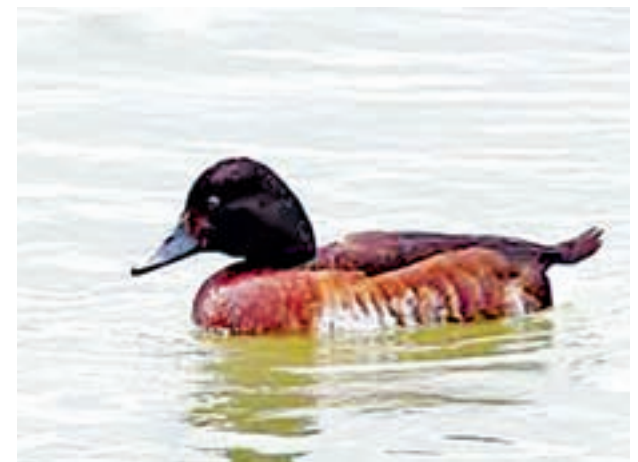
Baer's Pochard (Aythya baeri), one of the species of duck, seen in Myanmar.

Myanmar's total bird species will be 1,114, including new species found within the late five years from 2010 to 2014. Forty-nine are in danger of