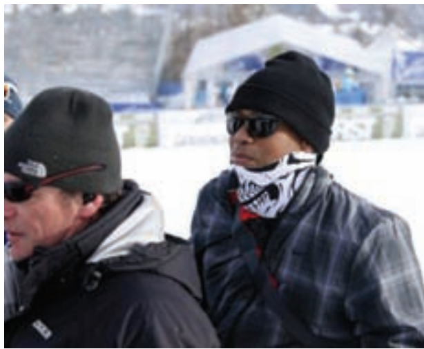
US golfer Tiger Woods sits on a snow bike during the women's World Cup Super-G skiing race in Cortina D'Ampezzo on 19 Jan, 2015.

"During a crush of photographers at the awards' podium at the