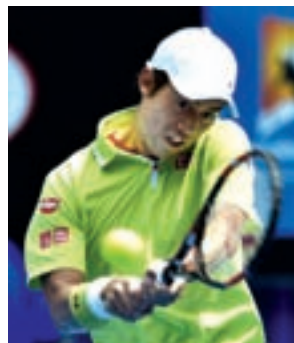
Kei Nishikori of Japan returns a shot during a first-round match against Nicolas Almagro of Spain at the Australian Open tennis championships at the Margaret Court Arena in Melbourne on 20 Jan, 2015. Nishikori won 6-4, 7-6, 6-2.

It was world No 5 Nishikori's first big step in his bid to become the first Japanese player to win a