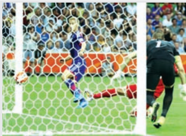
Japan's Keisuke Honda (L) scores the opener in the first half of an Asian Cup match against Jordan on 20 Jan, 2015, in Melbourne, Australia.