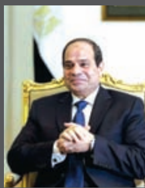
Egypt’s President Abdel Fattah al-Sisi

“I am more keen on human rights than anybody ... But take care when you demand your rights. Take care, don’t take us down with you,” Sisi told hundreds