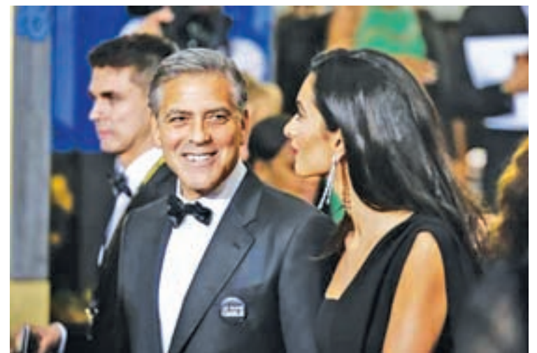
Actor George Clooney and wife, Amal Clooney, arrive at the 72nd Golden Globe Awards in Beverly Hills, California on 11 Jan, 2015.

The cartoon has sparked violent clashes in other Muslim countries.—Reuters