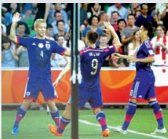
Japan's Keisuke Honda (4) expresses joy after scoring the opener in the first half of an Asian Cup match against Jordan on 20 Jan, 2015, in Melbourne, Australia.

MELBOURNE, 20 Jan — AC Milan midfielder Keisuke Honda scored his third goal in as many games as holders Japan defeated Jordan 2-0 to reach the quarterfinals of the Asian Cup on Tuesday.