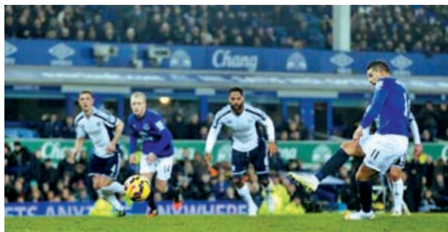
Everton's Kevin Mirallas misses his penalty kick during their English Premier League soccer match against West Bromwich Albion at Goodison Park in Liverpool, northern England on 19 Jan, 2015.

West Brom, who moved up to 14th and three points above the drop zone, are unbeaten in three league games since Tony Pulis took charge.