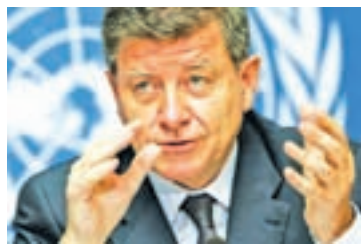
Guy Ryder, Director-General of the International Labor Organization (ILO) gestures during a news conference at the United Nations European headquarters in Geneva on 26 May, 2014.

By next year, more than half the world’s wealth will be owned by just one percent of the