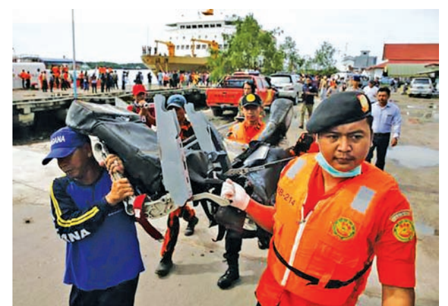
Rescue team members walk as they carry the wreckage of a seat of the AirAsia Flight QZ8501 airliner at Kumai port in Pangkalan Bun, on 19 Jan, 2015.

When asked if there was any evidence from the recording that terrorism was involved, Hananto said: