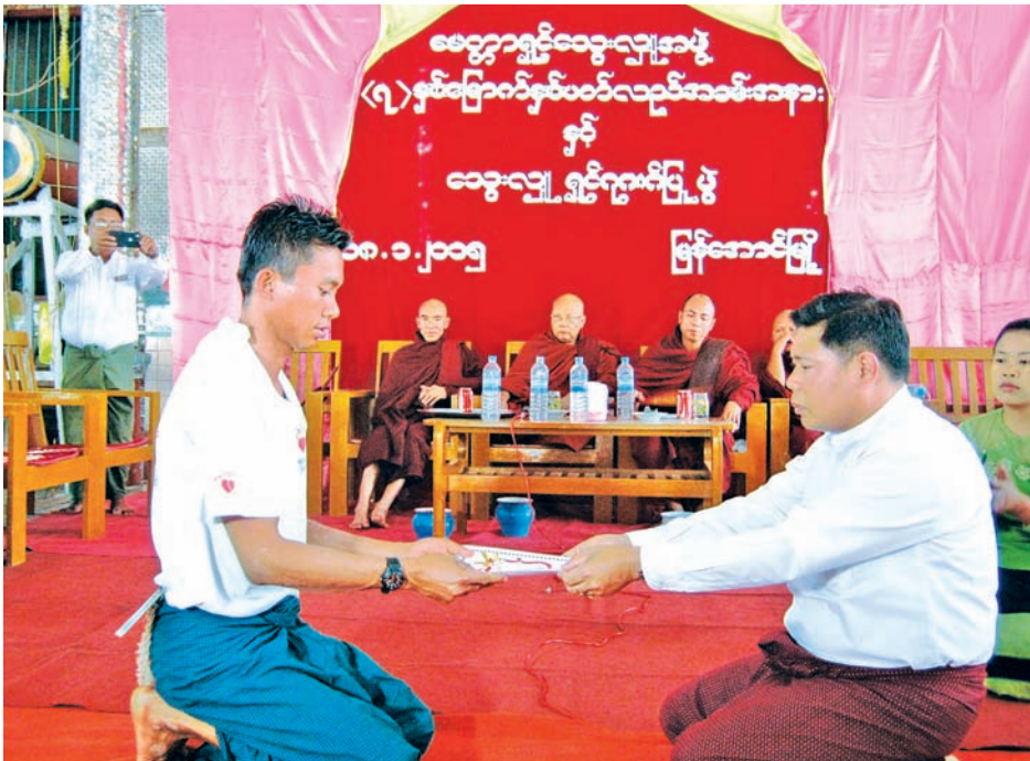
MYANAUNG, 19 Jan— Myyittashin blood donors association held the 7 th anniversary at the Dhammay-