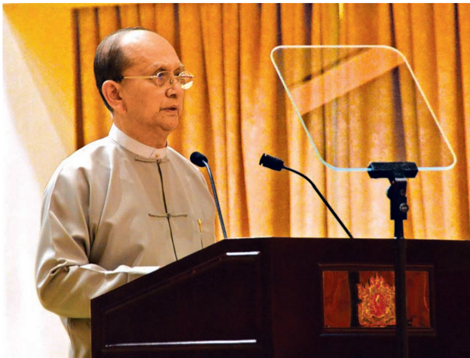
President U Thein Sein delivers speech at opening ceremony of refresher course for senior government officials, including directors general and managing directors of state departments and enterprises.

NAY PYI TAW, 19 Jan — President U Thein Sein delivered speech at the opening ceremony of a refresher course for senior government officials, including directors general and managing directors of state departments and enterprises, in Nay Pyi Taw on Monday.