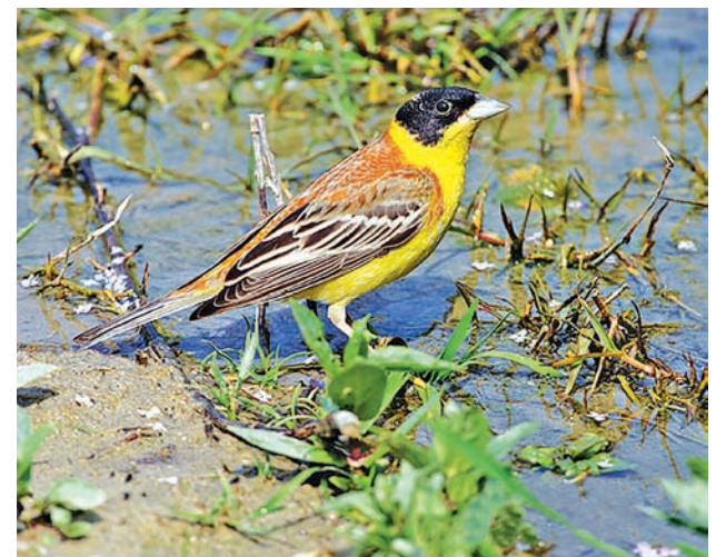
Black-headed Bunting (Emberizo melanocephala) is identified as a new species of bird in Myanmar which found in Bagan in Mandalay Region and central Myanmar by Birdtour Asia.