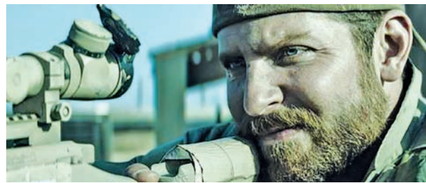
Bradley Cooper stars in “American Sniper.”

“Paddington” was released by The Weinstein Company. “Taken 3” was distributed by Fox, a unit of Twenty-first Century Fox. “Selma” was distributed by Paramount Pictures, a unit of Viacom Inc.—PTI