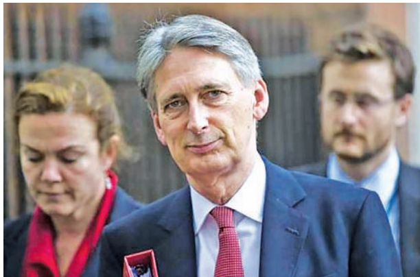
Britain's Foreign Secretary Philip Hammond leaves Downing Street after a meeting in London on 16 Oct, 2014.

Foreign ministers, in their first decision of the day, agreed to appeal against a European Union court ruling that the Palestinian Islamist