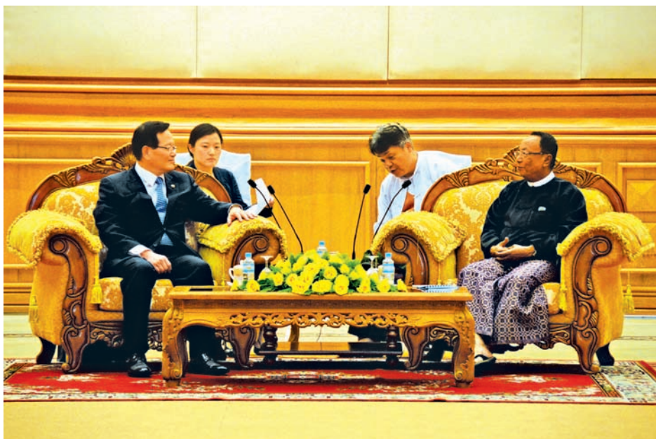
Amyotha Hluttaw Speaker U Khin Aung Myint holds talks with ROK Speaker Dr Chung Ui-hwa.

NAY PYI TAW, 19 Jan — Speaker of Amyotha Hluttaw (Upper House) U Khin Aung Myint received Speaker of the National Assembly Dr Chung Ui-hwa and party of the Republic of Korea at the Amyotha Hluttaw hall, here, on Monday afternoon.