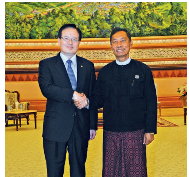
Speaker of Pyidaungsu Hluttaw and Pyithu Hluttaw Thura U Shwe Mann cordially greets Speaker of South Korea's National Assembly, Dr Chung Ui-hwa.