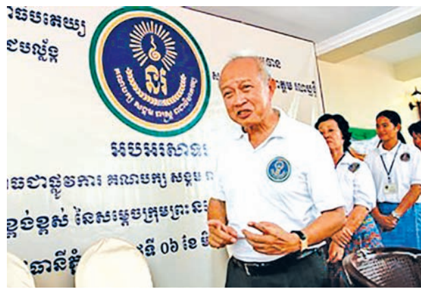
Cambodia's Prince Norodom Ranariddh

ter, Princess Arunrasmeay, was elected as FUNCINPEC's first vice president and Nhek Bunchay was elected as its second vice