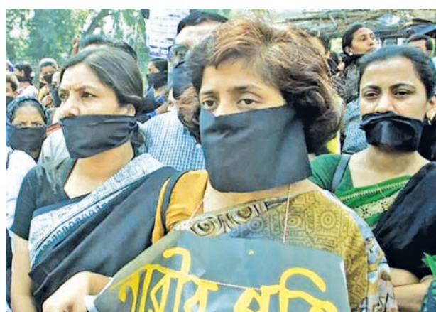
Bangladeshi women wearing masks stage a silent protest against rape in Dhaka on 6 March, 2002.

"There is every reason for an overhaul and com-