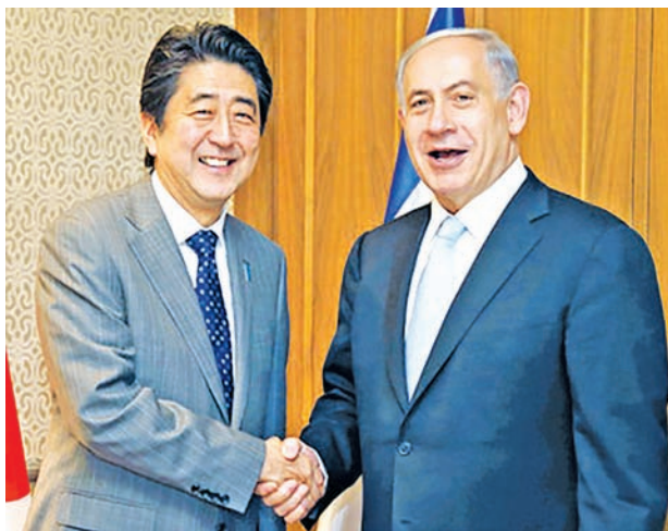
Japanese Prime Minister Shinzo Abe (L) and Israeli Prime Minister Benjamin Netanyahu shake hands before their talks in Jerusalem, Israel, on 18 Jan, 2015. They agreed to work together to enhance anti-terrorism measures.—KYODO NEWS

In their meeting on Sunday, the two leaders agreed to jointly enhance anti-terrorism measures amid a heightened threat of terrorism around the world.—Kyodo News