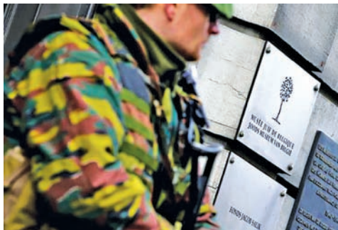
A Belgian soldier guards the entrance of the Jewish museum in central Brussels on 18 Jan, 2015. REUTERS

Earlier a spokesman had said no connection had been established between events in Belgium, where police killed two gunmen during raids in the east Belgian town of Verviers, and the detention in Greece of more than half a dozen people.—Reuters