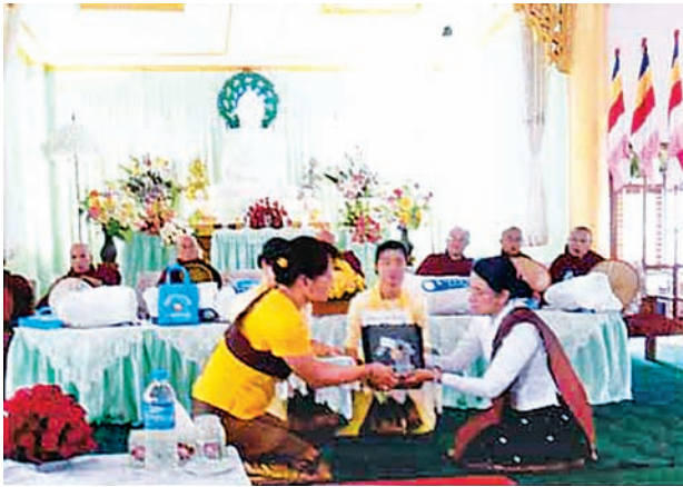
SHWEGIN, 19 Jan — A ceremony to award outstanding persons in the

of Religious Affairs and Dhammabyuha Sasana Mamaka Organization, was held at the training school of the organization in Chaydawya Village in Shwegyin Township, Bago Region, on 17 January.