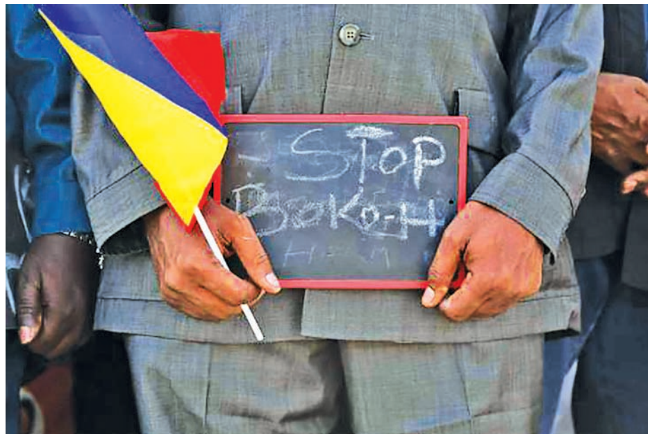
A man holds a sign that reads "Stop Boko Haram" at a rally to support Chadian troops heading to Cameroon to fight Boko Haram, in Ndjamena on 17 Jan, 2015.

"There was a Boko Haram attack on several localities in the Far North region. The assailants burnt down about 80 homes and kidnapped several inhabitants including women and very young children," he said. In an attack that gained worldwide attention last year, its fighters kidnapped around 200 schoolgirls from the town