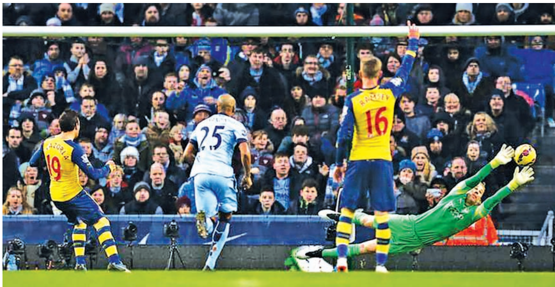
Arsenal's Santi Cazorla (L) shoots to score a goal from a penalty during their English Premier League soccer match against Manchester City at the Etihad stadium in Manchester, northern England on 18 Jan, 2015.

LONDON, 19 Jan — A change of tactics reaped rewards as a new, more subdued but more solid Arsenal arrived at Manchester City on Sunday, saw less of the ball than usual yet still masterfully outplayed the champions.