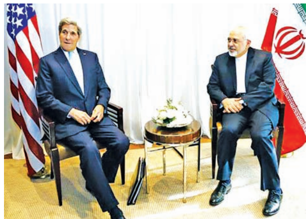
US Secretary of State John Kerry sits with Iranian Foreign Minister Mohammad Javad Zarif before a meeting in Geneva on 14 Jan, 2015.

"Substantive progress is limited, experts will con-