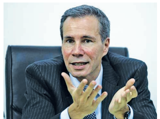
Argentine prosecutor Alberto Nisman

Ambito Financiero and other Argentine dailies reported Nisman was found dead in his bathtub in his flat in the luxurious Buenos Aires district of Puerto Madero. Lawmaker Patricia Bullrich told television channel TN that