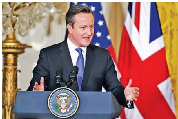
British Prime Minister David Cameron

The attacks triggered a massive security response in Europe and caused policymakers around the world to reconsider their strategies for combating radical Islamic groups and their approach to possible limits to free speech when it provoked