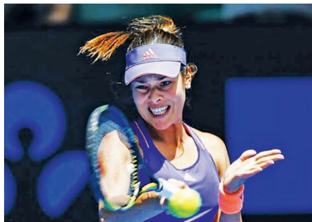
Ana Ivanovic of Serbia hits a return to Lucie Hradecka of Czech Republic during their women's singles first round match at the Australian Open 2015 tennis tournament in Melbourne on 19 Jan, 2015.

Czech Hradecka, who plays with an unorthodox double handed grip from both sides of the court, is ranked 142 nd in the world