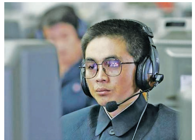
A student looks at a screen in the Grand People’s Study House in the North Korean capital of Pyongyang on 27 Oct, 2008.

Sony’s network was crippled by hackers in No-