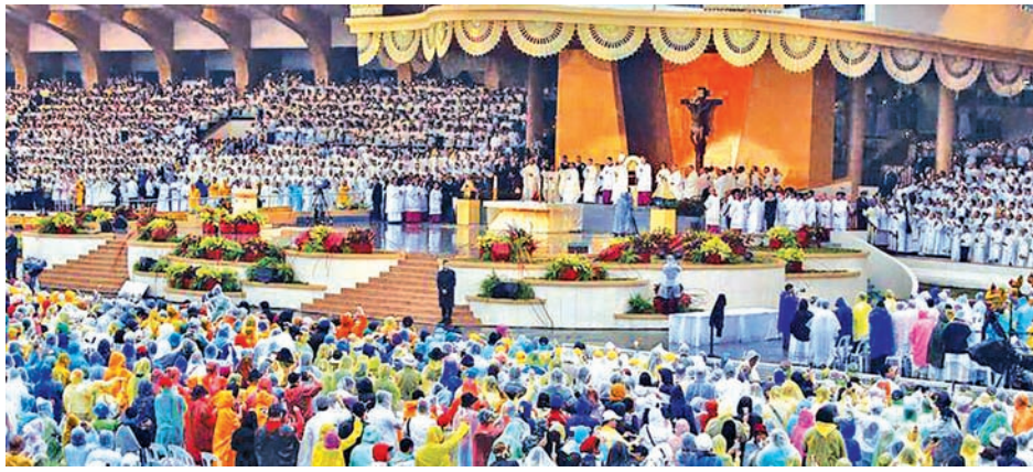
Catholics hold candles during a holy mass by Pope Francis at Rizal Park in Manila on 18 Jan, 2015. Huge crowds converged on a Manila park on Sunday to see Pope Francis wrap up his Asian trip with an outdoor Mass expected to draw one of the largest crowds in Philippine history.

MANILA, 19 Jan — Pope Francis left the Philippines on Monday, ending a week-long trip to Asia that cul-