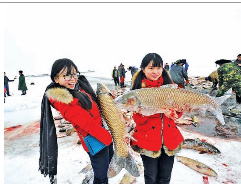
Winter fishing kicked off at Bosten Lake, China's largest inland freshwater lake in northwest China's Xinjiang Uygur Autonomous Region, on 18 Jan, 2015.

Fukuoka Women's University is the only national or public university in Fukuoka Prefecture that offers courses to obtain certification for a nutritionist and qualification to receive an exam to become a managerial dietitian. "A public university is a public entity that is being maintained by tax," the man said in his complaint. "If my application is rejected, the path to become a dietitian would be narrow as I will be forced to go to a university outside the prefecture or a private college."—Kyodo News