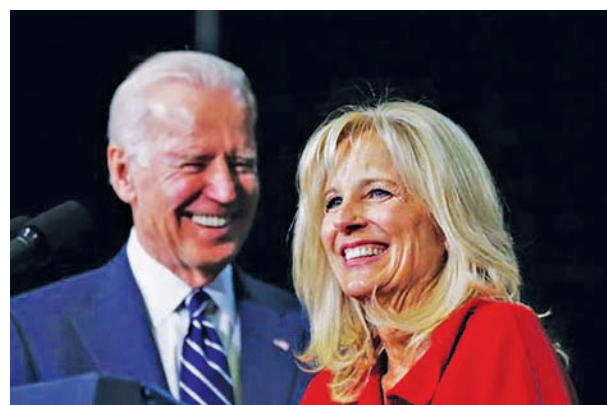
Vice President Joe Biden and Dr. Jill Biden smile onstage while speaking about community college education during a visit to Pellissippi State College in Knoxville, Tennessee on 9 Jan, 2015.

The incident occurred as the Secret Service tries to recover from a series of security lapses, including an incident in September when a knife-carrying man jumped the White House fence and ran into the president's official residence.