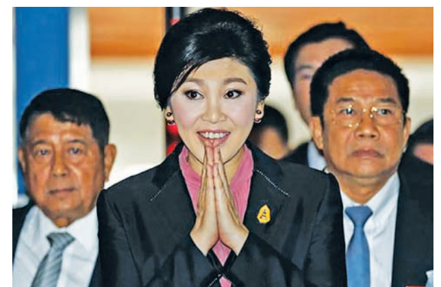
Ousted former Prime Minister Yingluck Shinawatra

She was removed from office in May, after a court found her guilty of abuse