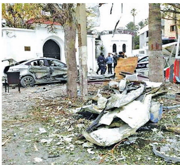
Civilians and security personnel stand at the scene of an explosion outside the Algerian embassy in Libya's capital Tripoli on 17 Jan, 2015.

TRIPOLI, 18 Jan — An explosion outside the Algerian embassy in Libya's capital Tripoli on Saturday slightly wounded two guards and damaged near-