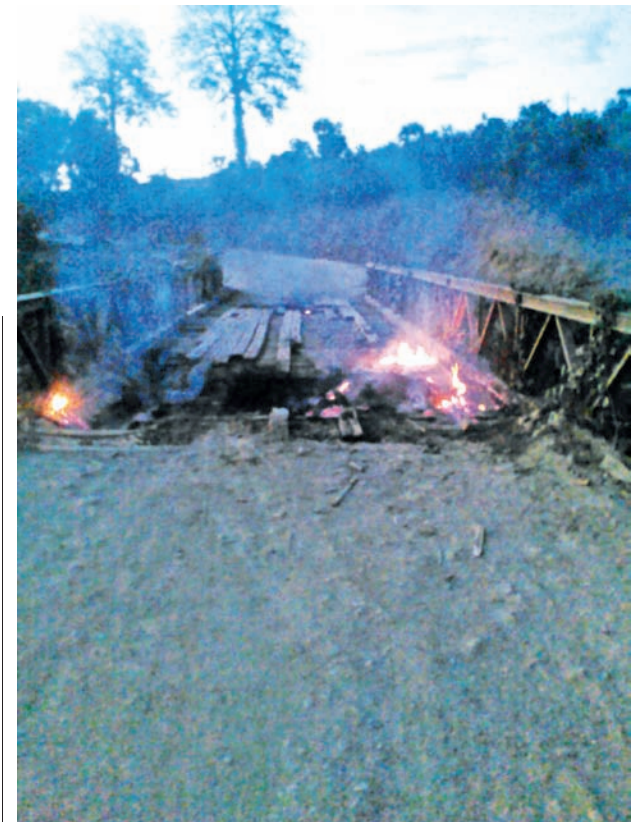
Pahok Creek Bridge burnt by the KIA in Mogaung Township.