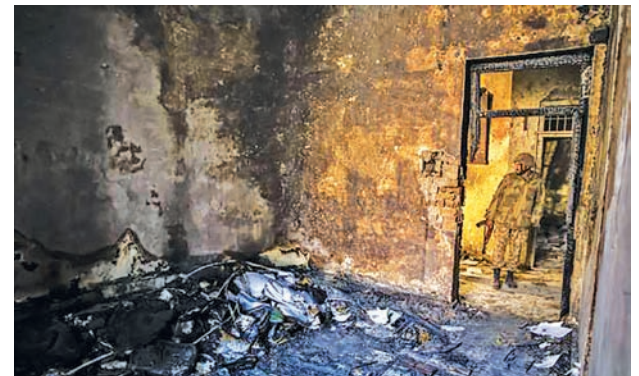
An army soldier stands in the Army Public School, which was attacked by Taliban gunmen, in Peshawar on 17 Dec, 2014.

A second Pakistani official said that talks were underway with the government for the transfer of the five prisoners in Afghanistan to Pakistan.