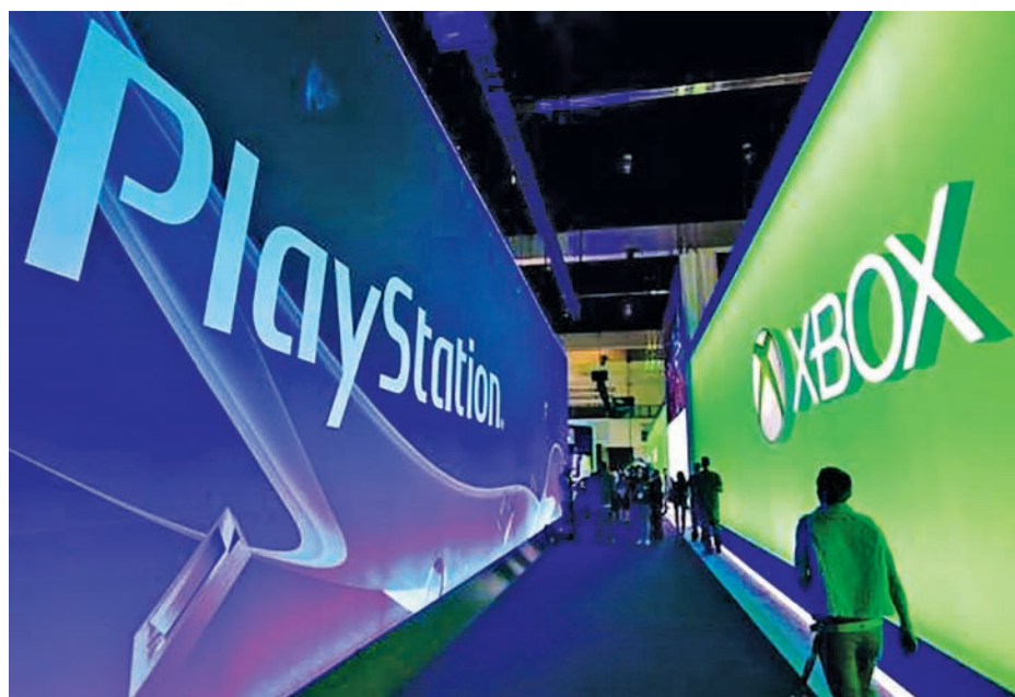
People walk past the Playstation and Xbox booths at the 2014 Electronic Entertainment Expo, known as E3, in Los Angeles, California on 10 June, 2014.

LONDON, 18 Jan — British police said on Friday they had arrested a man in northwest England following the 2014 cyber