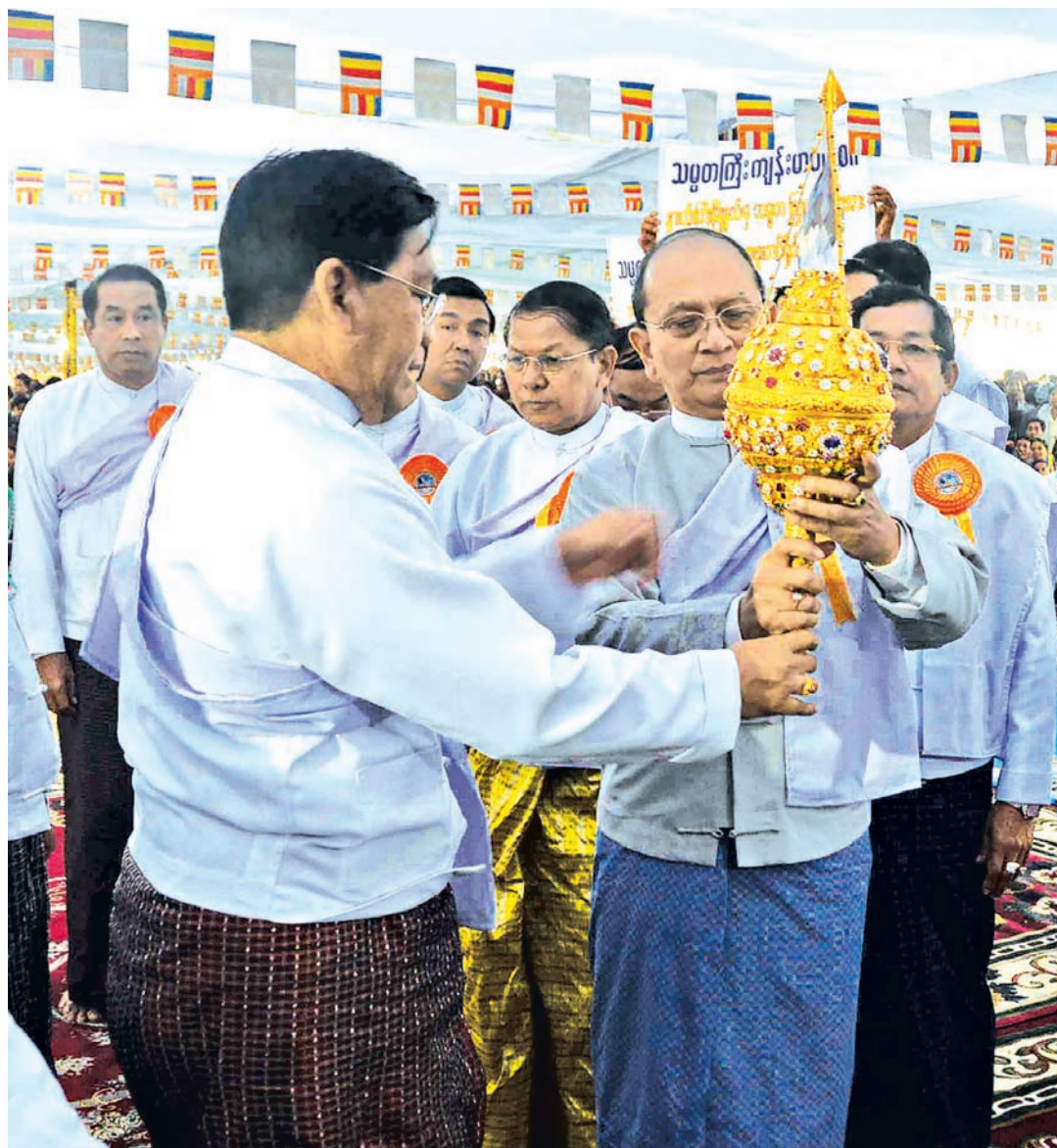
President U Thein Sein conveys a diamond orb to be hoisted atop Maha Zeyathukha Lawka Chantha in Natogyi Township, Mandalay Region.

Among dignitaries present together with the president were the chairman of the Union Election Commission, union ministers, the Mandalay Region chief minister, senior military officers, departmental officials, well-wishers and local people.—MNA