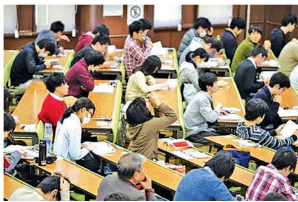
Examinees sit for the unified college entrance examinations at the University of Tokyo in Tokyo's Hongo district on 17 Jan, 2015, as the two-day event began across Japan with about 559,000 applicants and a record 849 public and private institutions taking part.