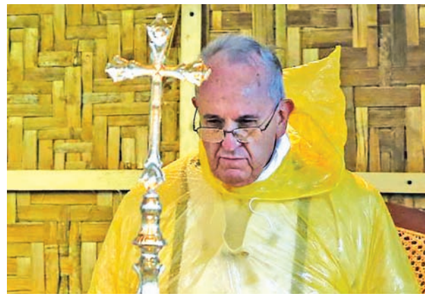
Pope Francis, in a rain poncho, attends during a Mass near Tacloban airport on 17 Jan, 2015.

pable of seeing things with a different angle from us, with a different eye, and pose questions that we men are not able to understand ... so when the next pope comes to Manila, let’s please have more women among you,” he said.