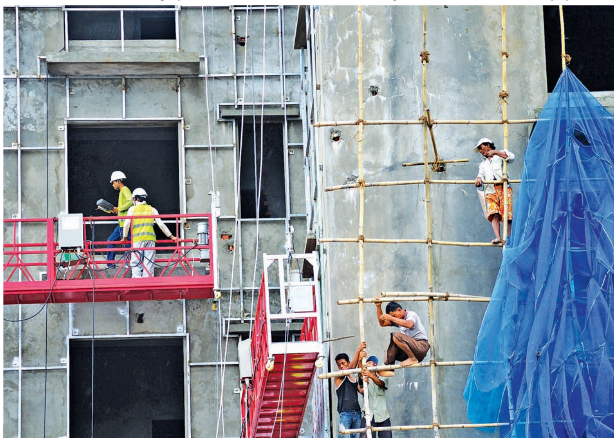
Labourers working at construction site of high-rise building in Yangon municipal area. Designation of minimum wage is expectation of labourers.