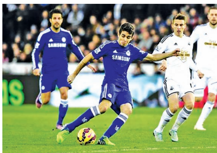
Chelsea's Oscar (2 nd L) shoots to score a goal against Swansea City during their English Premier League soccer match at the Liberty Stadium in Swansea, Wales on 17 Jan, 2015.

Playmaker Christian Eriksen struck another late winner to give Tottenham Hotspur a seventh 2-1 league victory this season, at home to Sunderland, and lift them above