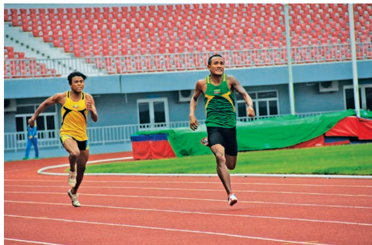
Athletes working on all cylinders in sports trials in race at Wunna Theikdi Stadium. SPED

They presented prizes to the winners in the men's and women's 200-metre freestyle events.—MNA