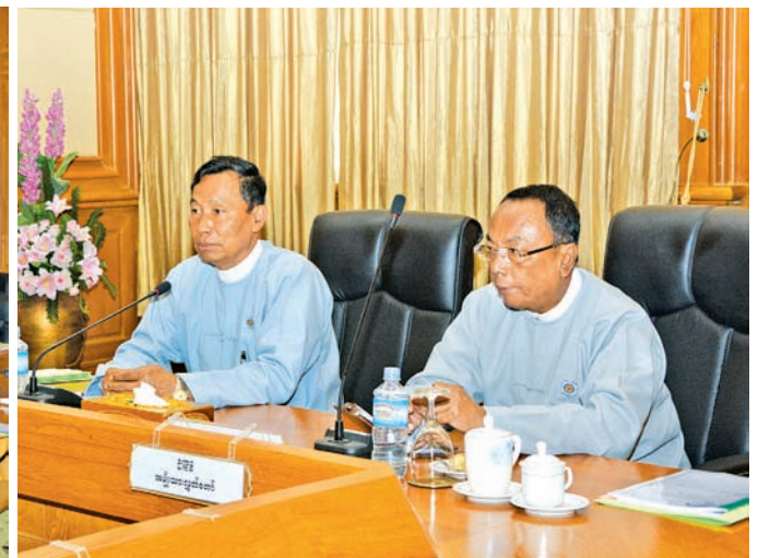
Speaker of Pyidaungsu Hluttaw Thura U Shwe Mann and Speaker of Amyotha Hluttaw U Khin Aung Myint attend coordination meeting of Myanmar Parliamentary Union.