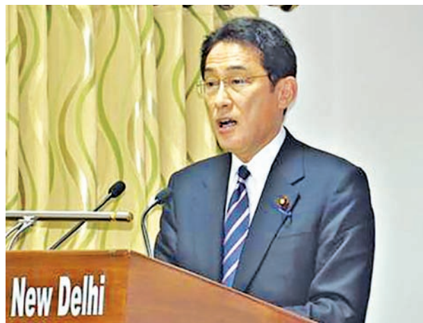
Japanese Foreign Minister Fumio Kishida makes a policy speech in the Indian capital New Delhi on 17 Jan 2015. Kishida vowed Japan would play a more active role in establishing international peace and stability.

vance negotiations over a civil nuclear pact and economic cooperation to help build infrastructure in the emerging economy. Kyodo News