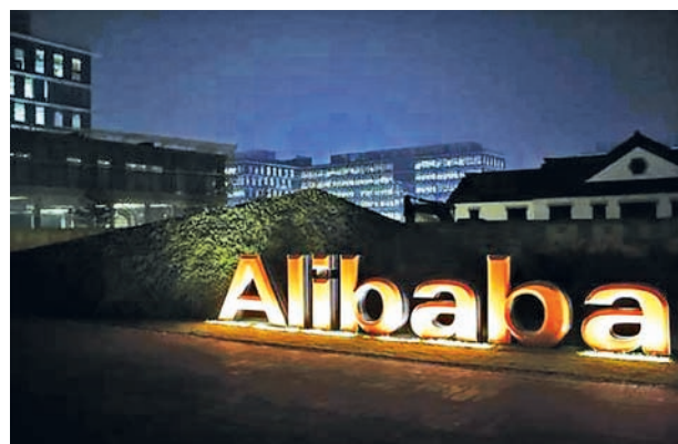
The logo of Alibaba Group is seen inside the company’s headquarters in Hangzhou, Zhejiang Province early on 11 Nov, 2014.