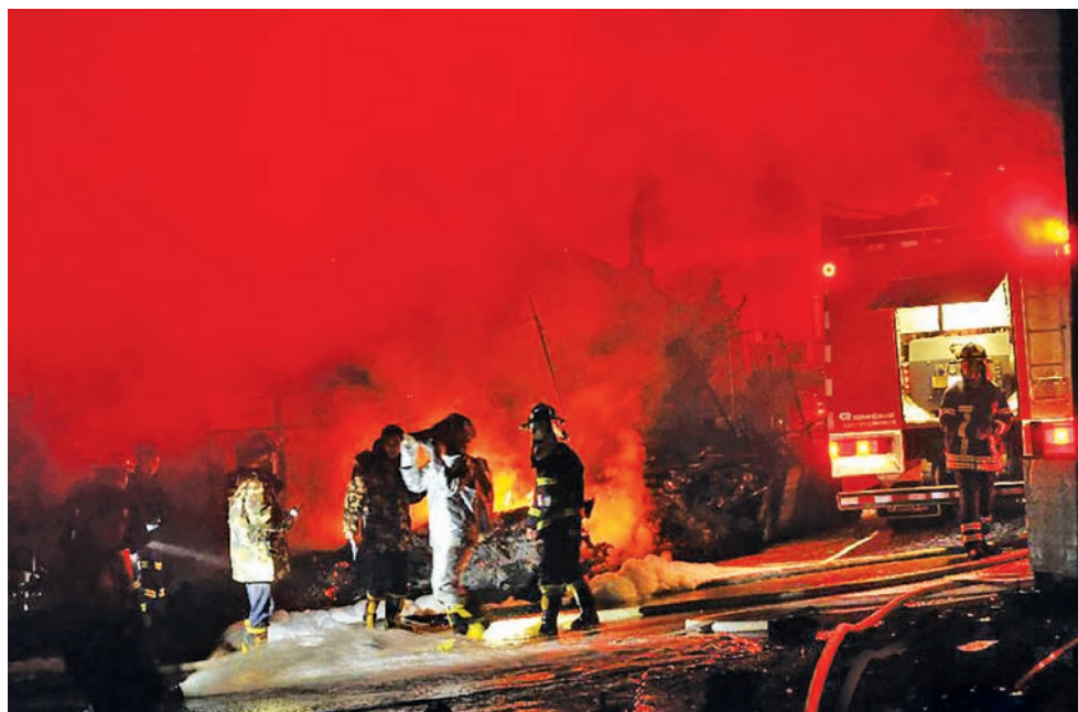
Firemen works at a liquefied gas station which exploded after a tank truck caught fire in the Jinzhou District in Dalian, northeast China's Liaoning Province, on 17 Jan, 2015. The explosion caused 4 injures who were sent to hospital for treatments.

Tel: 067-407468, 407578, 407603, 407583, 407380