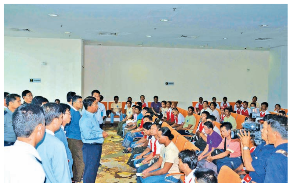
Officials meet Myanmar fishermen released from camp in Port Blair, India.—MNA

On Sunday, 150 more Myanmar fishermen arrived at Yangon International Airport. Those fishermen were from Yangon, Ayeyawady and Taninthayi regions and Rakhine State.—MNA