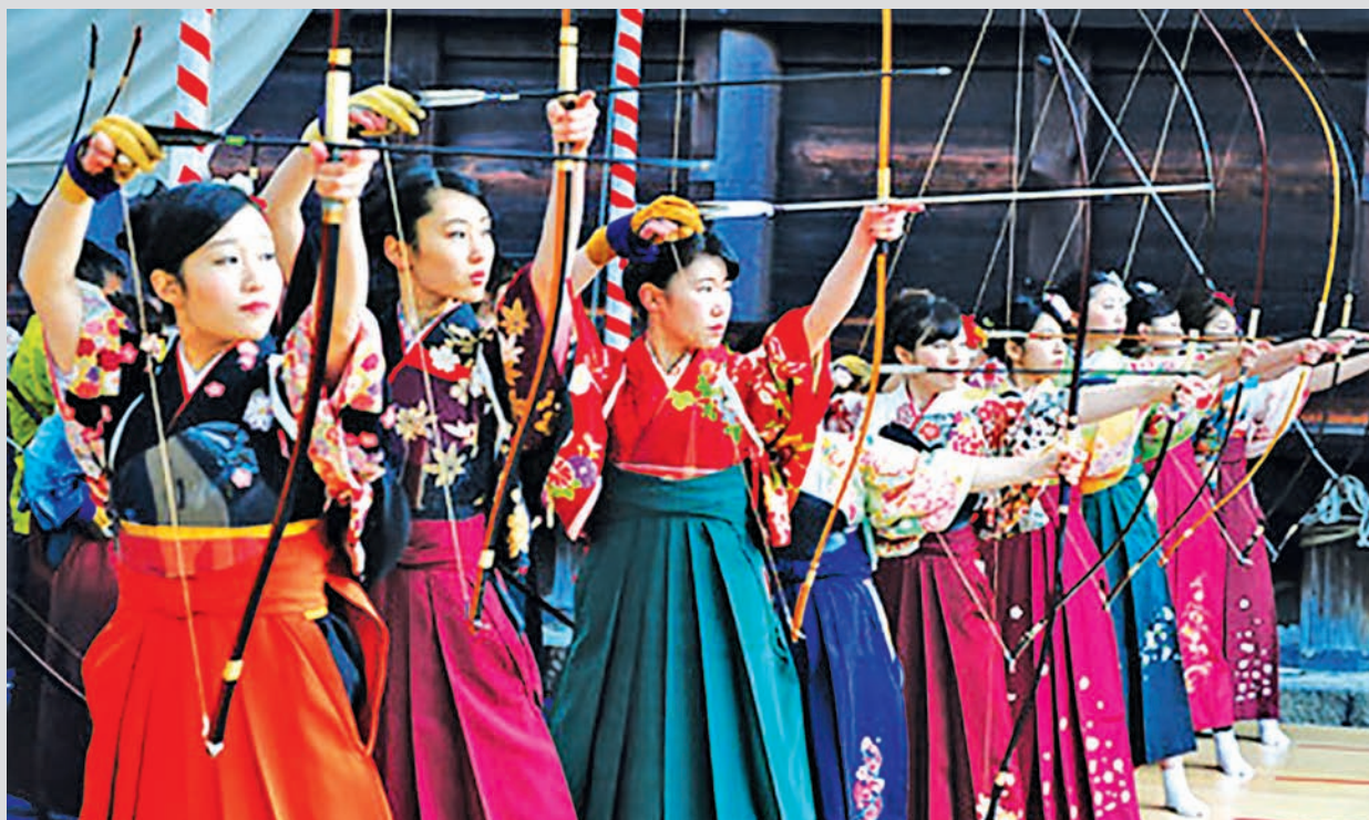
Wearing traditional attire, women who are or will turn 20 years old as of 1 April take aim at targets one metre in diameter and 60 metres away, during an archery event at Sanjusangendo, a Buddhist temple in Kyoto on 18 Jan, 2015.