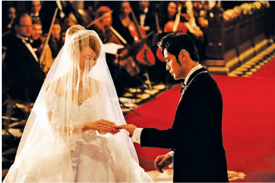
Singer Jay Chou and Hannah Quinlivan held wedding ceremony at the Selby Abbey in Yorkshire, Britain, local time on 17 Jan, 2015.