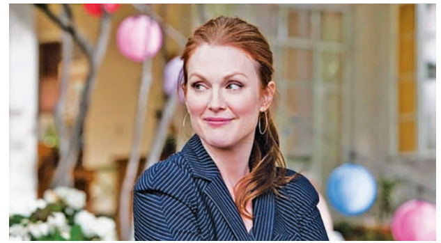
Julianne Moore is nominated in the category of best actress for the 87 th Academy Awards.

LOS ANGELES, 18 Jan — Golden Globe-winner Julianne Moore says while she is over the moon with an Oscar nod for her performance in 'Still Alice', her kids are not interested in it. Moore is nominated in the category of best actress for the 87 th Academy Awards, to be held on 22 February, reported Us magazine.