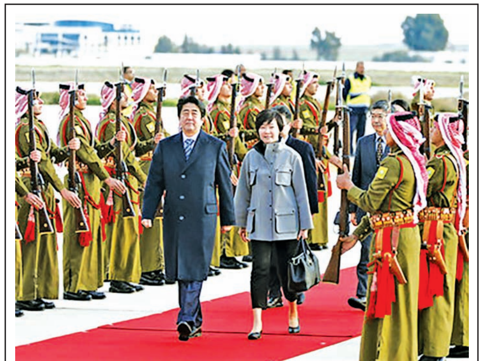
Japan’s Prime Minister Shinzo Abe and his wife Akie are greeted by an honour guard at Queen Alia International Airport in Jordan’s capital Amman on 17 Jan, 2015, upon their arrival from Cairo as part of Abe’s six-day Middle East trip.