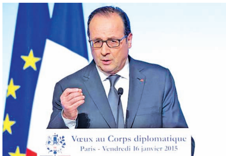
French President Francois Hollande

French Foreign Minister Laurent Fabius condemned the violence in Niamey and Zinder and said France stood in solidarity