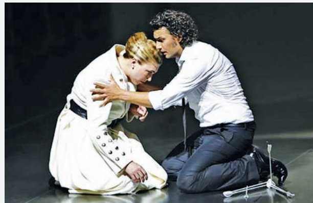
German tenor Jonas Kaufmann (R) performs as Lohengrin and German soprano Annette Dasch performs as Elsa von Brabant during their rehearsal of the opera "Lohengrin" by Richard Wagner in Bayreuth, southern Germany in this on 17 July, 2010 file photo.