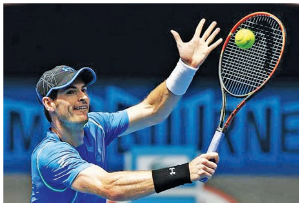
Britain's Andy Murray hits a shot during a practice session on Margaret Court Arena at Melbourne Park on 17 Jan, 2015.

MELBOURNE, 18 Jan — The draw has done few favors for Andy Murray at