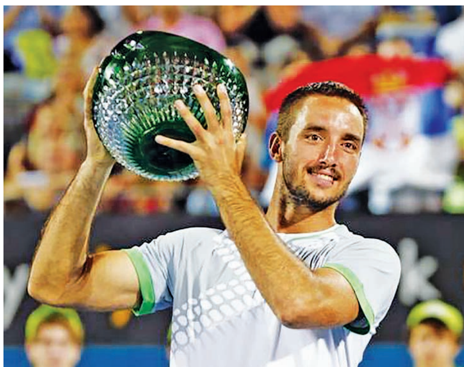
Viktor Troicki of Serbia holds the men's singles trophy after defeating Mikhail Kukushkin of Kazakhstan at the Sydney International tennis tournament in Sydney, on 17 Jan, 2015.

SYDNEY, 18 Jan — Serbian Viktor Troicki took a big step on his comeback trail after a doping ban by ruthlessly dismantling fellow qualifier Mikhail Kukushkin 6-2, 6-3 to win the Sydney International on Saturday.