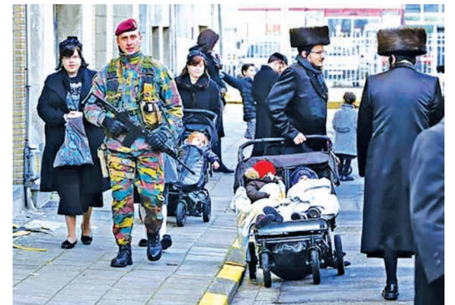
A Belgian paratrooper patrols outside a Jewish school in the central city of Antwerp on 17 Jan, 2015.

"In Antwerp the largest threat is there," Vandeput said, referring to the Jewish community. "It is also where people are most worried." —Reuters