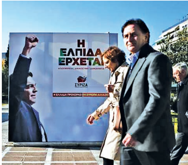
People walk past a banner with an image of opposition leader and head of radical leftist Syriza party Alexis Tsipras at the party's pre-election kiosk in Athens on 15 Jan, 2015.

on 13-15 January, showed that Syriza, which is running on a pledge to end austerity policies and renegotiate the