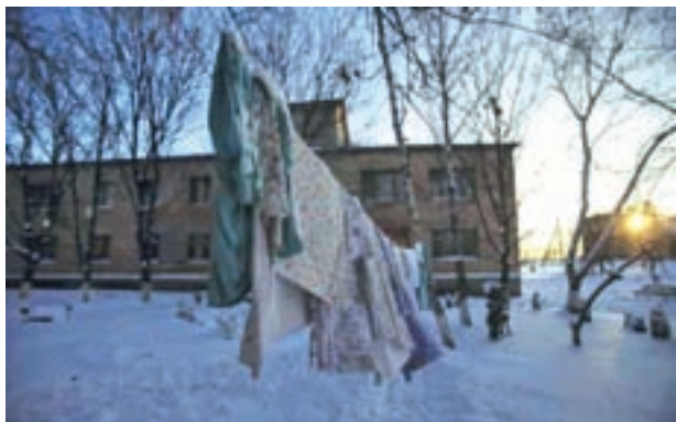
Clothes dry in front of the regional psycho-neurological hospital on the outskirts of Slovyanosersk, in a territory controlled by “Lugansk People’s Republic” (LPR), eastern Ukraine, on 1 Dec, 2014.

GENEVA, 17 Jan — Health care is collapsing after nine months of conflict in eastern Ukraine, where a lack of medicines and vaccines puts people at growing risk from diseases such as polio, measles and tuberculosis, the World