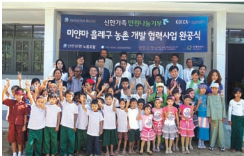
Responsible persons involved in rural school facility construction and renovation project funded by Shinhan Bank with a US$ 80,000, are pictured together with students in Hlegu Township, Yangon.

YANGON, 17 Jan — handover ceremony of Shinhan Bank of the Re- school facilities which public of Korea held a were newly built and ren-