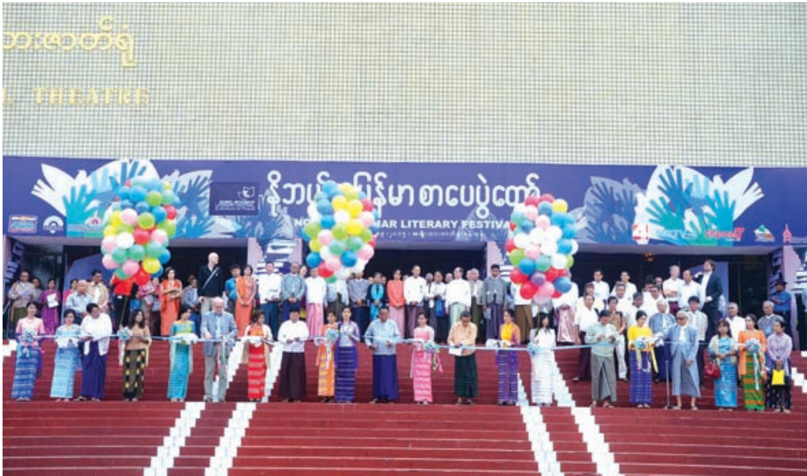
Nobel-Myanmar Literary Festival launched in front of the National Theatre in Yangon.

YANGON, 17 Jan—The Nobel-Myanmar Literary Festival was started at the National Theatre here on Saturday morning, aiming to arouse public interest in