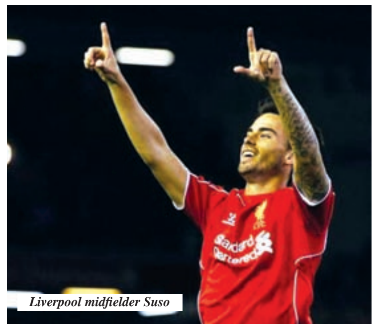
Liverpool midfielder Suso