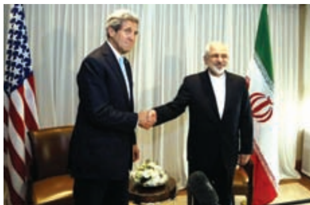
US Secretary of State John Kerry shakes hands with Iranian Foreign Minister Mohammad Javad Zarif before a meeting in Geneva on 14 Jan, 2015.

PARIS, 17 Jan — Iran's Foreign Minister Mohammad Jawad Zarif met his US and French counterparts separately on Friday to try to narrow gaps over Iran's nuclear programme, with just over two months left before a deadline to reach a deal.