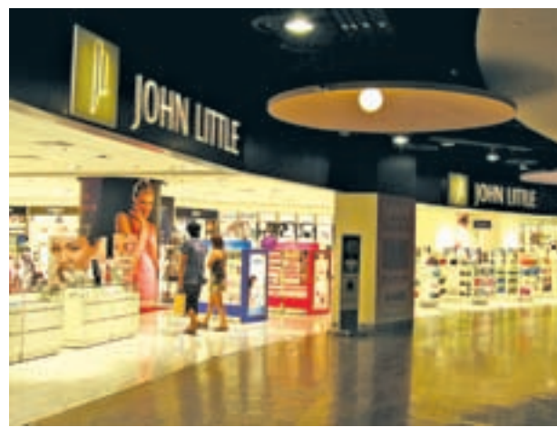
John Little's Marina Square store