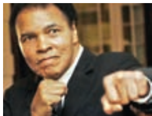
US boxing great Muhammad Ali poses during the Crystal Award ceremony at the World Economic Forum (WEF) in Davos, Switzerland on 20 Jan, 2006.