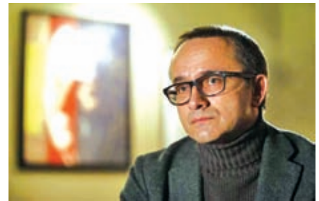
Director Andrey Zvyagintsev listens to a question of a journalist in Moscow on 24 Dec, 2014.

"I'm not doing a 'Beverly Hills Cop' unless they have a really incredible script. I've read a couple things that look like they can make some paper. But I'm not doing a movie just to make some paper. The film has got to be right," he added.