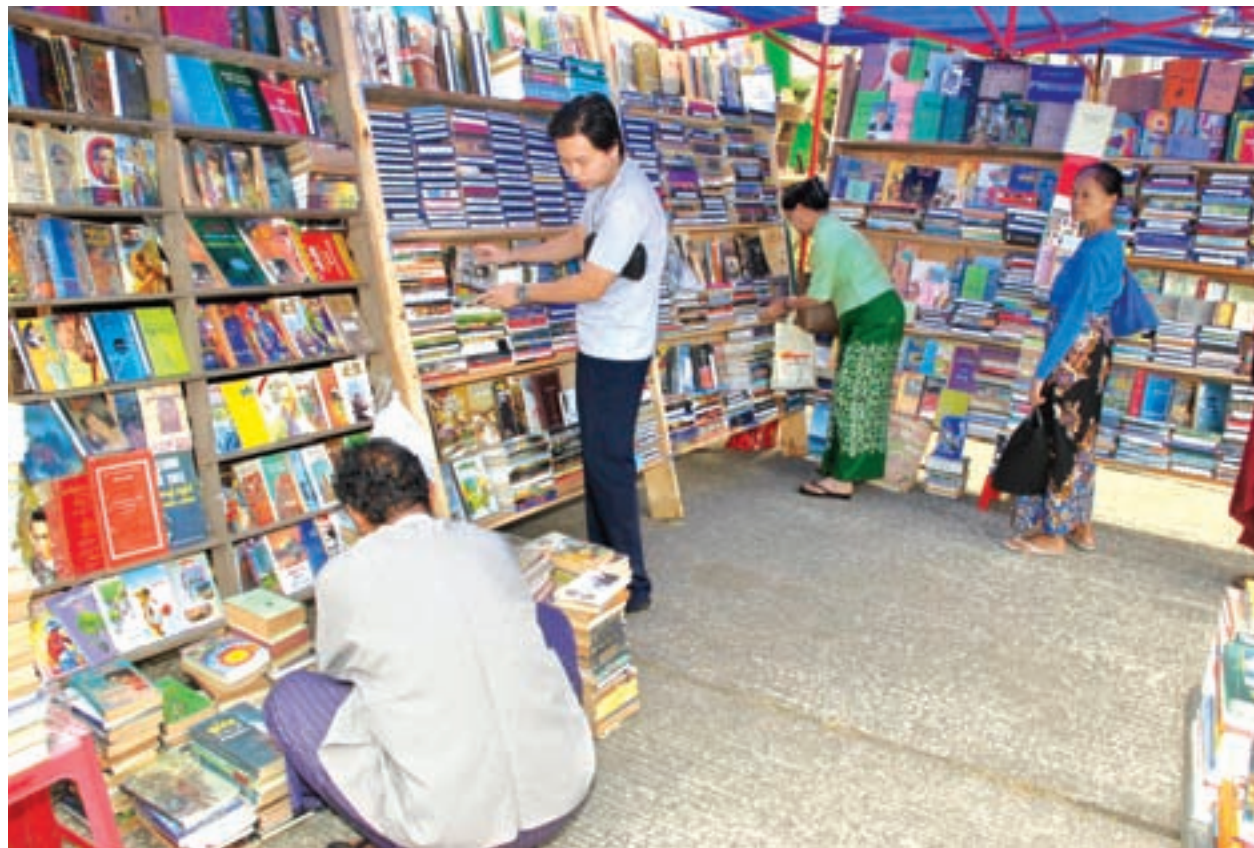
Nobel-Myanmar Literary Festival displays some genres of books to arouse public interest in reading.

NAY PYI TAW, 17 Jan—Armed men of Kachin Independence Army (Kachin) opened fire on military camps in Thewai, Maliyan and Seninku villages of Wai Maw Township in northern