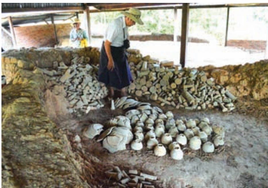
Celadon wares exhibited at kiln site museum in Twantay.