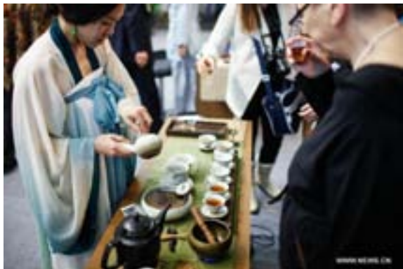
A staff member displays Chinese tea culture at China's stand during the 80 th International Green Week in Berlin, Germany, on 16 Jan, 2015. The 80 th International Green Week, a leading global agriculture fair, opened to visitors in Berlin on Friday, attracting thousands of traders to look for business opportunities.