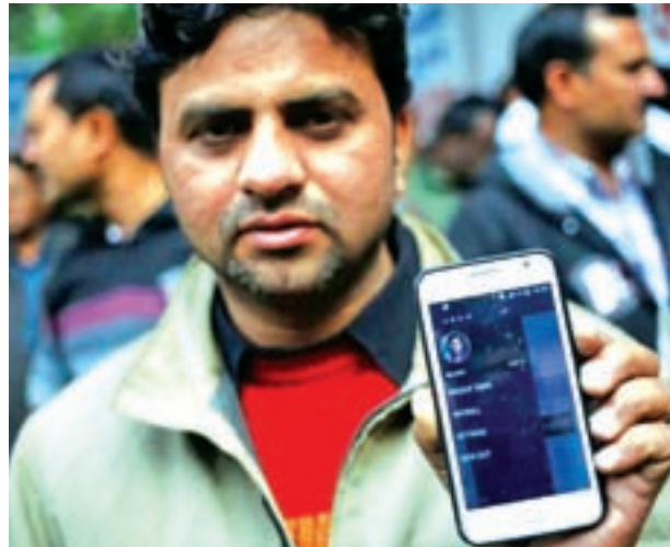
An Uber taxi driver shows an application software in his mobile phone used to track the taxi's location, during a protest against the ban on online taxi services, in New Delhi on 12 Dec, 2014.

NEW DELHI, 17 Jan — A woman who was allegedly raped by an Uber taxi driver in India's capital has hired a prominent lawyer to