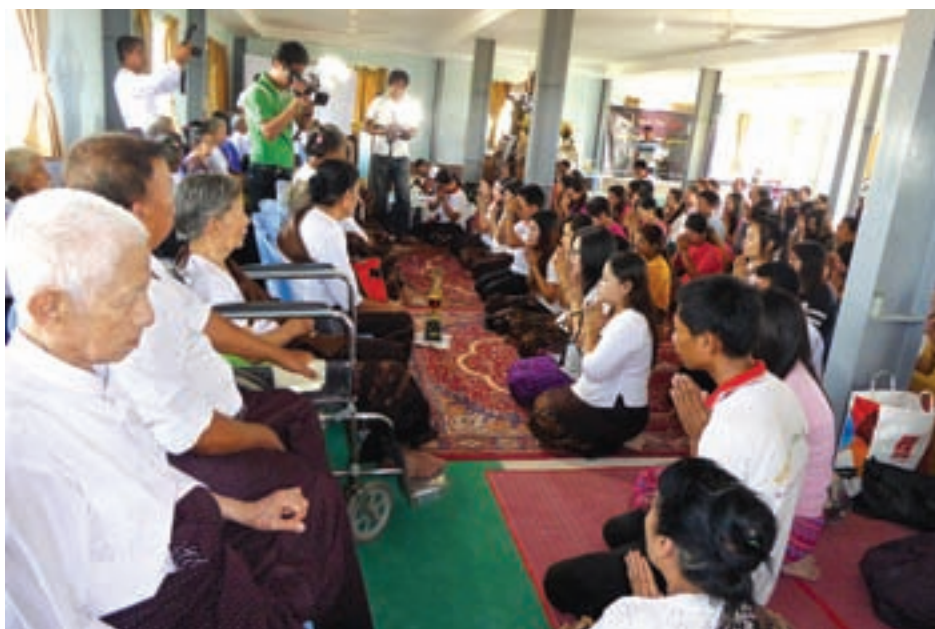
Local aged care providers pay their respects to older persons at a home for the aged in Yangon.