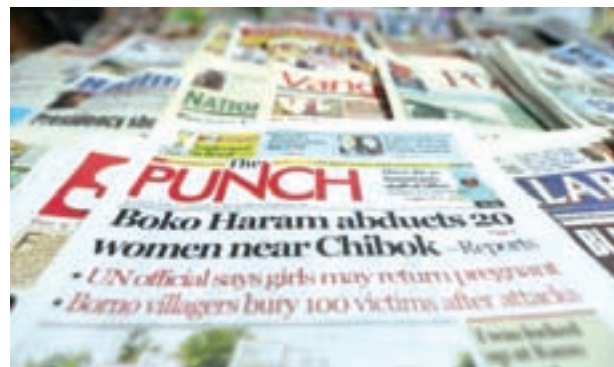
A newspaper with its frontpage headline on an abduction of women from a village in northeast Nigeria, is displayed at a vendor's stand along a road in Ikoyi district in Lagos on 10 June, 2014.

"Nigeria is taking military action and Cameroon is fighting Boko Haram, but I think we are increasingly getting to the point where probably a regional or a multinational force is coming into consideration," he said earlier. In a further blow, Boko Haram militants seized the military base and town of Baga, in Nigeria on the shores of Lake Chad, on 3 January. Baga was the headquarters of a planned force to fight the insurgents with troops from Nigeria, Chad, Niger and Cameroon, although that