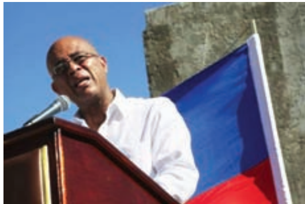
Haiti's President Michel Martelly addresses the audience during a memorial held for the victims of the 2010 earthquake in Titanyen, on the outskirts of Port-au-Prince on 12 Jan, 2015.

Some of his opponents have taken to the streets to protest poverty, corruption and what they consider his autocratic rule. They accuse Martelly of deliberately bringing about the crisis in order to rid himself of stubborn opposition in parlia-