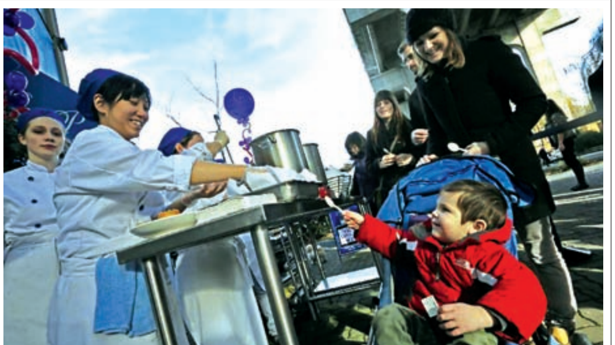
Chefs serve free soup samples to the public during the Chef Soup Experiment event at Granville Island in Vancouver, Canada, on 16 Jan, 2015. The 13 th Dine Out Vancouver Festival kicked off on Friday with a Chef Soup Experiment event. Each of the 50 top chefs brought one ingredient and put them together to make one soup that served to the public for free.—XINHUA

"The world needs to understand our environment. Our cooperation with the United Kingdom in security and social sectors is growing," General Raheel said.—Xinhua