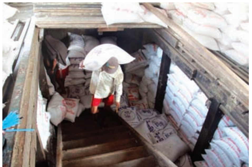
The World Bank says there are good market prospects to accommodate higher rice exports from Myanmar over the next 10-15 years, indicating China is becoming a large net importer of Myanmar rice.

Rice and Paddy Trading Company Limited (FRP), Myanmar Rice Mill Company Limited, Golden Land East Asia Development (See page 3)