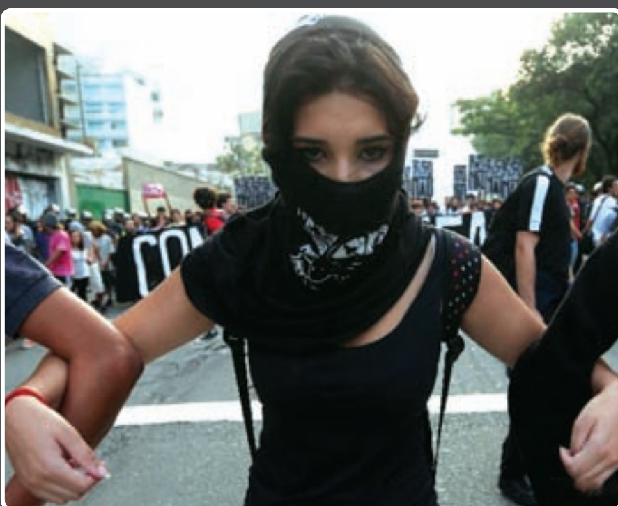
A woman takes part in a protest against the increase of the fares of public transportation, in Sao Paulo, Brazil on 16 Jan, 2015.

But in an indication of the shifting mood, Macky Sall, president of one of Africa's most stable democracies Senegal, said late on Thursday: "Freedom of the press should not, in our view, head in the direction of a totally pointless provocation."— Reuters