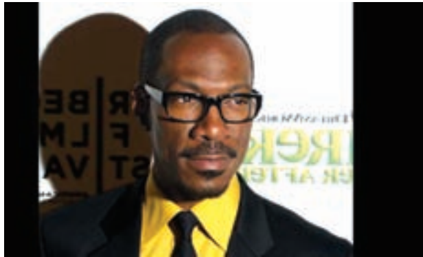
Actor Eddie Murphy, who is expected to reprise his role as Axel Foley in the fourth 'Beverly Hills Cop' film, says he won't do the movie without an incredible script.

LOS ANGELES, 17 Jan — Actor Eddie Murphy, who is expected to reprise his role as Axel Foley in the fourth 'Beverly Hills Cop' film, says he won't do the movie without an incredible script.