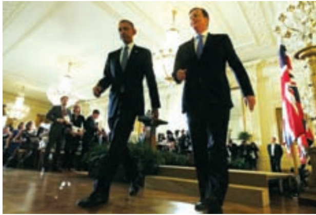
US President Barack Obama (L) and British Prime Minister David Cameron (R) depart a joint news conference following their meeting at the White House in Washington on 16 Jan, 2015.

"We face a poisonous and fanatical ideology that wants to pervert one of the world's major religions, Islam, and create conflict, terror and death. With our allies, we will confront it wherever it appears," Cameron told a joint White House news conference with Obama after their talks. Obama said he and Cameron accepted that intelligence and military force alone would not solve the problem, and they