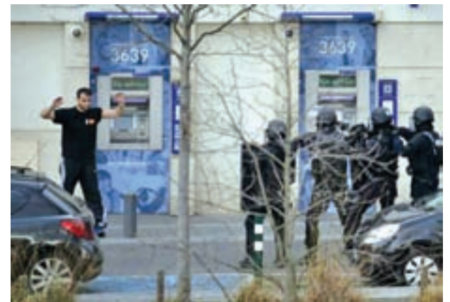
A suspect in a hostage taking situation raises his arms in the air as he is detained by members of special French RAID forces outside the post offices in Colombes outside Paris, on 16 Jan, 2015.