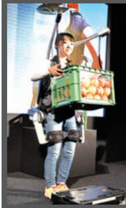
A woman wearing a prototype "assist suit" developed by Japanese agriculture equipment maker Kubota Corp easily lifts a 20-kilogram container filled with apples during a presentation in Kyoto on 16 Jan, 2015. The suit can reduce the burden on a wearer when loading or unloading articles, by making use of motors.