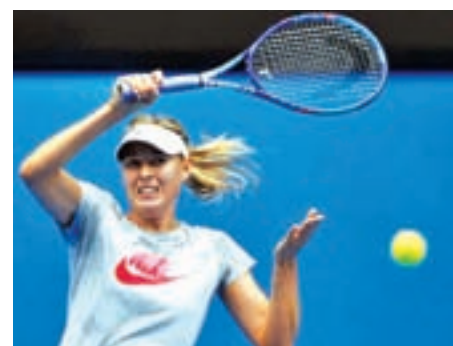
Russia's Maria Sharapova hits a shot during a practice session on Rod Laver Arena at Melbourne Park on 15 Jan, 2015.

In contrast to last year's tournament, the re-energised Russian enters the year's first grand slam in peak condition and great form after winning the warmup Brisbane International with a hard-fought victory over