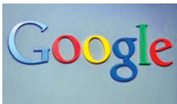
A Google logo is seen at the garage where the company was founded on Google's 15 th anniversary in Menlo Park, California on 26 Sept, 2013.

Softcard is jointly owned by AT&T Inc, Ve-