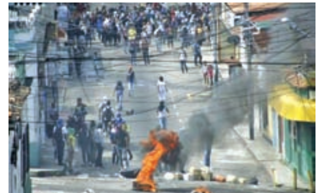
Students block a street as they clash with national guards during a protest against the government in San Cristobal on 14 Jan, 2015.