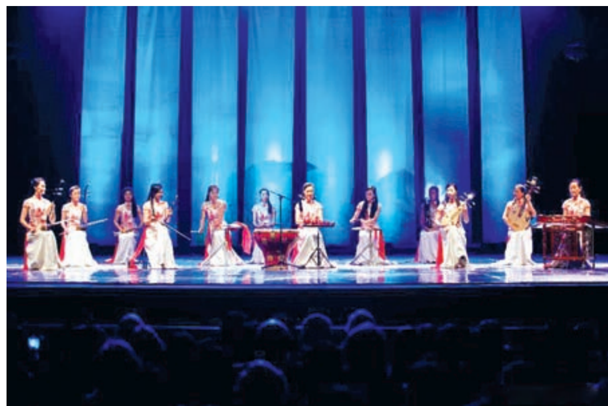
Chinese musicians take part in the performance of the "Band of Butterfly Girls" during the Gala Concert organized by the Confucius Institute of the University of Santo Tomas to celebrate the Chinese New Year, in Vina del Mar city, Chile, on 16 Jan, 2015.