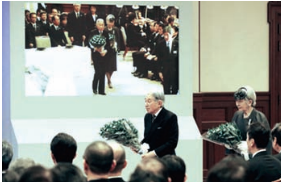
Japan's Emperor Akihito and Empress Michiko walk to the altar to offer flowers during a memorial ceremony in Kobe, western Japan, on 17 Jan, 2015, to mark the 20th anniversary of the Great Hanshin Earthquake, which devastated the port city and its surrounding areas and claimed the lives of 6,434 people.

Of the polled survivors with an average age of 73.7, 54 percent said they were not receiving or were dissatisfied with support from local governments, while only 21 percent said