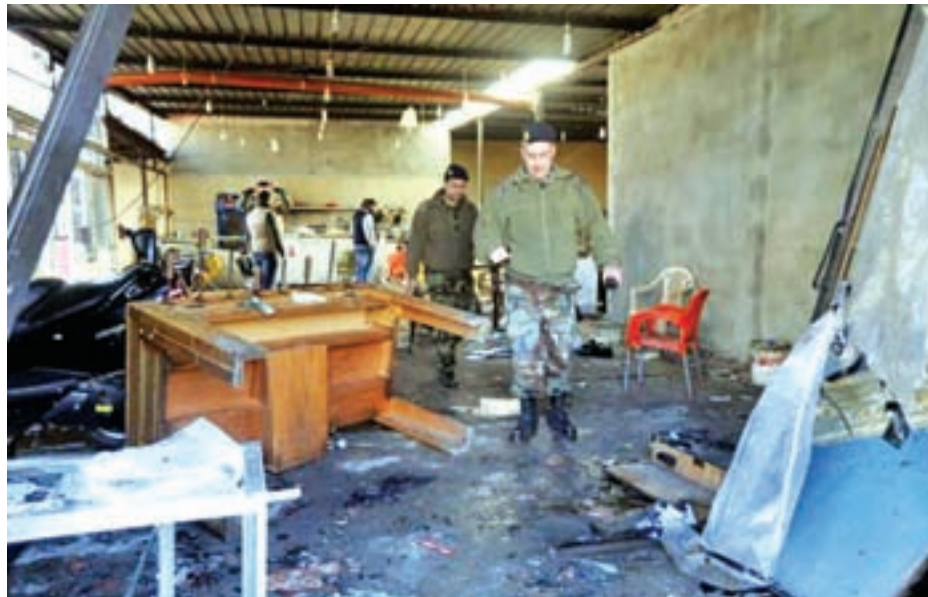
Lebanese Army soldiers walk inside a cafe where a suicide bomb attack took place in Jabal Mohsen, Tripoli on 11 Jan, 2015.

Three injured militants have been detained, and no casualties have been reported on the side of security force, the police chief noted.