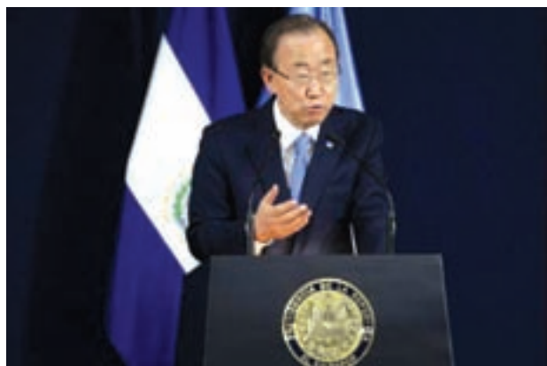
United Nations Secretary-General Ban Ki-moon speaks during a Press conference at the presidential house in San Salvador on 16 Jan, 2015.

SAN SALVADOR, 17 Jan — United Nations Secretary-General Ban Ki-moon said on Friday he was concerned by violence in Central America and El Salvador, where there has been a sharp spike in murders and police assassinations over the last year.