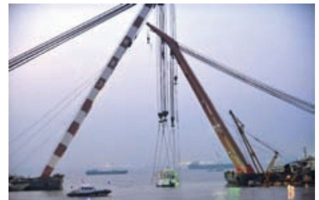
The wreckage of capsized tug boat "Wanshenzhou 67" (C) is lifted from the Yangtze River near Jingjiang, east China's Jiangsu Province, early on 17 Jan, 2015.

Rescuers found the body of the last missing person in the tug's cockpit at around 2 pm on Saturday, according to the Jiangsu Maritime Safety Administration (JMSD). The boat, the "Wanshenzhou 67", was extracted from the depths on Saturday morning, 40 hours after it sunk in Fubei Channel, near Jingjiang City. On Saturday morning, local authorities published the names of those on board, including eight foreigners — four Singaporeans, an Indonesian, a Malaysian, an Indian and a Japanese national. All 25 on-