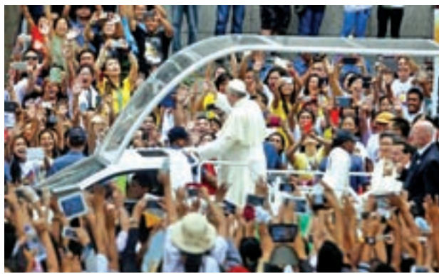
Pope Francis waves to well-wishers aboard the popemobile near the Manila Cathedral on 16 Jan, 2015.

MANILA, 16 Jan — Pope Francis called on the Philippine government on Friday to tackle corruption and hear the cries of the poor suffering from “scandalous social inequalities” in Asia’s most Catholic country. The pope went to the Malacanang presidential palace for an official welcoming ceremony led by President Benigno Aquino as tens of thousands of ecstatic Filipinos lined the streets. Francis, a champion of the poor, pulled no punches in calling for a more just and caring society in the Philippines, which is about 80 percent Catholic. “It is now, more than ever, necessary that political leaders be outstanding for honesty,