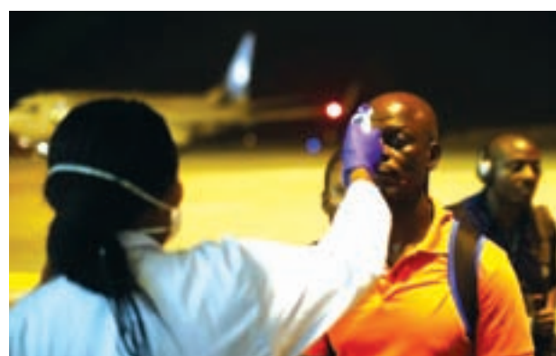
A health worker checks the temperature of a man arriving at Bata Airport, on 14 Jan, 2015.

“This external help was absolutely vital in bolstering and supporting the capacity of the people in the country to make the changes,”