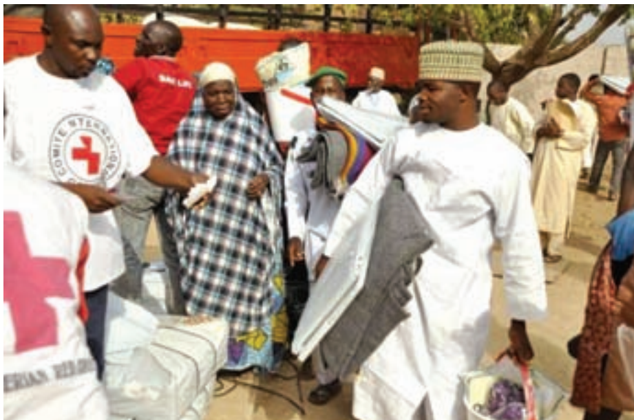
The Red Cross in Kano distributes relief materials to displaced victims of the Boko Haram violence, at a relief camp in Dawaki, a local government area in Kano, on 16 Dec, 2014.

Jonathan faces ex-military ruler Muhammadu Buhari in the 14 February election, and there are grave doubts over whether voting can happen in swathes of the northeast overrun by rebels. As they are mostly opposition strongholds, Buhari