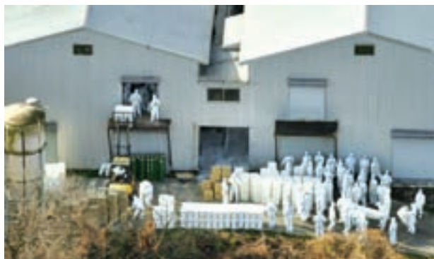
Photo taken from a Kyodo News helicopter shows public workers beginning to cull roughly 200,000 chickens on 16 Jan, 2015, at a farm in the western Japan city of Kasaoka, where a highly pathogenic H5 strain of bird flu virus was confirmed. The cull is expected to take four days.