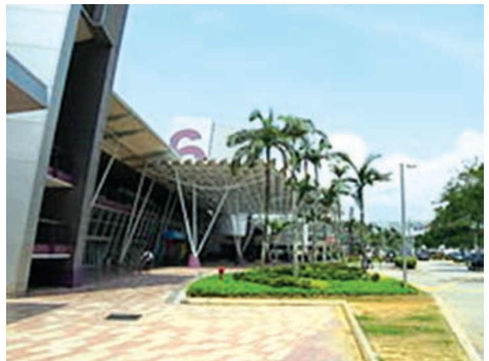
Exterior of the Singapore Expo Venue

Venue is the largest convention and exhibition venue in Singapore with over 100,000 square meters of column-free, indoor space spread over 10 halls. Built and managed by PSA International, and funded by the Ministry of Trade and Industry, the S$220 million building was built in the eastern part of Singapore. Currently managed by Temasek Holdings, Singex Venues Private Limited, the government-owned building was designed by Cox Richardson Rayner. It is a very big architectural firm with personnel in cities around Australasia. The design was perfect to fit the original aim and goal of the expo venue.