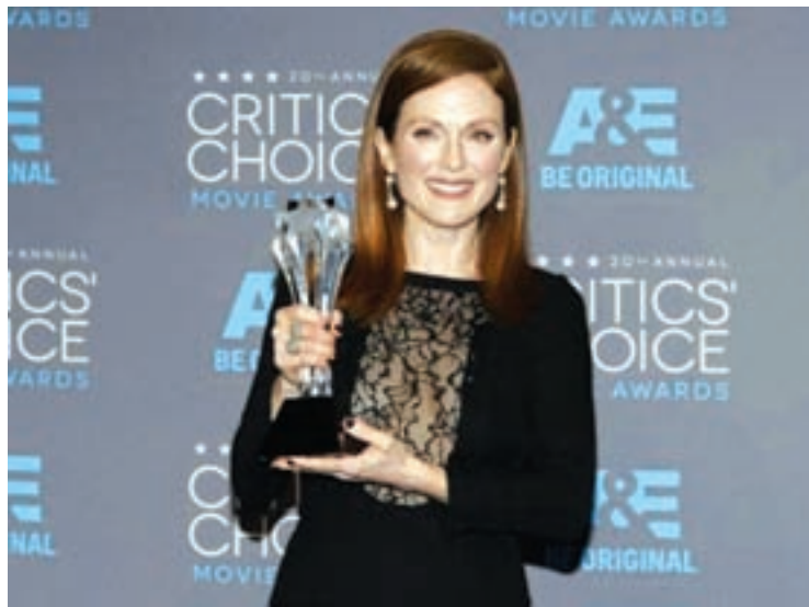
Actress Julianne Moore poses backstage with her Best Actress award for "Still Alice" during the 20 th Annual Critics' Choice Movie Awards in Los Angeles, California on 15 Jan, 2015.