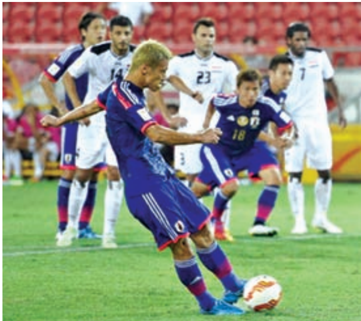
Japan’s Keisuke Honda scores the opening goal from the penalty spot during the first half of a Group D match against Iraq at the AFC Asian Cup at Brisbane Stadium in Brisbane, Australia on 16 Jan, 2015.