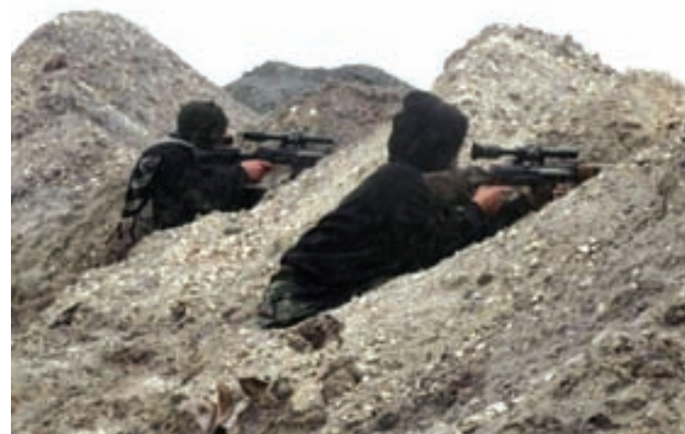
Rebel fighters take positions behind sand barricades at al-Breij frontline, after what they said was an advance by them in al-Manasher and al-Majbal areas, where forces loyal to Syria's President Bashar al-Assad were stationed, in Aleppo on 5 Jan, 2015.