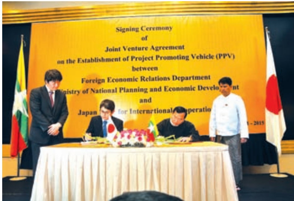
The signing ceremony of Joint Venture Agreement on establishment of Project Promoting Vehicle in progress.—MNA

NAY PYI TAW, 16 Jan— Foreign Economic Relations Department under Ministry of National Planning and Economic Development and Japan Bank of International Cooperation (JBIC) of Japan signed a Joint Venture Agreement for Project Pro-