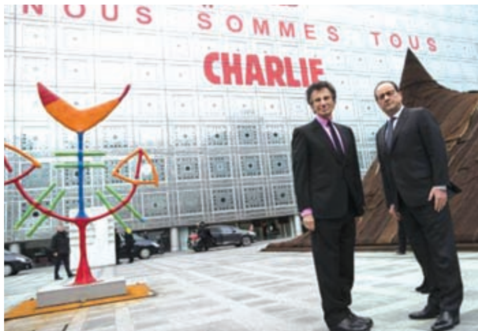
French President Francois Hollande (R) and the President of the Institut du Monde Arabe (Arab institute), Jack Lang pose in front of the Arab Institute building bearing the message 'We are Charlie', in Paris, on 15 Jan, 2015.

In the Middle East, authorities in several countries have denounced