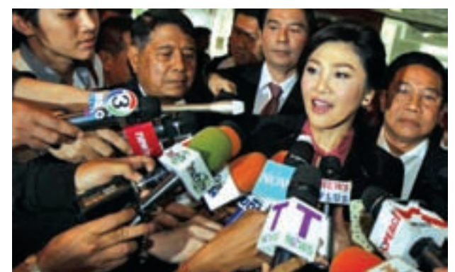
Ousted former Prime Minister Yingluck Shinawatra talks to reporters as she arrives at Parliament before the National Legislative Assembly meeting in Bangkok on 9 Jan, 2015.

The NLA will hold a third hearing on 22 January before voting on the charges against Yingluck on 23 January. A decision to ban her