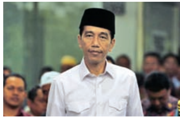
Indonesia's President Joko Widodo walks after Friday prayers at the Presidential palace in Jakarta, on 24 Oct, 2014.

Hundreds of people, who helped Widodo to win the presidential election in July on a platform of re-