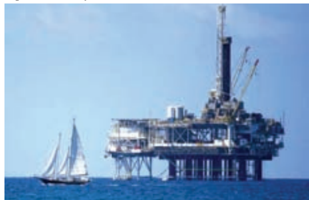
An offshore oil platform is seen in Huntington Beach, California on 28 Sep, 2014.—REUTERS

“In contrast, demand stayed tame, with European and Indian demand trending in the contraction zone,” it said.—Reuters