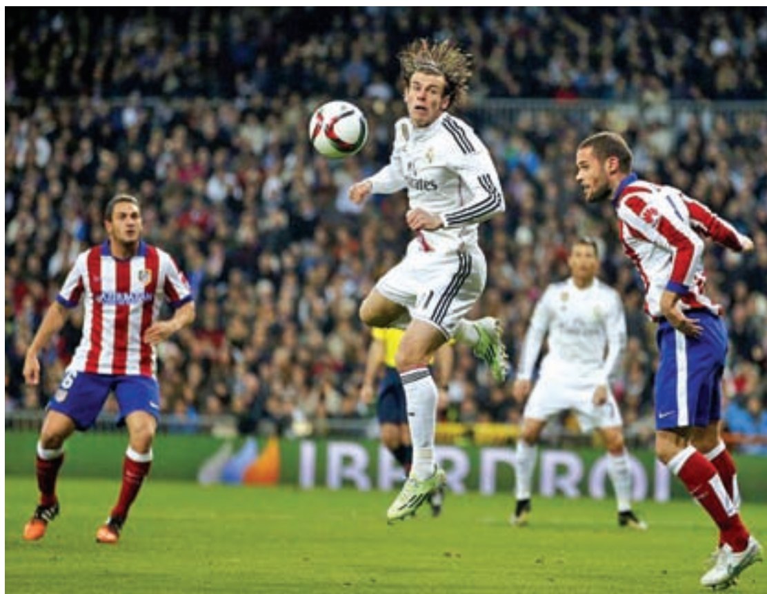
Real Madrid’s Gareth Bale (C) heads the ball challenged by Atletico Madrid’s Mario Suarez during their King’s Cup round of 16 second leg soccer match in Madrid on 15 Jan, 2015.

Editorial Section — (+95) (01) 8604529 Advertisement & Circulation — (+95) (01) 8604532 gnmindaily@gmail.com www.globalnewlightofmyanmar.com www.facebook.com/globalnewlightofmyanmar THE GLOBAL NEW LIGHT OF MYANMAR R/489 Printed and published at the Global New Light of Myanmar Printing Factory at No. 150, Nga Htat Kye Pagoda Road, Bahan Township, Yangon, by the Global New Light of Myanmar Daily.