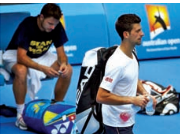
Serbia's Novak Djokovic (R) walks past Switzerland's Stan Wawrinka after they had a practice session together on Margaret Court Arena at Melbourne Park on 15 Jan, 2015. The Australian Open tennis tournament begins on 19 January.

MELBOURNE, 16 Jan — Novak Djokovic's chances of winning a fifth Australian Open title have been boosted by a kind draw in the opening week, while