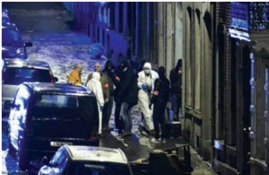
Belgian police inspect an apartment in central Verviers, a town between Liege and the German border, in the east of Belgium on 15 Jan, 2015.