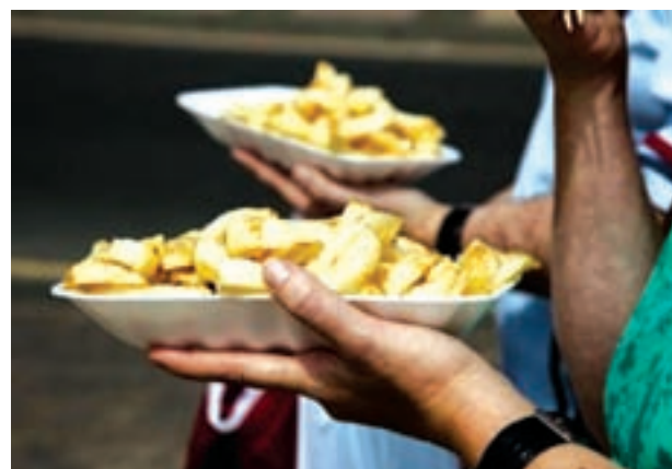
People eat chips whilst walking along the promenade at the British holiday resort of Scarborough, England on 16 July, 2009.

A Conservative spokesman said the Labour plan was “naive” and defended the government’s track record on public health. Labour have already pushed for the government to introduce a minimum price for alcohol and to ban branding on cigarette packaging. They said that without action, the