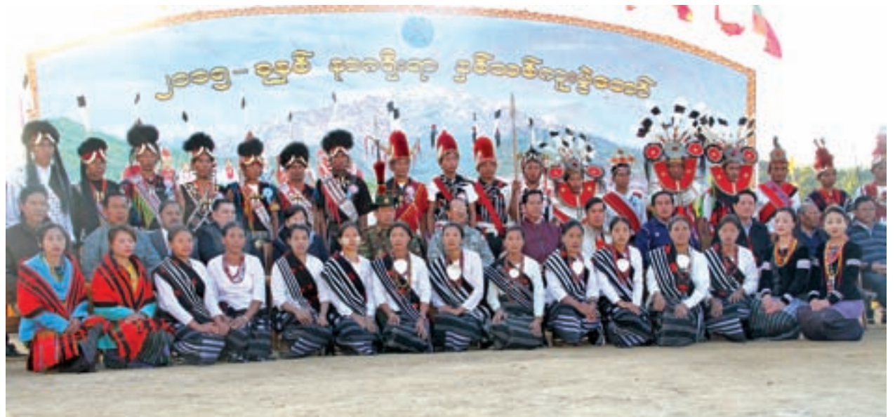
Union Ministers pose for documentary photo with Naga ethnics at the Naga New Year Festival 2015 in Leshi, Sagaing Region.—MNA

Leshi-Htamanthi road and Leshi-Summara road.