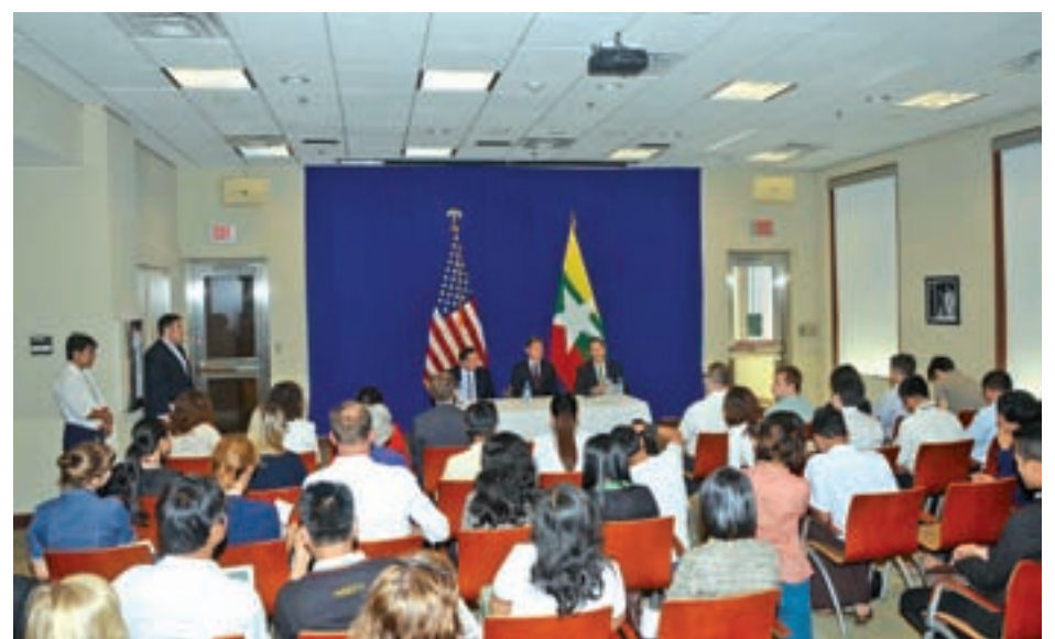
Officials meet media at press conference on the second Myanmar-US human rights dialogue.—MNA

The discussions focused on national races’ affairs, promotion and protection of human rights, creating an environment