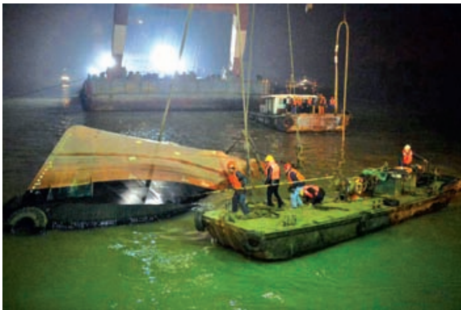
Rescuers salvage the wreck after a tug boat sank in the Yangtze River in east China’s Jiangsu Province on 16 Jan, 2015. Rescuers have rescued three passengers on board a tug boat that sank while testing water in Fubei Channel on the Yangtze River at about 3 pm on Thursday, and are still searching for more than 20 missing.

Seven or eight foreigners including Singaporean, Japanese nationals and a Frenchman, are believed to be among the missing.