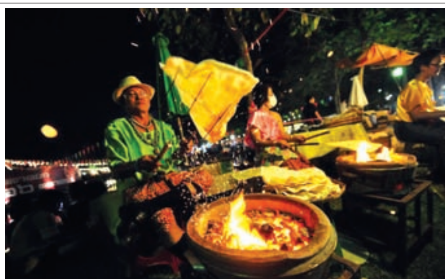
A man makes rice crackers during Thailand Tourism Festival 2015 at Lumpini Park in Bangkok, Thailand, on 15 Jan 2015. Thailand Tourism Festival 2015 was held here from 14 to 18 January. — XINHUA

Canadians are encouraged to report suspected violations of Canada’s anti-spam legislation to the Spam Reporting Centre. The information sent to the center is used by the CRTC, the Competition Bureau, and the Office of the Privacy Commissioner to enforce Canada’s anti-spam legislation.—Xinhua