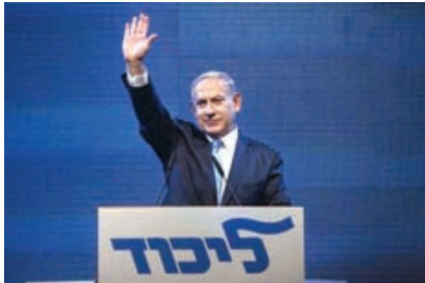
Israel's Prime Minister Benjamin Netanyahu waves after his speech during the launch of his Likud party election campaign in Tel Aviv on 5 Jan, 2015.

Polls forecast Kahlon's party winning between nine and 12 seats on 17 March, enough to put it in a kingmaker position to decide whether Netanyahu wins a fourth term against liberal Labour party leader Isaac Herzog.