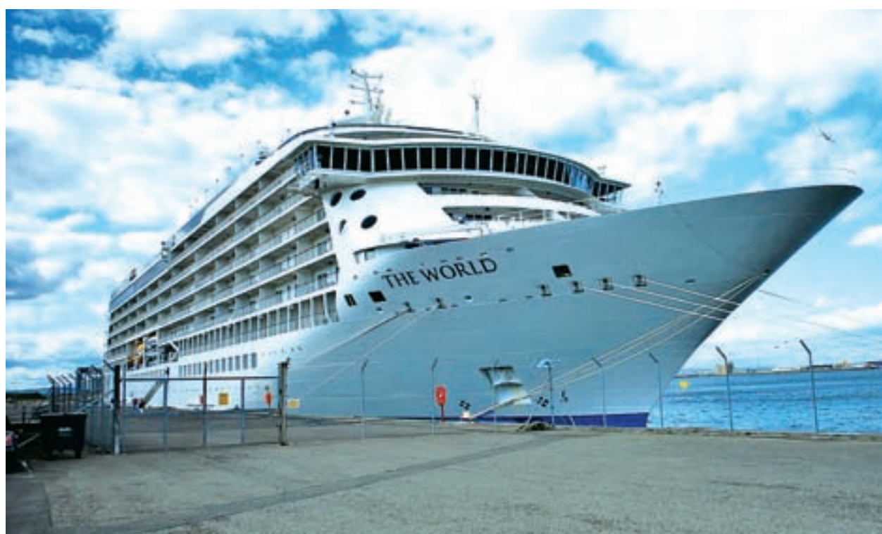
MS The World, cruise liner, arrives at Thilawa Port.