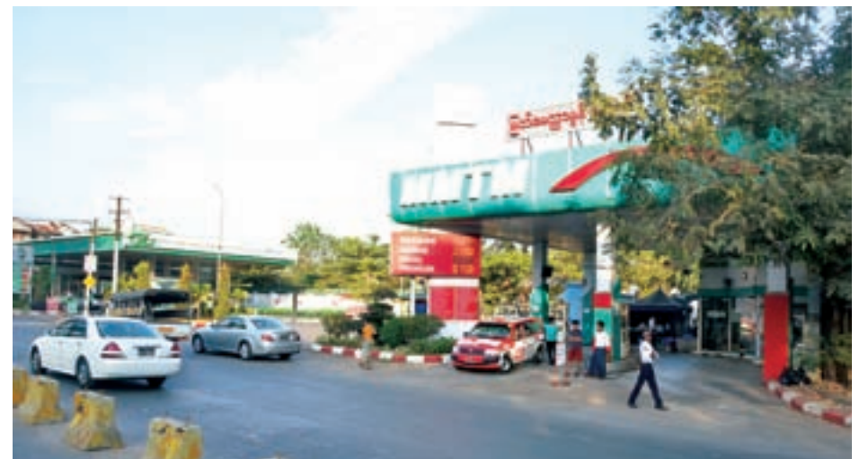
Myat Myitta Mon fuel station in Tamway Township.

Private fuel stations in Yangon reduced about K100 from the daily price