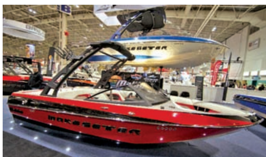
Visitors watch boats during the 57 th Toronto International Boat Show at Exhibition Place in Toronto, Canada on 15 Jan, 2015. As one of the largest annual consumer boat shows in North America, the nine-day event showcases hundreds of the newest models of boats and draws tens of thousands visitors from 10 to 18 January.