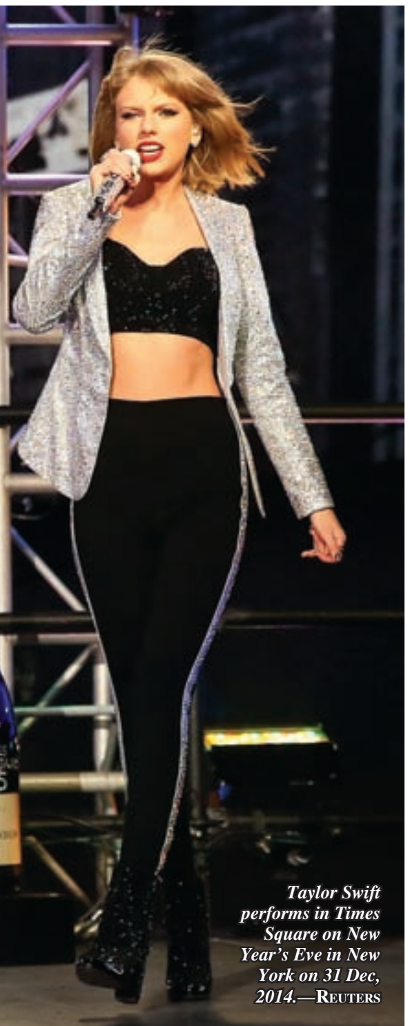
Taylor Swift performs in Times Square on New Year's Eve in New York on 31 Dec, 2014.

On the digital songs chart, which measures song downloads, Mark Ronson and Bruno Mars’ “Uptown Funk!” sold 340,000 units for the top spot two weeks running. Taylor’s “Blank Space” dropped to No 4 with 176,000 units.—Reuters