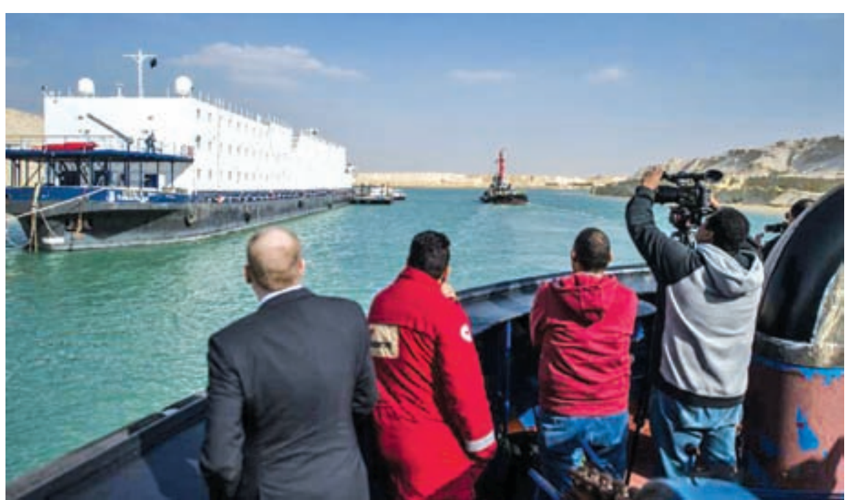
Journalists take video clips on a ship to the construction site of the New Suez Canal, in Ismailia, a city by the Suez Canal in Egypt on 14 Jan, 2015. Egypt launched the new waterway project in August 2014, and the construction was ordered by Egyptian President Abdel-Fattah al-Sisi to be completed in one year.