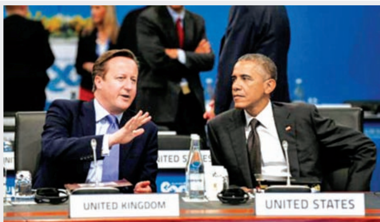
US President Barack Obama and British Prime Minister David Cameron (L) talk at the start of the plenary session at the G20 summit in Brisbane on 15 Nov, 2014.

“Whether we are facing lone fanatics or terrorist organizations such as al-Qaeda, Islamic State or Boko Haram, we will not be cowed by extremists.