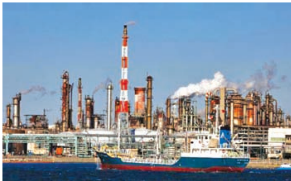
A ship passes a petro-industrial complex in Kawasaki near Tokyo on 18 Dec, 2014.

of floating storage would, in the near term, absorb barrels from the market in excess of physical demand, but noted that "those same barrels will eventually be delivered and could moderate a future price recovery".