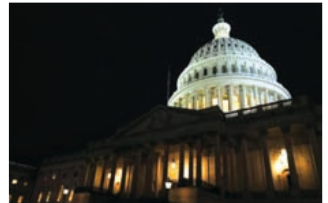
The US Capitol building is seen before US President Barack Obama delivers his State of the Union address in front of the US Congress, on Capitol Hill in Washington on 28 Jan, 2014.

The head of Britain’s MI5 Security Service has echoed that concern over lack of access to communications, warning last week that al-Qaeda militants in Syria were plotting attacks to inflict mass casualties in the West. Cameron has said if he is re-elected in a national vote in four months time, he will bring in new laws to give security and intelligence services greater powers to monitor Internet communications.—Reuters