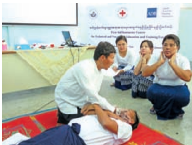
Trainees taking practice in first-aid course, organized by Myanmar Red Cross Society.

This course is the second in series of capacity building training which will enable the teachers assigned to the project to deliver competency-based modular short courses to