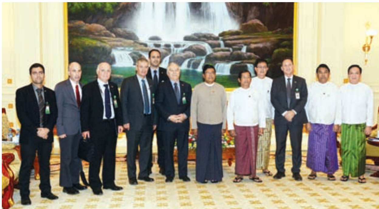
Vice President U Nyan Tun poses for documentary photo with Minister for Agriculture and Rural Development Mr Yair Shair of Israel and party.