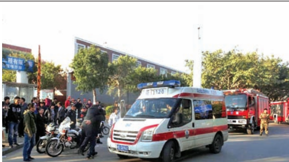
Rescuers work at the accident site after a bus caught fire in Xiamen City, southeast China's Fujian Province, on 15 Jan, 2015. A suspected arsonist has been caught after the bus fire. One passenger suffered burns while others were injured as the driver applied the emergency brake after the No 656 bus caught fire on Thursday morning on its regular route.

However, the report said, in Chinese mainland, the gradual shift to a consumption-based economy means that the huge growth in construction that has been witnessed over the last 10 years is unlikely to continue in the long term. Looking ahead, despite the changing nature of the economy, construction investment in China is likely to continue to diversify across both project types and geography, which will sustain relatively strong growth during 2015, according to the report. —Xinhua