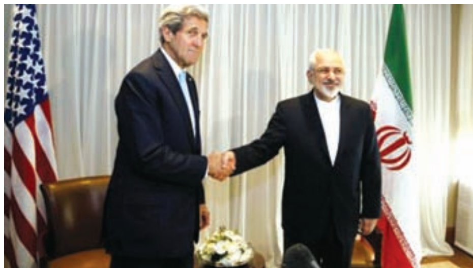
US Secretary of State John Kerry shakes hands with Iranian Foreign Minister Mohammad Javad Zarif before a meeting in Geneva on 14 Jan, 2015.

next round of talks tomorrow," a US State Department spokeswoman said.