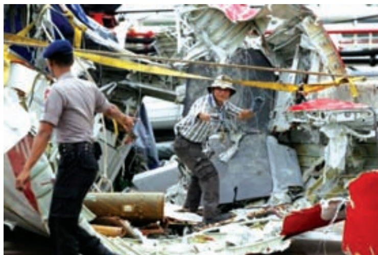
An Indonesian investigator from the National Transportation Safety Committee hands a cutting tool to a police officer while standing inside part of the tail of the AirAsia QZ8501 passenger plane in Kumai Port, near Pangkalan Bun, Central Kalimantan on 12 Jan, 2015.

PANGKALAN BUN, (Indonesia), 15 Jan — Indonesian navy divers searched for bodies on Thursday in the fuselage of an AirAsia airliner that crashed into the sea more than two weeks ago, killing all 162 people on board.