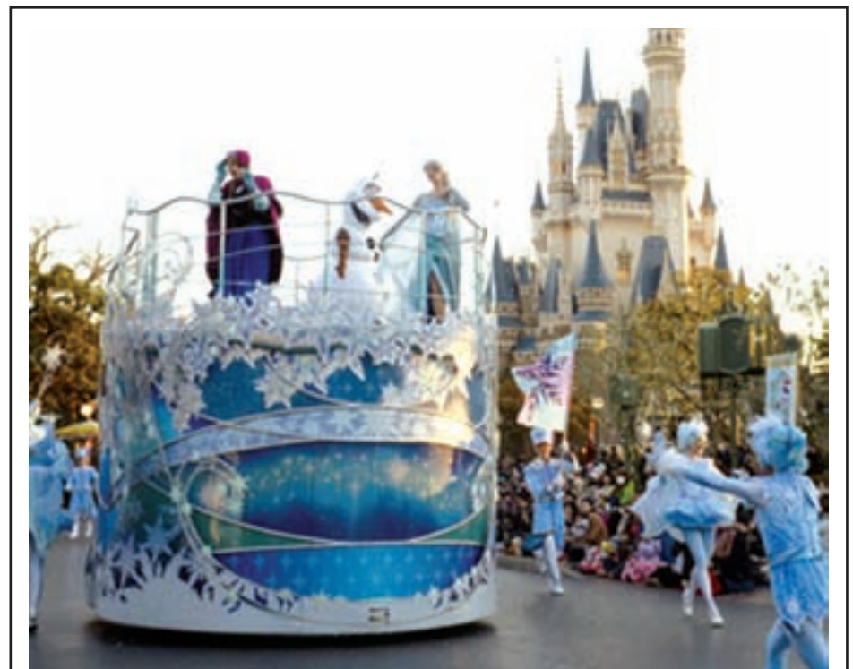
A parade featuring characters from Disney animation film "Frozen" is held at Tokyo Disneyland in Urayasu, Chiba Prefecture on 13 Jan, 2015, as a special winter event themed on the film started the same day.

pectedly returned to the Geneva lakeside hotel for a third meeting lasting some 90 minutes with Zarif after briefing senior US negotiators ahead of their technical-level talks scheduled for Thursday in the Swiss city. "Secretary Kerry and Foreign Minister Zarif reconvened this evening to continue discussion about the nuclear negotiations in advance of the start of the