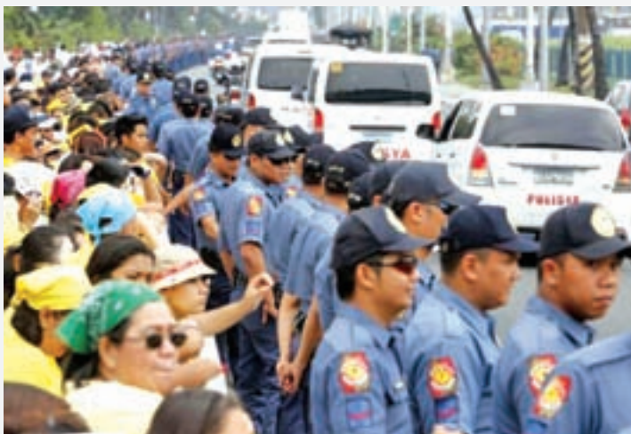
Members of the Philippine National Police (PNP) stand guard in front of well-wishers waiting along a main street for the arrival of Pope Francis in Manila on 15 Jan, 2015.

MANILA — Tens of thousands of people lined the streets of Manila on Thursday, cheering Pope Francis as he began his first visit to Asia's largest Catholic nation amid one of the biggest security operations in Philippine history.