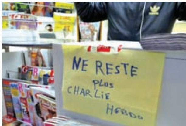
A handwritten sign at a newsstand, which reads “No more Charlie Hebdo”, is displayed after it sold out the limited stock of the satirical newspaper in Paris on 14 Jan, 2015.