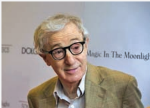
Director Woody Allen arrives for the premiere of his film ‘Magic in the Moonlight’ in New York on 17 July, 2014.

LOS ANGELES / SAN FRANCISCO, 15 Jan — Woody Allen will make his first foray onto the small screen, writing and directing an online series for Amazon.com, the latest coup by deep-pocketed cable and streaming companies in luring the biggest names in film to television.