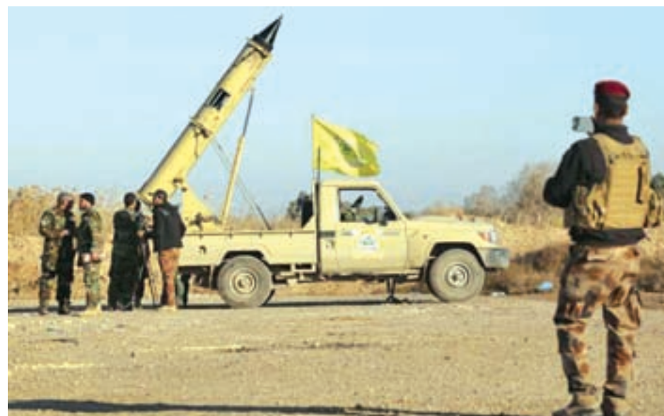
Iraqi Shi’ite fighters prepare to fire a weapon during fighting with Islamic State militants at Al-Nibai, north of Baghdad on 12 Jan, 2015. Picture taken on 12 Jan, 2015.