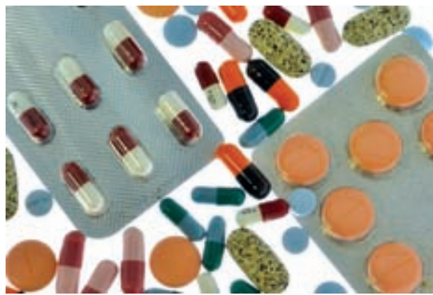
Pharmaceutical tablets and capsules in foil strips are arranged on a table in this picture illustration taken in Ljubljana on 18 Sept, 2013.

SAN FRANCISCO, 15 Jan — The world's biggest drugmakers face a new reality when it comes to US pricing for their products as insurers use aggressive tactics to extract steep