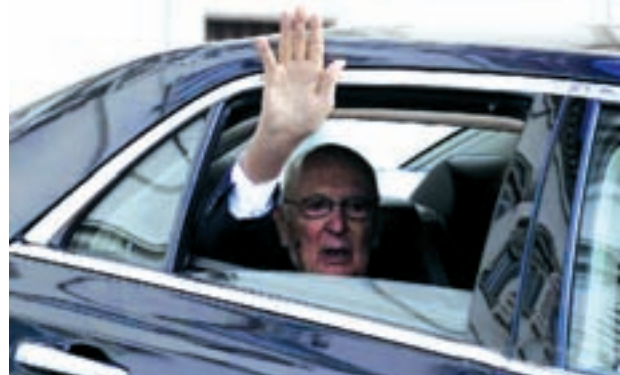
Italian President Giorgio Napolitano waves to people when leaving the Quirinale palace in Rome, Italy, on 14 Jan, 2015. Italian President Giorgio Napolitano resigned on Wednesday after almost nine years at the helm of the country and before the natural end of his second tenure.

Respected figures such as conductor Riccardo Muti or Mario Draghi, the current head of the European Central Bank (ECB), have also emerged as possible presidents. Local experts, however, say no real guessing is possible for a vote which has always been characterized by a high grade of unpredictability. Many believe the next president will be a compromise, balanced candidate.