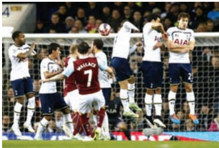
Burnley's Ross Wallace scores a goal from a free kick during their FA Cup third round replay soccer match against the Tottenham Hotspur at White Hart Lane in London on 14 Jan, 2015.

LONDON, 15 Jan — Tottenham Hotspur stormed back from 2-0 down to beat Burnley 4-2 in their FA Cup third-round replay on Wednesday despite resting their top striker in the once-fabled competition.