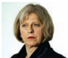
Britain’s Home Secretary Theresa May listens during a news conference in central London on 5 Jan, 2015.

“Every day that passes without the proposals in the communications data bill, the capabilities of the people who keep us safe diminishes and ... more people find themselves in danger and yes crimes will go un-