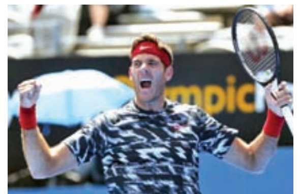
Argentina's Juan Martin Del Potro

"Now I just turn my focus onto the Australian Open and doing what I can in the next couple of days to prepare best for that." —Reuters