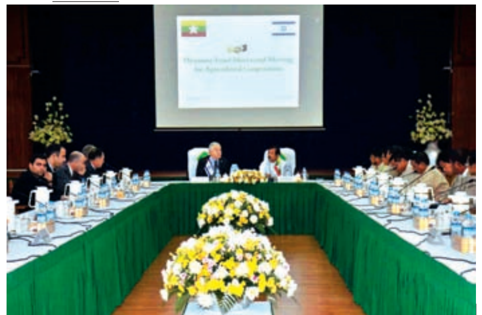
Union Minister U Myint Hlaing meets Israeli Minister for Agriculture and Rural Development Mr Yair Shair.—MNA