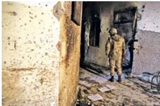
An army soldier stands in the Army Public School, which was attacked by Taleban gunmen, in Peshawar, on 17 Dec, 2014.

WASHINGTON, 14 Jan — The United States on Tuesday declared Pakistani Taleban leader Mullah Fazlullah a “global terrorist,” making it a crime to engage in transactions with the man behind the 16 December attack in which 134 children at a Peshawar