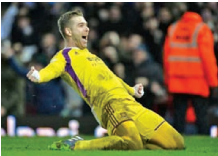
West Ham United's goalkeeper Adrian celebrates after scoring the winning penalty in a shoot out against Everton during their FA Cup third round replay soccer match at Upton Park in London on 13 Jan, 2015.

LONDON, 14 Jan — West Ham United goalkeeper Adrian converted the decisive spot-kick in a penalty shootout against 10-man Everton to send the Londoners into the FA Cup fourth round