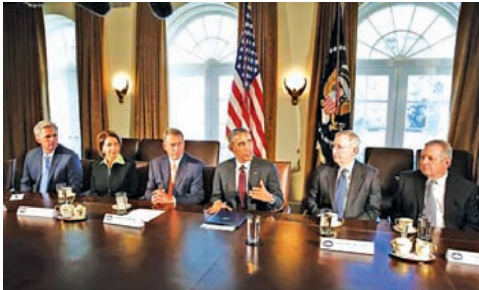
US President Barack Obama hosts a bipartisan meeting of Congressional leaders in the Cabinet Room of the White House in Washington on 13 Jan, 2015. Pictured (L to R) are House Majority Leader Kevin McCarthy, House Minority Leader Nancy Pelosi, Speaker of the House John Boehner, Obama, Senate Majority Leader Mitch McConnell, and Senate Minority Whip Dick Durbin.

“The president committed to working with members of both parties on text for an AUMF (authorization of military force)