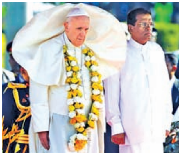
A gust of wind blows the mantle of Pope Francis (L) as he stands next to Sri Lanka's newly elected president Mithripala Sirisena at the Colombo airport on 13 Jan, 2015.

“The process of healing also needs to include