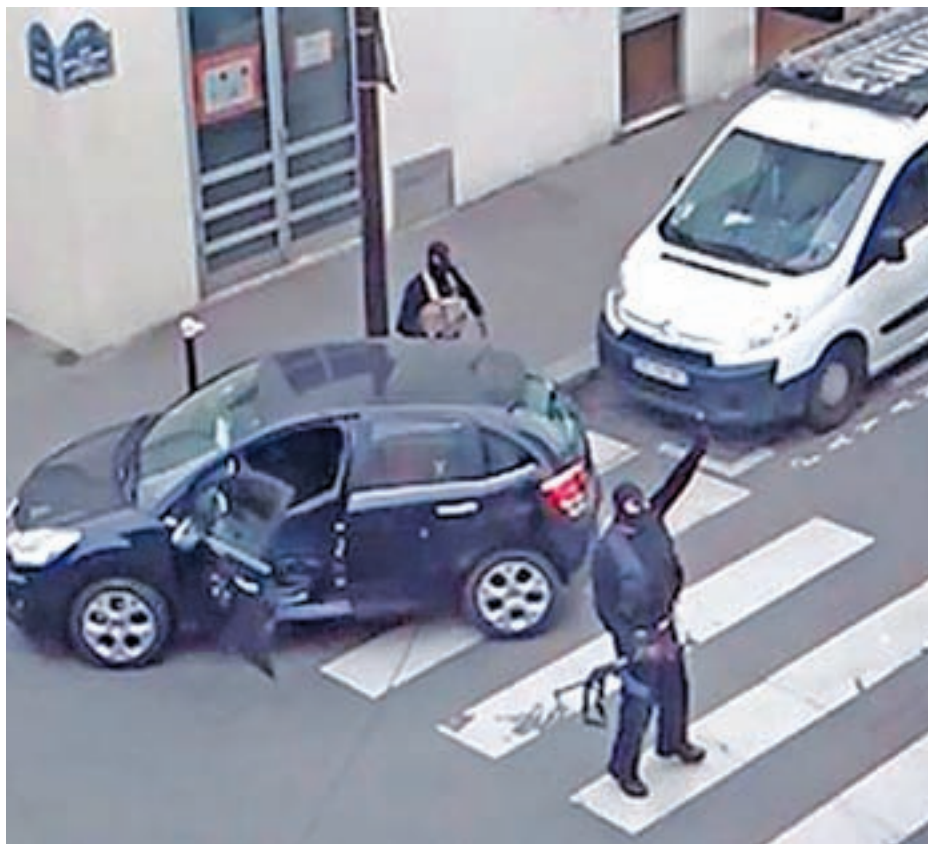
Gunmen gesture as they return to their car after the attack outside the offices of French satirical weekly newspaper Charlie Hebdo (seen at rear) in this still image taken from amateur video shot in Paris on 7 Jan, 2015.

The first edition of Charlie Hebdo published after last week’s attacks sold out within minutes at newspaper kiosks around France on Wednesday, with people queuing up to buy copies to support the satirical weekly.—Reuters