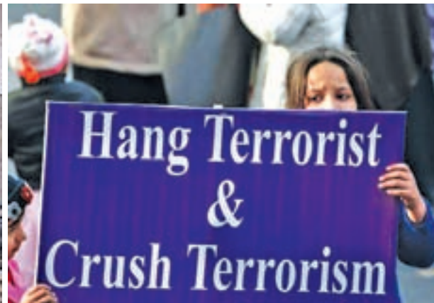
A child supporter of political party Pakistan Awami Tehreek (PAT), hold sign with others to condemn the attack by Taleban gunmen on the Army Public School in Peshawar, during a rally in Lahore on 21 Dec, 2014.

ban claimed responsibility for the school attack that resulted in the deaths of “at least 148 individuals, mostly students,” the department said.