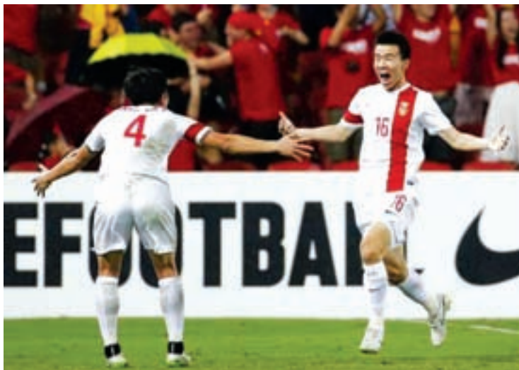
China's Sun Ke celebrates his goal with team mate Jiang Zhipeng (L) during their Asian Cup Group B soccer match against Uzbekistan at the Brisbane Stadium in Brisbane on 14 Jan, 2015.

Someone said the extra competition for a place in the forward line was positive and he was confident Torres would make a useful contribution.—Reuters