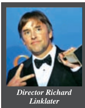
Director Richard Linklater

Rounding out the list of five were first-time DGA nominees Morten Tyldum for “The Imitation Game” and Wes Anderson