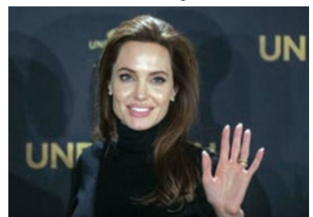
Director Angelina Jolie arrives to promote her film “Unbroken” in Berlin on 27 Nov, 2014.