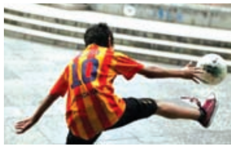
A boy plays soccer on a street in Porto Alegre on 16 June, 2014.