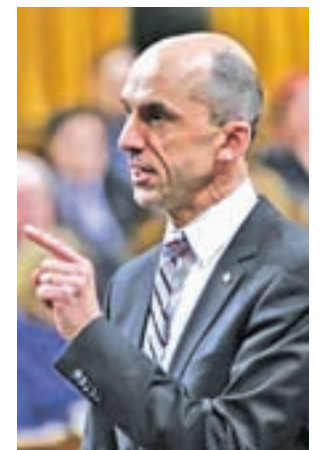
Canada’s Public Safety Minister Steven Blaney

“The Five Eyes regularly meet to discuss shared concerns and approaches,” he said. The official, who spoke on the condition of anonymity, added that the fight against terrorism would be “a major focus”