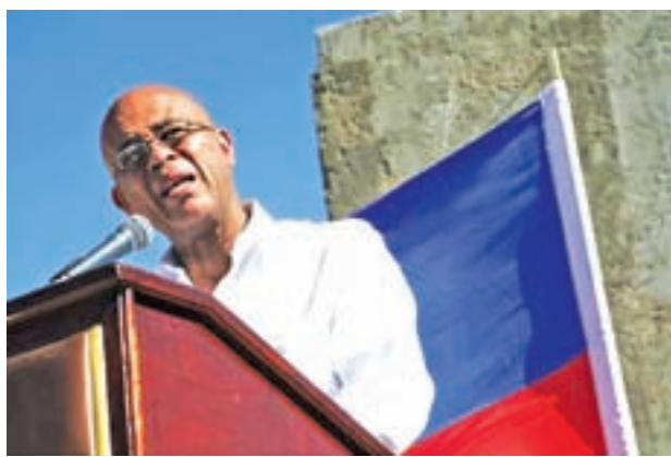
Haiti's President Michel Martelly addresses the audience during a memorial held for the victims of the 2010 earthquake in Titanyen, on the outskirts of Port-au-Prince on 12 Jan, 2015.

On Tuesday, the United Nations "Core Group," which includes countries working closely with Haiti, such as the United States, Brazil, Canada, and the