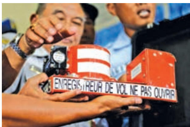
Indonesian soldiers hold the cockpit voice recorder of AirAsia QZ8501 at Iskandar Airbase in Pangkalan Bun, Central Kalimantan on 13 Jan, 2015.

The so-called black boxes — which are actually orange — contain a wealth of data that will be crucial for investigators piecing together the sequence of