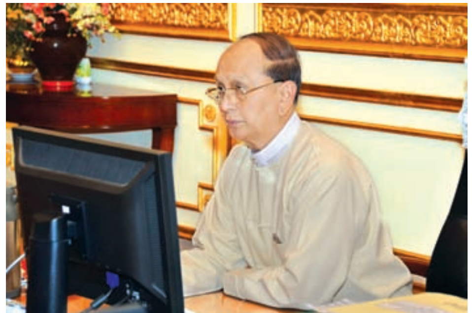
President U Thein Sein delivers speech at Meeting (1/2015) of Financial Commission.

Then, the president pointed out that in the management of public finance, more measures are being taken year by year for budget transparency and communicating the budget