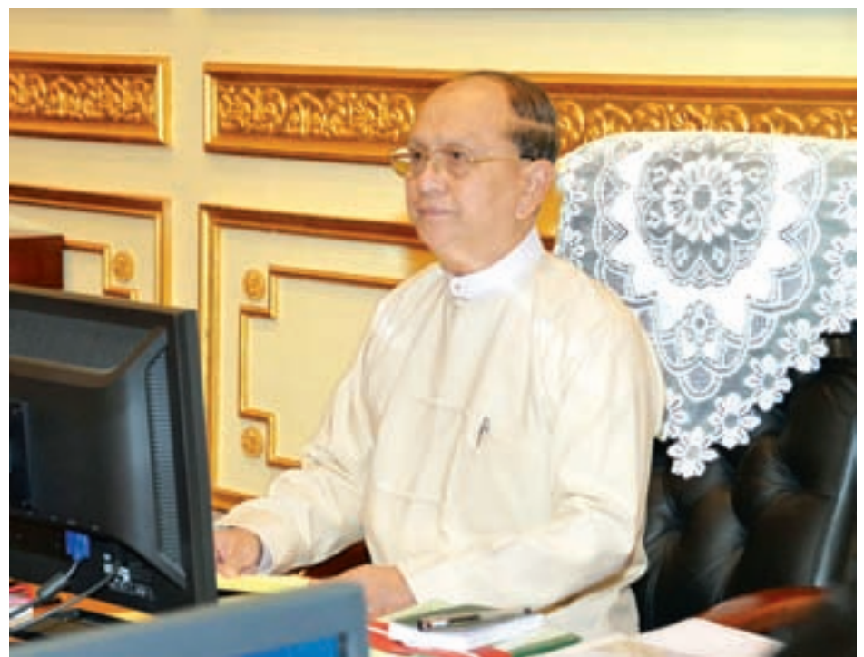
President U Thein Sein highlights project implementation at National Planning Bill for 2015-2016 fiscal year.

President continued there are still some challenges to overcome while many achievements have been gained in politics, economy and social issues,