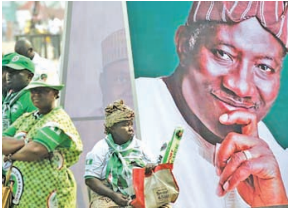
A woman sits beside an electoral poster of Nigeria’s President Goodluck Jonathan during the flag-off for his campaign for a second term in office, in Lagos on 8 Jan, 2015.

WASHINGTON, 14 Jan — Nigeria’s election next month is a factor behind the sharp increase in attacks by Boko Haram Islamist militants in the north of the country, the US State Department said on Tuesday.