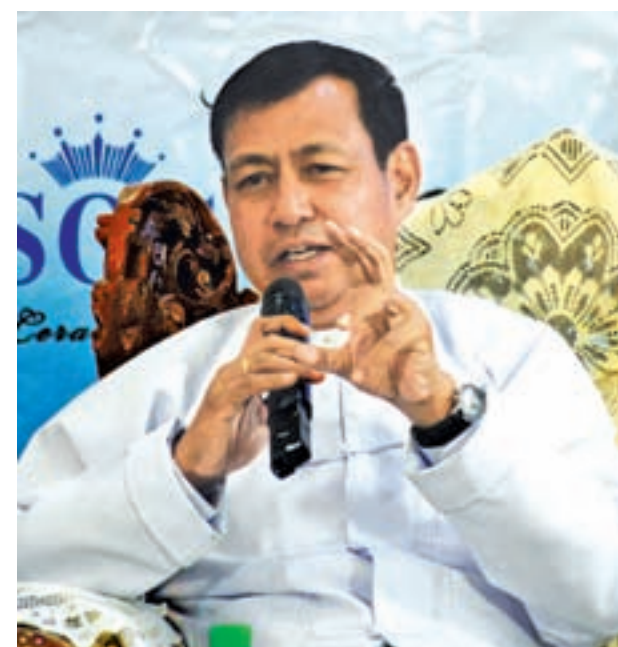
U Ye Htut, Union Minister for Information, participates in debate.