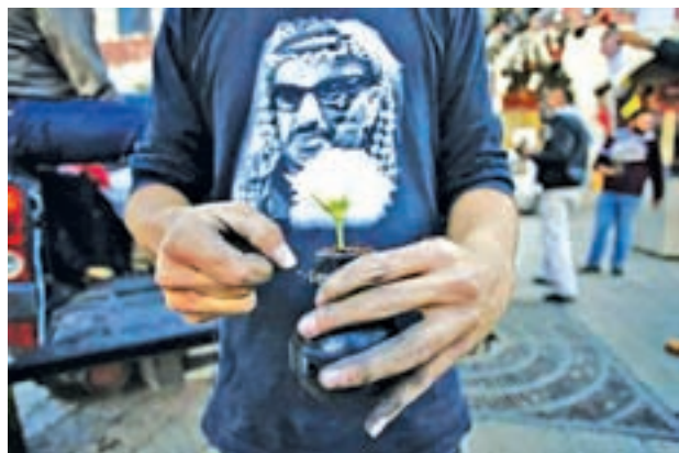
A Palestinian man wearing a T-shirt with the picture of late Palestinian leader Yasser Arafat holds a flower planted in a spent tear gas canister that he said was fired by Israeli troops during clashes with Palestinian protesters, at Manger Square, ahead of Christmas, in the West Bank city of Bethlehem on 23 Dec, 2014.

NEW YORK, 14 Jan — A US trial to decide the liability of the Palestine Liberation Organization and Palestinian Authority for several attacks in Israel began on Tuesday, as a lawyer for victims called the defendants’ alleged involvement “standard operating procedure” and a defense lawyer blamed others for the “horrific” violence.