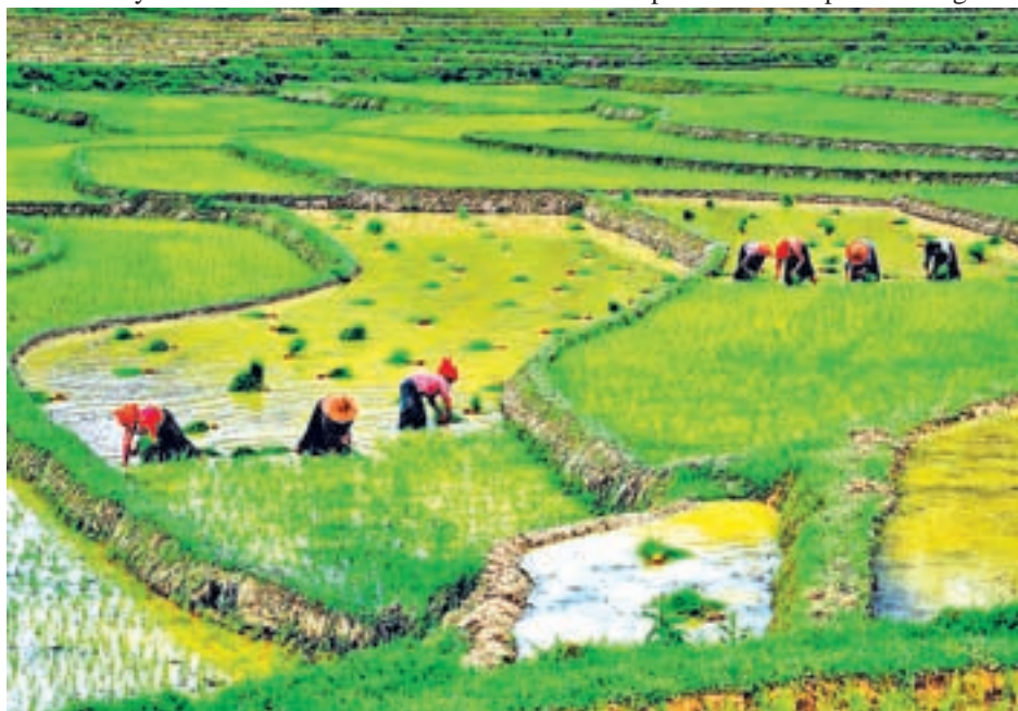
The second volume of OECD Multi-dimensional Review of Myanmar released in Yangon on Wednesday says the country's agriculture sector has the potential to become a major agri-food produce and trade hub in the region if it can increase its productivity and modernize.