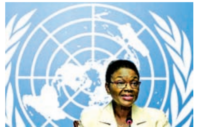
United Nations Under-Secretary-General for Humanitarian Affairs and Emergency Relief Coordinator Valerie Amos holds a news conference to launch of the Global Humanitarian appeal for 2015 at the United Nations European headquarters in Geneva on 8 Dec, 2014.

UNITED NATIONS, 14 Jan— UN aid chief Valerie Amos on Tuesday suggested more intervention in humanitarian emergencies as she said some states were aggressively asserting sovereignty rights to stop action being taken to protect civilians.