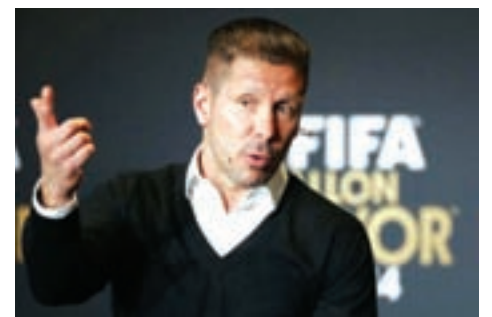
Atletico Madrid's Diego Simeone from Argentina, one of three nominees for 2014 FIFA World Coach of the Year, attends a news conference prior to the Ballon d'Or awards ceremony in Zurich on 12 Jan, 2015.

Simeone has done a fine rebuilding job following the departure of key performers like top scorer Diego Costa and goalkeeper