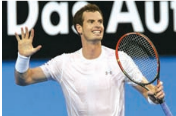
Andy Murray of Britain reacts after losing a point during his men's singles tennis match against Benoit Paire of France at the 2015 Hopman Cup in Perth on 5 Jan, 2015.

LONDON, 13 Jan — Andy Murray will warm up for this year's Wimbledon by playing in the Aegon Cham-