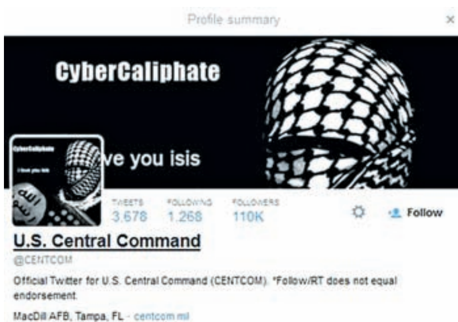
A computer screenshot shows the US Central Command Twitter feed after it was apparently hacked by people claiming to be Islamic State sympathizers on 12 Jan, 2015.