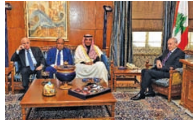
Kuwaiti Vice Premier and Foreign Minister Sabah al-Khaled al-Hamad as-Sabah (2nd R) meets with Lebanon’s parliament speaker Nabih Berri (1st R) in Beirut, Lebanon, on 22 Dec, 2014. An Arab delegation headed by Kuwaiti Vice Premier and Foreign Minister Sabah al-Khaled al-Hamad as-Sabah vowed Monday to help Lebanon with its Syrian refugee and security problems.

Bassil said that “the meeting was an opportu-