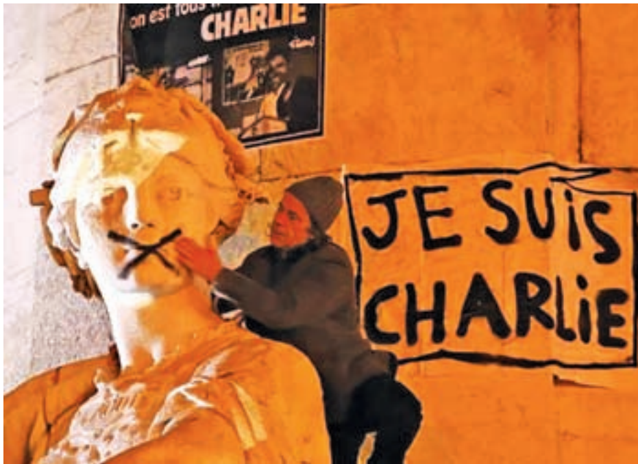
A man touches the spray-painted shut mouth of a statue near a poster reading “I am Charlie” as he takes part in a solidarity march (Marche Republicaine) in the streets of Paris on 11 Jan, 2015.

Seventeen people, including journalists and police, were killed in three days of violence that began on 7 January when militants burst into Charlie Hebdo 's office during a regular editorial meeting and shot dead five of its leading cartoonists. Liberation newspaper, now temporarily housing Charlie Hebdo operations, revealed the front page of the 14 January edition via Twitter late on Monday — an image of the Prophet Mohammad