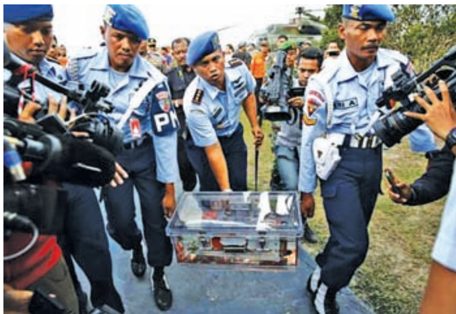
Military policemen carry the flight data recorder of AirAsia QZ8501 at the airbase in Pangkalan Bun, Central Kalimantan on 12 Jan, 2015.

The AirAsia group's first fatal accident took place more than two weeks ago, but wind, high waves and strong currents have