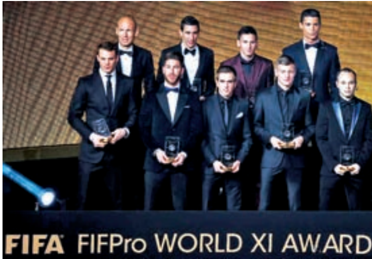
FIFA FIFPro WORLD XI AWARD Winners of the FIFA FIFPro WORLD XI Award of the year 2014: Manuel Neuer, Sergio Ramos, Philipp Lahm, Toni Kroos and Andres Iniesta (first row L to R), Arjen Robben, Angel Di Maria, Lionel Messi and Cristiano Ronaldo (back row L to R), pose with their trophies during the FIFA Ballon d'Or award ceremony at the Kongresshaus in Zurich, Switzerland on 12 Jan, 2015.

BERNE, 13 Jan — Cristiano Ronaldo won the FIFA Ballon d'Or award for the second year running and the third overall on Monday and said he wanted to become "one of the greatest players of all time." The Real Madrid forward polled more than double the number of votes as his bitter rival Lionel Messi who only just edged Bayern Munich and Germany goalkeeper Manuel Neuer into third place. Joachim Loew won the Coach of the Year of the award after leading Germany to the World Cup title in Brazil, finishing ahead of Real Madrid's Carlo Ancelotti and Atletico Madrid's Diego Simeone in the poll.