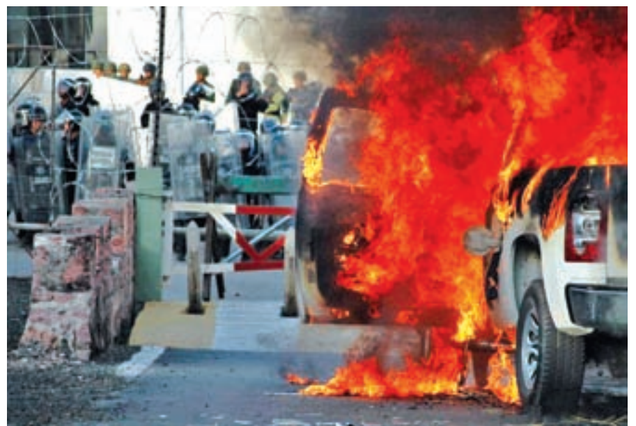
Flames emanate from a vehicle during a protest in front of the 35 th Military Zone in Chilpancingo, capital of Guerrero State, Mexico, on 12 Jan, 2015. According to local press, the parents of missing students, with support of the members of the State Coordinator of Education Workers of Guerrero (CETEG in Spanish), burnt an official vehicle in front of the main door of the 50 th Infantry Battalion of the 35 th Military Zone, demanding the presentation of results in the search for 43 missing students abducted in Guerrero State in September 2014.