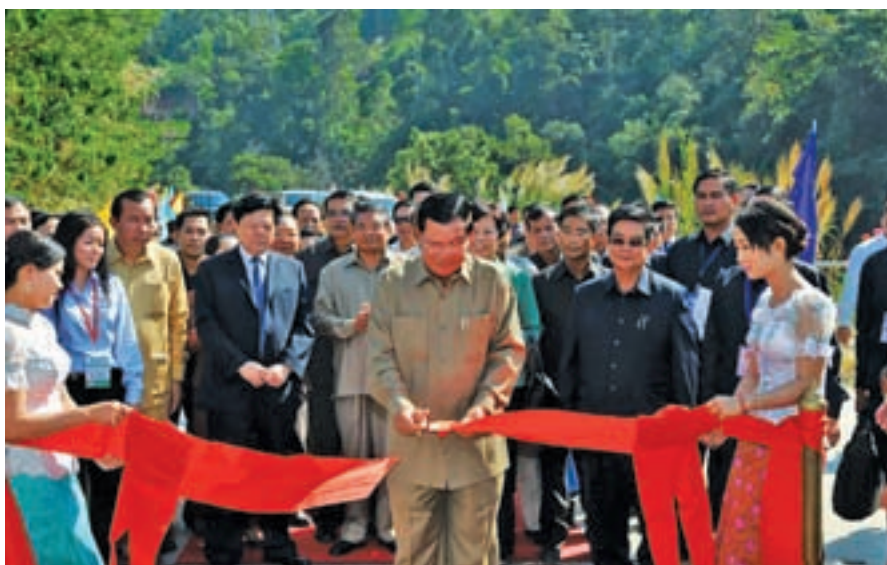
Cambodian Prime Minister Hun Sen (C, front) cuts the ribbon to inaugurate the Chinese-built 338-megawatt Russei Chrum Krom River hydropower dam in Koh Kong Province, Cambodia, on 12 Jan, 2015. The hydroelectric dam, Cambodia's largest hydropower station so far, commenced operation on Monday after it had been constructed for nearly five years.