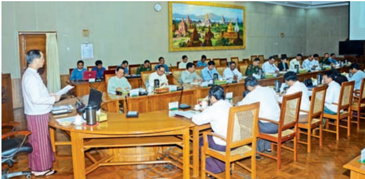
Vice President Dr Sai Mauk Kham delivers speech at coordination meeting of Central Committee for Organizing 68 th Anniversary Union Day.

Committees and subcommittees briefed the vice president on their preparatory measures for the successful celebration of the Union Day.