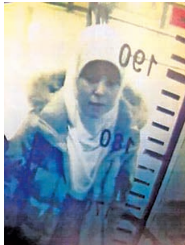
Hayat Boumeddiene, the suspected female accomplice of Islamist militants behind attacks in Paris, is seen upon her arrival to Turkey in this still image taken from surveillance video at Sabiha Gokcen airport in Istanbul on 2 Jan, 2015.—REUTERS

“Is it Turkey’s fault that it has borders with Syria?” Davutoglu said, adding Turkey has kept its 900-km-long border with Syria open to allow in more than 1.6 million refugees since the conflict there began in 2011. —Reuters