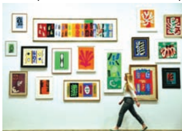
An employee poses with paper cut outs from the "Henri Matisse: The Cut-Outs" exhibition at the Tate Modern gallery in London, in this file photo taken on 14 April, 2014.

The 80-minute film, directed by Grabsky, includes a tour of the exhibition, biographical information, commentary and interviews