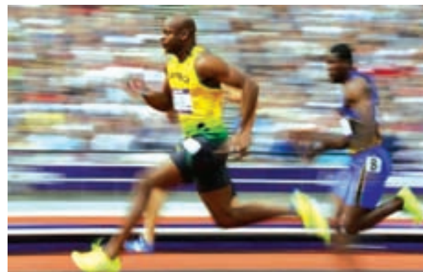
Asafa Powell of Jamaica runs on his way to winning his 100m heat round 1 during the London 2012 Olympic Games at the Olympic Stadium on 4 Aug, 2012.

"The main focus is the trials first because that is like a world championships by itself and then the world championships in China," said Powell, in reference to