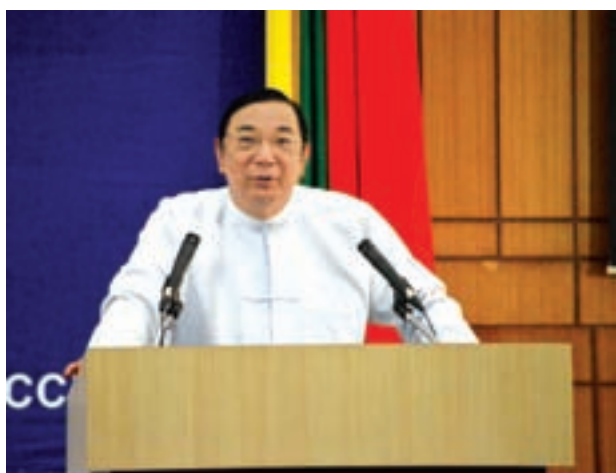
Deputy Finance Minister Dr Maung Maung Thein is pictured at talks to raise public awareness of a stock market in Myanmar on Saturday. The Yangon Stock Exchange is set to open in late 2015.

"Nowadays, a majority of students come to choose this field as they can find more job opportunities (See page 2)