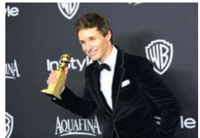
Actor Eddie Redmayne poses with his award for Best Performance by an Actor in a Motion Picture - Drama for 'The Theory of Everything' at the 16th annual InStyle and Warner Bros. party after the 72 nd annual Golden Globe Awards in Beverly Hills, California on 11 Jan, 2015.