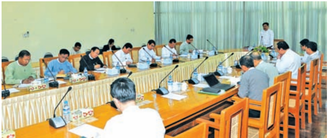
Union Minister U Soe Thane highlights plan of Myanmar to join Open Government Partnership.—MNA