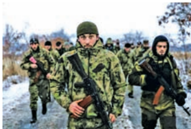
Separatists from the Chechen “Death” battalion walk during a training exercise in the territory controlled by the self-proclaimed Donetsk People's Republic, eastern Ukraine, on 18 Dec, 2014.