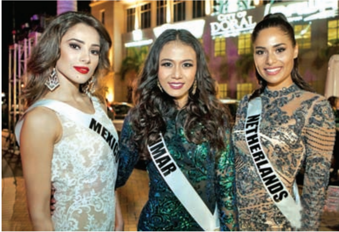
Miss Universe contestants arrive in Miami, the major city in south-eastern Florida, in the United States. The 63 th Miss Universe contest will be held in the city on 25 Jan, 2015.