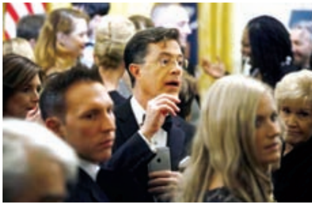
Comedian Stephen Colbert (C) attends a reception for 2014 Kennedy Centre honorees at the White House in Washington on 7 Dec, 2014.

"I have nine months to make a show, just like a baby. So first, I should find out how you make a baby," Colbert said in a statement.