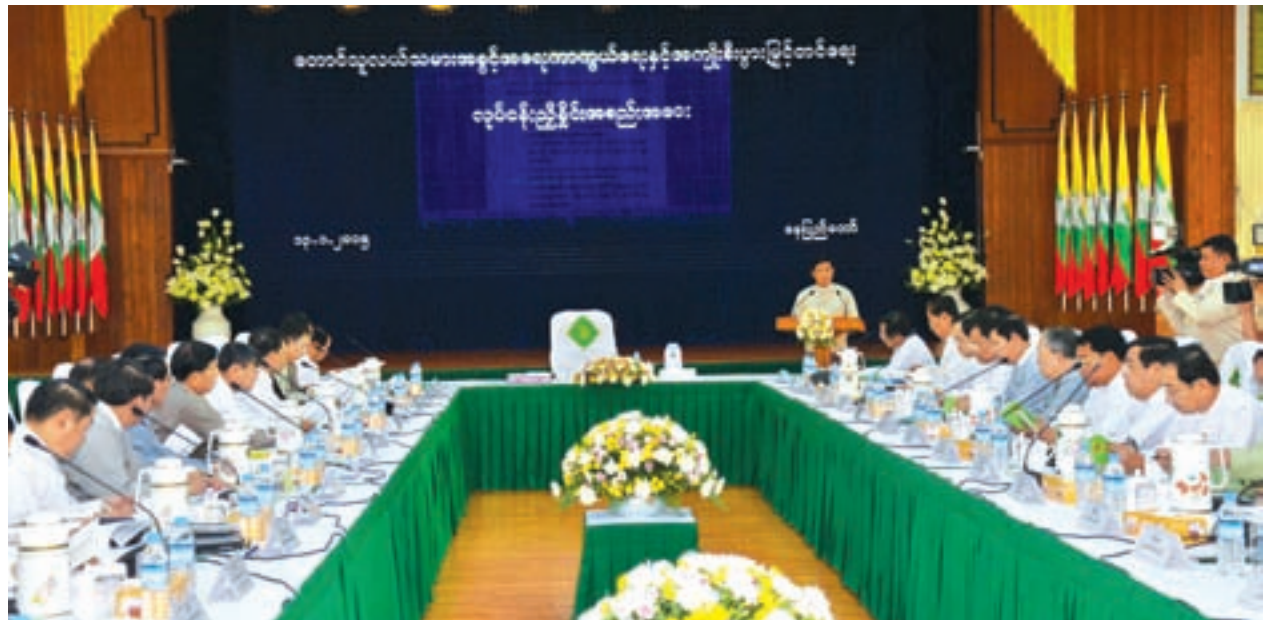
Vice President U Nyan Tun highlights protection of rights of farmers and promote their interests.

According to the vice president, the law was written with the participation of agriculturalists, legal