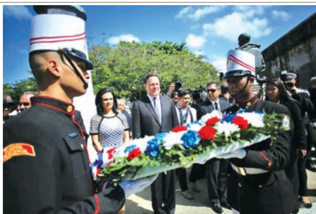
Panama's President Juan Carlos Varela (C) presents a wreath during a rally in memory of the 17 persons that were killed during the three days of attack in France, in Panama City, capital of Panama, on 12 Jan, 2015.