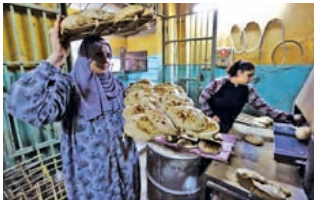
A woman carries bread at a bakery in Cairo, on 8 Jan, 2015.

Those who arrive at the bakery early sometimes buy extra bread to feed to their livestock. Meanwhile, those who arrive too late can get nothing. And bakers are widely accused of siphoning off flour to sell on the black market, profiting while run-