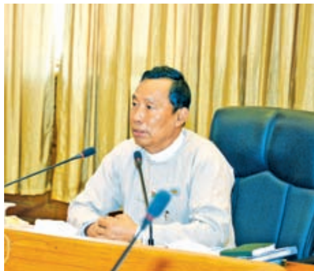
Speaker Thura U Shwe Mann discusses national unity, reconciliation and peace-making process.