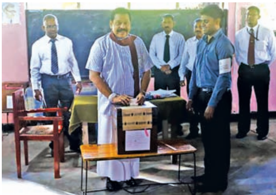
Sri Lanka's President Mahinda Rajapaksa casts his vote for the presidential election, in Medamulana, on 8 Jan, 2015.

Although his popularity has waned, Rajapaksa called the election two years early, confident that