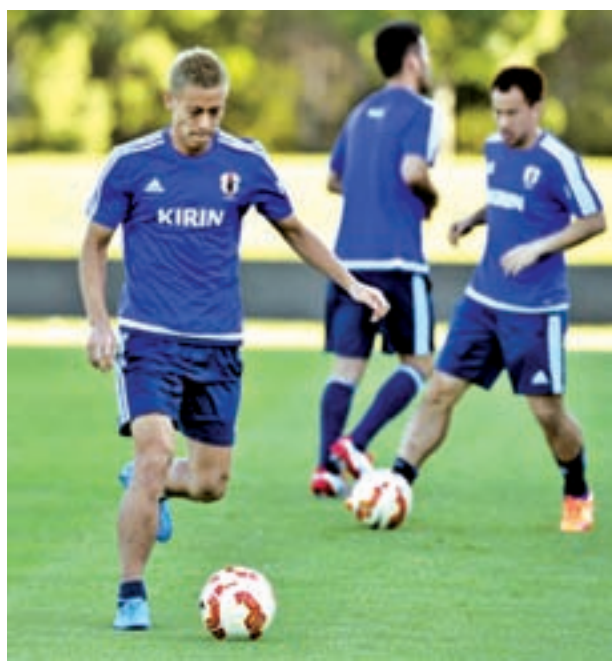
AC Milan's midfielder Keisuke Honda plays during the first training session of the Blue Samurai in Cessnock, Australia, on 3 Jan, 2015, ahead of the Asian Cup. Japan seeks a record fifth Asian Cup.