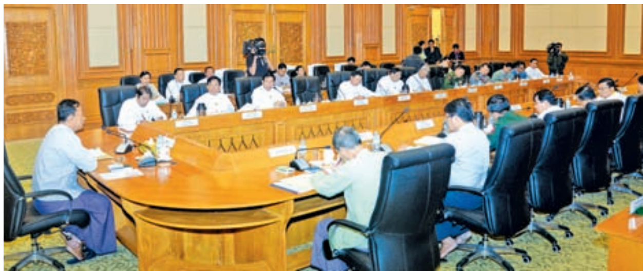
Speaker Thura U Shwe Mann discusses functions for 12 th regular session of the Pyidaungsu Hluttaw and duty of MPs to scrutinize bills.

NAY PYI TAW, 8 Jan — The union government will submit the national planning bill for 2015-16 fiscal year,