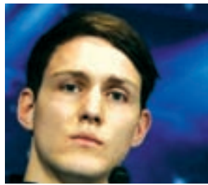
Bayer Leverkusen's Philipp Wollscheid addresses a news conference at the Parc des Princes stadium in Paris on 11 March, 2014.