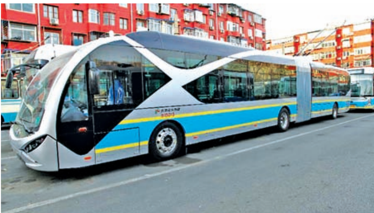
Photo taken on 7 Jan, 2015 shows a brand-new electric bus, 18 metres in length, at the Fuchengmen Outer street bus terminal in Beijing, capital of China. This batch of electric buses will put into operation recently.

The fatality died in the hospital inside the NBP while being treated. Investigation has been ongoing into the incident. Officers of NBP have been under fire after authorities conducted raids last month following reports that convicted drug lords still managed to continue with their illegal drug trade even under custody.—Xinhua