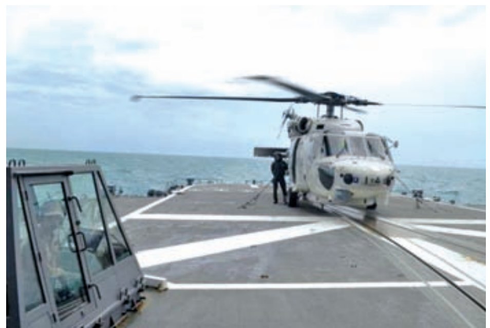
The Japanese Navy Sea Hawk helicopter sits on the deck of the Navy ship Ohnami as it searches for victims and debris of AirAsia QZ8501 in the Karimata Strait, south of Pangkalan Bun, Central Kalimantan on 7 Jan, 2015.