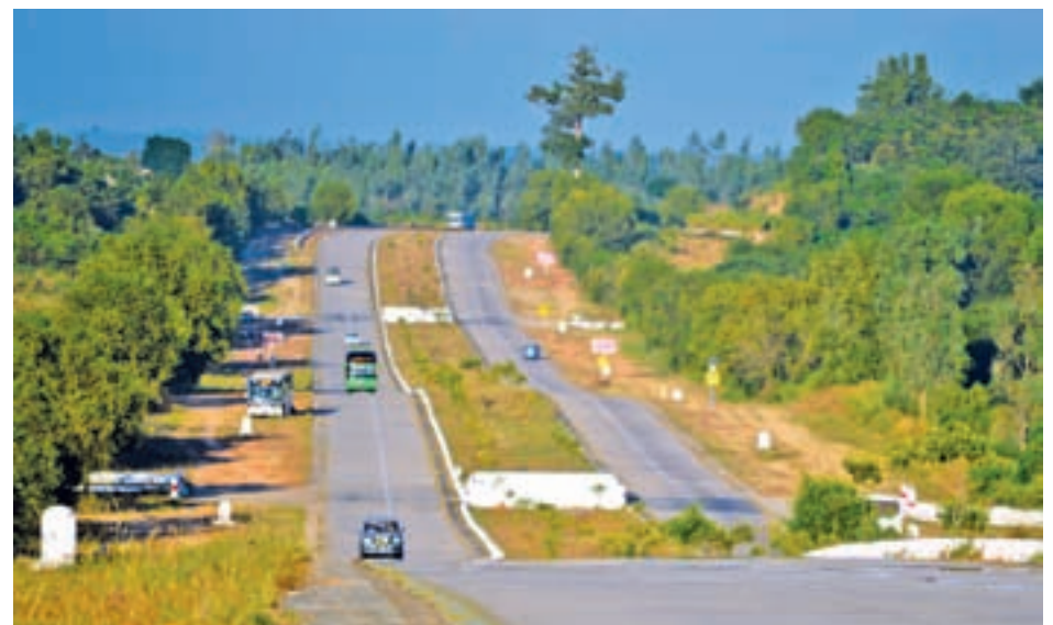
A road section of the Yangon-Nay Pyi Taw-Mandalay expressway that is planned to be upgraded with local and foreign investments.

As of Monday, EOI forms are available for interested international and local companies until next Friday, the ministry said, adding that the deadline (See page 2)