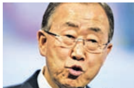
United Nations Secretary-General Ban Ki-moon

it does not believe Palestine is a sovereign state and therefore does not qualify to be part of the International Criminal Court.