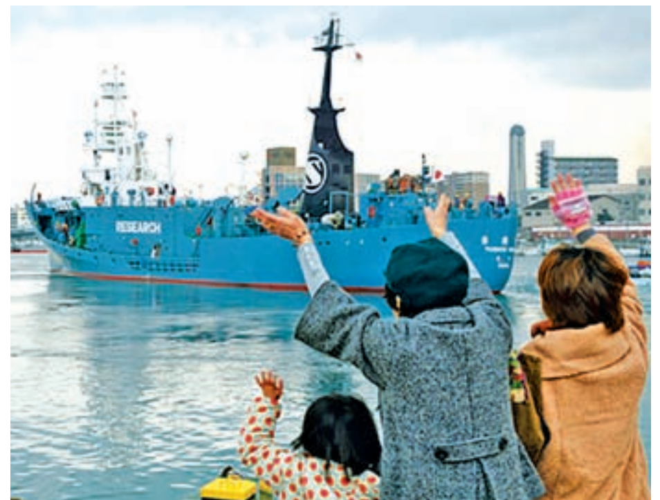
The Yushin Maru, a ship of Japan's Fisheries Agency, departs from the western Japanese port of Shimonoseki on 8 Jan, 2015, while it is seen off by relatives of crew members. The ship, leaving for the Antarctic Ocean, is to conduct a survey of whale stocks in place of an annual whaling mission that the International Court of Justice ordered the country to stop in 2014.