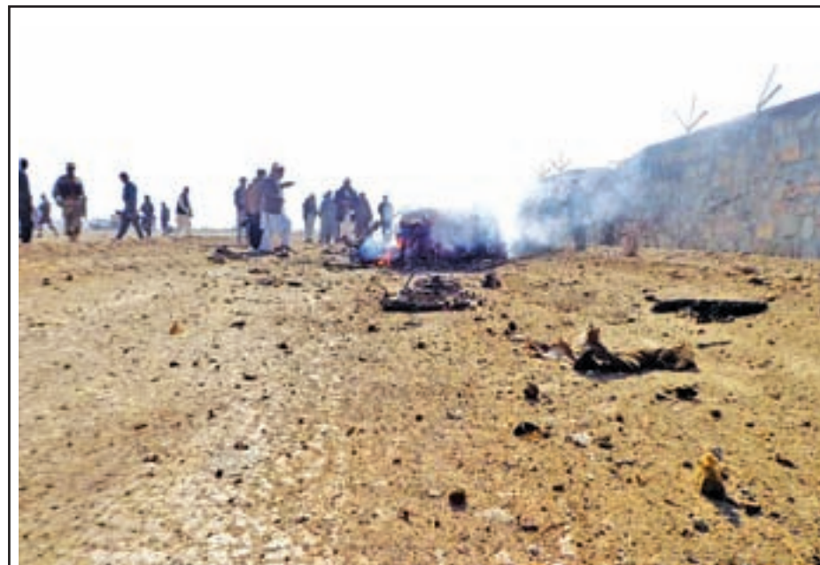
Afghan security forces inspect the site of an attack by Taliban militants in Khost Province in eastern Afghanistan, on 7 Jan, 2015. A group of suicide bombers stormed a police academy in Khost's provincial capital the Khost City on Wednesday. Four persons including three militants and a judge have been killed and five others including three police and two children sustained injuries, officials confirmed. — XINHUA

The PKK is designated a terrorist group by Ankara, the United States and European Union.—Reuters