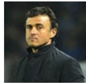
Barcelona's coach Luis Enrique