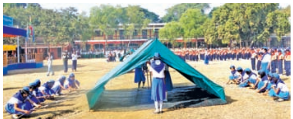
Girl guides participate in building of tent.