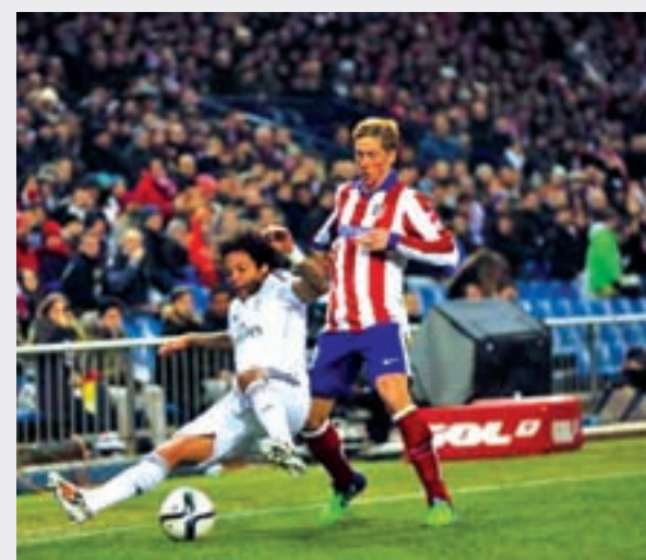
Atletico Madrid's Fernando Torres (R) and Real Madrid's Marcelo fight for the ball during their Spanish King's Cup soccer match at Vicente Calderon stadium in Madrid on 7 Jan, 2015.

Gareth Bale found the back of the net for Real with a header from a free kick after 12 minutes but was flagged offside. Atletico mainly played on the break and Antoine