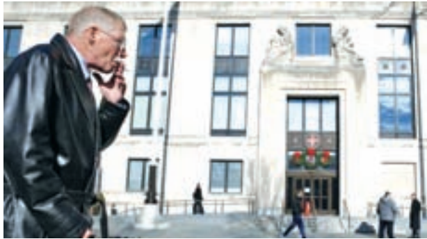
A cigarette smoker stands in the designated smoking area from the National Headquarters of the American Red Cross in Washington, on 30 Dec 30, 2014.

NEW YORK, 8 Jan — The American Red Cross risks damaging the reputation of the global Red Cross brand because of its refusal to stop accepting donations from tobacco companies, a top official with the humanitarian network said. These concerns are prompting the International Red Cross and public health organizations to press the US group to end its longtime policy of taking tobacco money, Reuters has learned. The International Red