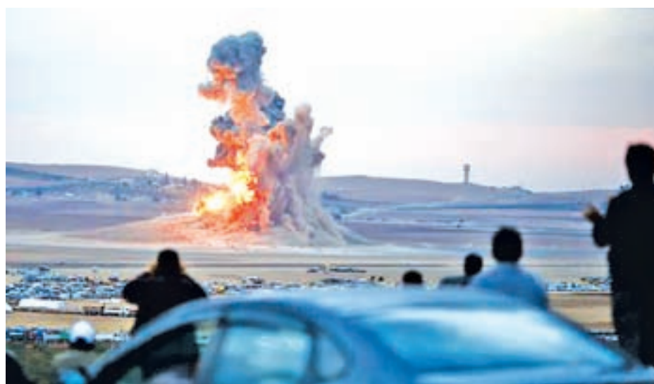
Smoke and flames rise over a hill near the Syrian town of Kobani after an airstrike, as seen from the Mursitpinar crossing on the Turkish-Syrian border in the southeastern town of Suruc in Sanliurfa Province, on 23 Oct, 2014.

Countries whose forces have participated in the strikes in Iraq are: Australia,