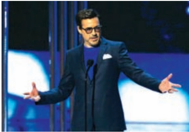
Robert Downey Jr accepts the award for favourite movie actor during the 2015 People's Choice Awards in Los Angeles, California on 7 Jan, 2015.

LOS ANGELES, 8 Jan — The people have spoken and superheroes continue to rule the movie pack, as Captain America, Iron Man and Batman were among the top winners at the People's Choice awards on Wednesday.