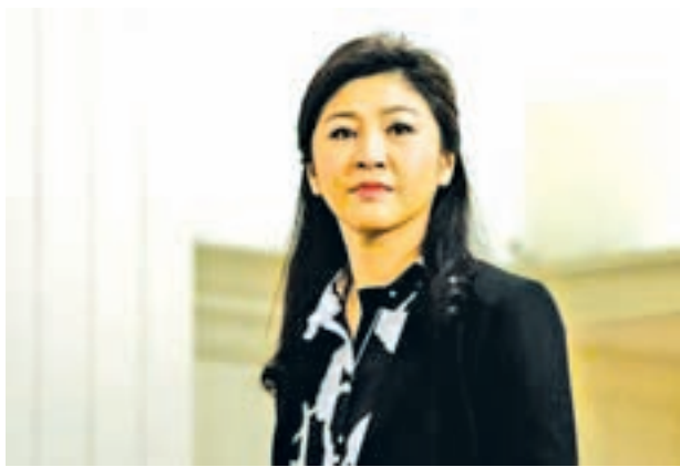
Former Thai Prime Minister Yingluck Shinawatra

A day after she was removed, the country's anti-corruption body indicted her for dereliction of duty in relation to a controversial rice subsidy scheme.