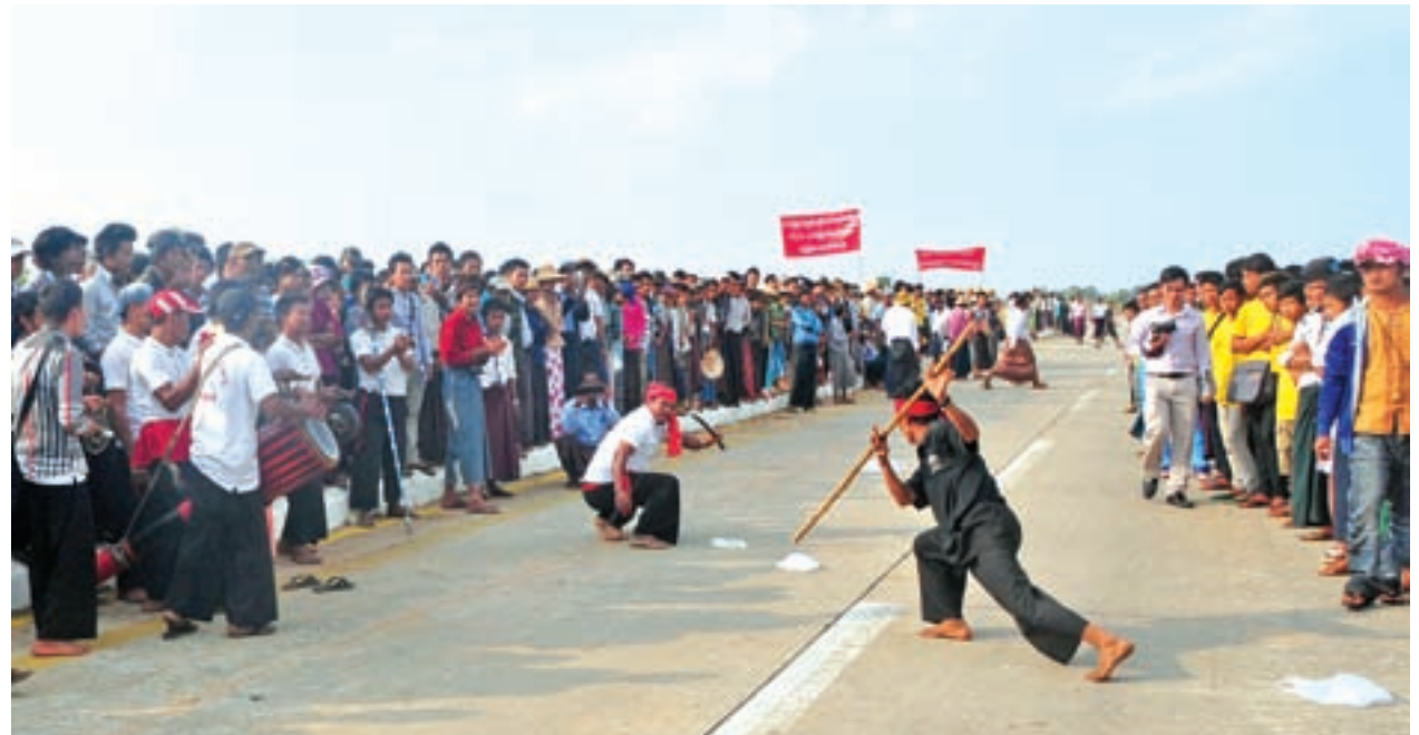
Local people from townships of Bago Region heartily welcome President U Thein Sein on his tour of Pyu Creek Dam.

After hearing the reports, the president urged the officials to carry out maintenance tasks of the dam, to prevent the wast-