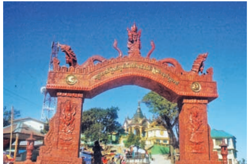
Pilgrims going to Myaseinyaung Shwe Pagoda in Kyaikhtiyoe Hill area in Kyaikto Township.

U Khin Maung Myint (Zabuthiri); Photos: U Sein Hlaing (IPRD)