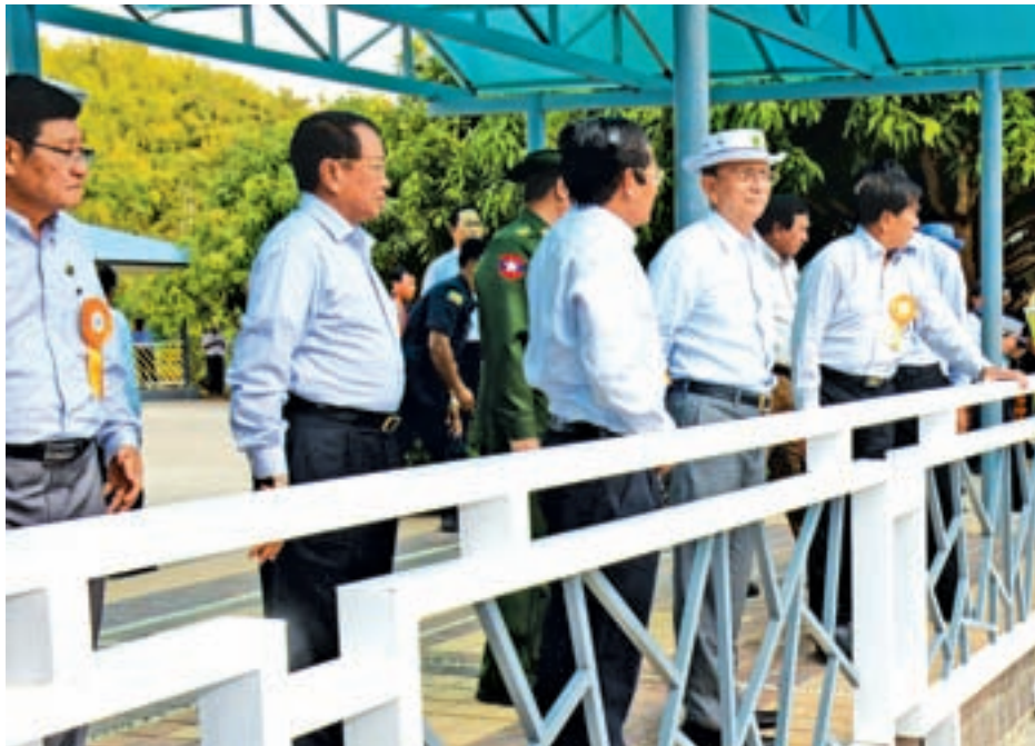
President U Thein Sein views Pyu Creek Dam at its opening ceremony in Pyu Township.

NAY PYI TAW, 8 Jan — President U Thein Sein delivered a speech at the opening ceremony of Pyu Creek Dam, its diversion dam and hydropower station at the dam near milepost 114 on Yangon-Mandalay Expressway in Pyu Township on Thursday morning.