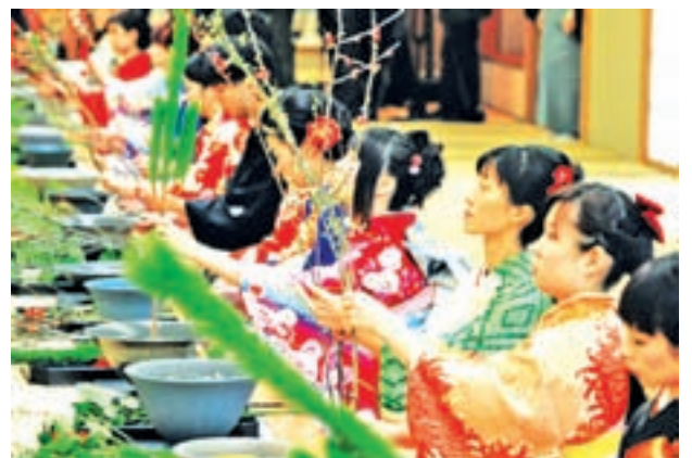
Dressed in kimono, students of the Ikenobo school of Japanese flower arrangement participate in a New Year flower arranging ceremony in Kyoto, western Japan, on 5 Jan, 2015.

KYOTO, 8 Jan — As the New Year began, schools of Japanese traditional arts held ceremonies in Kyoto this week to mark the beginning of their activities for 2015.