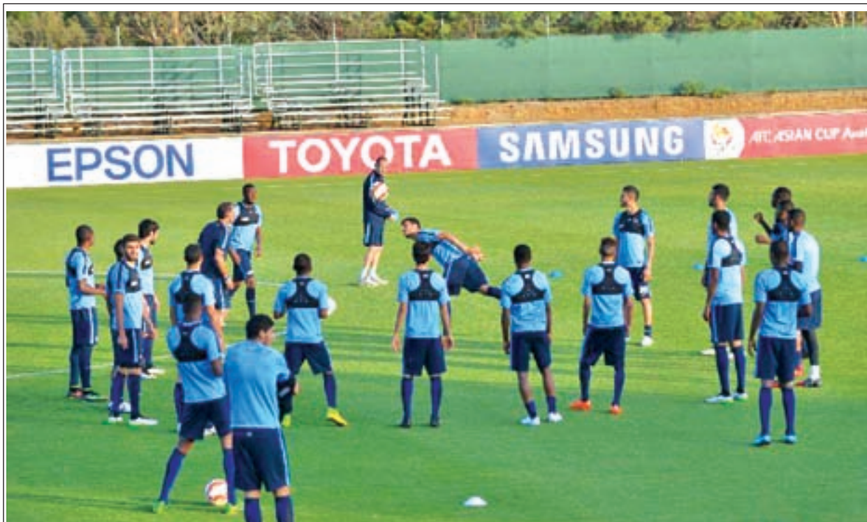
Players of Qatar soccer team attend a training session ahead of the AFC Asian Cup in Canberra, Australia, on 7 Jan, 2015. Qatar’s first match at this Asian Cup will be against the UAE in Canberra on 11 Jan, 2015.