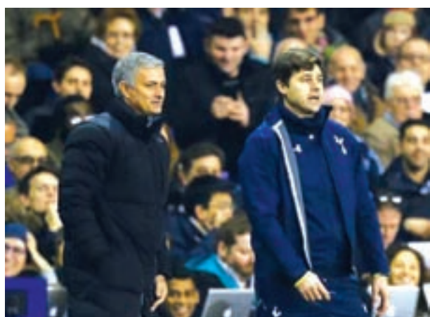
Chelsea manager Jose Mourinho (L) and Tottenham Hotspur manager Mauricio Pochettino watch play during their English Premier League soccer match at White Hart Lane in London on 1 Jan, 2015.

LONDON, 8 Jan — Stuttering Chelsea retained their Premier League lead by virtue of the alphabet but will need a quick ri-