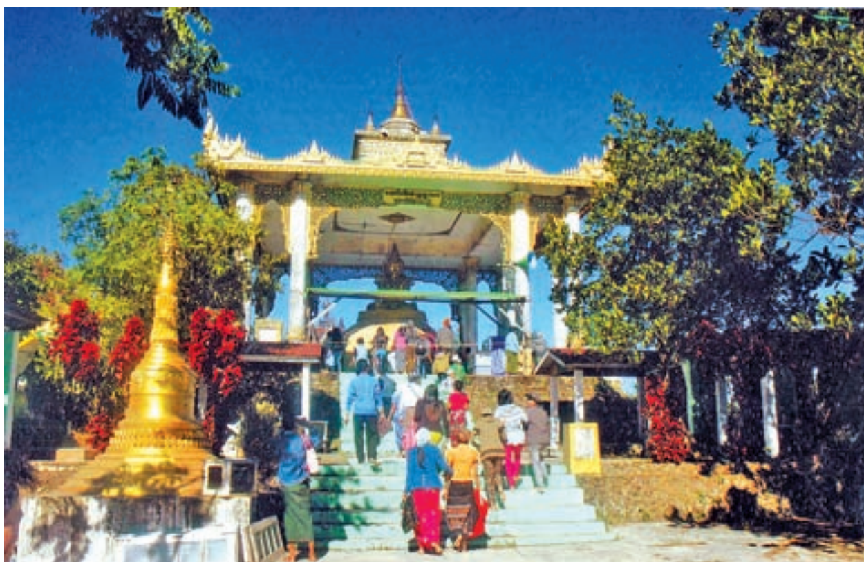
Aung Mingala Echasaya Buddha Image located on the route to Singyan, Myasein and Yathay hills.

gave free of charge transport to passengers to Moebaw Creek waterfalls on 3