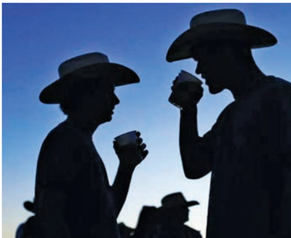
Country music fans drink beer as night falls during the final day of the Stagecoach country music festival in Indio, California on 27 April, 2014.