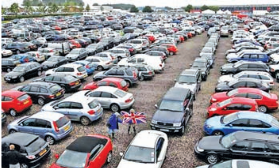
A Formula One fan wraps herself in a Union flag as she leaves a full car park ahead of the British F1 Grand Prix at Silverstone, central England on 8 July, 2012.