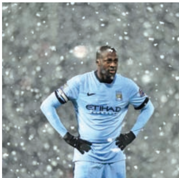
Manchester City's Yaya Toure stands in the snow during the English Premier League soccer match between Manchester City and West Bromwich Albion at The Hawthorns in West Bromwich, central England on 26 Dec, 2014.