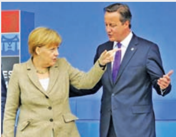
Britain's Prime Minister David Cameron (R) greets German Chancellor Angela Merkel at the start of the NATO summit at the Celtic Manor resort, near Newport, in Wales on 4 Sept, 2014.

LONDON, 7 Jan — German Chancellor Angela Merkel will give little ground on Wednesday as British Prime Minister David Cameron seeks her help in curbing EU migration, insisting that free movement of workers is crucial to the bloc.