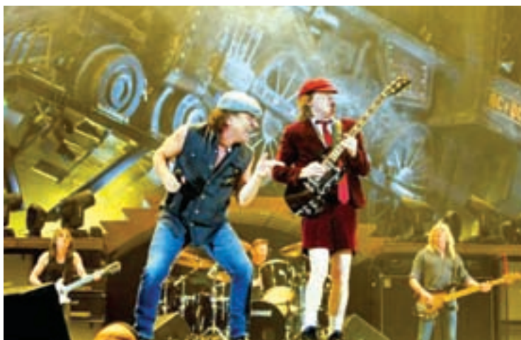
Rock band AC/DC lead guitarist Angus Young (R) and vocalist Brian Johnson perform during a concert at the Telenor Arena in Fornebu, near Oslo, in this file photo taken on 18 Feb, 2009.

It is not known if drummer Rudd will join the group after he was ordered in December to stay off drugs by a New Zealand judge. He was also charged with trying to set up a murder, which was later withdrawn because of lack of evidence.