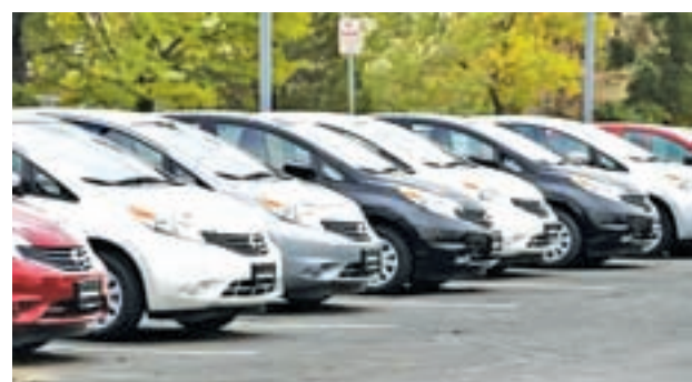
A line of new Nissan autos is seen outside a Nissan auto dealer in Broomfield, Colorado on 1 Oct, 2014.