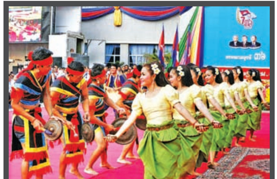
Actors and actresses perform during the commemoration of the 36 th anniversary of the Liberation Day in Phnom Penh on 7 Jan, 2015.—XINHUA

If the goal of the LUSH programme is fully achieved, Singapore will really live up to its reputation as Asia’s “Garden City.”—Xinhua