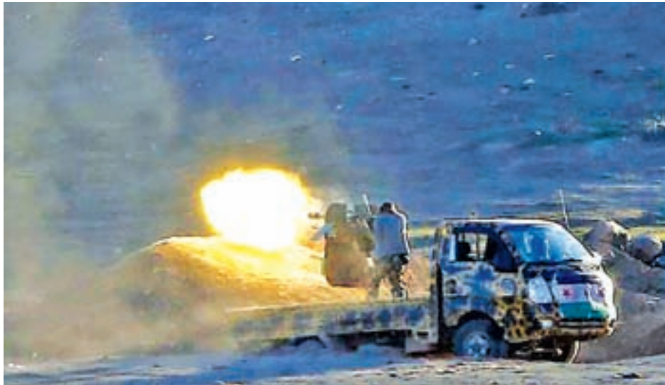
Syrian rebel fighters fire a heavy machinegun against Islamic State positions from a location west of Kobani during fighting on 4 Nov, 2014.

WASHINGTON, 7 Jan — The US military said on Tuesday it had received 18 complaints of civilian casualties in air strikes against Islamic State militants in Iraq and Syria, but concluded that 13 of the cases were not credible and was still reviewing the other five. The Pentagon has said it takes allegations of civilian casualties seriously and investigates them, but in the past military officials had played down such reports.