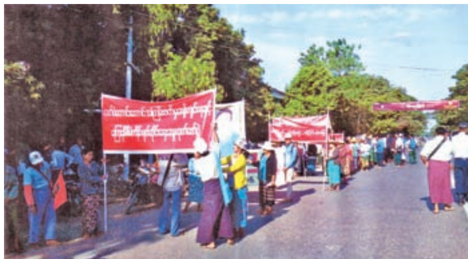
Local people stage protest to end of violence at Letpadaungtaung copper mine project in Monywa Township.

before the project starts and two percent of profit during production period