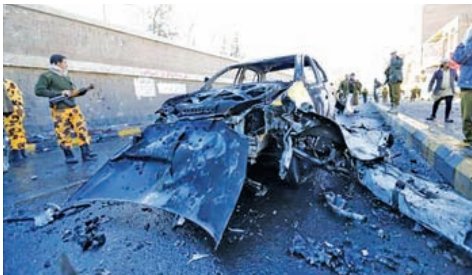
Policemen look at the wreckage of a car at the scene of a car bomb outside the police college in Sanaa on 7 Jan, 2015.

away from the scene of the blast, and bodies were seen lying in the street, witnesses said. The explosion was heard across the city and a large plume of smoke was visible in the area of the college.—Reuters