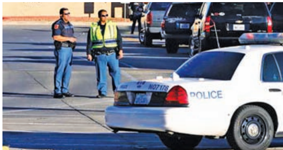
El Paso police block off an entrance to the Beaumont Army Medical Centre as other officers search for a gunman during a shooting incident in El Paso, Texas on 6 Jan, 2015 where a gunman shot a doctor at the Army medical centre and then apparently took his own life, according to media reports.

The facility, which is part of Fort Bliss, had been on lockdown for several hours. Local news reports said one of those shot in the attack was a doctor at the