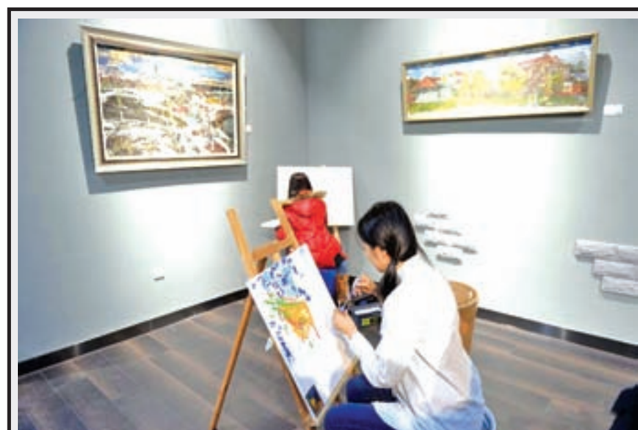
Painters work at the International Painting Trade Centre in Harbin, capital of northeast China's Heilongjiang Province, on 5 Jan, 2015. The centre opened to public on Monday.

Myanma Oil and Gas Enterprise Ph.+95 67-411097/411206