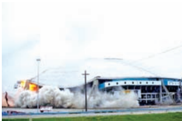
Texas Stadium, former home of the Dallas Cowboys, is demolished in Irving, Texas, on 11 April, 2010.