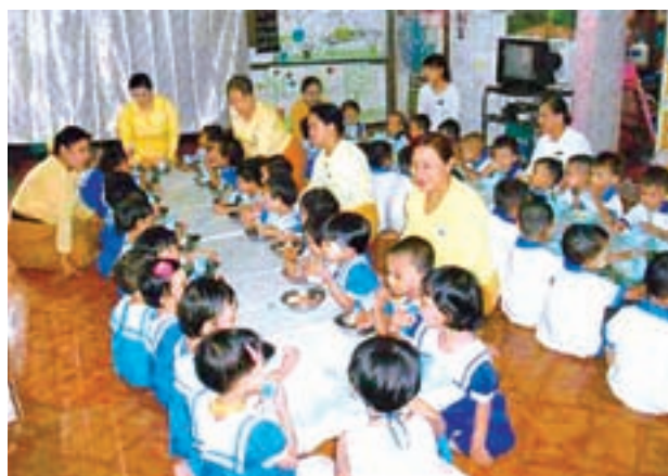
MCWA officials give nutritious foods to children of pre-primary school in Nyaunglebin.

NYAUNGLEBIN, 7 Jan — Nyaunglebin Township Maternal and Child Welfare Association fed re-