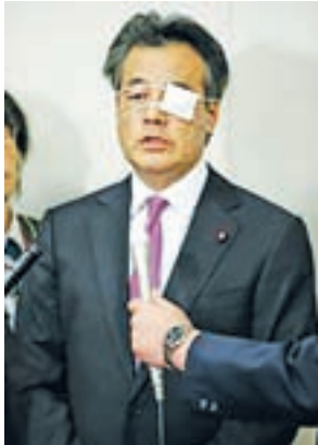
Katsuya Okada, acting head of the main opposition Democratic Party of Japan, speaks to reporters in Tokyo on 7 Jan, 2015, after he filed his candidacy for the party leadership election on 18 January.

Amid the opposition's continued weakness, the