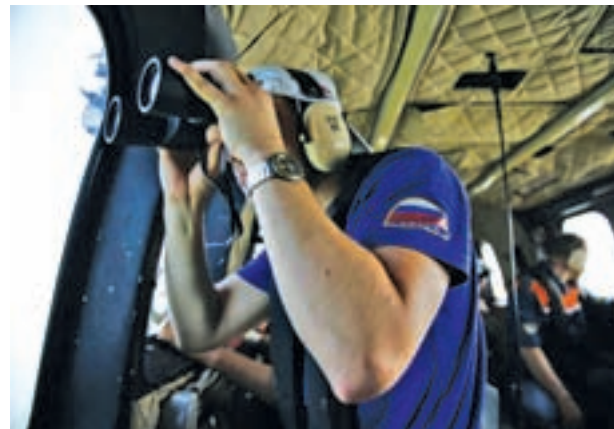
A Russian search team member uses a pair of binoculars to look out the window of a Super Puma helicopter during a search operation for passengers onboard AirAsia Flight QZ8501, off the Java sea, in Indonesia on 7 Jan, 2015.

Indonesia AirAsia, 49 percent owned by Fernandes’s Malaysia-based AirAsia budget group, has come under pressure from the authorities in Jakarta since the crash.