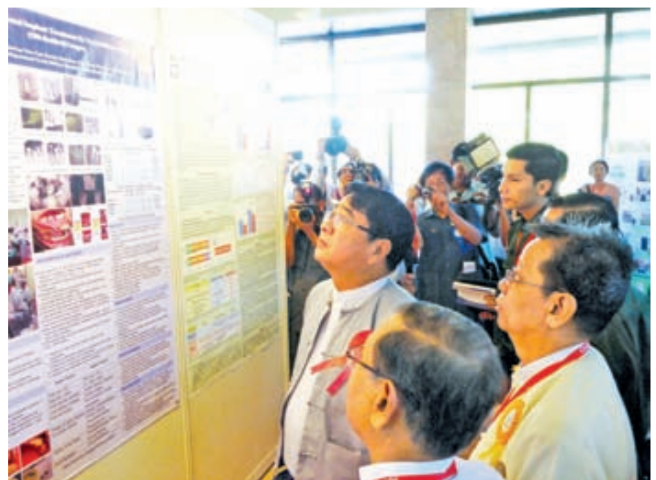
Union Minister for Health Dr Than Aung views documentary photos and research papers on dental medicine.