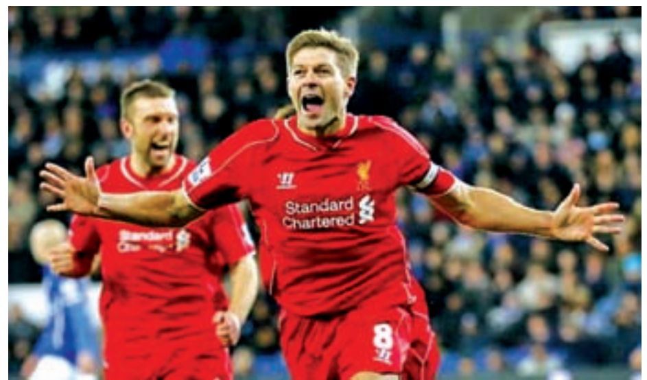
Liverpool's Steven Gerrard (R) celebrates his goal during their English Premier League soccer match against Leicester City at the King Power Stadium in Leicester, central England, on 2 Dec, 2014.

LONDON, 7 Jan — Liverpool captain Steven Gerrard has said he would have agreed to stay at the club if he had been offered a new contract in the close season.