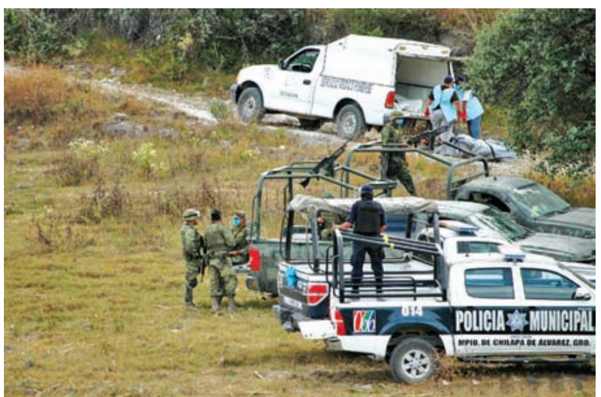
Elements of the Attorney General of Guerrero accompanied by members of the municipal police, the state police and the Secretariat of National Defence (SEDENA), take part in the exhumation of clandestine graves located in the area known as “El Huizache”, in the town of Chilapa de Alvarez, state of Guerrero, Mexico, on 6 Jan, 2015. According to local press, after an anonymous denunciation, experts of the Attorney General of Guerrero attended to El Huizache, where after several hours of work were found human remains, without that has been achieved to establish the exact number of bodies that could be found in the area.—XINHUA