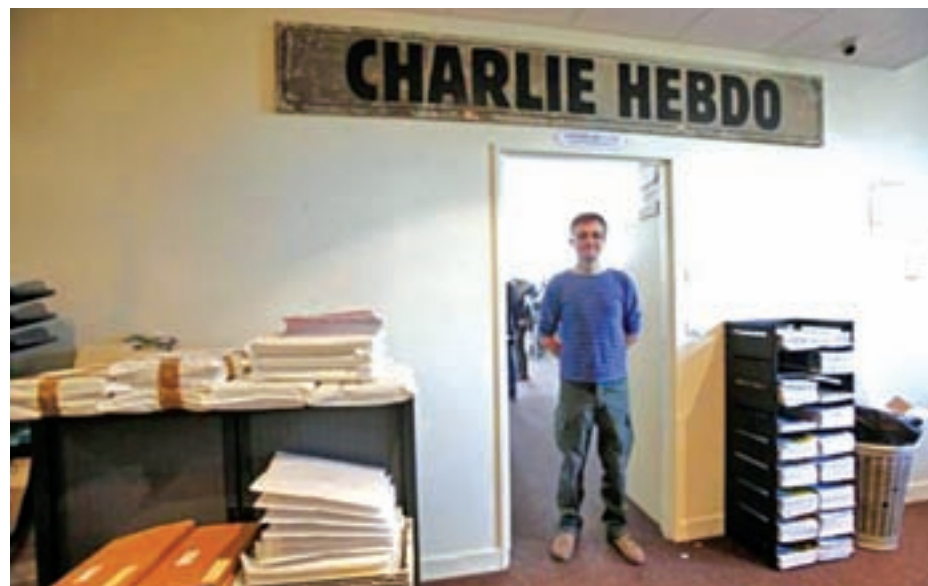
French cartoonist Charb, publishing director of French satirical weekly Charlie Hebdo, poses for photographs at their offices in Paris, in this 19 Sept, 2012 file photo.—REUTERS

In coming weeks, Boehner is expected to face the difficult task of finding a middle ground on a bill to keep the Department of Homeland Security operating beyond February when funds run out.—Reuters