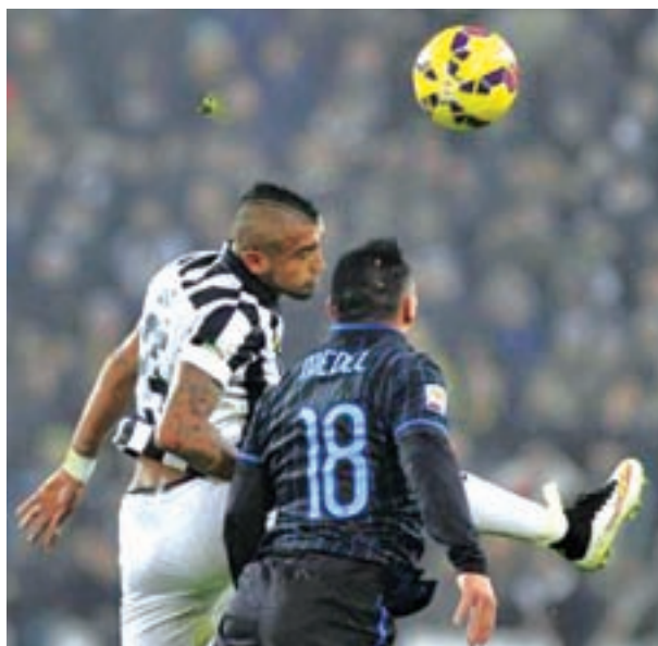
Juventus' Arturo Vidal (L) and Inter Milan's Gary Medel jump for the ball during their Italian Serie A soccer match at the Juventus stadium in Turin on 6 Jan, 2015.

MILAN, 7 Jan — Serie A leaders Juventus were held to a 1-1 draw by Inter Milan who hit back through a clinical Mauro Icardi strike after conceding an early Carlos Tevez goal on Tuesday.