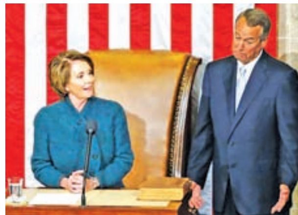
US House Minority Leader Nancy Pelosi (D-CA) (L) makes remarks before handing the gavel to House Speaker John Boehner (R-OH) (R) after he was re-elected speaker on the House floor at the US Capitol in Washington on 6 Jan, 2015.