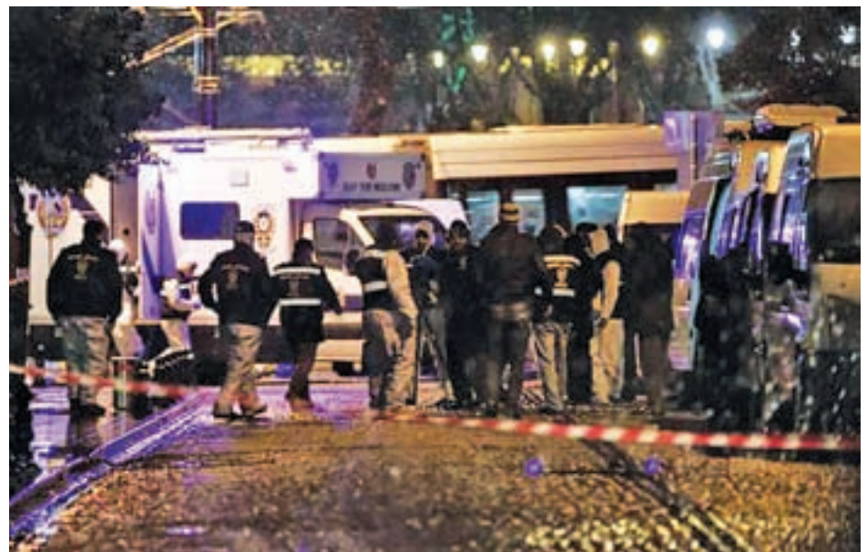
Forensic officers work at the scene of a bomb blast in Istanbul on 6 Jan, 2015.

Prime Minister Ahmet Davutoglu said one of the officers had died. It was not immediately clear whether the bomber had links to any particular group.