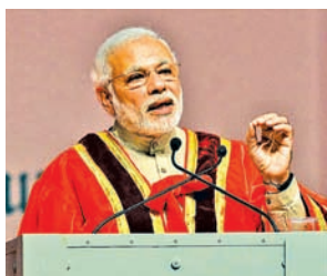
Indian Prime Minister Narendra Modi

NEW DELHI, 4 Jan — Indian Prime Minister Narendra Modi on Saturday said on Saturday that digital connectivity should become a basic right in the country just like the right to schooling.