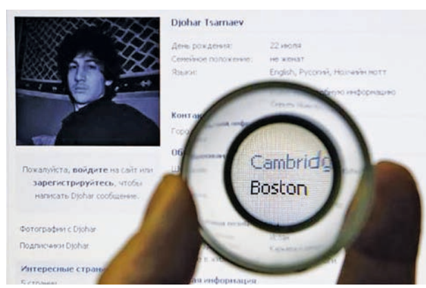
A photograph of Djohar Tsarnaev, who is believed to be Dzhokhar Tsarnaev, a suspect in the Boston Marathon bombing, is seen on his page of Russian social networking site Vkontakte (VK), as pictured on a monitor in St Petersburg on 19 April, 2013.

BOSTON, 4 Jan — A US appeals court on Saturday denied a last-ditch request by lawyers for accused Boston Marathon bomber Dzhokhar Tsarnaev to delay his trial on charges of killing three people and injuring more than 260 in the attack.