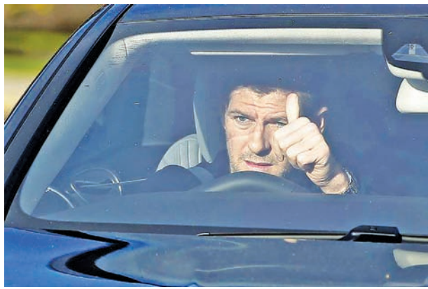
Liverpool captain Steven Gerrard gestures as he leaves the club's Melwood training centre in Liverpool, northern England on 2 Jan, 2015.

"But I'm not over the line with any team just yet. I'm close and as soon as I know I'll make the an-