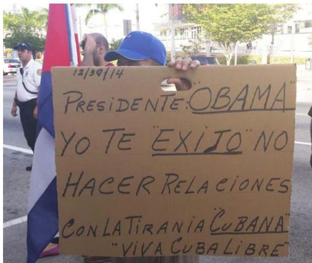
A protester holds up a sign during a rally in solidarity with Cuban dissidents in downtown Miami, Florida, on 30 Dec, 2014.

Whether the obstacles amount in the long run to anything more than speed bumps on the way to wider detente remains to be seen. But at a minimum, they illustrate how benefits from Obama's ditching of a