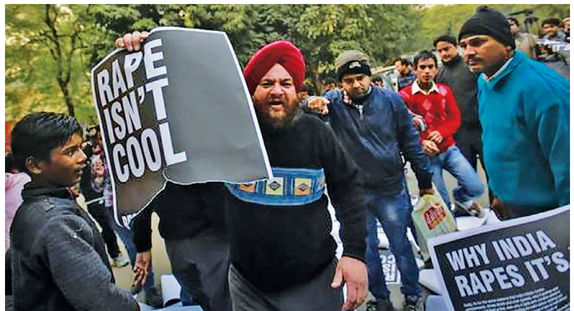
A demonstrator holds a torn poster during a protest in New Delhi on 29 Dec, 2012.