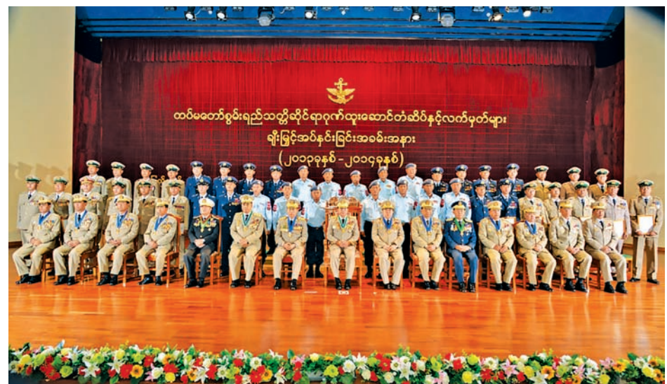
Senior General Min Aung Hlaing poses for documentary photo with gallantry title winners.

Similar ceremonies were held in military commands to confer medals on 331 defence services personnel on Sunday.