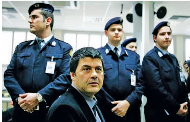
Greek member of 17 November urban guerrilla group Christodoulos Xiros (front) sits inside a court room in Korydallos prison, a few kilometres west of Athens on 2 Dec, 2005.

A 1 million euro (0.78 million pound) reward had been offered for his capture. Xiros' escape from prison in January 2014 was an embarrassment