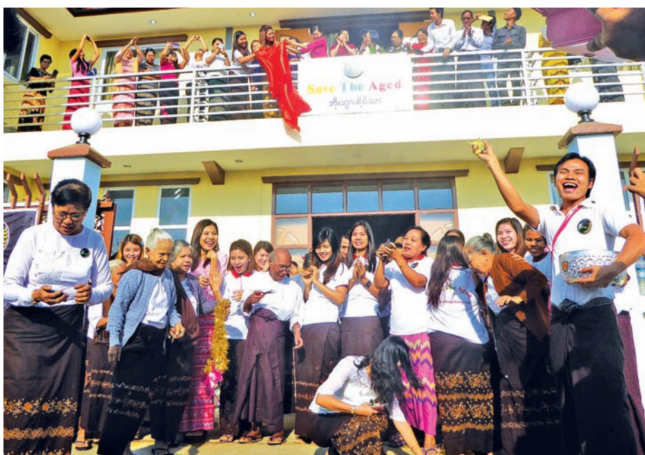
Members and elderly people seen at opening ceremony of home for the aged in Dagon Myothit (South) Township, Yangon, established by Save the Aged, a local NGO.