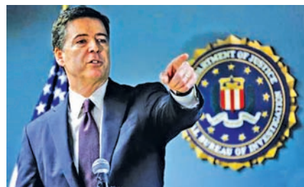
FBI Director James Comey takes a question from a reporter during a news conference at the FBI office in Boston, Massachusetts on 18 Nov, 2014.

WASHINGTON, 4 Jan — Hundreds of employees with foreign ties working for the US Federal Bureau of Investigation are subjected to what they say are unfair aggressive background checks that have forced some to cut contact with family members abroad, the New York Times reported on Saturday.