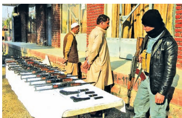
Two men of Taleban stand handcuffed after being captured with weapons during an operation by Afghan policemen in Nangarhar Province, eastern Afghanistan on 3 Jan, 2015.

Local reports have said a Coptic doctor and his wife were murdered in their home in early December, with their daughter's body later found. A formal diplomatic mission to retrieve the Egyptians would be difficult because much of Libya falls outside of the officially recognized government's control, an Egyptian foreign ministry spokesman said on Saturday. —Reuters