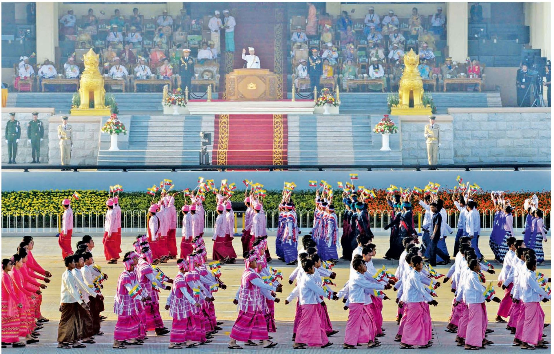
President U Thein Sein takes salute of parade columns at 67 th Anniversary Independence Day's Grand Military Review parade in Nay Pyi Taw.

NAY PYI TAW, 4 Jan — President U Thein Sein delivered an address at the flag-hoisting ceremony of the 67 th Anniversary Inde-