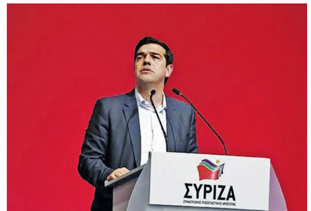
Alexis Tsipras, opposition leader and head of radical leftist Syriza party, looks on as he speaks during a party congress in Athens on 3 Jan, 2015.

Syriza has led New Democracy in opinion polls for months, but its lead has narrowed in recent weeks.