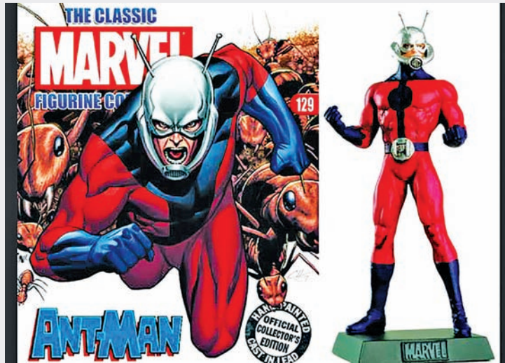
The 18-second clip — made up of just over 10 shots — ends with a note that the full teaser trailer will air during the premiere of Marvel TV show 'Agent Carter'.—PTI

Lang's daughter Cassie will appear in the movie and