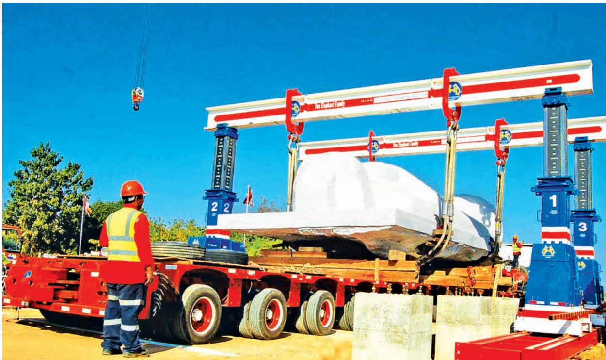
Large marble stone being lift by heavy machinery at ACE Company's workshop compound in Nay Pyi Taw.

NAY PYI TAW, 4 Jan— Under the supervision of Nay Pyi Taw Council Chairman U Thein Nyunt and party, a large marble stone to be carved as Maha Thakyananthe Buddha Image arrived at the compound of ACE Workshop in Pobbathiri Township on Sunday noon.