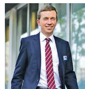
Bernd Lucke, leader of Alternative for Germany (AfD) party walks after a news conference in the Bundespressekonferenz in Berlin on 15 Sept, 2014.

Chancellor Angela Merkel's conservatives, concerned about the rise of a party that attracts far-right voters and siphons off some of its support, hope the movement will self-destruct. In a letter seen by Reuters , five senior party figures told Lucke they were alarmed by his plans, denounced his "despot-like style of leadership" and summoned him to a meeting. It was the latest sign