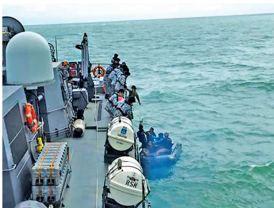
An Indonesian Navy seaboat (R) picks up items retrieved from the Republic of Singapore Navy vessel RSS Valour in this handout photo provided by Singapore's Ministry of Defence, released to Reuters on 4 Jan, 2015.—REUTERS

A source close to the investigation told Reuters that