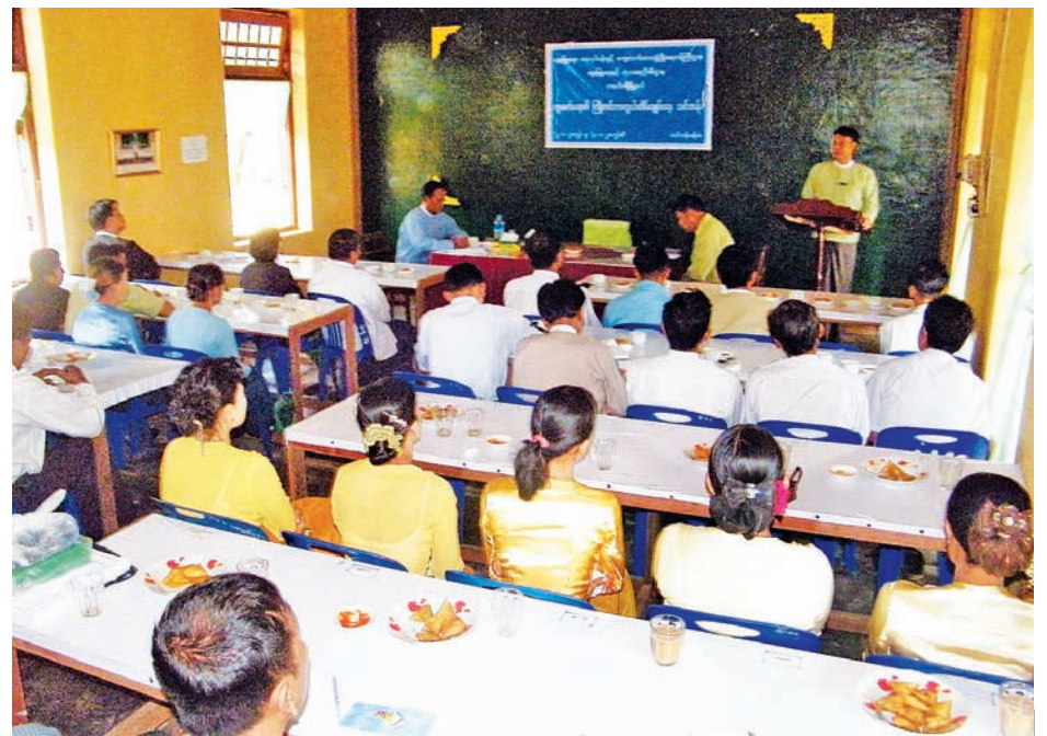
Departmental officials lecture prevention of infectious animal diseases to villagers in Taninthayi.

TANINTHAYI, 4 Jan — A ceremony to open the animal infectious disease control course was opened at Taninthayi Township General Administration Department in Taninthayi Region on 2 January.