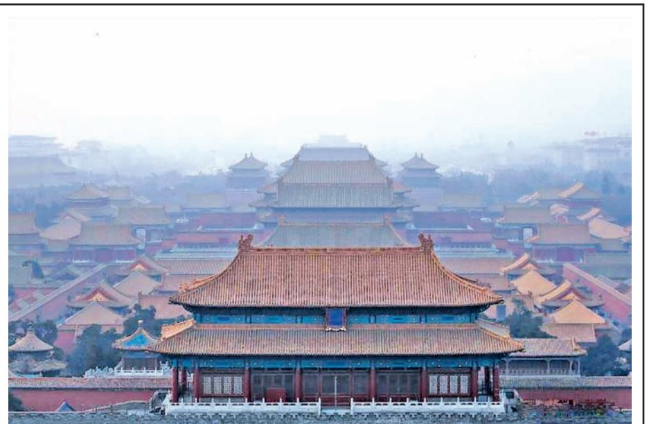
The Palace Museum, or the Forbidden City, is shrouded in smog in Beijing, capital of China on 4 Jan, 2015. China's top meteorological authority forecast medium to severe smog in the country's northern regions including Beijing and Tianjin as well as the neighbouring Hebei Province on Sunday. Meanwhile, smoggy weather will also affect the country's eastern province of Jiangsu as well as the southwestern province of Sichuan on Sunday.—XINHUA

Scores of people were killed in wide spread violence over the last year's 5 January elections.— Xinhua