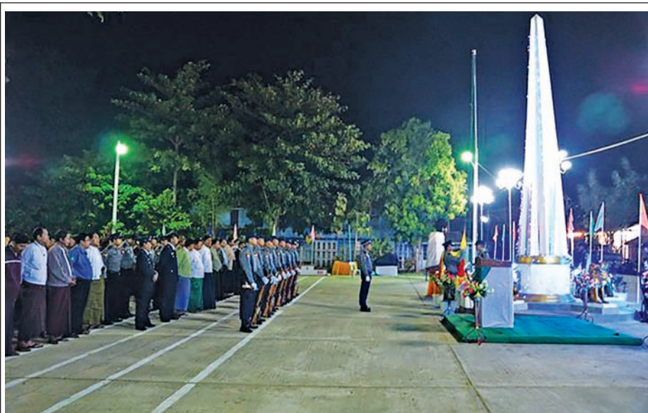
MYANAUNG MARKS INDEPENDENCE DAY: Police and local people salute State Flag at flag hoisting ceremony of 67 th Anniversary Independence Day at the independence monument of people's square in Myanaung, Ayeyawady Region, on 4 January.