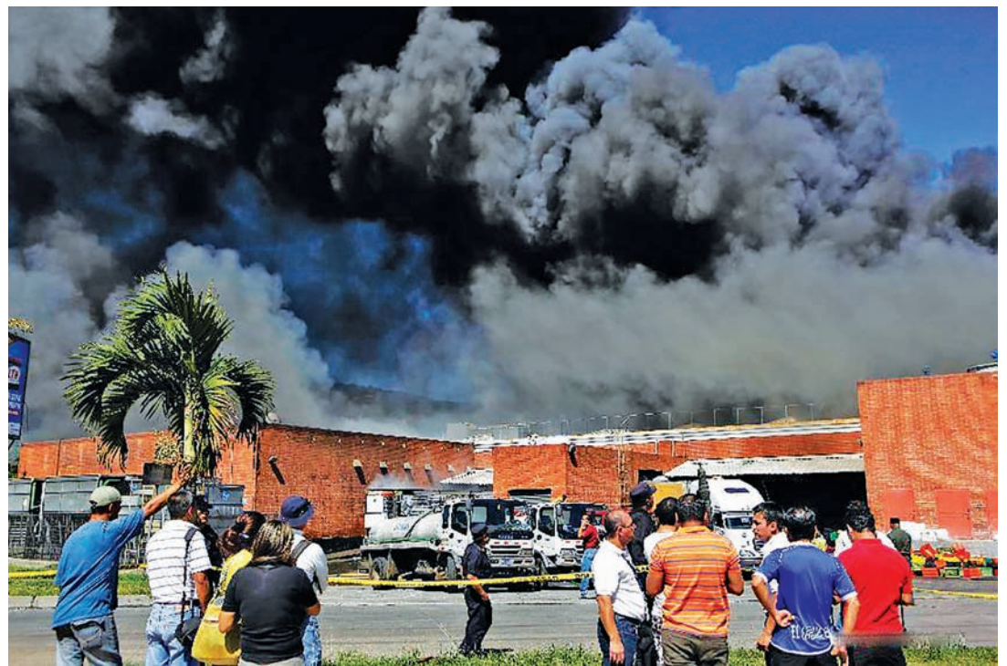
People gather outside the Las Cascadas Commercial Centre where a fire broke out in the town of Antigua Cuscatlan, 12 km away from San Salvador, capital of El Salvador, on 3 Jan, 2015. According to information provided by rescue workers, more than 600 employees were evacuated from the shopping mall and the fire was finally controlled. — XINHUA

In May, 2014, the first "military and civilian integration forum" released around 200 items on weapon procurement, which attracted more than 100 private enterprises and scores of cooperation agreements were subsequently signed.—Xinhua