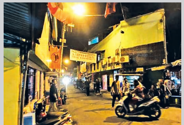
A woman rides a motorcycle through the Dolly area of Surabaya on 24 March, 2014.

JAKARTA, 4 Jan — The US Embassy in Indonesia issued a security alert on Saturday for its citizens in the country's second biggest city Surabaya.