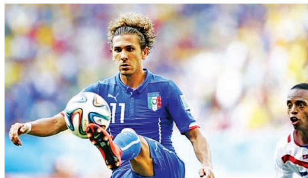
Alessio Cerci controls the ball during a 2014 World Cup Group D soccer match at the Pernambuco arena in Recife on 20 June, 2014.

"We have been following Cerci for three years. Finally he has arrived and he has already promised me he will cut off his beard for his first match," Berlusconi told Milan Channel as he visited the club's training ground.