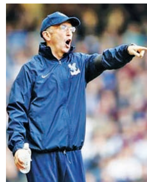
Tony Pulis reacts during their English Premier League soccer match at the Boleyn Ground in London on 19 April, 2014.

However, after seeing the player shine in the 7-0 drubbing of minor league Gateshead in the FA Cup third round, Pulis told re-