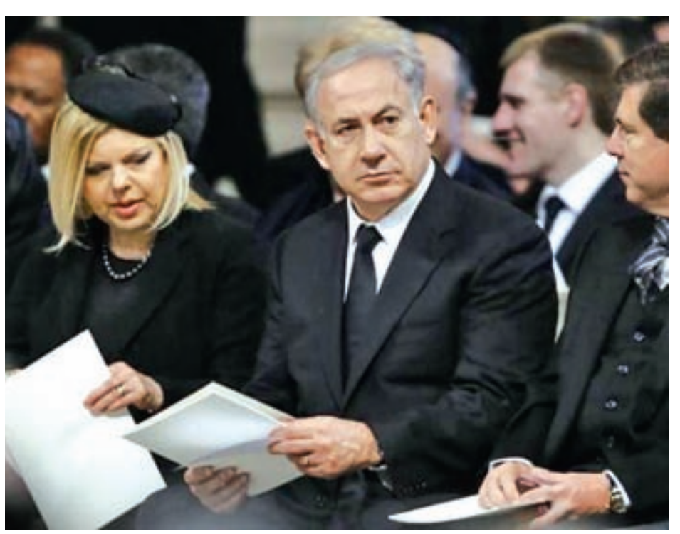
Israel's Prime Minister Benjamin Netanyahu (C) and his wife

Likud officials were still counting the votes from Wednesday's primary election, but Netanyahu's sole contender, former defence minister and far-right lawmaker Danny Danon, conceded defeat soon after