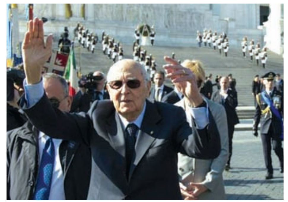
Italy's President Giorgio Napolitano waves during a Liberation Day ceremony at the Unknown Soldier's monument in central Rome on 25 April, 2014, in this handout photo provided by the Italian Presidency Press Office.

Renzi, 39, appointed by Napolitano less than a year ago as Italy's youngest-ever prime minister said on Monday he was "absolutely certain" a successor could be elected. But the process is full of hazards that could absorb valuable political energy as Italy struggles to pull out of recession. Electing a president involves about 1,000 voters — members of par-