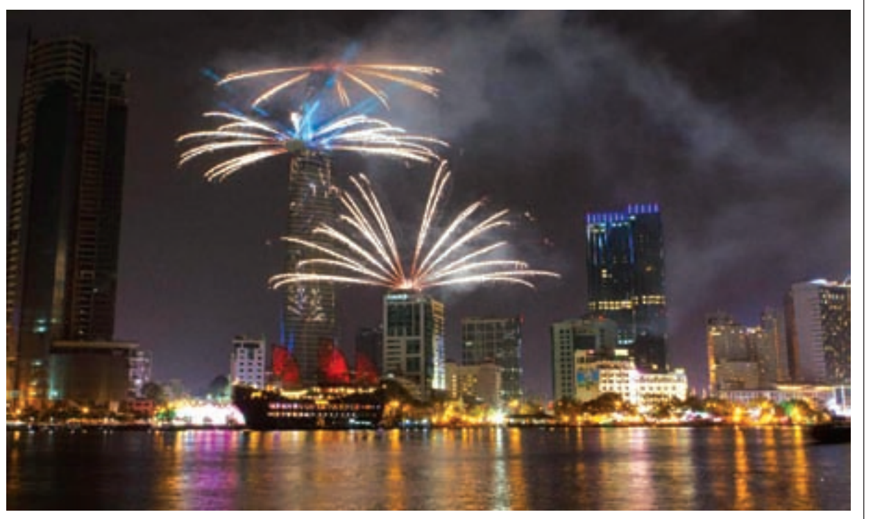
Photo taken on 1 Jan, 2015 shows the firework display in combination with light performance on the New Year's Eve at the Bitexco Financial Tower in Ho Chi Minh city, Vietnam.