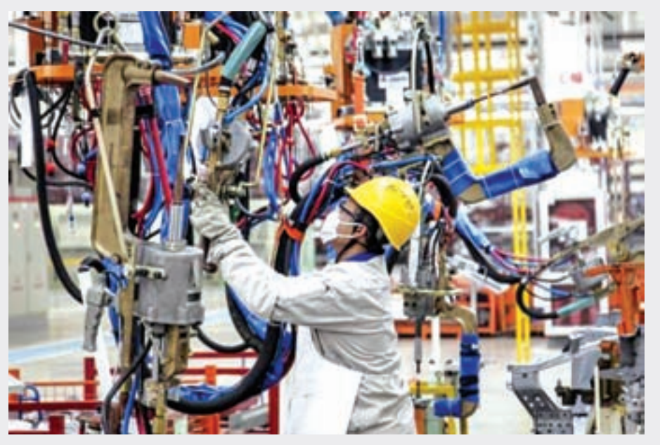
An employee works at the production line of an automobile factory in Dalian, Liaoning Province on 18 Oct, 2014.