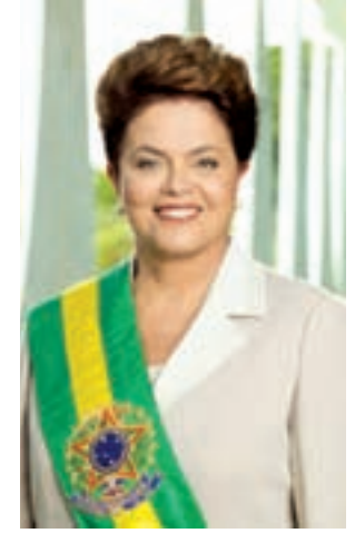
Brazil's President Dilma Rousseff

During the whole ceremony, security will be tight, with 4,000 policemen to be deployed in case of protests, and police barricades to be set up along the president's route and