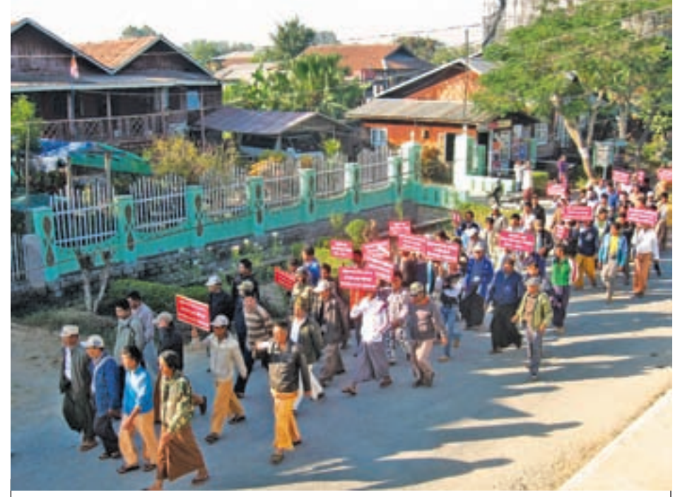
Local people in Nyaungshwe Township stage a protest demanding five points including opposing six-party talks.

talks related to the national race affairs in Shan State is impossible, to create opportunities for all national races to participate in constitutional amendment and political process and to include participation of ethnic representatives in the talks. Township IPRD