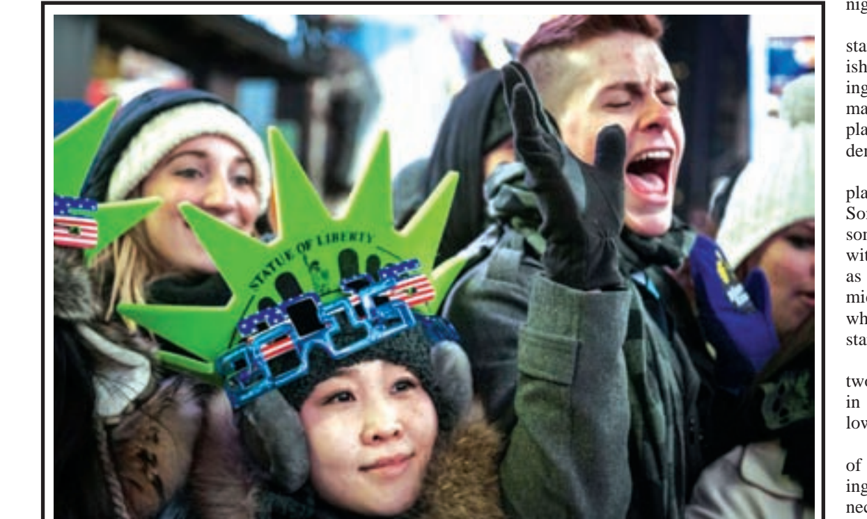
Revellers sport 2015 glasses while taking part in New Year's Eve celebrations in Times Square, New York on 31 Dec, 2014.