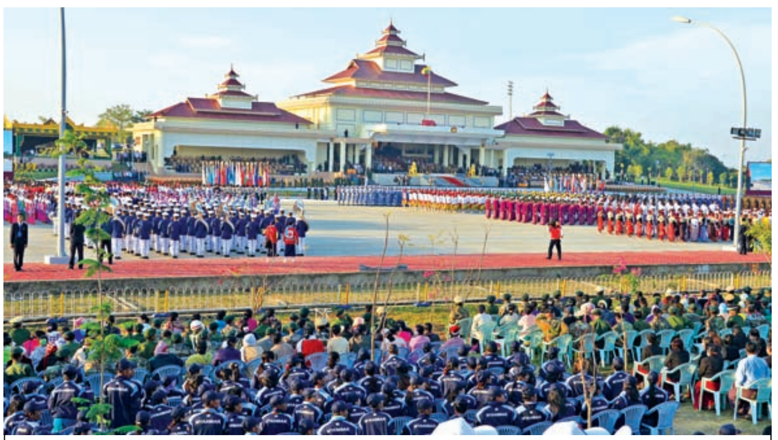
Parade columns comprising personnel of Defence Services (Army, Navy and Air), bands, Myanmar Police Force, Myanmar Red Cross Society, Fire Brigade and departmental personnel take part in Independence Day flag hoisting ceremony and grand military review ceremony.—MNA

Parade columns of Defence Services (Army, Navy and Air), bands, men and women military officers, Myanmar Police Force, Myanmar Red Cross Society, Fire Brigade, (See page 3)