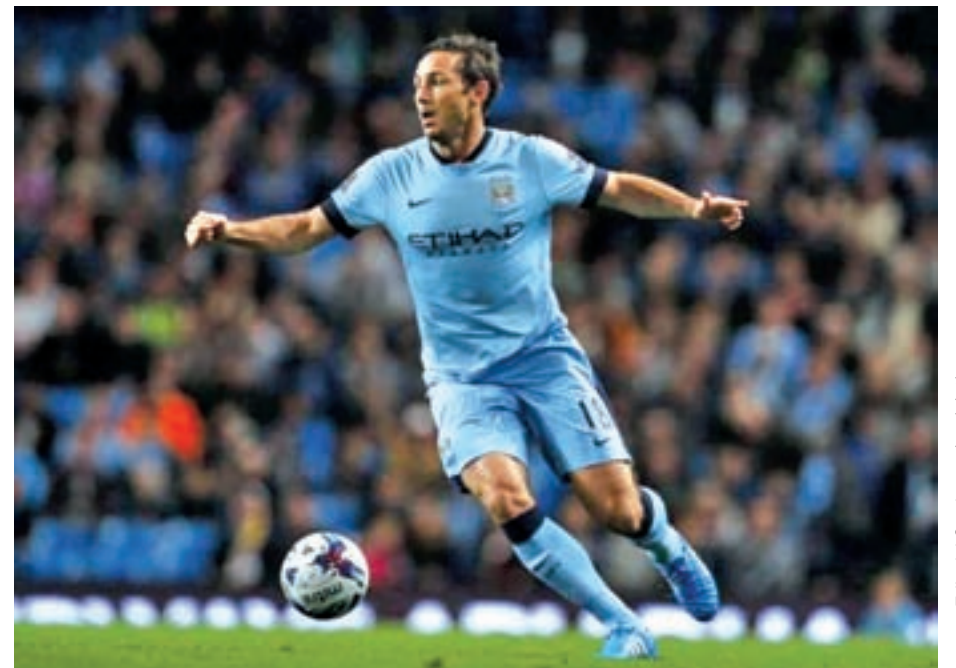
Manchester City's Frank Lampard runs with the ball during their League Cup soccer match against Sheffield on Wednesday at Etihad Stadium in Manchester, northern England on 24 Sept, 2014.