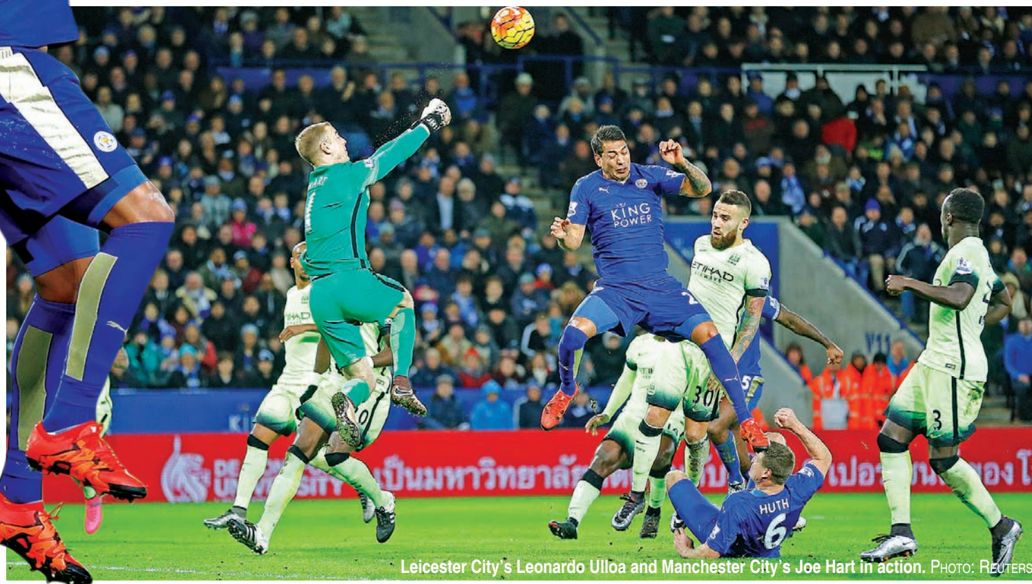
Leicester City’s Leonardo Ulloa and Manchester City’s Nicolas Otamendi in action during Barclays Premier League at King Power Stadium on 29 December 2015.