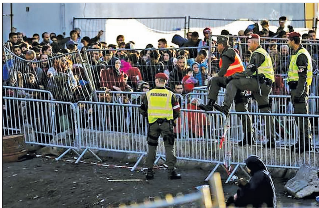
Members of the Austrian army observe migrants waiting to access Austria at the border near the village of Spielfeld, Austria, in November 2015.

VIENNA — Austria has sent hundreds of migrants back to neighbouring Slovenia in the past three days for lying about their nationality in an apparent attempt to improve their chances of being granted asylum, a police spokesman said on Tuesday.