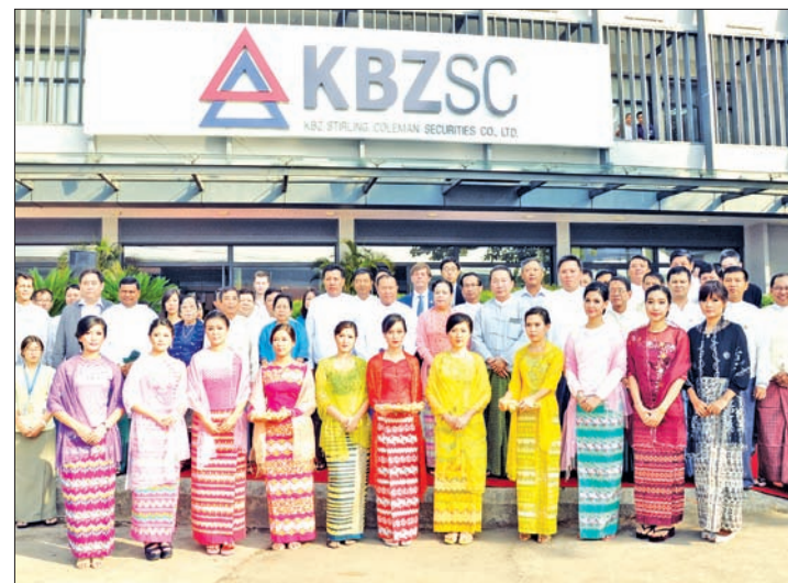
KBZ SC Securities Co Lt opens its office at Strand Square.

The Yangon Stock Exchange was inaugurated with on 9 December with plans for six companies to start trading in March. —GNLM