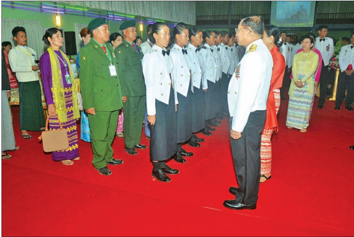
Senior General Min Aung Hlaing greets woman army cadets at the Officers' Training School (Army) in Hmawbi township.

THE second graduation of female army cadets took place at the Officers' Training School (Army) in Hmawbi township, Yangon Region, yesterday, with a speech by Commander-in-Chief of Defence Services Senior General Min Aung Hlaing.