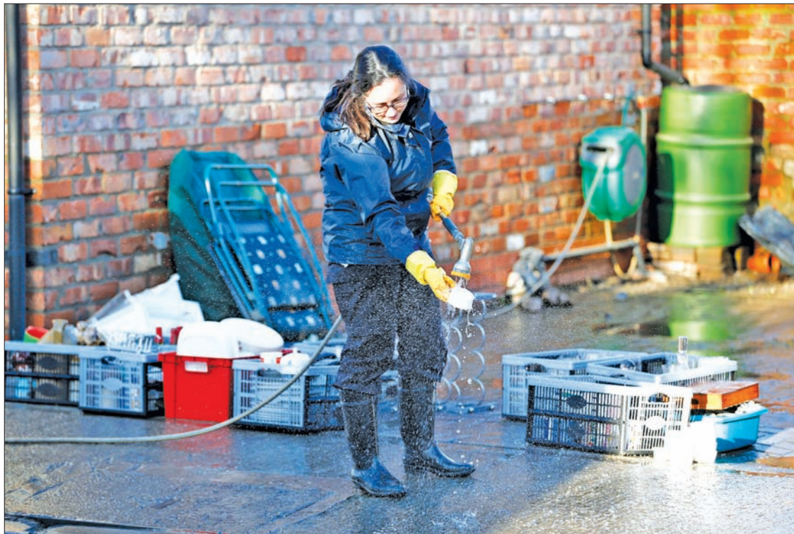
A resident cleans up after flood waters receded on Huntington Road in York, Britain on 29 December.

claims tend to be around 30,000 pounds though can often run as high as 130,000 pounds, JBA said.