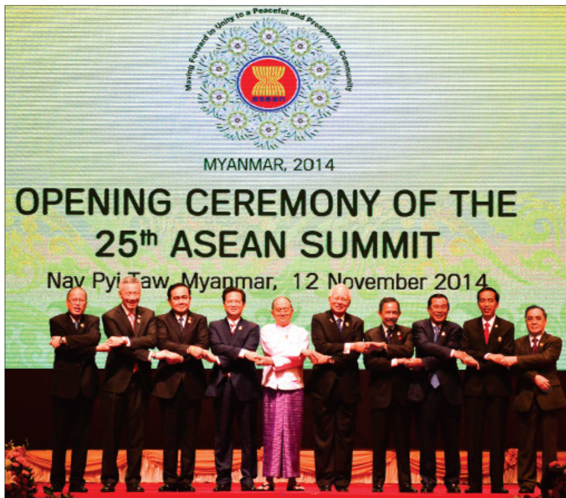
Leaders of ASEAN nations pose for photo in ASEAN way at 25 th ASEAN Summit in Nay Pyi Taw.

We all have witnessed how ASEAN has endured and over-