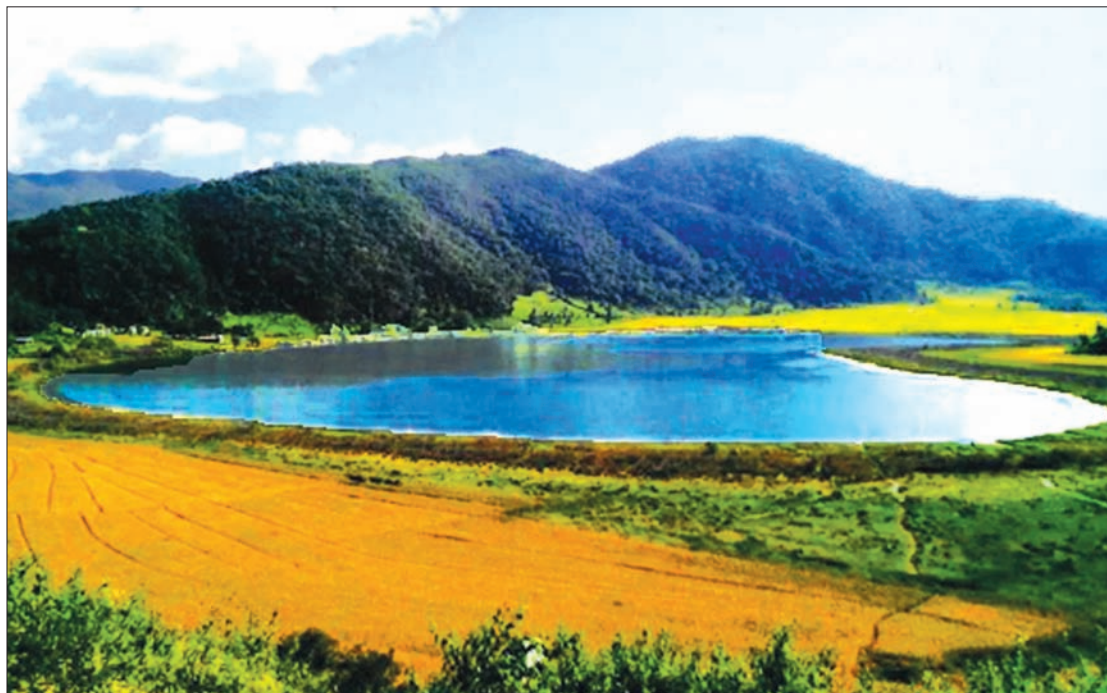
Reed Lake in Chin State becomes popular for holiday makers from local and Mizoram from India.