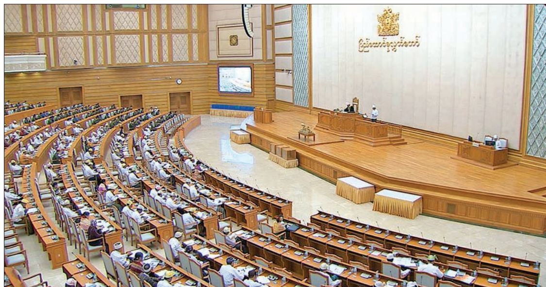
Pyidaungsu Hluttaw being convened in Nay Pyi Taw.

THE Pyidaungsu Hluttaw yesterday passed a bill and discussed three reports on three other bills.