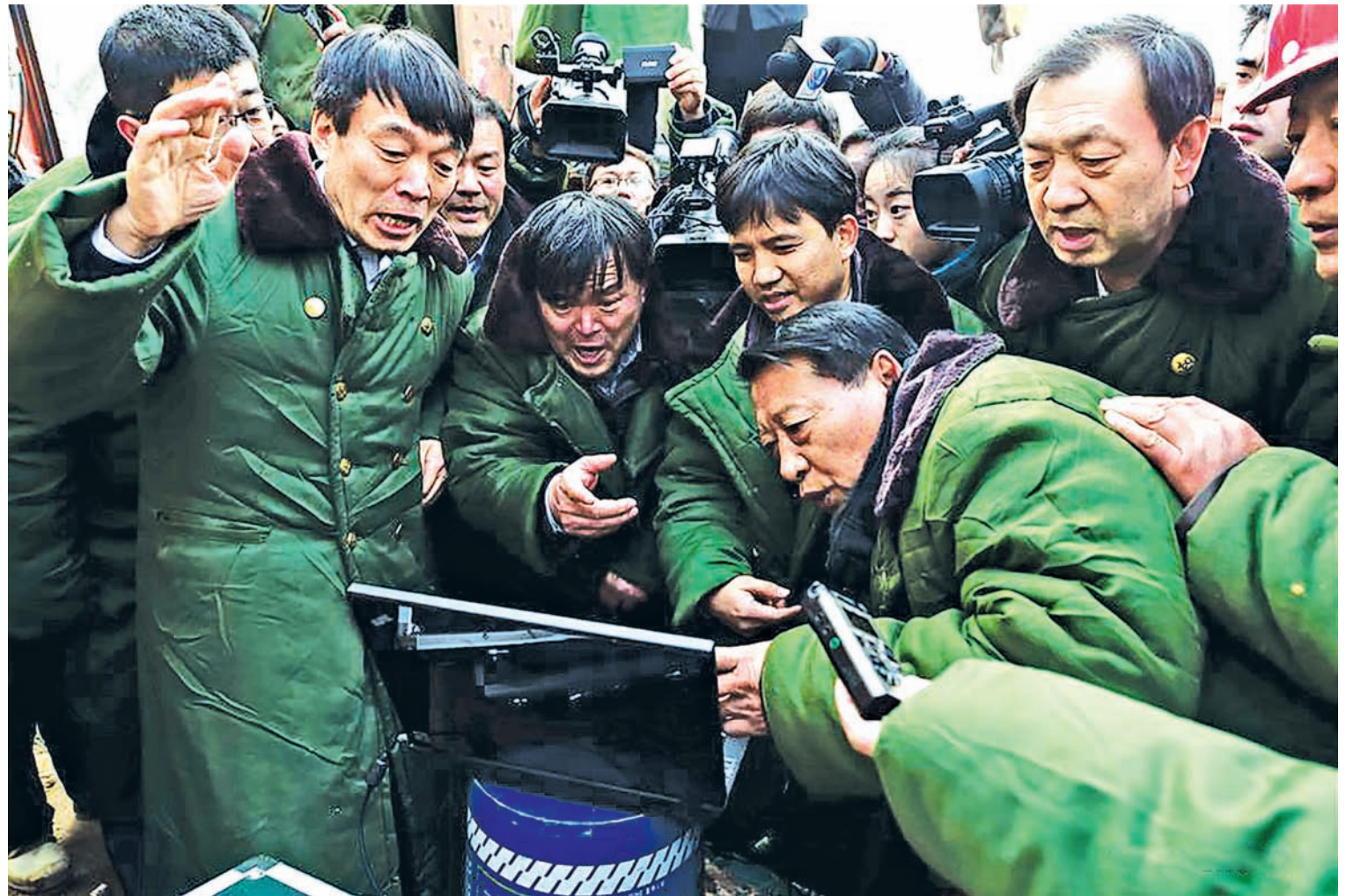
Rescuers get in touch with the trapped mine workers at a collapsed mine in Pingyi County, east China's Shandong Province, on 30 December.