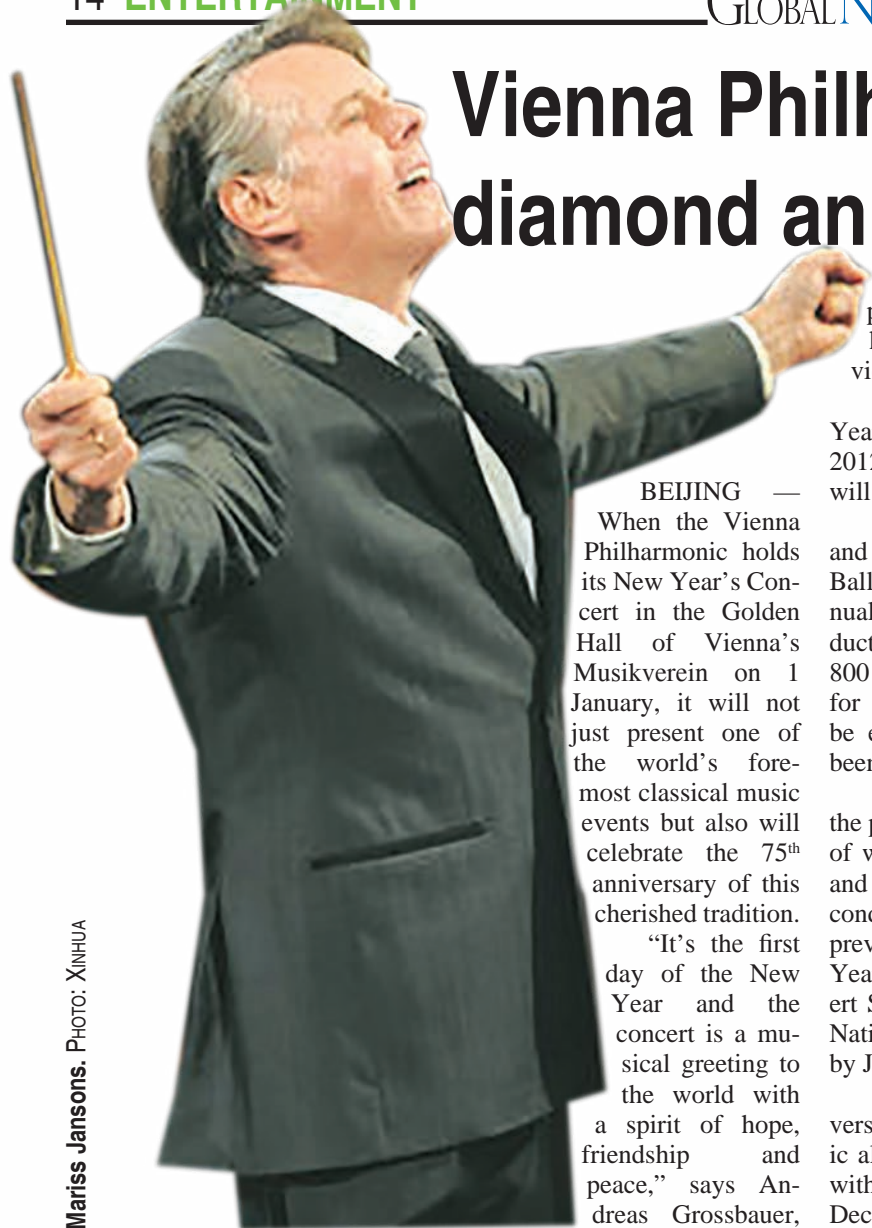
Mariss Jansons.