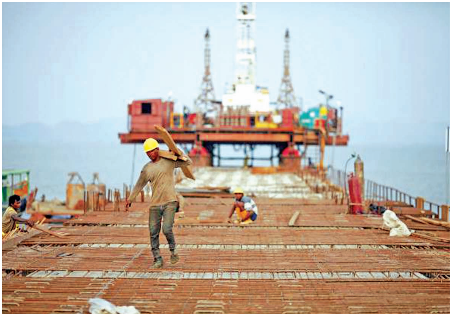
Workers at a special economic zone construction site in Rakhine state.

They also stressed need for transparency as the project is