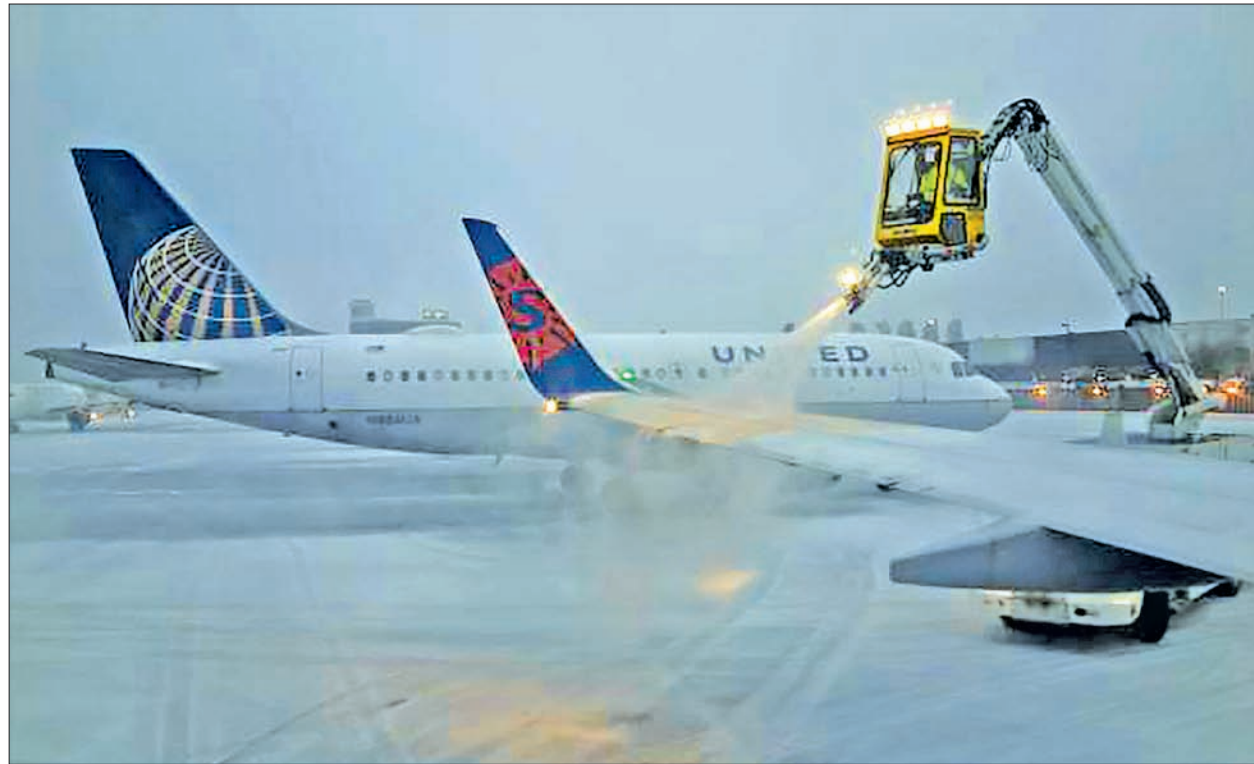
A Sun Country Airlines plane's wing is de-iced as a United Airlines plane waits at the de-icing station during a snowstorm at Logan International Airport in Boston, Massachusetts, United States on 29 December.

“Flooding on the middle portion of the Mississippi River and its tributaries may reach levels not seen during the winter months since records began during the middle 1800s,” Alex Sosnowski,