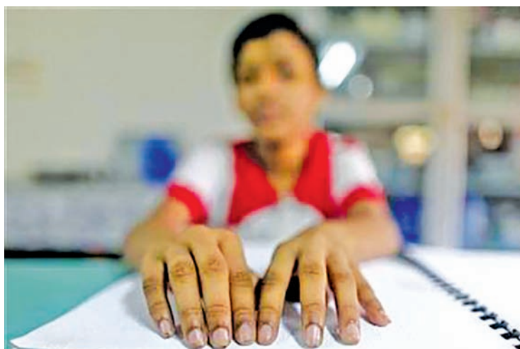
A visually impaired boy takes part in a lesson in Dhaka in 2010.

So what you end up with is a three dimensional print that has length, width, depth and texture,"