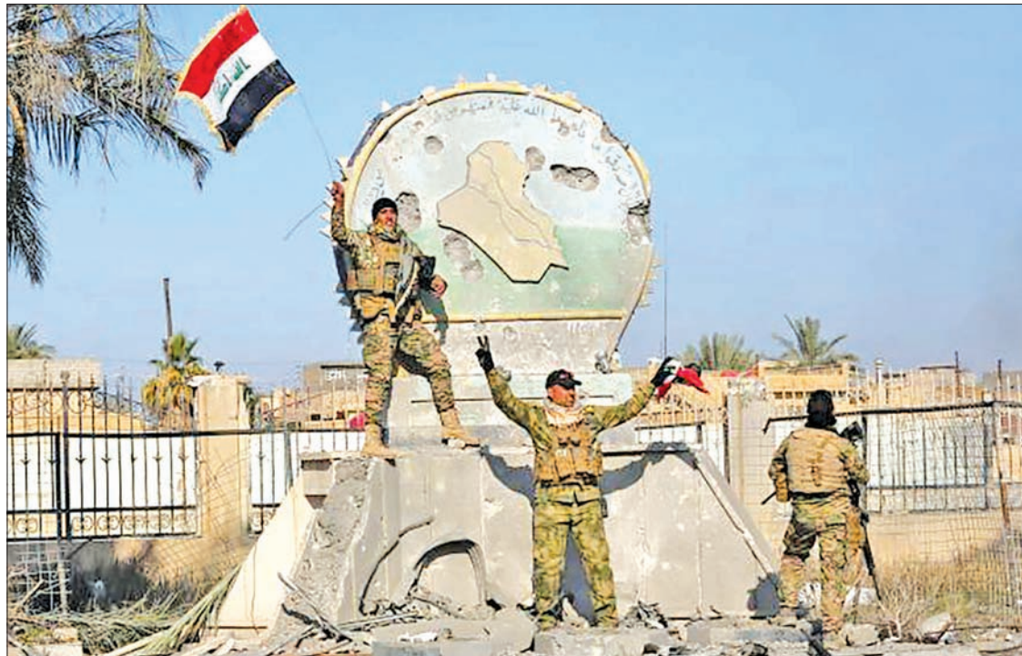
A member of the Iraqi security forces holds an Iraqi flag at a government complex in the city of Ramadi, on 28 December.

Two days earlier, a coalition air strike in Syria killed Charaffe al Mouadan, a Syria-based Islamic State member with a direct link to Abdelhamid Abaaoud, the suspected ringleader of the coor-