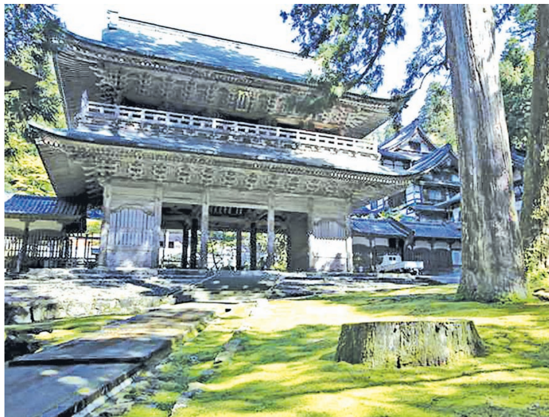
Sanmon gate, or the main gate is pictured at the Eiheiji temple in Eiheiji town, Fukui prefecture.

EIHEIJI (Japan) — Deep in a forest near Japan's western shore, a 13 th century Buddhist temple where Steve Jobs once dreamed of becoming a Zen monk has teamed up with a Tokyo skyscraper builder to seek the commercial enlightenment of foreign tourist dollars.