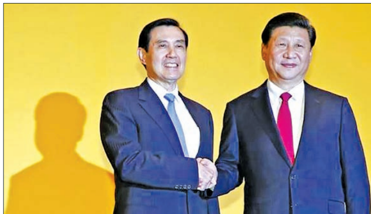
Chinese President Xi Jinping shakes hands with Taiwan's President Ma Ying-jeou during a summit in Singapore in November 2015.