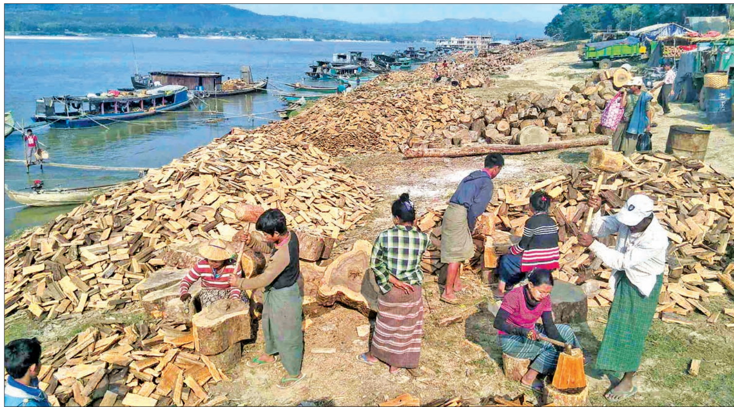
Villagers are cutting logs on the bank of Ayeyawady River in Thabeikkyin Township.

THE locals of Thabeikkyin Township are seeing seasonal job opportunities in the cutting of firewood from logs.