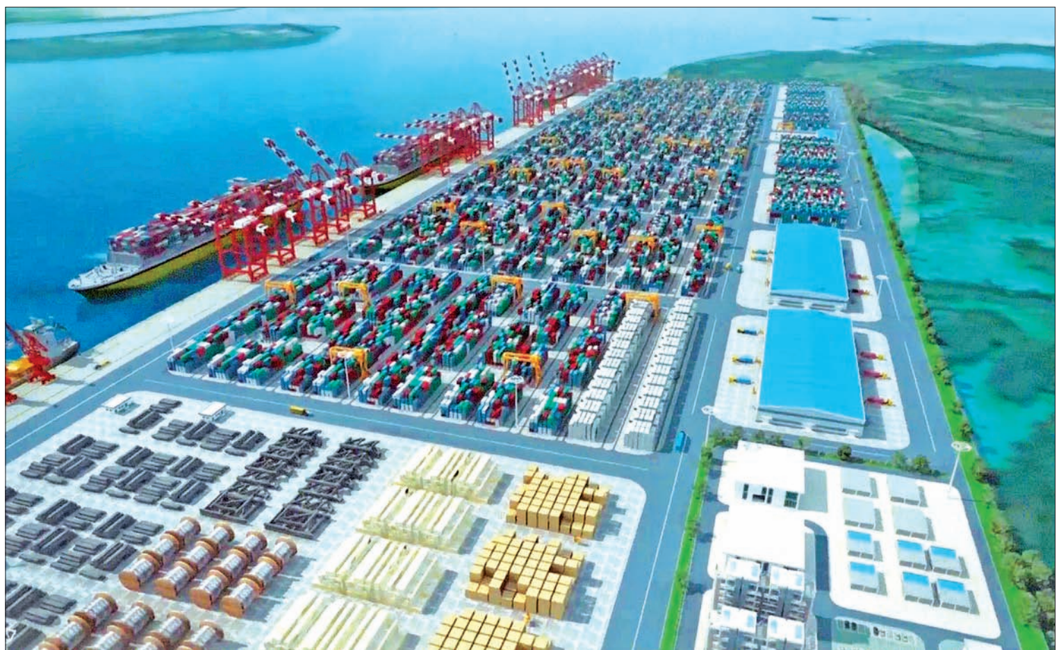
A small-scale model of the Kyaukphyu Special Economic Zone.

During the meeting, MPs agreed with the amendment of the Specific Goods Tax bill, which was amended by the Bill Joint Committee and put forward by the Ministry of Finance in December.—GNLM