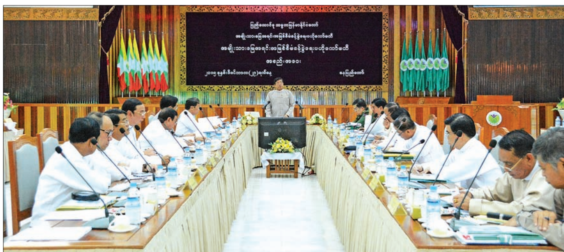
Vice President U Nyan Tun addresses meeting of National Land Resources Management Central Committee.

The government has been cooperating with the USAID, the EU and the SDC of Switzerland to produce a land use classification map and the One Map My-