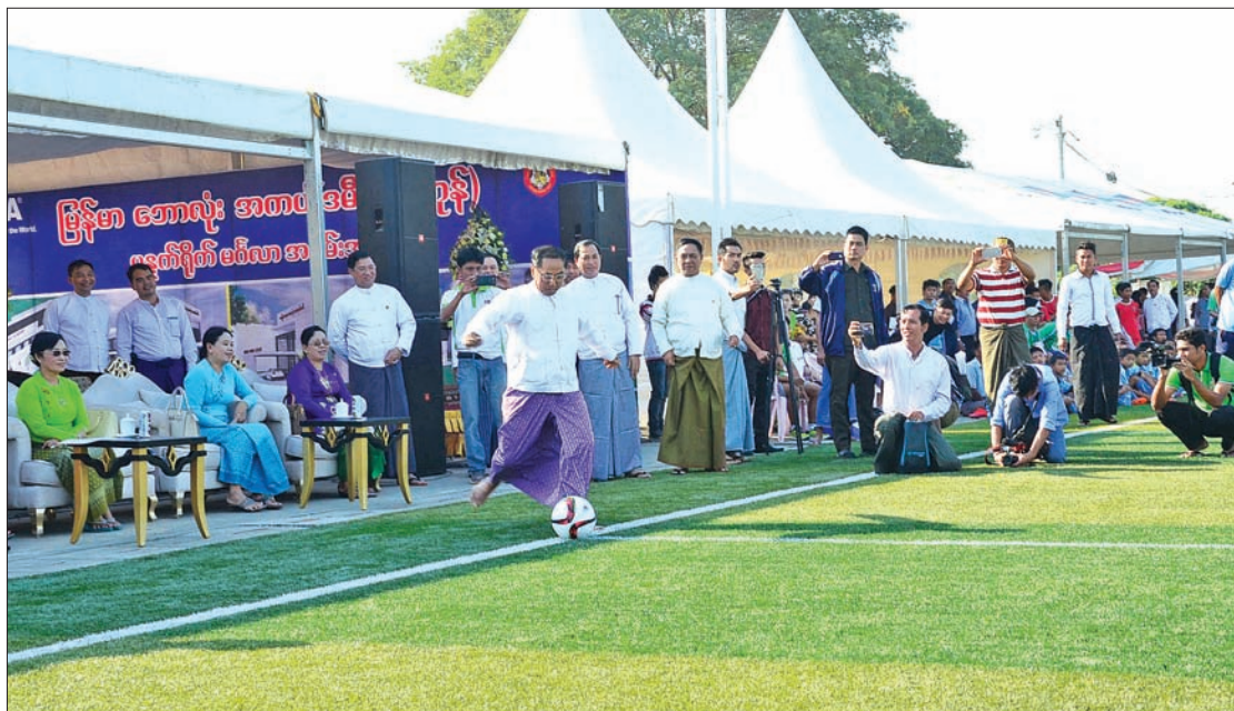
Yangon Region Chief Minister U Myint Swe kicks off the ball at the opening ceremony of MFF U-14 Boys 100 Plus Super Cup 2015 tournament at Thuwunna Football Stadium on 29 December.

MYANMAR Football Federation held a ground-breaking ceremony yesterday to build a football academy at Thuwunna Football Stadium, Thingangyun Township in Yangon.