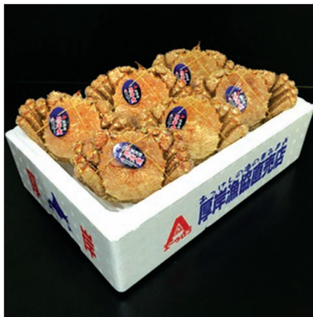
Crabs taken from seas off Akkeshi, Hokkaido Prefecture, that are exported by the Akkeshi fisheries cooperative.

Beginning last year, Yamato signed agreements with Miyazaki, Kumamoto, Ehime and Aomori prefectures to help the local gov-