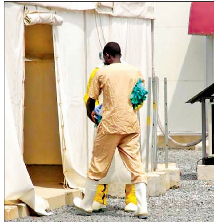
A health worker enters a tent in an Ebola virus treatment centre in Conakry, Guinea, on 17 November.

Ebola has orphaned about 6,200 children in Guinea, said Rene Migliani, an official at the national coordination center for the fight against Ebola.