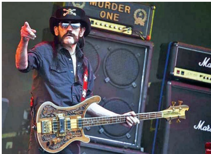
Ian Fraser "Lemmy" Kilmister of Motorhead performs on the Pyramid stage during the Glastonbury Festival at Worthy Farm in Somerset, Britain, on 26 June 2015.

"We cannot begin to express our shock and sadness, there aren't words," Motorhead said in its Facebook posting about Lemmy's death. "We will say more in the coming days, but for now, please...play Motörhead