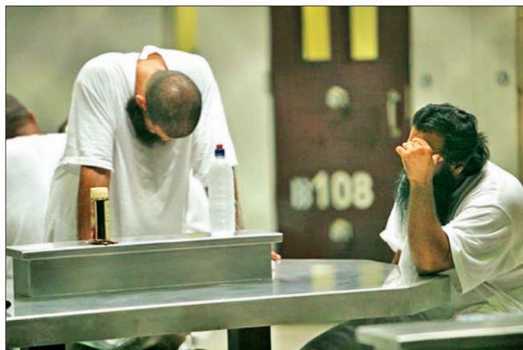
Detainees are seen inside the Camp 6 detention facility at Guantanamo Bay US Naval Base in Cuba in 2009.

Partly as a result of the Pentagon's maneuvers, it is increasingly doubtful that Obama will fulfill a pledge he made in the 2008 presidential election: to close the detention center at the US Naval Base at Guantanamo Bay, Cuba. Obama criticized President George W. Bush for having set up the prison for foreigners seized in the "War on Terror" after the 11 September, 2001, attacks on the US, and then keeping them there for years without trial.—Reuters