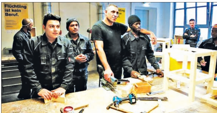
Refugees pose for a picture as they take part in a workshop organized by the Arrivo Berlin initiative to receive new professional skills, in Berlin, Germany, on 17 December.

The paper said actual costs would probably be even higher because the regional finance ministries had based their budgets on an estimate from the federal government that 800,000 refugees would come to Germany in 2015. In fact, 965,000 asylum seekers had already arrived by the end of November.—Reuters