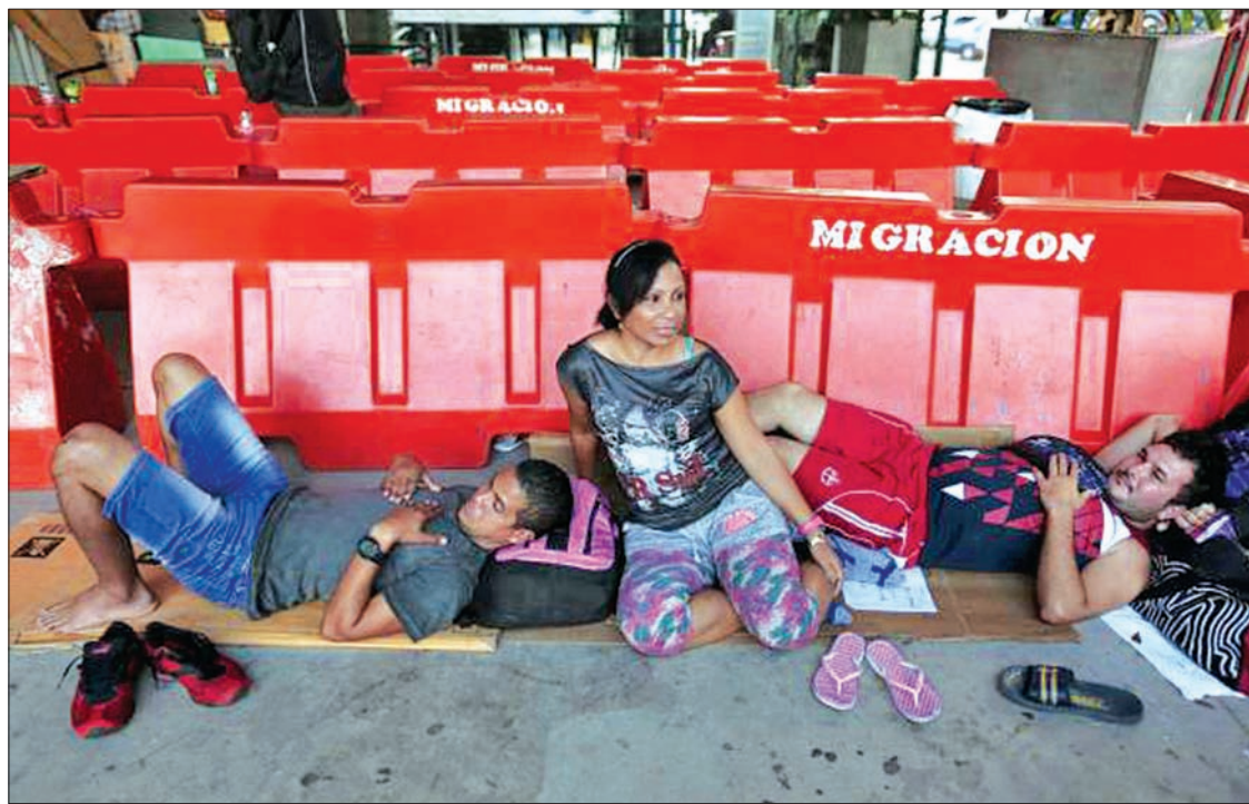
Cuban migrants rests at a temporary shelter in the border between Costa Rica and Nicaragua in Penas Blancas, Costa Rica, on 24 December.

It was not immediately clear how the migrants' travel will be paid for, but diplomats are ex-