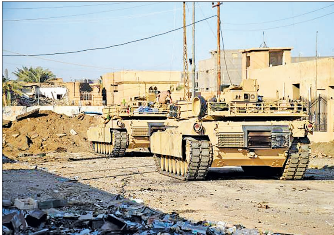
Tanks are seen in the city of Ramadi, on 28 December.

The army's apparent capture of Ramadi, capital of Anbar Province in the Euphrates River valley west of Baghdad, marks a major milestone for US-trained forces who crumbled when Islamic State fighters charged into Iraq in June 2014. In previous battles since then, Iraq's armed forces operated mainly in a support-