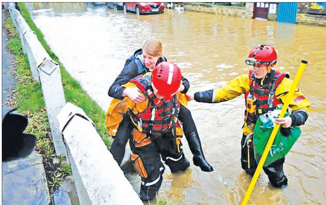
Members of the emergency services rescue a woman from a flooded property in York City Centre, in northern England, on 28 December.

But nine severe flood warnings, which indicate a danger to life, remained in place, and further rain was expected on Wednesday on already saturated ground, the government said. Regional power supplier Electricity North West said it had restored supplies to 24,750 homes since Saturday, but around 1,200 customers in the northwestern city of Manchester were still cut off.—Reuters