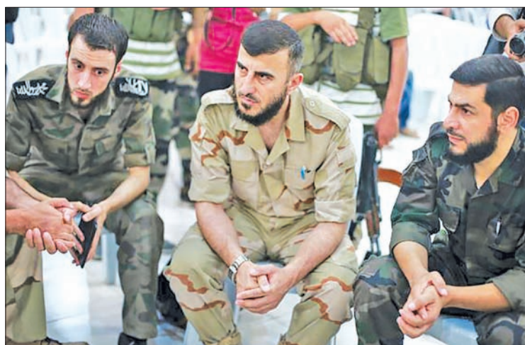
Zahran Alloush (C), commander of Jaysh al-Islam, sits during a conference in the town of Douma, eastern Ghouta in Damascus, Syria, in 2014.