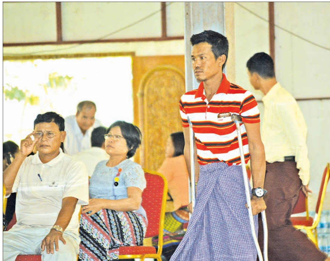
Rules and regulations are not coming yet despite a period of 180 days is over following the promulgation of the Disable Rights Law, Myanmar Council of Persons with Disabilities says.

In Myanmar, an individual with a disability is defined as a person who has a physical or mental impairment.