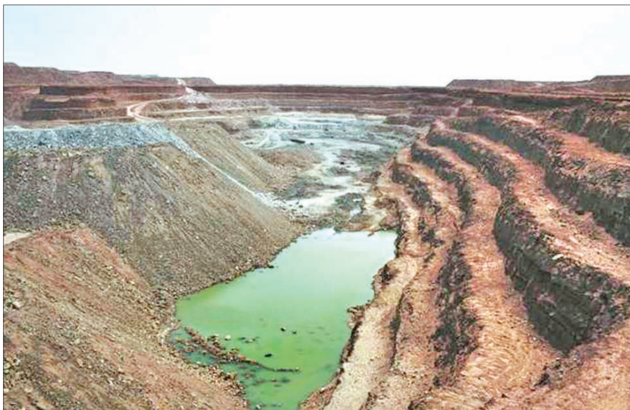
The Tamgak open air uranium mine is seen at Areva's Somair uranium mining facility in Arlit.

duce its dependence on polluting coal — plans to build six to eight nuclear power plants a year for the next five years, and India aims to generate 25 per cent of its electricity from nuclear by 2050, up from 4 per cent in 2013.