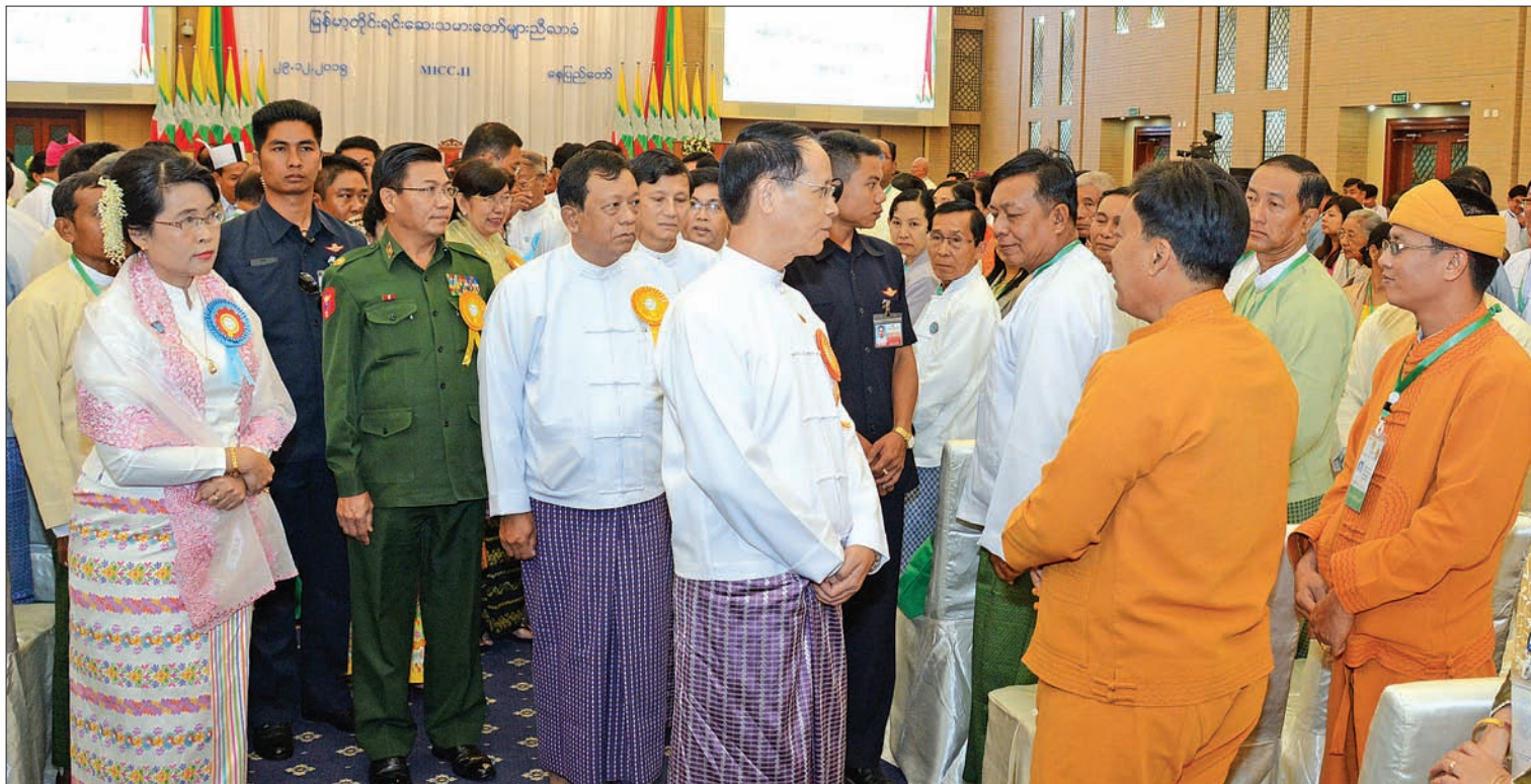
Vice President Dr Sai Mauk Kham meets practitioners at 16 th Myanmar Traditional Medicine Practitioners Conference.

The pros and cons of their therapies are to be put on record and these records need to be systematically compiled so as to disclose the findings with firm evi-