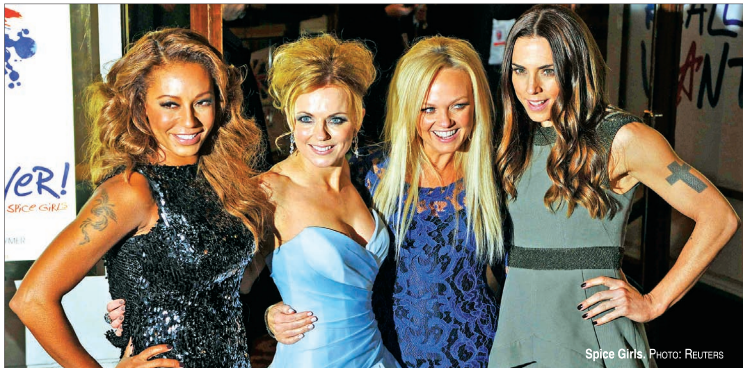
Spice Girls.

The Spice Girls' last reunion tour happened in 2007, and they last performed together at the closing ceremony of the 2012 Summer Olympics.—PTI