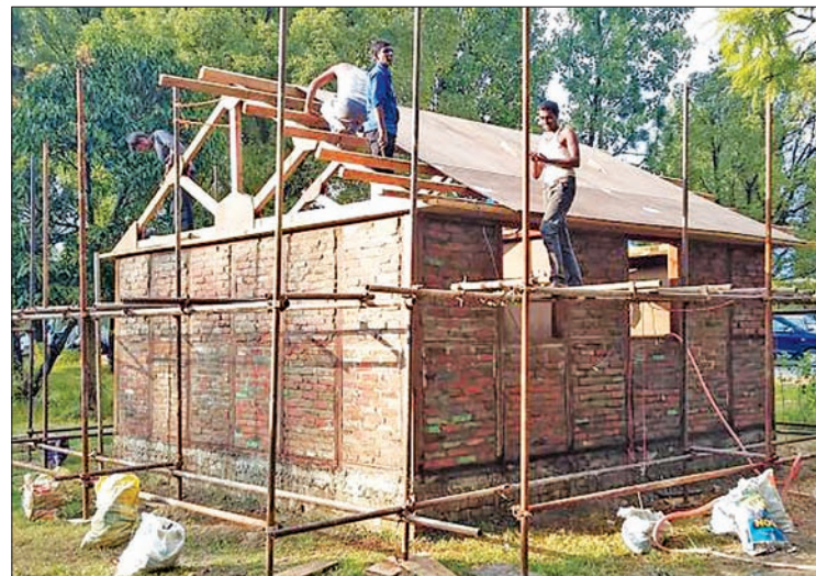
Construction workers make the final touches to a prototype house of the Nepal House Project designed by Japanese architect Shigeru Ban in Kathmandu on 15 October.

While Ban said he enjoys working on grand projects commissioned by privileged people,