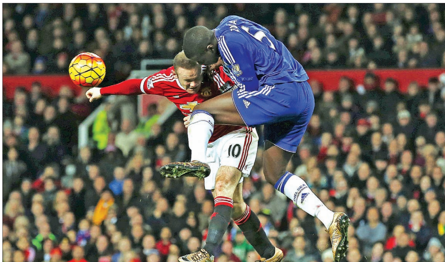
Chelsea's Kurt Zouma and Manchester Wayne Rooney during Barclays Premier League at Old Trafford on 28 December.

Aston Villa's miserable season continued with the bottom club, marooned on eight points, going down 2-0 at Norwich City. Crystal Palace and Swansea City drew 0-0.—Reuters