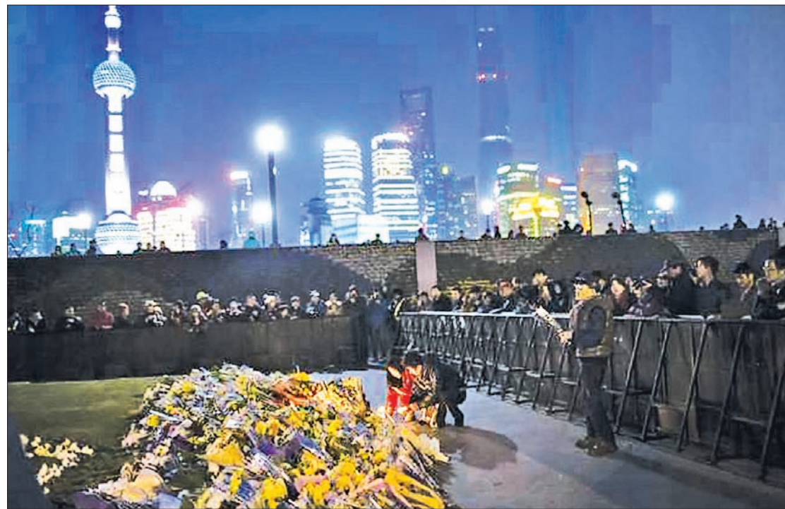
People offer prayers during a memorial ceremony for people who were killed in a stampede incident during a New Year’s celebration on the Bund, in Shanghai on 2 January 2015.

SHANGHAI — Authorities in the Chinese city of Shanghai have opted not to organise New Year celebrations the historic riverfront Bund this week, a year after a stampede killed 36 people.