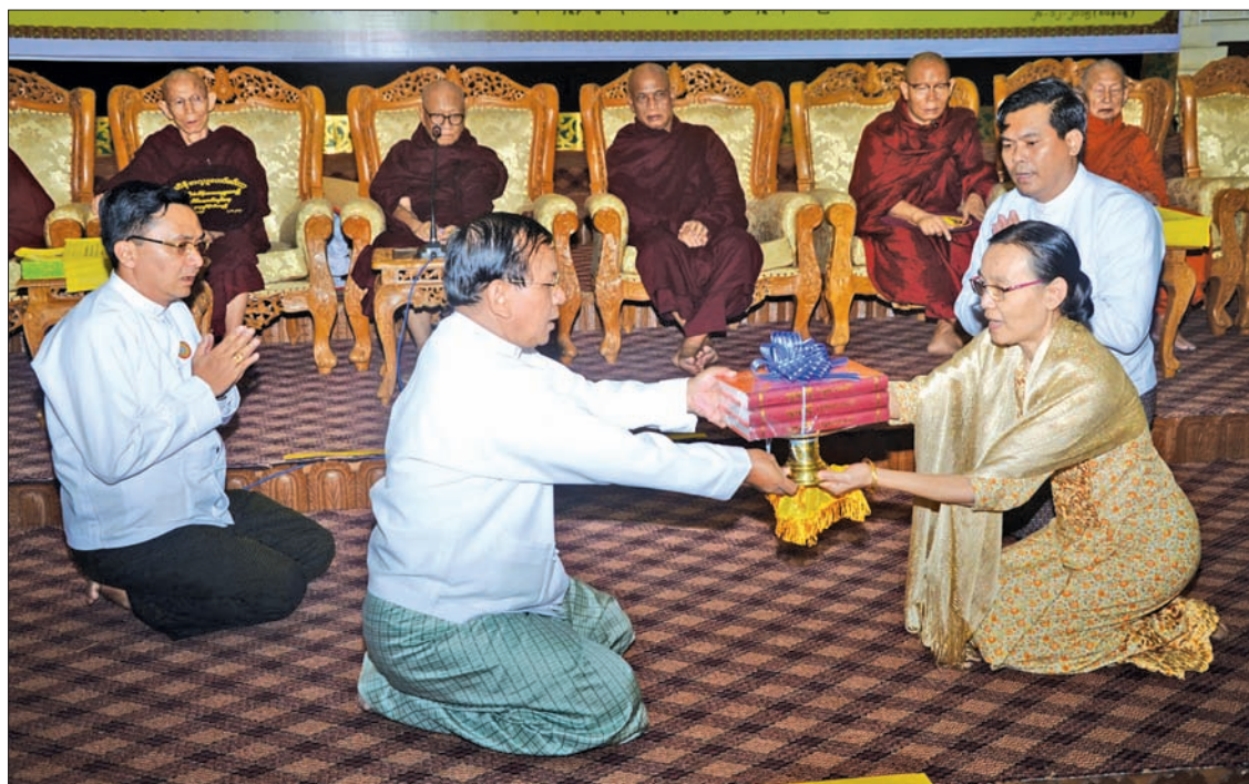
Union Minister for Religious Affairs U Soe Win receives pitaka canon texts donated by wellwishers.

THE holders of the bachelor's, master's and doctorate's degrees should not be complacent with the graduate studies. They ought to be well-versed in pali, atthakatha and tikas because repetitive recitation or reading of Buddha's teachings can make the recitalist or reader worth receiving homage.