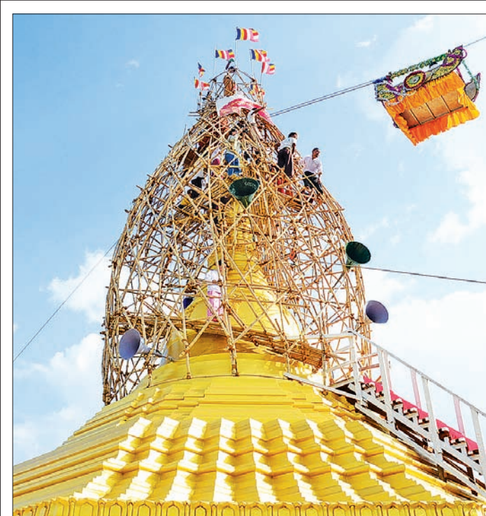
A golden umbrella is being hoisted atop historic Issa Punna (Lotaya) Pagoda in Mingaladon on 26 December 2015. Yangon Region Chief Minister U Myint Swe and devotees attended the ceremony and donated alms to Members of Sangha to mark the ceremony.

Many shops were opened, and free entertainment shows were staged for visitors from far and near, at the pagoda festival.—Ye Thura Aung