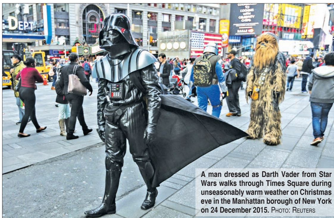
A man dressed as Darth Vader from Star Wars walks through Times Square during unseasonably warm weather on Christmas eve in the Manhattan borough of New York on 24 December 2015.

which stars Daisy Ridley, John Boyega, Oscar Isaac, Adam Driver and Harrison Ford, could earn USD 35 million-USD 47 million on Christmas Day, which would