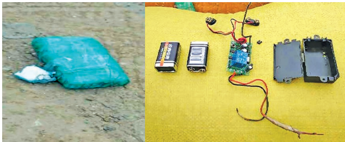
A pack of gun-powder sealed in green tape and accessories of improvised mine.

The police assumed that the blast was a time bomb attack and are conducting a probe into the accident. — Myanma News Agency