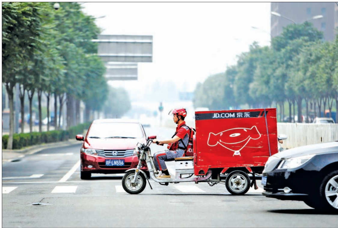
Richard Liu, CEO and founder of China's e-commerce company JD.com, crosses a street on an electric tricycle as he delivers goods for customers to celebrate the anniversary of the founding of the company, in Beijing.

SHANGHAI — Alibaba Group Holding Ltd has agreed to invest $1.25 billion in Chinese online food delivery service Ele.me, leading business weekly Caixin reported on Friday.