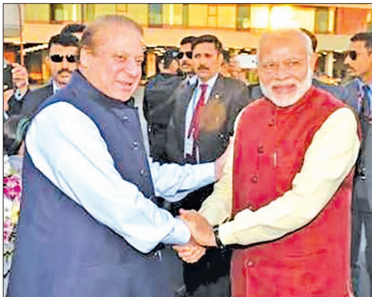
Pakistani Prime Minister Nawaz Sharif shakes hands with his Indian counterpart Narendra Modi after his arrival in Lahore, Pakistan, on 25 December.

A spokesman at Sharif's office earlier told Reuters the two