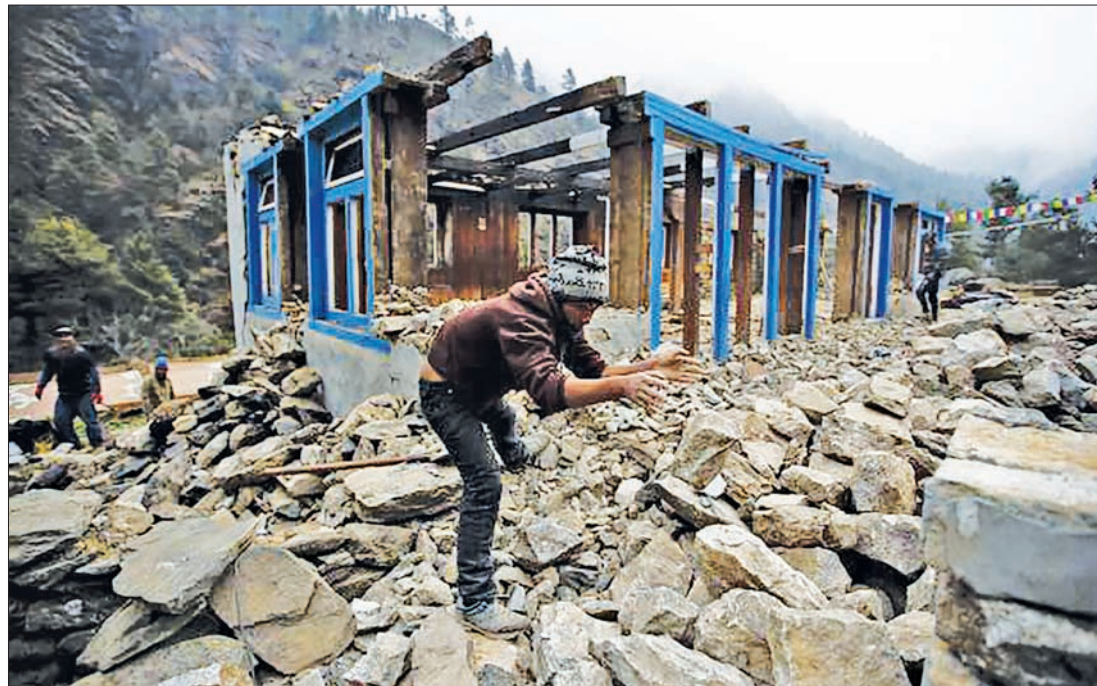
A man clears debris to rebuild a damaged lodge after the earthquake earlier this year in Solukhumbu district, also known as the Everest region, in November 2015.