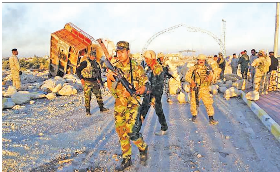
Iraqi security forces gather to advance towards the centre of Ramadi city, on 25 December.