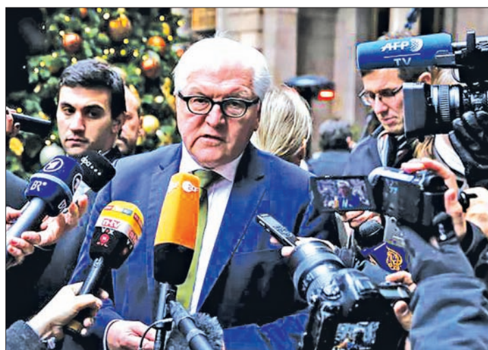
German Foreign Minister Frank-Walter Steinmeier speaks to reporters following a meeting of Foreign Ministers about the situation in Syria in the Manhattan borough of New York in December 2015.

“However, irrespective of this, it is important that we have more control again over who is