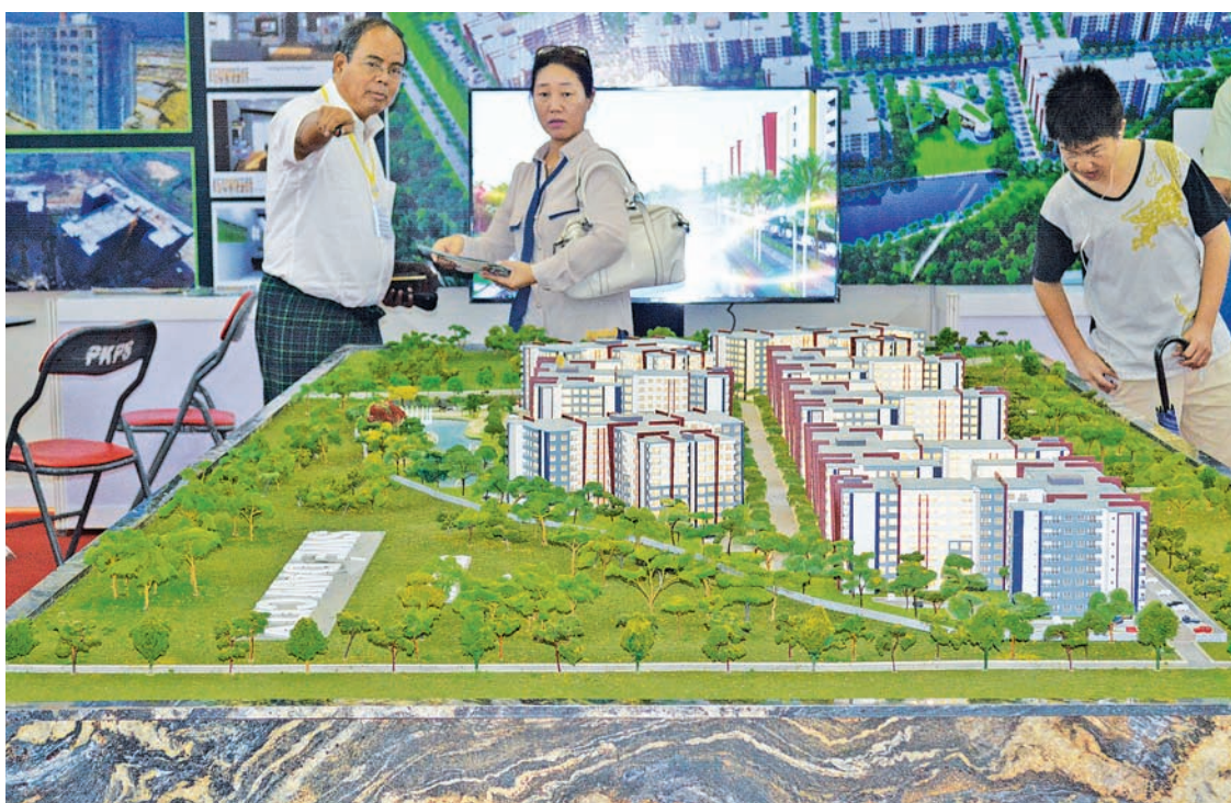
Expo visitors examine a housing display at a property expo in Yangon yesterday.

of the country’s property market, real estate companies have gathered at a three-day property expo set to run until today in