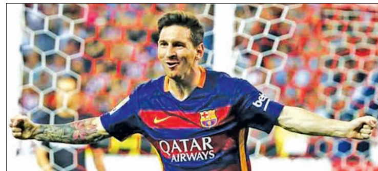
Leo Messi.

MADRID — Spanish paper Marca has released a top 10 players of 2015 list on Friday with Leo Messi being placed first and Cristiano Ronaldo 8 th .