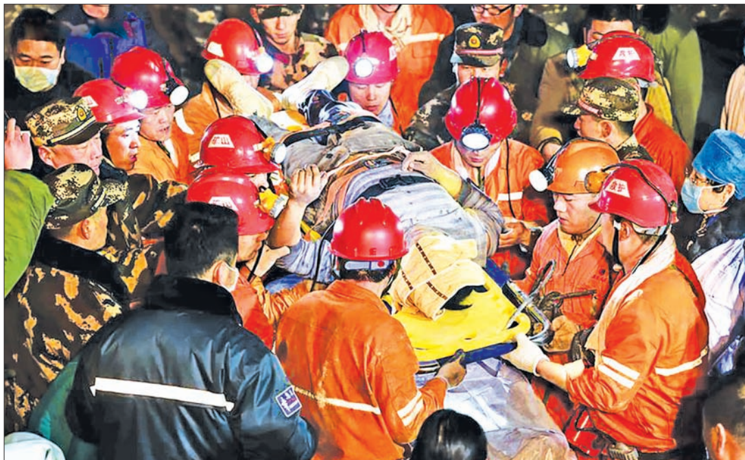
A trapped miner is rescued from a collapsed gypsum mine in Pingyi County, east China's Shandong Province, on 25 December.

The shock affected local rail service, with 10 freight trains halted and eight passenger trains delayed on Friday morning. All trains had resumed service by 12:15pm, the Jinan Railway Bureau said.—Xinhua