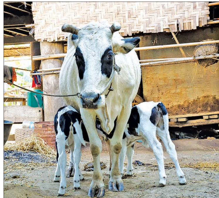
Cow gave birth to twins.

The twins, one male and one female, are in good health.— Thant Maung