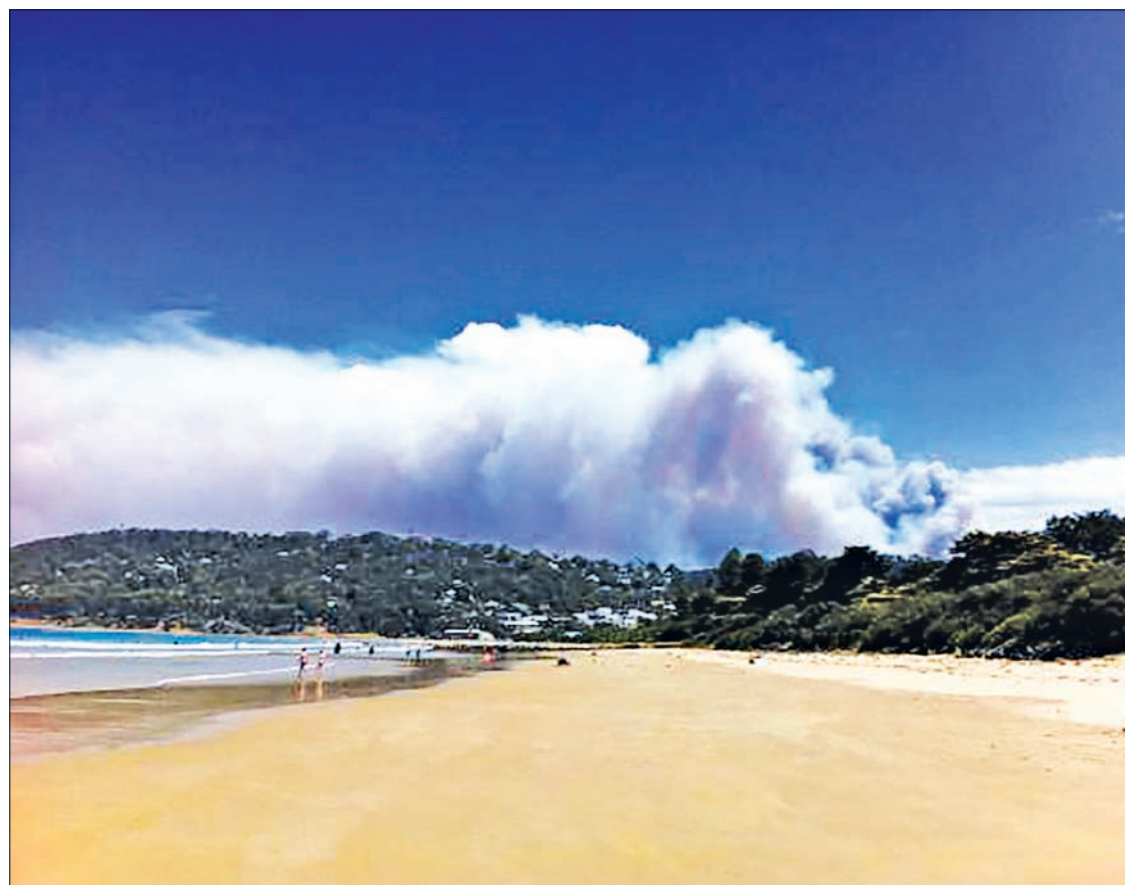
Smoke rises from a fast-moving bushfire near the Great Ocean Road in Victoria, Australia, on 25 December.