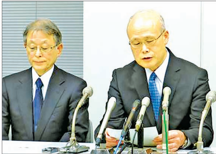
Matsuo Nagata (R), head of the Chiba Cancer Centre, at a press conference on 25 December.

CHIBA — A public hospital in Chiba Prefecture said Friday it removed the right breast of a female patient in her 30s by mistake based on data belonging to a