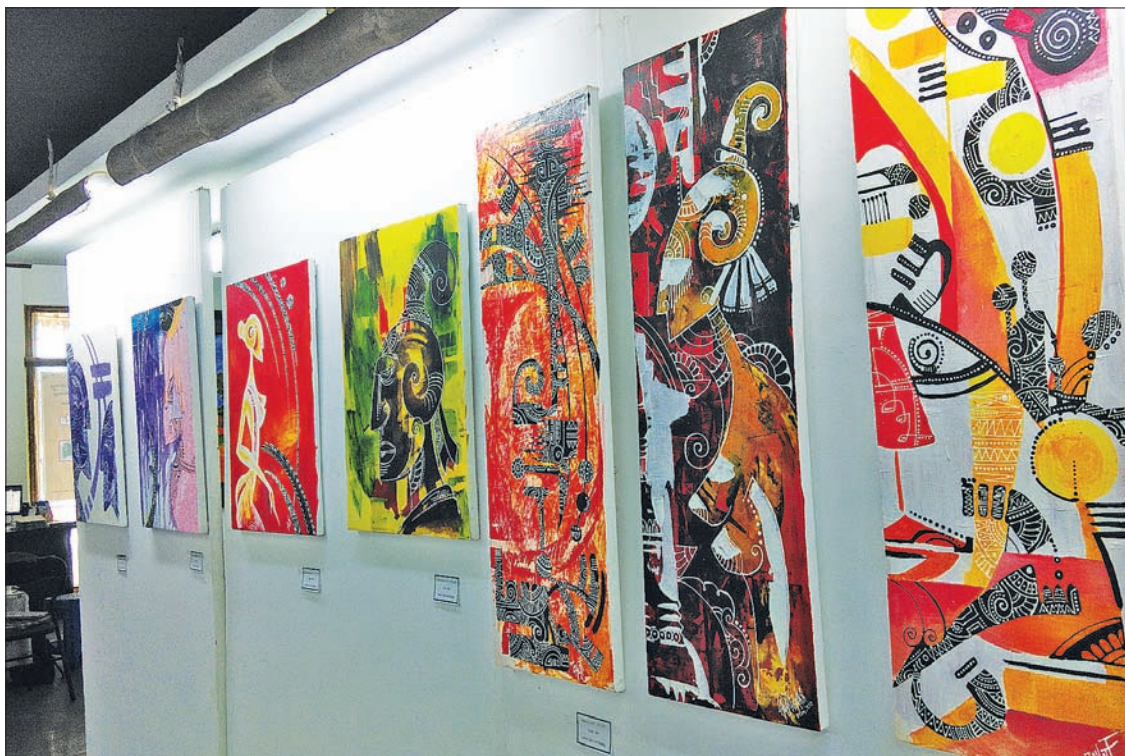
Contemporary works being displayed at River Ayeyawady Gallery.

River Ayeyawady Gallery is located on 35th Street (Middle Block) in Kyauktada Township in downtown Yangon. The gallery will host a group event next month, according to the gallery founder.