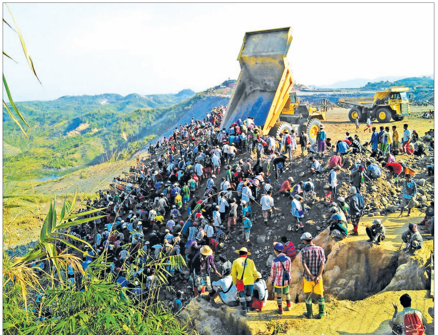
File photo shows migrant workers searching jade stones from discarded soil in Hpakant.

To prevent landslides, local authorities have suggested that migrant miners squatting in at-risk areas relocate to safer areas and that mining companies dump their waste soil in accordance with technical safety rules.