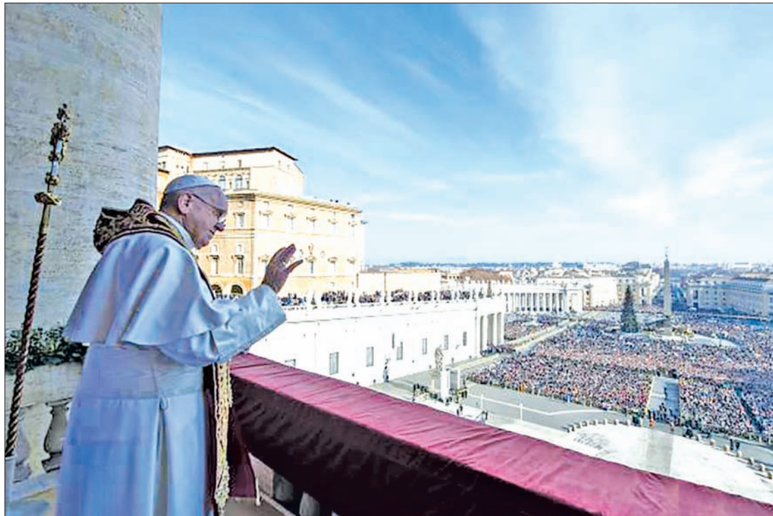
Pope Francis waves during the 'Urbi et Orbi' (to the City and the World) Christmas message from the balcony overlooking St. Peter's Square at the Vatican, on 25 December.

VATICAN CITY — Pope Francis urged the world in his Christmas message on Friday to unite to end atrocities by Islamist militants that he said were causing immense suffering in many countries.