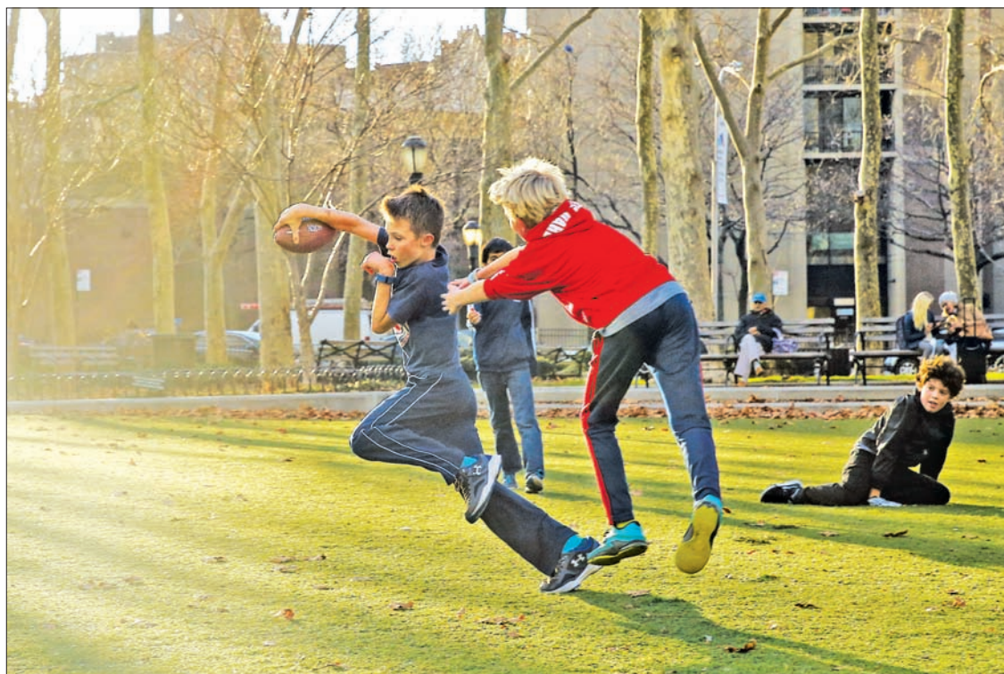
Young boys play in a park during an unusually warm winter day in Brooklyn, New York.

But even as soggy conditions in the South begin to abate, a powerful winter storm was forming across the southern Rockies and Plains, threatening blizzard conditions for parts of New Mexico, Texas and Oklahoma on Saturday,