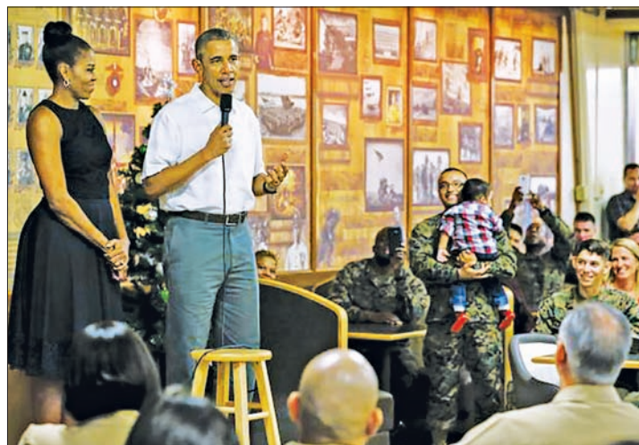
US President Barack Obama, with first lady Michelle Obama, delivers remarks at a Christmas reception with service members at Marine Corps Base Hawaii in Kaneohe Bay, Hawaii, on 25 December.