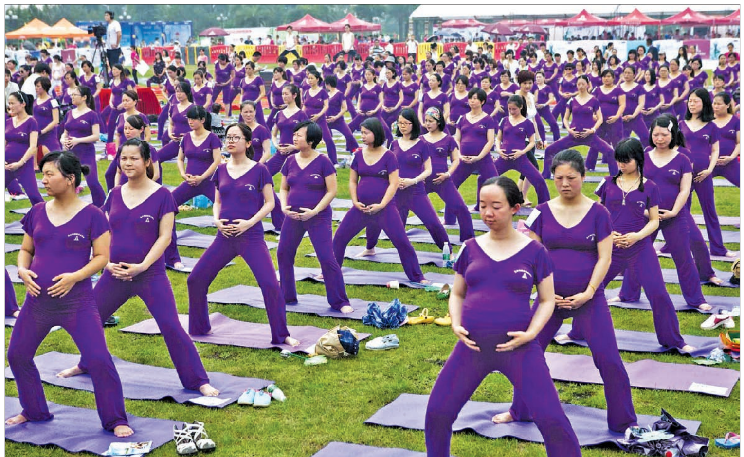
Pregnant women practice yoga as they attempt to break the Guinness World Record for the largest prenatal yoga class, in Changsha, Hunan Province in 2014.

"I encourage pregnant women to seek out studios that offer specialised prenatal yoga classes that are taught by teachers who have prenatal yoga training," Curtis said by email. —Reuters