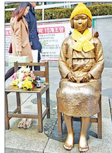
A statue of a girl symbolising the issue of "comfort women" in front of the Japanese Embassy in Seoul.

It remains uncertain whether the South Korean government can convince the civic group to accept the statue's relocation. The body demands that the Japanese government offer an apology and compensation to Korean former comfort women. — Kyodo News