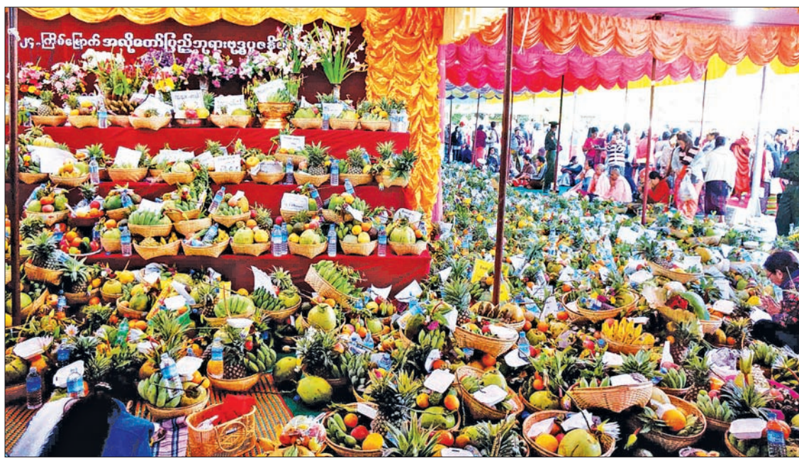
Traditional offertories are seen at Buddha Pujaniya event at Alotawpyae Pagoda.

THE Alotawpyae Pagoda in Bagan in Mandalay Region is holding its 24 th annual pagoda festival from 19 December to 9 January.