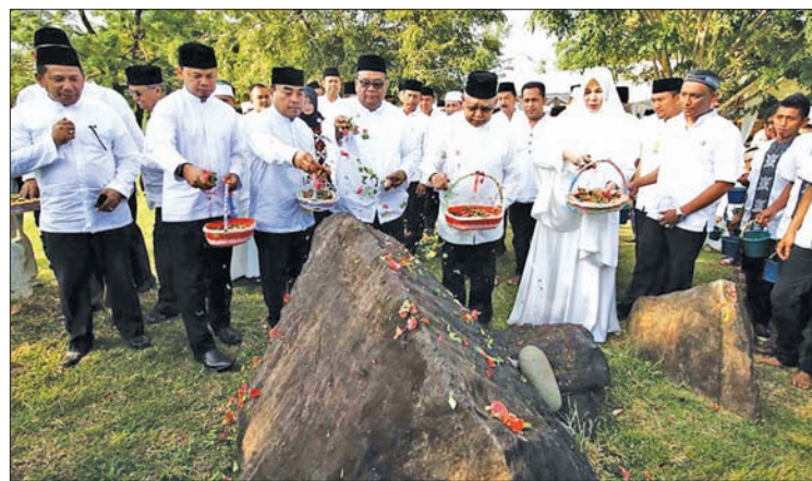
People strew flowers over a grave at a mass graveyard where thousands of the 2004 tsunami victims are buried during the commemoration of the 11th anniversary of the devastating tsunami at Uleelheue in Aceh, Indonesia, on 26 December 2015.

PHUKET — A Japanese group held a remembrance event for the deadly 2004 Indian Ocean tsunami disaster yesterday in the southern Thai province of Phuket.