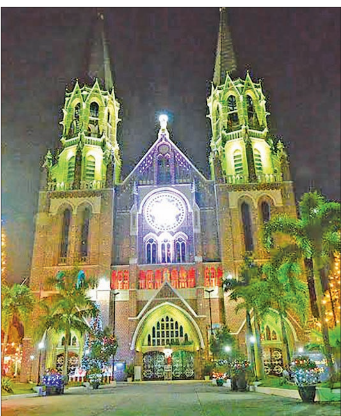
A church in Yangon decorated with lights for Christmas Festival.