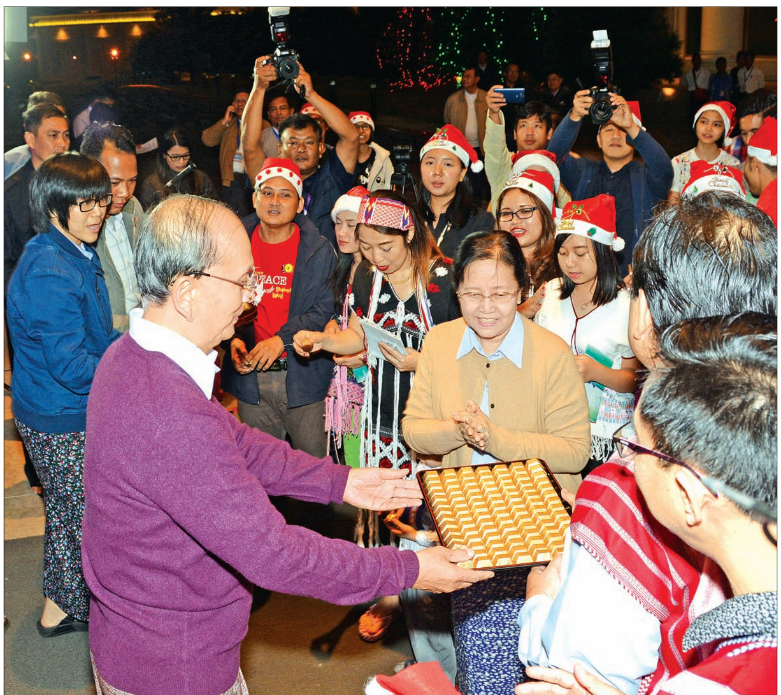
President U Thein Sein exchanges gifts with Christian youths.

The president and his family greeted the band warmly and presented gifts to them before posing for documentary photographs.