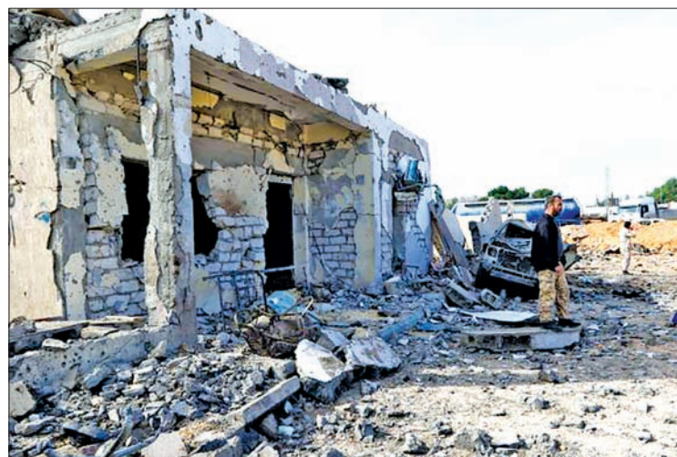
General view of damage at the scene of an explosion at the Mislattah checkpoint near Khoms, on the coast road between Tripoli and Misrata Libya in November 2015.

The resolution said the council welcomed the formation of the so-called Presidency Council in Libya