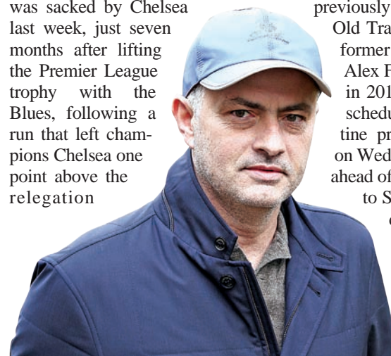
Former Chelsea soccer club manager Jose Mourinho walks near his home in London, Britain, on 20 December.

Mourinho, who worked with Van Gaal during a successful spell at Barcelona, was previously linked to the Old Trafford job when former United boss Alex Ferguson retired in 2013. Van Gaal is scheduled for a routine press conference on Wednesday evening ahead of Saturday's trip to Stoke City. Two days later the club will host champions Chelsea.