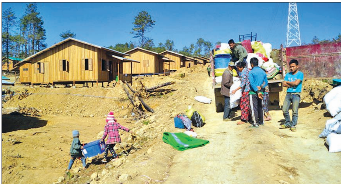
A family arrives at their new home in Haka.

The nationwide death toll from the landslides and floods between June and late August reached 120. Most of the deaths occurred in Rakhine State, where 56 people were killed, followed by 23 in Sagaing and 12 in Mandalay Region, according to data from the Ministry of Social Welfare, Relief and Resettlement.— Haka IPRD