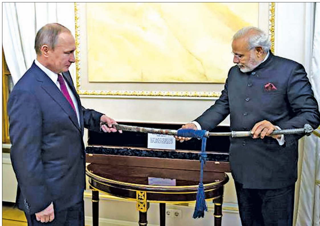
Russia's President Vladimir Putin (L) and India's Prime Minister Narendra Modi exchange presents during a meeting at the Kremlin in Moscow, Russia, on 23 December 2015.

Under the offsets policy, global defence contractors are required to invest a percentage of the value of any deal in India to help it build a defence industrial base and reduce imports for a military that has emerged as the world's biggest buyer of arms in recent years.