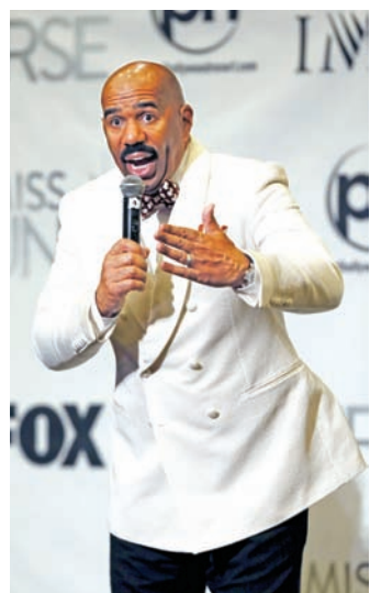
Host Steve Harvey speaks to reporters after the 2015 Miss Universe Pageant in Las Vegas, Nevada, on 20 December.

In a separate interview, one of the 2015 Miss Universe pageant judges, Perez Hilton, said that the idea of Harvey returning to the show was really good for ratings. “I think Steve Harvey should definitely come back,” Perez said. “It would be great for ratings.—PTI