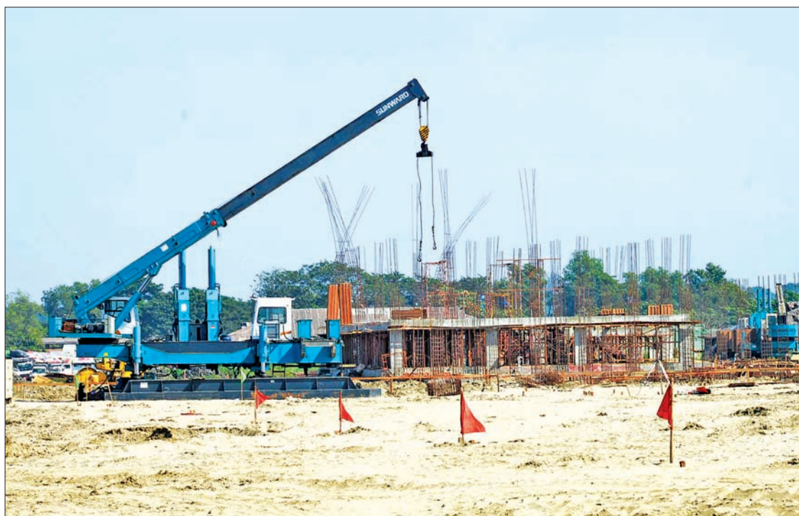
New vegetable and flower market under construction.