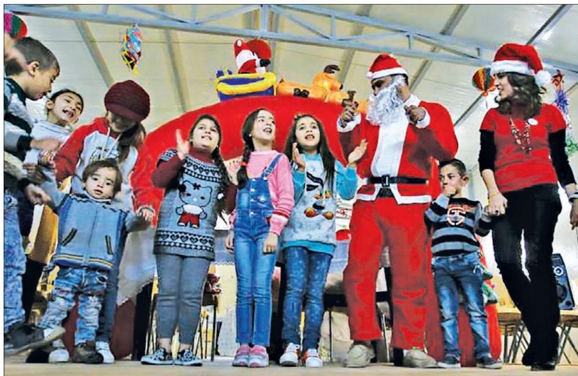
Displaced children who fled Islamic State listen to a Christmas carol service at Zayuna camp in Baghdad on 23 December.

A key figure of Saddam's regime, Tariq Aziz, who was his foreign minister, was a Christian.