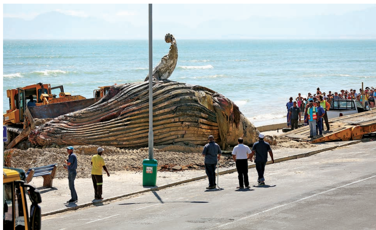
Workers remove the carcass of a whale on Strand Beach, near Cape Town, on 23 December.

CAPE TOWN — A South African beach popular with Christmas holiday-makers has been closed until the carcass of a beached whale is removed amid concerns its blood may attract sharks, the City of Cape Town said on Wednesday.