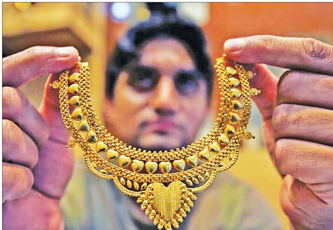
A salesman poses with a gold necklace at a jewellery shop in Jammu on 11 July 2008.

US crude prices rose for a fourth straight session yesterday, after hitting their lowest since early 2009 on Monday. The benchmark is set for a more than 8 per cent weekly gain in the lead-up to Christmas as the US market tightened on falling sup-