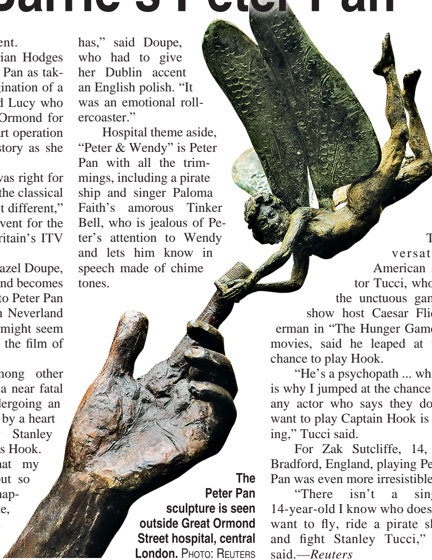
The Peter Pan sculpture is seen outside Great Ormond Street hospital, central London.

Hospital theme aside, “Peter & Wendy” is Peter Pan with all the trimmings, including a pirate ship and singer Paloma Faith’s amorous Tinker Bell, who is jealous of Peter’s attention to Wendy and lets him know in speech made of chime tones.