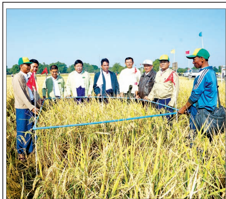
A model plot in Kwatnge Village Tract, Meiktila District, yielded more than 150 baskets of Paletwe paddy strain per acre. Government-appointed farmers harvested the 7-acre model field, which has been planted during the rainy season. PHOTO: CHAN THAR (MEIKTILA)

Solar panels have been used widely in rural areas since 2012 since they were deemed to be more cost effective than using candles and kerosene. The panels also offer obvious benefits for the environment and prevention of fires.— Kyawswa-Magwe