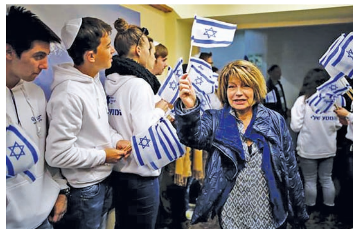
A Jewish immigrant from France arrives for a candle-lighting ceremony to mark the Jewish holiday of Hanukkah, upon landing at Ben Gurion International Airport near Tel Aviv, Israel on 8 December.

JERUSALEM — A record number of French Jews moved to Israel this year, an immigration official said yesterday, citing anti-Semitic violence and economic insecurity in the European country as causes. France has the largest Jewish population in Europe, having grown by nearly half since World War II to some 550,000. The community has been jarred by an increase in security threats and Islamist militant attacks such as January's gun rampage at a Paris kosher market that killed four Jews.