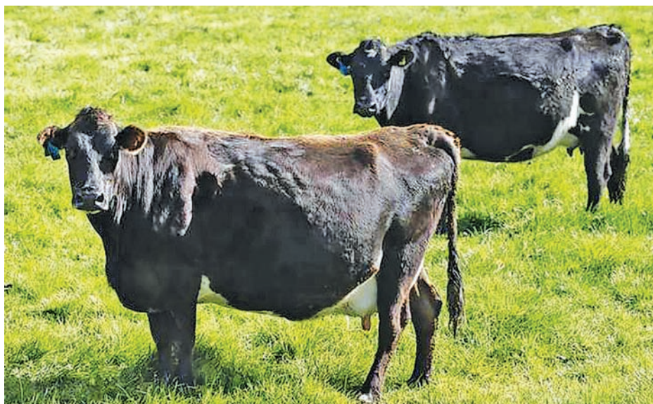
Cows are seen on a pastoral farm near Hamilton in 2013.

"Consumers love New Zealand dairy products and we want to increase that