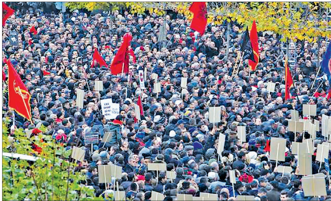
People gather in a peaceful protest called by Kosovo's opposition against the EU-brokered accord between Kosovo and Serbia in the capital Pristina, in November 2015.

PRISTINA — Kosovo's highest court ruled on Wednesday that parts of an European Union-brokered agreement with Serbia violated its constitution, after weeks of violent protests against the deal.