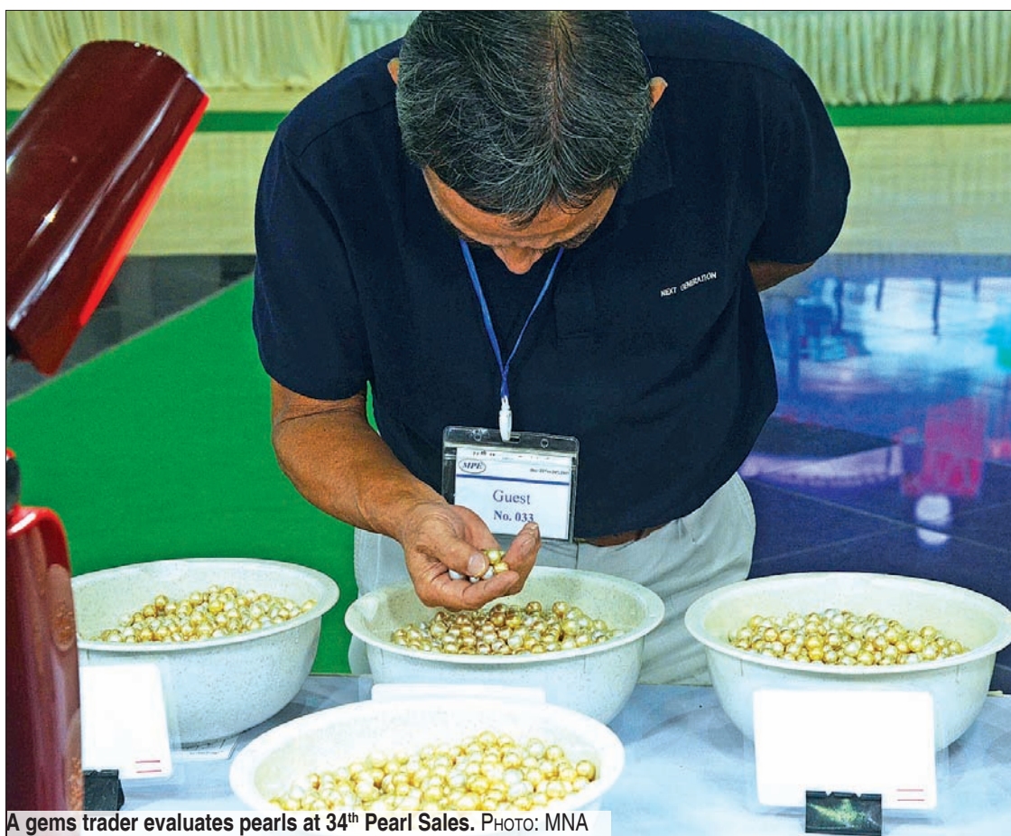
A gems trader evaluates pearls at 34 th Pearl Sales. PHOTO: MNA

More than 120 pearl lots were sold on the last day, and more than 220 pearl lots were sold in an open tender on the second day.— Myanma News Agency