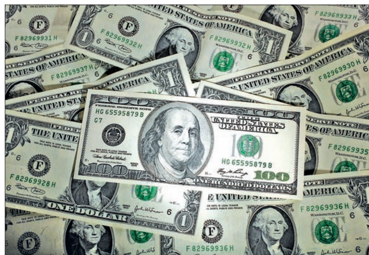
A picture illustration shows a 100 Dollar banknote lying on one Dollar banknotes, in Warsaw, in 2011.

“If US data remains broadly in line with the Fed's expectations, we suspect the USD will be off to a positive start in 2016 as there is plenty of scope for rates markets to price in