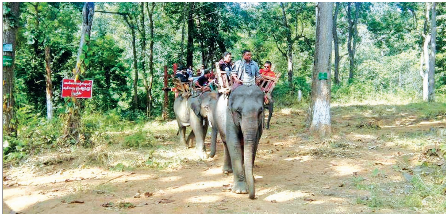
Pilgrims ride elephants on their way to Alaungkawthapa Cave.

THE opening of the Alaungkawthapa pilgrimage season for devotees have been moved forward from the previously announced 23 December, according to an official of the Alaungkawthapa National Park. The much revered Alaungkawthapa religious area with its many pagodas is located in