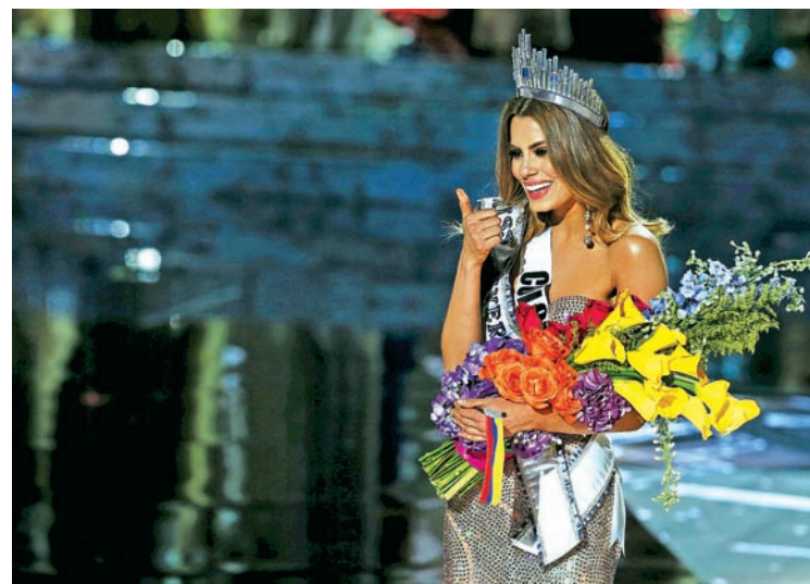
Miss Colombia Ariadna Gutierrez gives a thumbs up after initially being crowned as the winner during the 2015 Miss Universe Pageant in Las Vegas, Nevada on 20 December.

The Colombian beauty, who went through a myriad of emotions before hundreds of thousands of