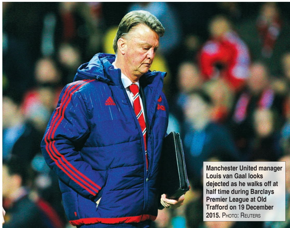
Manchester United manager Louis van Gaal looks dejected as he walks off at half time during Barclays Premier League at Old Trafford on 19 December 2015.

LONDON — Seasonal cheer has been scarce for Louis van Gaal after a six-match winless sequence for his Manchester United side intensified rumours that he will be sacked and Stoke City are unlikely to be offering any solace on Saturday.