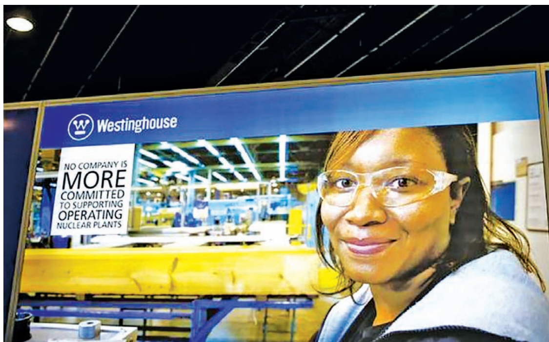
The logo of the American company Westinghouse is pictured at the World Nuclear Exhibition 2014.

Indian officials have been trying to assuage suppliers' con-