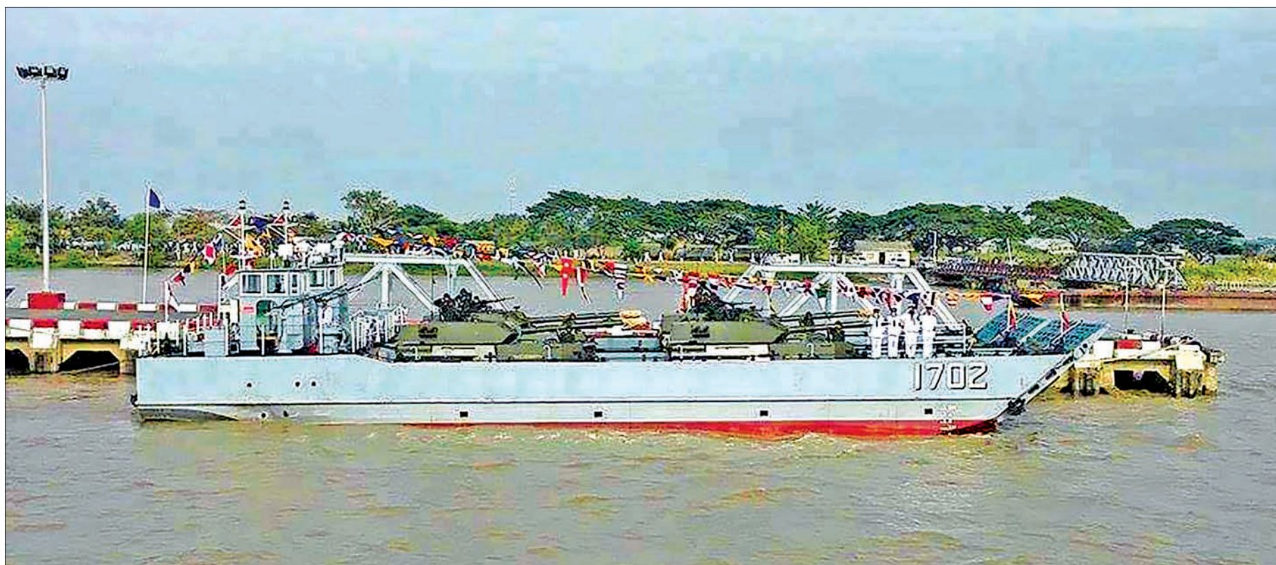
A new naval ship being launched at 68 th Anniversary Defence Services (Navy) Day. (See story page 1)