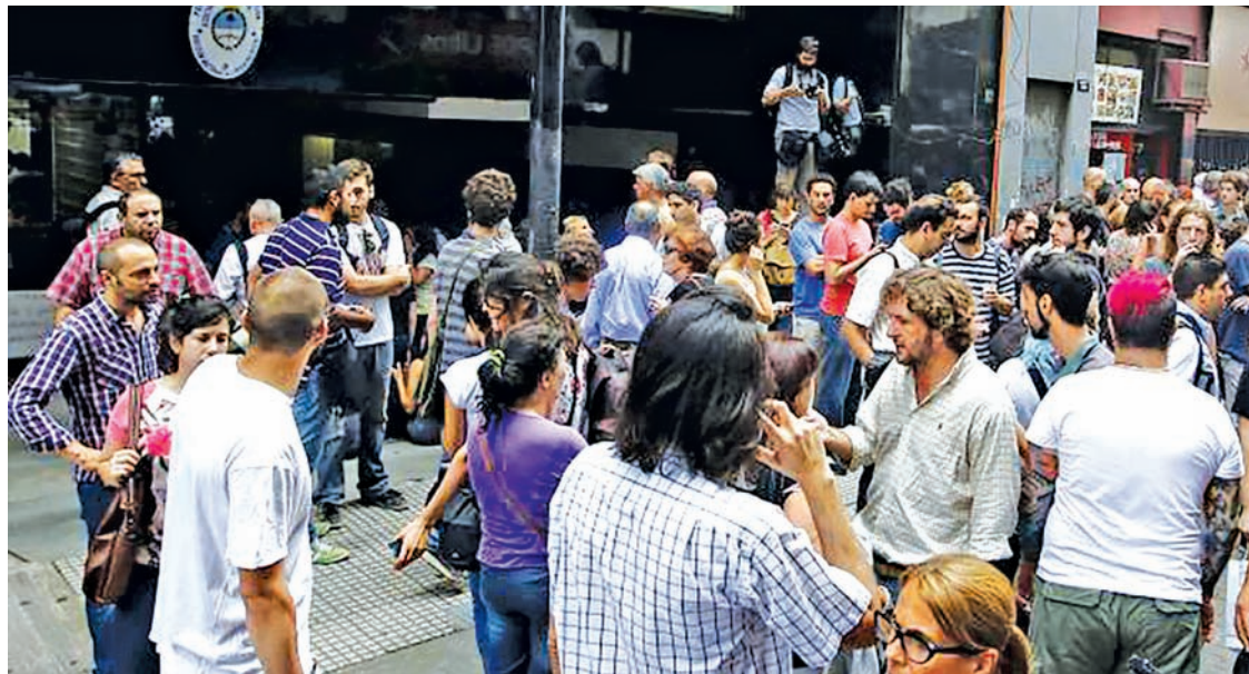
People gather outside the Federal Authority on Audio Visual Communications Services (AFSCA) headquarters in Buenos Aires, on 23 December.