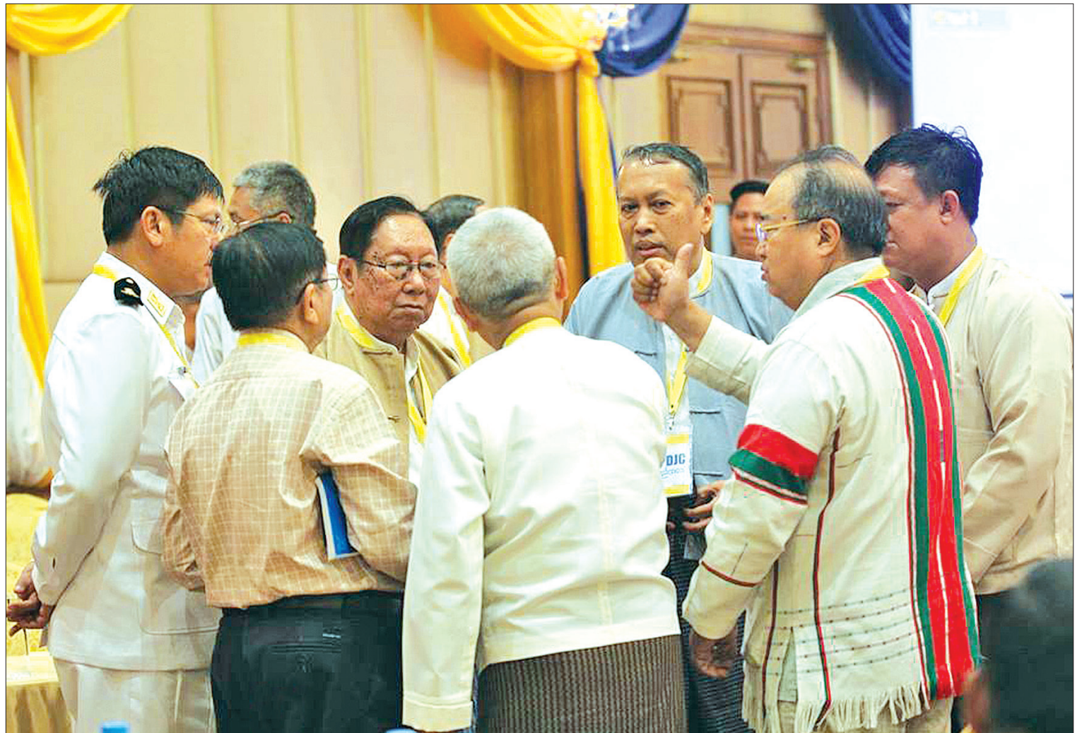
Rear Admiral Myint Nwe and U Hla Maung Shwe are seen together with other attendees to a Union Political Dialogue Joint Committee meeting in Nay Pyi Taw. Both of them will be present at 5 January meeting representing stakeholder groups of the government and Tatmadaw.