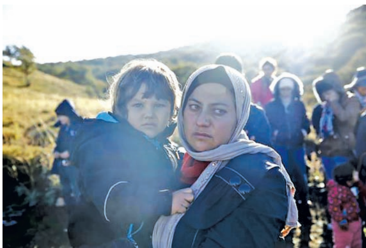
A migrant woman holds a girl after arriving on a boat on the Greek island of Lesbos, in November 2015.

Out of a total of 1,005,504 arrivals to Greece, Bulgaria, Italy, Spain, Malta and Cyprus by 21 December, the vast majority