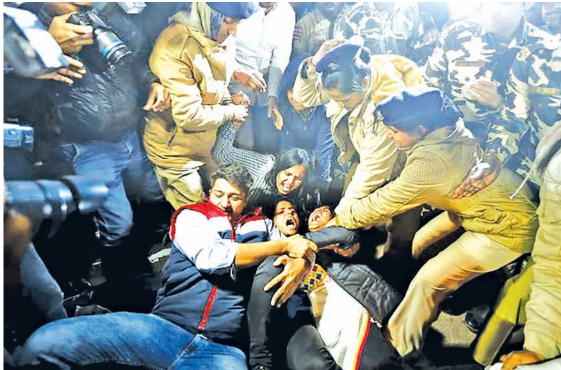
Police detain demonstrators during a protest against the release of a juvenile rape convict, in New Delhi, India, on 20 December.

The Rajya Sabha passed the Juvenile Justice (Care and Protection of Children) Bill by a voice vote, paving the way for lowering the minimum age for a criminal trial to 16 from 18, depending on