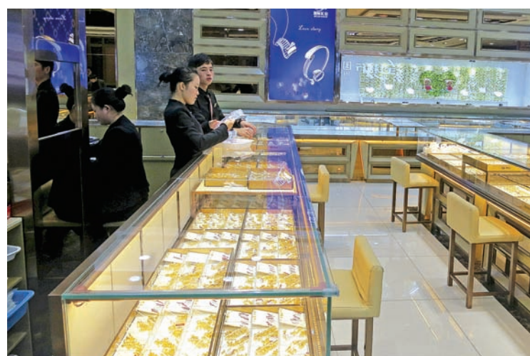
Staff wait for customers inside an empty gold and jewellery store in Shenzhen's Shuibei District, one of China's biggest jewellery retail and production hubs, in the southern Chinese city of Shenzhen on 17 December.