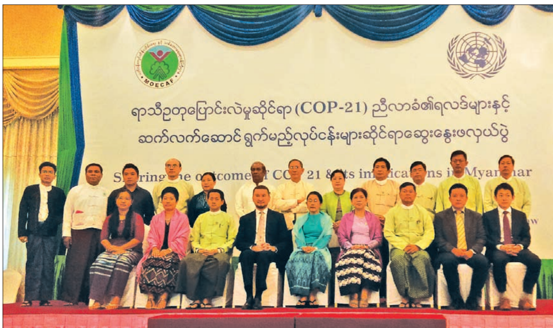
Dignitaries pose for photo at knowledge sharing workshop on the outcome of COP-21 and its implications.

"Climate change represents a major challenge for Myanmar as it is frequently affected by climate-included disasters such as