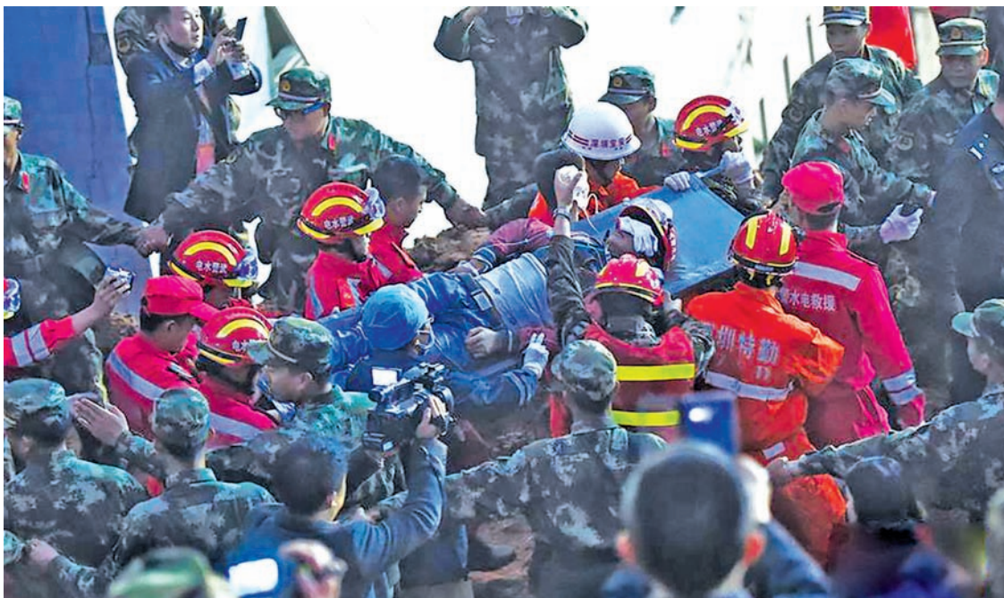
A survivor is found at the site of landslide at an industrial park in Shenzhen, south China's Guangdong Province, on 23 December.

Firefighters had to squeeze into the narrow room in which