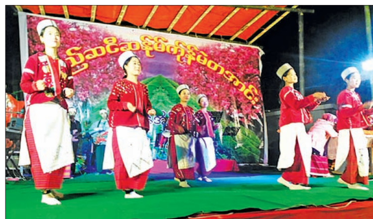
Ta'ang ethnic ladies perform dances at New Year festival.

The Ta'ang National flag was flown at the festival, a traditional orchestra performed at midnight.—Myint Aung