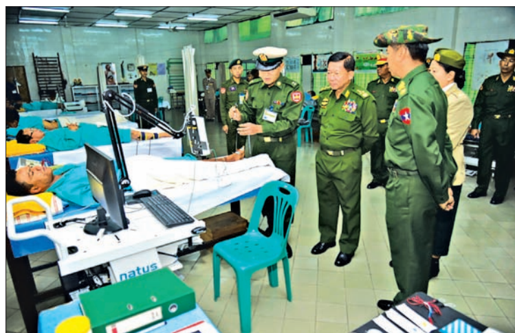
Senior General Min Aung Hlaing stresses importance of nursing and paramedical science for the military operations of every country in his speech at graduation of DSINPS.

THERE is an increased demand for effective medical treatment as the use of weapons of mass destruction in modern warfare has claimed many lives and wounded hundreds of thousands, Senior General Min Aung Hlaing said yesterday at the graduation of the Defence Services Institute of Nursing and Paramedical Science (DSINPS).