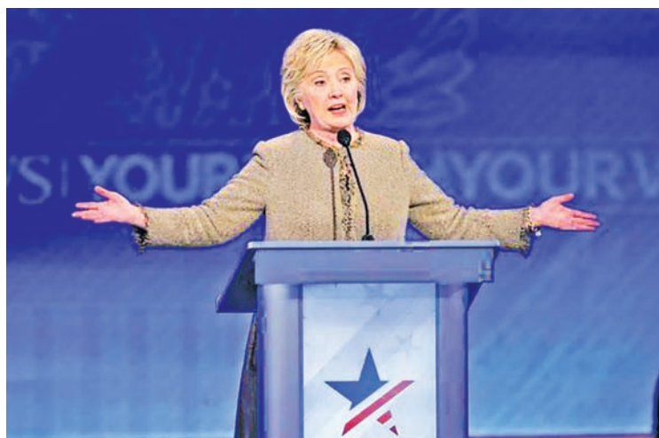
Democratic US presidential candidate Hillary Clinton.