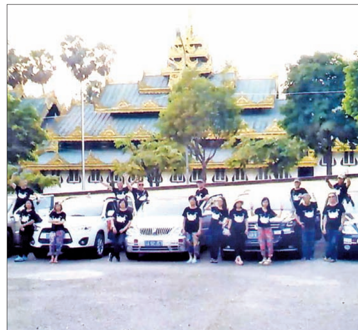
Myanmar has seen an increase in number of tourists taking sightseeing trips by car, motorcycle and bicycle.

They returned to India on 18 December.— Myanma News Agency