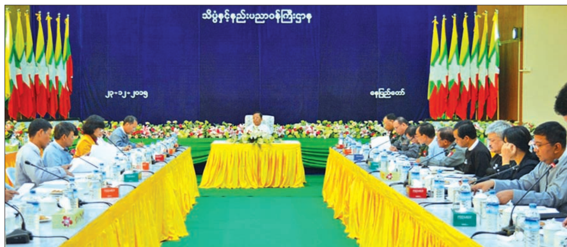
Science and Technology Ministry discuss the Chemical Weapons Convention.

THE Ministry of Science and Technology held a coordination meeting in Nay Pyi Taw yesterday to discuss the process of signing the Chemical Weapons Convention (CWC).