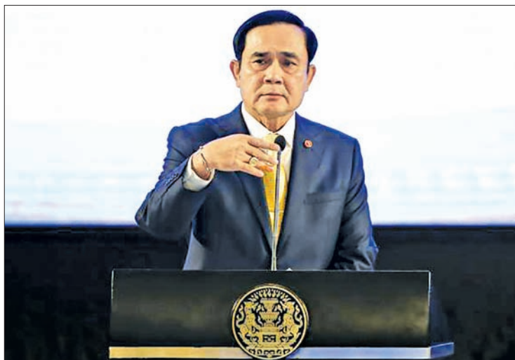
Thailand's Prime Minister Prayuth Chan-ocha addresses the nation and summarises the junta's annual report in Bangkok, Thailand, on 23 December.

coup it is struggling to revive Thailand's export-dependent economy.