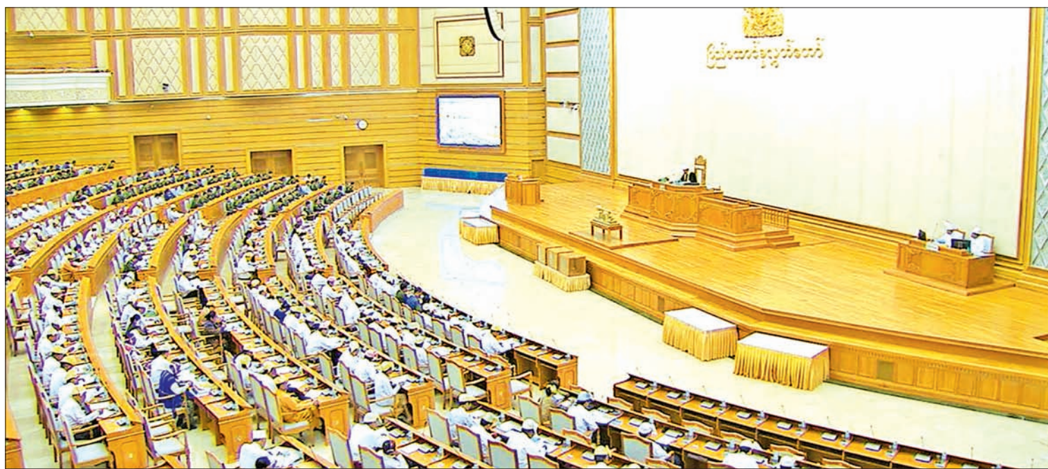
Pyidaungsu Hluttaw being convened in Nay Pyi Taw.

The meeting will resume on 28 December.— Myanma News Agency