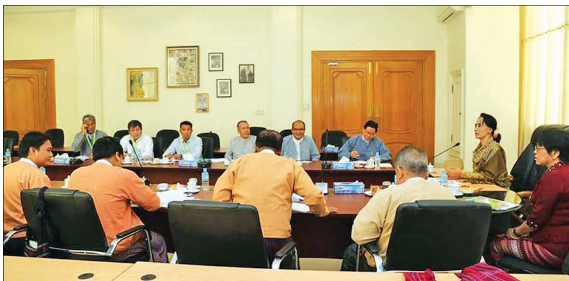
Daw Aung San Suu Kyi, chairperson of the National League for Democracy that won majority in the historic 2015 vote, holds talks on the country's ongoing peace process with Union Minister U Aung Min and Myanmar Peace Centre's officials at her office in Nay Pyi Taw on Wednesday.

DAW Aung San Suu Kyi, chairperson of the National League for Democracy, held talks with Union Minister U Aung Min and party on the country's peace process at her office in Nay Pyi Taw yesterday, NLD Chairperson Facebook posted.