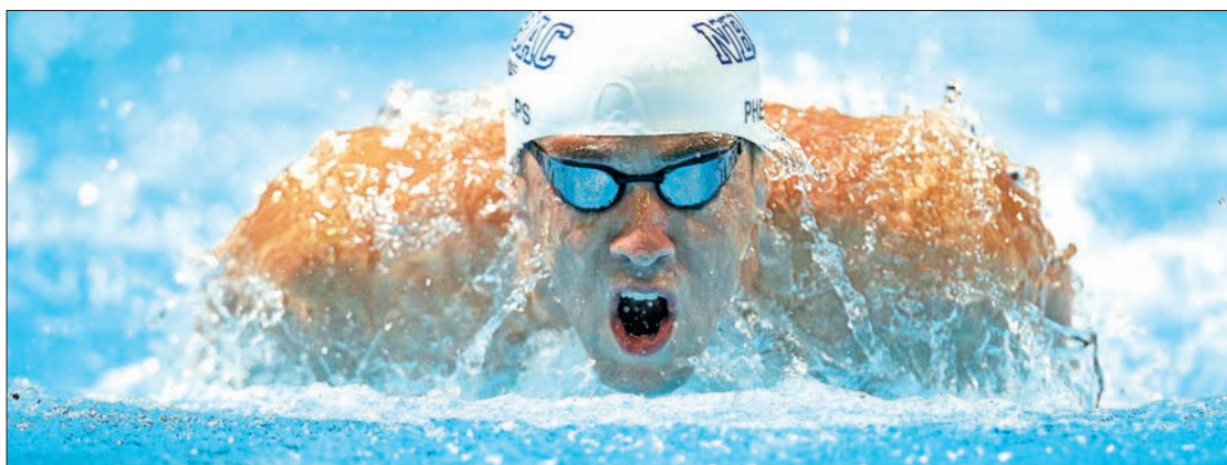
Michael Phelps swims in the men's 200-metre breaststroke final during the Phillips 66 National Championships at Northside Swim Centre, San Antonio, TX, USA, on 10 August 2015.

NEW YORK — For the first time in his career, Michael Phelps is preparing for an Olympics without the support of longtime sponsor Speedo, and is instead wearing a suit designed by Aqua Sphere, a virtual unknown in swim racing that is making its Games debut at Rio de Janeiro next year.