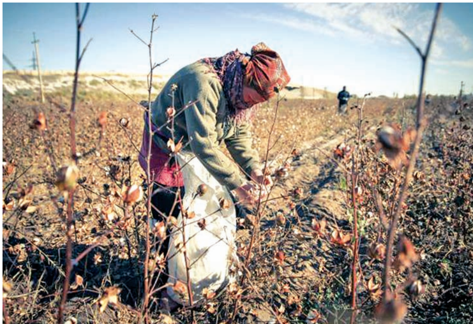
A cotton picker is at work during this year's harvest in Karakalpakstan, Uzbekistan in October 2015.

Persecution of activists is among many abuses cited by witnesses and