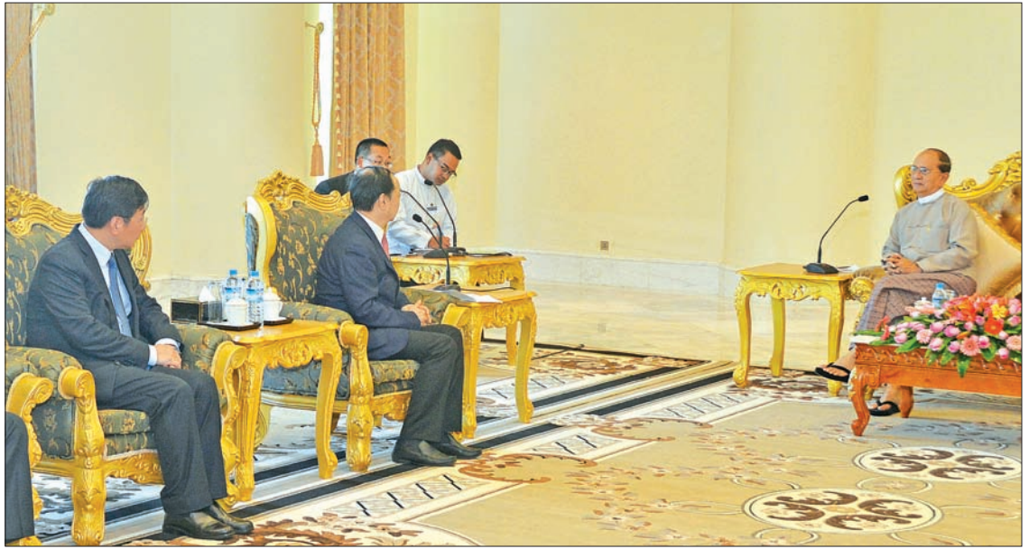
President U Thein Sein receives CITIC delegation from China.