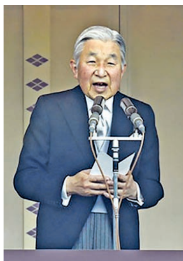
Japanese Emperor Akihito addresses general well-wishers from the balcony at the Chowaden Reception Hall of the Imperial Palace in Tokyo on 23 December 2014, as he turns 82.

The emperor also said he is “beginning to feel my age,” acknowledging that “there were times when I made some mistakes at events,” and he expressed his intention “to minimize such incidents by continuing to do the best