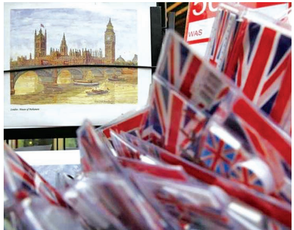
A poster of the houses of Parliament is displayed alongside Union flag souvenirs for sale in London, Britain, on 17 December.

Critics in his party, which has been deeply divided over Europe for decades, say his negotiations are likely to achieve little of