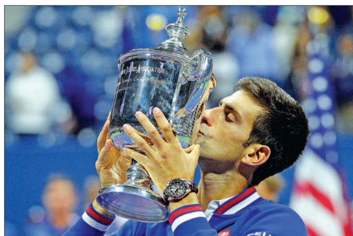
Novak Djokovic.

LONDON — Novak Djokovic and Serena Williams were named men's and women's world champions for 2015 by the International Tennis Federation on Tuesday.