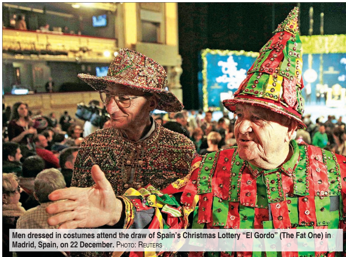
Men dressed in costumes attend the draw of Spain's Christmas Lottery "El Gordo" (The Fat One) in Madrid, Spain, on 22 December.

This year's draw, like others a huge collective affair, provided a welcome distraction from Sunday's national election, which plunged the country into a political stalemate and ended almost four decades of two-party rule.