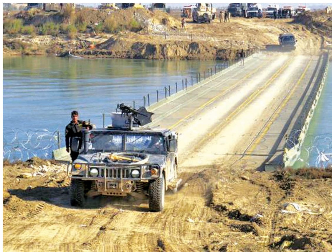
Iraqi security forces cross a bridge built by corps of engineers over the Euphrates in Ramadi, on 22 December.

BAGHDAD — Government forces expect to dislodge Islamic State militants from the western Iraqi city of Ramadi within days, state TV said yesterday, citing army chief of staff Lt General Othman al-Ghanemi.