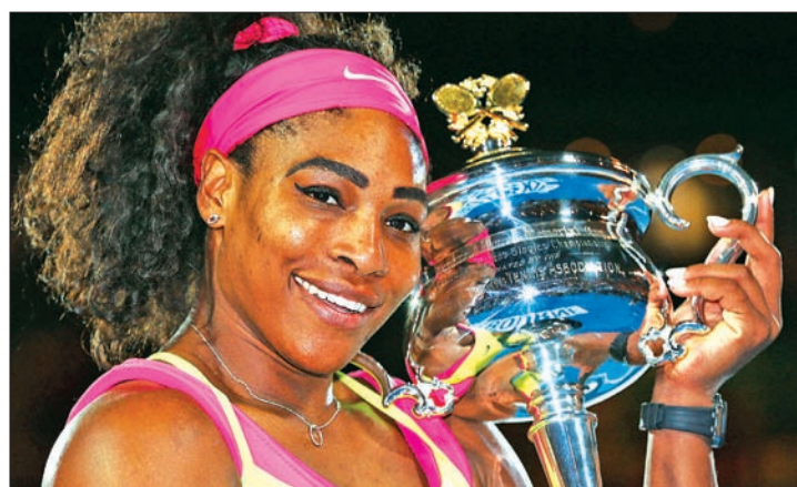
Serena Williams.