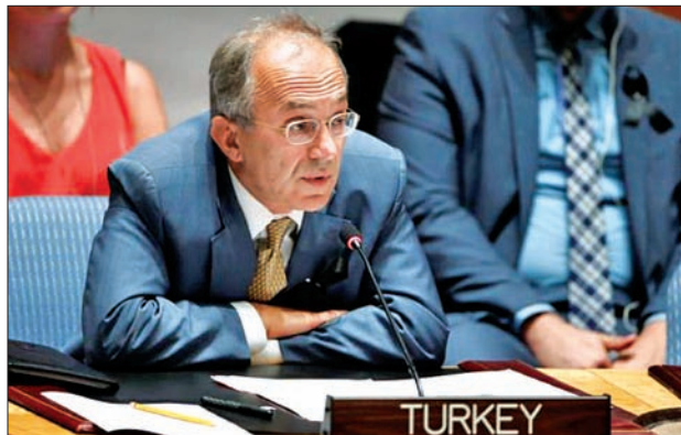
Turkey's Ambassador to the United Nations, Yasar Halit Cevik, addresses the Security Council during a meeting about the situation in the Middle East, including Palestine, at United Nations headquarters in New York.

UNITED NATIONS — Turkey accused Iraq on Friday of undermining the global fight against Islamic State militants by taking its complaint about the deployment of Turkish troops in northern Iraq to the United Nations Security Council.