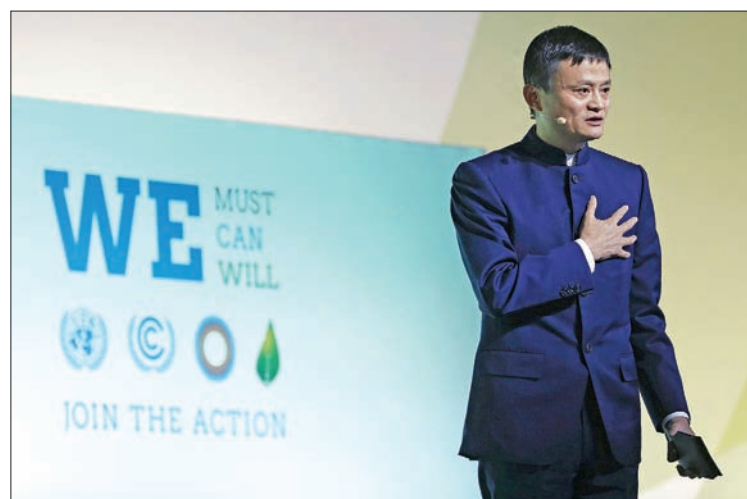
Alibaba Executive Chairman Jack Ma delivers his speech during the World Climate Change Conference 2015 (COP21) at Le Bourget, near Paris, France, on 5 December.

WASHINGTON — Chinese e-commerce giant Alibaba Group Holding Ltd has avoided being named on a US blacklist for sites hosting the sale of fake goods, a victory for the firm after lobbying hard to avoid inclusion on the list.