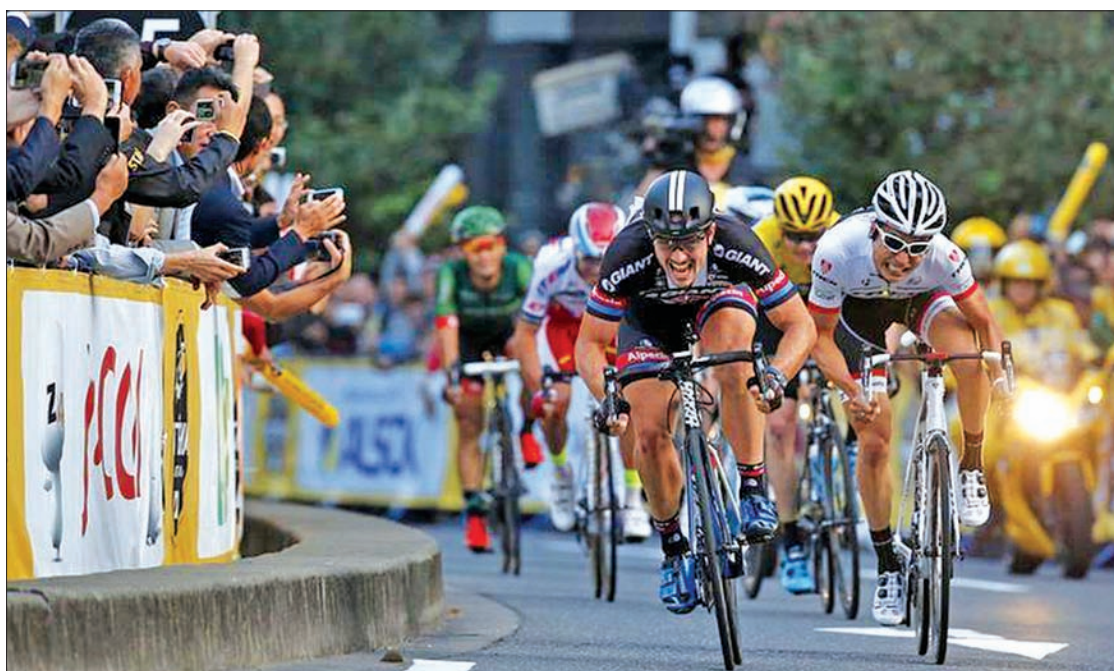
Giant-Alpecin rider John Degenkolb (3rd R) of Germany and Trek Factory rider Fumiya Beppu (R) of Japan sprint to the finish line as spectators take pictures of them during the Tour de France Saitama Criterium cycling race in Saitama, north of Tokyo, Japan.

In 2008, then defending Tour champion Alberto Contador could not enter the Tour de France because ASO had not invited his Astana team following the doping scandals they were involved in the