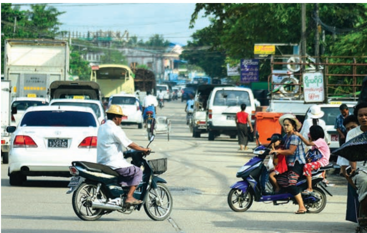
Motorbike drivers are struggling in Yangon.

FOLLOWING a crackdown on motorbike drivers who break the traffic laws the Yangon Region Police Force arrested 207 motorbike drivers who did not follow traffic rules.