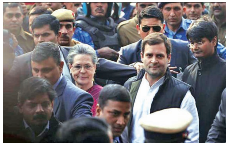
Congress party president Sonia Gandhi and her son and the party's vice-president Rahul Gandhi (2nd R) arrive at a court in New Delhi, India, on 19 December.

The family has denied any wrongdoing.—Reuters