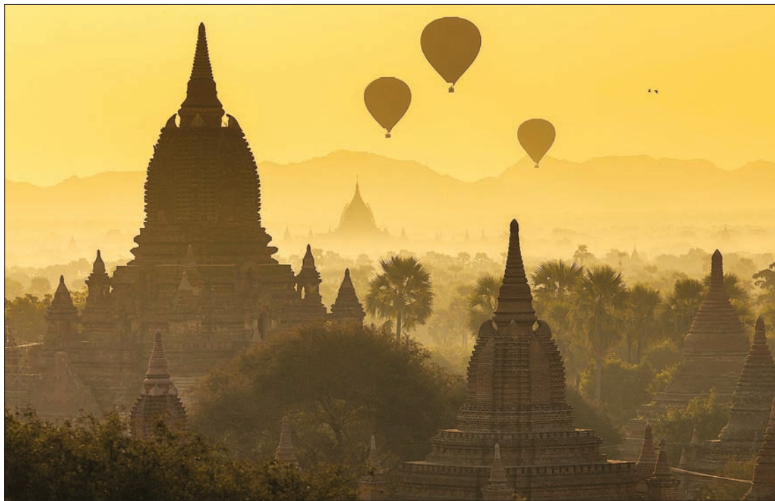
Hot air balloon over Bagan.

2014 and it is expected that the sector can find jobs for a further 536,000 people in 2015.— Kyaw Lwin (Hotel & Tourism)