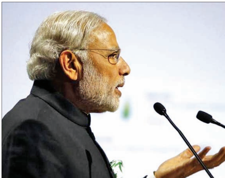
Prime Minister Narendra Modi.

New Delhi has turned to Russia as US firm General Electric and Westinghouse, a US-