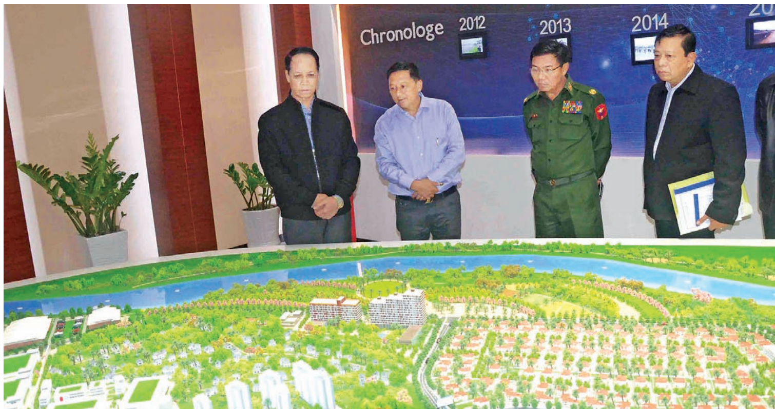
Vice President Dr Sai Mauk Kham views the scale model of the central economic zone in Muse.