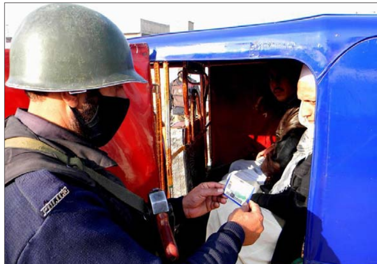
A Pakistani policeman checks the identity card of a passenger due to security high alert in northwest Pakistan's Peshawar, on 18 December 2015.

ISLAMABAD — At least 637 terrorists have been killed and 710 others arrested by the police and security forces in Pakistan during the year 2015, the interior ministry informed the country's Upper House Friday.