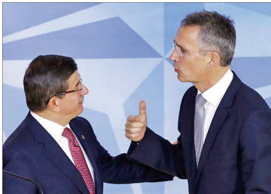
Turkish Prime Minister Ahmet Davutoglu and NATO Secretary-General Jens Stoltenberg.

AWACS monitor airspace within a radius of more than 400 km (250 miles) and exchange information via digital data links, with ground-based, sea-based and air-