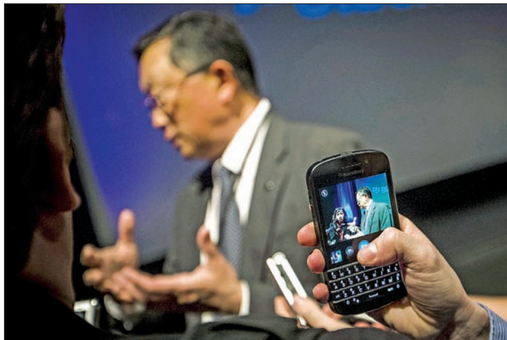
A reporter uses a BlackBerry device to photograph BlackBerry CEO John Chen as he speaks to reporters following their annual general meeting for shareholders in Waterloo, Canada.

In the quarter ended 28 November, BlackBerry reported a loss of $89 million, or 17 cents a