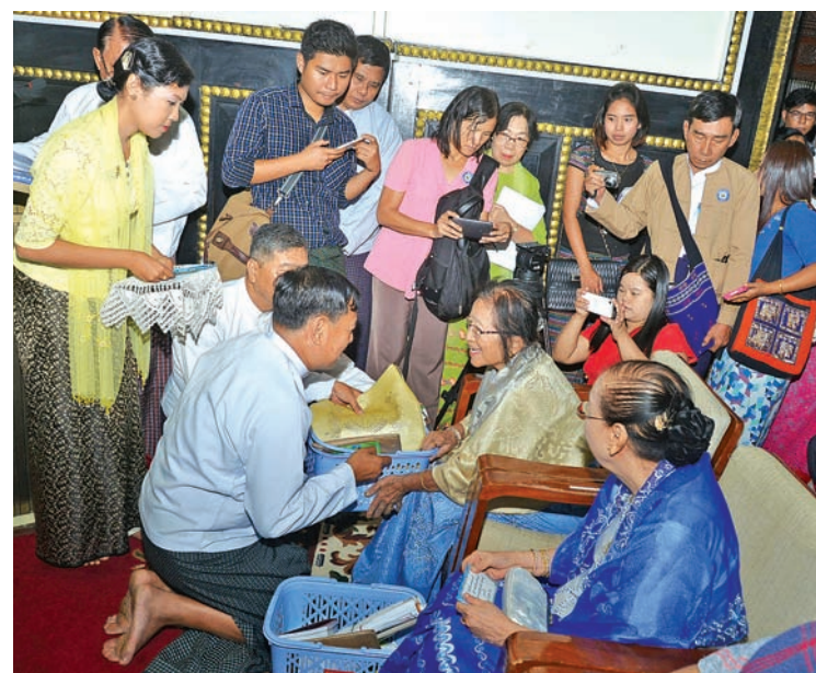
Union Minister U Ye Htut presents gifts to doyen literati at the ceremony to mark Sarsodaw Day in Yangon.

On behalf of the doyen literati, U Maung Maung (Maung Nyein Chan-PhyarPon) counselled to the attendees. —Yee Yee Myint, Ohnmar Than