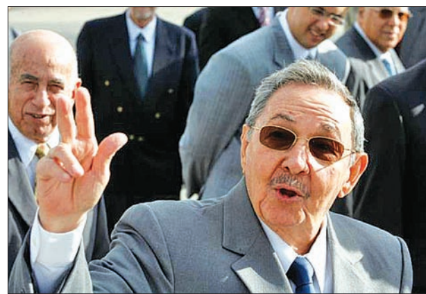
Cuba's President Raul Castro gestures after the departure of his Chinese counterpart Hu Jintao at Havana's Jose Marti airport on 19 November 2008.

HAVANA — Cuba is willing to keep improving relations with the United States even though Washington has failed to meet its key demands for normalisation, Cuban President Raul Castro said on Friday, a day after the anniversary of de-