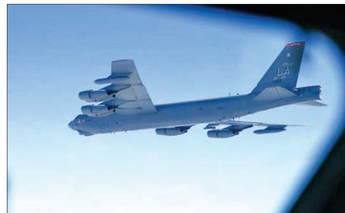
A US AIR FORCE B-52.

The US guided missile destroyer USS Lassen sailed within 12 nautical miles of Subi Reef in late October to deliberately challenge China's claims of territorial waters there. The decision drew an angry rebuke from China, which called it "extremely irresponsible."—Reuters