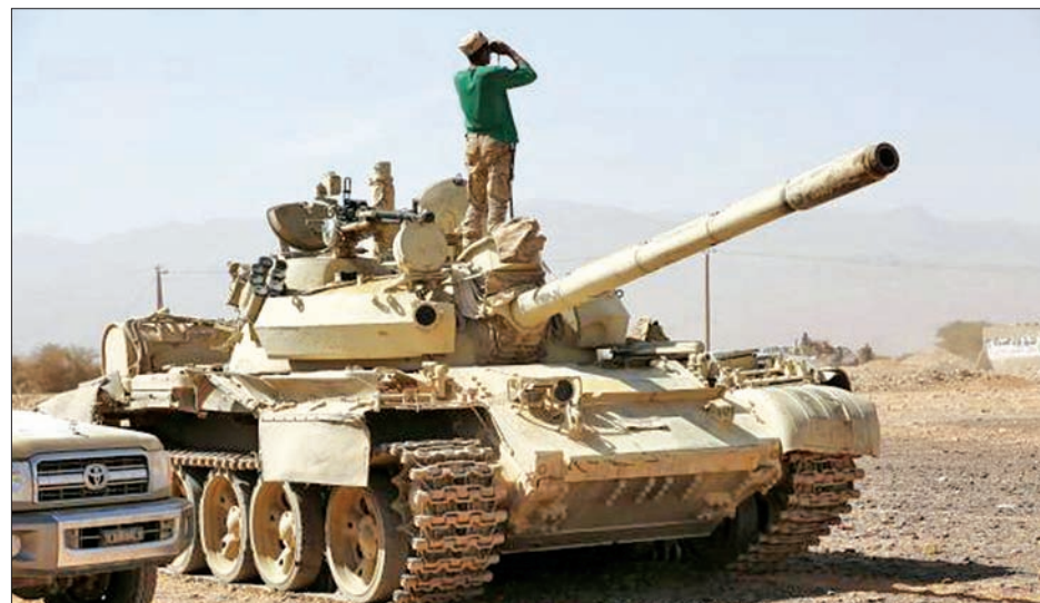
A soldier loyal to Yemen's President Abd-Rabbu Mansour Hadi stands atop a tank as he uses binoculars in Majaz district, in the country's northwestern province of Marib, after the pro-Hadi forces took the area from Houthi rebels, on 18 December.

A supposed one-week truce came under strain on Friday when troops loyal to Hadi seized an important northwestern city and a military base from Houthis