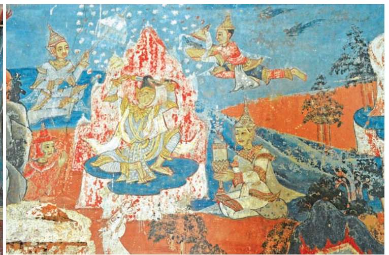
Mural paintings at Htigyi Pagoda in Minbu.