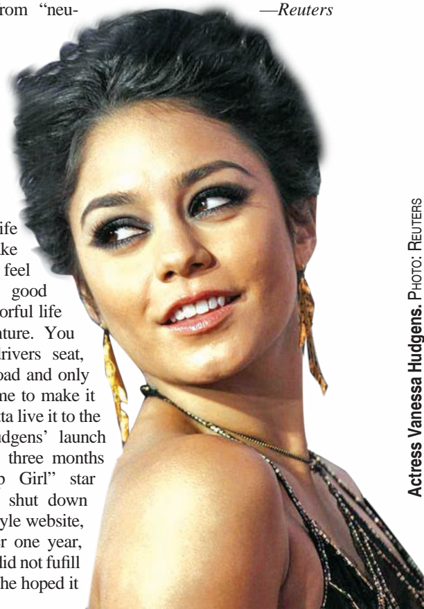
Actress Vanessa Hudgens.

believe that life is as you make it. I want to feel good, look good and live a colorful life full of adventure. You are in the drivers seat, on an open road and only get one lifetime to make it count. We gotta live it to the fullest!” Hudgens’ launch comes nearly three months after “Gossip Girl” star Blake Lively shut down her own lifestyle website, Preserve, after one year, confessing it did not fulfill the potential she hoped it would.—PTI