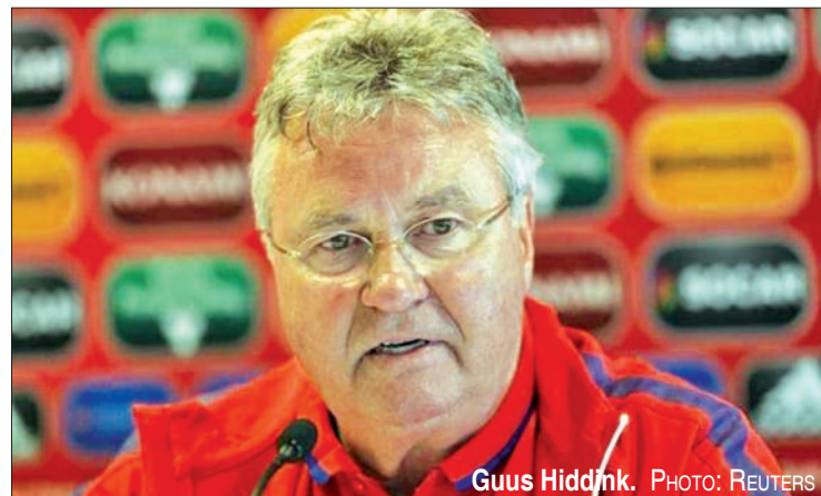
Guus Hiddink.

LONDON — Dutchman Guus Hiddink was named as Premier League champions Chelsea's interim manager for a second time yesterday following the sacking of Jose Mourinho, the club said in a statement.