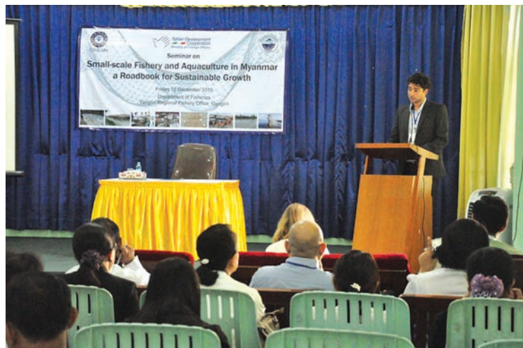
A meeting at which technical support for Ministry of Livestock, Fisheries & Rural Development was discussed seen in progress.