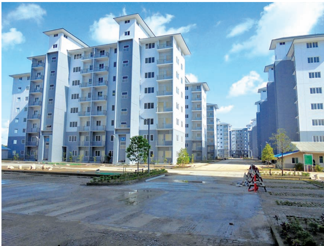
Bo Ba Htoo Housing Complex seen at the corner of Bomhu Ba Htoo and Bayinnaung roads in Dagon Myothit (North).

At the Phase 1 section, 600 sq ft apartments were sold at K 25.5 million and 900 sq ft apartments were sold at K 34.7 million. The construction of the 14 eight-story buildings on a 5.26-acre land cost K 12 billion. Those buildings were also constructed by Myanmar V-Pile.— Soe Win