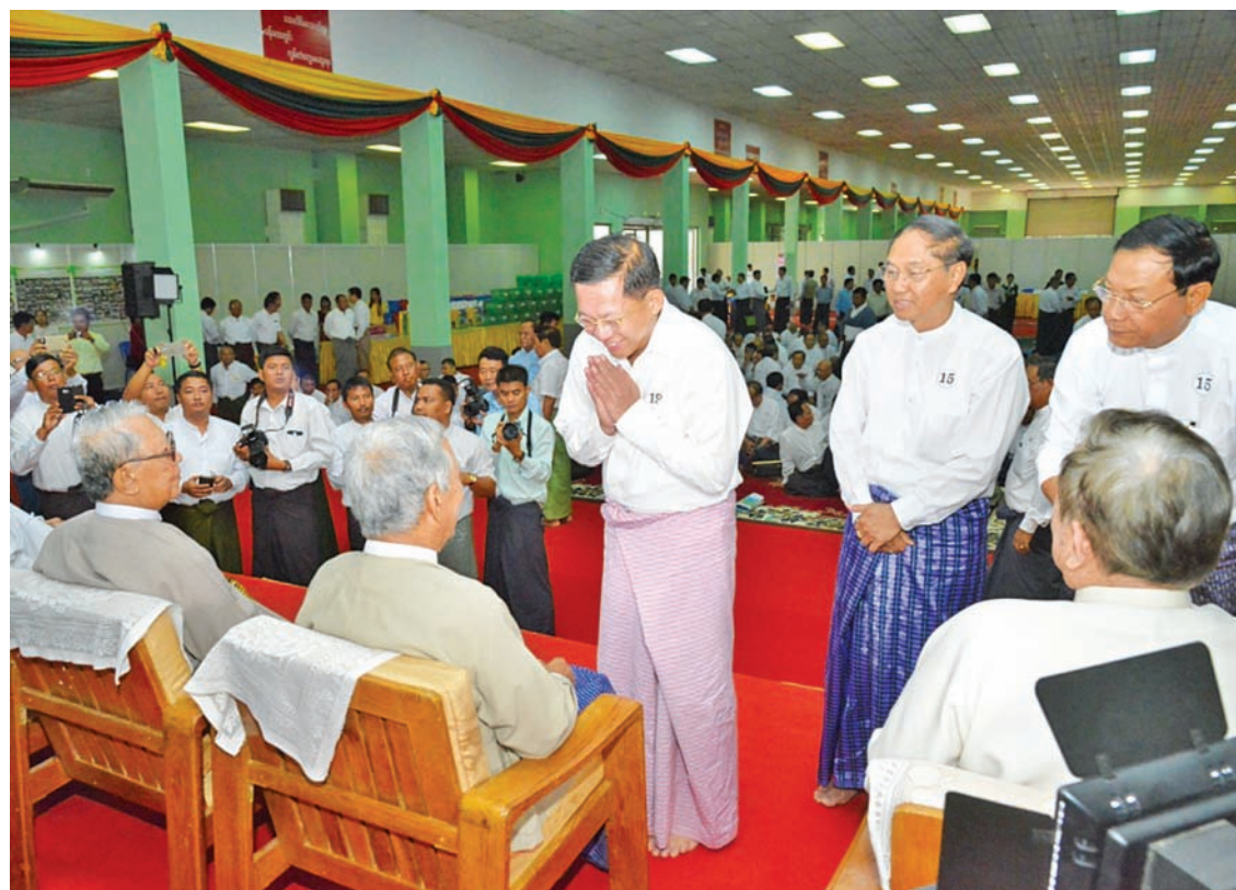
Senior General Min Aung Hlaing pays respects to retired faculty members of DSA.

FORMER graduates of the Defence Services Academy (DSA) paid respects to their retired military and civil faculty members at the Tatmadaw Exhibition Hall in Yangon yesterday.