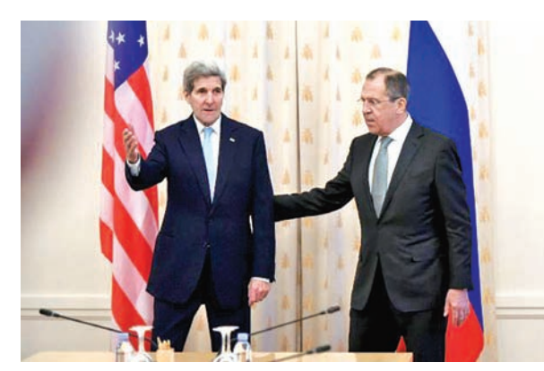
US Secretary of State John Kerry (L) gestures next to Russian Foreign Minister Sergei Lavrov as they pose for cameras ahead of a bilateral meeting in Moscow.

For its part, the Russian Foreign Ministry issued a statement complaining that Washington was not ready to fully cooperate in the struggle against Islamic State militants and needed to rethink its policy of "divid-