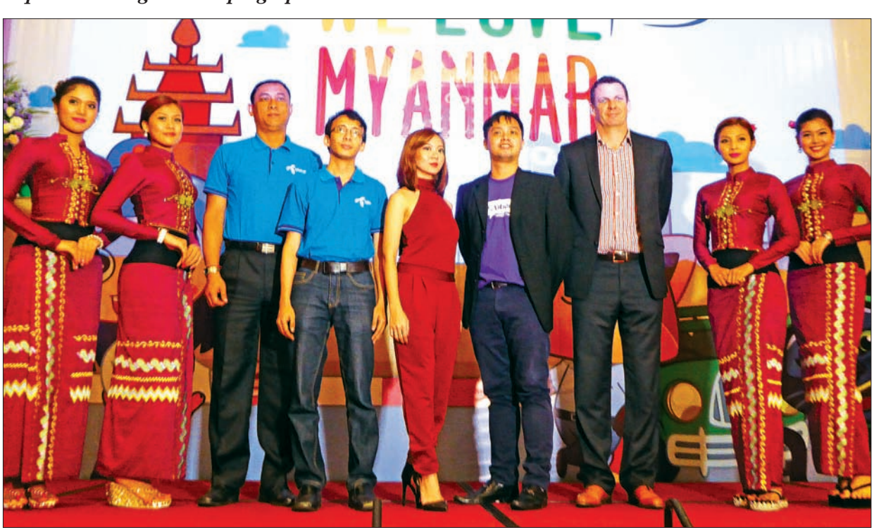
Officials from Viber, Telenor and Red Dot gather at We Chat Myanmar campaign launching ceremony.

Telenor will offer two weeks of cost-free access to messaging on the app with no registration required during the campaign period.