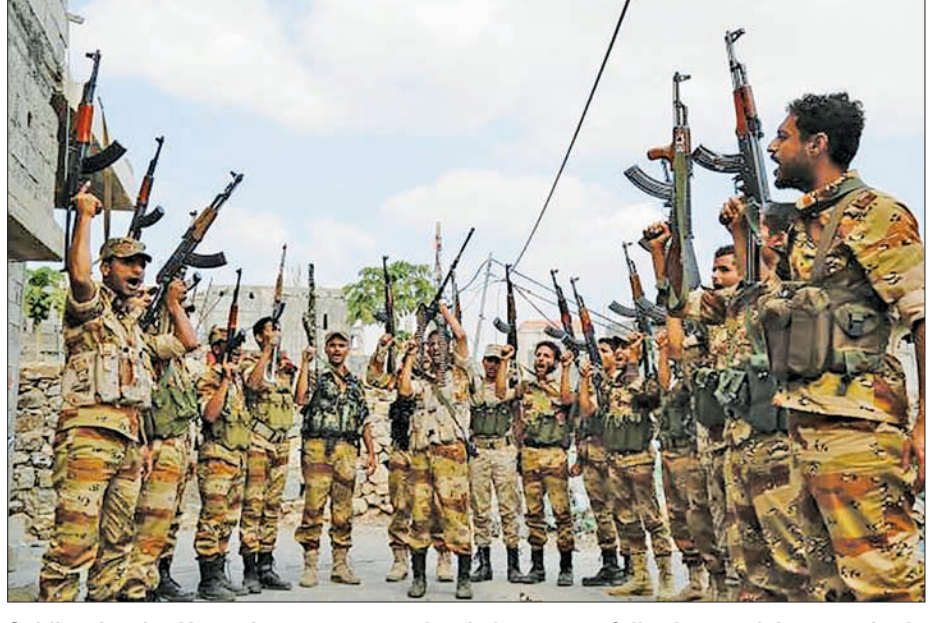
Soldiers loyal to Yemen's government raise their weapons following a training exercise in the country's southwestern city of Taiz, on 14 December.

Ahmed said in a statement released in Geneva that Yemen's peace talks were underway and urged the parties to ensure full compliance with the ceasefire.