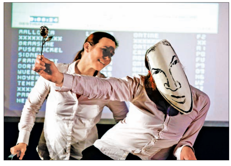
Actors perform a satirical play called 'Asylant im Wunderland' (Asylum Seeker in Wonderland) in a community centre in Stralsund, Germany, on 12 December.

They greet two well-qualified refugees with roses, sparkling wine, beer and coffee be-