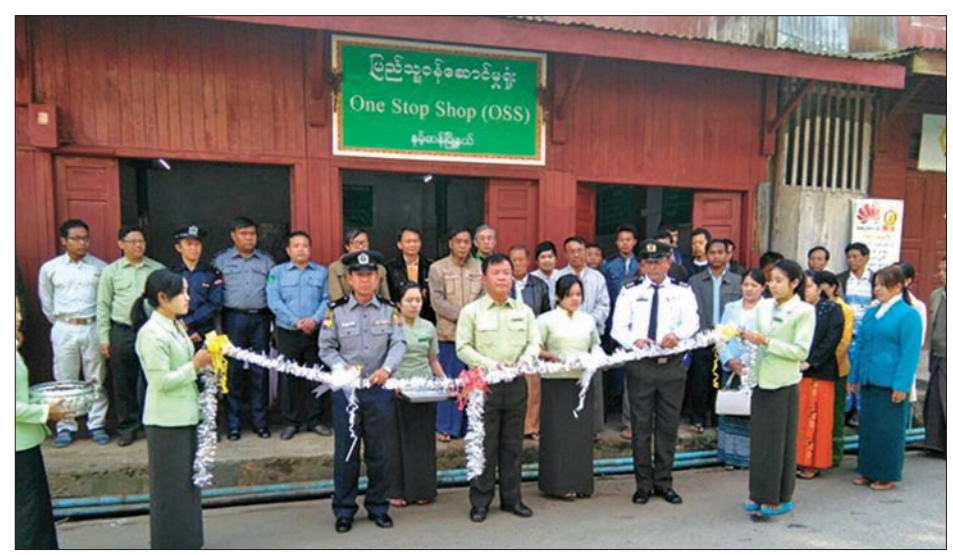
One Stop Shop opened in Namhsan Township.

A ONE-STOP shop was opened in Namhsan Township in the Palaung Self-Administered Zone in Shan State yesterday.