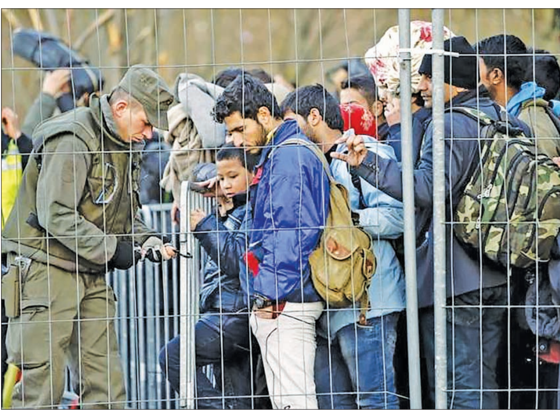
An Austrian soldier fixes the fence as migrants wait to cross the border into Spielfeld in Austria from the village of Sentili, Slovenia, on 31 October.

VIENNA — The wave of refugees flooding into Austria could bolster the country's economic growth if Vienna continues to work on integrating them quickly, the International Monetary Fund (IMF) said on Monday.