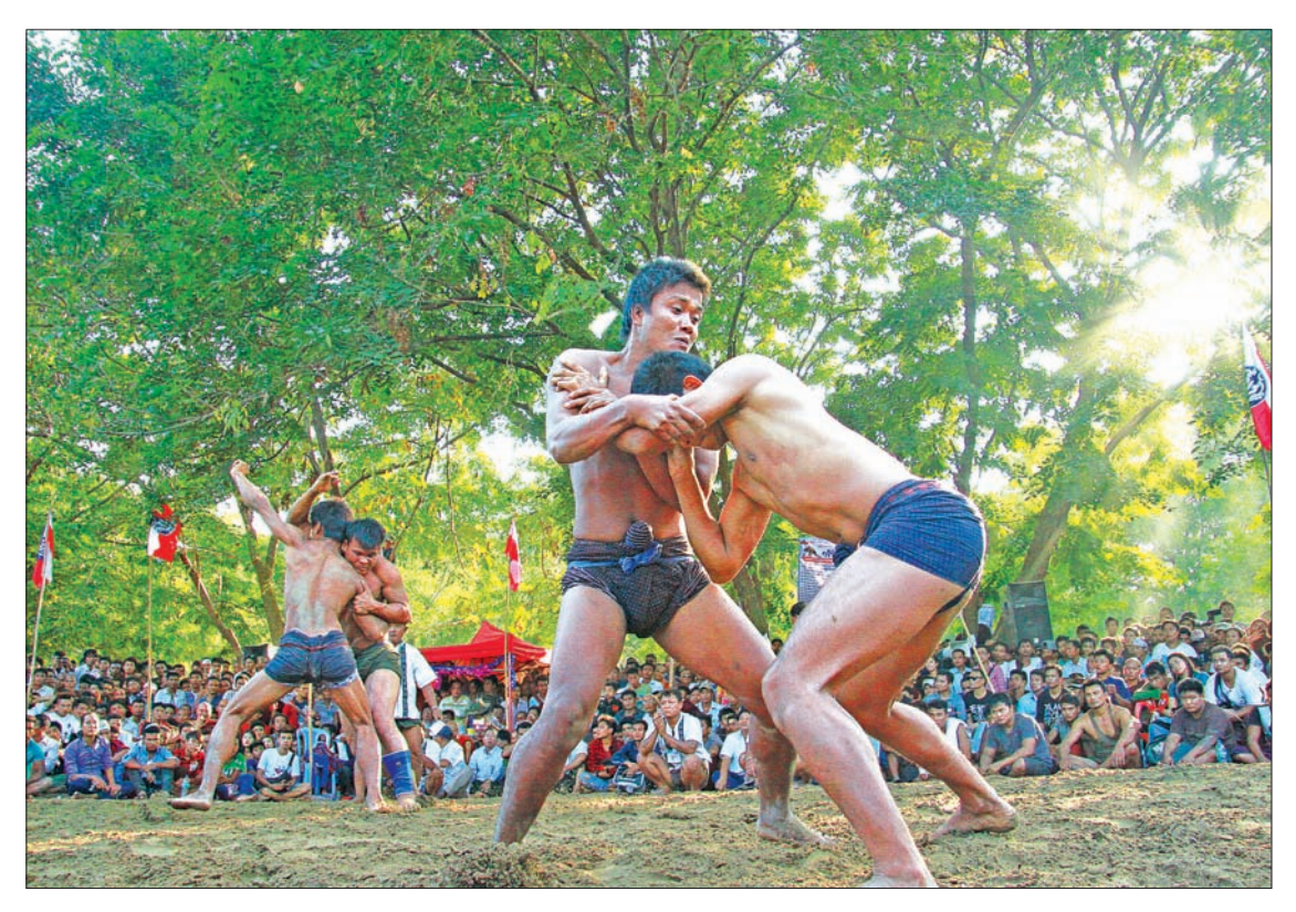
Rakhine Traditional wrestling matches, Kyin competitions, in progress in National Races Village on 13 December.

The celebration resumed after 2010.—GNLM