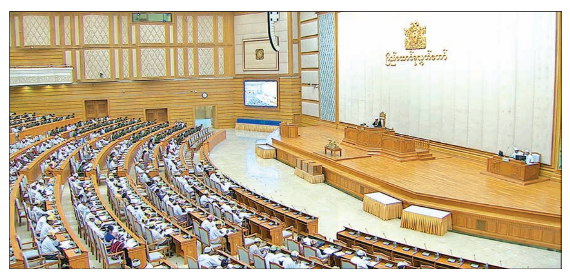
Pyidaungsu Hluttaw being convened in Nay Pyi Taw.

The ministry expects to collect over 6.1 trillion kyats next fiscal year—a 269 million kyat increase from this year. The Bill Amending Criminal Law, the Bill Amending Insurance Permission Law and the Bill Amending Banking Law were approved. Amendments to laws relating to crime, insurance and banking were approved at the Tuesday session of Pyidaungsu Hluttaw.—Myanmar News Agency