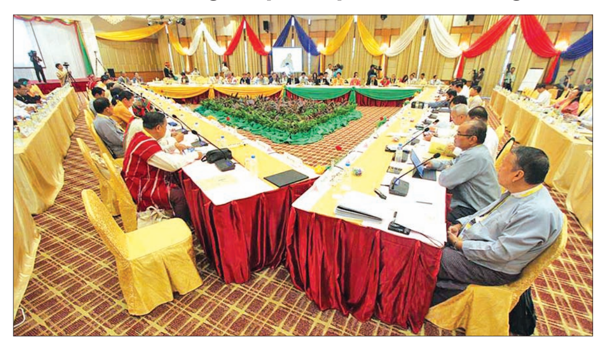
Three groups comprising the Union Political Dialogue Joint Committee of 16 representatives from political parties, the government and ethnic ceasefire signatories meet on Day 2 of the meeting at the Horizon Lake View Hotel in Nay Pyi Taw yesterday.