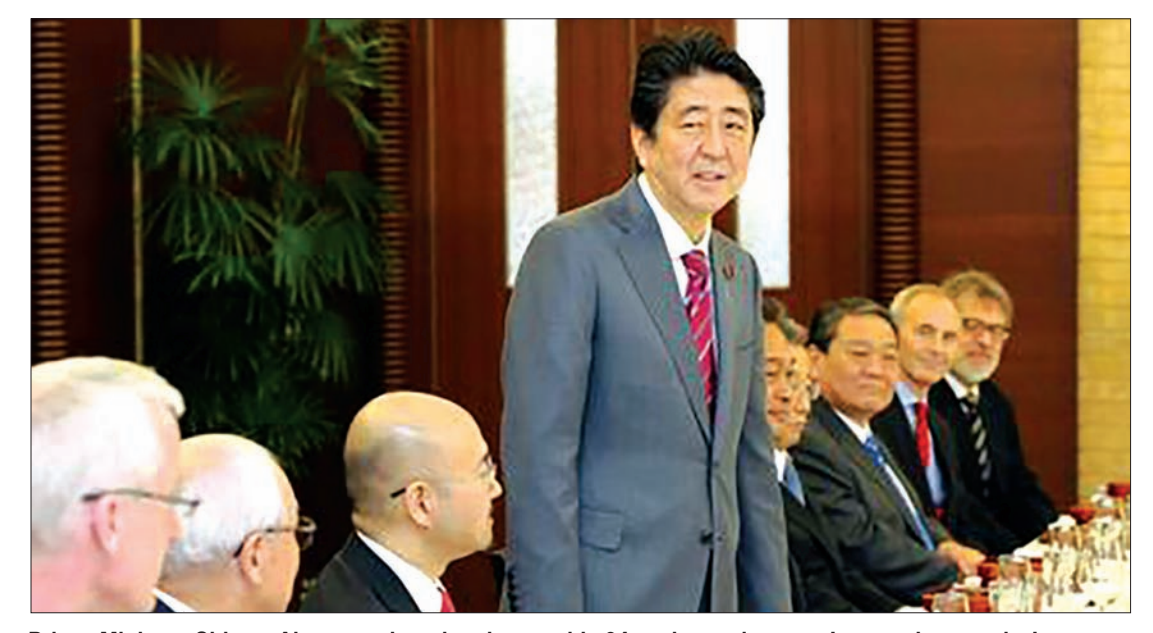
Prime Minister Shinzo Abe attends a luncheon with 24 ambassadors to Japan who speak Japanese, including those from Britain, China and South Korea, on 15 December 2015, at his official residence in Tokyo.

TOKYO — In an effort to munication and deepen mutual understanding with other countries, Prime Minister Shinzo Abe hosted a luncheon meeting yesterday with 24 Japan-based foreign ambassadors with proficiency in the Japanese language.