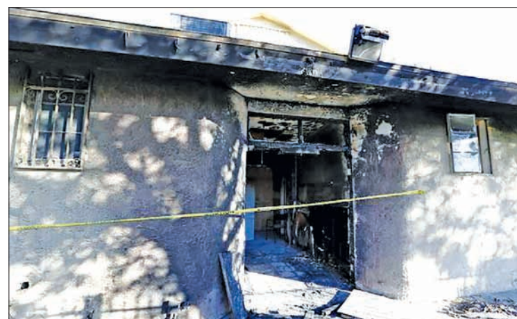
A view of damage at the burned Islamic Society of Coachella Valley on 12 December 2015.

It was not clear if Dial had obtained an attorney, and he could not be reached for comment from jail.