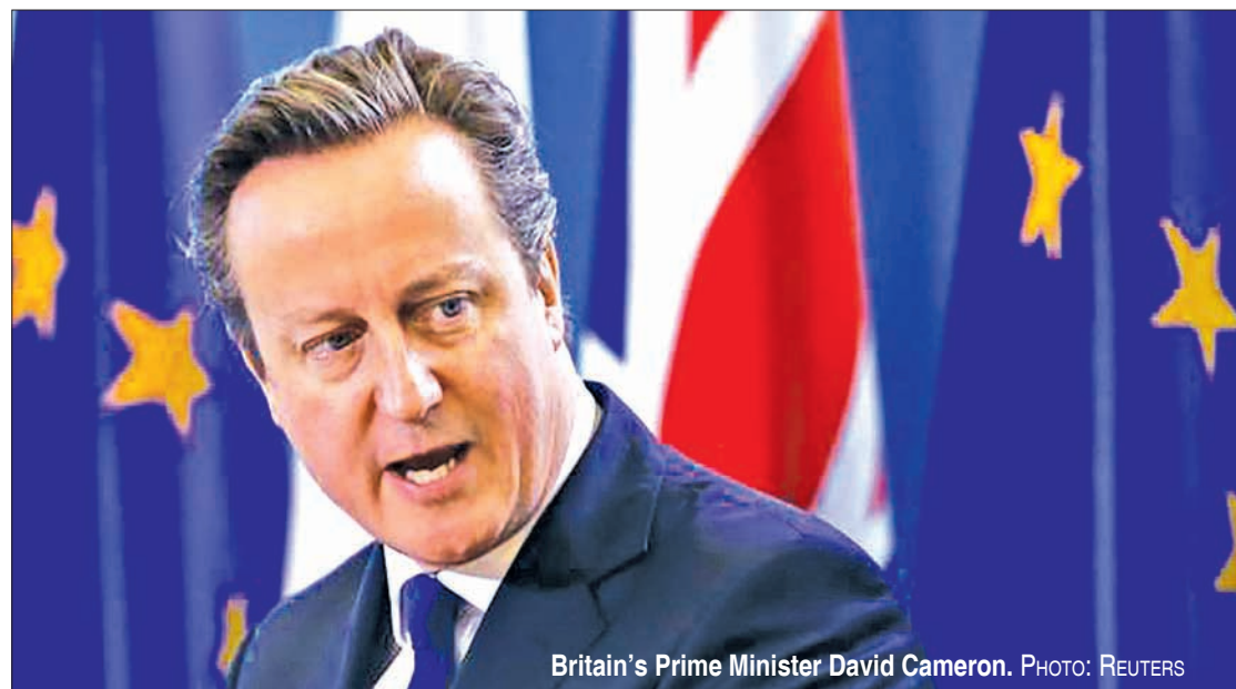
Britain's Prime Minister David Cameron.

LONDON — British Prime Minister David Cameron is prepared to drop a demand to curb welfare benefits for migrant workers as he attempts to renegotiate the terms of Britain's membership of the European Union, two British newspapers reported on Saturday.