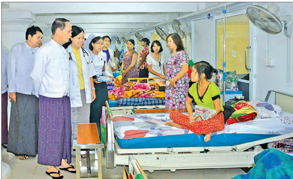
Vice President Dr Sai Mauk Kham conforms a patient at Yangon General Hospital.

The Yangon General Hospital has been upgraded from a 1,500-bed to a 2,000-bed facility equipped with sophisticated equipment such as 16-Slice CT, Digital X-ray, ECG, Ultrasound, PET/CT, Cyclotron, 128-Slice CT and MRI-1.5.— Myanmar News Agency