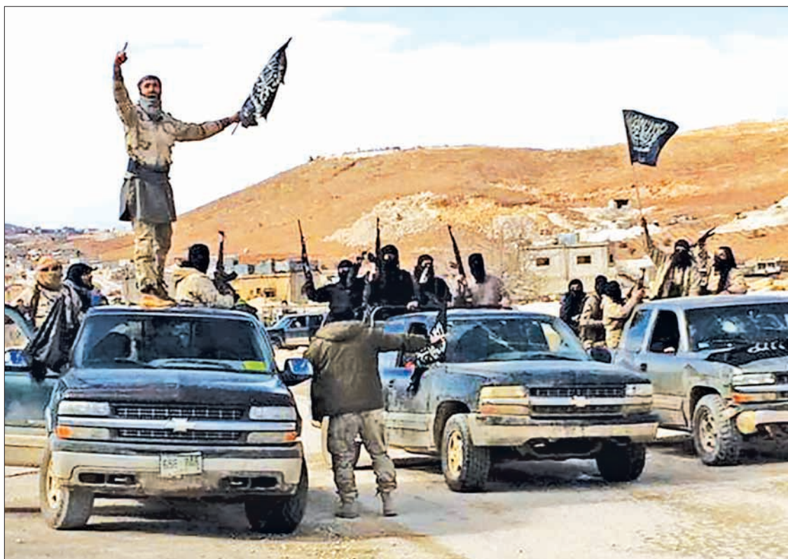
Al Qaeda-linked Nusra Front fighters carry weapons on the back of pick-up trucks during the release of Lebanese soldiers and policemen in Aarsal, eastern Bekaa Valley, Lebanon, on 1 December 2015.

“It is a big betrayal of these young people who sacrificed their blood and everyone who sacrificed their blood for the establishment of Islamic rule ... this is a conspiracy of many factions and we must work to