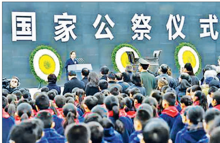
Li Jianguo, vice chairman of the Standing Committee of the National People's Congress, addresses a memorial ceremony in Nanjing on 13 December 2015, for victims of the 1937 massacre committed by the Imperial Japanese Army in the eastern Chinese city.

Leading up to the service, coverage by Chinese official media was also low-key, amid a gradual-but-steady improvement in diplomatic relations between Tokyo and Beijing.