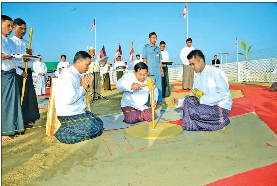
Senior General Min Aung Hlaing drives stake at a ground-breaking of home for aged for veterans.

A total of K1.6 billion were donated by families of the defence services, retired personnel and members of the public for the home for the aged.