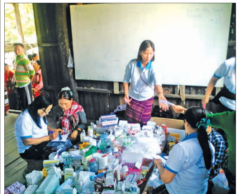
Volunteers participate in giving free medical care to residents in Kalay.

This is the 5th mobile health care tour of areas which were hit by flood in July and August by the team.— Cin Sawm Tuang