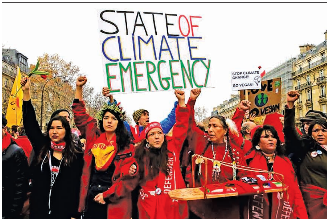
Representatives of indigenous peoples demonstrate in Paris, France, as the World Climate Change Conference 2015 (COP21) continues at Le Bourget on 12 December 2015.

entially unchanged from a draft unveiled earlier in the day, including a more ambitious objective of restraining the rise in temperatures to "well below" 2 degrees Celsius (3.6 degrees Fahrenheit) above pre-industrial levels, a mark scientists fear could be a tipping point for the climate. Until now the line was drawn only at 2 degrees.