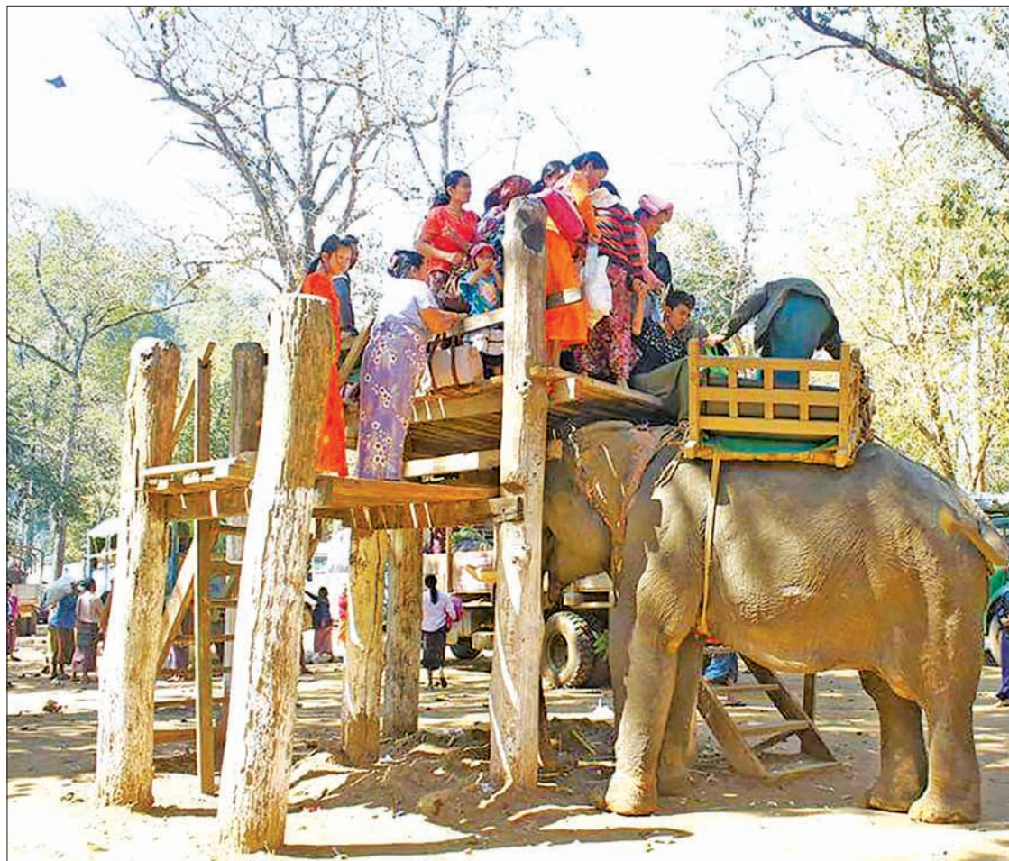
Buddhist devotees wait to ride an elephant on their way to Powintaung Cave Pagodas.

The ancient Powintaung Cave Pagodas formed entirely