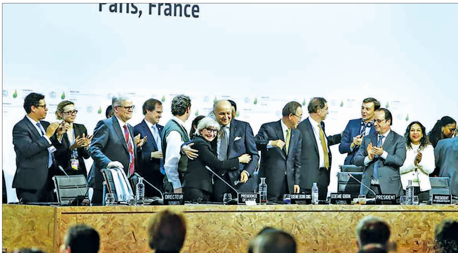
The final conference at the COP21, in Le Bourget, Paris, on 12 December 2015.

the two-week Paris gathering, Chinese President Xi Jinping warned against a zero-sum game mentality in the negotiations.