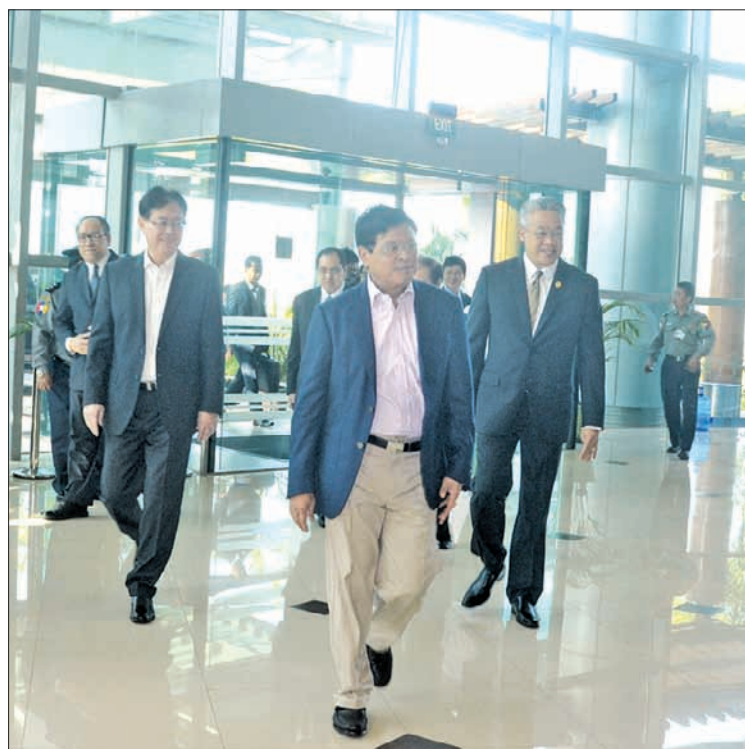
Vice President U Nyan Tun seen off by officials as he leaves for Bangkok.