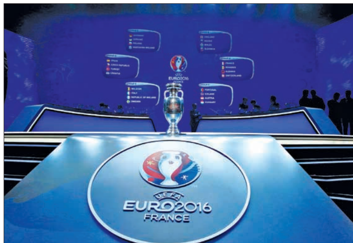
Euro 2016 trophy is on display with the results of the draw in the background at Euro 2016 draw, Palais des Congress, Paris, France on 12 December 2015.

France, who won Euro 1984 and the 1998 World Cup on home soil, kick off against Romania on