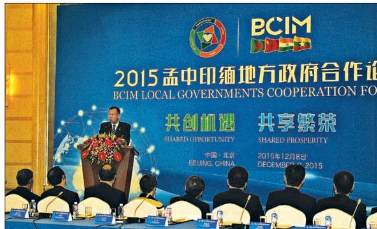
Union Minister Dr Kan Zaw delivers a speech at BCIM forum.

The Myanmar delegation attended a dinner hosted by Madame Li Xiaolin, chairperson of the Chinese People's Association for Friendship with Foreign Countries (CPAFFC) on 7 December. On 8 December, Dr Kan Zaw delivered an opening address at the forum. In his speech, the union minister expressed his belief that the forum would create a new network of links between Asian countries and other nations through the further consolidation