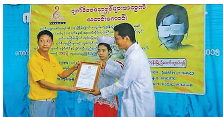
An eye specialist presents certificate of honour to a donor.

The visit will be the mobile team's second visit to the town. During its first visit, 165 locals were found to have tuberculosis, and 17 were found to be positive.—Htein Lin Aung (IPRD)