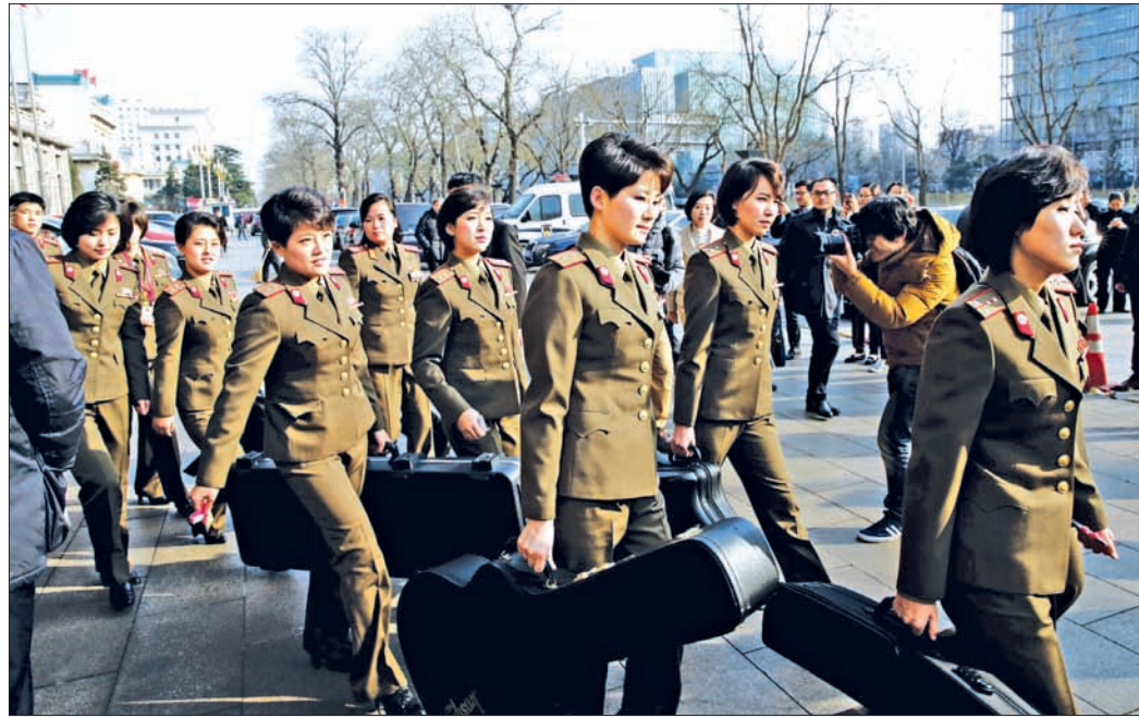
Members of the Moranbong Band from North Korea carry their instruments as they leave a hotel in central Beijing, China, on 11 December 2015.

BEIJING — An all-female North Korean pop group formed by leader Kim Jong Un abruptly canceled a Beijing concert on Saturday because of “communication issues” and headed home, Chinese media and the concert venue said.