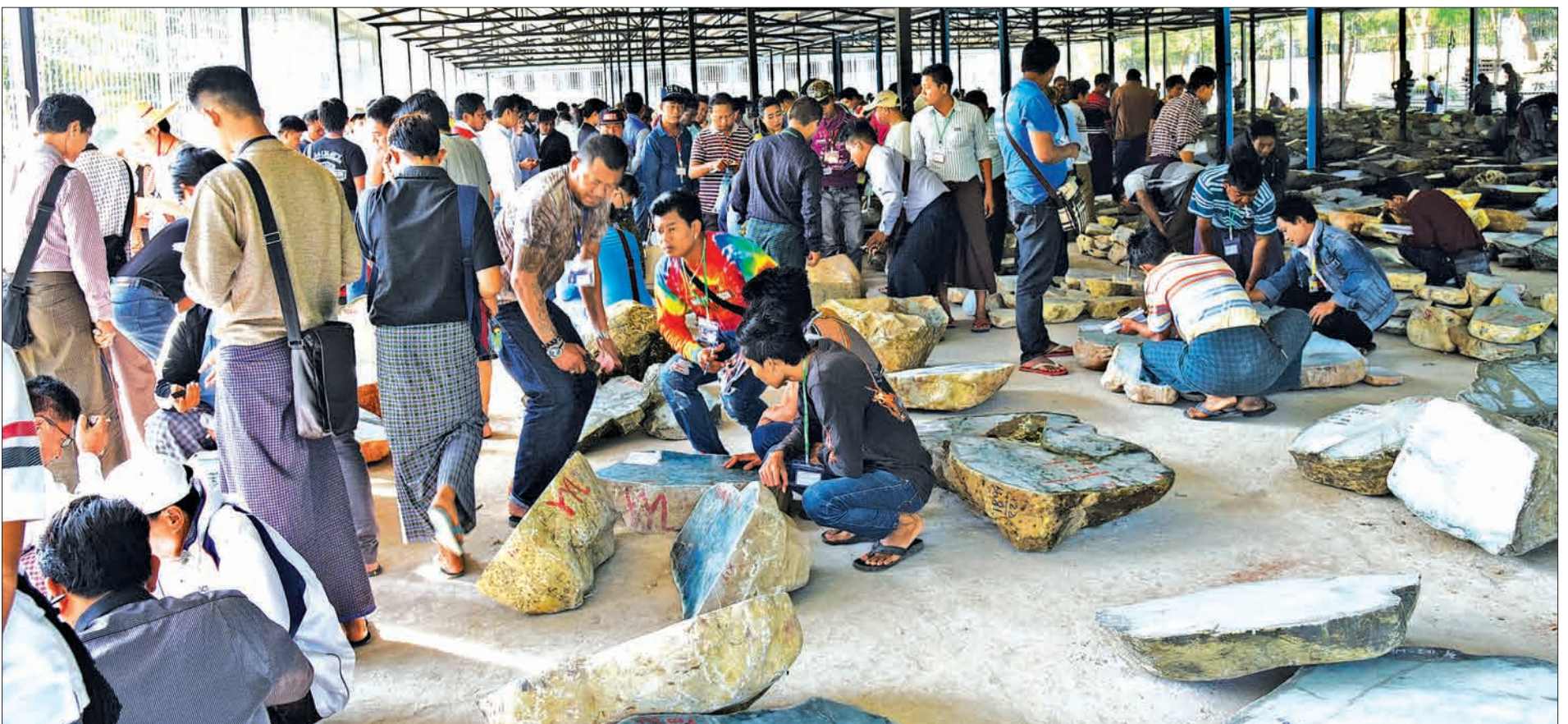
Gems merchants evaluate raw jade stones at Myanmar Gems Emporium in Nay Pyi Taw.

UNCUT gems and raw jade lots worth K80.8 billion (US$62 million) were sold at the 52 nd annual Myanmar Gems Emporium at