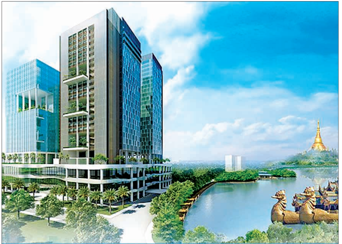
Conceptual design of Kan Thar Yar Consortium Towers Project.