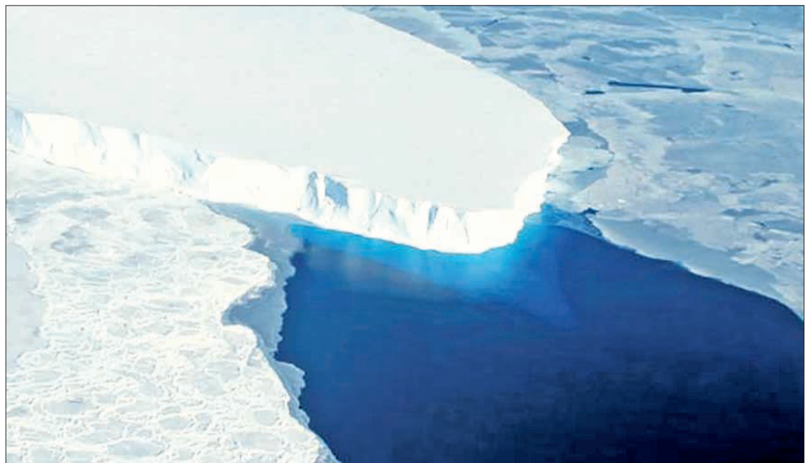
The Thwaites Glacier in Antarctica is seen in this undated NASA image. Vast glaciers in West Antarctica seem to be locked in an irreversible thaw linked to global warming that may push up sea levels for centuries, scientists said on 12 May 2014.

The research was published in the journal Science Advances .— Reuters