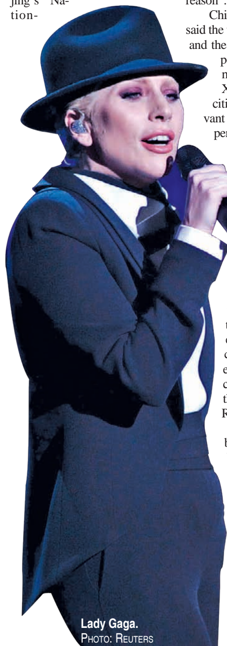
Lady Gaga.

The band said the break won’t be forever though, with Louis suggesting they “give it 18 months” and see what happens.— PTI