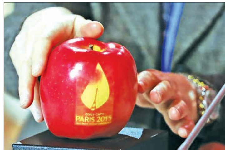
A participant holds an apple marked with the logo of the World Climate Change Conference 2015 (COP21) during a meeting at Le Bourget, near Paris, France, on 7 December 2015.