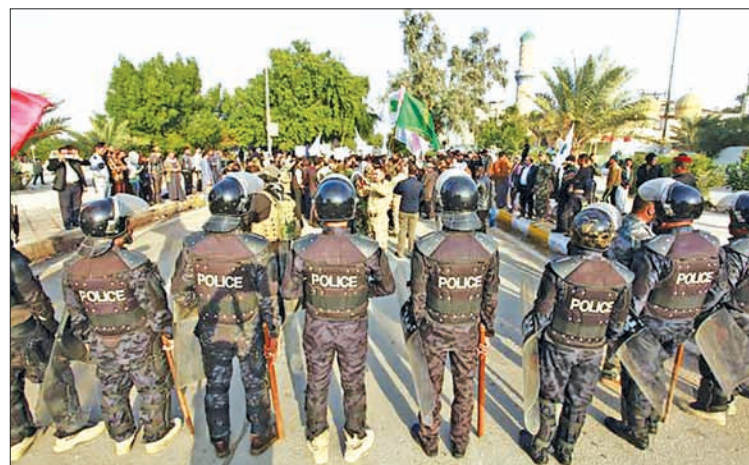
Riot police stand in front of protesters during a demonstration against Turkish military deployment in Iraq, in Najaf, on 12 December.