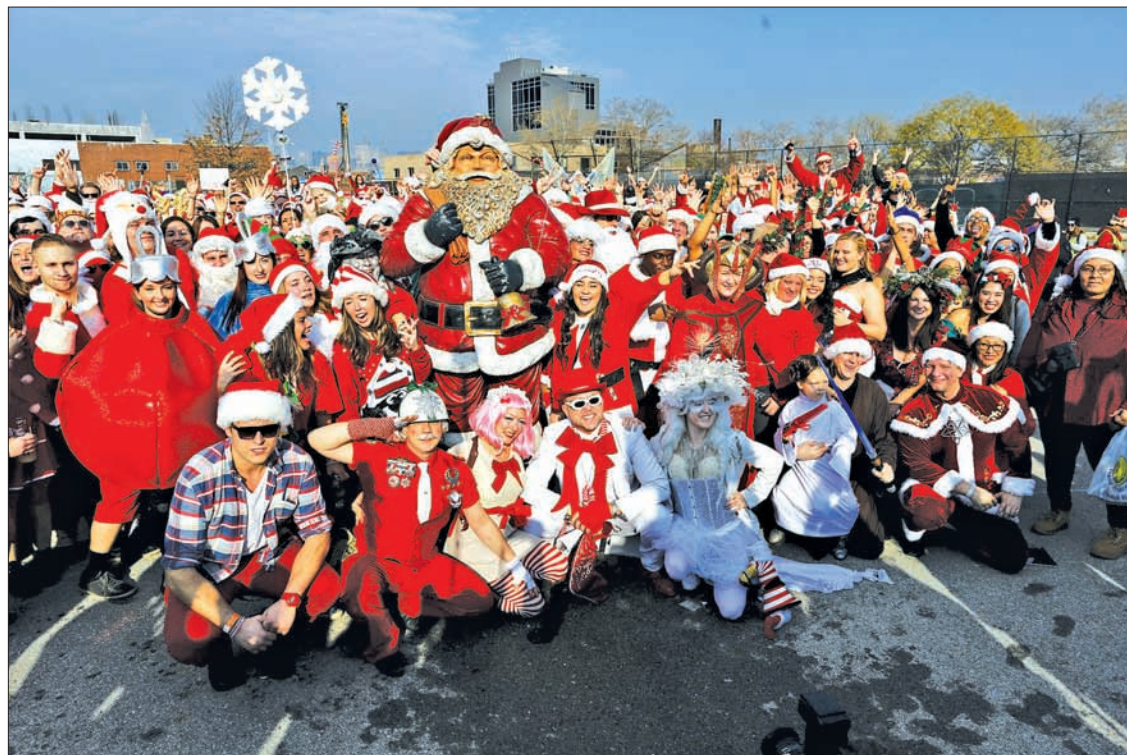
Revelers dressed in Santa Claus and other holiday themed outfits pose for a group photo before the start of the annual SantaCon event in the Brooklyn borough of New York, on 12 December 2015.

NEW YORK — Thousands of merrymakers dressed like Santa Claus and his elves took to the streets of New York on Saturday for the annual pub crawl known as SantaCon, a Yuletide rite with a reputation for inspiring bad behavior among the revelers.