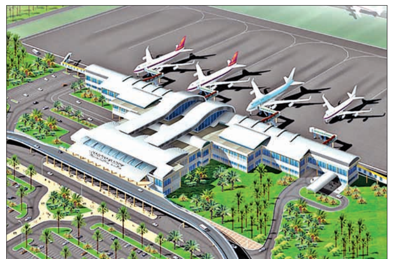
A conceptual design of the Hanthawady International Airport, submitted by the Yongnam CAPE-JGC Consortium.