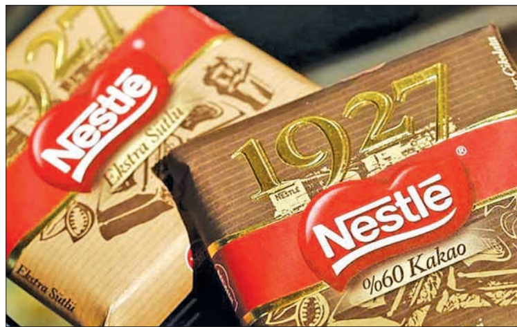
Chocolate packets are displayed in the showroom at the headquarters of Nestle in Vevey, Switzerland, on 16 October, 2015.

ZURICH — Nestle could leave Switzerland if limits on pay and immigration restrict its staffing choices but continues to invest in the country, chief executive Paul Bulcke said in an interview published on Saturday.