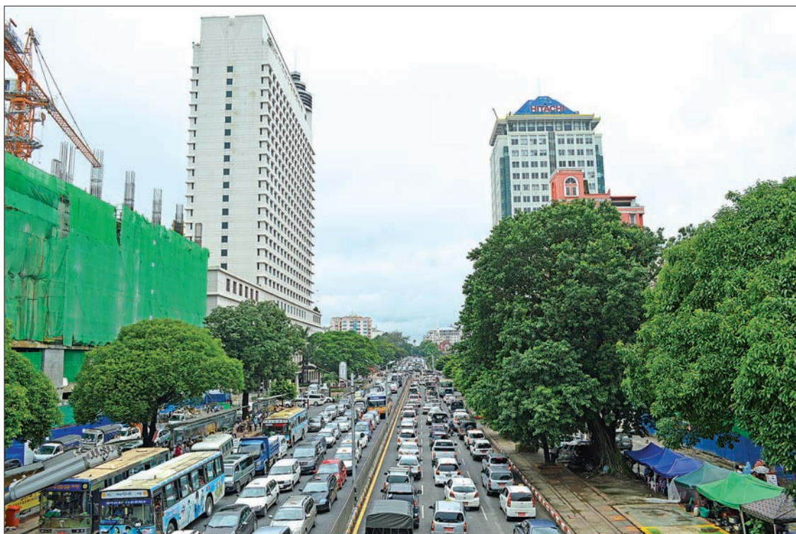
Traffic flowing on Sule Pagoda Road in Yangon.

The MCRB, a Yangon-based initiative funded by a number of European countries, is a neutral platform that aims to improve knowledge, capacity and dialogue concerning responsible business in Myanmar in cooperation with businesses, civil society and the government.