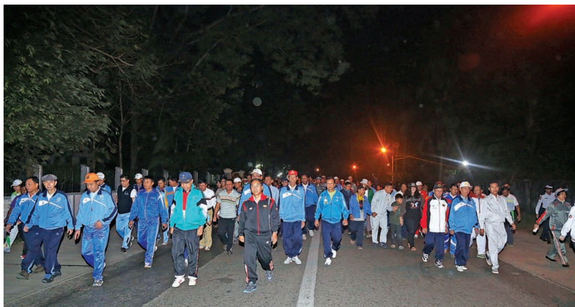
Yangon Region Chief Minister U Myint Swe and dignitaries participate in 2 nd Mass December Walk in Yangon.

YANGONITES held their second mass December walk on Saturday. The mass walkers included the Yangon Region Chief Minister U Myint Swe and wife, Chief Region Hluttaw Speaker, regional officials and