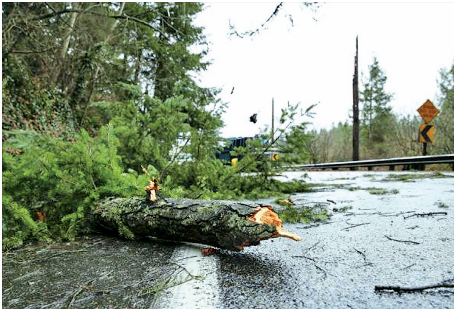
A tree branch is pictured on Issaquah-Hobart Road Southeast as crews work to restore a broken power pole in Issaquah, Washington.

SEATTLE — A storm system moving across the western United States will bring heavy rain once again to the drenched Pacific Northwest and northern California on Friday, forecasts said, as officials warned of renewed mudslides and flooding following the record rainfall.