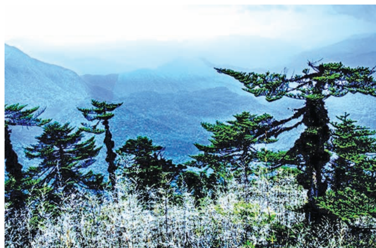
Petrified pine-trees.