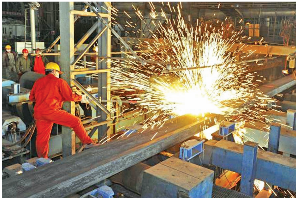
An employee works at a factory of Dongbei Special Steel Group Co., Ltd., in Dalian, Liaoning Province, China.

Premier Li Keqiang said earlier this month that China was on track to reach its economic growth target of about 7 percent this year, and the economy was going through adjustments to maintain reasonable medium- to long-term growth. But that would still mark China's weakest economic expansion in a quarter of a century, and some analysts believe real growth levels are much weaker than official data suggest.—Reuters