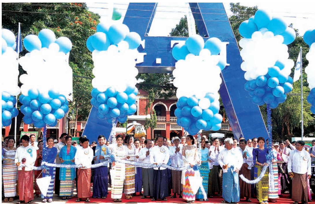
Stone Inscription is unveiled to mark 120 th anniversary of GTI's Education (Government Technical Institute) and blue plaque of Yangon National Heritage building is installed at the building.