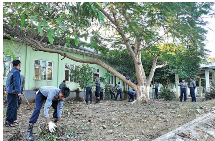
Police volunteer for sanitation to mark 68th Anniversary of Independence Day.

TO mark the 68 th Anniversary of Independence Day, which falls on 4 January next year, members of the Myanmar Police Force carried out sanitation services at a 1,000-bed General Hospital in Nay Pyi