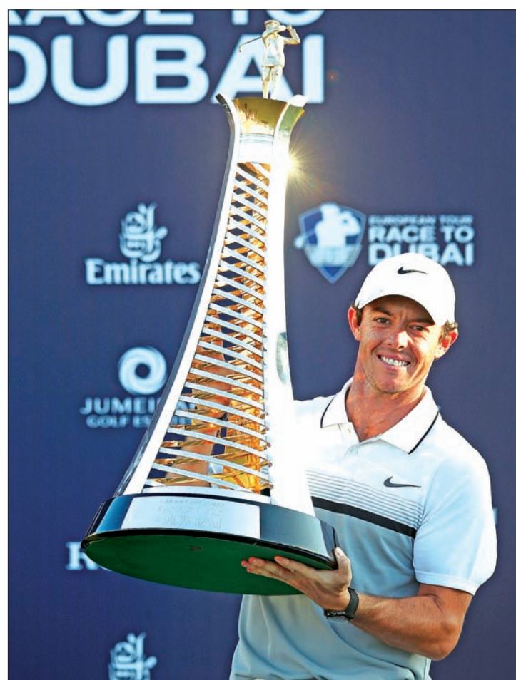
Northern Ireland's Rory McIlroy celebrates with the trophy after winning The Race to Dubai at DP World Tour Championship, Jumeirah Golf Estates, Dubai, United Arab Emirates.