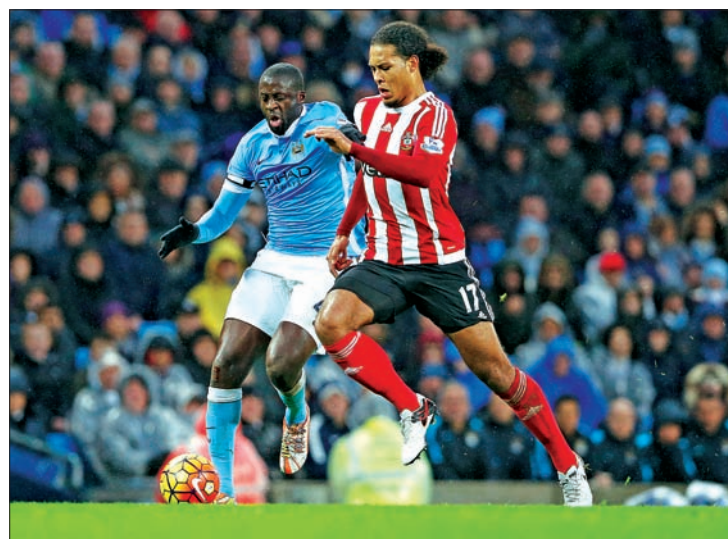
Manchester City's Yaya Toure in action with Southampton's Virgil van Dijk during their Barclays Premier League at Etihad Stadium.

The 32-year-old became only the third player to win the award twice, following Nigerians Jay Jay Okocha and Nwankwo Kanu.— Reuters