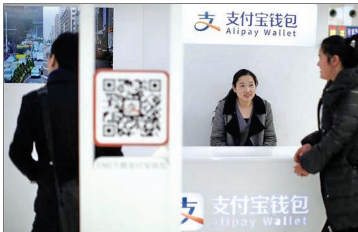
A sales assistant sits behind and under Alipay logos at a train station in Shanghai.

FRANKFURT — Alipay, a unit of Chinese e-commerce giant Alibaba and German banking software company Wirecard AG, said on Friday the companies have agreed to a deal to provide mobile phone payment services for Chinese tourists visiting Europe. In Europe, the payments process will be run through Wirecard and run on existing payment terminals with no software upgrades necessary, the companies said in a joint statement.