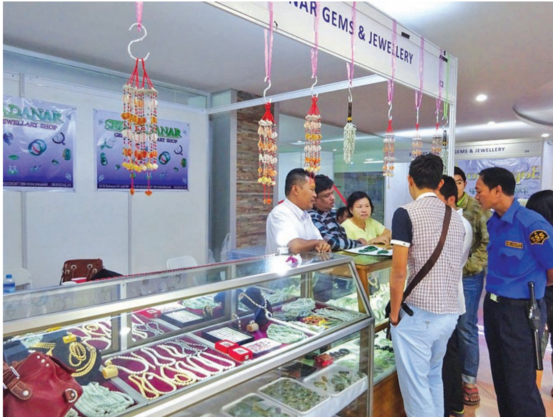
Gems merchants evaluate gems at 4 th Myanmar gems and jewellery.

THE 4 th Myanmar gems and jewellery emporium, jointly organised by the Myanmar Gems Association, the Mandalay Region Gems Association and Future Asia Connect Co. Ltd from Thailand was held at Diamond Plaza, Chan Aye Tharzan Township in