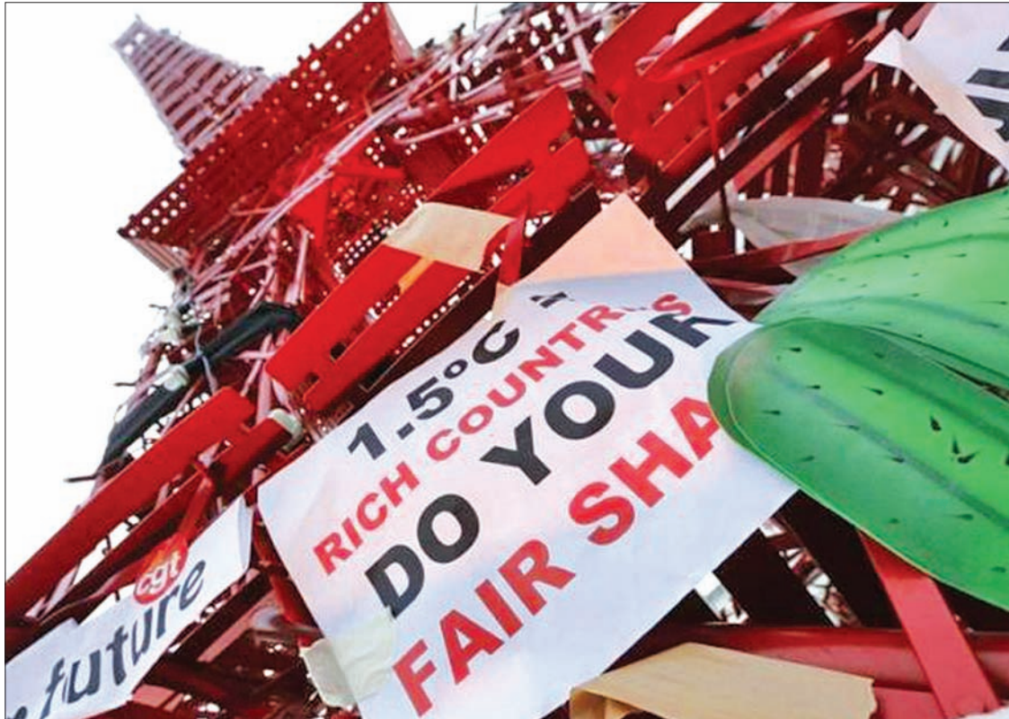
A placard with the slogan '1.5 Degrees Celsius = rich countries do your fair share' is seen on a replica of the Eiffel Tower during the World Climate Change Conference 2015 (COP21) in Le Bourget, near Paris, France, on 11 December.

PARIS — French Foreign Minister Laurent Fabius presented a landmark global climate accord yesterday, a “historic” measure for transforming the world’s fossil fuel-driven economy within decades and turn the tide on global warming.