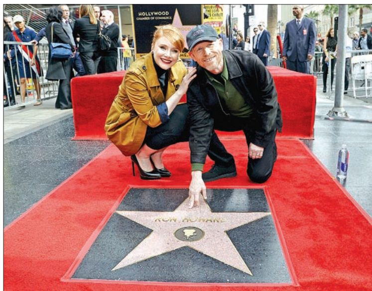
Ron Howard poses with his daughter Bryce Dallas Howard after he was honoured with the 2,568 th star on the Hollywood Walk of Fame in Los Angeles, California, on 10 December.

LOS ANGELES — Hollywood director Ron Howard has received his second star on the Walk of Fame, honoring his award-winning career as a film maker.