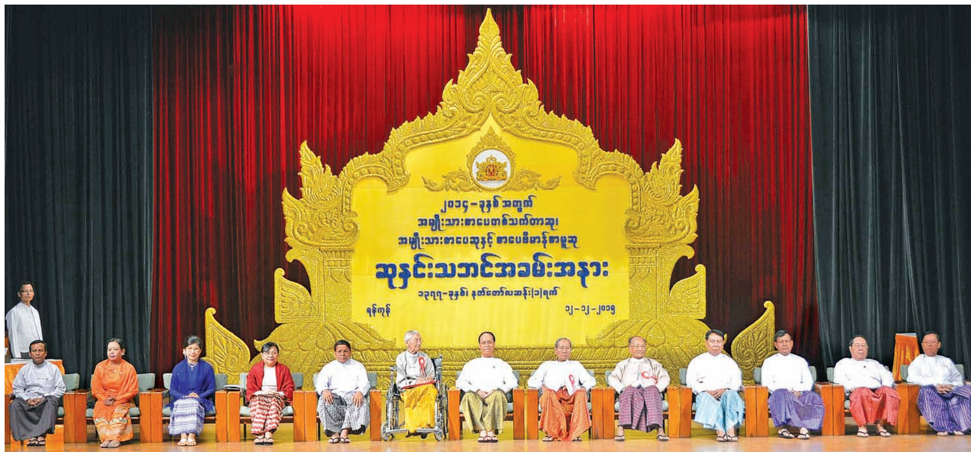
Vice President Dr Sai Mauk Kham poses for photo along with ministers and life-long literary award winners in Yangon.

LITERATURE is the origins of films, music and dramas as well as the centre of national characteristics and cultural variations, Vice President Dr Sai Mauk Kham said yesterday at a prize ceremony for literary and manuscript awards at the National Theatre in Yangon.