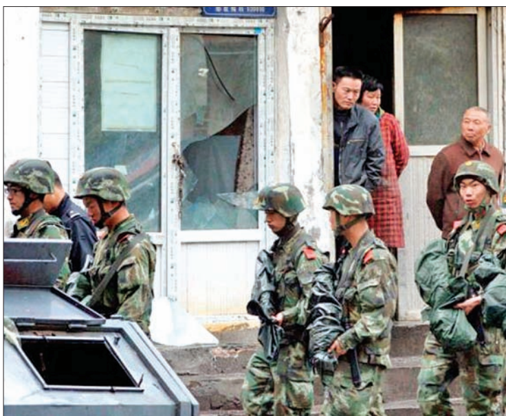
Paramilitary policemen patrol past a building in the Xinjiang Uighur Autonomous Region in 2014.

"Push the joining up and deeper integration of both the national and Xinjiang anti-terrorism intelligence platforms, put into ef-