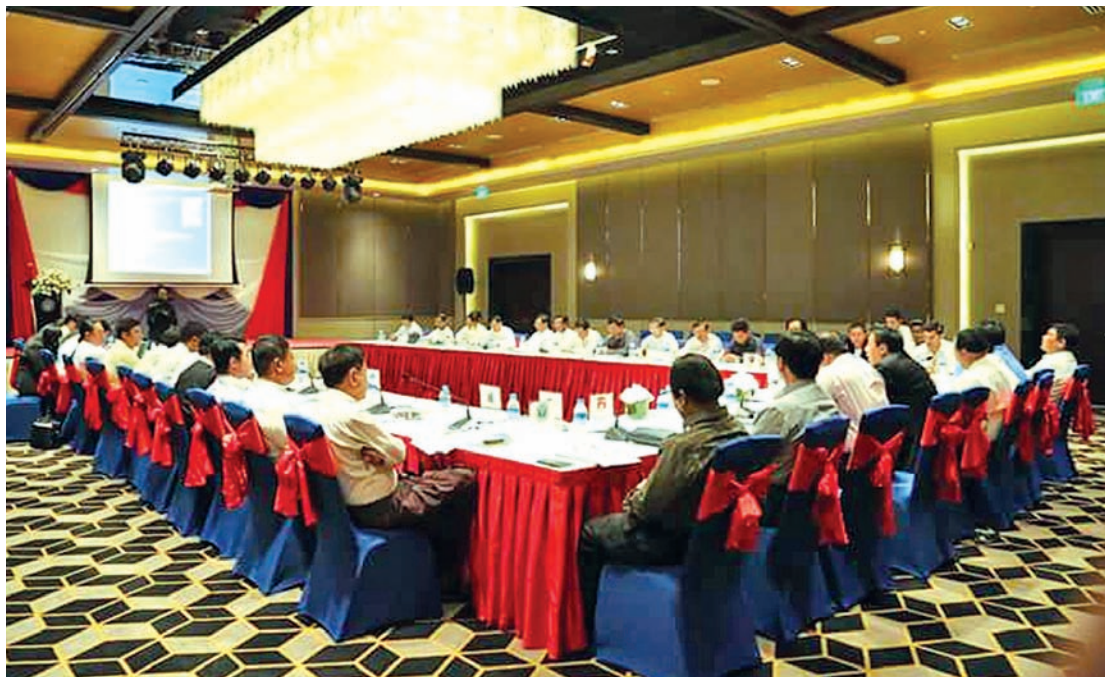
MNL Committee of Myanmar Football Federation meeting held at the Novotel Hotel in Yangon.