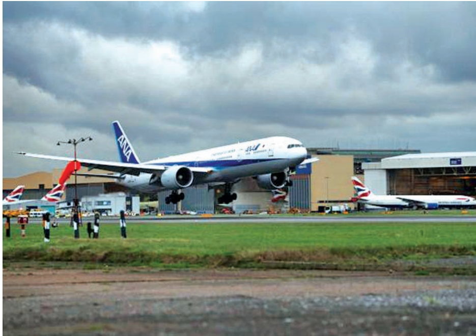
An aircraft lands at Heathrow Airport near London, Britain on 11 December.

The Directorate General of Safeguards, a branch of the finance ministry that can impose temporary import curbs, said on Tuesday it found prima facie evidence that increases in imports "have caused or are threatening to cause serious injury to the domestic producers", as it investigates local industry complaints.—Reuters