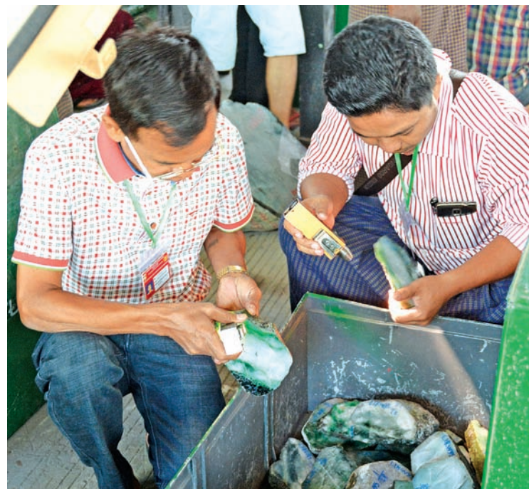
Two traders check cut jade stones.

The central committee announced updated information through LED screen at the emporium. The sale of jade lots continues tomorrow for the final day, with the committee planning to sell 1,576 further lots.— Myanmar News Agency