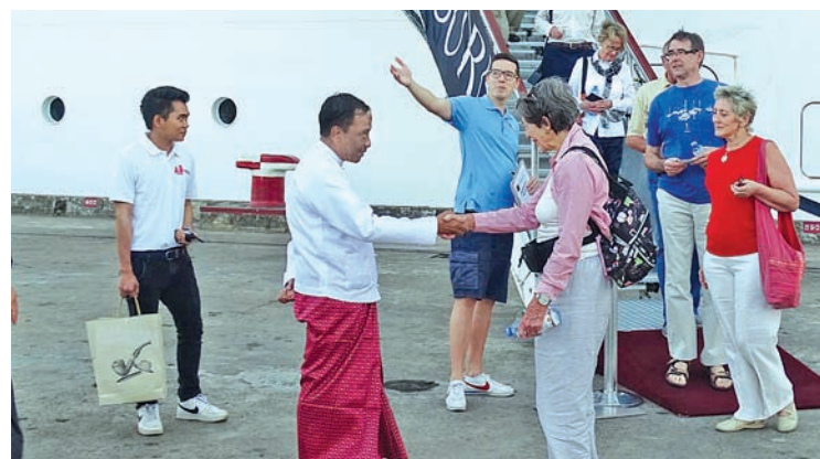
Union Minister U Htay Aung welcomes tourists at Thilawa Port.

The event was attended by senior officials of DHT and Myanmar Tourism Federation, course instructors and the trainees. —Myanmar News Agency