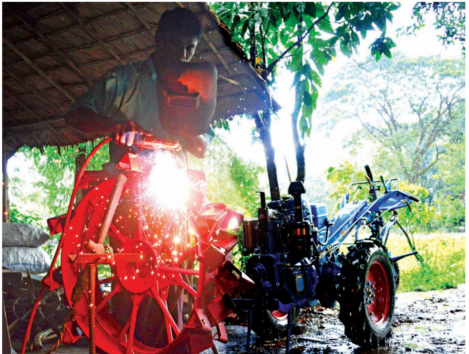
See page 2>> A man make ploughing tool which can be used with a power tiller.