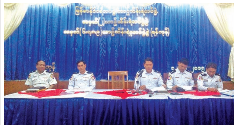
Traffic police officers gives press conferece on road accidents in Yangon.

YANGON Region has seen 88 accidents and 37 people dead in the last two week, according to local police.