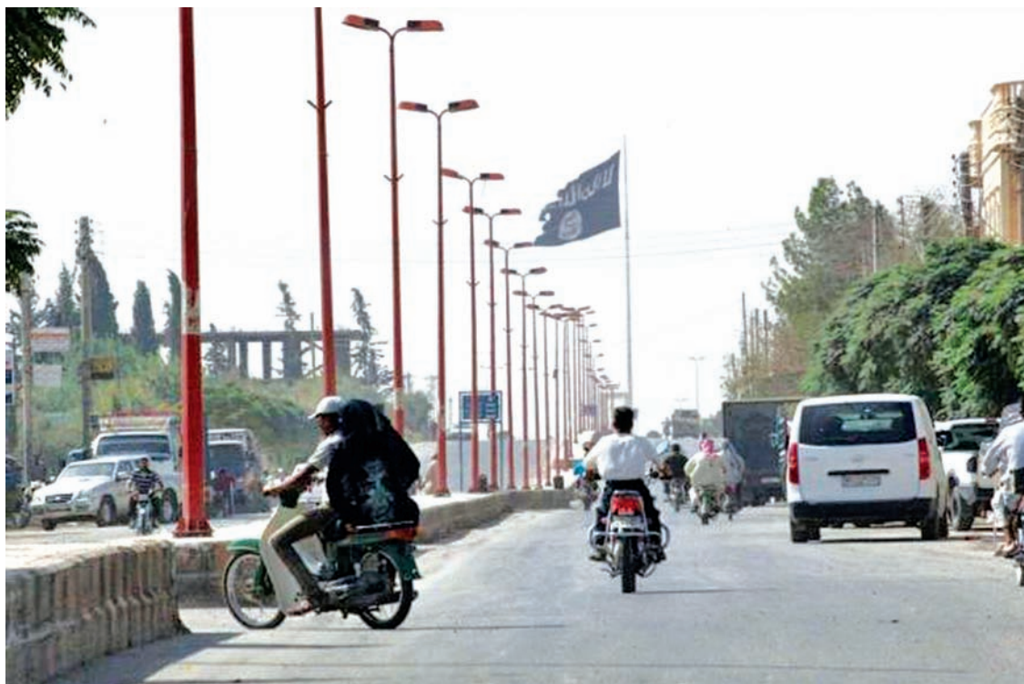
Residents drive across a street with a fluttering Islamic State flag, in Tel Abyad town on the Syrian-Turkish border, Raqqa countryside in 2014.

WASHINGTON — A US government agency report has warned that Islamic State has the ability to create fake Syrian passports, a federal official confirmed on Friday.