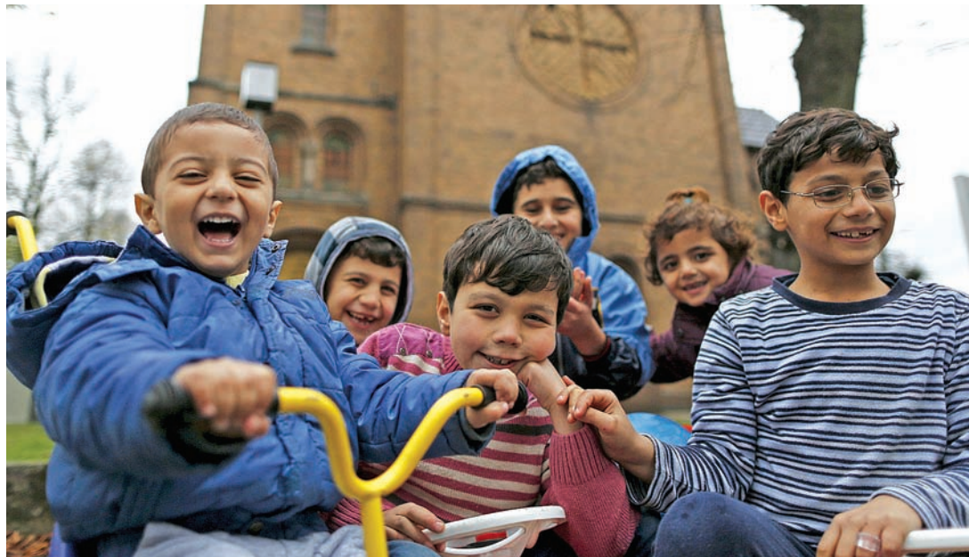
Migrant children from Syria pose in front of a Protestant church in Oberhausen, Germany, on 19 November.

BERLIN — With roughly one million migrants arriving in Germany this year, the Society for the German language on Friday chose "Fluechtlinge" — refugees — as Word of the Year 2015.