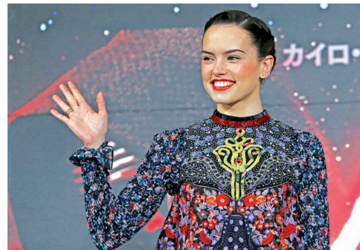
Cast member Daisy Ridley waves as she walks into a news conference for her upcoming movie “Star Wars: The Force Awakens” in Urayasu, Chiba prefecture, the suburbs of Tokyo.

LOS ANGELES — When the much-anticipated “Star Wars” film opens next week, little-known British actress Daisy Ridley will undoubtedly become one of the most recognised faces in the world.