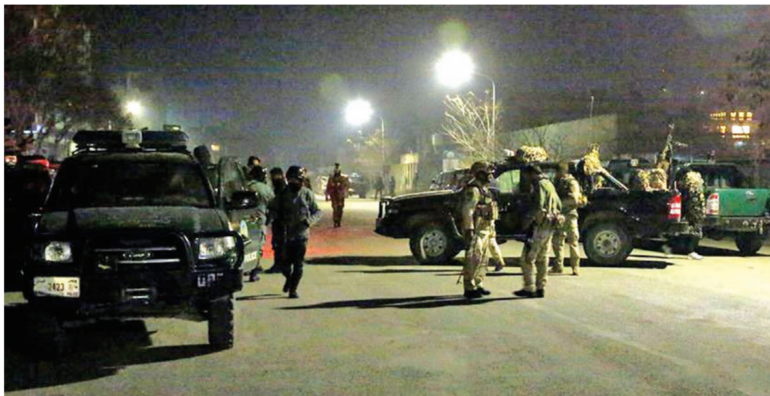
Afghan security forces stand guard at the site of an explosion in Kabul, capital of Afghanistan, on 11 December.

KABUL — Afghan security forces suppressed a suicide attack on a guest house near the Spanish embassy in Kabul, killing three Taliban fighters after hours of intermittent gunfire and explosions that lasted into the early hours of yesterday.