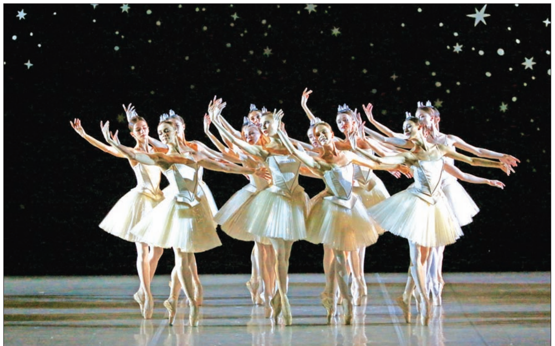
Ballet dancers perform in Nacho Duato’s “The Nutcracker” at the Mikhailovsky Theatre in St. Petersburg, Russia, on 20 November 2015.

Wherever The Nutcracker is staged, from Los Angeles to Melbourne via Tokyo, the performance does not just happen. The entire dance troupe at the Mikhailovsky started one day of