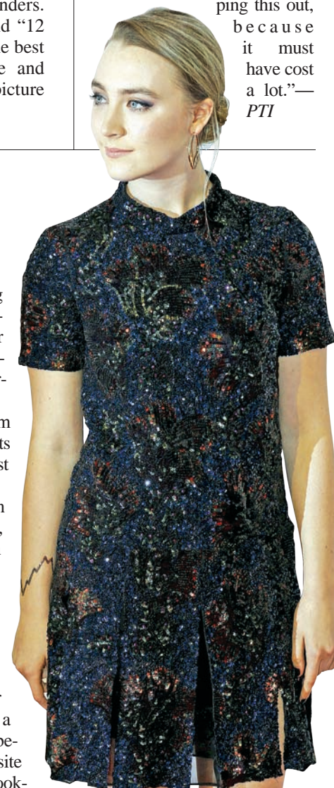
Saoirse Ronan