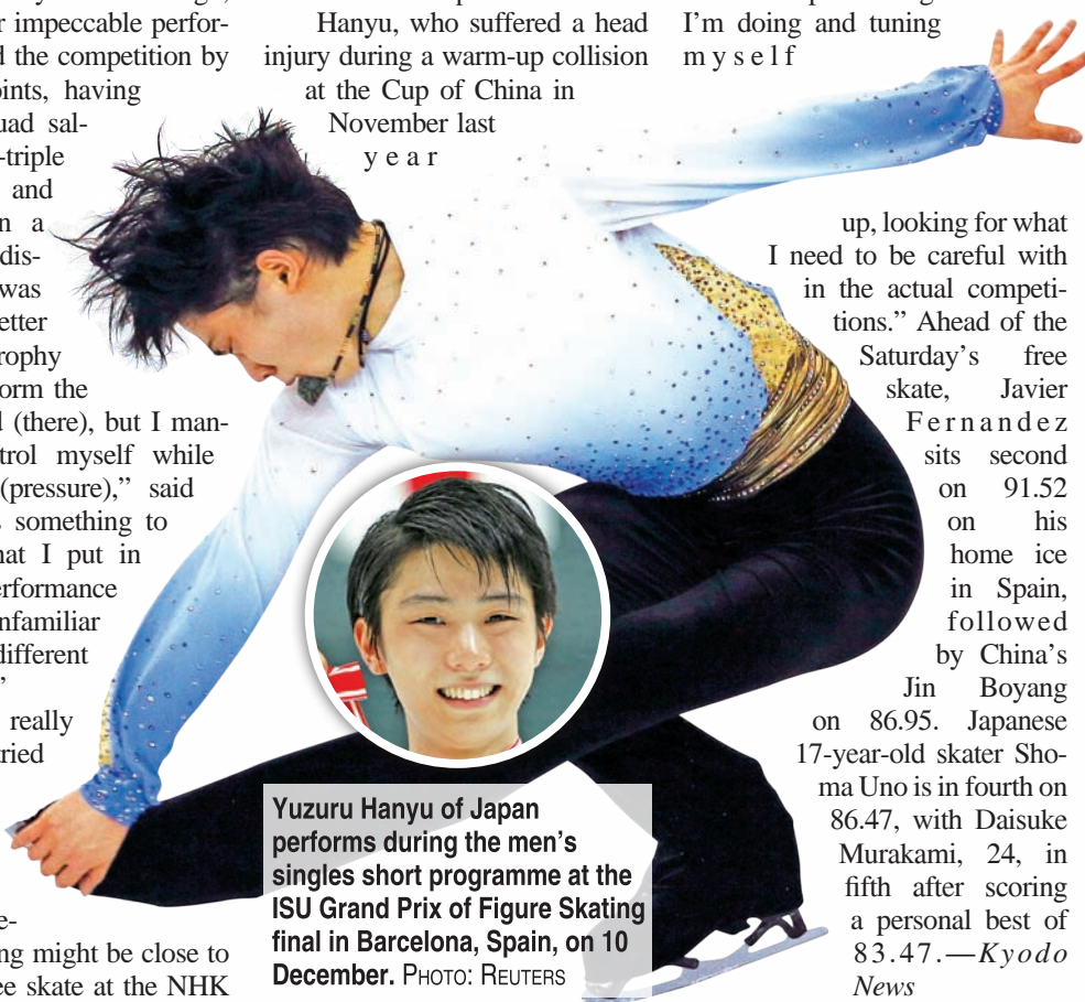
Yuzuru Hanyu of Japan performs during the men’s singles short programme at the ISU Grand Prix of Figure Skating final in Barcelona, Spain, on 10 December.