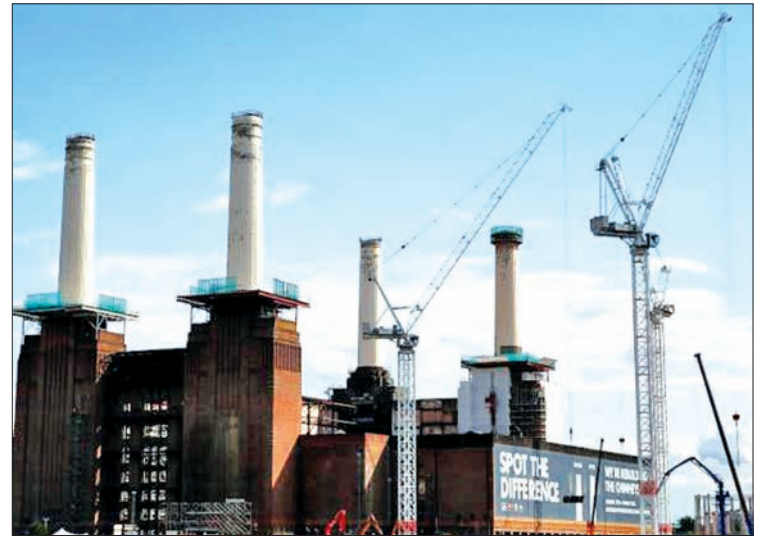
A rig surrounds the top of one of the chimneys of Battersea Power Station as demolition work is carried out, in London.

nance minister, said she personally hoped Britain would stay in the EU but stressed she was not speaking for the Fund.