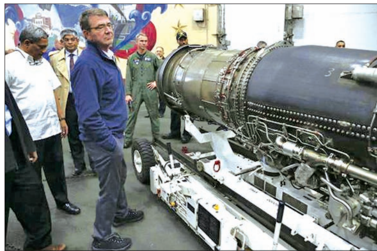
India's Minister of Defence Manohar Parrikar (L) and US Defence Secretary Ash Carter (C) inspect a jet engine in the hanger deck of the USS Eisenhower off the coast of Virginia, in the Atlantic Ocean on 10 December.

WASHINGTON — The United States has updated its policy on gas-turbine engine technology transfer to India, a move that should lead to expanded cooperation in production and design of jet-engine components, a joint statement said on Thursday.