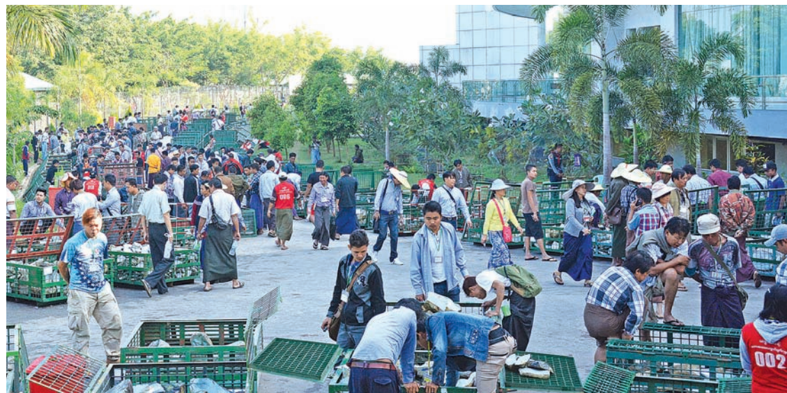
Gems merchants evaluate jade lots.

During the sales, a total 6826 jade lots were displayed for sale under open tender and competitive bidding systems.— Myanmar News Agency