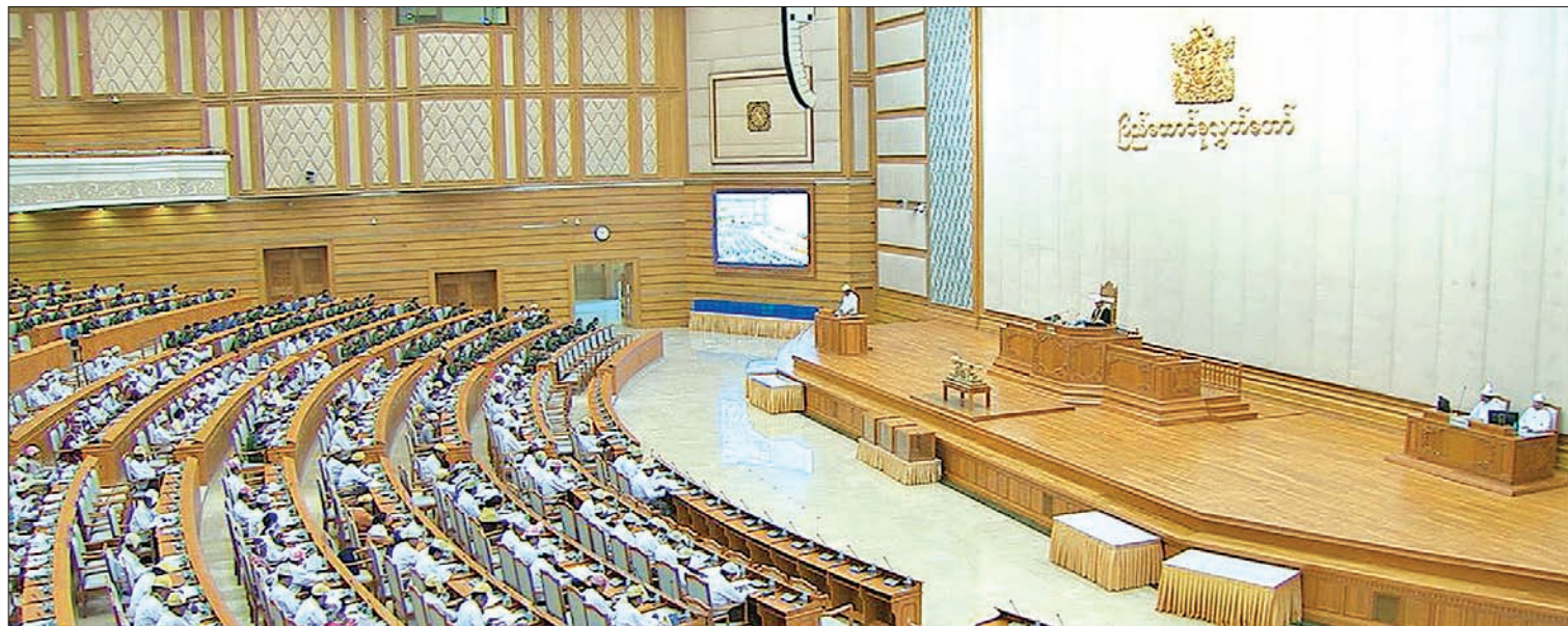
Pyidaungsu Hluttaw being convened in Nay Pyi Taw.

More than 500 MPs, making up 80% of the total representatives attended the session.— Myanmar News Agency