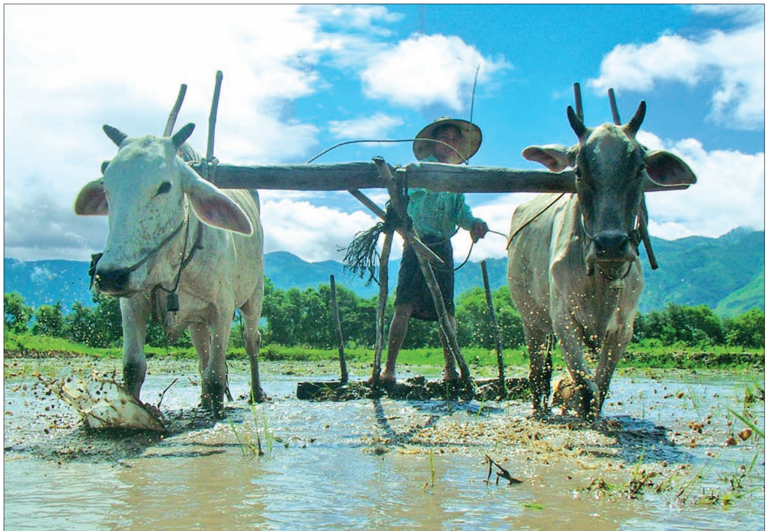
A farmer ploughs rain-fed field to grow rice in Tatkon.

Despite failing to attract foreign investment in the two sectors, Myanmar's total FDI target was set at $6 billion for the present fiscal year and it received FDI worth US $3.79 billion so far,