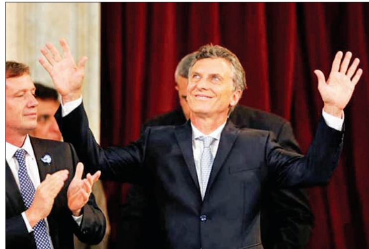
Argentina’s President Mauricio Macri waves after being sworn-in to office at the Argentine Congress in Buenos Aires, Argentina, 10 December.

His victory delivered a hammer-blow to the Peronist move-