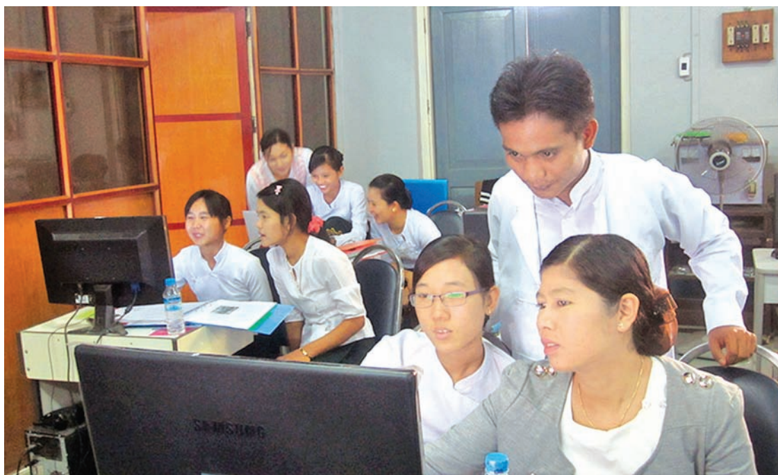
Participants find and evaluate resources to use in their teaching.

“The idea that learning about technology can be paired successfully with learning about teaching was a new and exciting