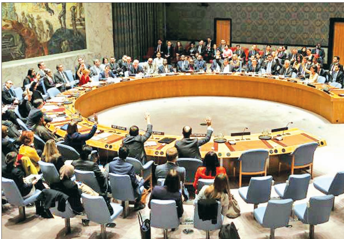
United Nations Security Council members cast their votes in favour of the adoption of the agenda during a meeting of the United Nations Security Council on alleged human rights abuses by North Korea on 10 December 2015.

"The international community has a collective responsibility to protect the population of the DPRK, and to consider the wider implications of the reported grave human rights situation for the stability of the region," Jeffrey Felt-