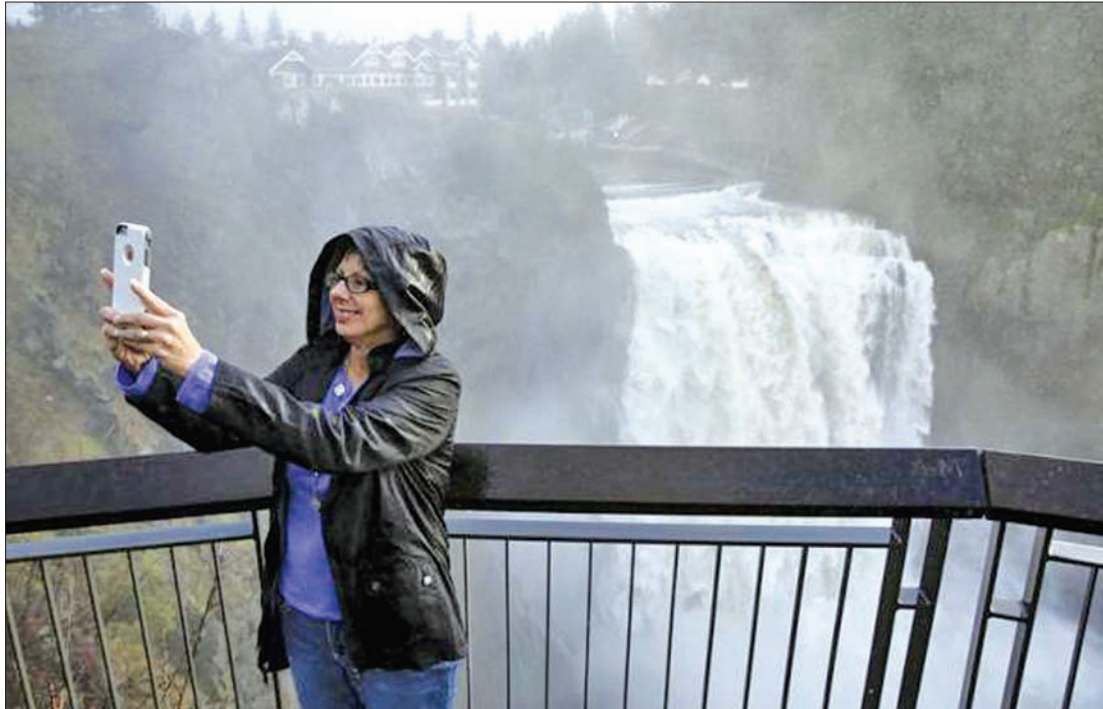
A woman poses for a photo in front of Snoqualmie Falls after recent storms increased water flow in Snoqualmie, Washington, on 10 December.

SEATTLE — Fresh storms hit the US Pacific Northwest on Thursday, triggering a state of emergency in several counties, after it received record-breaking rainfall that left two dead in Oregon and triggered widespread flooding, landslides and power cuts.