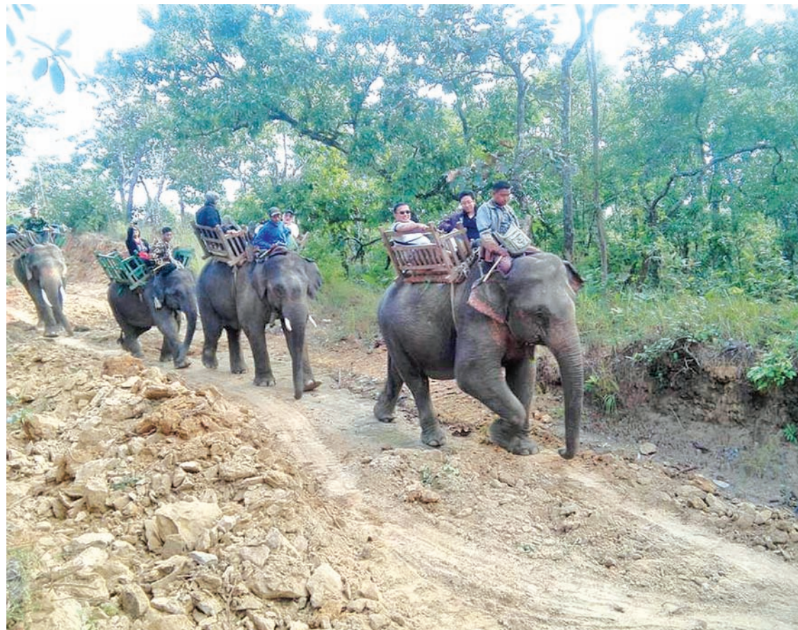
Visitors ride elephants as they tour around Alaungkaw Kathapa National Park.

THE ASEAN Centre for Biodiversity in the Philippines and joint technical advisor officers from KFW Bank in Germany is visiting the Alaungkaw Kathapa National Park to carry out a small grant project.