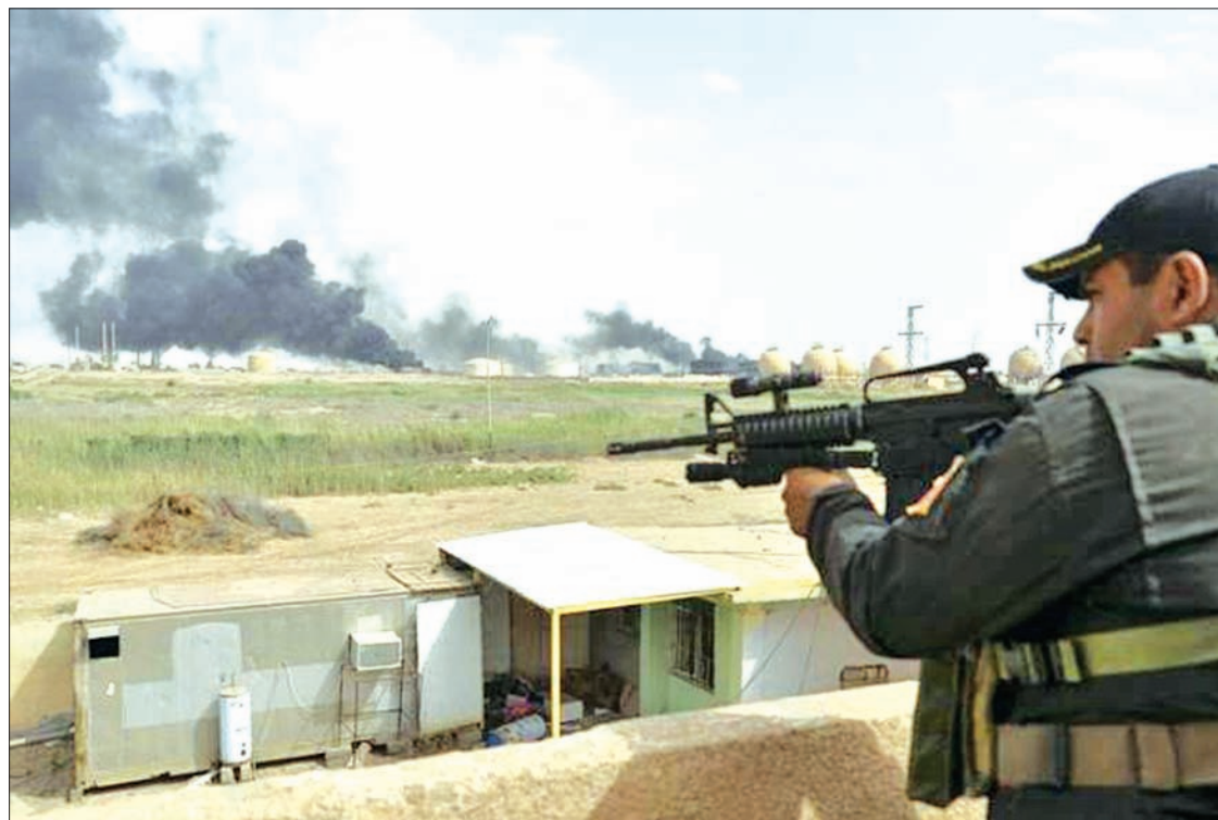
A member from the Iraqi security forces guards as smoke rises from Baiji oil refinery, north of Baghdad, Iraq.