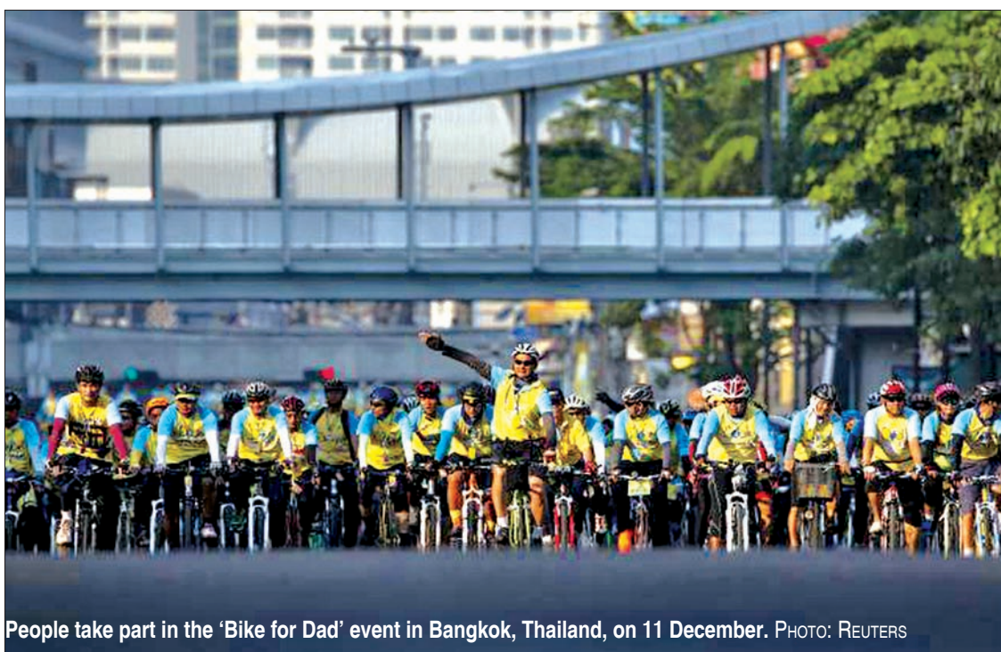
People take part in the 'Bike for Dad' event in Bangkok, Thailand, on 11 December.

Two suspects have died in military custody during a police