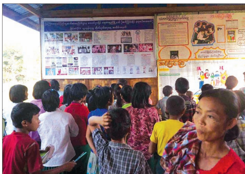
Villagers read posters displayed in Yedashe to mark the Literati Day.

They distributed pamphlets to people at the ceremony.— Shwe Win(017)