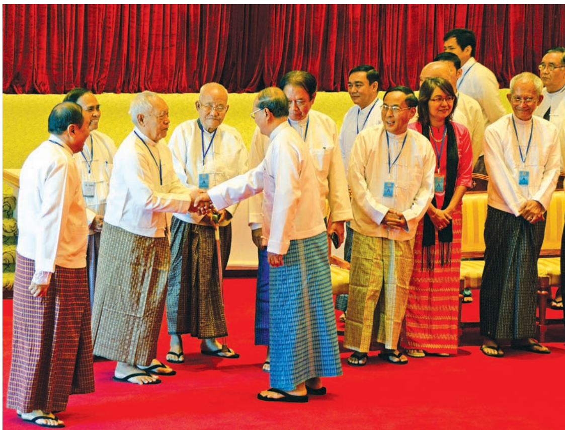
President greets members of Myanmar Press Council.

He praised the media community for their engagement in the abolition of censorship, the enactment of media laws and the establishment of an independent press council.— Myanmar News Agency