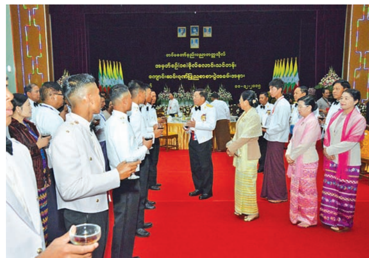
Senior General Min Aung Hlaing greets cadets of 18 th intake of the Defence Services Technological Academy.

The senior general and party sat for dinner with the cadets and their families.— Myawady