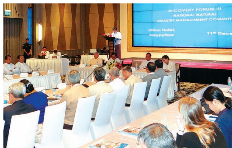
Vice President U Nyan Tun delivers speech at ceremony to release post-disaster needs assessment to recovery report.

It is estimated that the flood and landslides that hit the country during the past rainy season caused about US$ 1.5 billion losses and the cost of recovery is estimated to be about the same amount as the