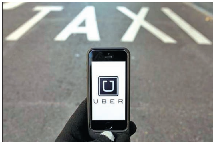
The logo of car-sharing service app Uber on a smartphone over a reserved lane for taxis in a street is seen in this photo illustration taken in Madrid.

SAN FRANCISCO — State legislators in Ohio and Florida are moving ahead with regulations governing Uber and other ride services that would designate all drivers as independent contractors, bolstering a critical but much-disputed aspect of Uber's business model.