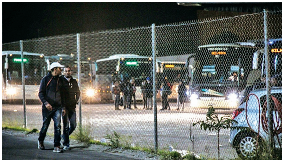
Migrants disembark from buses at the Taekwondo Stadium in Athens.

The majority of those arriving in Athens on Wednesday were weary and had no idea how they would proceed on their journeys. Those that had returned from the border several days ago had some leads. Standing outside the stadium, three Moroccans and one Iranian told IRIN that smugglers in Idomeni had offered them car rides to Italy for between €1,500 and €2,000 each.