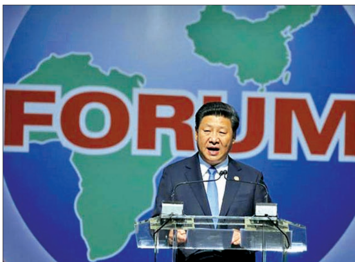
China's President Xi Jinping.

The reforms, kicked off in September with Xi's announcement he would cut service personnel by 300,000, have been controversial. The military's newspaper has published a series of commentaries warning of opposition to the reforms and worries about lost jobs. In a lengthy commentary provided by the Chongqing military command,