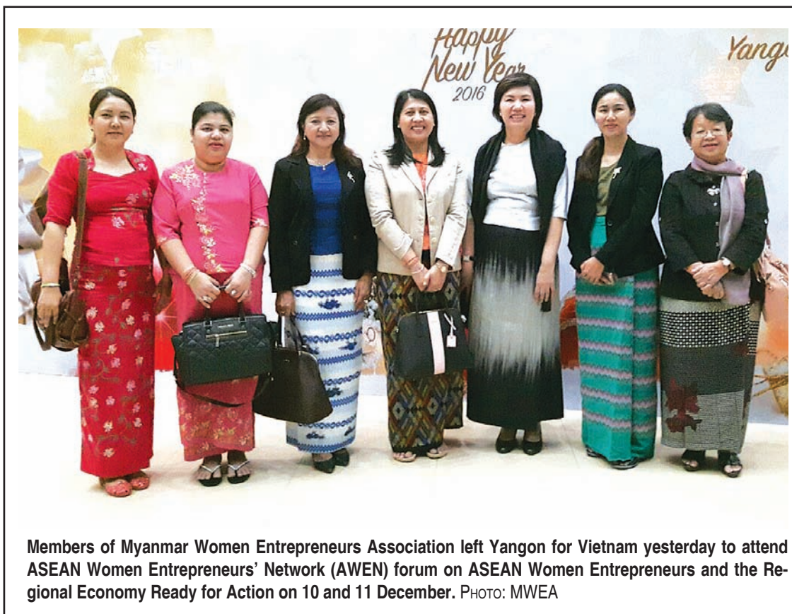
Members of Myanmar Women Entrepreneurs Association left Yangon for Vietnam yesterday to attend ASEAN Women Entrepreneurs' Network (AWEN) forum on ASEAN Women Entrepreneurs and the Regional Economy Ready for Action on 10 and 11 December.