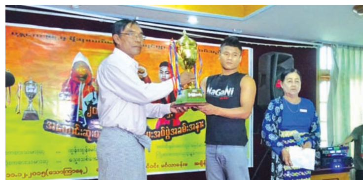
A winner of Myanmar Traditional Boxing 2015 accepts the trophy from an official.

AN award ceremony was held in Mandalay for Myanmar Traditional Boxing 2015 at Kimar Tin Win Hall in Maha Aungmye Township yesterday.